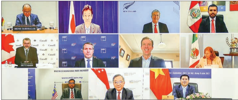
Photo taken on 1 Sept. 2021, at Japan's Cabinet Office in Tokyo, shows the Trans-Pacific Partnership Commission held online.

THE United Kingdom will hold its first meeting with members of the Trans-Pacific Partnership free trade pact later this month to discuss London's application to join the deal, the Japanese government said Wednesday.