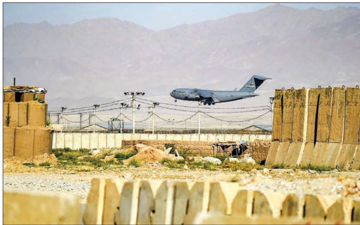
Bagram Air Base served as the linchpin for US operations in Afghanistan.

The evacuation, he said, was an "extraordinary success".