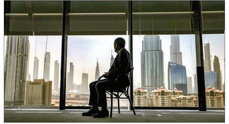
Ilan Sztulman Starosta, head of mission at Israel's consulate in Dubai, sits in his office against the background of the bustling Gulf city state.

Last year, the UAE broke with decades of Arab consensus that there should be no normalization of ties with Israel without a