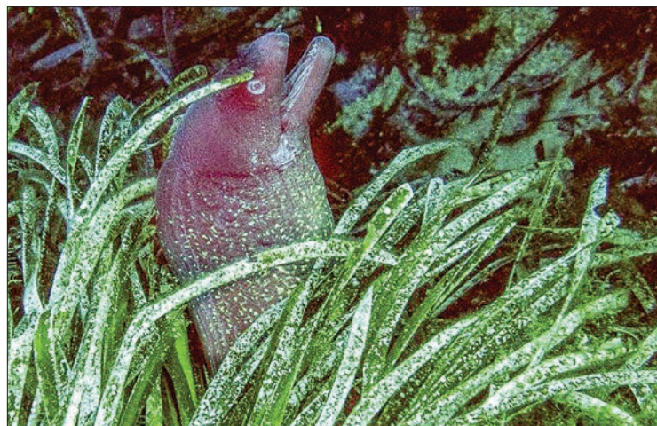
Neptune grass meadows have long fallen prey to boating activity with some 7,500 hectares damaged along the French coastline alone.

The Mediterranean Network for Posidonia says the real area is probably much larger than that, with data largely unavailable for countries on the sea's eastern and southern shores.