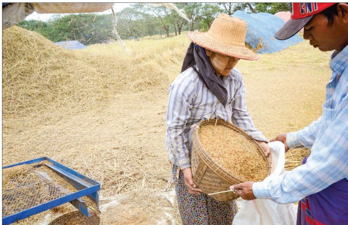
The agricultural exports rocketed to US$4.3 billion between 1 October and 20 August of the current financial year 2020-2021, despite the downward trend in other export groups resulted from the tightened coronavirus containment measures in the border and increase in the container shipping cost.

The agricultural exports surged even though the main trade partner China shut down all the borders in the wake of the COVID-19 surge in Myanmar: