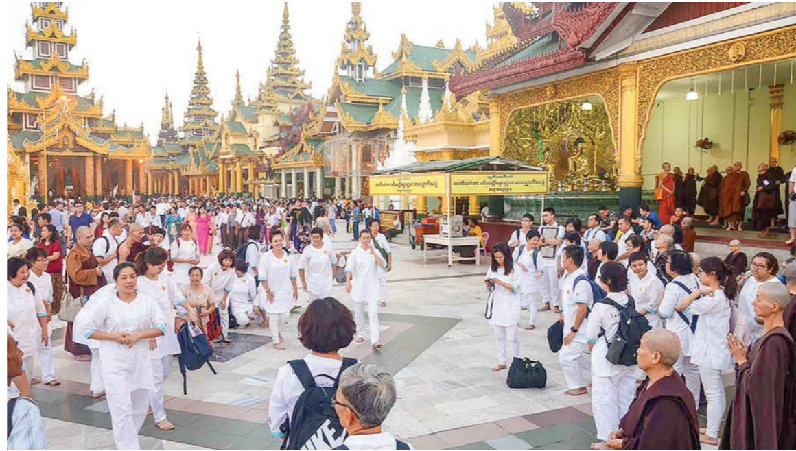
This file photo taken on 6 March 2018 shows the famous Shwedagon Pagoda attracting thousands of international tourists daily.

What happened was that the two own-brothers by the name of