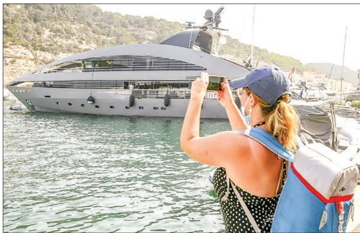
Guests aboard the Ocean Sapphire can once again plunge into Corsican waters thanks to anchorages designed specifically to protect seagrass.

LAST year when France moved to protect Mediterranean seagrass beds by barring larger boats from dropping anchor near them, Yves-Marie Loudoux found