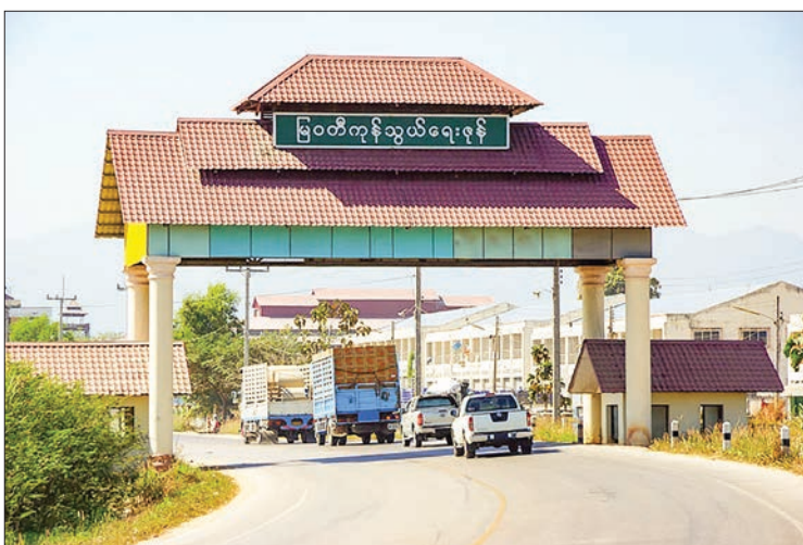
Myawady Border Trade Zone.

The products traded between the two countries include bamboo, ginger, peanuts, saltwater prawns and fish, dried plums, garlic, rice, mung beans, blankets, candy, plum jams, footwear, frozen foods, chemicals, leather, jute products, tobacco, plastic, wood, knitwear and beverages, according to the Ministry. — Zwe/GNLM