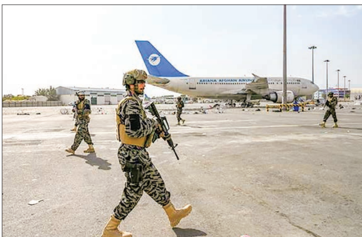
Taliban Badri special force fighters secure the airport in Kabul after the US’ withdrawal.

WITH the Taliban in possession of Kabul’s airport after the United States completed its withdrawal on Tuesday, the focus will now shift from the mammoth Western evacuation operation seen in the past two weeks to the group’s plans for the transport hub. The symbolism of the airport was underlined Tuesday when the Taliban’s top spokesman stood on its runway and declared victory over the United States. But what happens next remains unclear. Here is a look at the future of Hamid Karzai International Airport: