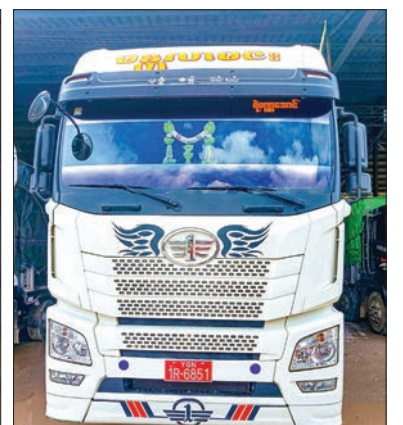
Anti-COVID devices and medical supplies are imported daily through border trade zones, and the lorries are transporting them to the needed areas.