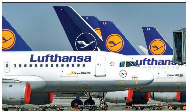
Planes of German airline Lufthansa are parked at the "Franz-Josef-Strauss" airport in Munich, southern Germany, 27 March, 2020.

GERMAN airline Lufthansa again during the winter, against expects business to slow down the backdrop of a possible fourth