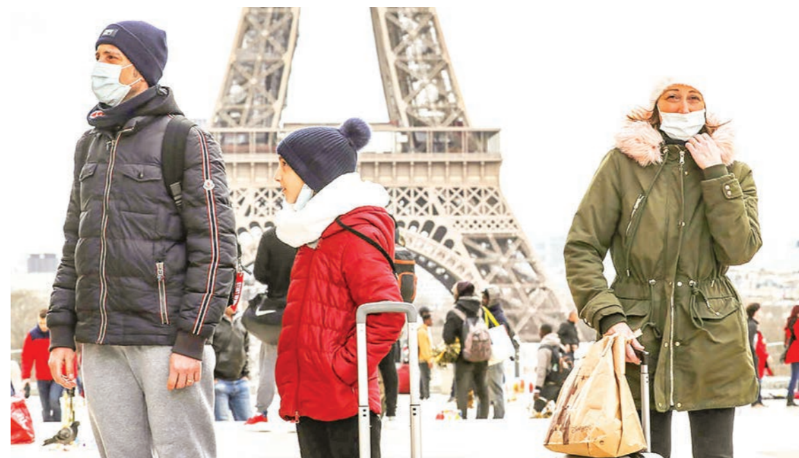
People wear protective facemasks as they walk in front the Eiffel Tower, in Paris on March 12, 2020.