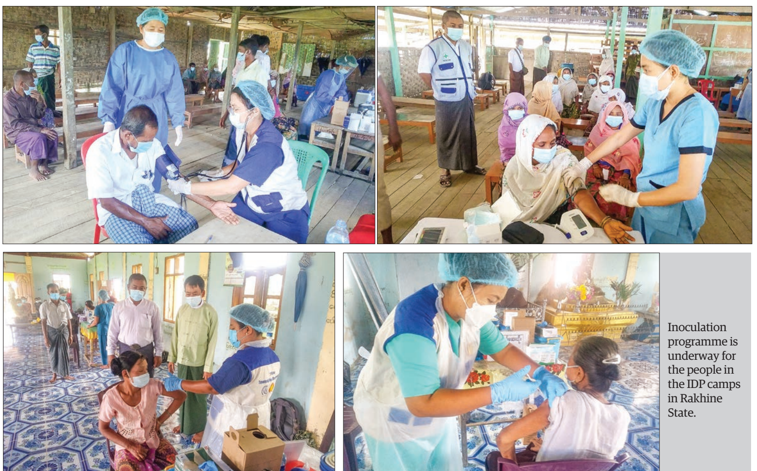
Inoculation programme is underway for the people in the IDP camps in Rakhine State.