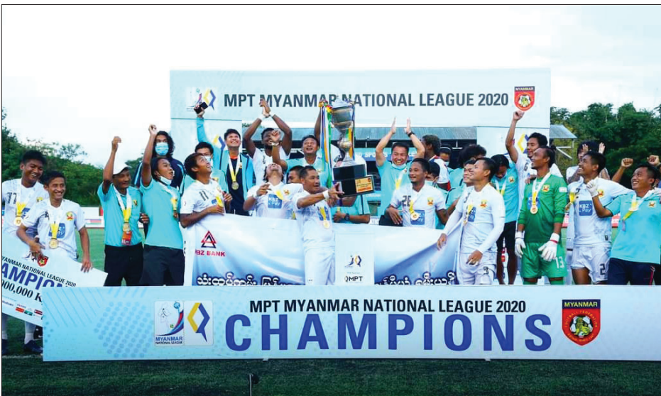
Shan United FC is a defending champion of the Myanmar National League.

ALL the Myanmar National League football matches have been postponed to next year amidst the outbreak of the COVID-19 pandemic across Myanmar, said the source with the Myanmar National League yesterday.