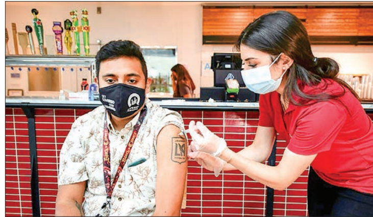
EU chief Ursula von der Leyen said Tuesday 70 per cent of adults in the European Union were now fully vaccinated against Covid-19, hitting an end-of-summer target the bloc set for itself in January.

Brussels has stressed the need for the EU to reduce the "worrying gap" in vaccination rates between member states and urged national authorities