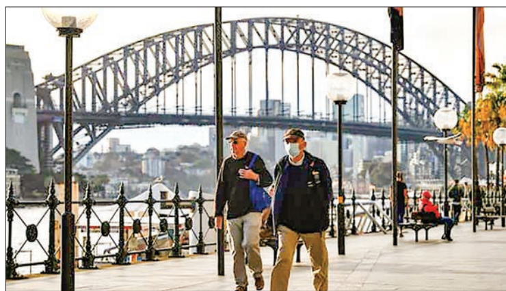
A man wearing a face mask walks before the Harbour Bridge in Sydney, Australia on 22 July 2020.

"Domestic demand drove growth of 0.7 per cent this quarter which saw continued growth across household spending,