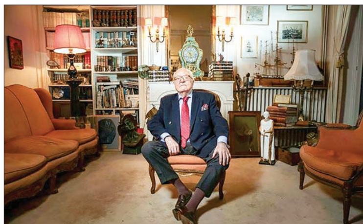
Jean-Marie Le Pen has long relished in the outrage provoked by his comments regarding Jews, blacks and immigrants.

Jean-Marie claimed the comments carried no anti-Semitic connotations "except for my political enemies or imbeciles".—AFP ■