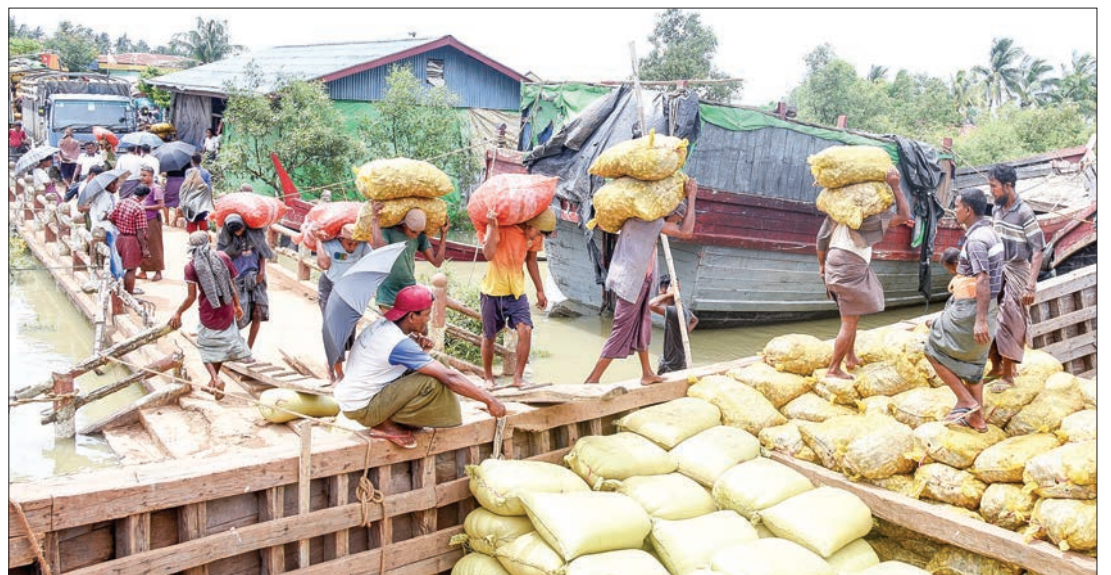
Myanmar exports goods to Bangladesh through both maritime and land routes. Bilateral border trade is mainly conducted through the Sittway and Maungtau points of entry.

THE bilateral border trade between Myanmar and Bangladesh totalled US$35.41 million as of 20 August in the financial year 2020-21, a decrease by $16 mln compared to the same period last year, according to the Ministry of Commerce.