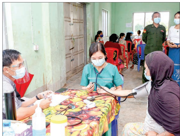
An IDP is seen receiving medical examination before inoculation.

ship, Rakhine State, continued to be vaccinated with Sinovac