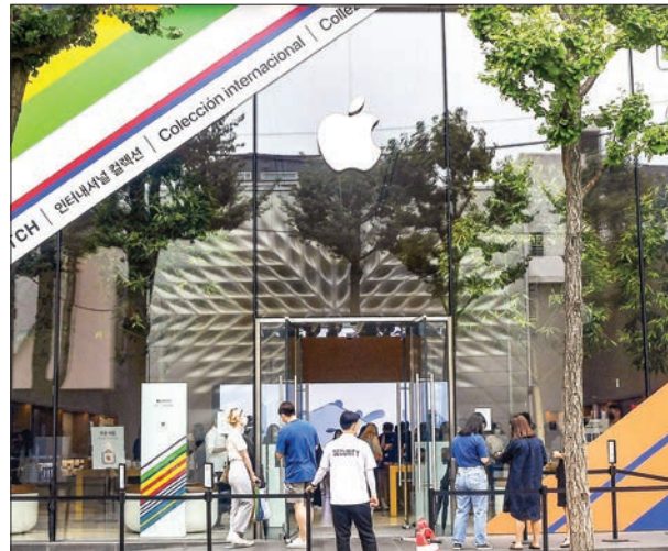
Photo taken on 30 Aug. 2021, shows Apple Inc.'s shop in Seoul, South Korea.

per cent on purchases made through their app stores and exclude alternative payment handlers.— Kyodo