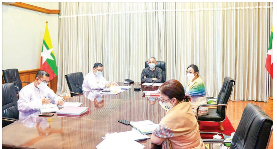
The virtual consultation meeting on private sector's inputs for MERP(draft) to address the impact of COVID-19 on Myanmar Economy in progress.