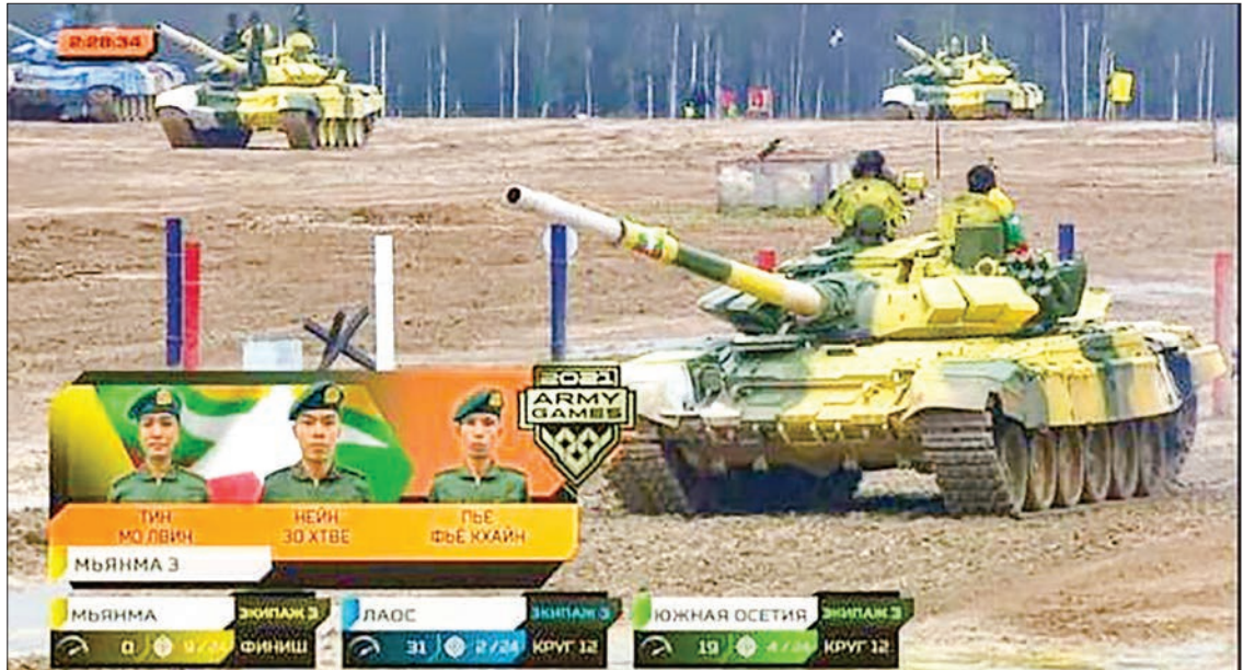
The Tank Biathlon (Division-2) will take place on 3 September with the participation of Myanmar, Kyrgyzstan, South Ossetia and Tajikistan.

In the semifinal event, Myanmar Tank Squad had to choose the draw lot for taking