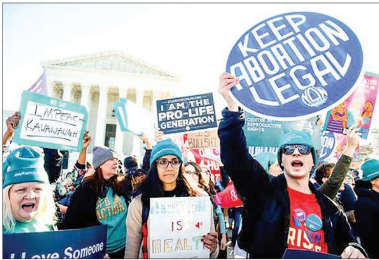
Pro-choice activists supporting legal access to abortion protest outside the US Supreme Court.

A Texas law that bans abortion after six weeks, and makes no exception for rape or incest, took effect on Wednesday after the Supreme Court did not act on an emergency request to block it. Governor Greg Abbott, a Republican, signed the bill in May, making Texas one of a dozen states banning abortion once a fetal heartbeat can be detected