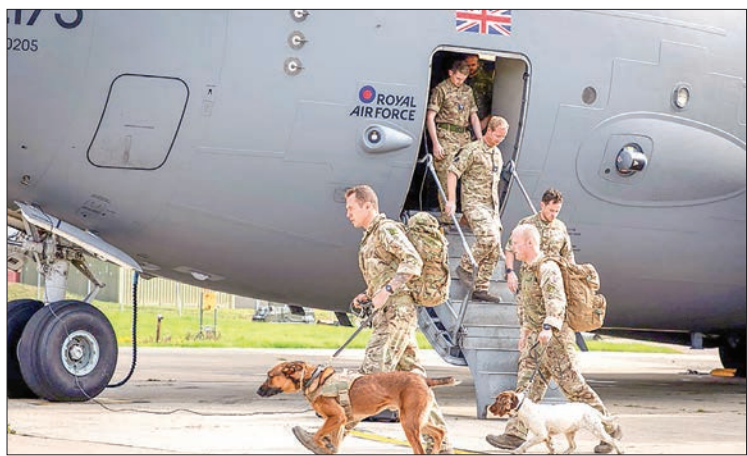
A handout picture released by the British Ministry of Defence (MOD) shows military personnel and military working dogs departing from a RAF C-17 aircraft after landing at RAF Brize Norton, west of London on 29 August 2021, as the troops and diplomatic staff return from assisting with the evacuation of people from Kabul airport in Afghanistan.

BRITAIN has opened talks with the Taliban over the "safe pas-