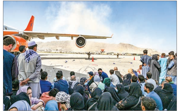
Britain has a resettlement scheme for everyday Afghans fleeing from their home country.

Johnson said of the so-called “Operation Warm Welcome” measures. “I know this will be an incredibly daunting time, but I hope they will take heart from the wave of support and generosity already expressed by the British public.” The government said the measures “will give Afghans the certainty and stability to rebuild their lives with unrestricted rights to work and the option to apply for British citizenship in the future.”—AFP ■