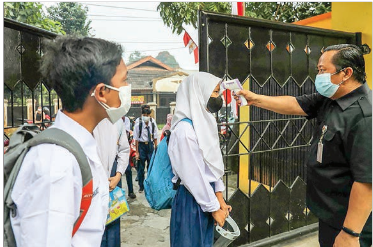
A student has her temperature checked while entering a school in Jakarta, as the government reopened schools amid the covid-19 pandemic.

HUNDREDS of schools in Jakarta threw their doors open to students Monday, as some parents resisted the return to in-person learning weeks after Indonesia overtook India and