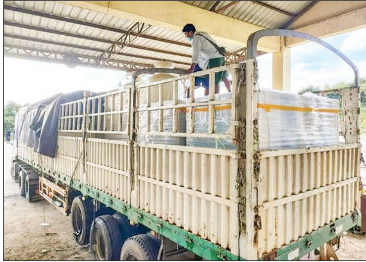
Anti-COVID devices and medical supplies are imported daily through land borders.

A total of 40 tonnes of oxygen (liquid) carried by two bowsers, three tonnes of liquid oxygen, 2,322 empty oxygen cylinders, 11 oxygen plants, one oxygen generator, 353 oxygen concentrators, 100 sets of COVID-19 test kits, eight tonnes of gloves, and 100 tonnes of masks were imported via Muse, Chinshwehaw, Myawady and Hteekhee border