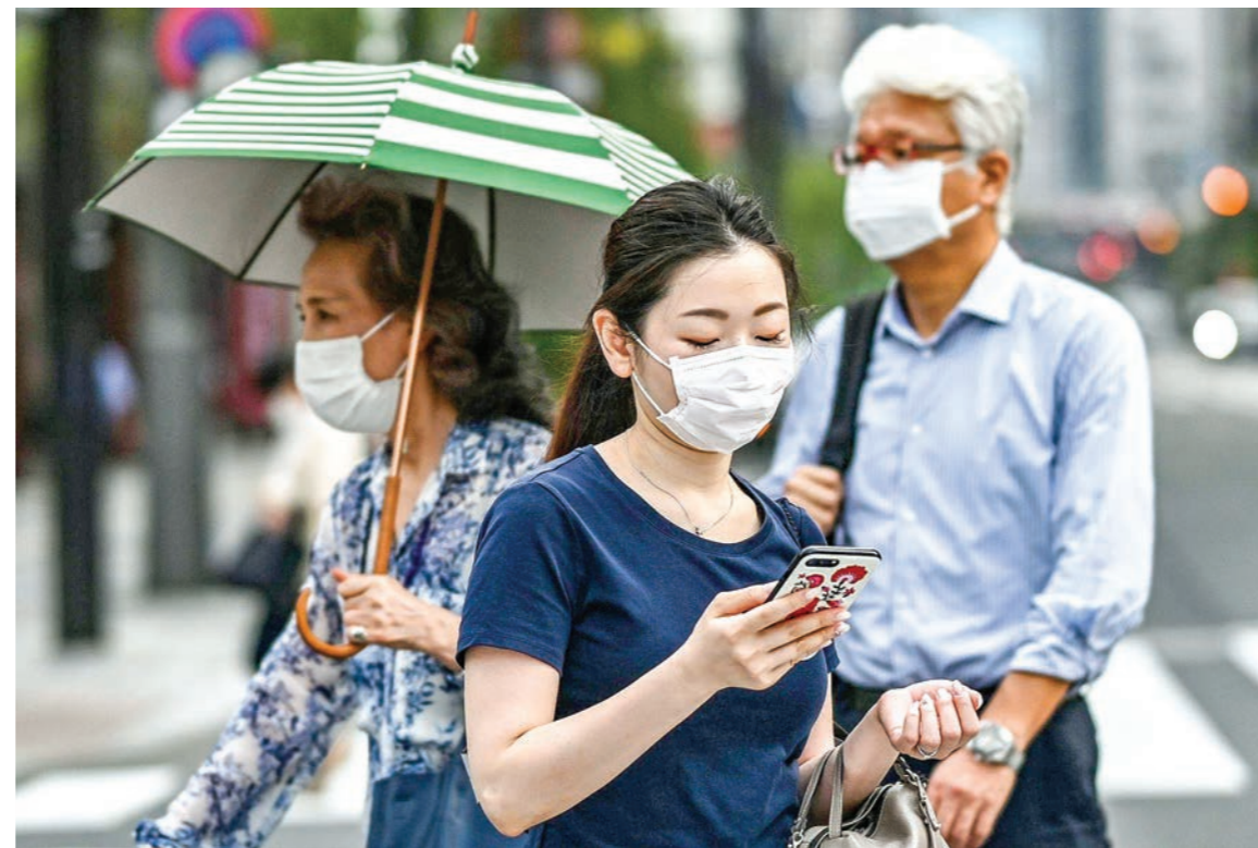
People walk in a street in Tokyo. According to environmentalists, Japanese coasts and waters have witnessed an apparent increase in the number of disposable masks recently.

To add fuel to the flame, strict lockdowns and banning consumers from dining in at restaurants have pushed consumers to order meals and groceries online