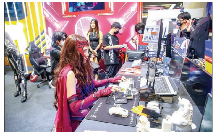
Animation game players will participate in the ChinaJoy 2021, 30 July 2021, in Shanghai, China.

Minors' addiction to online games has drawn much attention from the society, an official with the NPPA said, adding that the newly-released notice is meant for minors who are still in the developmental stage physically and mentally, and have poor self-control.—Xinhua ■