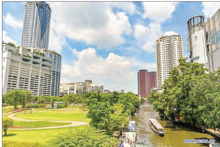
A boat sails on a canal in Bangkok, capital of Thailand, on 2 Sept 2020.

THAILAND'S finance minister and industry minister on Monday expressed their confidence on the government's easing of