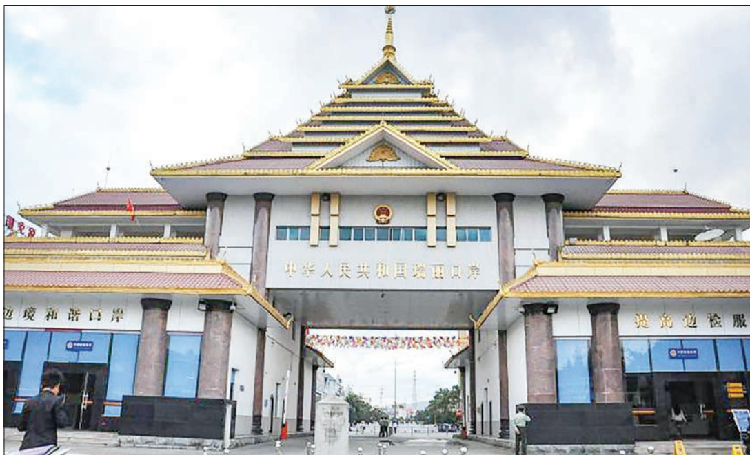
The re-acceptance committee in Muse is accepting and welcoming back Myanmar returnees.

MYANMAR migrant workers are returning from China as they have trouble with their living conditions due to factory and shop closures caused by the pandemic in Ruili and Kyalgaung.