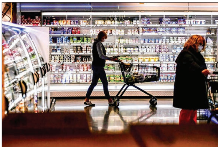
German consumer price inflation remained at euro-era high levels in August.

GERMAN consumer price inflation remained at euro-era high levels in August, prelimi-