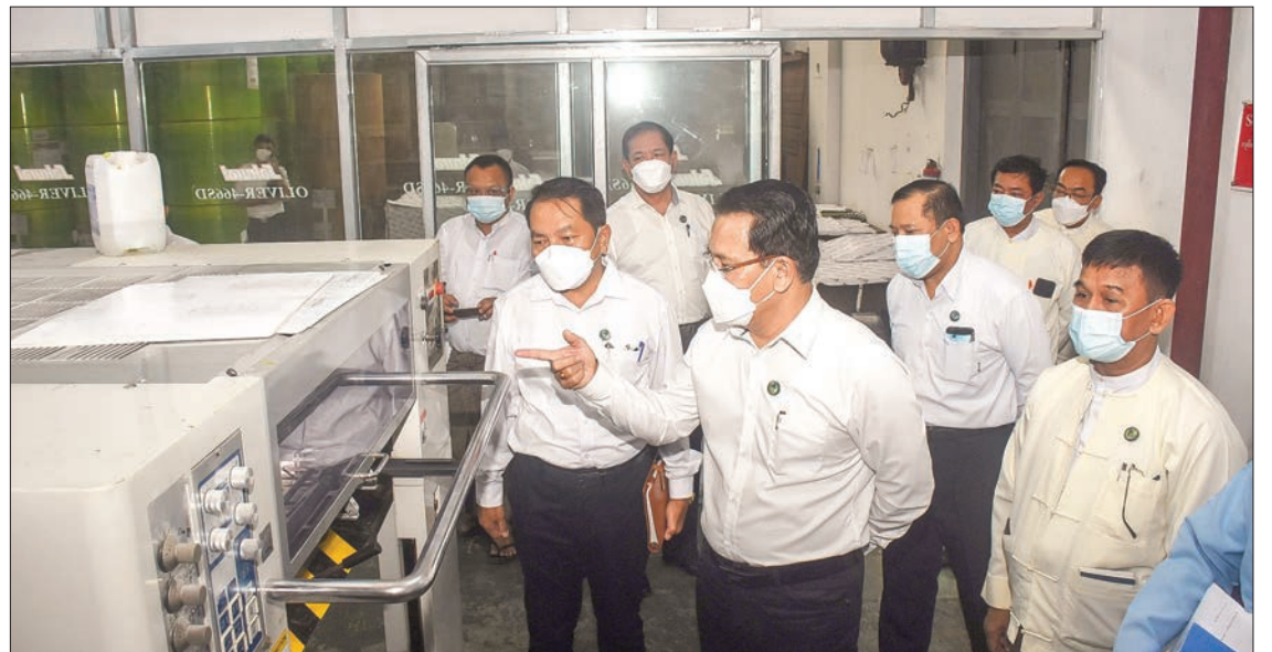
MoI Union Minister U Maung Maung Ohn views around the Photolitho Printing Press in Yangon on 31 August 2021.

During the meeting, the Union Minister highlighted the directives of the Prime Minister of the State regarding the artistes from literature, movie, theatrical and music fields, duties of media to inform the public with the correct ways as most of the youths lead to wrong ways due to the unscrupulous persons and un-