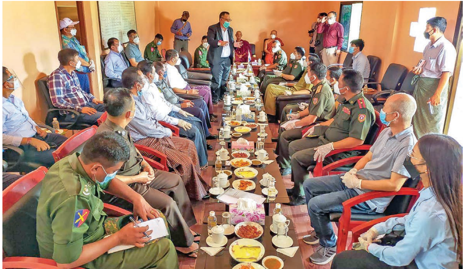
Officials from Myanmar and Laos held a meeting at Wanbon Port in Mongphone (A) Village-Tract, Tachilek Township, Shan State (East) on 30 July and 1 August discussed the repatriation process for over 400 Myanmar migrant workers who are facing difficulties in Laos.

The Ministry of Social Welfare, Relief and Resettlement and the Ministry of Home Affairs coordinated with volunteers and charitable organi-