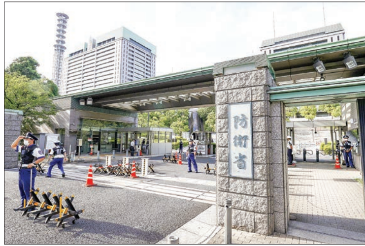
Photo taken on 19 Aug. 2021, shows Japan's Defence Ministry in Tokyo.

The request for such spending will include systems for the electromagnetic spectrum to