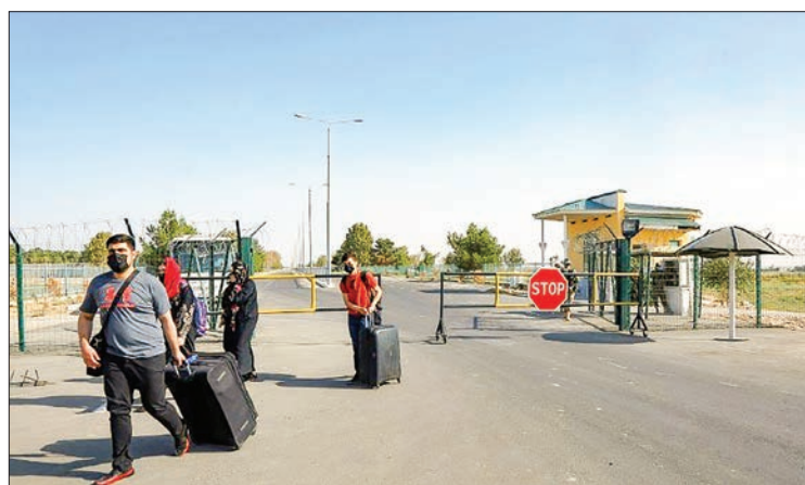
Former Soviet Uzbekistan is one of three Central Asian countries that share a border with Afghanistan.

That sentiment is not shared by Russia, a longstanding force in the region, which has urged