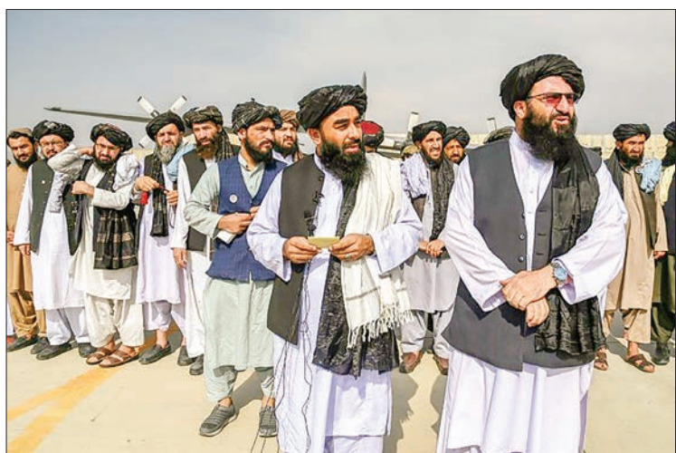
Taliban spokesman Zabihullah Mujahid (C, with shawl) led a group of officials onto the runway of Kabul airport after the US withdrawal.