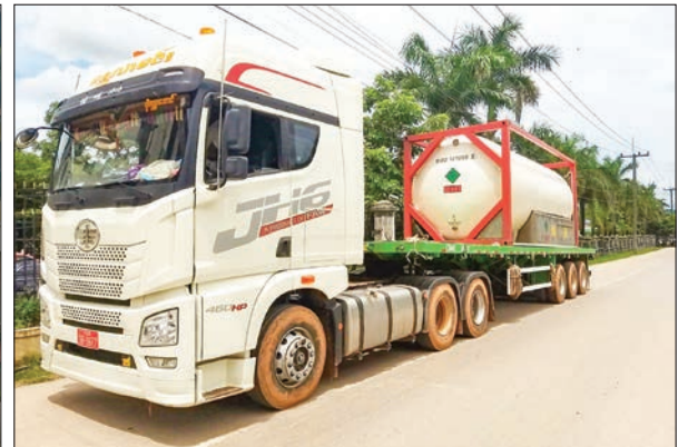
The lorries carrying oxygen tanks and anti-Covid equipment seen transporting them to the needed areas.