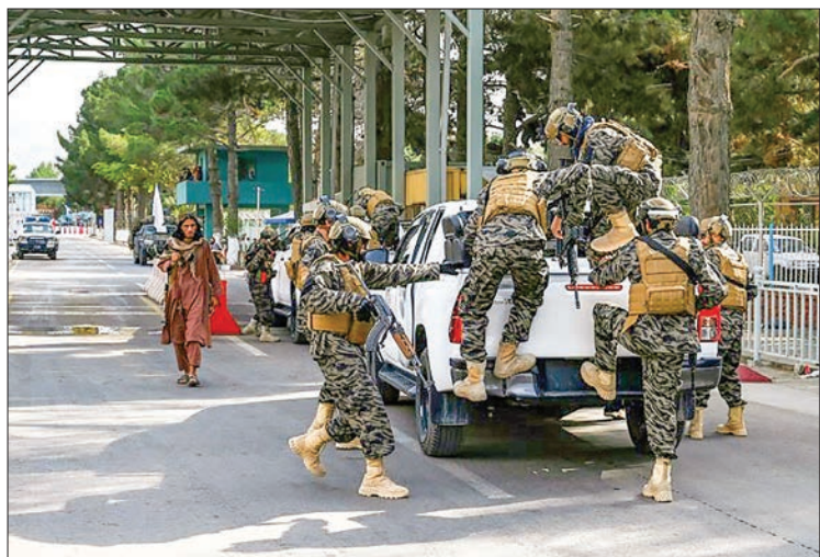
Taliban 'Badri 313' special force fighters arrive at the main entrance gate of Kabul airport after the last US troops left.

THE U.S. administration of President Joe Biden said Monday it has completed the withdrawal of its troops from Afghanistan,