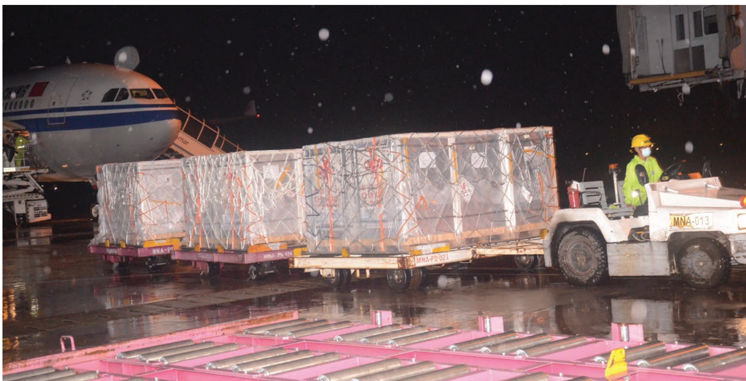
Air China carrying the third batch of 2 million vaccines arrives, and cargoes are seen at Yangon International Airport on 24 July 2021.

Overall, the sixth month of the State Administration Council has centred on efforts to respond to the COVID-19 emergency. Despite the many challenges, the State Administration Council is continuing to work hard to control the pandemic while promoting measures to ensure stability and security and accelerate the country's return to normalcy as soon as possible. Clearly, these efforts are being undertaken in the best interests of the people.