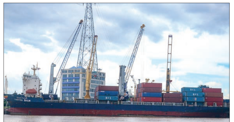
The value of trade between Myanmar and its development partner Japan exceeded over $966.66 million in the current FY. Japan is placed as the third-largest exporting country of Myanmar.

have registered $1.92 billion in the last FY2019-2020, $1.89 billion in the FY2018-2019, $1 billion in the 2018 mini-budget period, $1.92 billion in the 2017-2018FY, $2 billion in the 2016-2017FY and $1.84 billion in the 2015-16FY, respectively.