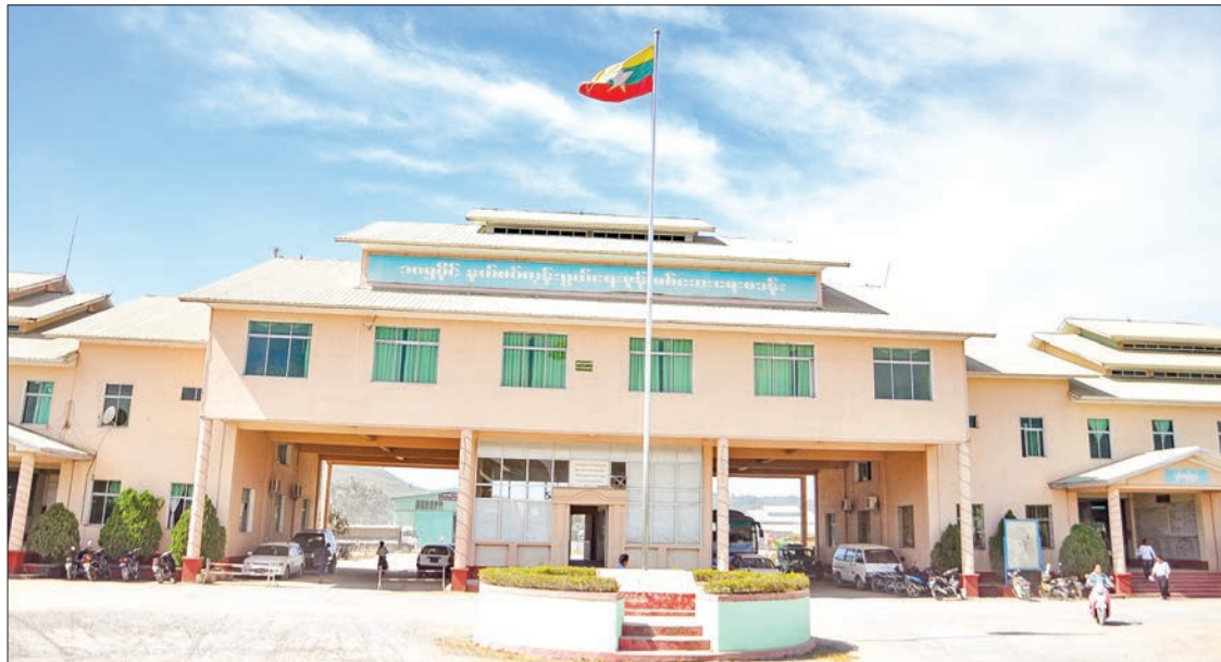
The 105 th -mile border trade zone.

Myanmar shares borders with China, Thailand, India and Bangladesh. During the period, the country's export via land borders earned over $5.81