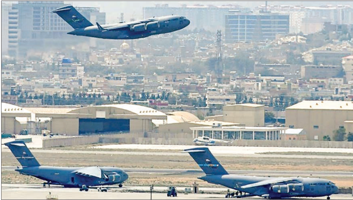
A US Air Force aircraft takes off from the airport in Kabul.

THIS has been a miserable summer for Joe Biden but with the last troops out of Afghanistan the Democrat will now hope to relaunch his struggling presidency back home.