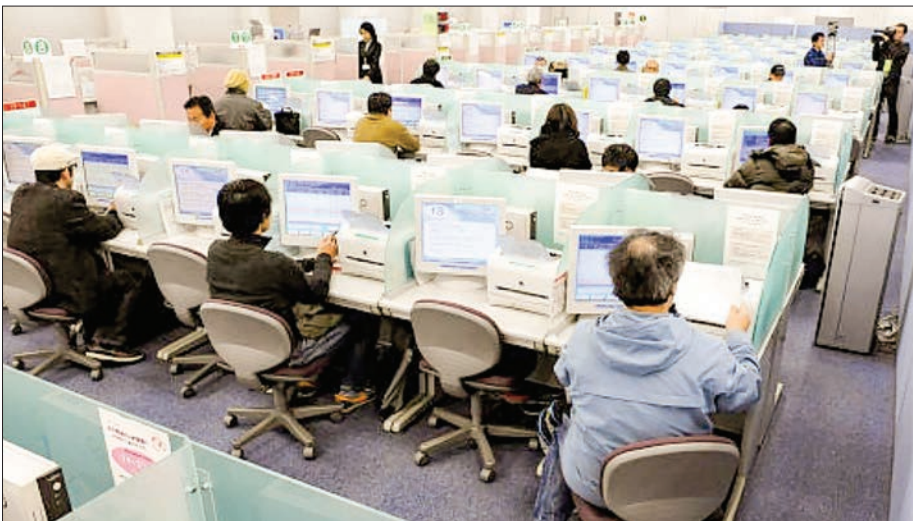
Japan's unemployment rate decreased to 2.8 per cent in July, down for the second consecutive month, despite a resurgence of COVID-19 infections caused many regions to enter or extend emergency measures that limited business activities, government data showed Tuesday.

According to separate data from the Ministry of Health, Labour and Wel-