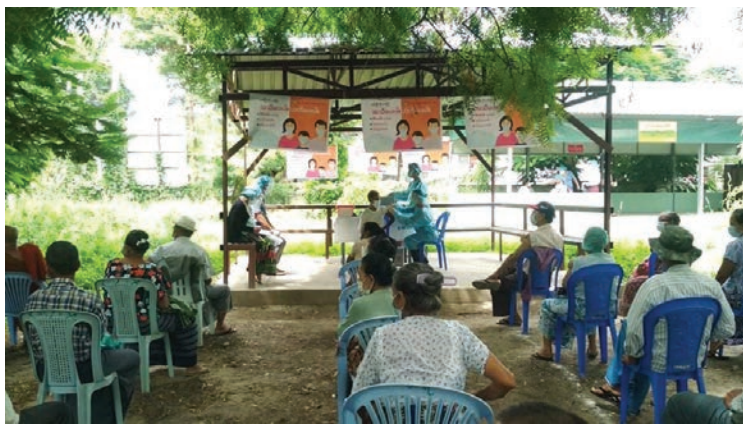
The inoculation programme for the above 65-year-old elders is underway in Amarapura Township.

The State Administration Council's Information Team