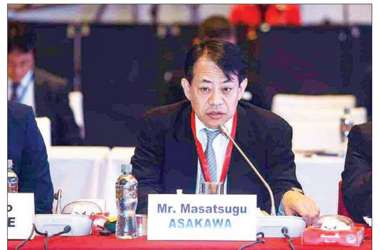
The Asian Development Bank said Tuesday its president, Masatsugu Asakawa, was re-elected for a second term.

In April, he announced his intention to run for re-election and Japanese Finance Minister Taro Aso immediately expressed his support. "President Asakawa has shown excellent leadership since his inauguration in January 2020 and offered speedy and strong supports to counter the spread of the novel coronavirus infections," Aso said in a statement Tuesday. "His re-election resulted from the high evaluation of these previous accomplishments," Aso added.