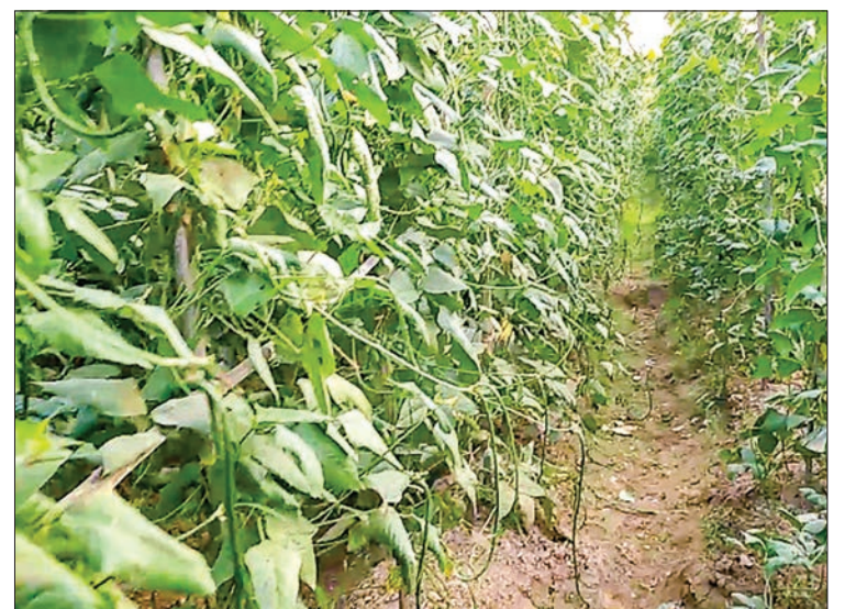
The price of long beans varies every single day. Now, the bean fetches K800 per viss.