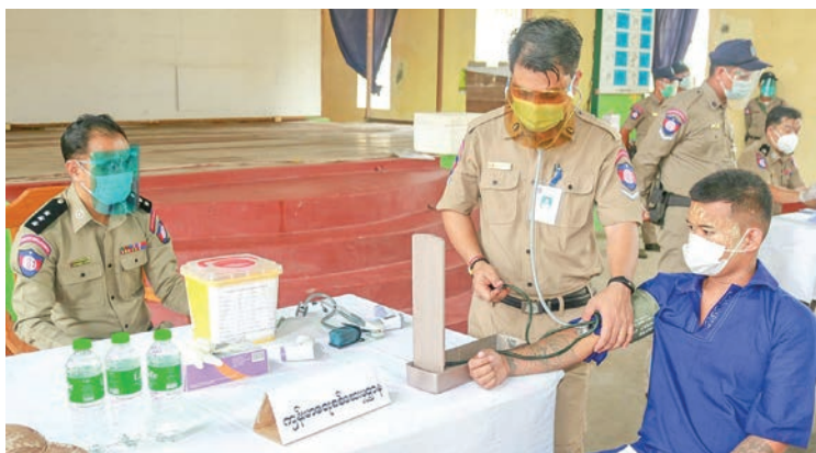
An inmate is seen receiving health condition test before inoculation.