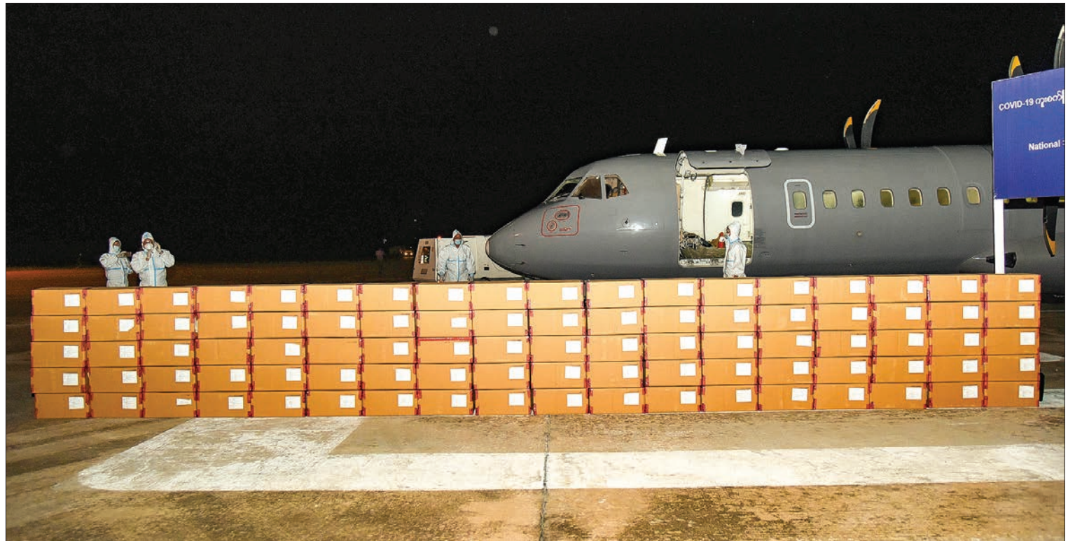
The MoH Union Minister is receiving Remdesivir for the treatment of COVID-19 from the donor National Strategic Investment Corporation Co. Ltd (NSIC) at Nay Pyi Taw Airport on 20 July 2021.