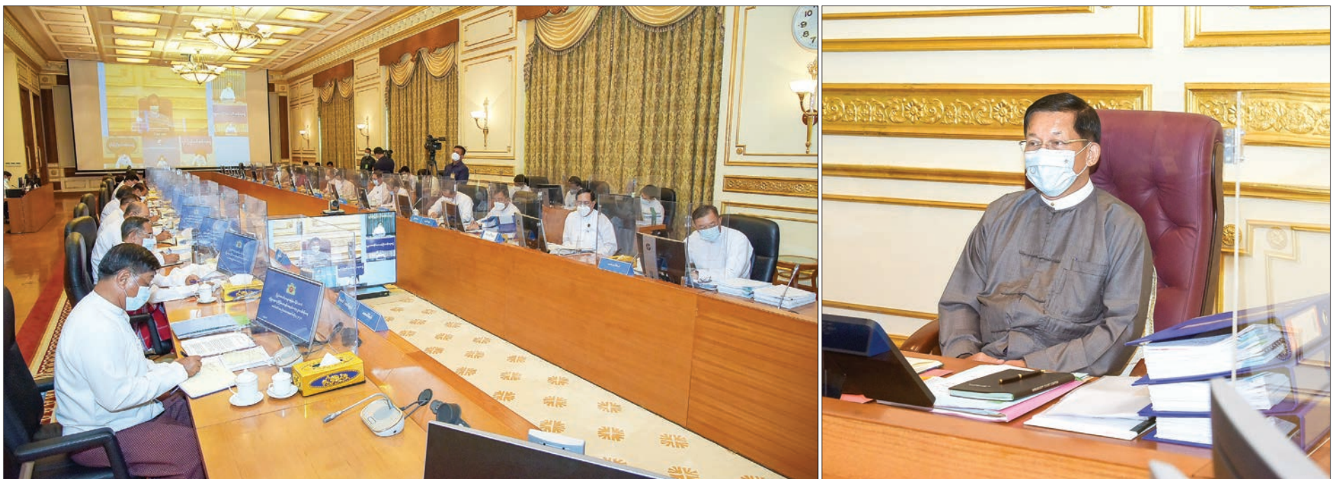
Chairman of the State Administration Council Prime Minister of the Provisional Government of the Republic of the Union of Myanmar Senior General Min Aung Hlaing delivers the address at the meeting No 4/2021 of Security, Stability and Peace and the Rule of Law Committee in Nay Pyi Taw on 31 August 2021.

T HE Security, Stability and Peace, and Rule of Law Committee of the Republic of the Union of Myanmar held meeting No 4/2021 at the Office of the State Administration Council Chairman in Nay Pyi Taw yesterday, with an address by Chairman of the Committee Chairman of the State Administration Council Prime Minister of the Provisional Government of the Republic of the Union of Myanmar Senior General Min Aung Hlaing.