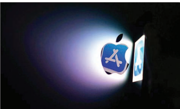
The South Korean law comes as Apple and Google face global criticism for the commission they charge on app sales.

A bill set for a vote in the national assembly would make the South the first major economy to pass legislation on the issue, in a move that could set a precedent for other jurisdictions around the world.