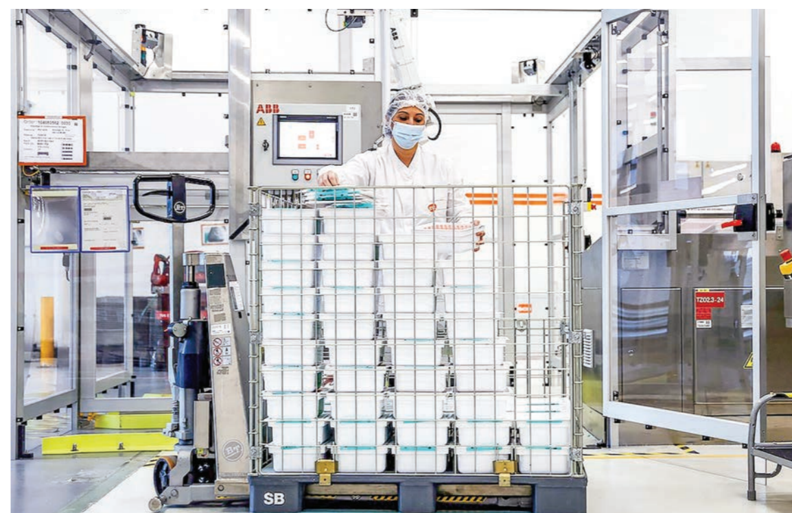
An employee at the factory of British pharmaceutical company GlaxoSmithKline in Wavre on 8 February 2021, where the Covid-19 vaccine will be produced.

Glaxo is also working with French pharmaceutical giant Sanofi on final Phase 3 tests of a different Covid vaccine, which