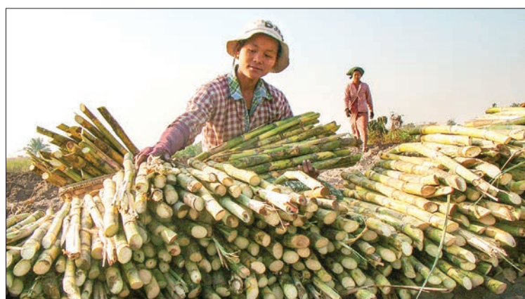
Sugarcane covered 438,420 acres in the country last year from 2019-2020. Myanmar's sugar production was reduced by about 100,000 tonnes this year, the Agriculture Department stated.

Sugar cane prices were pegged at over K50,000 per ton in the 2015-2016FY, K45,000 in the 2016-2017FY, K41,500 in the 2017-2018FY, K38,000-40,000 in the 2018-2019FY and K40,000 in the last FY2019-2020, according to the news released online by the Ministry of Commerce.