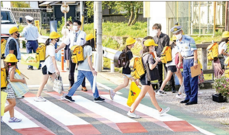
Photo taken on 30 August 2021, shows students of an elementary school in Kameoka, Kyoto Prefecture, traversing a specially-painted crosswalk made to appear as if it is three-dimensional to catch the attention of drivers and get them to slow down. The stripes of the crosswalk, at which there are no traffic lights, are painted not just in white but also dark red and appear to the eye to be floating in the air.

A specially-painted crosswalk made to appear as if it is three-dimensional to catch the attention of drivers and get them to slow down was declared open near an elementary school in Kyoto Prefecture on Monday as the school restarted after the summer vacation.