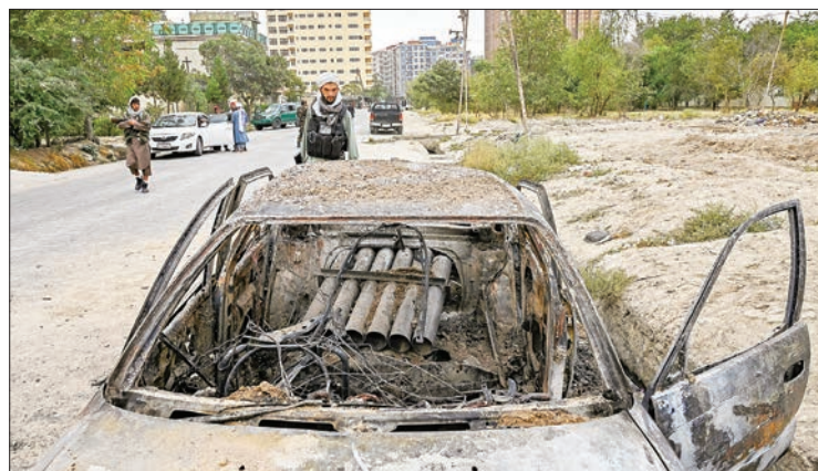
A Taliban fighter investigates a damaged car after multiple rockets were fired in Kabul on 30 August 2021.

The Islamic State group, rivals of the Taliban, pose the biggest threat to the withdrawal after carrying out a suicide bomb attack at the perimeter of the airport late last week that claimed more than 100 lives, including those of 13 US troops.