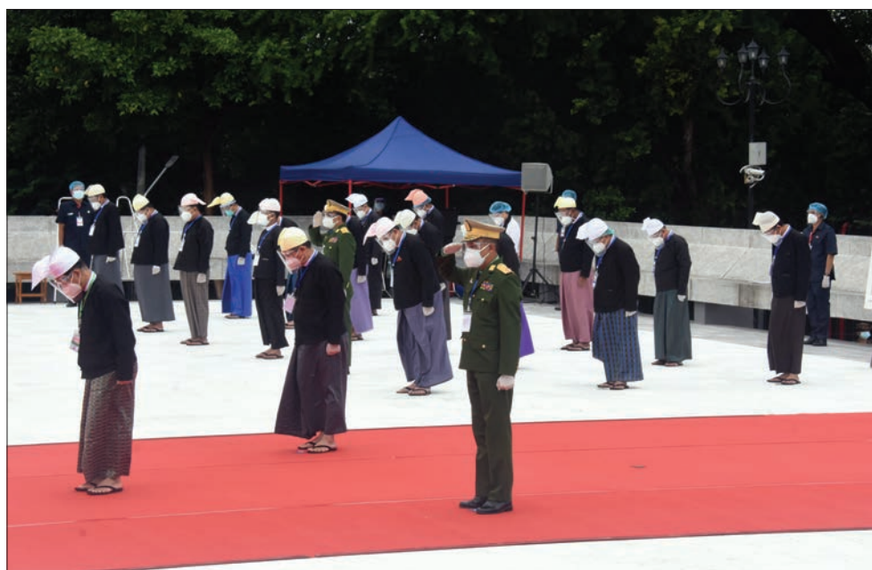
The MoRAC Union Minister, the Yangon Region Administration Council Chairman and the Commander of the Yangon Region Command are paying tribute to the Martyrs after laying wreaths at the Martyrs' Mausoleum to commemorate the 74th Martyrs' Day on 19 July 2021.

with the Special Rapporteur on Myanmar at the 7 th regular session of the UN Human Rights Council, held in the absence of the representative of the country concerned, Myanmar also rejects the statement made by the Special Rapporteur as inter-