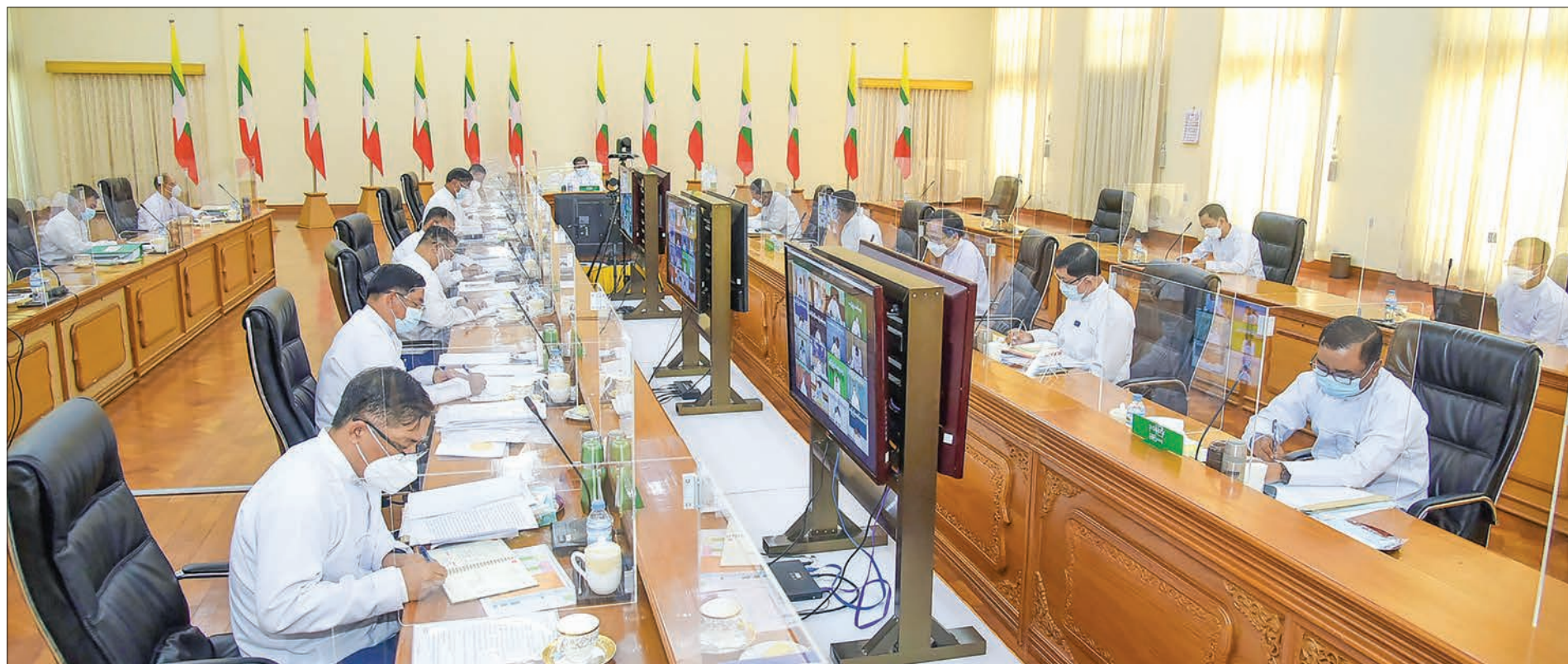
Chairman of the State Administration Council Prime Minister of the Provisional Government of Myanmar Senior General Min Aung Hlaing addresses the tenth coordination meeting on COVID-19 prevention, control and treatment activities yesterday in Nay Pyi Taw.

O FFICIALS at different levels need to supervise necessary medical examination and protection for returnees from foreign countries in order to plummet the infection rate of COVID-19 in border areas as well as the whole country, said Chairman of the State Administration Council Prime Minister of the Provisional