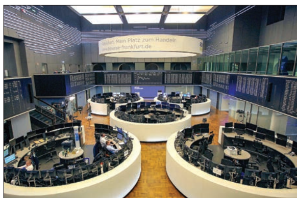
Traders work in front of a board displaying Germany's share index DAX (background) at the stock exchange in Frankfurt am Main, western Germany, on 27 August 2021.

"But his dovish undertones on his views on inflation as well as the emphasis on decoupling the rate hike decision from... tapering resulted in a risk positive market reaction." — AFP ■