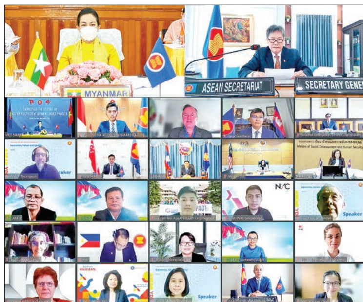
A total of 1,582 students and 151 Myanmar experts and students participated in data collection programmes of ASEAN YDI Phase II. — MNA

The report will benefit the youth development in ASEAN countries. The ASEAN YDI Phase I looked at four domains of education, health and well-being, employment, participation and engagement while the ASEAN YDI Phase II studied awareness, values and identity.