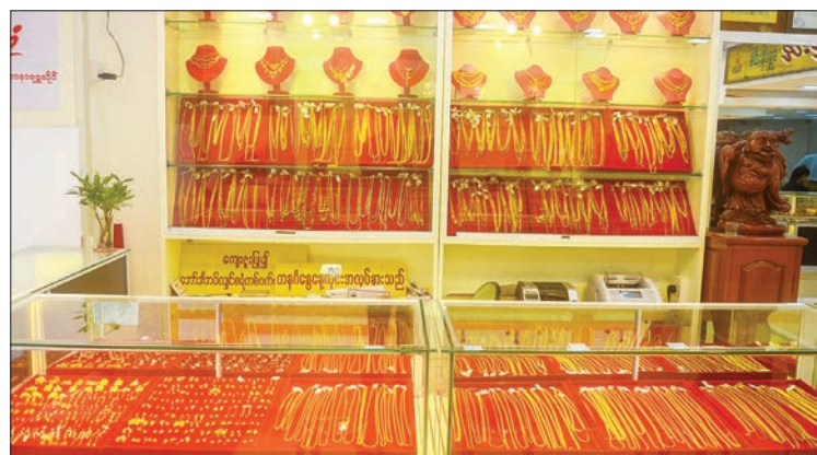
Despite the domestic gold price staying in the upward trend, the market is pretty sluggish, according to the YGEA.

With global gold prices on the uptick, the domestic price hit fresh highs in 2019, reaching K1,000,000 per tical between 17 January and 21 February, crossing K1,100,000 (22 June to 5 August), climbing to over 1,200,000 (7 August-4 September), and then reaching a record high of K1,300,000 on 5 September 2019. — NN/GNLM