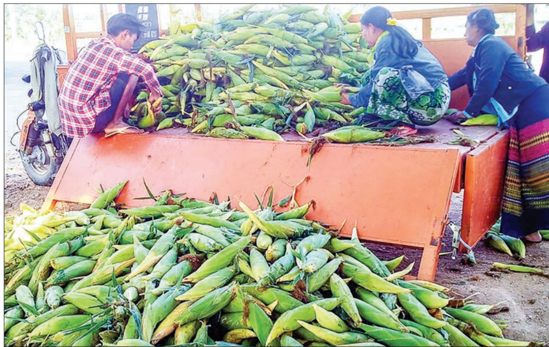
Myanmar is the second-largest exporter of corn among regional countries. At present, corn is cultivated in Shan, Kachin, Kayah and Kayin states and Mandalay, Sagaing and Magway regions.

MYANMAR'S corn exports to foreign countries generated revenue of more than US$490 million in the past nine months (October-June) of the current financial year 2020-2021, Myanmar Customs Department's statistics showed.