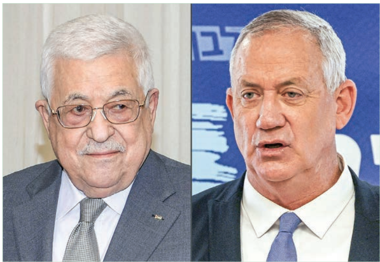
(COMBO) This combination of pictures created on 30 August 2021 shows (L to R) Palestinian president Mahmoud Abbas during a diplomatic meeting in Ramallah in a handout photo provided by the Palestinian Authority’s press office (PPO) on 1 August 2021; and Israeli Defence Minister Benny Gantz giving a press conference at his party’s office in the Knesset in Jerusalem on 7 June 2021.

IAEA inspectors were kicked out of North Korea in 2009, and the agency has since monitored it from outside. — AFP ■