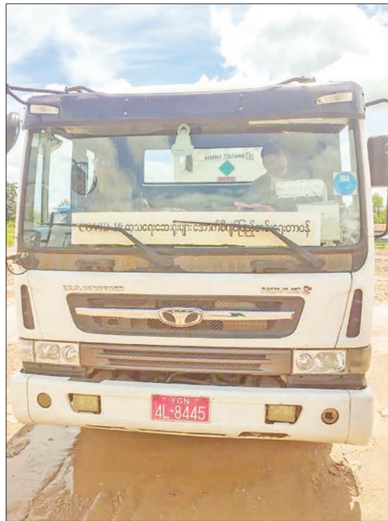
The Lorries carrying oxygen tanks and COVID protective equipment are transporting them to the needed places and areas.