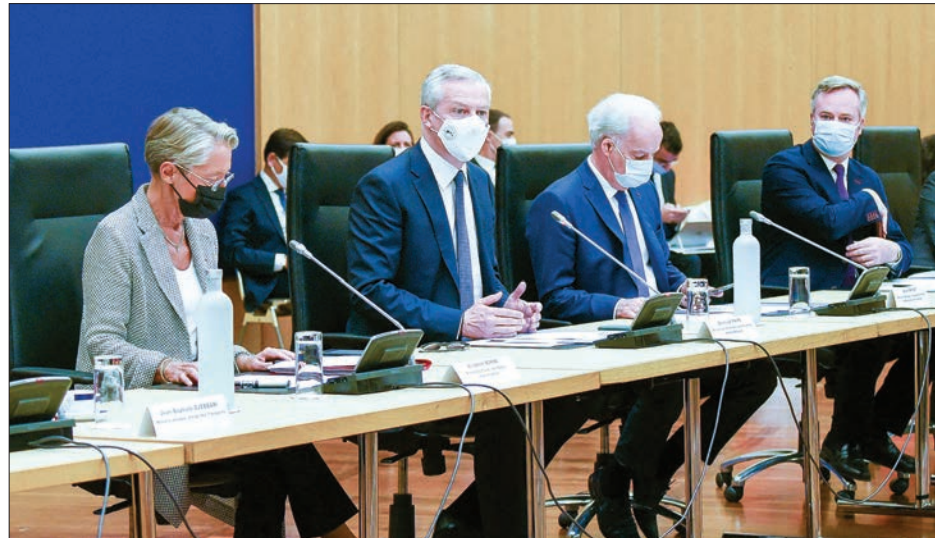
(From L to R) French Labour Minister Elisabeth Borne, French Economy and Finance Minister Bruno Le Maire, French Junior Minister of Small and Medium Enterprises Alain Griset and French Junior Minister in charge of Tourism Jean-Baptiste Lemoyne attend a meeting concerning the helps for the economic sectors amid the Covid-19 pandemic, at the Economy ministry in Paris, on 30 August 2021.

THE French government has extended 240 billion euros ($283 billion) in financial aid to businesses hammered by the coronavirus pandemic since March