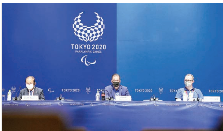
Toshiro Muto (L), CEO of the committee organizing the Tokyo Olympics and Paralympics, and International Paralympic Committee President Andrew Parsons (C) attend a press conference in Tokyo on 30 August 2021.

While some COVID-19 cases have been reported among participants and workers related to the games, Parsons said the organizers have been taking adequate measures to prevent the virus from spreading, adding that the "key" is to track infections and isolate those who test positive from others. Toshiro Muto, CEO of the organizing committee, also said the Paralympics have been "generally going smoothly" since they opened on 24 August following a one-year postponement. — Kyodo News ■