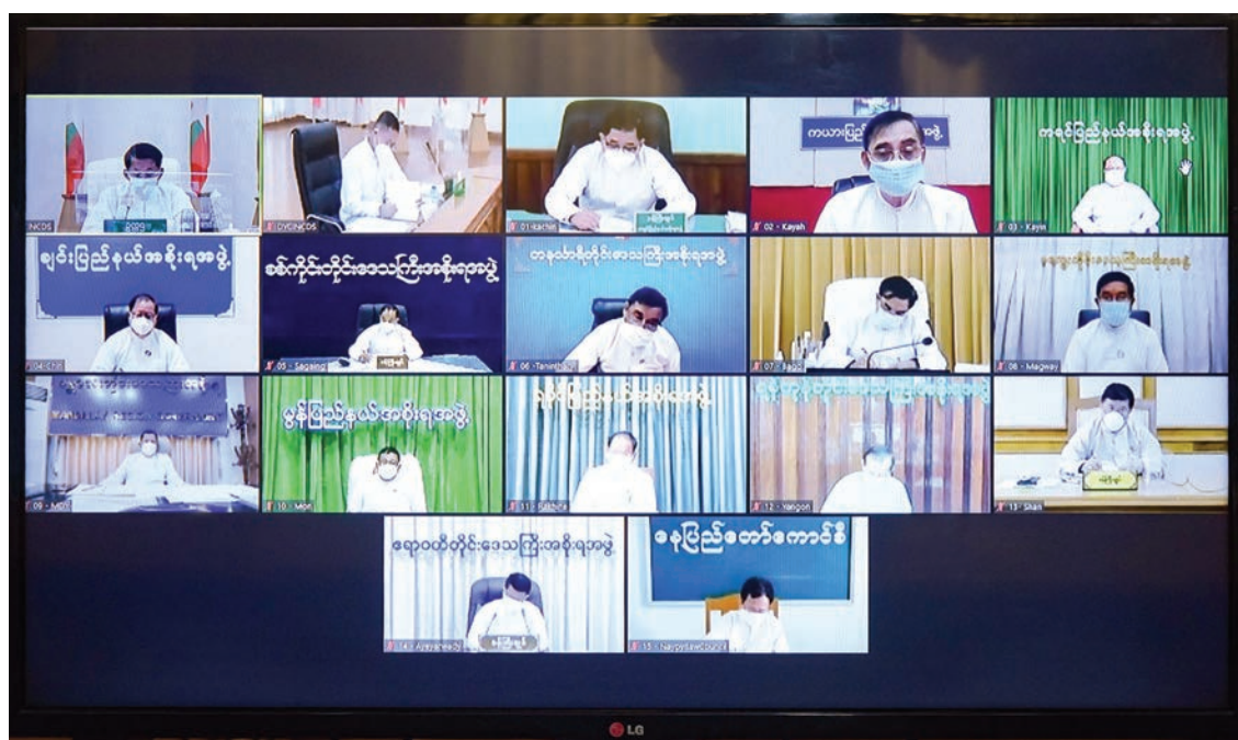
The State/ Region Chief Ministers attend the 10 th coordination meeting online.

Not only China and India but other friendship countries Cambodia, Thailand and Viet Nam donated COVID-19 vac-