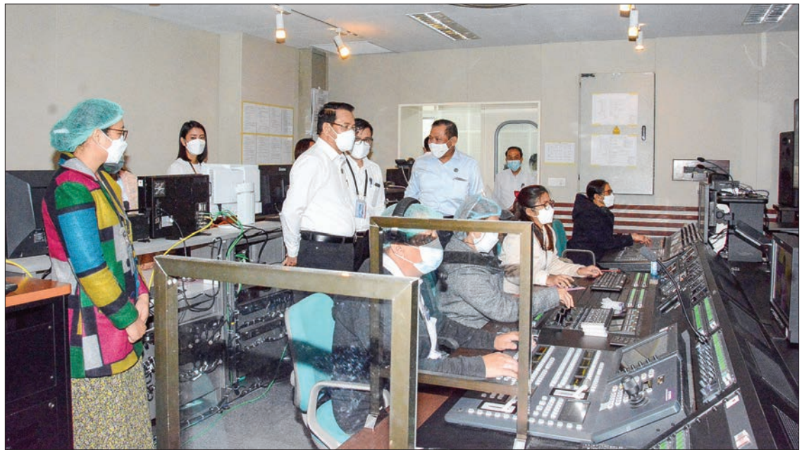
The MoI Union Minister views around the broadcasting news studio.

cooperate with the ministry in easing the difficulties of people from various media sectors during the outbreak of COVID-19.