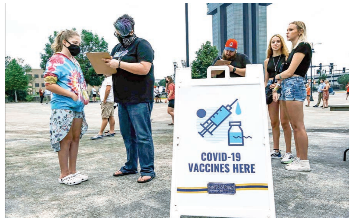
People wait to get vaccinated for COVID-19 at a baseball game in Springfield, Missouri, U.S., on 5 Aug 2021.

The Delta variant was first reported in India in December 2020 and early studies found it to be up to 50 per cent more transmissible than the Alpha variant, which was first iden-