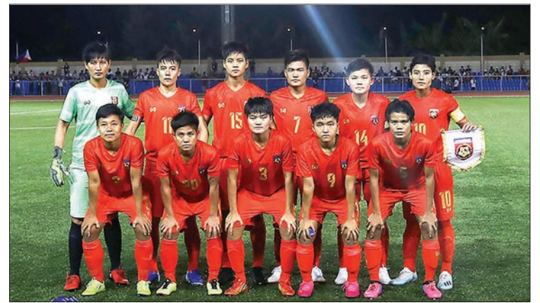
Myanmar women's national football team is currently at tenth place in Asia.