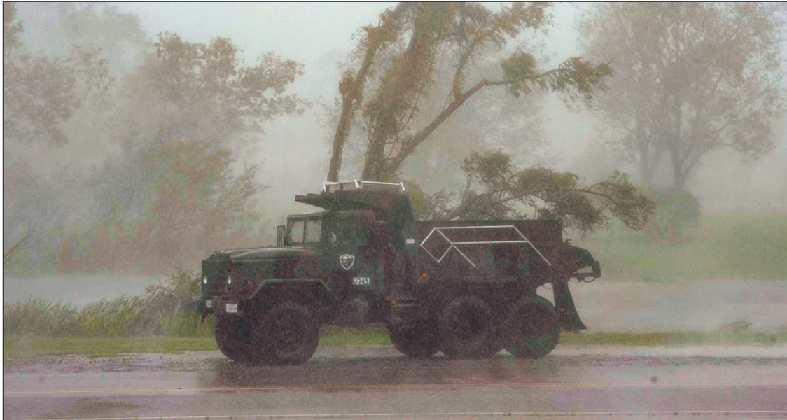
A truck is seen in heavy winds and rain from hurricane Ida in Bourg, Louisiana on 29 August 2021. Hurricane Ida struck the coast of Louisiana Sunday as a powerful Category 4 storm, 16 years to the day after deadly Hurricane Katrina devastated the southern US city of New Orleans.

POWERFUL Hurricane Ida battered the southern US state of Louisiana and plunged New Orleans into darkness Sunday, leaving at least one person dead 16 years to the day after Hurricane Katrina devastated the city.