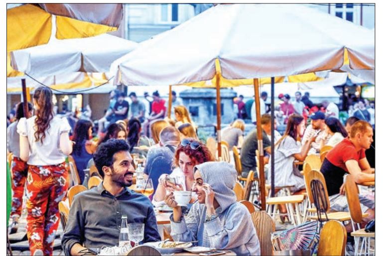
Middle Eastern tourists sit in a street cafe in Lviv, some 540 km west of Kiev on 15 August 2021.