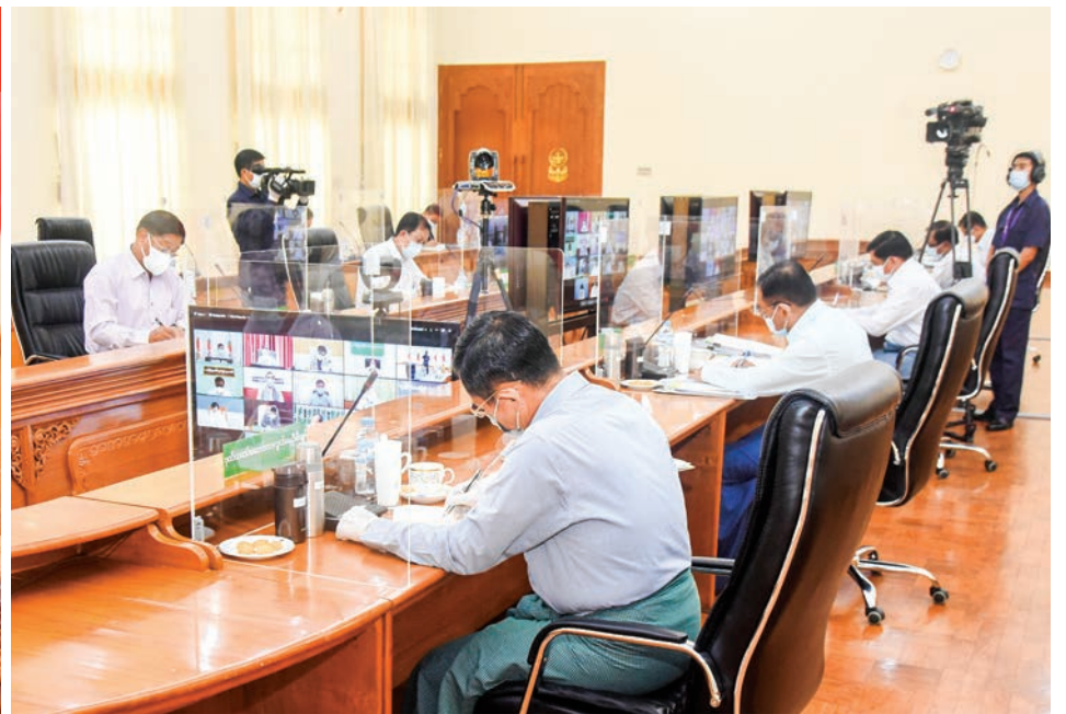
State Administration Council Chairman Senior General Min Aung Hlaing is addresses the fourth coordination meeting on the prevention, control and treatment of COVID-19 in Nay Pyi Taw on 23 July 2021.

Region, which take their policy guidance from the national level coordination body.