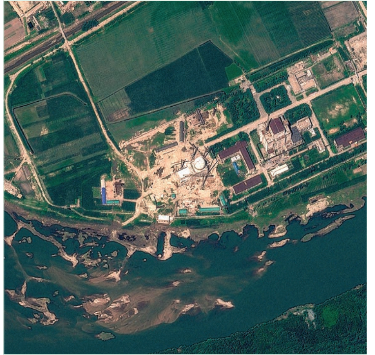
(FILES) This file satellite handout image provided by GeoEye on 22 August 2012 and taken on 6 August 2012 shows the Yongbyon Nuclear Scientific Research Centre in North Korea. Nuclear-armed North Korea appears to have restarted its plutonium-producing reprocessing reactor in a “deeply troubling” development, the UN atomic agency has said on 30 August 2021, a possible sign Pyongyang is expanding its banned weapons programme.

“Since early July, there have been indications, including the discharge of cooling water, consistent with the operation of the reactor,” the International Atomic Energy Agency said in