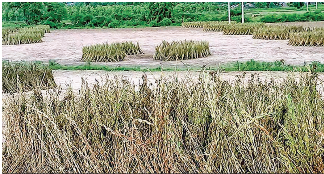
Of the cooking oil crops grown in Myanmar, the acreage under sesame seed is the highest, accounting for 51.3 per cent of the overall oil crop plantation.

"We see a high inflow of black sesame from Shwebo, Wetlet and Monywa areas in the Mandalay market this monsoon season. Moreover, the sesame seed from Magway Region also starts to enter the Mandalay market. The black sesame is high in demand. In addition, Yuan value is also gaining. China uses black sesame in the snack food business, oil production and making herbal medicine. There is one thing that I want to remind the growers of the excess of acid content," the owner of Soe Win Myint Depot