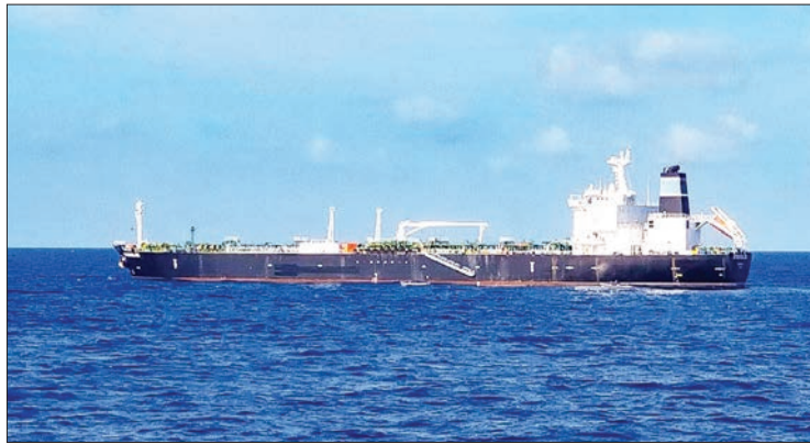
The MT Strovolos was picked up by the Indonesian navy off the coast of Sumatra.

INDONESIA'S navy said Wednesday it has seized a tanker and its crew who were wanted on charges of stealing nearly 300,000 barrels of crude oil from Cambodia's reserves.