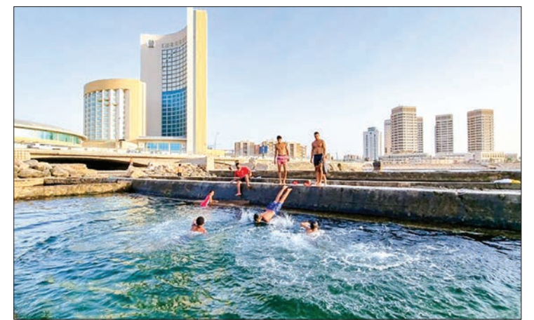
Libyans swim in the Mediterranean at the capital Tripoli's waterfront. Libya's infrastructure has been devastated by a decade of conflict, state collapse and neglect since the 2011 overthrow and killing of dictator Moamer Kadhafi.

“We have raised the issue of pollution in Tripoli's seawater with the former and current governments, and emphasized the urgent need for a sanitation facility,” Naami said. —AFP ■