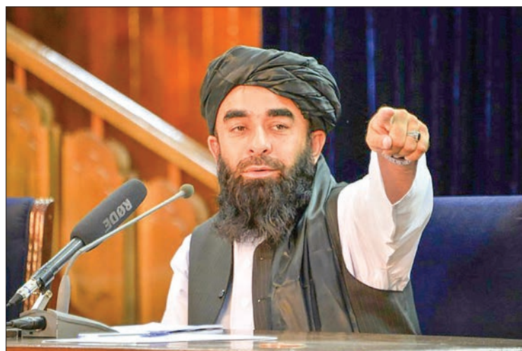
Days after the Taliban captured Kabul, spokesman Zabihullah Mujahid presented himself to the public for the first time.

FOR years the Taliban's top spokesman shunned the public eye, even as he amassed hundreds of thousands of followers