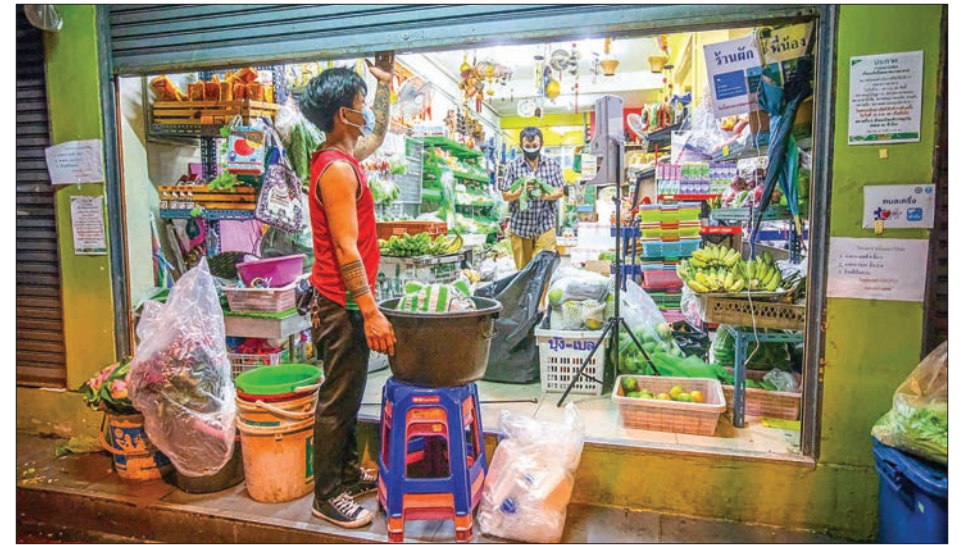
Employees prepare to close a grocery shop in Bangkok on 19 July 2021, ahead of a night-time curfew restriction implemented to reduce the spread of the Covid-19 coronavirus.

THE Thai Cabinet on Tuesday decided to keep the current 7 per cent rate of Value Added Tax (VAT) for at least another two years, hoping to reduce the financial burden of consumers and businesses wrought by COVID-19 pandemic.