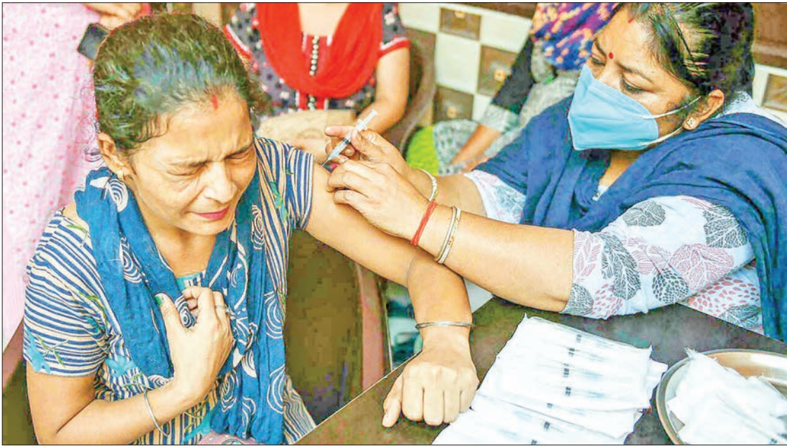
Emerging countries will bear the brunt of the losses from slow vaccination efforts, according to the Economist Intelligence Unit.