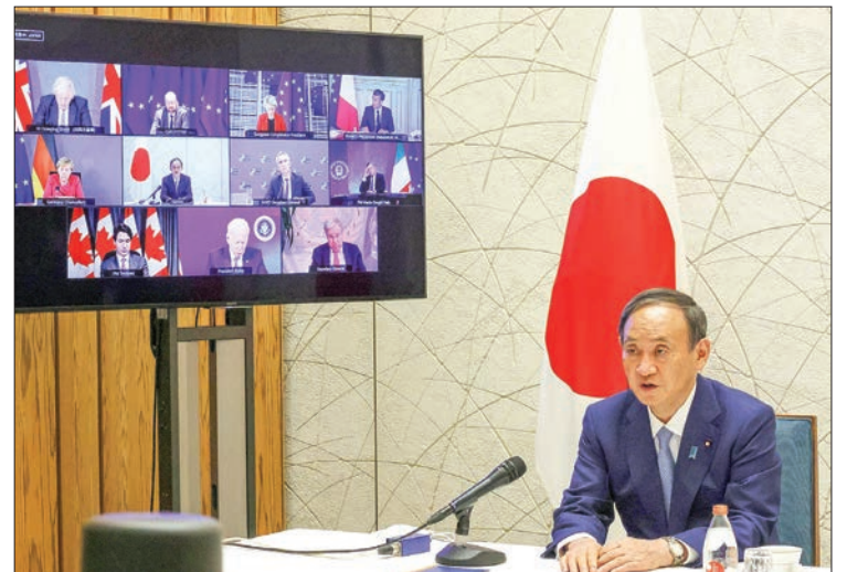
Japanese Prime Minister Yoshihide Suga participates in an online summit meeting of the Group of Seven industrialized nations at the prime minister's office in Tokyo on 24 Aug. 2021.

Japanese Prime Minister Yoshihide Suga told reporters that Tokyo will work closely with the other G-7 members on efforts to evacuate people from Afghanistan and that his country is prepared to help support