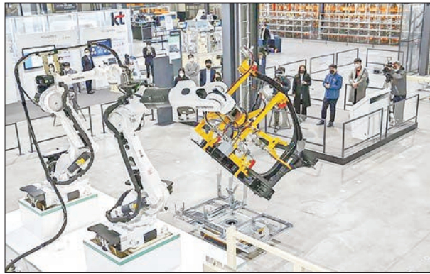
Visitors look at industrial robots during a smart logistics demonstration event organized by South Korea's Land, Infrastructure and Transport Ministry at Hyundai robot logistics demo centre in Gwangju on 30 March 2021.