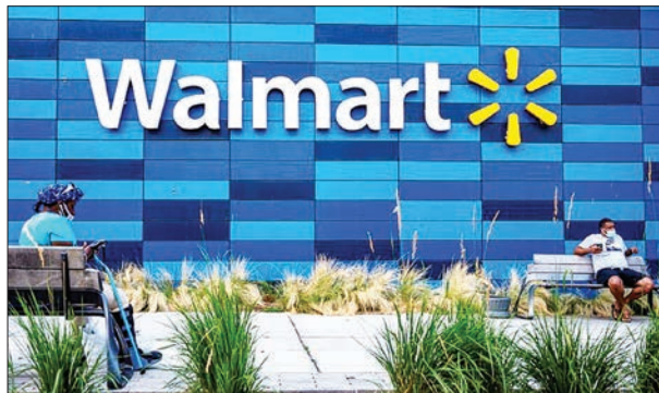
US retail giant Walmart's new shipping service is the latest move in its competition with Amazon.