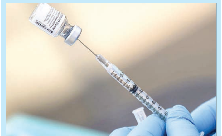
The Centres for Disease Control and Prevention (CDC) has been examining the real-world performance of the two vaccines since they were first authorized among health care personnel, first responders and other frontline workers.

According to a recent paper in the journal Virological , the amount of virus found in the first tests of patients with the Delta variant was 1,000 times higher than patients in the first wave of the virus in 2020, greatly increasing its contagiousness. —AFP ■