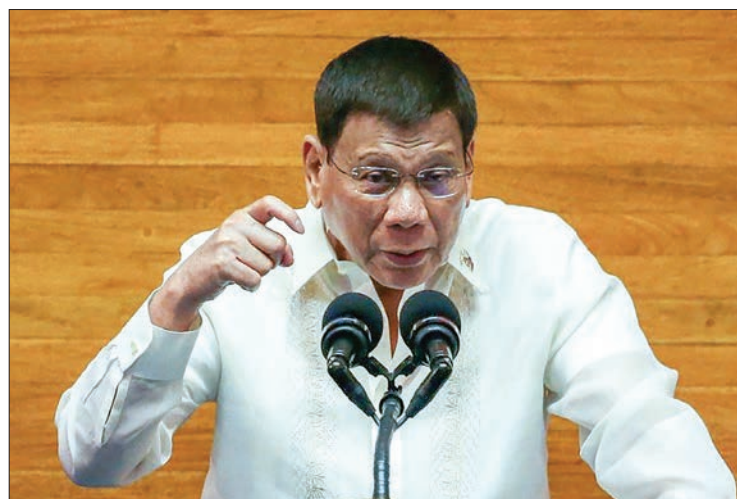
Rodrigo Duterte is barred under the constitution from seeking another term as president.

PHILIPPINE President Rodrigo Duterte will run for vice-president in next year's elections, his party said Tuesday, after months of speculation about whether he would seek to stay in power.