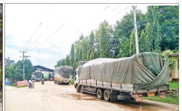
The lorries are seen transporting the imported COVID-19 protective devices and medical supplies to the needed places.