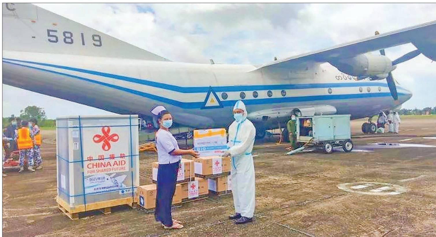
The COVID-19 vaccines are transported and distributed to one of the remote areas with the help of Tatmadaw aircraft.

These vaccines were also used to vaccinate the factory workers in Yangon, Mandalay, Bago and Ayeyawady regions. — MNA