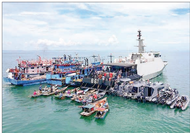
Fishermen got doses of Covid-19 vaccines onboard an Indonesian naval ship off the coast of southern Riau.

Others closer to shore often leave for work before vaccination centres open and return home after they're closed. — AFP ■