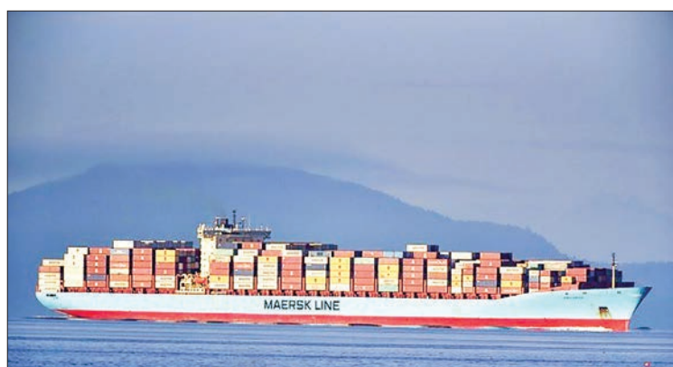
Global maritime transport accounts for almost three per cent of greenhouse gas emissions, according to the International Maritime Organization.

DANISH shipping giant AP Moller-Maersk said Tuesday it was speeding up plans for an environment-friendly fleet with the order of eight carbon-neutral container vessels, a pioneering project in the highly-polluting industry.