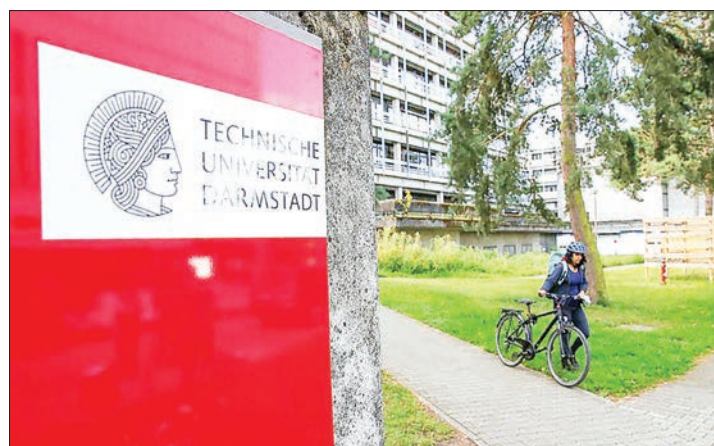
German police launched an investigation into "attempted murder" on Tuesday after a poisoning at a university left one student in a critical condition and six others in need of medical attention.