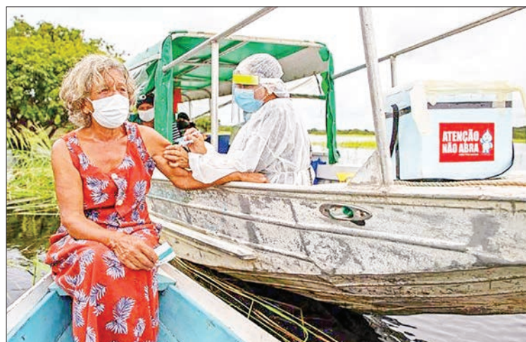
File photo of an Amazonian women getting a Covid-19 jab in Brazil's Amazonas State.

As he was vaccinated, Bellido also commented on several issues pertaining to the embattle Pedro Castillo administration – chief among which is the President's historically low approval rating just a few weeks into his government and the controversy over Bellido's own appointment.—AFP ■