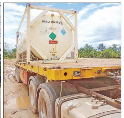
The lorries are seen transporting the imported COVID-19 protective devices and medical supplies to the needed places.

ing with relevant departments, facilitating the importation of essential medical supplies re-