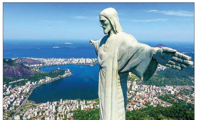
The Christ the Redeemer statue is one of the most visited site in Rio de Janeiro, Brazil's tourism capital.

The two men were detained on Monday and released after posting 10,000 reais ($1,900) in bail. The two will now have to appear before a judge.—AFP ■