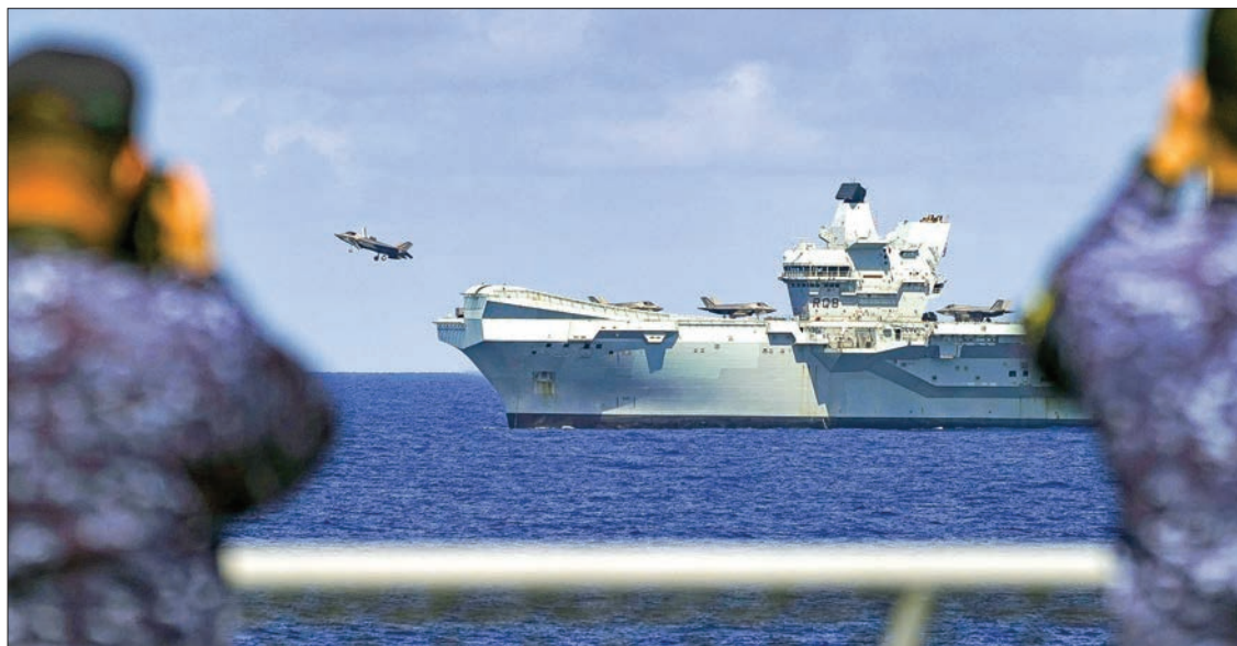
A F-35B fighter jet takes off from British aircraft carrier Queen Elizabeth during Japan and Britain's joint naval drill in the Pacific Ocean south of Okinawa Island on 24 Aug 2021.

In the exercise, which was open to the media, the F-35B advanced stealth fighter jets belong-