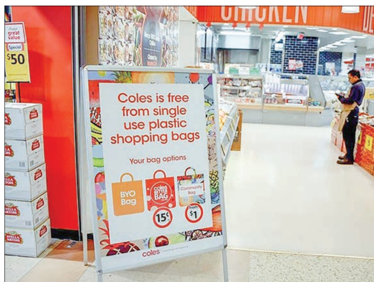
Scientists have measured bag impacts taking into consideration materials, manufacturing, use, and disposal or recycling.