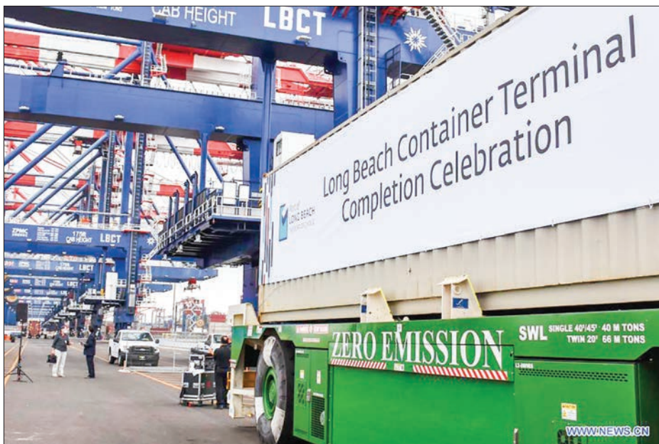
A container ship of China's COSCO Shipping docks at a new container terminal of the Port of Long Beach in California, the United States, 20 August 2021.

While capacity in most terminals on the U.S. West