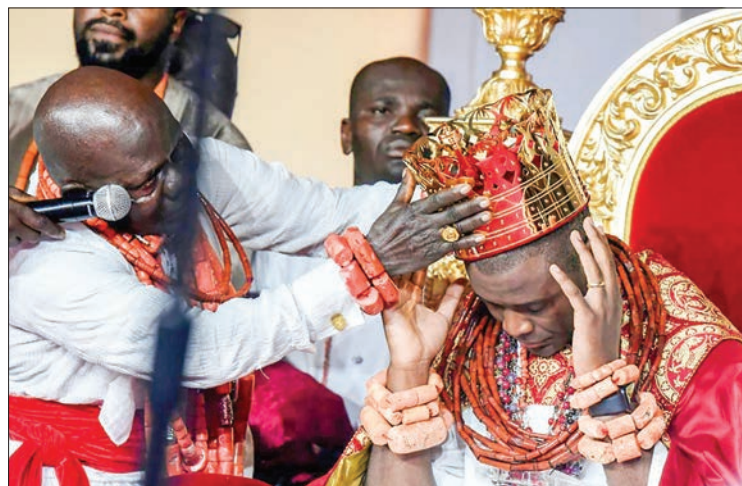
The king or Olu of Warri is one of the most important traditional rulers in Nigeria reigning over a kingdom dating back to the 15th century.

After the crown was placed on his head, the kingmakers bowed to pay homage to the new king to applause from the ecstatic crowd of onlookers. The new king, now officially known as Ogiame Atuwatshé III of Warri kingdom, urged Itsekiri to support him, as guests were given displays of music, dancing, acrobatics and a boat regatta.— AFP ■