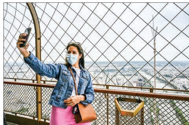
The Eiffel Tower reopened in mid-July after a nine-month hiatus due to the pandemic.

el emergency response for flood prevention was also activated. In the provincial capital Zhengzhou, the residents living in flood-hit zones, mountainous areas, and those living on the first floor of buildings in the urban area were requested to be evacuated, according to a circular issued by the city's headquarters of flood prevention and drought control. — AFP ■