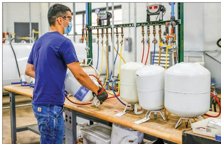
Companies like Tradewater collect potent greenhouse gases at their facility near Chicago and then sends them for destruction.