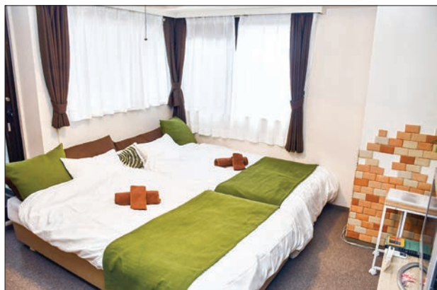
Photo taken in June 2019 shows a "minpaku" private lodging room in the Ishikawa Prefecture city of Kanazawa, central Japan.

THE number of private properties for vacation rental in Japan has declined as the novel coronavirus pandemic caused a nosedive in travel demand, dashing hopes for more