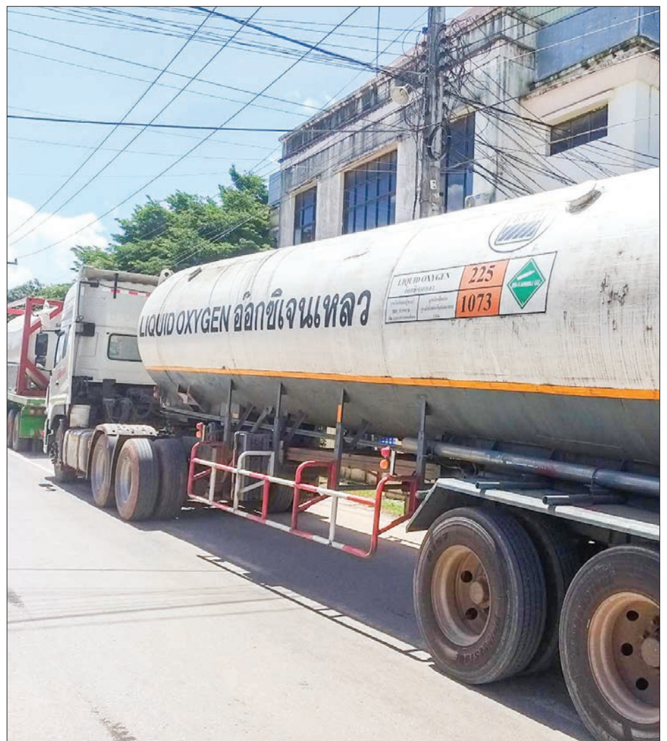
Truck is carrying liquid oxygen from Myawady.