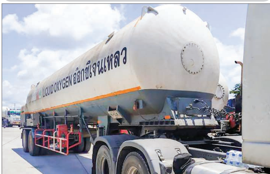
A truck transports liquid oxygen container.