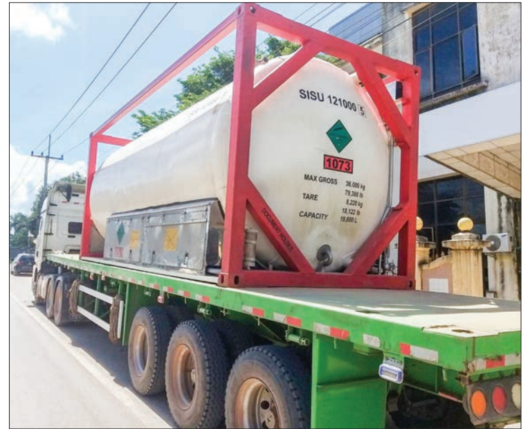
A truck carries oxygen container.

It is reported that the Ministry of Commerce is allowing the importation of COVID-19 devices in accordance with the SOP priority negotiated by relevant departments, and announcements related to the imports of medical supplies and equipment are posted on commerce.gov.mm.—MNA