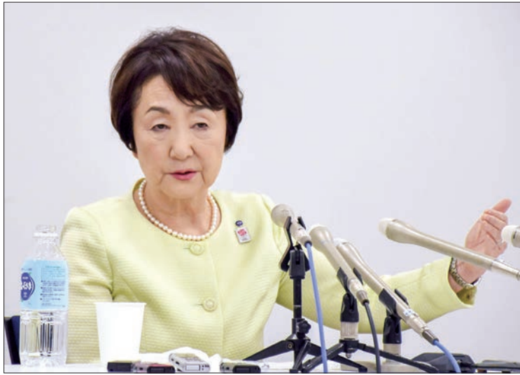
Incumbent Yokohama Mayor Fumiko Hayashi is seeking re-election by supporting the Yamashita Pier casino resort project.

VOTING is under way in the Yokohama mayoral election Sunday, with the result set to have major implications for Prime Minister Yoshihide Suga's hopes of remaining in power beyond