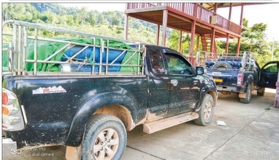
A cub is seen with oxygen cylinder.