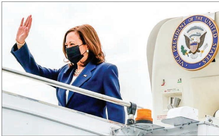
US Vice President Kamala Harris aims to underline Washington's commitment to Asia during her trip to Singapore and Vietnam.

Her two-nation trip to Asia, which includes Vietnam, comes as US President Joe Biden faces strong criticism at home and abroad over the chaos caused by the hasty US troop withdrawal from Afghanistan amid the Taliban's recent takeover of the country.