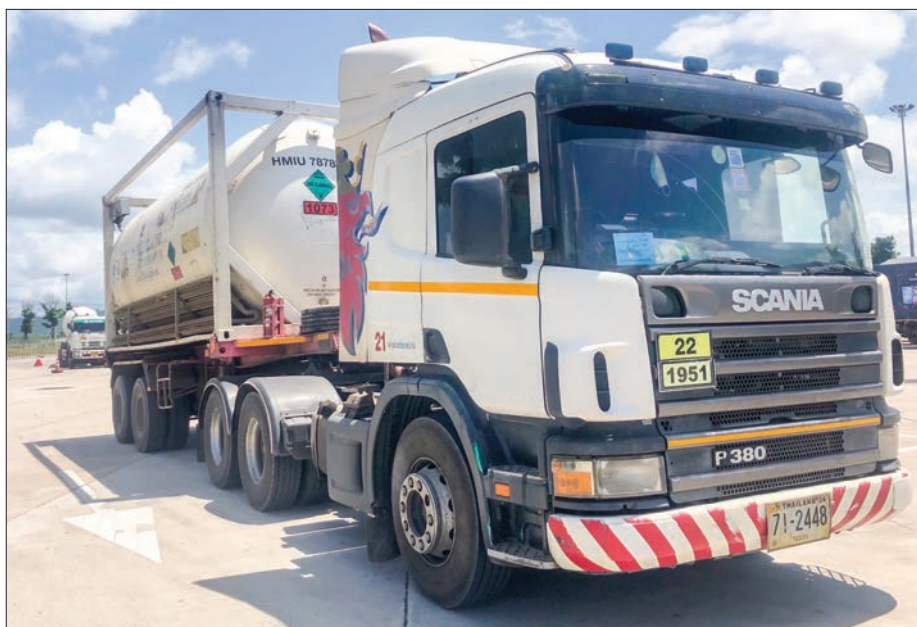
A cargo truck transports liquid oxygen container.