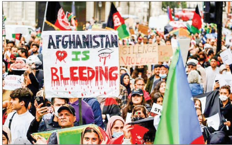
Protesters in London carry placards and wave Afghan flags as they march in solidarity with the people of Afghanistan.

The EU's top foreign policy official had been in Madrid accompanying European Council