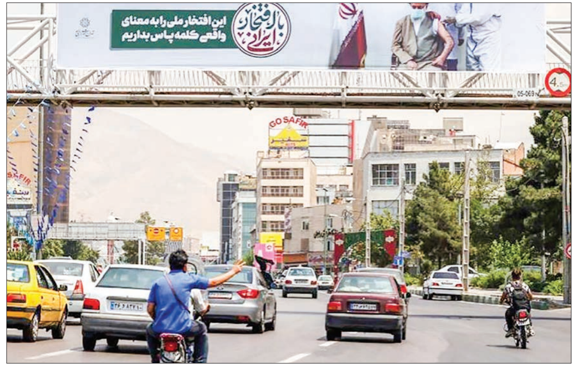
Cars drive under a bridge with a banner showing Iran's Supreme Leader Ali Hosseini Khamenei receiving a COVID vaccine.

IRAN'S ultraconservative President Ebrahim Raisi said Saturday his government will prioritise tackling Covid and accelerating vaccinations ahead of an economic revival, as he defended his cabinet choices before parliament.