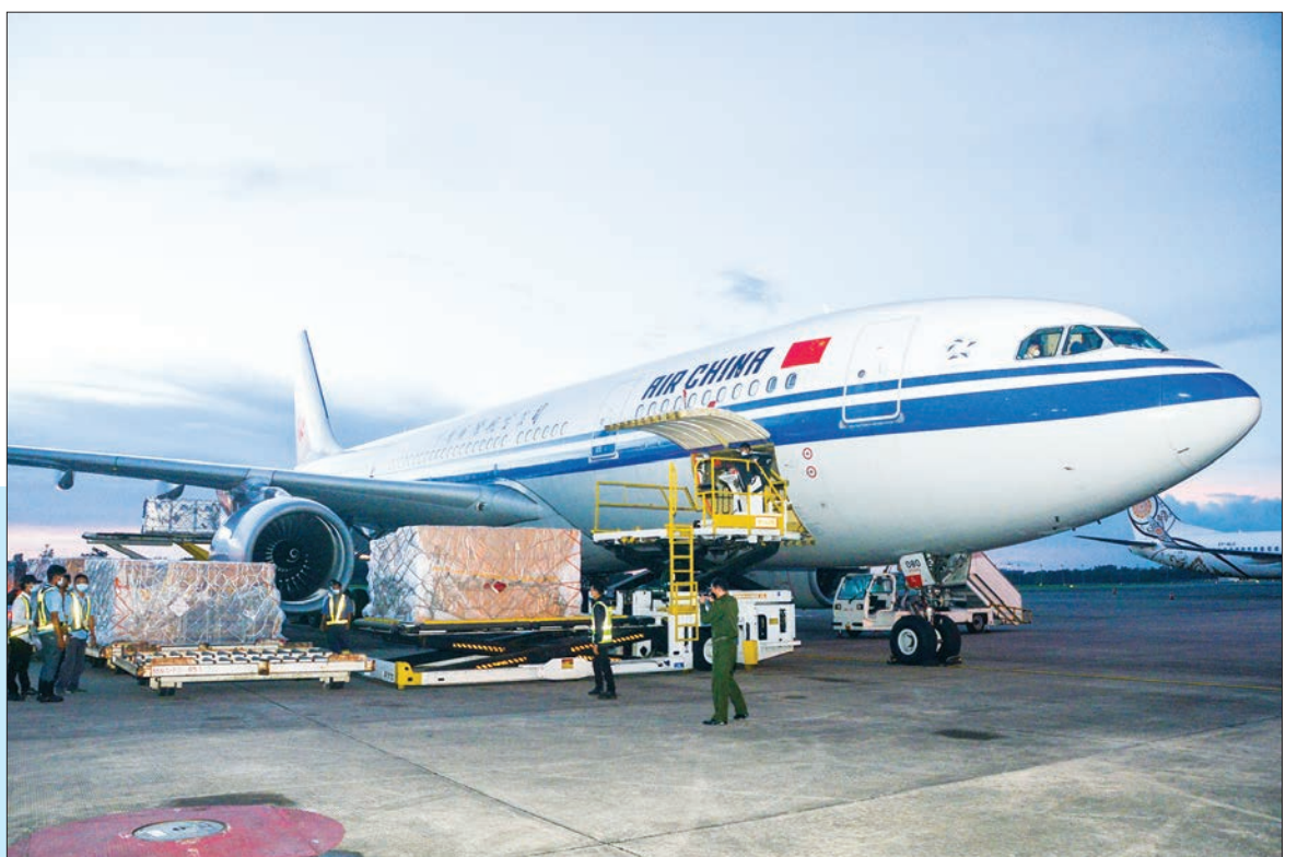
Photo shows medical equipment and accessories donated by People's Liberation Army of China and Myanmar Embassy and Military Attache office in Beijing are unloaded from Air China flight.

These medical supplies were transported from the Yangon International Airport to the medical storage depot in Dagon Township and the central vaccine store depot of the Public Health Department on Mindhamma Road in Mayangon Township.—MNA