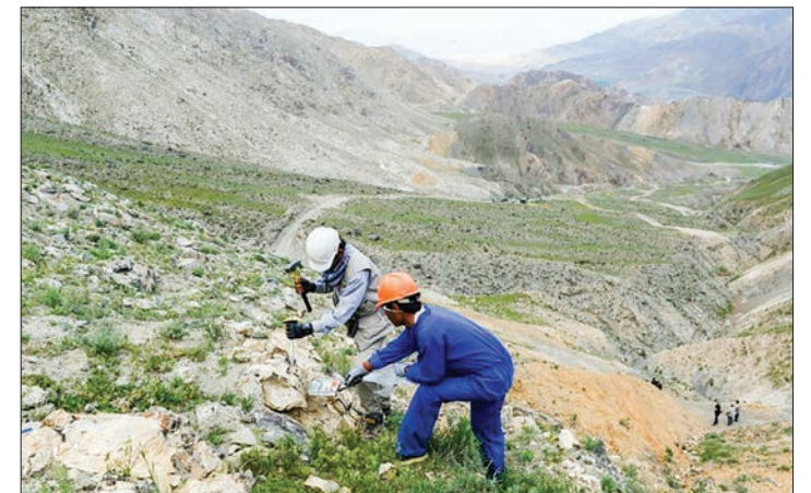
The country’s untapped mineral riches have been estimated at $1 trillion, though Afghan officials have put it three times as high.

THE Taliban now hold the keys to an untouched trillion-dollar trove of minerals including some that could power the world’s transition to renewable energies, but Afghanistan has long struggled to tap its vast deposits.