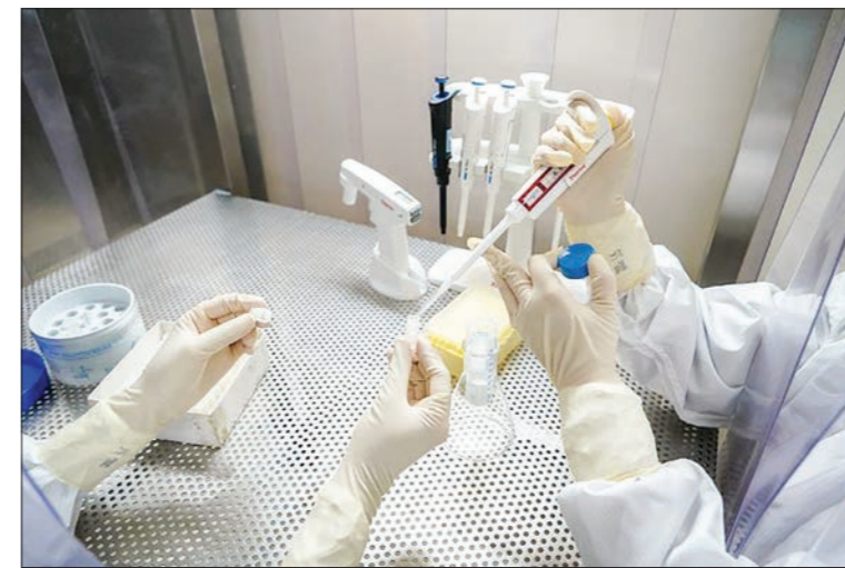
The Directorate General of Health Services has issued a regulation concerning the prices for RT-PCR tests which have been effective from 17 August.

"In addition to lowering the price of the RT-PCR test to 495,000 rupiahs, we also reduced the price of antigen swab to 85,000 rupiahs