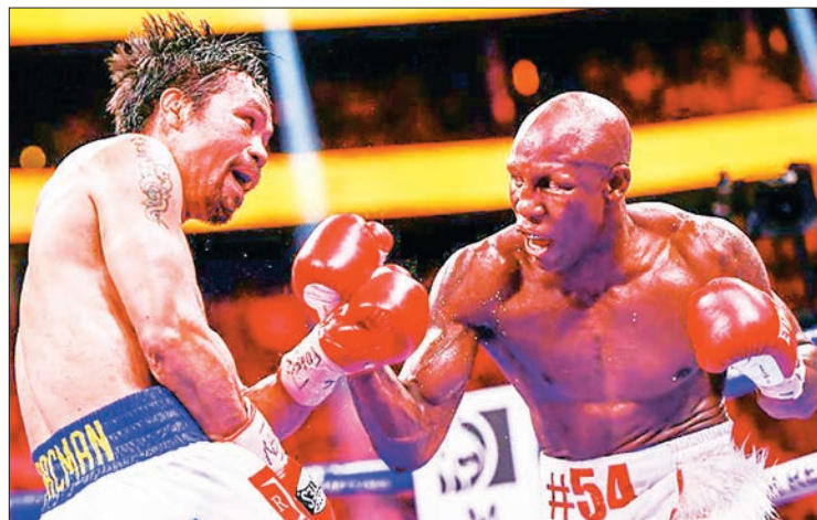
Filipino boxer Manny Pacquiao (left) trades blows with Cuba's Yordenis Ugas during the WBA welterweight title fight in Las Vegas.

CUBA'S Yordenis Ugas sent Manny Pacquiao spinning to a dramatic upset defeat on Saturday, outclassing the Filipino boxing icon with a composed unanimous points victory at the T-Mobile Arena.