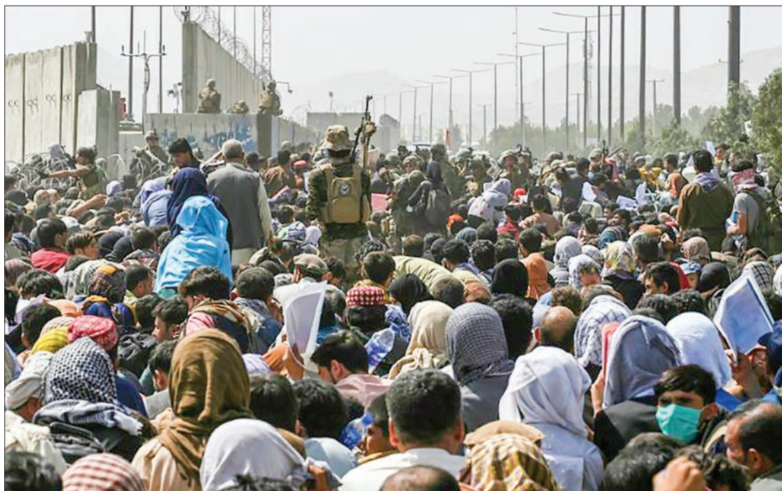
Afghans mass near the airport in Kabul hoping to get in and catch an evacuation flight out of the country.

A journalist aboard the convoy that left a downtown hotel early Sunday told AFP a huge crowd was camped at an intersection close to the airport — many sleeping in the open.