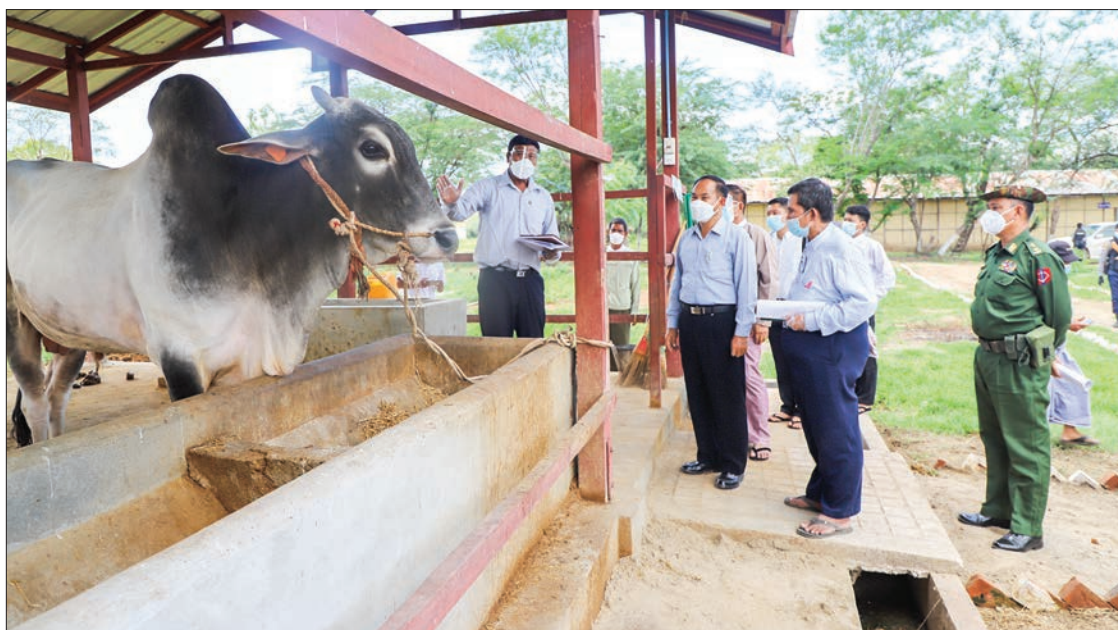
Sagaing Region Chief Minister U Myat Kyaw inspects cow breeding farm in Htihsaung village of Myinmu Township.

The Chief Minister and party also viewed round broadcasting of fertilizers in the model plot in Pyawt Village, and proceeded to the local breeding and animal feed development research farm in Htihsaung Village, Myinmu Township. In the farm, a total of 159 cows are being raised and