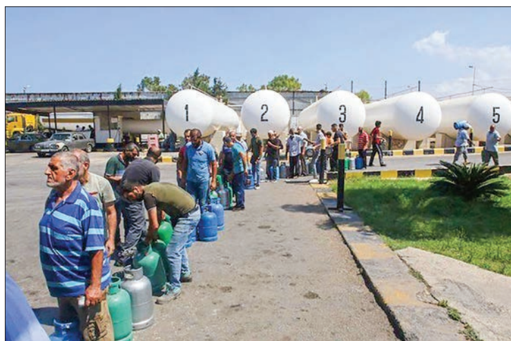
Lebanese wait to fill their gas cylinders in the southern city of Sidon amidst a deepening economic crisis, on 10 August 2021.

Lebanon’s currency, the Lebanese pound, remains officially pegged at 1,507 to the dollar, but it has lost more than 90 percent of its value on the black market. — AFP ■