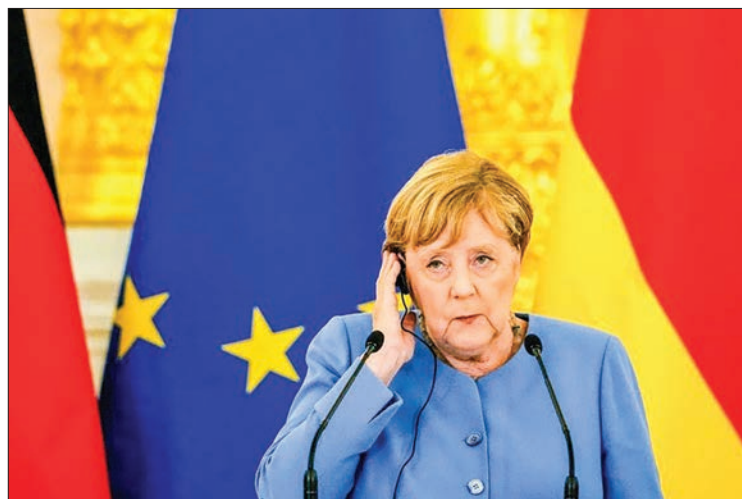
German Chancellor Angela Merkel will visit Ukraine ahead of her departure from office next month.

But she has also been unwavering in pushing across the finish line a controversial Russian gas pipeline to Europe despite fierce opposition from Ukraine, the United States and several European countries. "You can call it a pragmatic approach," Zelensky said this week in an interview with several media outlets, adding that Merkel was conducting a "very delicate balancing act".