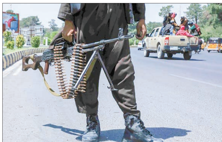
The Taliban's senior leaders are gathering for talks on forming a new government after taking over Afghanistan.

Haibatullah Akhundzada was appointed leader of the Taliban in a swift power transition after a US drone strike killed his predecessor, Mullah Mansour Akhtar,