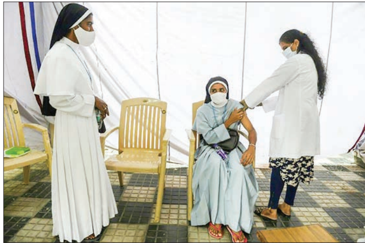
An Indian health worker inoculates a catholic nun with the Covishield vaccine—one of six approved by New Delhi against Covid-19—at Saint Mary's Basilica in Secunderabad, the twin city of Hyderabad, on 19 August 2021.

"This three-dose vaccine — when injected produces the spike protein of the SARS-CoV-2 virus and elicits an immune response," the biotechnology department, which partnered with Zydus Cadila, said in a statement. "The plug-and-play technology on which the plasmid DNA platform is based can be easily adapted to deal with mutations in the virus, such as those already occurring," it added. ZyCoV-D is now the sixth vaccine to be approved by New Delhi after Moderna, Oxford-AstraZeneca's Covishield, Covaxin — which was developed by Indian firm Bharat Biotech, Russia's Sputnik V, and Johnson and Johnson.— AFP ■