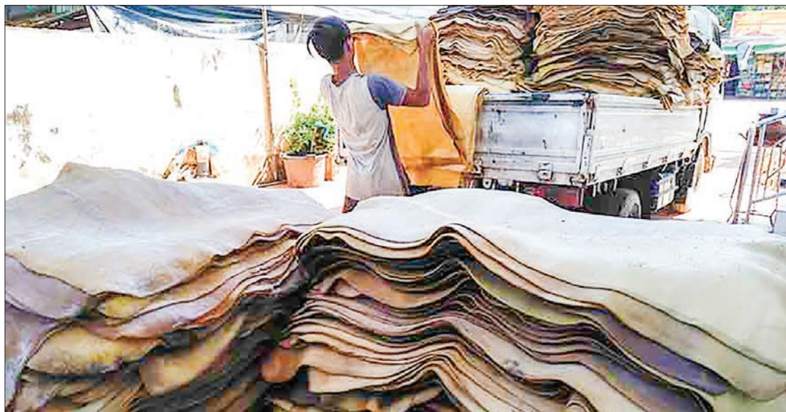
A worker is loading ribbed smoked sheet rubber onto truck.

About 150,000 tons of rubber was exported in the 2017-2018 fiscal year. Myanmar shipped over 190,000 tonnes of rubber, with an estimated value of $250 million, to external markets in the 2018-2019 fiscal year, an increase of 41,000 tons which helped boost earnings by $60 million compared to the year-ago period, according to data released by the Ministry of Commerce. Myanmar exported over 200,000 tonnes of natural rubber to foreign countries last FY 2019-2020, generating income of over $200 million.—GNLM