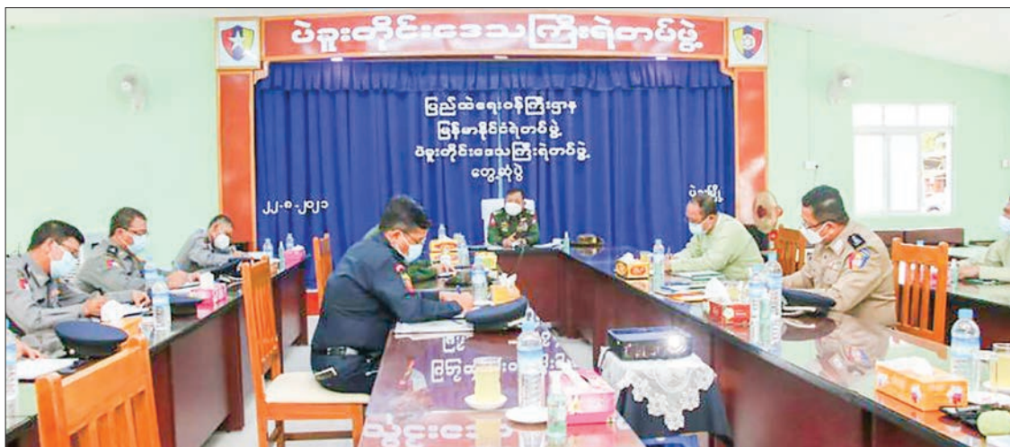
Union Minister for Home Affairs Lt-Gen Soe Htut meets departmental officials at Bago Region Police Force office.

The Union Minister then met the officials of relevant