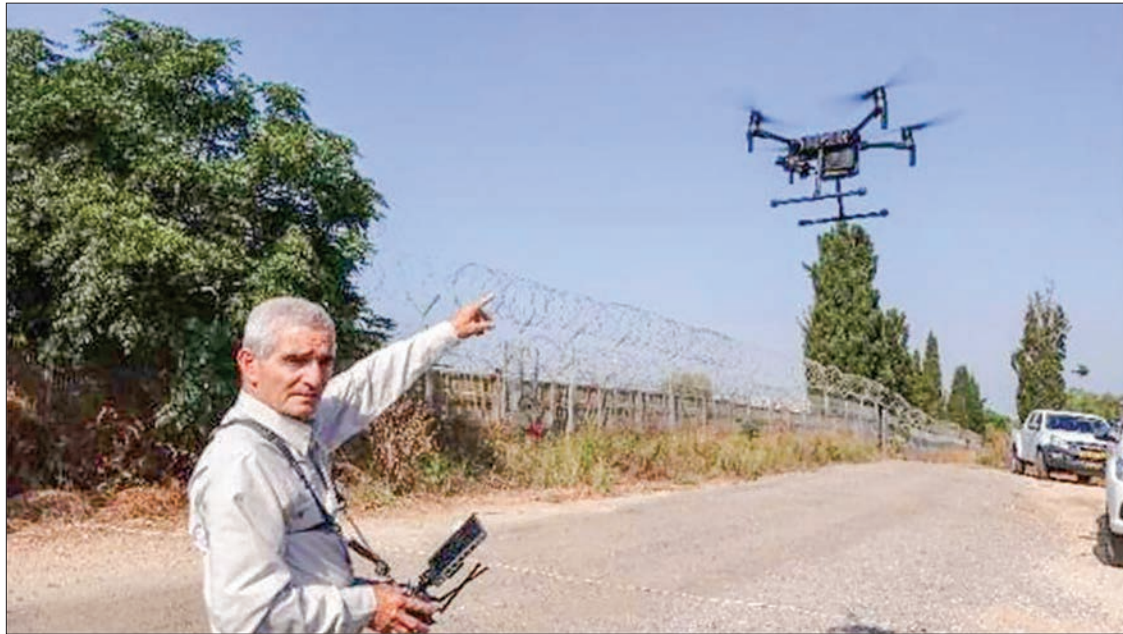
Israel's Ministry of Environmental Protection is expanding its use of drones to fight more effectively against environmental offenders.

As the main enforcement and deterrence arm of the min-