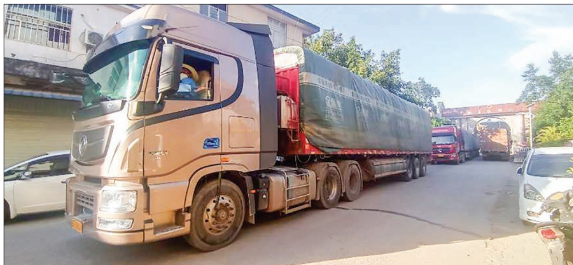
A Cargo truck loaded unit medicines and medical equipment is ready to start trip from Chinshwehaw.

The medical equipments are imported by linking with cross-border posts in accordance with the regulations of the related ministries.