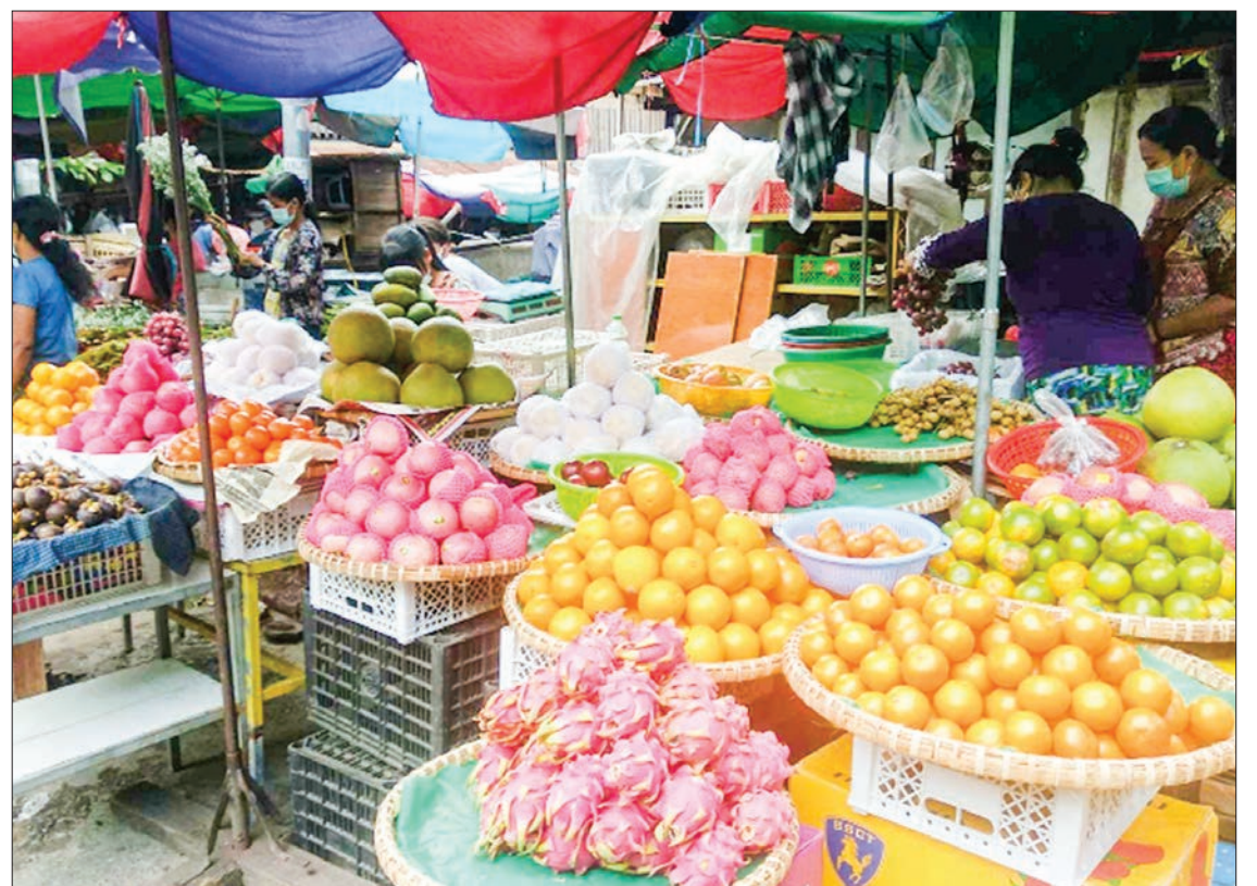
Vegetables and fruits are being sold at the domestic market.

Depending on the size of the fruits, the prices stand at K100-K200 each for custard-apple, K600-K800 for apple, K 1,200 for pomegranate, K800 for sunkist fruit, K400 for avocado, K1,000-K1,200 for pear, K400-K500 for pineapple, K2,500 for pomelo of Thailand origin, K1,000 for pomelo of Myanmar origin, K500 for tangerine and K500 for passion fruit respectively.—Min Htet Aung (Mandalay sub-printing house)/GNLM