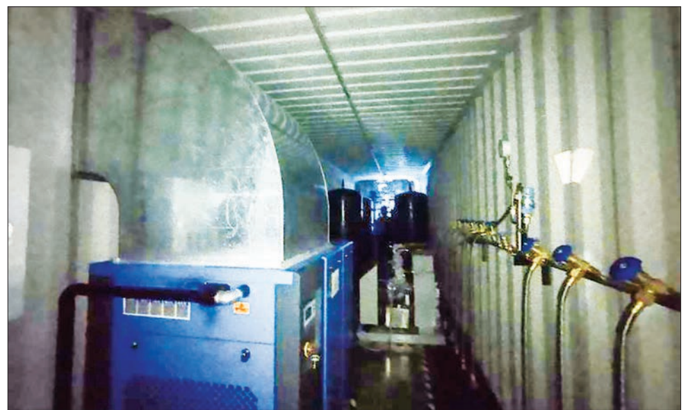
Cylinders are refilled with oxygen at the plant.