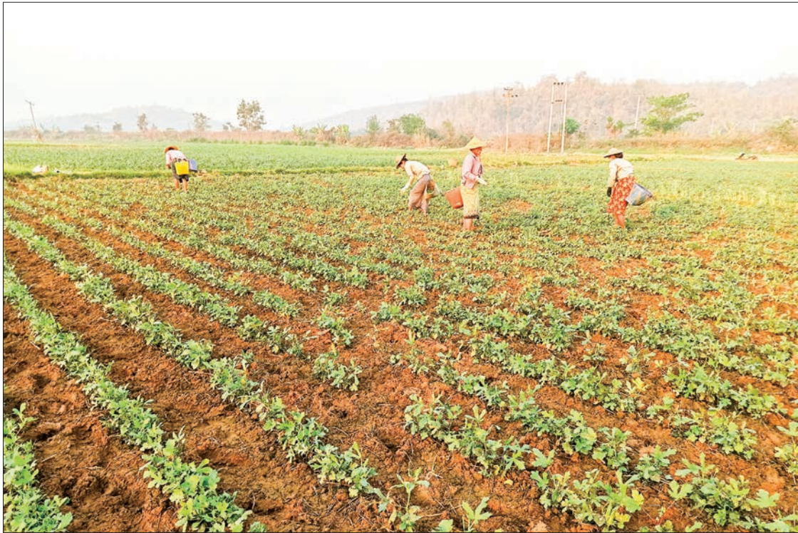
Farming workers are nurturing saplings of crops.

In the exports sector, the agriculture industry performed the best, accounting for 35 per cent of overall exports. The chief items of export in the agricultural sector are rice and broken rice, pulses and beans and maize. Fruits and vegetables, sesame, dried tea leaves, sugar, and other