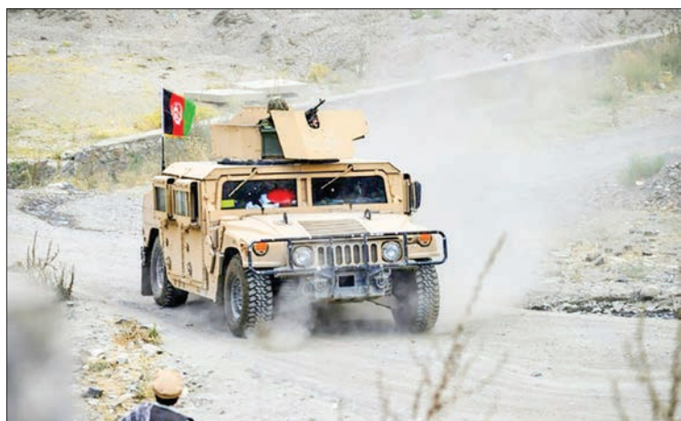
The National Resistance Front says Panjshir become a safe zone for all those groups who feel threatened in other provinces.

But Nazary said the group is also prepared for conflict, and if the Taliban do not negotiate they will face resistance across the country. — AFP ■