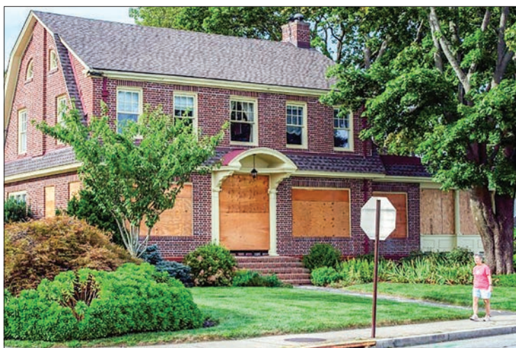
Homes were boarded up in Connecticut as Hurricane Henri steams towards the US east coast.

Nasty weather that preceded Henri forced New York City to halt its star-studded Central Park concert that was billed as a "homecoming" for a metropolis hard hit by the pandemic.