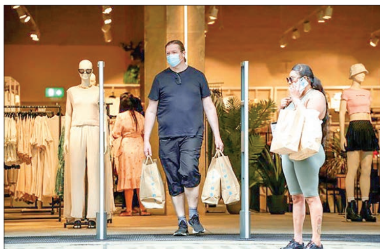
Analysts say inflation in Britain will likely rise again this year.

BRITAIN'S annual inflation rate slowed sharply last month as clothing retailers slashed prices in the pandemic-hit sector, official data showed Wednesday, but economists warned it will likely rise again. The Consumer Prices Index stood at 2.0 per cent in July, the Office for National Statistics said in a statement.