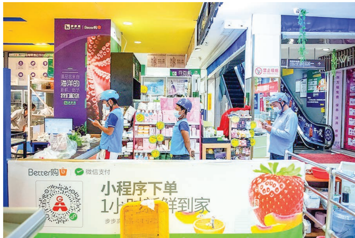
Deliverymen wait to collect customer orders at a supermarket in Yongding District in Zhangjiajie, central China's Hunan Province, Aug. 5, 2021.

the current Delta variant is highly contagious, its overall impact on China's economy may be more limited, because China is now experienced in containing the spread of the virus and can better coordinate control measures and economic development.