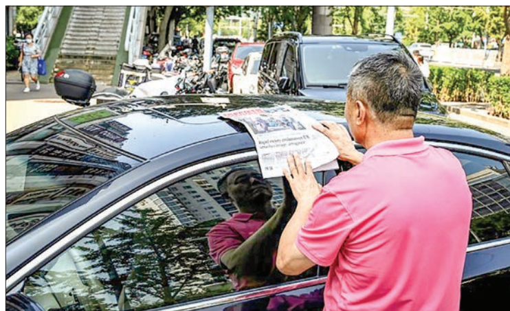
Chinese state-run media branded the Taliban's victory as an indicator of the US' failure in Afghanistan.

CHINA'S overtures to the Taliban indicate a bid to extract maxi-