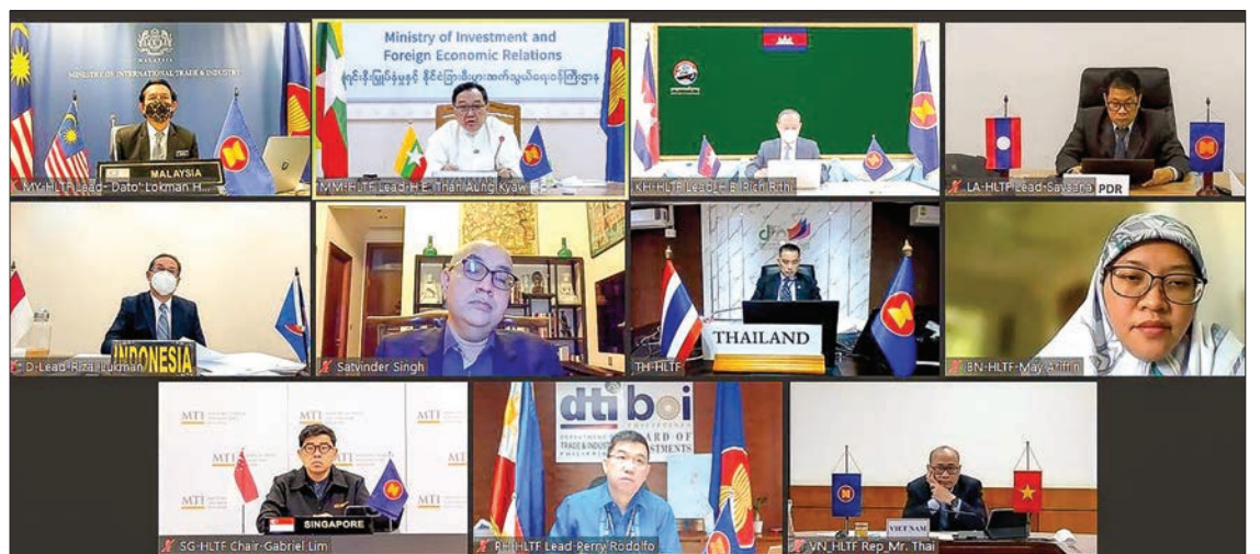
Deputy Minister U Than Aung Kyaw participates in Fortieth Meeting of High-Level Task Force on ASEAN Economic Integration via video conference.

The Deputy Minister informed the meeting about the COVID-19 pandemic prevention and control measures particularly for government's efforts to speed up vaccination, private sector cooperation in national vaccine programme, and the measures to facilitate the cross border import of COVID-19 related medicine and