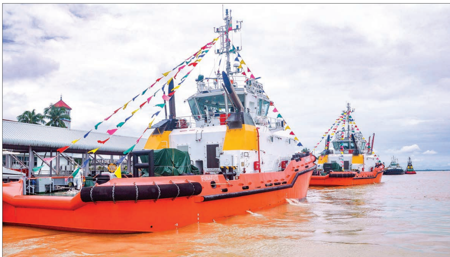
Newly-arrived tugboats Sin Min-1 and Sin Min-2 are seen at Nanthida Jetty in Yangon.

According to the terms of the contract, the two vessels were designed by Singapore-based Sea Tech Solutions International Pte., Ltd and constructed by Shunhai Shipyards Ltd. of Guangzhou Province.