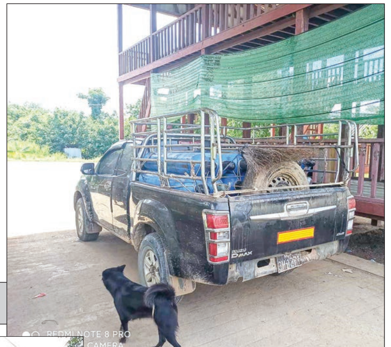
A vehicle carries oxygen cylinders.

Of 89 vehicles carrying liquid oxygen imported between 1 July and 18 August, 67 of them were distributed to Yangon, 15 to Mandalay, two to Bago, four to Mawlamyine and one to Thaton,