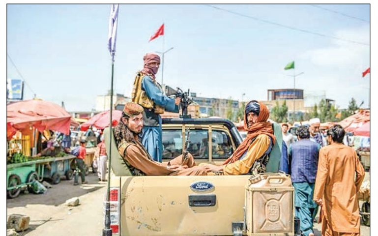
Taliban fighters patrol a market in Kabul.

Saleh and Massoud's son, who commands a militia force, appear to be putting together the