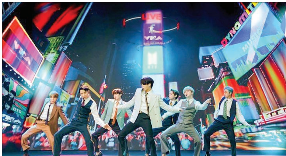
South Korean boy band BTS perform during the 2020 MTV Video Music Awards.

His wages were around 38 million won, but Kang also earned 39.9 billion won from stock options and 111 million won in incentives, according to