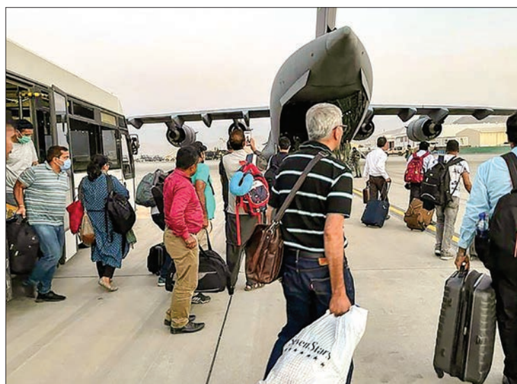
Indian nationals prepare to board an Indian military aircraft to be evacuated after the Taliban takeover of Afghanistan.