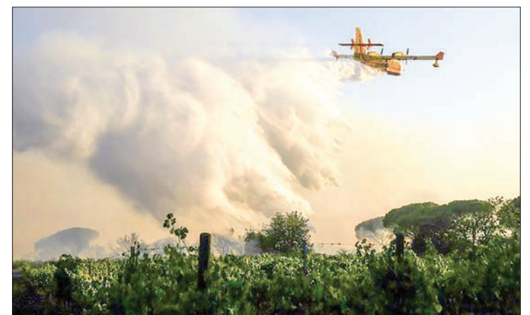
Water-dropping planes and helicopters were used to control the flames.

"We started smelling the smoke around 7:00 pm, then we saw the flames on the hill," said Cindy Thinesse, who fled a campsite near Cavalaire on Monday evening.—AFP ■