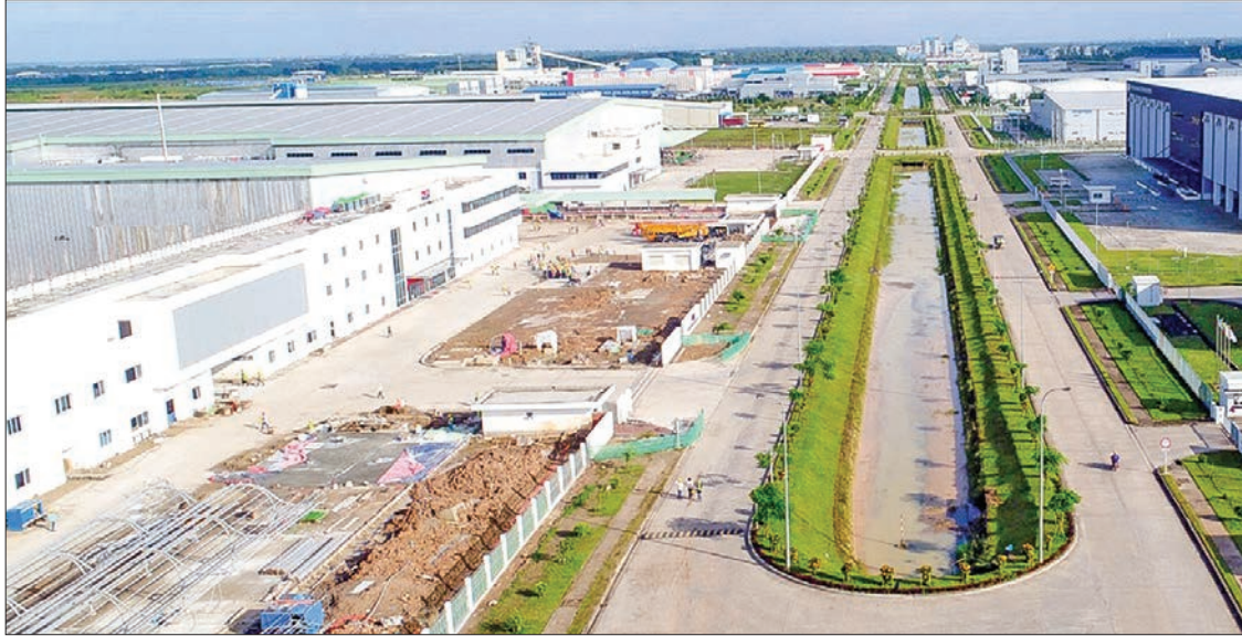
Buildings of industries are mushrooming in Thilawa special Economic Zone in Yangon Region.

In May, the UK-listed enterprise brought in large investments of $2.5 million and became