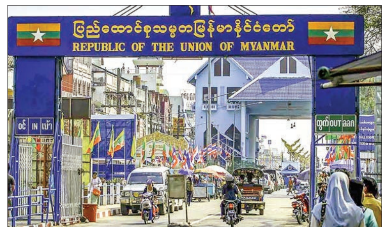
Border gate between Myanmar and Thailand is crowded with vehicles and walkers.

The bilateral trade between Myanmar and Thailand stood at $ 3.26 billion in FY 2020-2021 (as of July), $ 5.1 billion in FY 2019-2020, $ 5.5 billion in FY 2018-2019, $ 2.9 billion in mini-budget year of