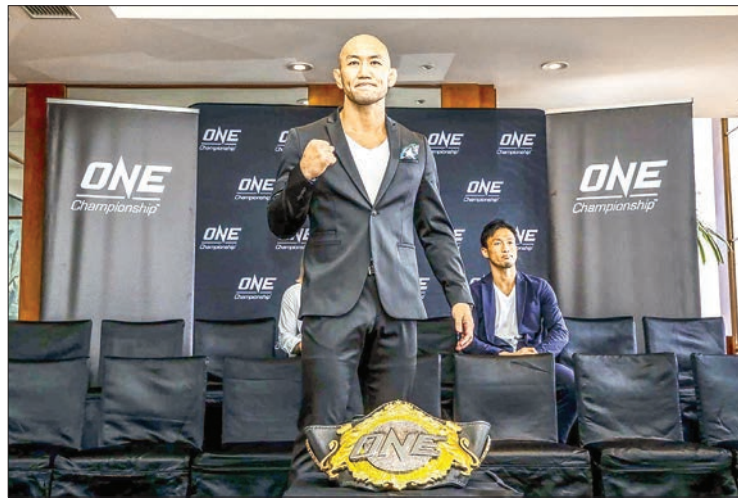
Japanese Mixed Martial Arts legend Yushin Okami.

And after Aung La N Sang’s victory on 30 July, Okami doubled down on the challenge.