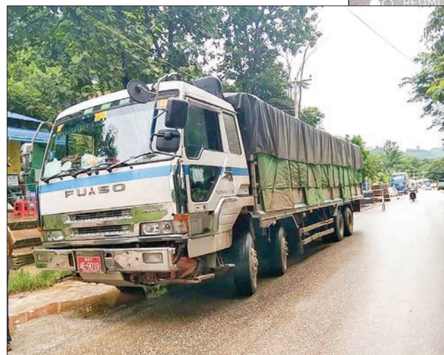
Cargo truck conveys full of medical supplies for the people.

respectively. Among 40 oxygen plants, 11 were transported to Yangon, five to Lashio, four to Bago, two to Pakokku, four to Mandalay, two to Hpa-an, two to Mawlamyine, three to Kyaukpadaung, two to Hpa-an, one each to Taunggyi, Thanbyuzayat, Magway, Dawei, Wakema, Myittha and Mogaung respectively.