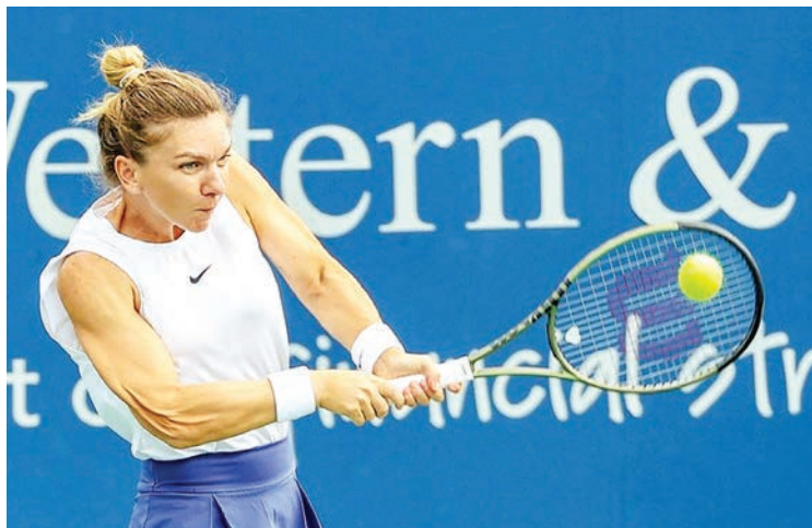
Simona Halep of Romania plays a backhand during her match against Magda Linette of Poland during the WTA/ATP Cincinnati tournament in Ohio.

“This was the first time in my life that I’ve had this kind of problem, and I didn’t really know how to manage it. But I’m happy to be back, happy to play pain-free. I’m just trying to build my confidence back.” —AFP ■