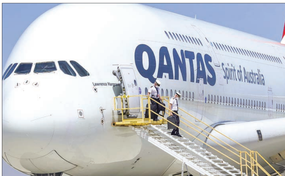
Australian airline Qantas said Wednesday it would make Covid-19 vaccines mandatory for staff, as the company bids to get planes back into the skies.

Qantas' new rule comes after Australia's conservative government said it would not make vaccines mandatory but would leave businesses to implement their own policies. The airline said a staff survey found 89 percent were willing to be vaccinated or already had been, while 4 percent were unwilling or unable. — AFP ■