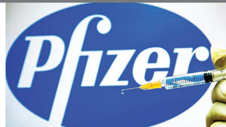
Pfizer Inc is an American multinational pharmaceutical and biotechnology corporation headquartered on 42nd Street in Manhattan, New York City.