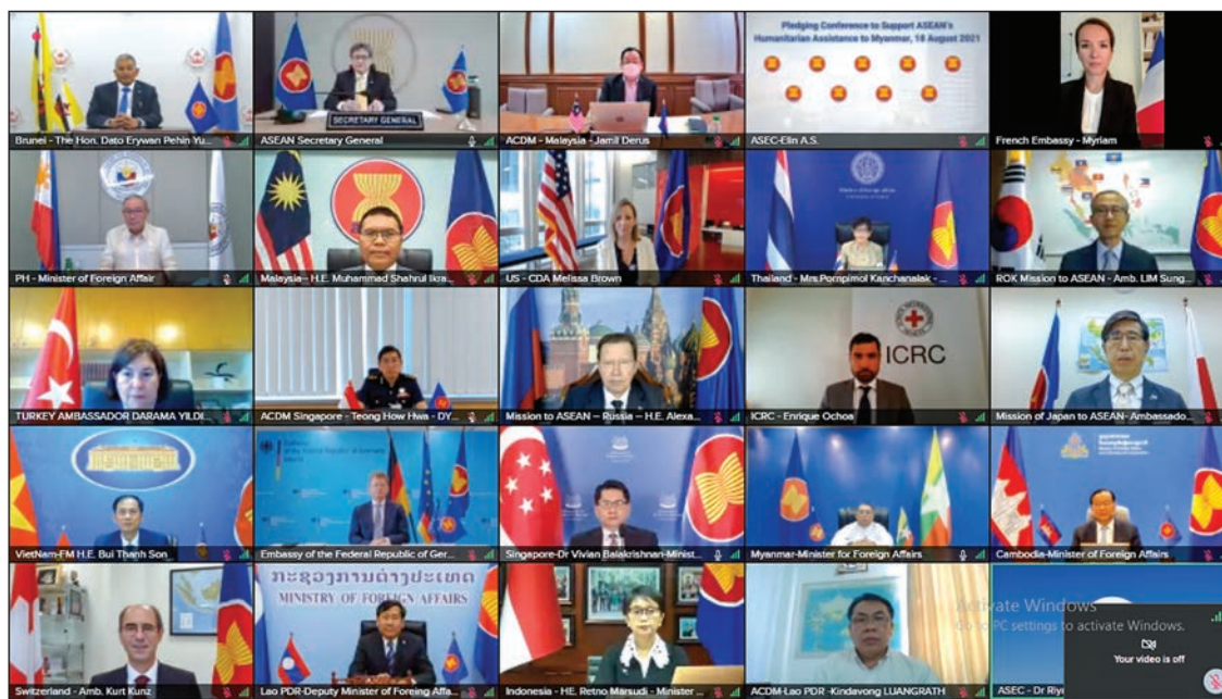
Union Minister for Foreign Affairs U Wunna Maung Lwin joins pledging conference to support ASEAN's humanitarian assistance to Myanmar via video conference.

The Secretary-General of ASEAN explained about the provision of ASEAN's Humanitarian assistance to Myanmar which will be delivered through the ASEAN Co-