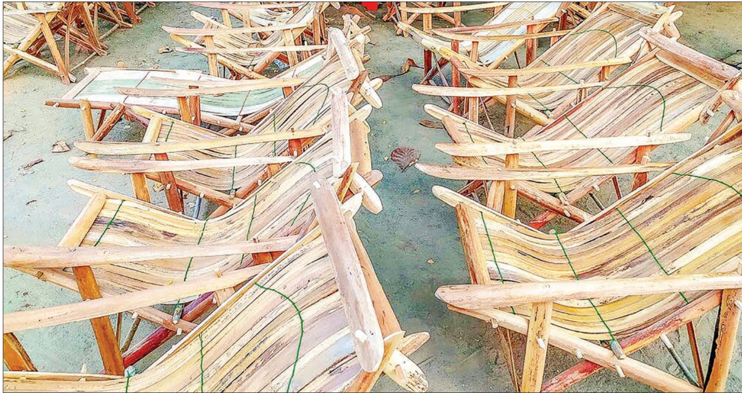
Traditional chairs made of toddy-palm are displayed at the wholesale centre to attract local and foreign travellers.

T HE Indawkyay village in Kyaukpadaung Township is engaged in toddy-palm chair making business and the local people are manufacturing a lot of toddy-palm