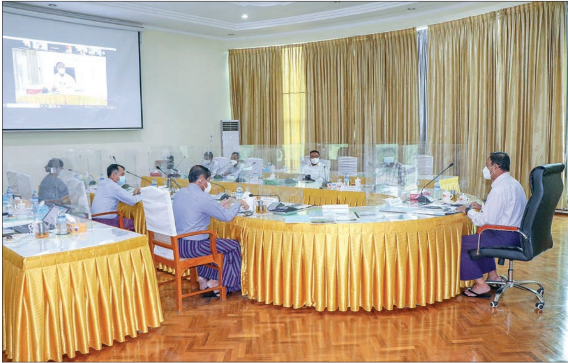
Union Minister U Hla Moe discusses plans to supply drinking water to rural area.

EFFORTS are being made to enable the rural people to have better water in villages in accordance with the sustainable management of water and sanitation for all by 2030, said Union Minister for Cooperatives and Rural Development U Hla Moe yesterday.