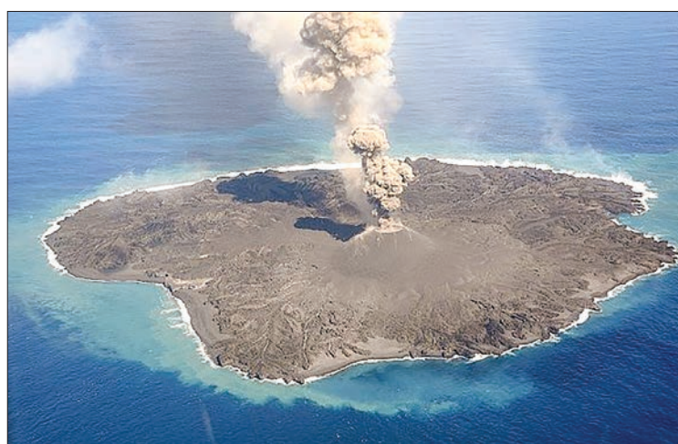
Photo shows eruption at a submarine volcano near Iwoto Island, located around 1,200 kilometers south of Tokyo on Aug. 15, 2021.

Such a battle would be the latest in Saleh's long struggle against the Taliban as a onetime insurgent turned spy chief and later vice premier.—AFP ■