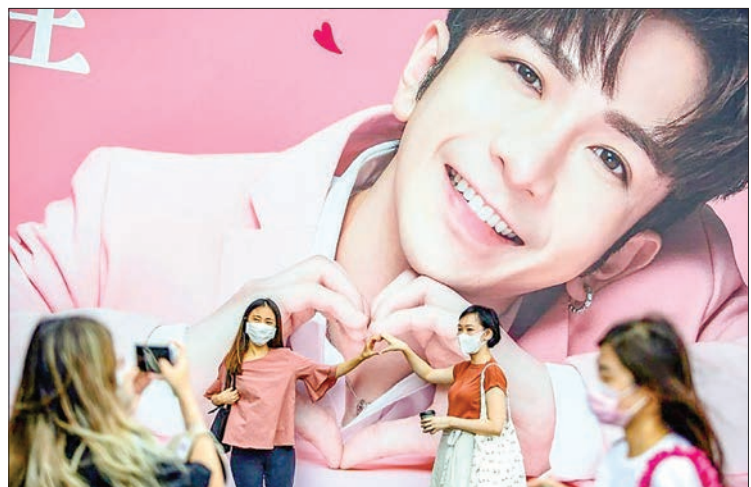
The occasion is an appearance by Edan Lui, one of the 12 members of local band Mirror who have taken Hong Kong by storm, who has arrived to promote an animated kids' movie screening in local theatres.

IN the middle of a Hong Kong shopping mall, hundreds of people are excitedly screaming and