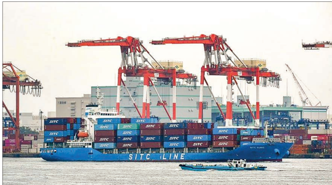
Japan's economic recovery is likely to remain sluggish in the July-September period, as the resurgence in domestic coronavirus infections is expected to lead to parts of the country remaining under a state of emergency for the next few months, analysts say.

JAPAN'S economic recovery is likely to remain sluggish in the July-September period, as the resurgence in domestic coronavirus infections is expected to lead to parts of the country remaining under a state of emergency for the next few months, analysts say. Some analysts say the econ-