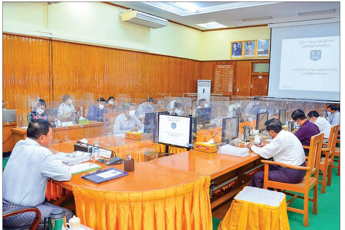
Union Minister U Aung Than Oo meets officials to discuss electrification plans and mitigation of power outage.

Officials from respective departments discussed the power outage at substations, the situation of power outage in each transformer in each township and measures to be taken to prevent it.