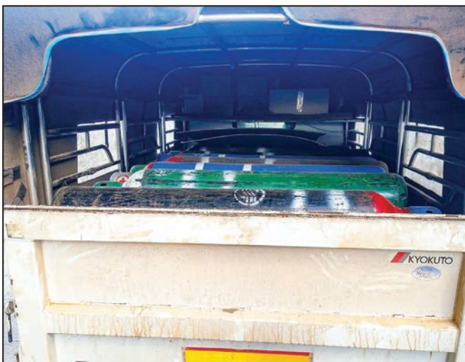
A truck with oxygen containers is ready to start trip.