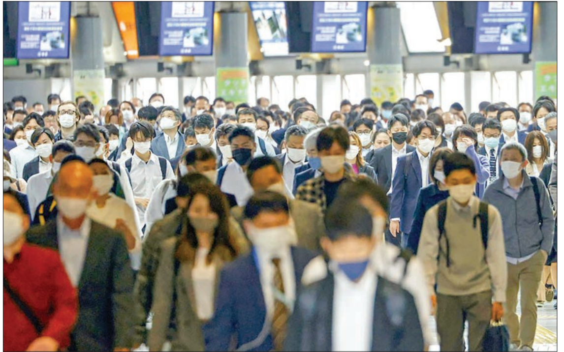
Prime Minister Yoshihide Suga asked Japan's largest business lobby Wednesday to help reduce the number of commuters through telework as the increasingly rampant novel coronavirus puts a strain on the country's medical system.

The treatment, in which COVID-19 patients are adminis-