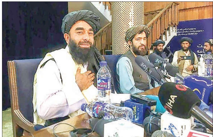
The Taliban are pledging to rule differently from their last stint from 1996-2001.

THE Taliban have offered a pledge of reconciliation, vowing no revenge against opponents and to respect women's rights in a "different" rule of Afghanistan from two decades ago.