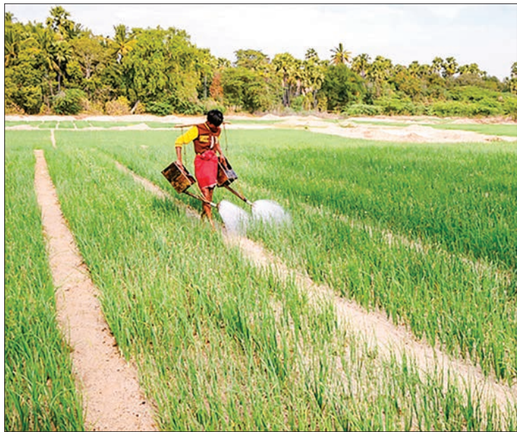
Farmer is showering thriving garlic plantation.

THE price of garlic (Kyukok variety) imported by China is on the rise tracking the shutdown of the border post between Myanmar and China, Mawlamyine commodity depot stated.