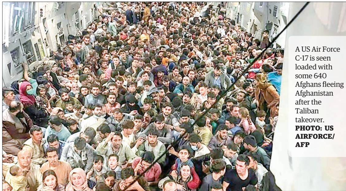
A US Air Force C-17 is seen loaded with some 640 Afghans fleeing Afghanistan after the Taliban takeover.

sands of US soldiers were at the airport as the Pentagon planned to ramp up flights of its huge C-17 transport jets to as many as two dozen a day. "Now that we have established the flow, we expect those numbers to escalate," said the White House official who gave the updated evacuation figures Tuesday and who spoke on condition of anonymity.—AFP ■