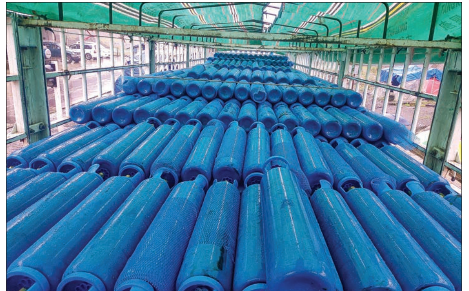
Cargo trucks are seen with loads of essential medical equipment and oxygen cylinders.

T HE Ministry of Commerce is working hard to ensure people have access to essential medical supplies which are critical to the COVID-19 prevention, control and treatment activities, including liquid oxygen and oxygen cylinders, arranging the continuous importation on public holidays.