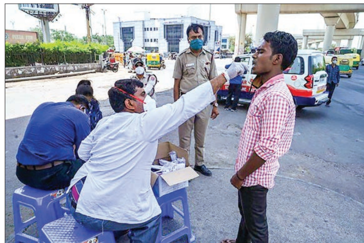
Last week, India's federal health ministry approved the allocation of over 971 million U.S. dollars -- 50 per cent of the federal government's share in the emergency response package announced in July -- to states to prepare for the possible COVID-19 third wave.

India's health officials have urged people to wear face masks, wash hands and maintain social distancing, and people embarking on "revenge travel" have been strongly criticized. —Xinhua ■