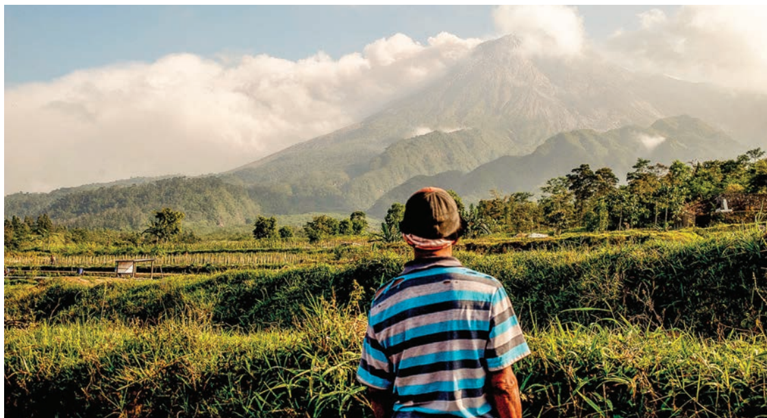
A villager watches as Mount Merapi, Indonesia's most active volcano, spews ash and smoke 3,500 meters from its peak as seen from Sleman in Yogyakarta on 16 August 2021.

"Residents should avoid volcanic ash and they've been warned about potential lava flows in the area surrounding