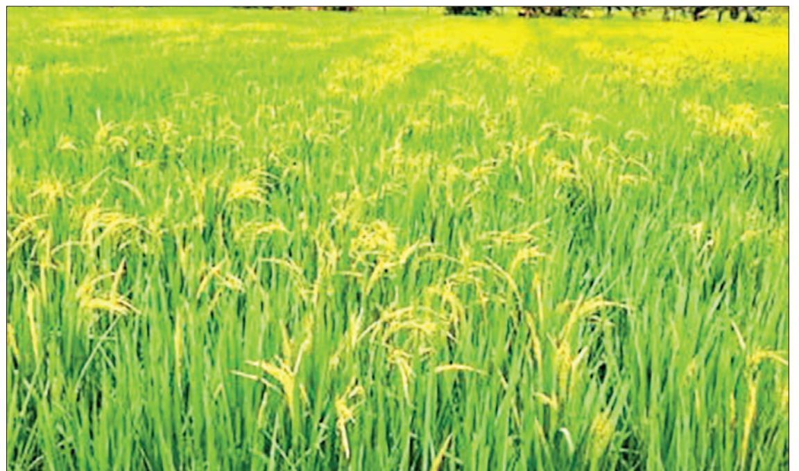
Thriving paddy plants bear ears of paddy.

In 2021-2022 FY, the local farmers from ChaungU Township targeted to cultivate over 102,000 acres of monsoon paddy crops including paddy, edible oil, variety of nutritious pulses, bamboo, kitchen crops and other crops. Those monsoon crops are started cultivating in May, 2021. As of today, over 100,000 acres of monsoon crops have been cultivated, according to the ChaungU Township Agriculture Department.—Lulay/GNLM