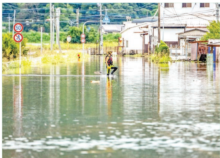
A fire service department officer wades through a flooded area in Takeo City, Saga Prefecture on 15 August 2021.

HEAVY rain continued to pelt vast areas of Japan on Monday as mudslides had killed at least four people and left five others missing, with the country's weather agency urging the public to remain vigilant as the threat of more disasters remains.