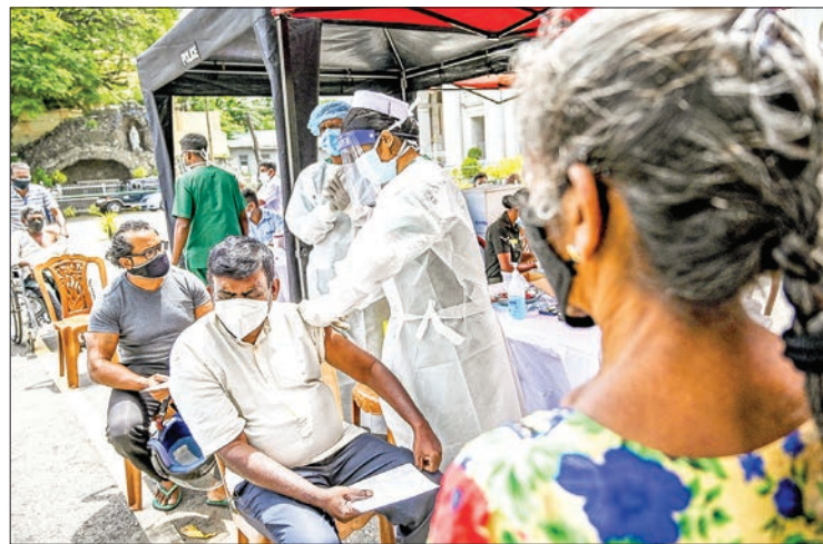
Police health officials inoculate people with a dose of the Sinopharm vaccine against the Covid-19 coronavirus at a vaccination camp held in Colombo on 14 August 2021.

Wedding and parties have been banned from Tuesday, while state ceremonies and public gatherings are also prohibited until 1 September. — AFP ■