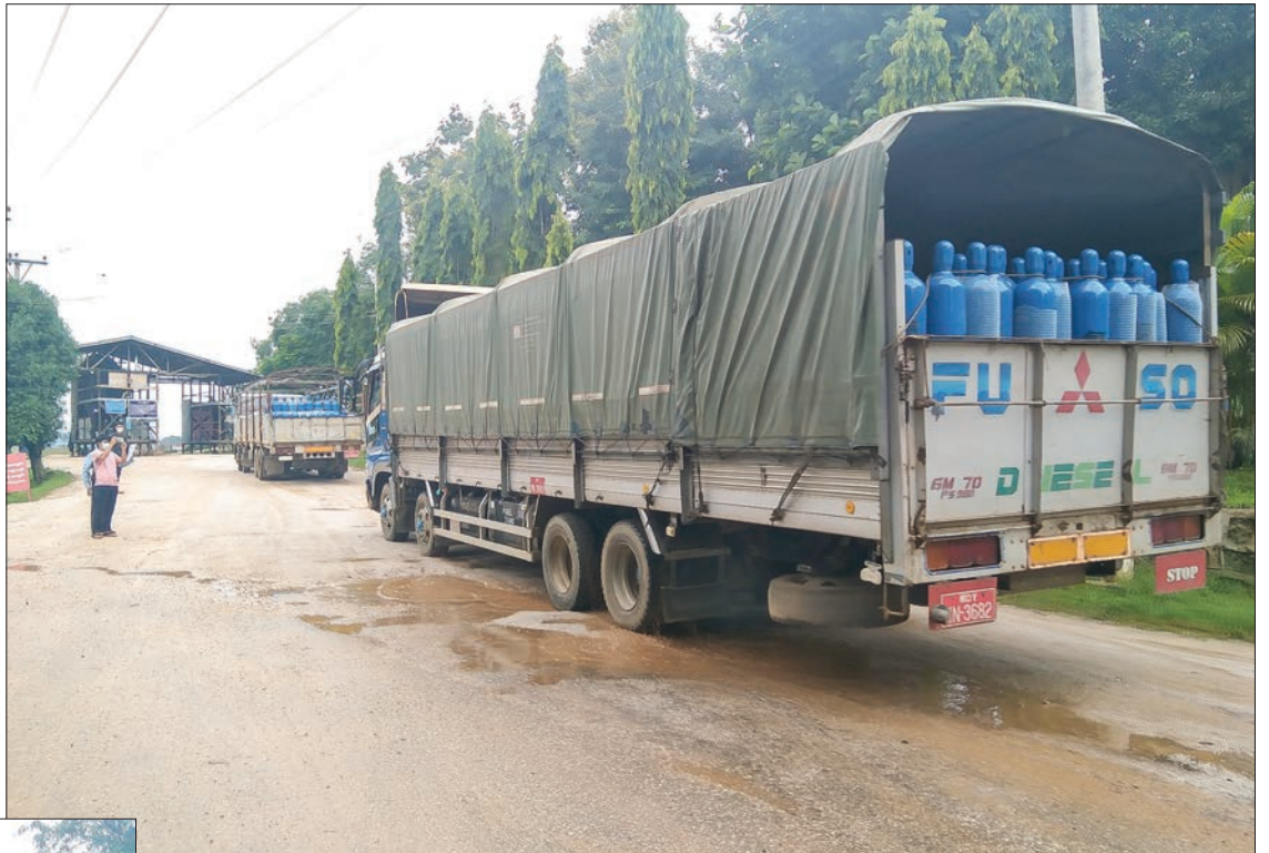
Cargo trucks convey oxygen cylinder and medical supplies through Muse border point.

Of 79 liquid oxygen bowsers imported between 1 July and 16 August, 61 of them drove to Yangon, 11 to Mandalay, two to Bago, four to Mawlamyine and one to Thaton respectively. Among 30 oxygen plants, four were transported to Yangon, five to Lashio,