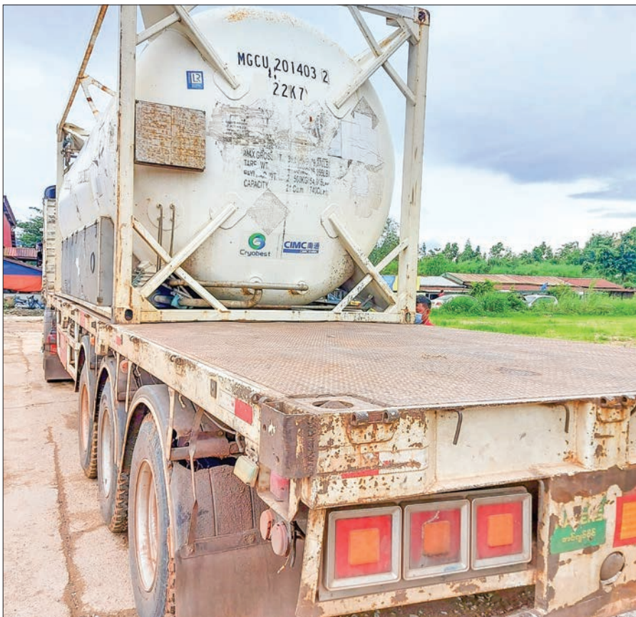
Heavy trucks carry medical equipment imported through Myawady border point.