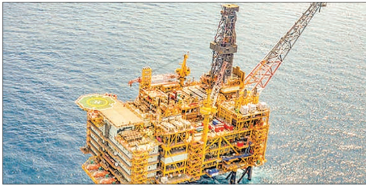
An oil and natural gas exploration platform is seen in the sea to produce oil and natural gas.

MYANMAR'S exports of natural gas in the past eight months (Oct-May) of the current financial year 2020-2021 exceeded US$2.025 billion, the Commerce Ministry's data showed.