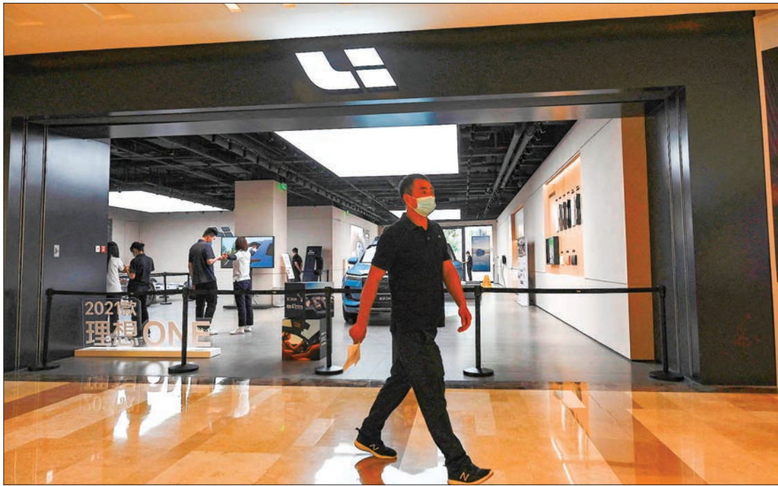
A man walks past a retail store of Chinese electric car Li Auto at a shopping mall in Beijing on 12 August 2021.