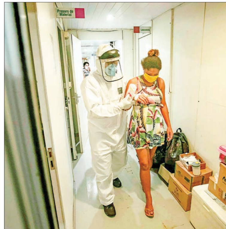
Healthcare worker assists a pregnant woman in a hospital in Santarem, Brazil.

Having comorbidities along with COVID-19 infection increased the risk of preterm birth. Individuals with hypertension, diabetes and/or obesity as well as a COVID-19 diagnosis had a 160 per cent higher risk of very preterm birth and a 100 per cent higher risk of preterm