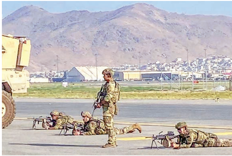
US soldiers take up their positions as they secure the airport in Kabul on 16 August 2021, after a stunningly swift end to Afghanistan's 20-year war, as thousands of people mobbed the city's airport trying to flee the group's feared hardline brand of Islamist rule.

THE Taliban were in control of Afghanistan on Monday after President Ashraf Ghani fled the country and conceded the insurgents had won the 20-year war.