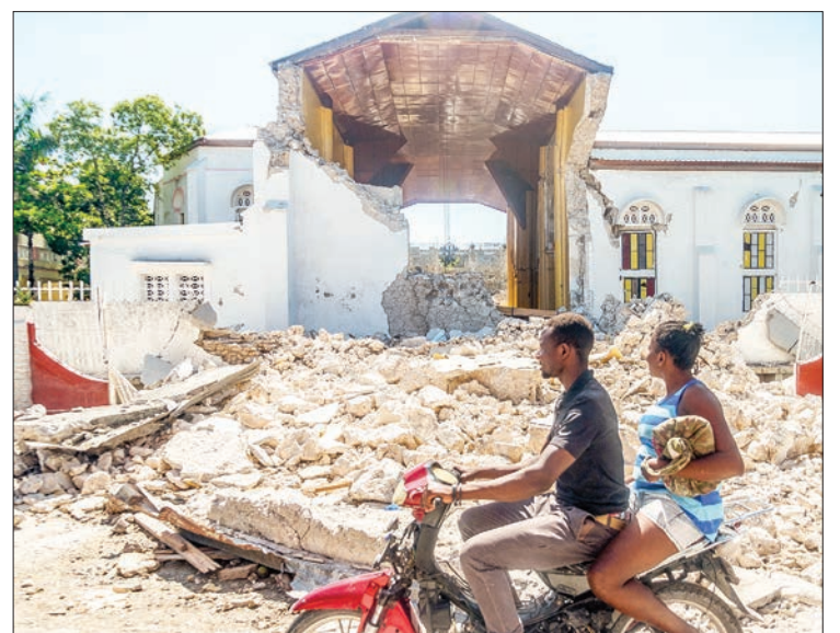
People drive past the remains of the "Sacré coeur des Cayes" church in Les Cayes on 15 August 2021, after a 7.2-magnitude earthquake struck the southwest peninsula of the country.

destroyed and more than 13,700 damaged, trapping hundreds under rubble and leaving more