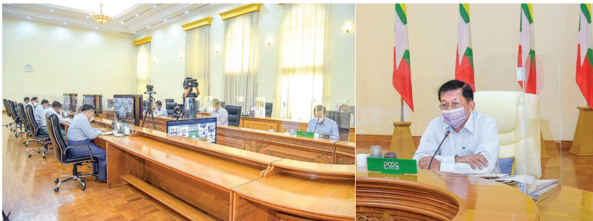
Chairman of the State Administration Council Prime Minister of the Provisional Government of the Republic of the Union of Myanmar Senior General Min Aung Hlaing delivers address at the 8 th coordination meeting for prevention, control and treatment of COVID-19.

P Riority must be given to health staff who were infected by COVID-19 discharging duty on frontline in giving treatments to confirmed patients at hospitals and centres by looking after them as a special matter, said Chairman of