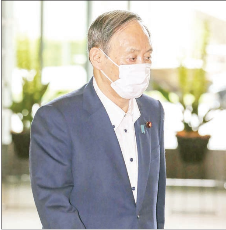
Japanese Prime Minister Yoshihide Suga enters his office in Tokyo on 16 August 2021.