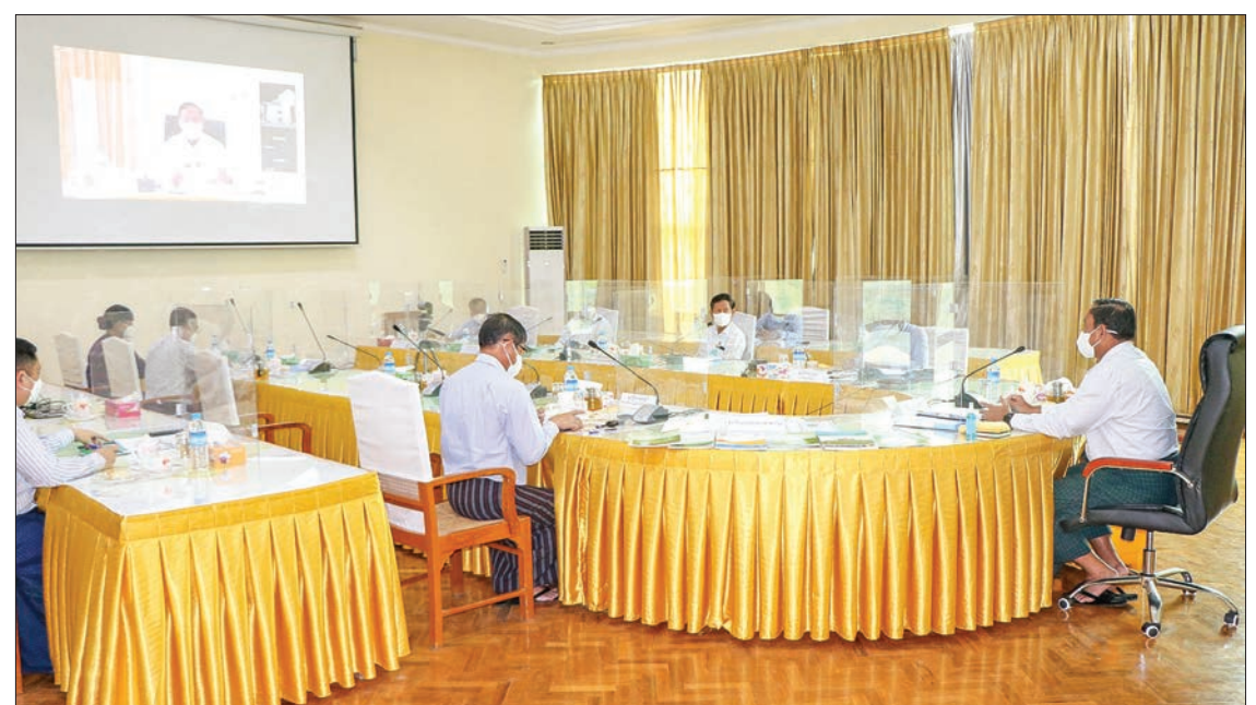
Union Minister for CRD U Hla Moe highlights implementation of Mya Sein Yaung village project.

At present, the project has received 188.84 billion kyats