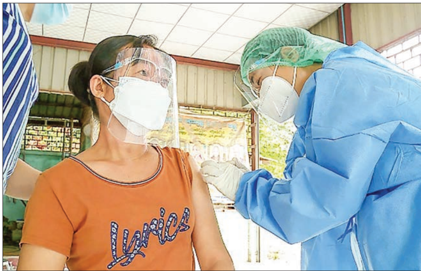
A health staff injects anti-COVID-19 vaccine into a local.

THE factory workers in Aungmyethazan Township of Mandalay Region received COVID-19 vaccines yesterday.