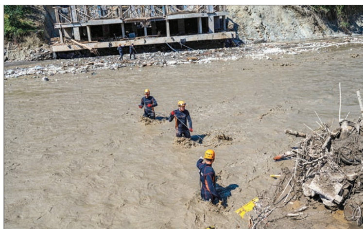
A rescue worker walks through the mud and debris after flash floods destroyed parts of the town of Bozkurt in the district of Kastamonu, in the Black Sea region of Turkey on 15 August 2021.

SEVENTY people died and 47 are still missing in Turkey after flash floods hit Black Sea regions last week, officials said on Monday.