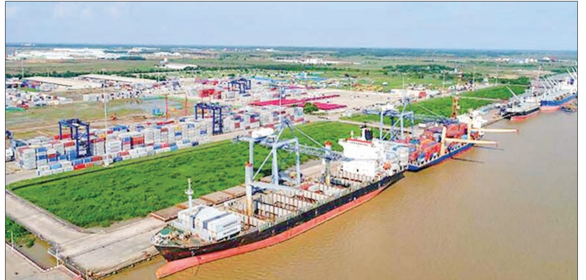
Myanmar International Terminal Thilawa (MITT).

Of 45 foreign enterprises permitted and endorsed by MIC