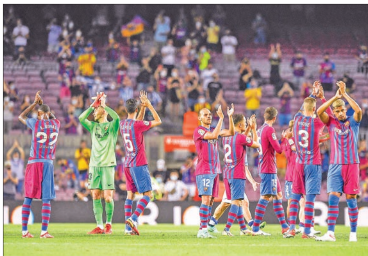
Barcelona's players celebrate during the Spanish League football match between Barcelona and Real Sociedad at the Camp Nou stadium in Barcelona on August 15, 2021.

BARCELONA started life without Lionel Messi by defeating Real Sociedad 4-2 in their La Liga opener at the Camp Nou on Sunday even if fans admitted it felt like "a leap into the unknown". Captain Gerard Pique gave them a 19th minute lead with his 50th goal for the club.