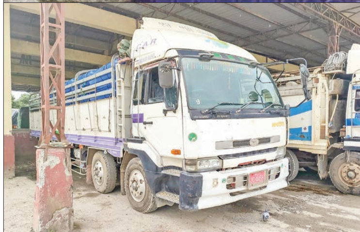
Cargo trucks carrying essential medical supplies are seen at Chinshwehaw border point.

four to Bago, two to Pakokku, three to Mandalay, two to Hpa-an, two to Mawlamyine, one each to Taunggyi, Thanbyuzayat, Magway, Dawei, Wakema, Myittha, Kyaukpadaung and Mogaung respectively.