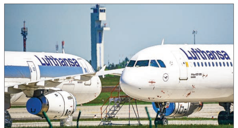
Parked aircraft operated by German airline Lufthansa are pictured at Berlin Brandenburg BER airport Willy-Brandt in Schoenefeld near Berlin on 31 May 2021.

Lufthansa halved its losses in the second quarter of 2021 compared to a year ago, as travel restrictions eased over the coronavirus pandemic and passengers returned.