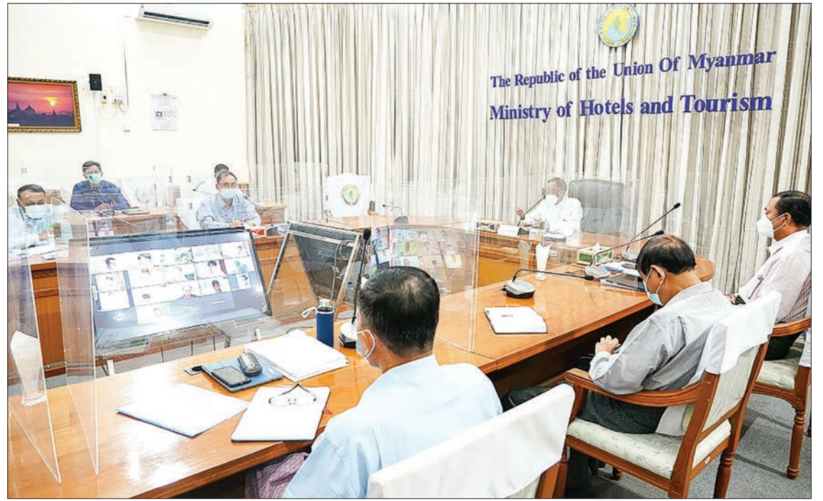
The Ministry of Hotels and Tourism focuses on development of tourism industry with creation of new tourist destinations.

The Union Minister instructed the meeting participants to create new tourist destinations and significant events in addition to traditional festivals and make efforts to promote the quality of local foodstuffs for the Myanmar Food Show and cooperation works of employees to develop the tourism industry based on their experience, knowledge and skills.—MNA