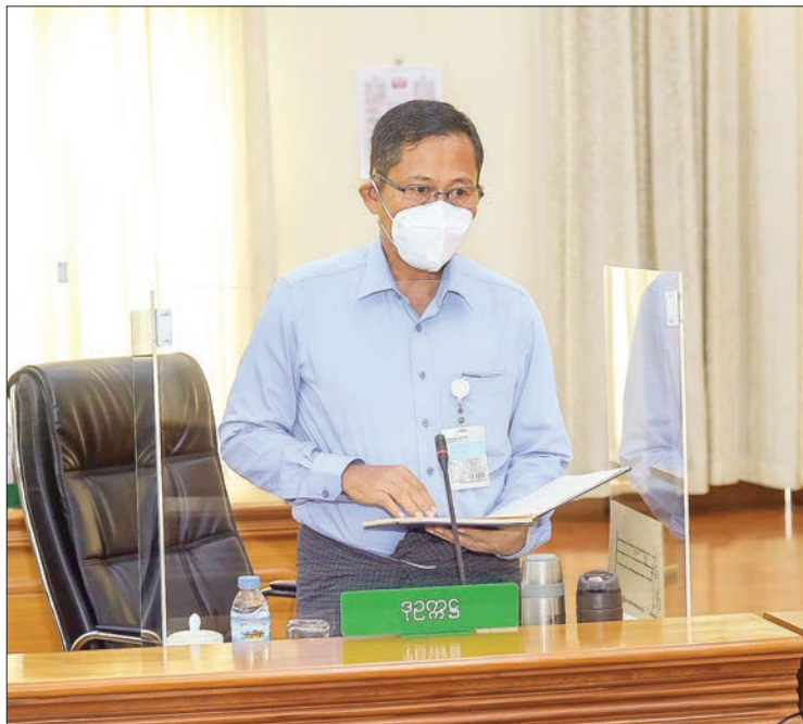
Vice-Chairman of the State Administration Council Deputy Prime Minister Vice-Senior General Soe Win takes part in the meeting.

District and township officials need to maintain the school buildings for convenient learning of students when the schools are opened with controlling of infection rate to some extent. Priority must be given to teachers who would closely teach the students. Although restrictions have been removed for import of vaccines and medicines, relevant departments need to supervise import of medicines in conformity with the rules of