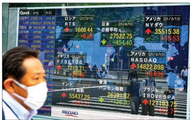
A pedestrian walks past a stock indicator displaying the Nikkei 225 of the Tokyo Stock Exchange (C, top) and other world stock markets in Tokyo on 16 August 2021.