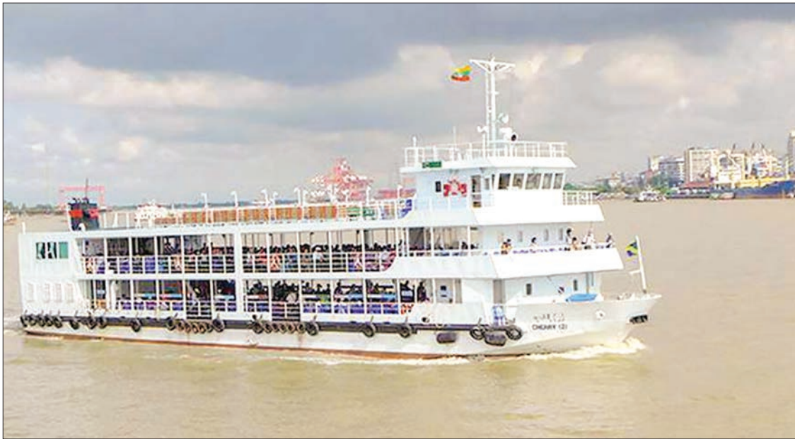
Cherry vessel ferry is conveying passengers between Pansodan and Dala.

DURING the COVID-19 outbreak and extended public holidays, Yangon (Pansodan-Dala) ferries have amended its route and schedule for the convenience of the passengers, according to the Inland Water Transport (Delta Division).