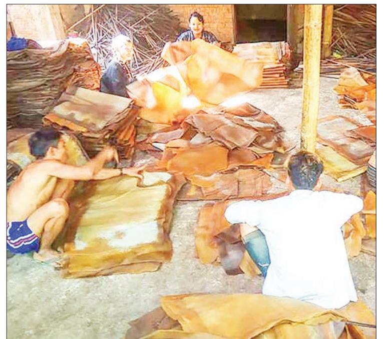
Labours are working on production of rubber sheets.

Myanmar yearly exports over 200,000 tonnes of natural rubber to foreign countries, generating income of over $200 million.—NN/GNLM