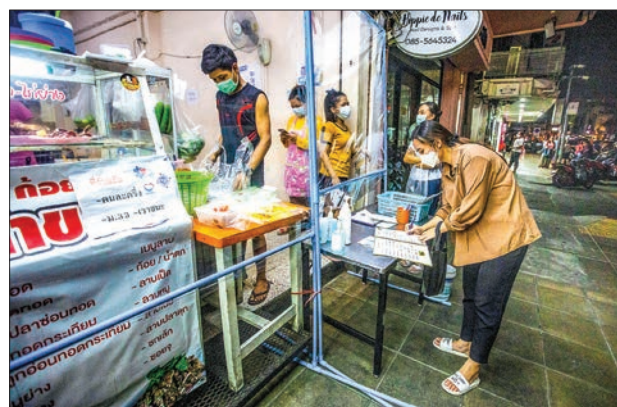
A customer writes down a takeaway food order at a restaurant in Bangkok on 19 July 2021, ahead of the nighttime curfew restriction implemented to reduce the spread of the Covid-19 coronavirus.

Since the start of the pandemic Thailand has recorded 928,314 cases with 7,733 deaths, the bulk of them detected since April. — AFP ■