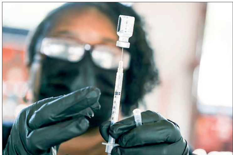
The rapid US vaccination program has slowed particularly in politically conservative regions in the South and Midwest.

THE United States on Thursday authorized an extra dose of Covid vaccine for people with weakened immune systems, as the country struggles to thwart the Delta variant.