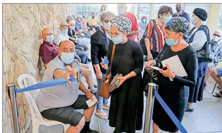
Israelis arrive to get their third dose of the Pfizer-BioNtech COVID-19 vaccine at the Clalit Health Service in Jerusalem

The campaign helped to drastically bring down infections, but that trend has since reversed, driven by the spread of the Delta variant in unvaccinated people as well as those whose immunity has waned six months after they got their initial shots. “Starting