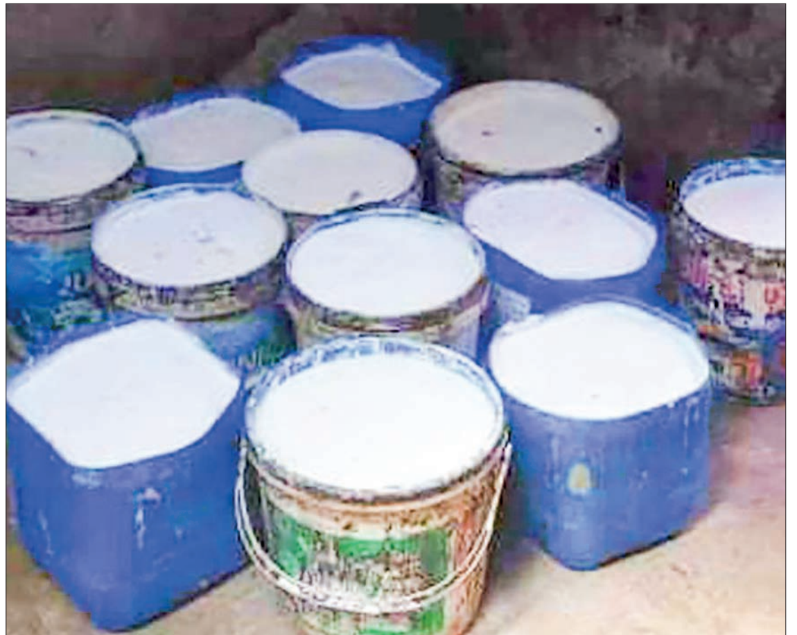
Buckets of rubber latex are gathered before sending them to the market.

Myanmar annually exports over 200,000 tonnes of raw rubber to foreign countries generating over $200 million.—Ko Ko Naing (Mongyu)/GNLM