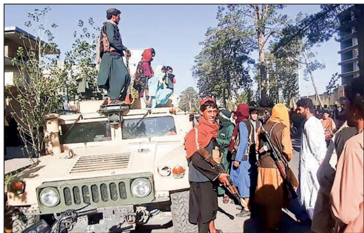
Taliban fighters stand on a vehicle along the roadside in Herat, Afghanistan's third biggest city.

Footage of Afghan soldiers surrendering in the northern city of Kunduz shows army vehicles loaded with heavy weapons and mounted with artillery guns safely in the hands of the insurgent rank and file. In the western city of Farah, fighters patrolled in a car marked with an eagle swooping on a snake—the official insignia of the country's intelligence service.— AFP ■