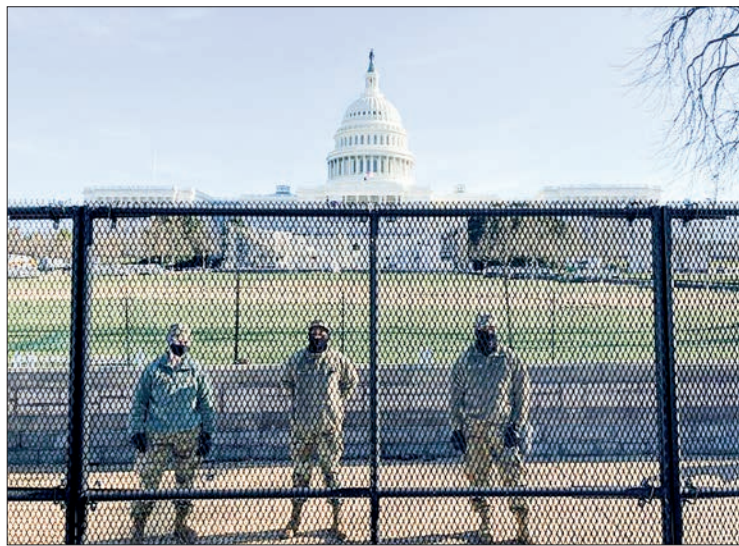
Washington saw security intensified with National Guard troops and high fences following the January 6 assault on Congress by supporters of president Donald Trump.

The new advisory updated a January alert following the attack on the US Congress by supporters of then-president Donald Trump, when DHS said the country faced “increasingly complex and volatile” threats from anti-government and racially motivated extremists, often stirred up by online influence from abroad. The bulletin had already been amended in May, with DHS warning violent extremists could exploit the easing