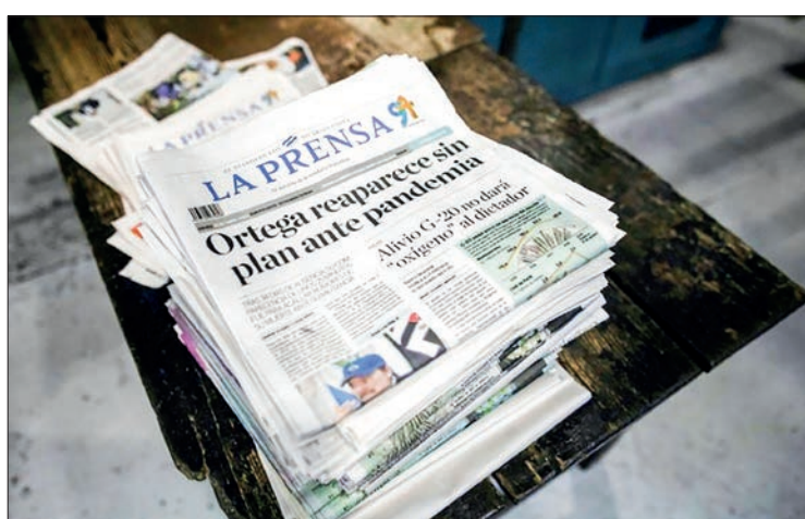
La Prensa had been the only national independent daily newspaper remaining in circulation at a time when the Nicaraguan government is accused of repressing opponents.

published photos of La Prensa’s warehouses on social media,