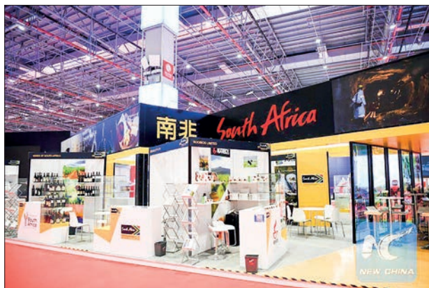
The South Africa pavilion is seen during the first China International Import Expo (CIIE) in Shanghai, east China, Nov. 5, 2018.

She explained that in the Forum they want to identify challenges and opportunities to ensure greater economic, trade and investment ties amongst the BRICS countries. Mabuza expressed confidence in BRICS countries' capability to drive economic development amongst those countries. "There is a consensus amongst our partners that there are opportunities in our economies to unlock growth and allow for development. Our conviction is that we have to massively mobilize all the resources at our disposal and accelerate economic activities that will put the BRICS economies on a journey towards a sustainable recovery trajectory," she said.—Xinhua ■