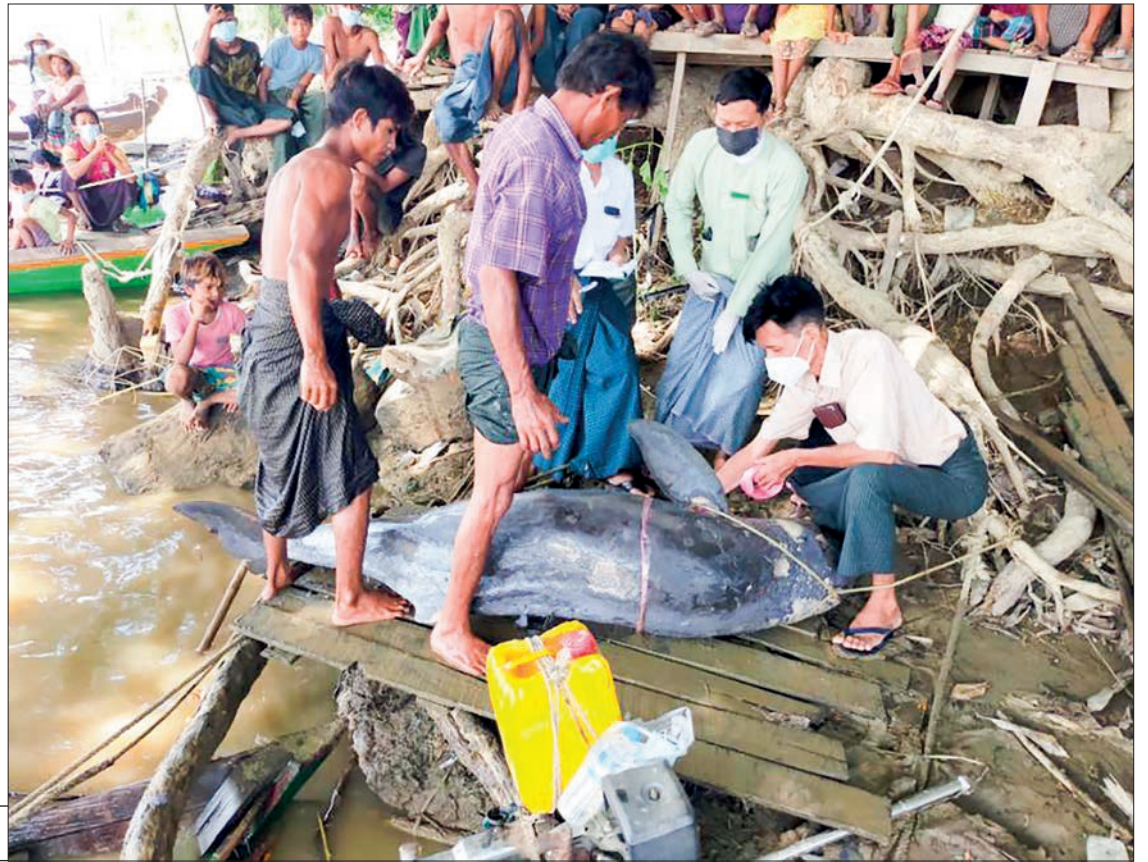
Officials check body of Irrawaddy dolphin by measuring the body.