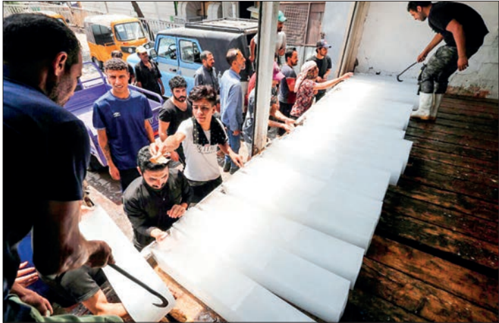
Iraqis buy ice blocks at a factory in Sadr City, east of the capital, Baghdad, on July 2 amid power outages and soaring temperatures.

JULY was the hottest month globally ever recorded, a US scientific agency said Friday, in the latest data to sound the alarm about the climate crisis.