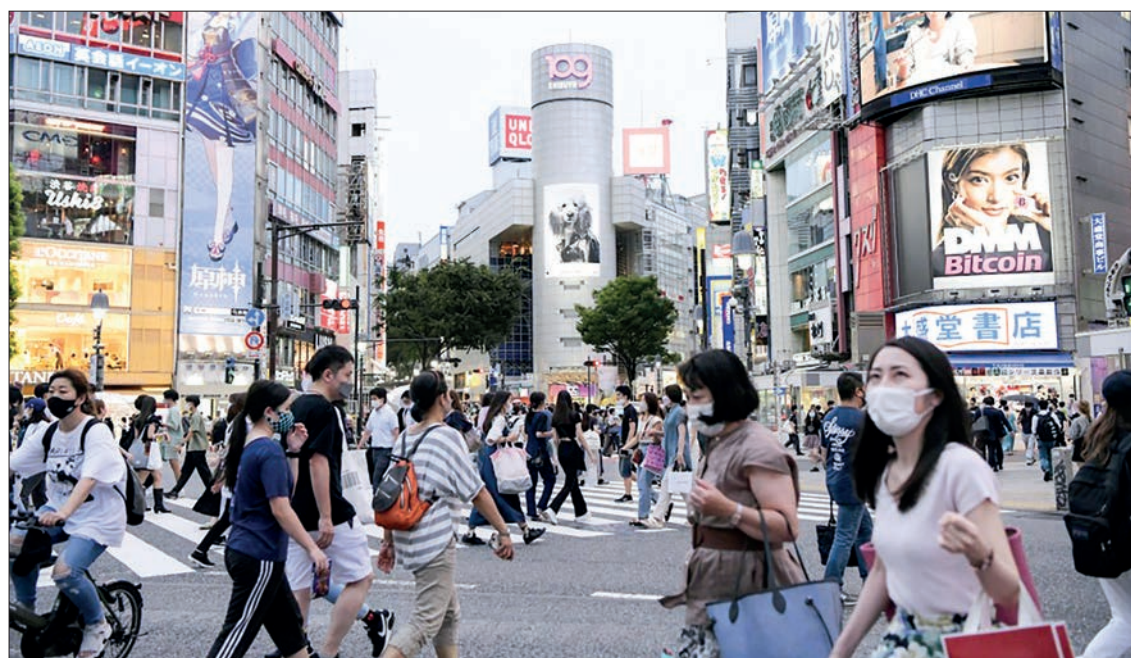
People wearing face masks walk in Tokyo’s Shibuya area on Aug. 12, 2021, as the capital reported 4,989 new coronavirus cases the same day, the second highest figure after 5,042 infections logged a week earlier.

Tokyo reported 4,989 new coronavirus cases the same day, the second-highest figure