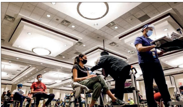
A woman receives a Covid-19 vaccine in the Canadian city of Mississauga in May 2021.

As of Friday, 71 percent of Canada's 38 million population had received at least one dose of a Covid-19 vaccine, while nearly 62 percent were fully vaccinated. —AFP ■