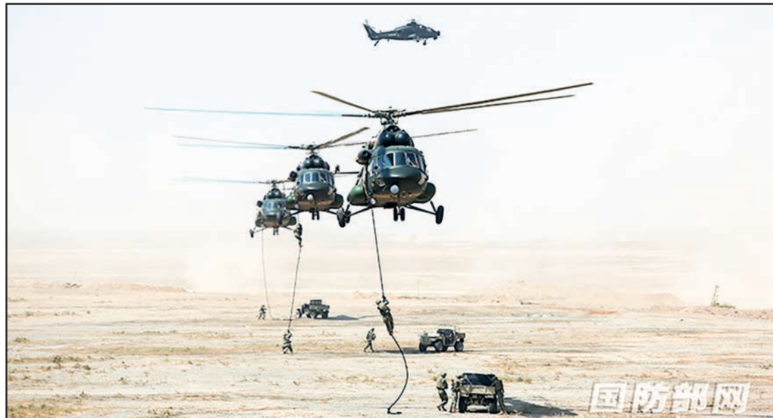
A joint military exercise between China and Russia, named ZAPAD/INTERACTION-2021, concluded Friday in northwest China's Ningxia Hui Autonomous Region.

A JOINT military exercise between China and Russia, named ZAPAD/INTERACTION-2021, concluded Friday in northwest China's Ningxia Hui Autonomous Region.