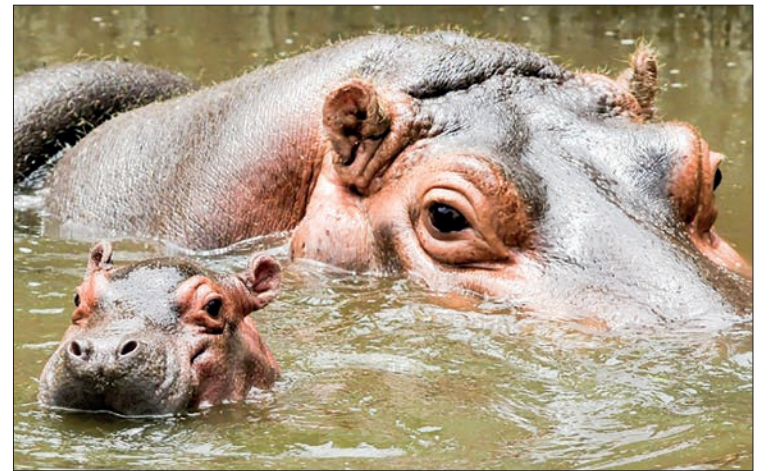
Local officials say the dead bodies of hippos and fish have been found in contaminated waters in DR Congo, according to the environment minister.

The situation is an "ecological catastrophe", for the local populations, said Bazaiba. The discolouration was "on the brink of reaching Kinshasa" where over 10 million people live, she added.— AFP ■