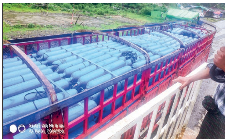
Cargo trucks transports medical supplies and necessary equipment to major cities from regions and states.

tonnes of oxygen cylinders, nine tonnes of oxygen gas, 186 tonnes of oxygen cylinders, seven storage containers, six oxygen distributors, 140,092 empty oxygen cylinders, 30 oxygen plants,