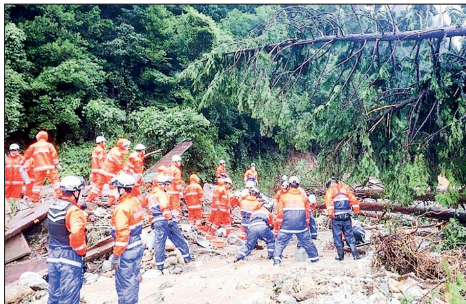
A landslide destroyed two houses in Unzen, Nagasaki prefecture.

cating she hopes the move will encourage the private sector to follow suit. An online survey, conducted in January and February, receiving responses from roughly 47,000 national public employees, showed 1.8 percent were undergoing fertility treatment while 10.1 percent said they have experience with it and 3.7 percent said they had considered it.— Kyodo ■