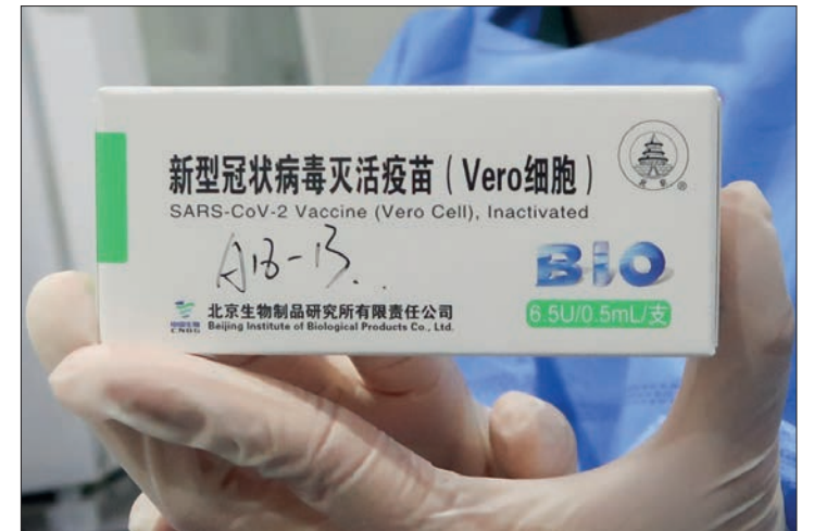
Bangladesh's Health Ministry also confirmed that 1.7 million Chinese Sinopharm vaccines, under the UN's COVAX facility, has arrived in Dhaka.

TO strengthen its campaign against the alarming spike in the COVID-19 spread in the country, Bangladesh has planned to sign an agreement with China for vaccine co-production, reported Pakistani daily The Nation, citing Bangladeshi Foreign Minister AK Abdul Momen.