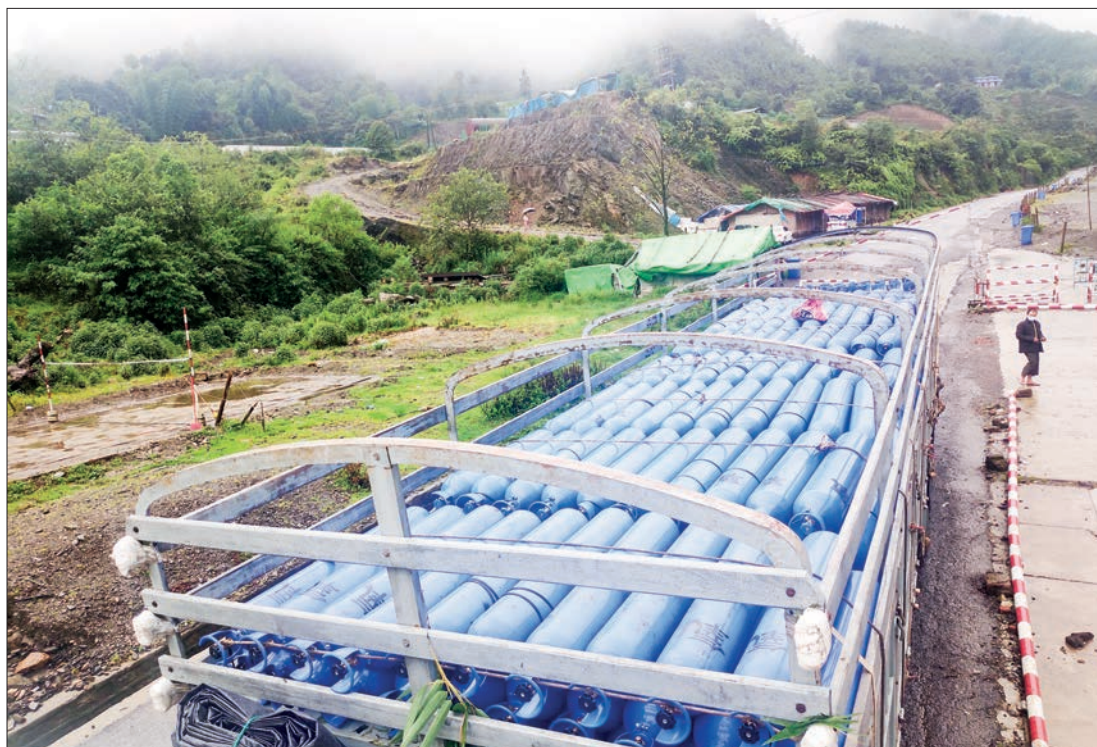
A cargo truck is carrying oxygen cylinder to be distributed to regions and states.

THE Ministry of Commerce is working hard to ensure people have access to essential medical supplies which are critical to the COVID-19 prevention, control and treatment activities, including liquid oxygen and oxygen cylinders, arranging the continuous