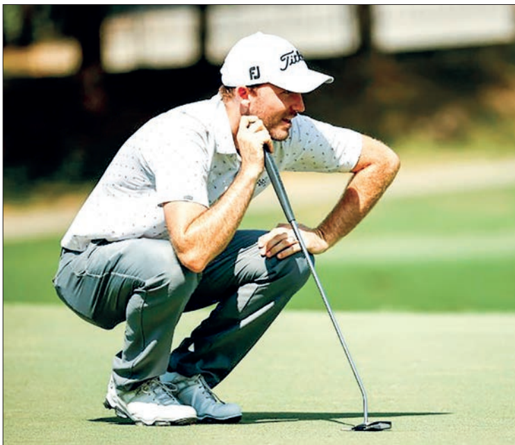
American Russell Henley fired a six-under 64 on Friday to seize a four-stroke lead after the second round of the US PGA Wyndham Championship.

"Keep trying to make good decisions and commit to what I'm doing," Henley said of his weekend plans. "I feel good about my game, but there's so much golf to be played and I'm just excited to try to keep playing well."—AFP ■