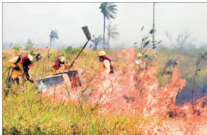
Firefighters battle flames close to the Santa Cruz airport in Bolivia on 1 August, 2021.

DEVASTATING wildfires in Bolivia consumed 749,000 hectares from January to July, the Friends of Nature Foundation (FAN) NGO said on Thursday night.