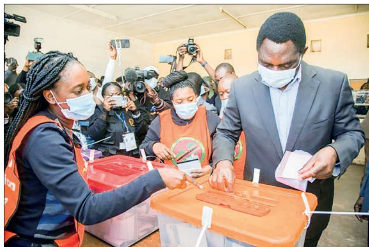
Hakainde Hichilema, who is vying the top job for the sixth time and is backed by an alliance of 10 parties.

Vote counting was underway in Zambia on Friday after a hard-fought general election that saw social media throttled in the capital and President Edgar Lungu