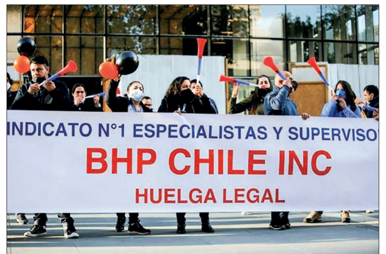
Escondida copper mine workers protest outside BHP Billiton's offices in Santiago in May 2021.

Workers at the Escondida mine had announced their intention to strike after insisting their