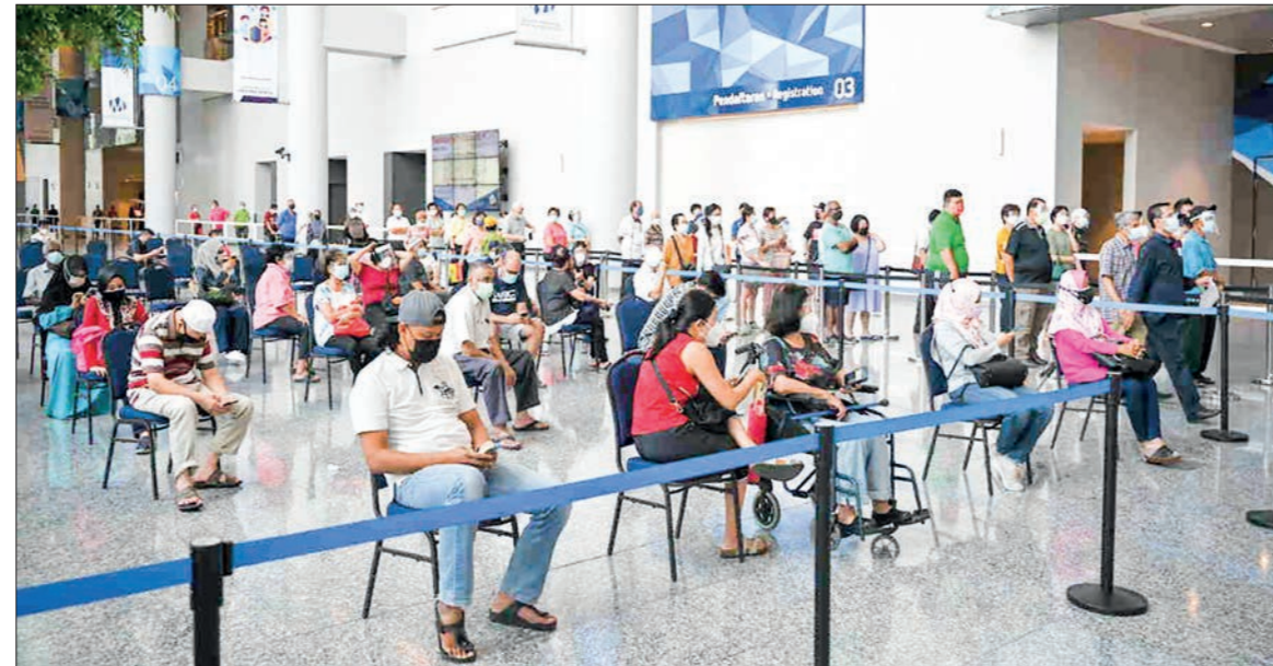
People queue for the Pfizer/BioNTech COVID-19 coronavirus vaccine during the first mega COVID-19 vaccination drive at the Malaysia International Trade and Exhibition Centre in Kuala Lumpur on 31 May, 2021.

The number of new infections was by far the worst in the US-Canada zone, with 31 percent more cases compared to the previous week. The pandemic also picked up speed, but more slowly, in the