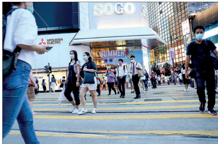
People walk in the Hennessy Road in south China's Hong Kong, July 16, 2020.

HONG KONG'S population has seen a 1.2 percent decline in the past year amidst Beijing's crackdown on dissent in the city and