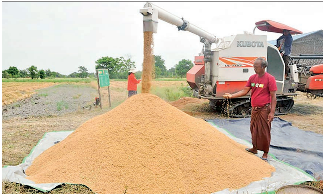
A combine harvester is in operation for winnowing paddy.

THE rice price in domestic market has climbed to over K5,000 per bag (containing 108 pounds), according to the data of Mawlamyine Commodity Depot.