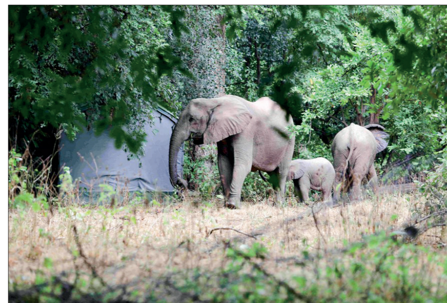
This file photo taken on April 13, 2019, shows elephants at Mana Pools National Park in Mashonaland West Province, Zimbabwe.

"Our area of focus is to make sure that we depopulate where we have more concentration of animals to areas where there is less concentration. But that process is expensive. We don't have money. We survive on tourism-related receipts but for the past two years there is no