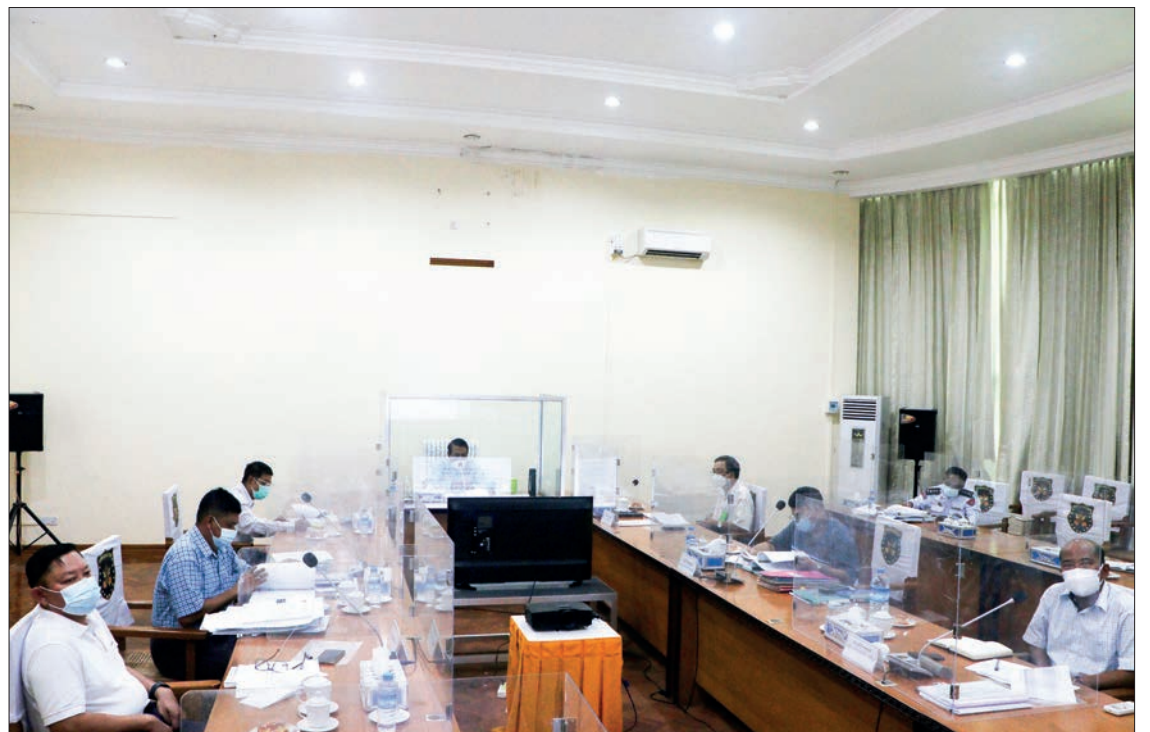
Union Minister for Immigration and Population U Khin Yi hears reports on implementation of Pan Khin project by officials.

During the meeting, the Union Minister highlighted the importance of Pan Khin project for the socio-economic lives of citizens, ways to seek public cooperation in the project, online and offline media, education programmes via social network and other work plans to present the project for the region/state authorities, ethnic people organizations and other social organizations.—MNA