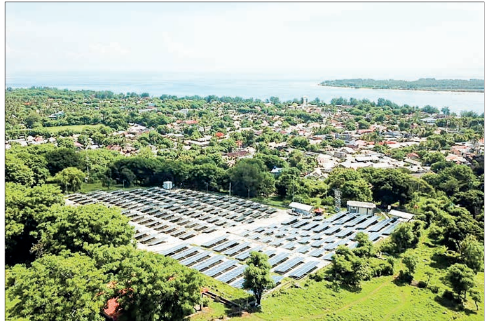
The Lombok Solar Project consists of three individual solar projects each with a capacity of 7-megawatts, all located on the island of Lombok in Indonesia.

ing knowledge. Then, the students will be trained directly by rooftop photovoltaic power station entrepreneurs about market survey, business strategies, and promotional techniques. According to the Ministry of Energy and Mineral Resources, the current total capacity of photovoltaic power stations in Indonesia is only 31 megawatts.—Xinhua ■