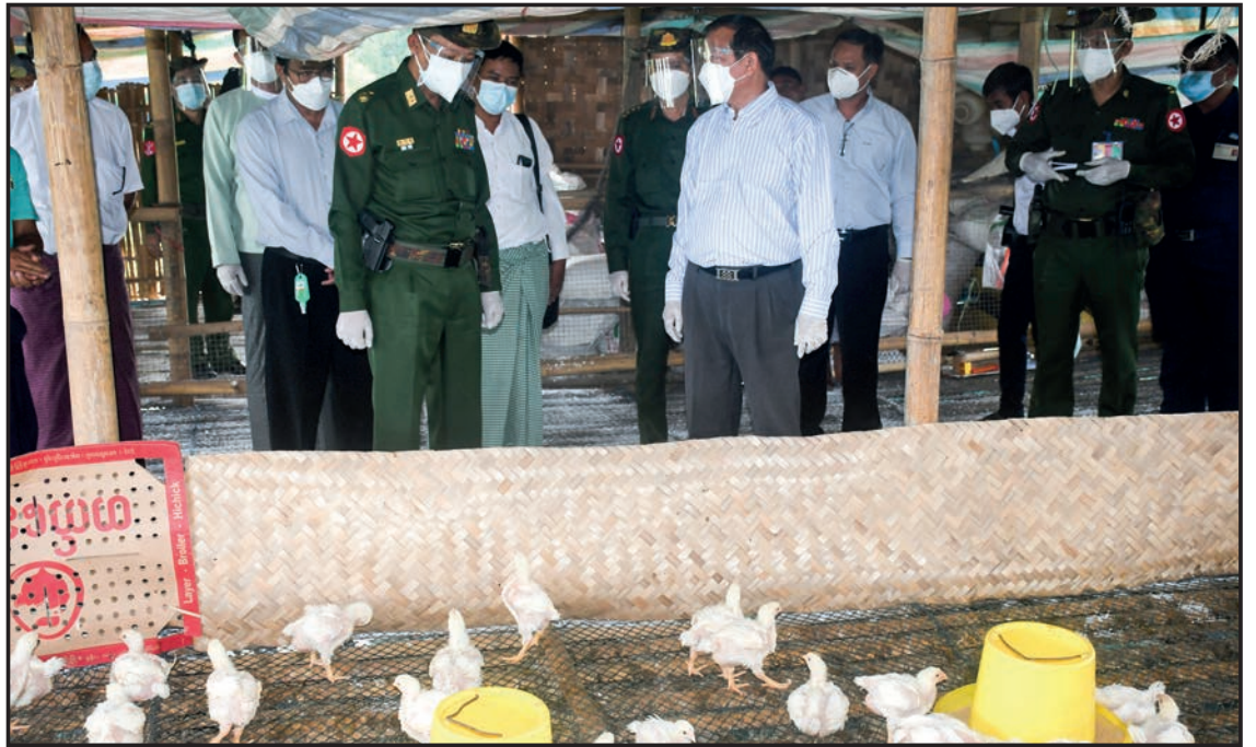
Yangon Region Chief Minister U Hla Soe views raising of layers in the farm.

During the visits, they viewed round the broiler and layer farms in Uto Village and breeding of over 100 oxen in Myaungdakar Model Village.— Hsan Kyaw Oo (IPRD)/GNLM