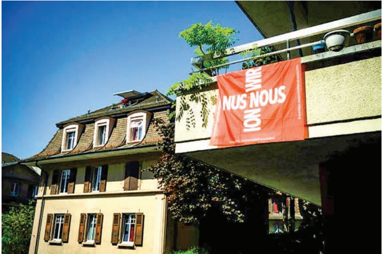
Wrestling with language is part of the national identity in Switzerland, where German, French and Italian are used -- plus a fourth official language: PHOTO: ROMANSH./AFP/FILE

As a result, there has been a rapidly spreading trend of filling words up with dots and stars to include their masculine, feminine and sometimes non-binary forms all in one go. But critics say this is going too far, butchering the written language and creating an unreadable mess.