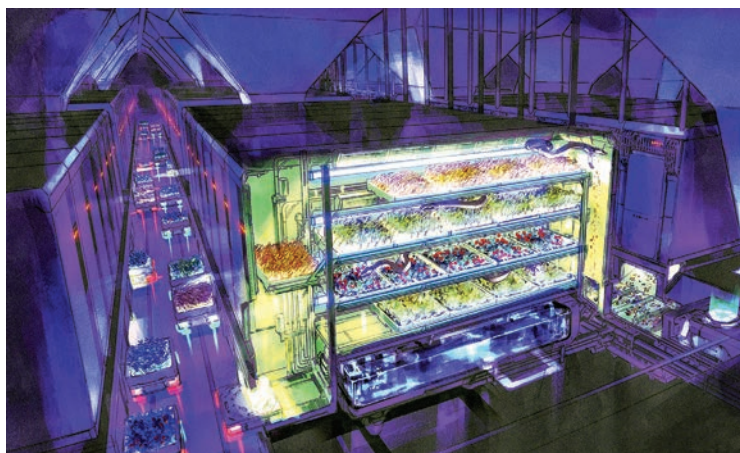
Supplied image shows a plant factory to be built on the Moon.

According to the new electoral calendar, the second round of presidential and legislative elections will be on 23 January, 2022 at the same time as municipal and local elections, which have also been delayed for years. —AFP ■