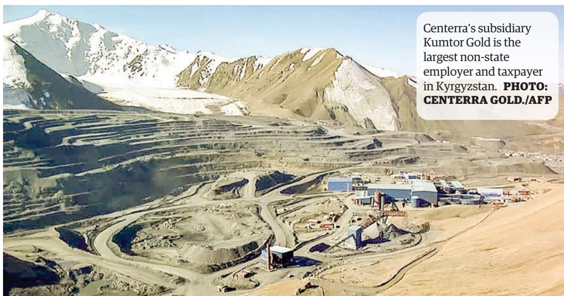
Centerra's subsidiary Kumtor Gold is the largest non-state employer and taxpayer in Kyrgyzstan.

KYRGYZSTAN said Wednesday that it had launched the process of kicking out its largest foreign investor, Canada's Centerra