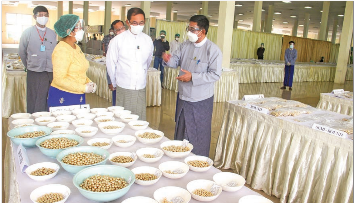
Union Minister U Khin Maung Yi views pieces of pearl in respective quality produced from farming sites in Taninthayi Region.

THE pearls produced by the Pearl Farming Company, a joint venture of Myanma Pearl Enterprise were transported to Nay Pyi Taw from Myeik of Taninthayi Region for valuation and proportionate allocation yesterday.