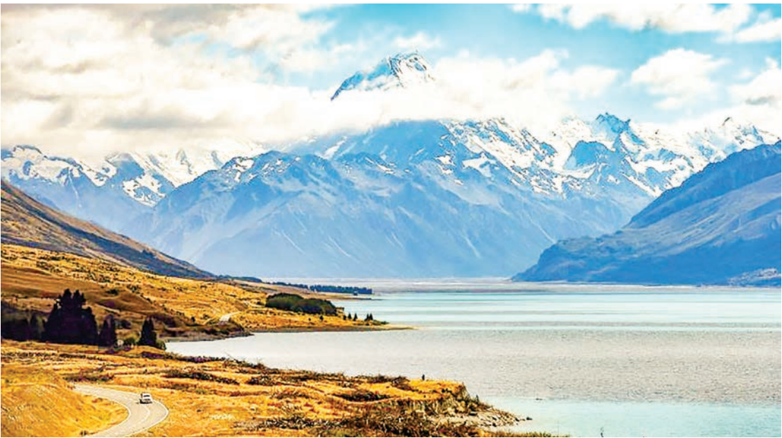
Under the changes, international arrivals will be assessed on vaccination status and whether they have travelled from a country deemed high, medium or low risk

She said the changes would be “careful and deliberate” to avoid allowing variants such as the highly contagious Delta strain into New Zealand, where there is no local transmission and domestic life is close to normal. “Rushing could see us in the situation many other countries are finding themselves in,” she said, citing an outbreak of the Delta variant in neighbouring Australia that has forced its two largest cities into renewed lockdown. Ardern won widespread praise for her decisive early response to the pan-