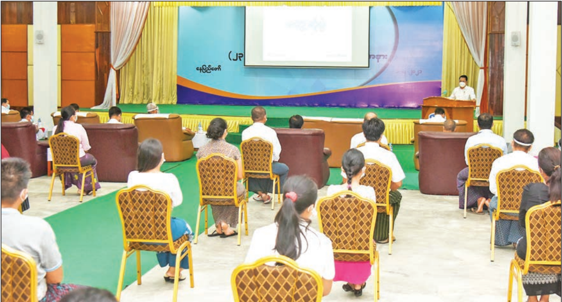
Union Minister for Information U Maung Maung Ohn meets staff of daily newspapers and Nay Pyi Taw Printing Factory.

He viewed round arrangements to finish the production of school textbooks in time, operating of work process in line with COVID-19 disciplines, and maintenance of printing machines. He instructed officials to prepare the printing machines to be operated