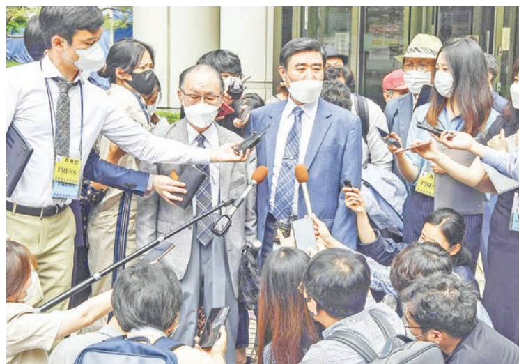
Plaintiffs speak to reporters on Jun 7 in Seoul after the Seoul Central District Court's dismissal of their wartime labour compensation lawsuit.

The South Korean Supreme Court in a groundbreaking decision on May 24, 2012, said the right of individuals such as former wartime labourers to pursue compensation was not nullified