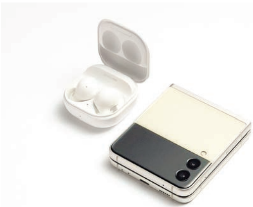
This undated photo released on August 11, 2021 courtesy of Samsung shows the Samsung Galaxy Z Flip3 5G smartphone and Galaxy Buds2. PHOTO: SAMSUNG ELECTRONICS/AFP

SAMSUNG unveiled two upgraded folding smartphones on Wednesday as the South Korean sector leader sought to head off rising competition from Chinese firms in a fast-evolving market. The Galaxy Z Fold3 and Z Flip3 offer sleeker designs, improved water resistance and more durable screens are available for pre-ordering for delivery later this month in the United States, Europe and South Korea. The new devices come with Samsung facing heightened competition from Chinese manufacturers including Xiaomi, which grabbed the number two position in the second quarter. “These devices equip consumers with technologies that unlock new ways to maximize and enjoy every moment with an ecosystem built on openness and innovation.” The Flip3 aims to offer an affordable foldable, and the Fold3 aims to replace the large-screen devices and will include a retractable pen than can be used on the screen. A recent survey by the research firm Canalsys showed Chinese electronics firm Xiaomi has overtaken Apple as the number two global smartphone maker in a market in turmoil due to a global chip shortage and consumers emerging from lockdowns.—AFP ■