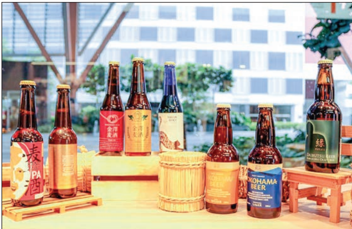
The photo shows a lineup of locally brewed Japanese craft beers to be offered at East Japan Railway Co.'s Japan Rail Cafe in Singapore.

The company chose the companies from among brewers across Japan that responded positively to its campaign proposals. It treats the upcoming promotional event as a test-marketing of broader ranges of regional products from Japan for possible sales expansion. — Kyodo News ■