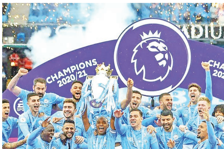
Premier League champions Manchester City.

Manchester United have also spent over £100 million on Jadon Sancho