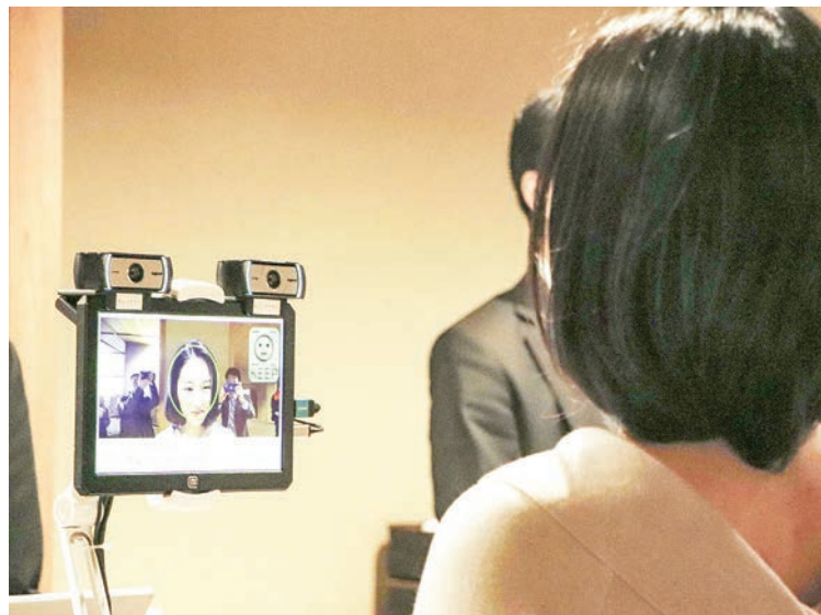
Facial recognition tech 'set for wider usage' at Tokyo Olympics.

FOUR Japanese firms will jointly develop a payment system using facial recognition technology that will allow customers to make deposits and withdrawals at banks and shop at stores without presenting anything if they register their facial images in advance.