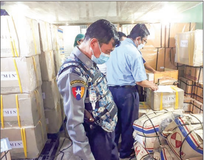
Officials check packages of medicines in medicine warehouse.

the prices, and so such warehouses will face legal actions in accordance with the law. The pharmacies that sell the medicines at normal prices must sign a form promising not to increase the medicine prices, not to control the distributions in the market and not to sell for profits. The companies that import the medicines in accordance with the procedures will not face any actions. The joint inspection team also raided 19 medicine warehouses yesterday.—MNA