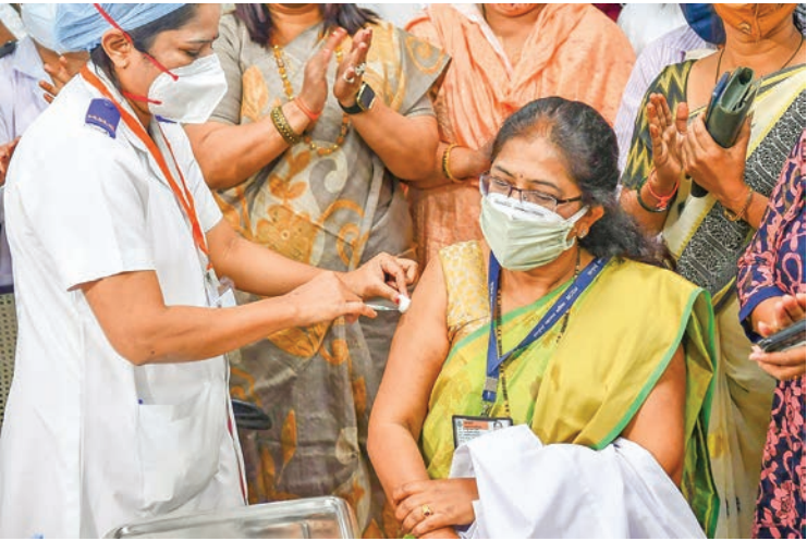
A medical worker inoculates a woman with a COVID-19 vaccine at a hospital in Mumbai, India, Jan. 16, 2021. PHOTO: AFP viewed. According to the finding of the ICMR study, immunization with a combination of an adenovirus vector platform-based vaccine, followed by inactivated whole virus vaccine was not only safe but also elicited better immunogenicity.—Xinhua ■

Covishield and Covaxin are two main COVID-19 vaccines being administered to people in India. The ICMR study on the mixing of vaccines was conducted on 18 people, who by mistake received both Covishield and Covaxin doses in Uttar Pradesh’s Siddharth Nagar in May this year. The villagers were administered Covaxin after being given Covishield as the first shot. The study is yet to be peer-re-