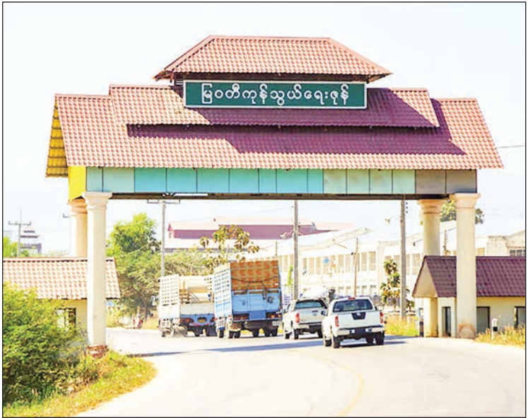
Small and large vehicles are passing the gate of Myawady Trade Zone.

Myanmar primarily exports corn, natural gas, fishery products, coal, tin concentrate (SN 71.58 per cent), coconut (fresh and dry), beans, and bamboo shoots to Thailand. It imports capital goods such as machinery, raw industrial goods such as cement and fertilizers, consumer goods such as cosmetics and food products from the neighbouring country.—KK/GNLM