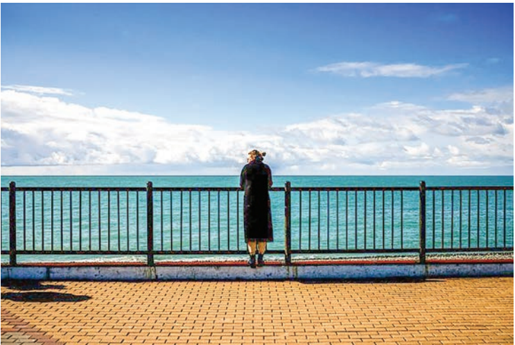
Russia’s Black Sea coastline is home to some of the country’s best beaches and is popular with tourists.

and involved around 12 cubic metres (423 cubic feet) of oil. By early Sunday, “the situation was back to normal” and posed no threat to either the local population or wildlife, said the consortium. CPC’s shareholders include Russia’s Rosneft, US oil giant Chevron and Italy’s Eni. The WWF and Russian scientists said the oil slick was much more serious than initially reported and could harm the