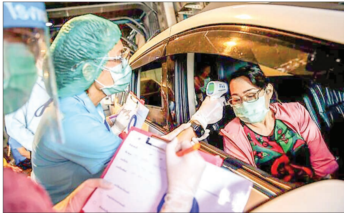
Medical staff dressed in protective gear test a woman for the COVID-19 novel coronavirus at a drive-through testing centre at Vibhavadi Hospital in Bangkok on March 25, 2020.

The coordinated research across dozens of countries allows the trial to assess multiple treatments using a single protocol, thereby generating robust estimates on the effect a drug may have on mortality, including