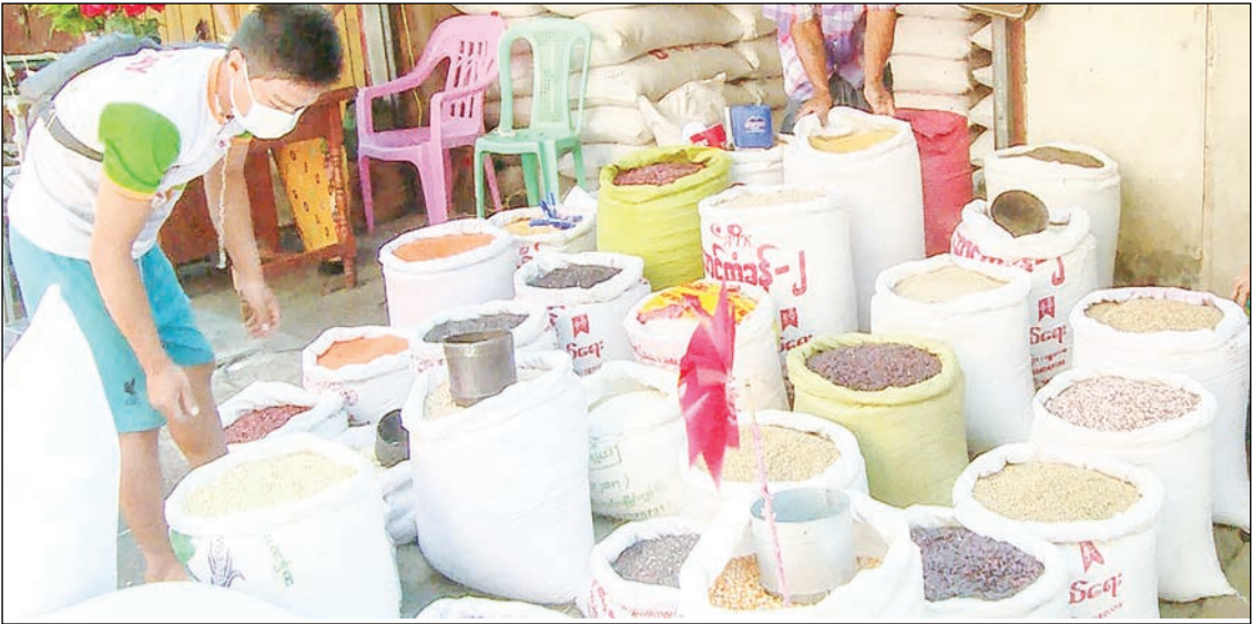
A merchant checks pulses and beans in bags displayed at depot.

setting import quota on beans, including black beans and pigeon pea under India government plus foreign trade policy for 2015-2020.