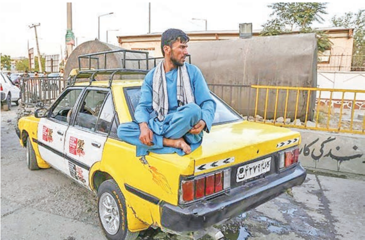
The Taliban's capture of Ghazni city brings them just 150 kilometres (95 miles) from the Afghan capital of Kabul.

THE Taliban have taken the strategic Afghan city of Ghazni just 150 kilometres (95 miles) from Kabul, a senior lawmaker