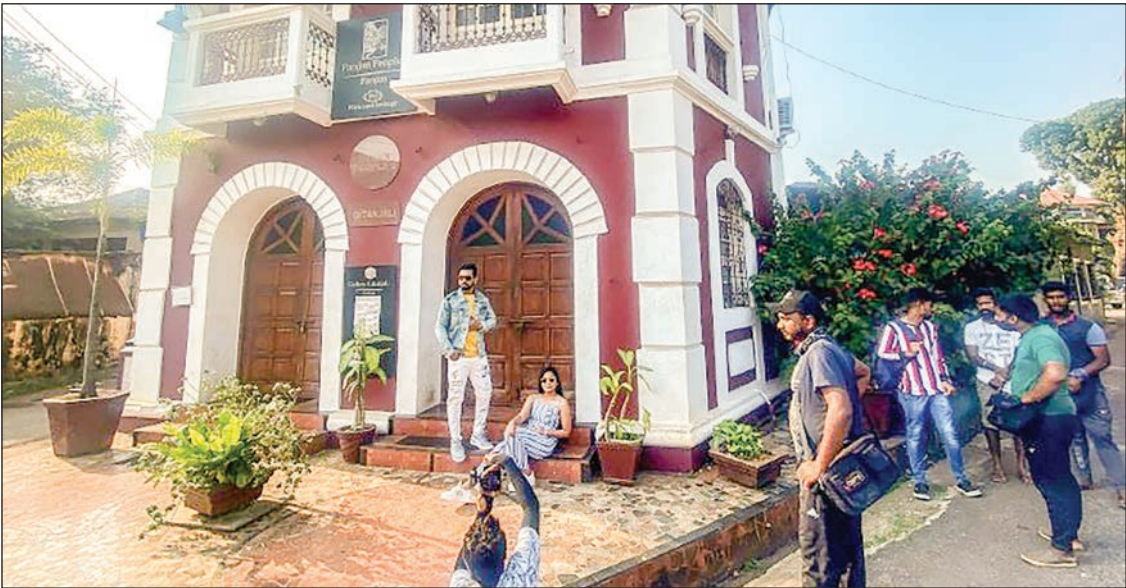
Only a handful of homes influenced by old Portuguese design trends have been earmarked for protection.

AS Lorraine Alberto begins her Portuguese class at Goa University, students from the former colony are in short supply.