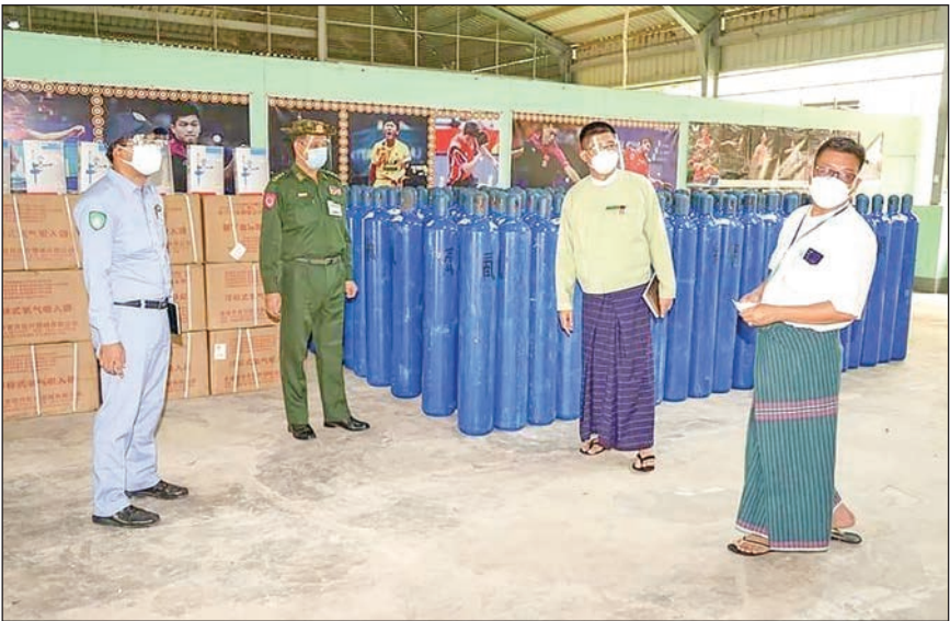
Officials inspect new arrivals of oxygen cylinders and flow meters.

Besides, the vaccination programme started with the priority group of people in 25 townships of seven districts in Sagaing region. The first COVID-19 vaccines were given to 88,134 people including person from religions, people of above 65, public service personnel and public from 3 to 9 August.—Lulay/GNLM