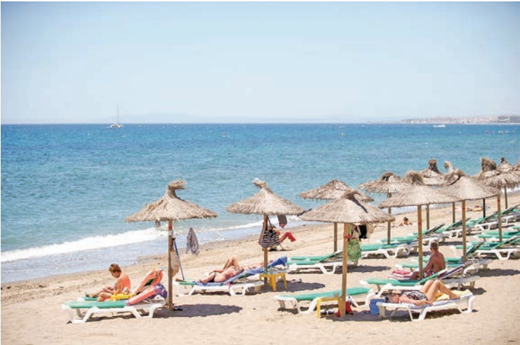
Tourists sunbathe at Marbella beach, in Marbella, Spain, June 7, 2021.

SPAIN’S medicines agency approved Tuesday a first round of clinical trials on humans for a Covid-19 vaccine developed by Spanish firm Hipra. “This is the first trial on humans of a vaccine made in Spain,” the agency said in a statement. Dozens of volunteers will be recruited from Spanish hospitals “as soon as possible” for the clinical trials, it added. Hipra, which is based in the northeastern city of Girona, said it could produce up to