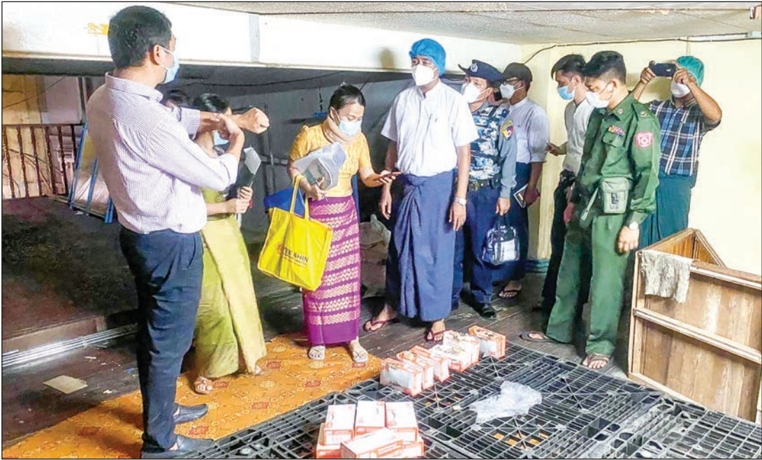
Departmental officials inspect medicines and medical equipment not to rise prices.

The State Administration Council will specifically ease restrictions for service personnel, intellectuals and intelligentsia, and persons from various arenas and citizens who, with worries, absconded from the country except for persons who committed murders, robberies, setting fires, mine explosions and intentional attacks on security troops, those who crowded to attack public service personnel and some people, those who destroyed government and private-owned buildings and those who are highly involved in the CDM activities by providing monetary assistance and other means.