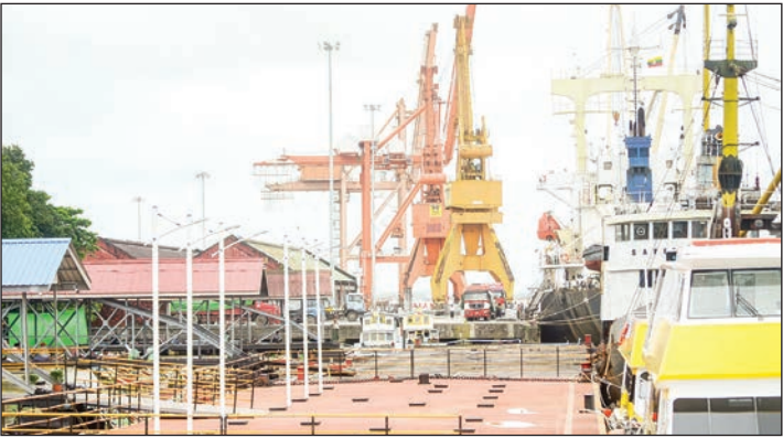
An ocean liner prepares to unload cargo at the port.

MYANMAR'S external trade between 1 October and 30 July in the current financial year 2020-2021 exceeded US$24.7 billion, according to the Ministry of Commerce.