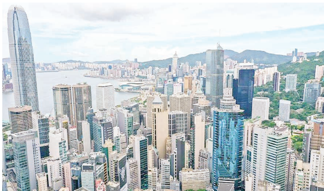
Finance hub Hong Kong has long marketed itself as a reliable business gateway to China.

years. And things could be about to get even more complicated. In June, China passed a broad anti-sanctions law in response to US and European punishments sparked by Beijing's treatment of Hong Kong and its Uighur Muslim minority in Xinjiang.—AFP ■