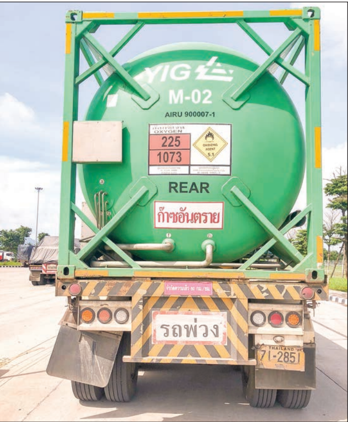
A bowser carries liquid oxygen to be distributed to regions and states.

MYANMAR'S COVID-19 positive cases rose to 344,730 after 3,430 new cases were reported on 12 August 2021 according to the Ministry of Health. Among these confirmed cases, 260,025 have been discharged from hospitals. Death toll reached 12,667 after 215 died. —MNA