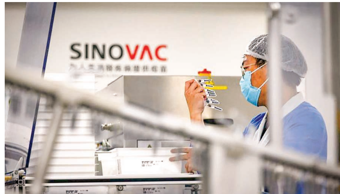
A staff member works during a media tour of a new factory built to produce a COVID-19 vaccine, at Sinovac, in Beijing, China, Sept. 24, 2020.

In May, the ministry published a study on the effectiveness of the Sinovac vaccine on medical workers. Looking at about 128,000 healthcare workers between January and March, the review showed that the vaccine was 98 percent effective in reducing the number of deaths among them due to the COVID-19 infections. The Southeast Asian biggest economy has received COVID-19 vaccines from a number of foreign vaccine producers. Sinovac has become the major vaccine in the archipelago. Indonesia has given the first vaccination shots to at least 51.18 million people, and