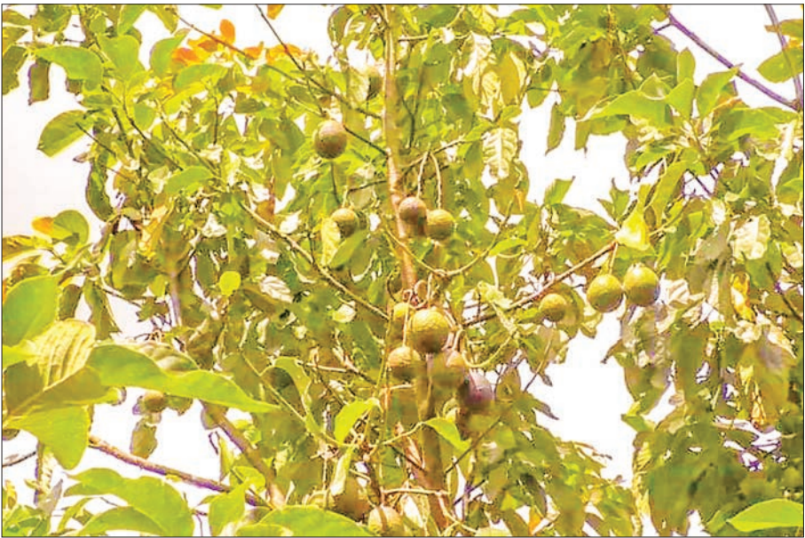
Pinkerton avocado plant bears fruits in the farm.