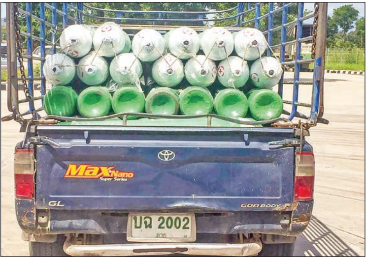
A truck transports oxygen cylinders to respective centres for treatment of patients.

A total of 784 tonnes of liquid oxygen, 66 tonnes of oxygen cylinders, 83,679 tonnes of empty oxygen containers, 20 oxygen plants, 10 oxygen generators, 64,849 oxygen concentrators, 150,268