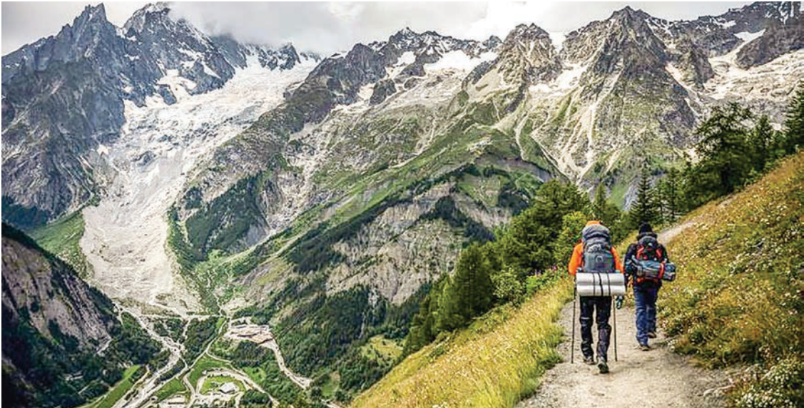
Hikers walk near the Brenva Glacier in Courmayeur, north-western Italy.

SCIENTISTS on Italy’s side of the Mont Blanc massif are constantly monitoring a melting glacier, where the risk of collapse due to rising temperatures threatens the valley below. The Planpincieux glacier, at an altitude of about 2,700 metres (8,860 feet), hangs over the hamlet of Planpincieux, underneath the south face of the Grandes