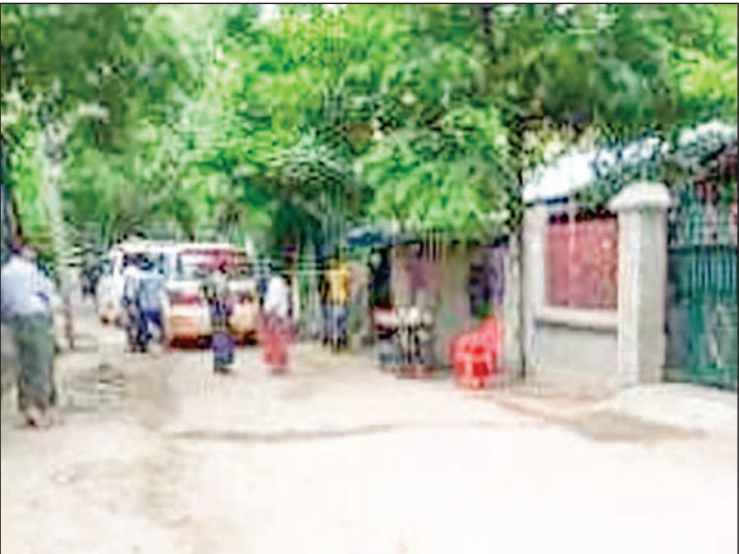
Photo shows scene of shooting to innocent people in Myingyan.