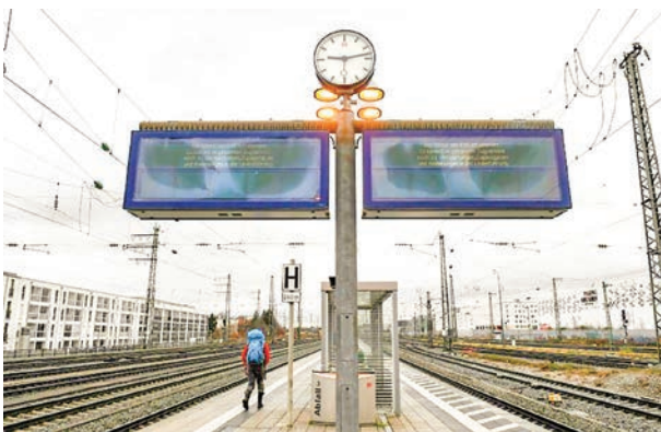
The strike is a new setback at the height of the key summer vacation season for the travel industry which was only starting to recover after months of shutdown over coronavirus infection risks.

He in turn accused DB managers of "lining their pockets while the little guys are getting their pockets picked."—AFP ■