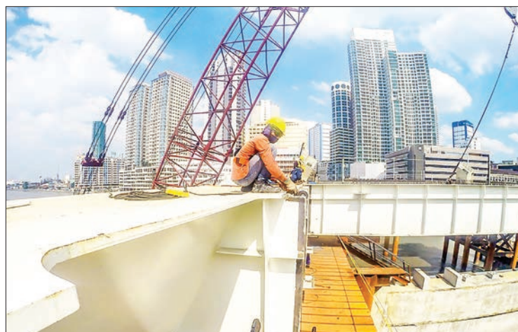
Workers work at the construction site of the China-funded Binondo-Intramuros Bridge in Manila, the Philippines, Nov. 18, 2020.