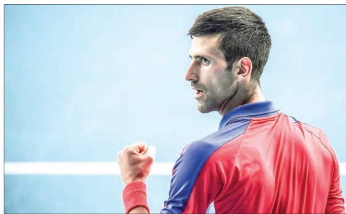
(FILES) In this file photo taken on 31 July 2021 Serbia's Novak Djokovic celebrates a point against Spain's Pablo Carreno Busta during their Tokyo 2020 Olympic Games men's singles tennis match for the bronze medal at the Ariake Tennis Park in Tokyo.

Djokovic, 34, lost at Tokyo to Alexander Zverev in a semi-final and Pablo Carreno Busta in the bronze medal match in what will be his last matches before the US Open after pulling out of the last major tuneup event.