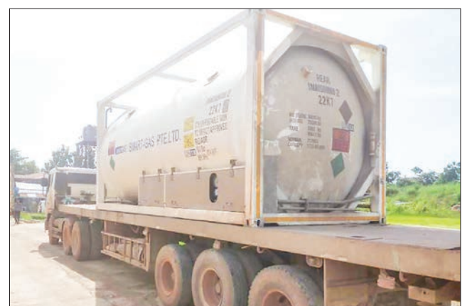
Cargo trucks are transporting medical equipment to be distributed to regions and states.