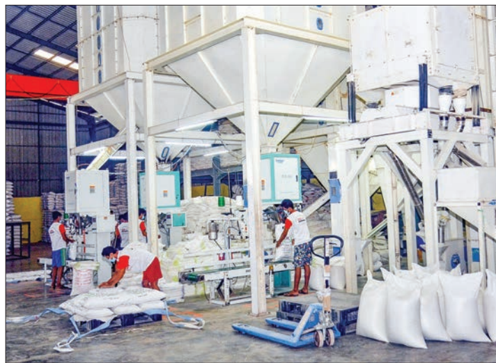
Employees are working at rice production at modern rice mill.

In the exports sector, the agriculture industry performed the best, accounting for 37 per cent of overall exports. The chief items of export in the agricultural sector are rice