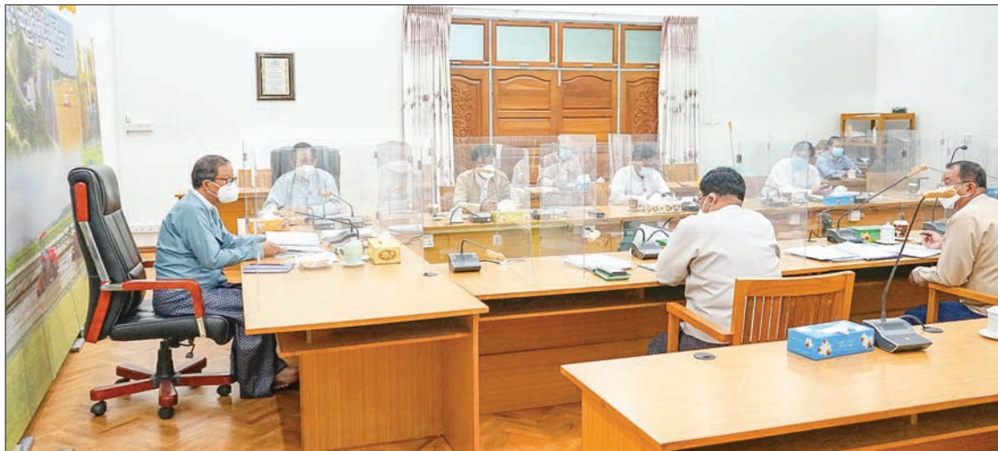
The meeting emphasizes the plans how to increase high yield of paddy and other crops in Sagaing Region.

Therefore, it is necessary for the relevant departments to make effective plans to increase crop yields and production for the coming monsoon paddy season so as not to affect domestic consumption and exports.