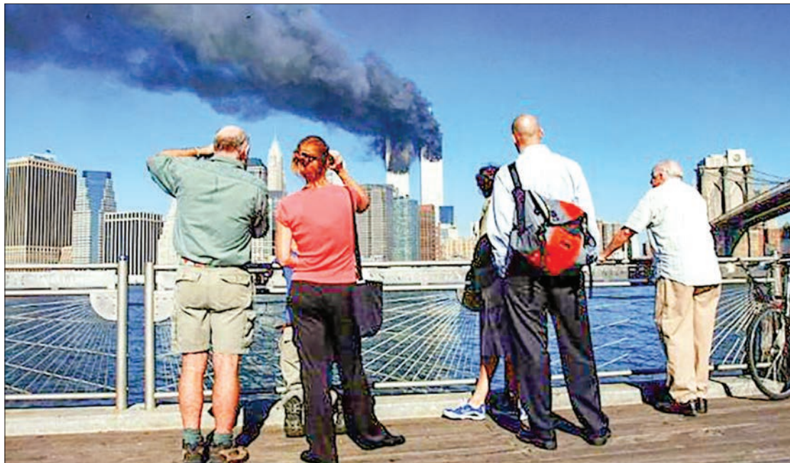
Pedestrians standing on the Brooklyn waterfront look across the East River towards the burning Twin Towers of the World Trade Center in lower Manhattan, New York on September 11, 2001.

The FBI’s commitment is part of a legal battle waged by relatives of September 11 victims against Saudi Arabia and other nations they believe were