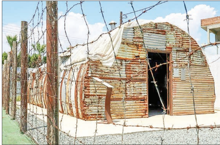
More than 52,000 Jews were detained in a dozen camps in Cyprus, according to Israel’s Holocaust memorial and education centre.

She escaped death using false papers, working as a forced labourer in Germany. After the