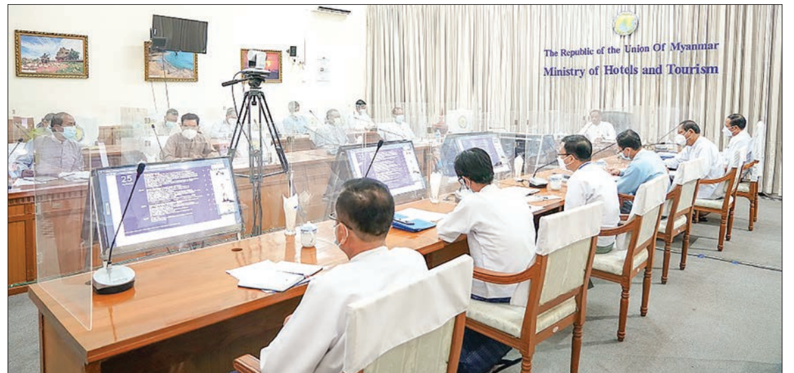
Meeting participants discuss surging of hotels and tourism sector.

The president and officials of the Myanmar Tourism Federation and its affiliate associations discussed the need to include representatives from the Myan-