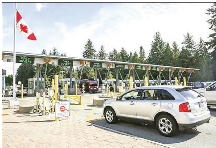
The US-Canada border in Blaine, Washington state, as non-essential travel reopened to fully vaccinated Americans.

The Canadian-born resident of Queensbury, New York, her