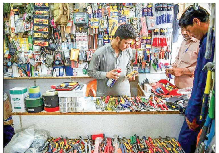
Smugglers' markets mushroomed in Pakistan along the Afghan border after 2001.

Major fires were also reported in Ait-Yenni, Azazga, Jijel and Yakourene. — AFP ■