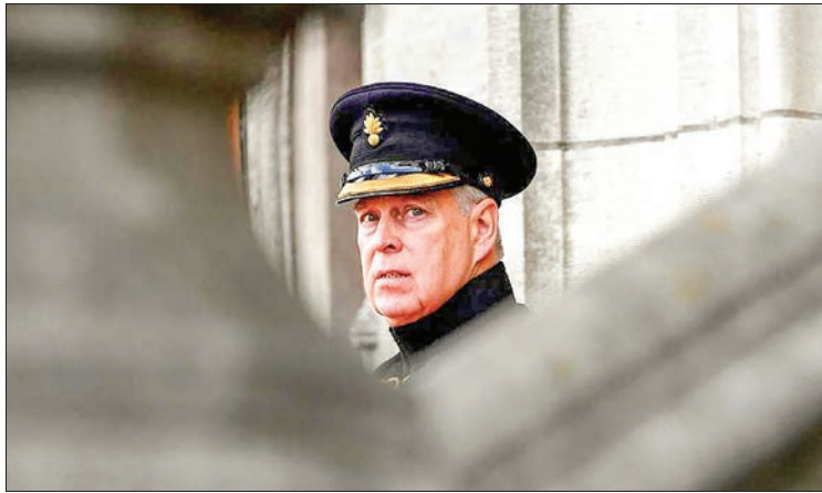
Prince Andrew.

According to the complaint, Giuffre said Andrew sexually abused her at the London home of socialite Ghislaine Maxwell more than 20 years ago, when she was under 18. "Epstein, Maxwell, and Prince Andrew forced (the