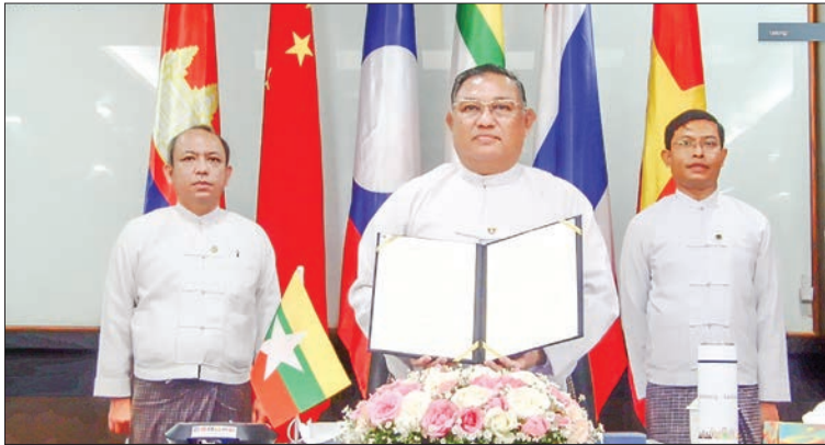
U Wunna Maung Lwin, Union Minister for Foreign Affairs of the Republic of the Union of Myanmar and H.E. Mr. Chen Hai, Ambassador Extraordinary and Plenipotentiary of the People's Republic of China to Myanmar attend Signing of agreement on transfer of fund for Mekong-Lancang Special fund (2021) through video conference.

U Wunna Maung Lwin, Union Minister for Foreign Affairs of the Republic of the Union of Myanmar and H.E. Mr. Chen Hai, Ambassador Extraordinary and Plenipotentiary of the People's Republic of China to the Republic of the Union of Myanmar signed the agreement on the transfer of fund for Mekong-Lancang Special Fund (2021) projects, via video conference in the morning of 10 th August 2021.