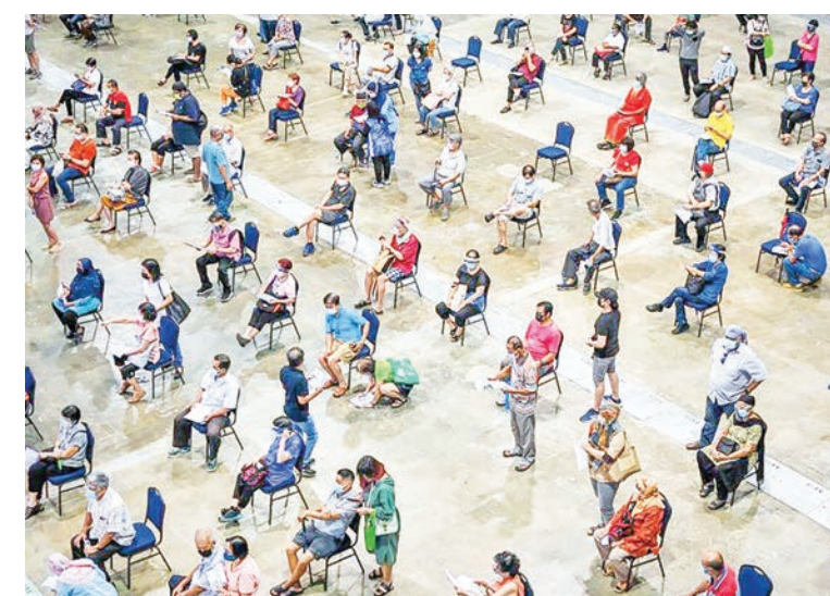
In Malaysia, more than 13 million people in total have registered for vaccination.

The virus spread also raged in the non-metropolitan area. The number of newly infected people in the non-capital region was 658, or 44.6 percent of the