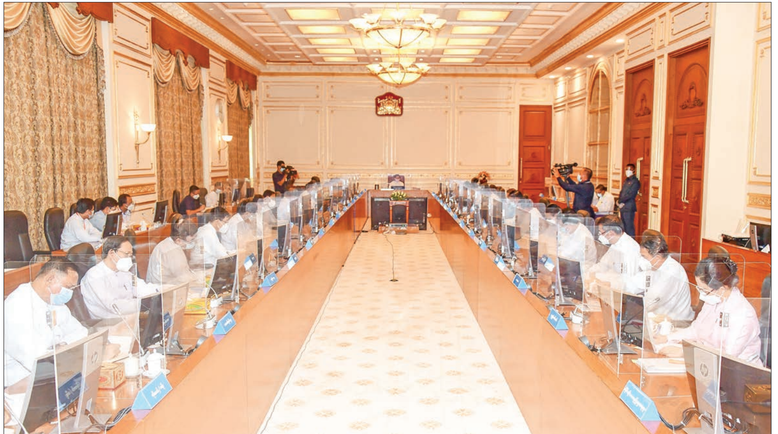
The meeting 1/2021 of Provisional Government of the Republic of the Union of Myanmar is in progress.

The government is striving for narrowing the development gap between regions and states, districts and townships as much as it can. Especially, it makes efforts for improvement of living standard of the people from rural areas. Manufacturing is based on rural areas. As such,