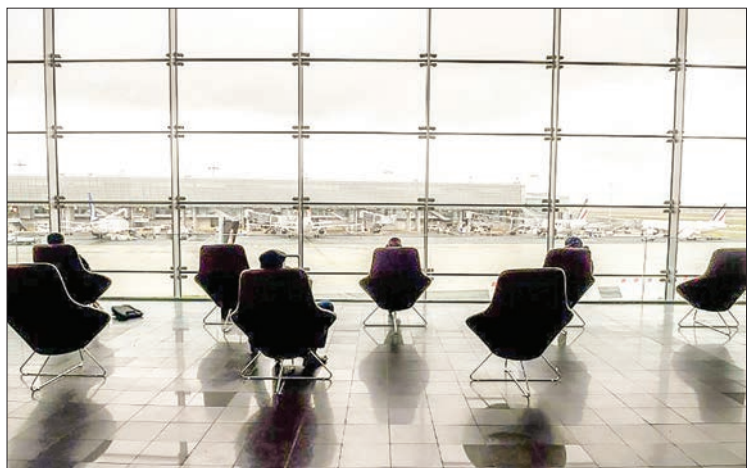
US authorities have advised Americans against travelling to France over coronavirus concerns.

THE US State Department has advised Americans to avoid all travel to France over rising coronavirus cases in the country.