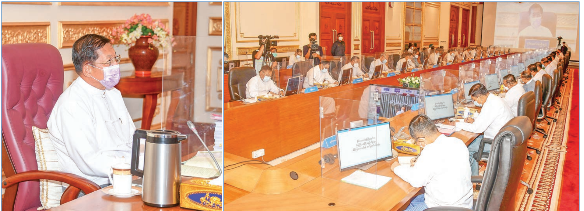
State Administration Council Chairman Prime Minister of Provisional Government of the Republic of the Union of Myanmar Senior General Min Aung Hlaing addresses meeting 1/2021 of Provisional Government of the Republic of the Union of Myanmar.

ONLY when the country is peaceful and stable, can the election be held smoothly, said Chairman of the State Administration Council Prime Minister of the Provisional Government of the Republic of the Union of Myanmar Senior General Min Aung Hlaing at the meeting 1/2021 of the Provisional Government of the Republic of the Union of Myanmar at the