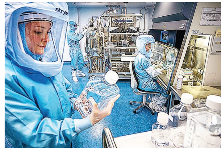
BioNTech is a biotechnology company which manufactures active immunotherapies for patient-specific approaches to the treatment of diseases.

works by providing human cells with the genetic instructions to make a surface protein of the coronavirus, which trains the immune system to recognise the real virus.