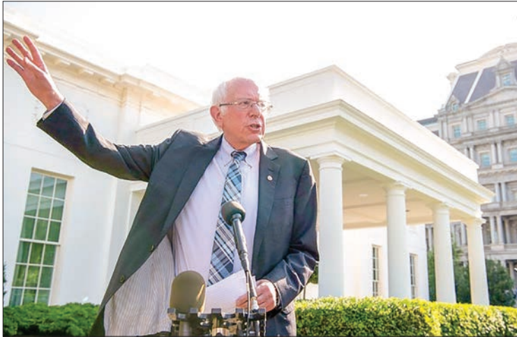
US Senator Bernie Sanders, shown here at the White House on July 12, 2021, said the budget blueprint would be the “most consequential piece of legislation” on social spending since the New Deal.

US lawmakers on Monday laid out a $3.5 trillion budget framework, calling it the “most consequential” social spending plan since the 1930s, and launching