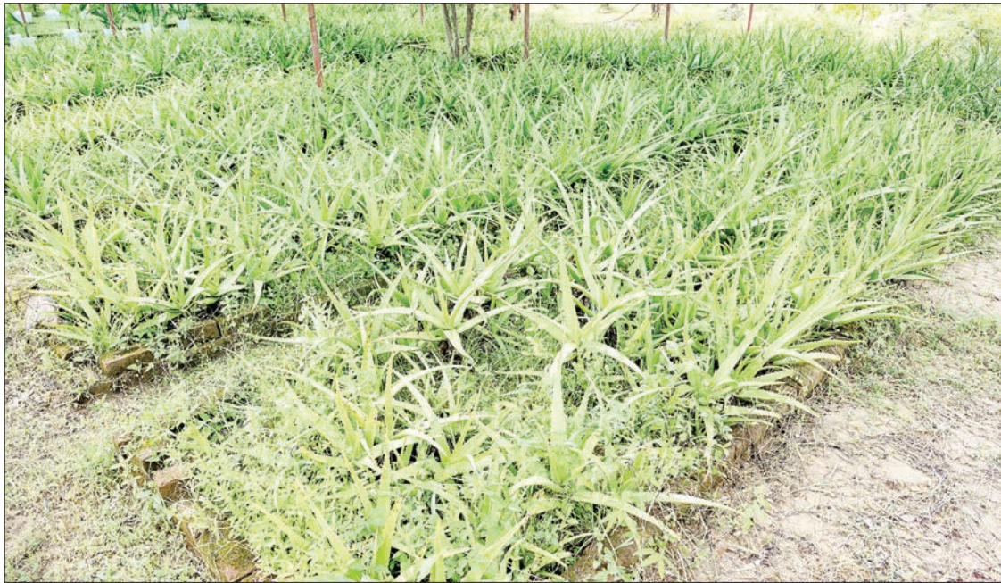
Dragon fruit plants are thriving in farm.