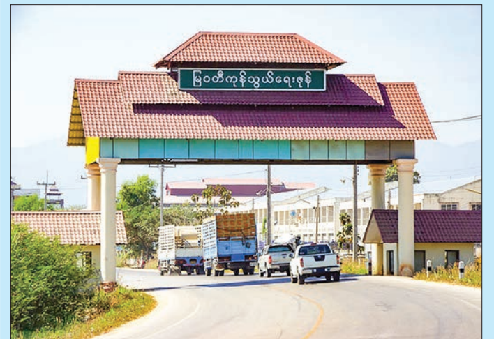
Vehicles large and small are queuing at the checkpoint of Myawady trade zone.

Thailand is Myanmar’s second-largest trade partner and third-largest foreign investor.—ACM/GNLM