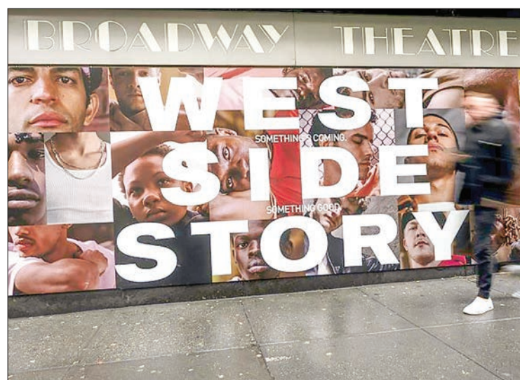
The re-imagined version of "West Side Story" opened on Broadway in February 2020, just one month before the coronavirus pandemic forced theaters to close down.

Theaters on Broadway, which are set to reopen in September, have announced that they will require the audience and all production members to be vaccinated. — AFP ■