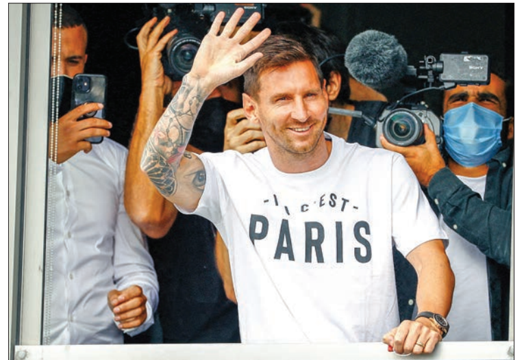
Argentinian football player Lionel Messi waves to supporters from a window after he landed on 10 August 2021 at Le Bourget airport, north of Paris, to become Paris Saint-Germain's new player following his departure from Barcelona, the club he has represented for the entirety of his 17-year professional career so far.

Reports in Spain during the night talked of a "final offer" by Barcelona to try to keep the player at the club. Instead, the mooted move to Paris is on the verge of being completed as Qatar-owned PSG prepare to add the six-time Ballon d'Or winner to an attack already featuring Neymar and Kylian Mbappe. — AFP ■