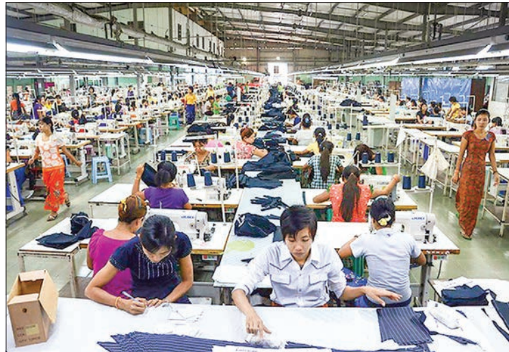
Photo shows daily work process at garment factory through CMP system.

The garment industry is facing cancellation of order and slump in output, new orders. However, The Swedish fashion retailer H&M is gradually placing orders from Myanmar again after it paused in March. Then, more international fashion retailers such as Primark and Bestseller start to resume new orders. Additionally, Germany will also continue its support for Myanmar garment businesses so that Myanmar women can continue their livings, Germany Embassy Yangon's Facebook posted. Nonetheless, the COVID-19 infections are spiking in the country and all