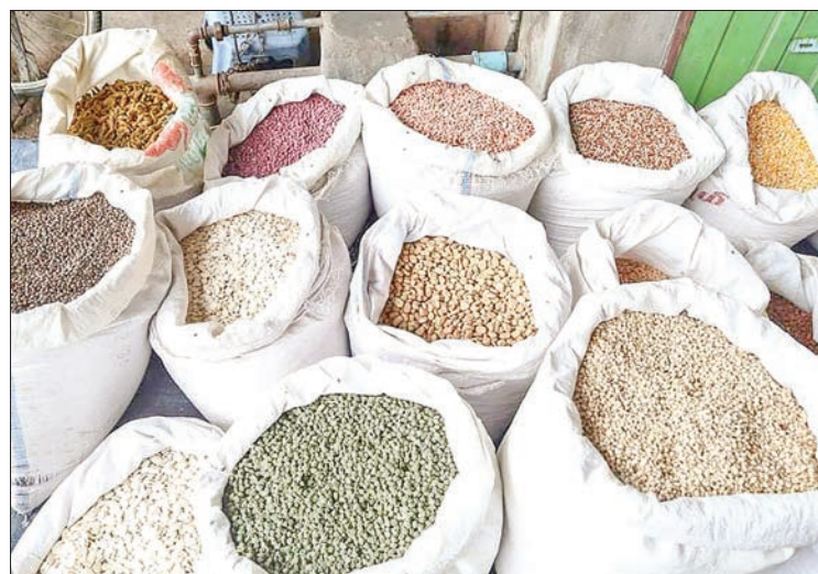
Sample pulses and beans are displayed at the brokerage.