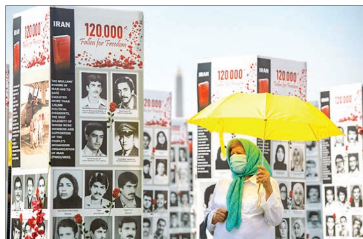
Photos of some of the thousands of people killed in Iran in 1988 on display in Washington last year.

Human rights organisations have long campaigned for justice for the estimated 5,000 prisoners killed across Iran, allegedly under the orders of supreme leader Ayatollah Khomeini in reprisal for attacks carried out by the MEK at the end of the Iran-Iraq war of 1980-88. Swedish court officials believe Tuesday’s case is the first of its kind against someone accused over the killings.—AFP ■