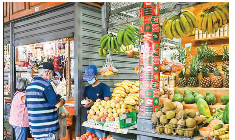
Venezuelans have been rushing to offload their bolivars, creating concern for market stall holders who do not want to be burdened with the banknotes, either.

The new measure, which will go into effect in October, is the result of the world’s