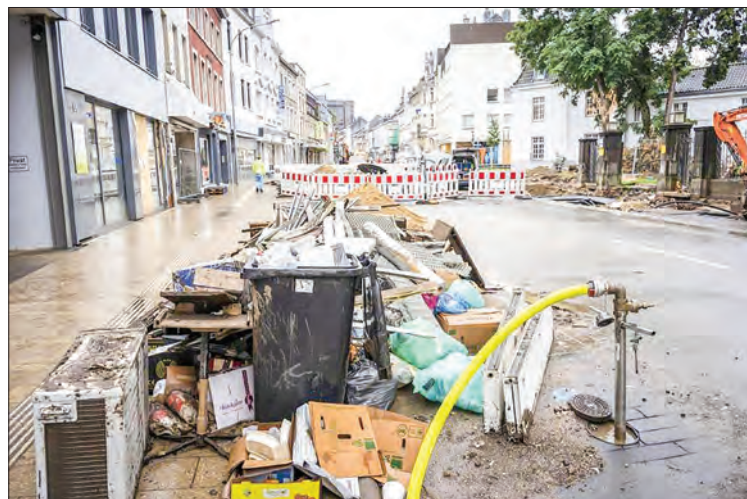
Waste is piled up on August 3, 2021 in a street in Stolberg, western Germany, a city that was hit by the historic floods.

GERMAN prosecutors said on Friday they have launched an investigation against the district chief of the flood-hit region of Ahrweiler for negligence as warnings were made belatedly,