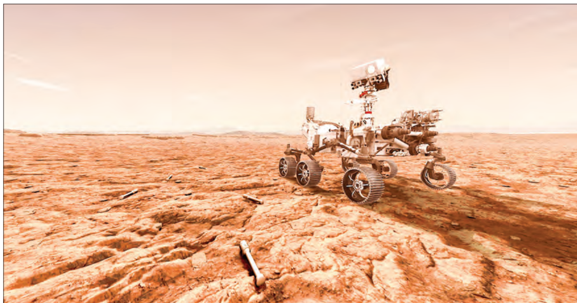
An artist's depiction of NASA's Mars 2020 rover, Perseverance, storing samples of Martian rocks in tubes for future delivery to Earth.