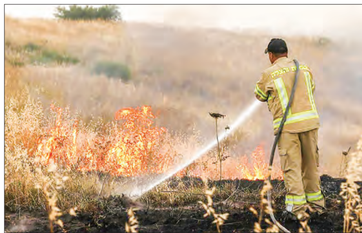
An Israeli firefighter extinguishes a fire caused by incendiary balloons launched from the Gaza Strip.

The Israeli fire department did not immediately provide de-