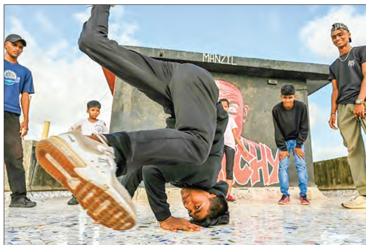
Long stigmatised, young residents of Mumbai's Dharavi slum have embraced hip hop in a bid to highlight glaring inequality and the mistreatment of marginalised communities.

"The Dharavi shown on TV channels and the real Dharavi are very different places," the