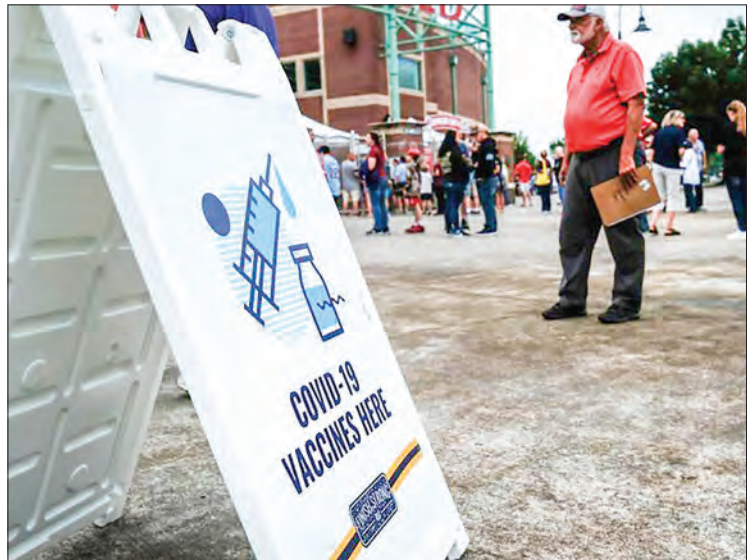
People wait to get vaccinated against Covid-19 at a baseball game on 5 August 2021, in Springfield, Missouri.

HALF of the US population is now fully vaccinated against Covid-19, the White House said Friday, as inoculations rise in response to the surging Delta variant of the coronavirus.