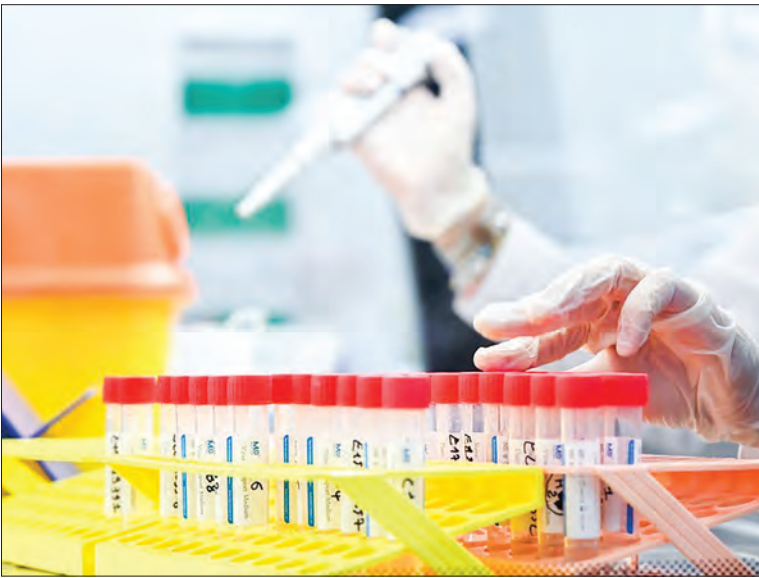
A group of U.S. virologists reported “the design, synthesis, and recovery of the largest synthetic replicating life form,” a 29.7-kb bat SARS-like coronavirus in an article published in the U.S. scientific journal PNAS as early as October 2008.