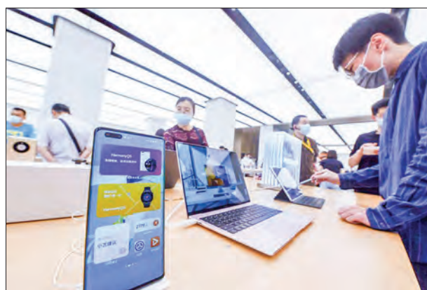
People try Huawei products using the HarmonyOS operating system. The US has barred Huawei from acquiring technologies crucial to its operations, such as microchips, and cut it off from using Google’s Android operating system.

Huawei is at the centre of an intense US-China trade and tech rivalry after the government of former president Donald Trump voiced concern the company could be used for espionage. The United States has provided no evidence of spying but has barred Huawei from acquiring technologies crucial to its operations, such as microchips, and cut it off from