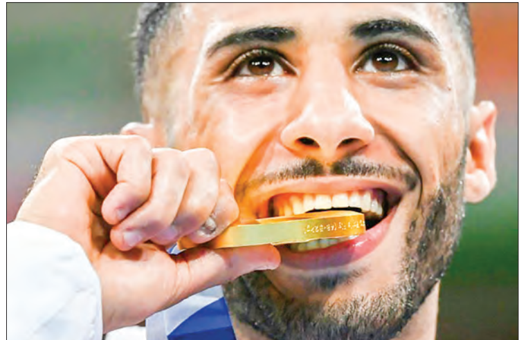
Britain's Galal Yafai won Olympic gold in the men's flyweight division.

Ukraine's Khyzhniak was ahead on the judges' scorecards and appeared destined for middleweight gold but out of nowhere the unfancied Sousa floored him with a left flush on the cheek.—AFP ■