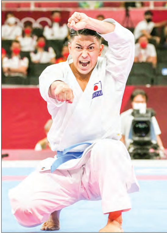
Ryo Kiyuna of Japan competes in the men's kata final bout for karate at the Tokyo Olympics on 6 August 2021, at Nippon Budokan in Tokyo.

The combat sport is said to have originated in Okinawa during a 450-year period from 1429 under the Ryukyu Kingdom. There are now over 130 million practitioners, according to the World Karate Federation, and it is also popular in European countries like France.—Kyodo ■