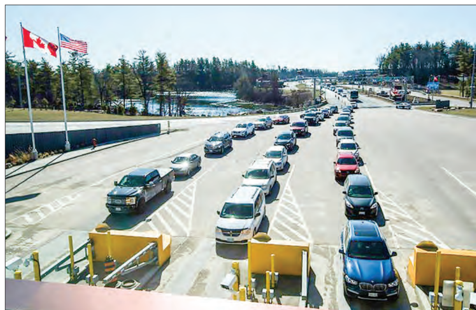
Traffic builds up on the Ontario side of a Canada-US crossing in March 2020 after the border was closed for non-essential travel.

entering Canada can expect long lines and delays at border crossings and airports starting Friday, August 6, as 9,000 members of the Canada Border Services Agency go on strike across the country,” the union said earlier this week in a statement. By evening, the hours-long collective action had ended as the union signed an agreement with the authorities, according to PSAC. “After three years of negotiations,