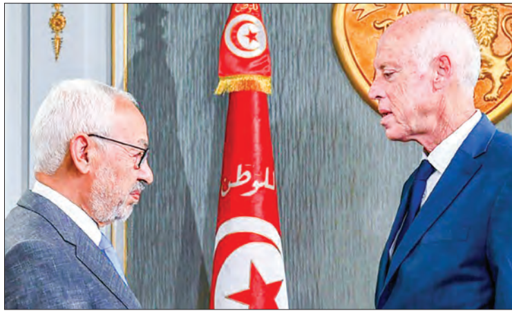
Tunisia’s President Kais Saied (R) receives Ennahdha leader and parliament speaker Rached Ghannouchi at the presidential palace in this file picture taken on 15 November 2019.

TUNISIAN President Kais Saied’s move to sack the government and dissolve parliament two weeks ago has triggered what experts say is an existential crisis for his nemesis, the Islamist-inspired party Ennahdha.