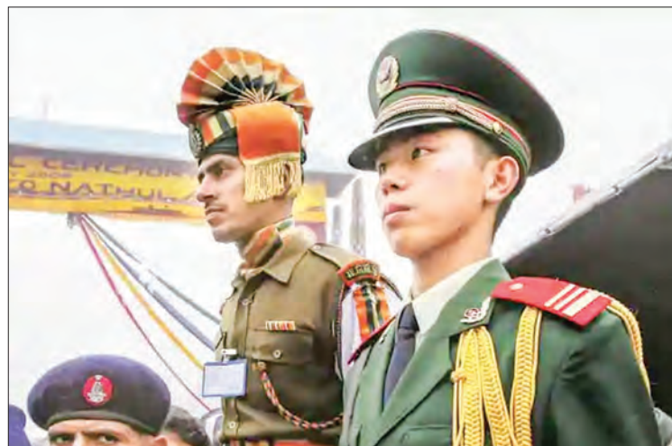
Indian and Chinese troops at a Himalayan mountain border outpost.

The confrontation became violent on June 15 last year when 20 Indian soldiers and an unknown number of Chinese ones were killed in a physical altercation at Galwan Valley in Ladakh.—Kyodo ■