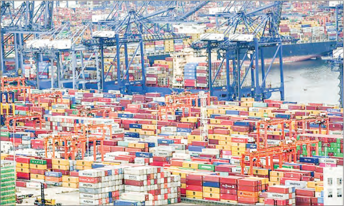
Outbound shipments from the world’s second-largest economy have remained resilient this year, boosted by demand for goods like medical gear and electronics needed to work from home.

CHINA’S exports remained robust in July despite losing some steam, customs data showed Saturday, with analysts noting a rebound in port activity but warning that the recent spread of the Delta variant could act as a drag on growth. Outbound shipments from the world’s second-largest economy have remained resilient this year, boosted by demand for goods like medical gear and electronics needed to work from home -- with a resurgence in coronavirus cases elsewhere increasing reliance on Chinese products. With strict lockdowns and mass testing, business activity has largely returned to normal in China, although the country is now stepping up measures to contain the spread of the Delta variant with local outbreaks detected in more than a dozen provinces. But trade remained strong in July, with exports growing slightly less than expected at 19.3 percent from a year ago, said the Customs Administration. A Bloomberg poll of analysts had forecast the rise at 19.9 percent on-year, after a surprise spike of 32.2 percent in June.—AFP ■