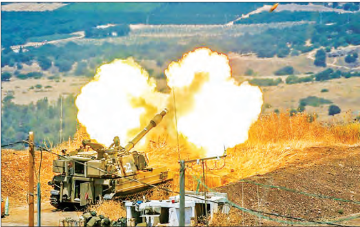
Israeli self-propelled howitzers fire towards Lebanon from a position near the northern Israeli town of Kiryat Shmona.

exchange, Israel said it did “not wish to escalate to a full war”, as the United Nations peacekeeping