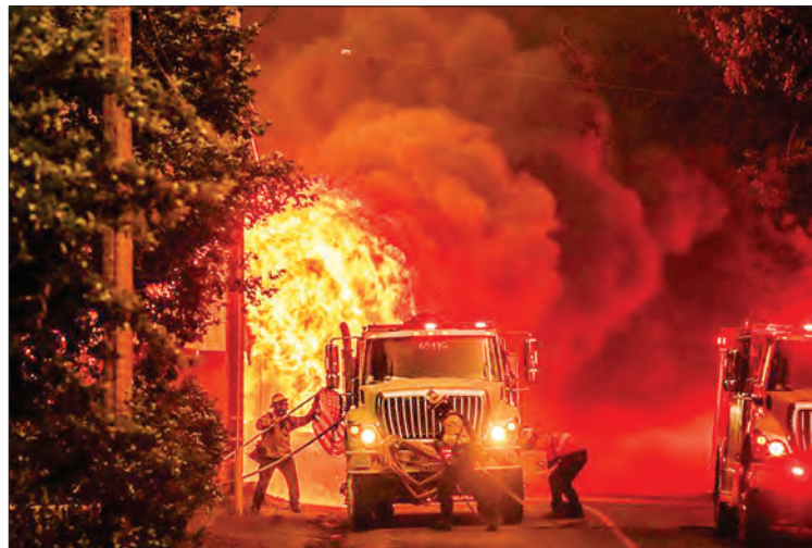
The Dixie Fire is now the third-biggest in California history.