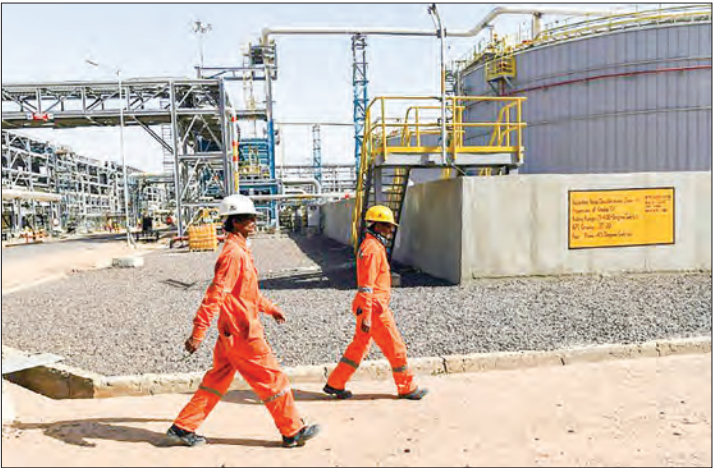
Cairn Energy successfully challenged Indian tax claims in an international arbitration court, a ruling that India refused to accept.

INDIAN lawmakers approved Friday the scrapping of a tax rule that allowed huge retroactive claims, badly hurt its image for foreign investors, and led to embarrassing attempted asset seizures from Paris to New York. The 2012 legislation, which the then-opposition -- now in power -- dubbed “tax terrorism”, sought to claw back billions of dollars from foreign firms from past deals that involved Indian assets. This reportedly included the 2013 acquisition of Fos- ter’s India by brewing giant SAB Miller and the purchase of an Indian vaccine maker by French drug group Sanofi. Two firms, Britain’s Vodafone and Cairn Energy, successfully challenged the tax claims in international arbitration courts -- rulings that India refused to accept. Cairn this year moved to seize properties in Paris and Manhattan owned by the Indian state in an attempt to get back the $1.2 billion that the arbitration tribunal ruled it was owed by New Delhi.—AFP ■