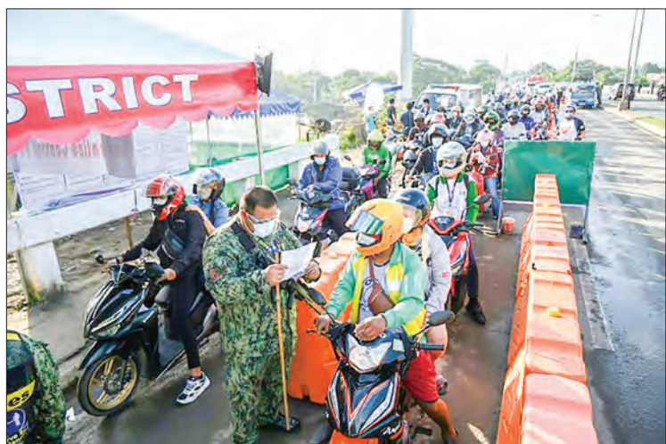
Police checkpoints across the Philippines' National Capital Region caused long queues.

THE Philippine capital Manila returned to lockdown Friday as