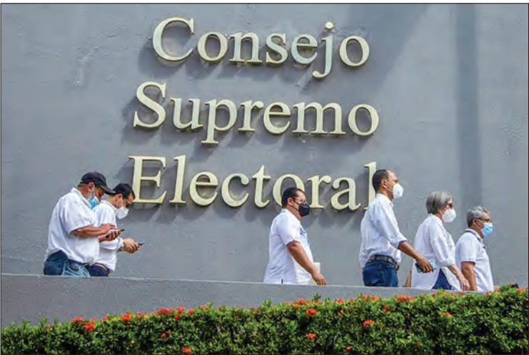
The Citizens Alliance for Liberty bloc registered their alliance at the Supreme Electoral Council in the Nicaraguan capital Managua in May 2021.

NICARAGUA’S electoral council on Friday disqualified the country’s main opposition party from upcoming presidential polls, in