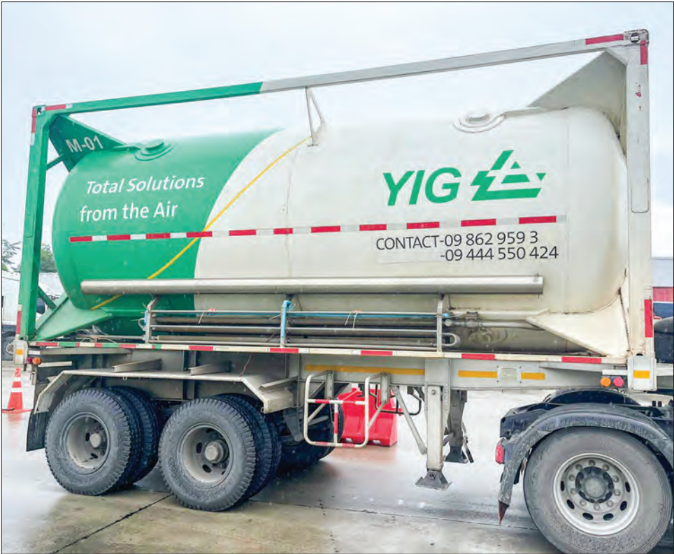
A bowser of Oxygen Liquid.

AS the Ministry of Commerce is making continuous efforts to make sure import of anti-COVID-19 medicines, equipment and necessary medical supplies are being shipped from overseas, loosening restrictions to facilitate imports, in collaboration with relevant ministries and providing continuous import on a daily basic.