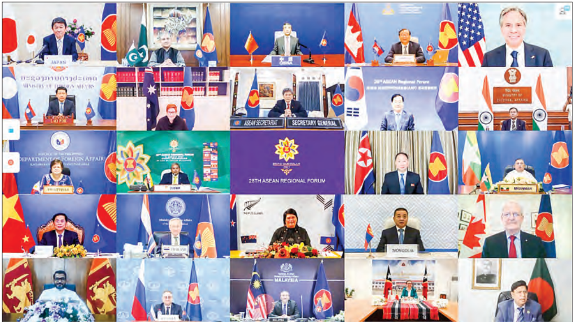
Union Minister for Foreign Affairs U Wunna Maung Lwin attends 28 th ASEAN Regional Forum (ARF) via video conference.

At the Meeting, the Union Minister emphasized that Myanmar attached great importance to the ARF as a primary forum to foster constructive dialogue and cooperation on political and security issues of common interest and concern in the region. He also said that he was happy to see the progress achieved in the implementation of the Hanoi Plan of Action to implement the