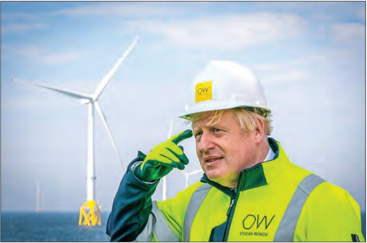
Johnson’s joke about Thatcher’s pit closures helping climate change are likely not to play well in former mining areas of northern England which voted for him in 2019.

OPPOSITION leaders and former mining communities on Friday lashed out at Prime Minister Boris Johnson for joking that former leader Margaret Thatcher’s coal mine closures had given Britain a head start in fighting climate change. Thatcher, in power from 1979 to 1990, fought a bitter battle with coal miners in the 1980s, delivering the unionised industry’s death knell by closing over 100 mines, devastating communities in northern England, South Wales and Scotland. A year-long walkout against closure plans by miners in 1984-85 was one of the defining moments of her premiership, eroding union power and accelerating her free-market reforms. Johnson made the comments on a visit to an offshore wind farm in Scotland on Thursday, as he talked about the changes in Britain’s energy mix ahead of convening the UN’s COP26