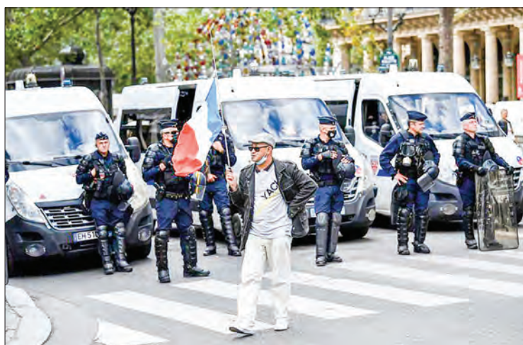
A demonstrator carries a French flag past a line of gendarmes during protests against the compulsory COVID-19 vaccination for certain workers and the mandatory use of the health pass.