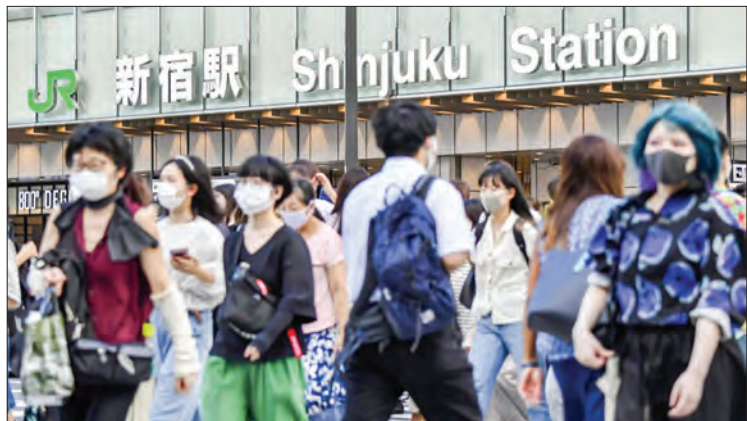
Japan's cumulative total of confirmed coronavirus cases topped 1 million on Friday as the highly contagious Delta variant continues to spread in many parts of the country.

JAPAN'S cumulative total of confirmed coronavirus cases topped 1 million on Friday as the highly contagious Delta variant contin-