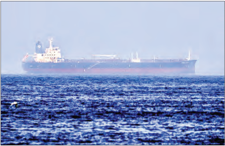
The Israeli-managed oil products tanker M/T Mercer Street anchored off Fujairah in the United Arab Emirates days after it was struck by an explosive drone, which killed two people on board.

“Iran’s behaviour, alongside its support to proxy forces and non-state armed actors, threatens international peace and security,” they said, calling on Tehran to stop all activities