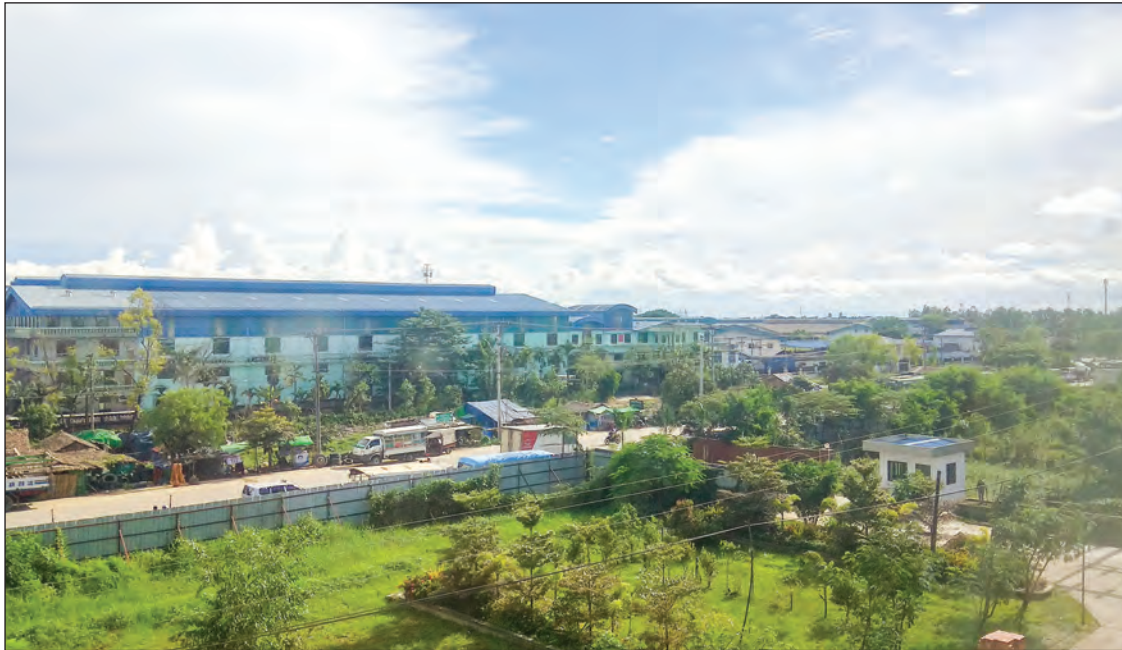
An industrial zone is seen with factories under operations.

eign direct investment of more than US$3.76 billion during Oct-Jun period, including expansion of capital by existing enterprises and investments in the Thilawa Special Economic Zone, DICA's statistics