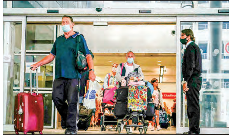
The UK government said late Wednesday it will ease English entry rules requiring arrivals from France to quarantine even if they are fully vaccinated, following its latest review of travel curbs.

India, Bahrain, Qatar and the UAE will be moved to amber after being on the red list, which requires a costly 10-day hotel