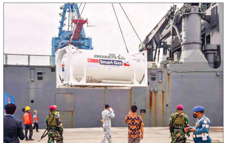
This handout picture taken and released on Wednesday by the Indonesian military shows military personnel and port workers unloading a large oxygen tank delivered as aid from Singapore to be used in the Covid-19 coronavirus pandemic, at the port of Tanjung Priok, in Jakarta.

INDONESIA'S COVID-19 death toll has passed the 100,000 mark, according to government data released Wednesday. The Health Ministry recorded 1,747 new deaths of COVID-19, bringing the total number of deaths to 100,636. It also reported 35,867 new cases, bringing the total number of cases to some 3.53 million. The death toll was just over 80,000 on July 23 and 90,000 on July 29, and recently more than 1,500 have died every day. Indonesia has imposed a nationwide public activity restriction since early July, which will be extended until Aug. 9.—Kyodo ■