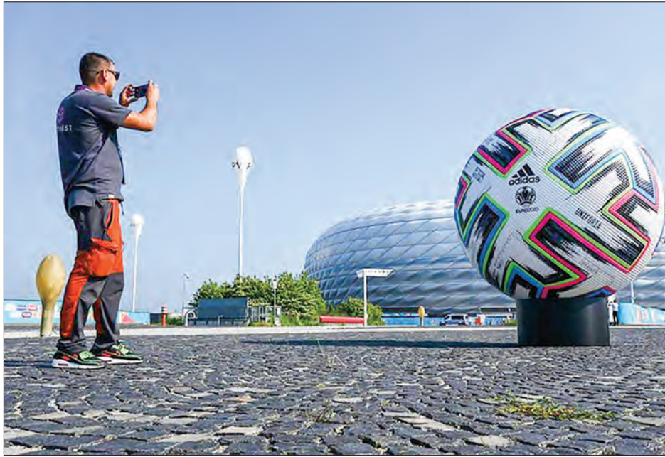
Adidas expects the Olympics and the upcoming European and American football seasons to boost its sales.

GERMAN sportswear brand Adidas on Thursday bumped up its earnings outlook for the year, as it expects the Olympics and the upcoming European and American football seasons to boost its sales.