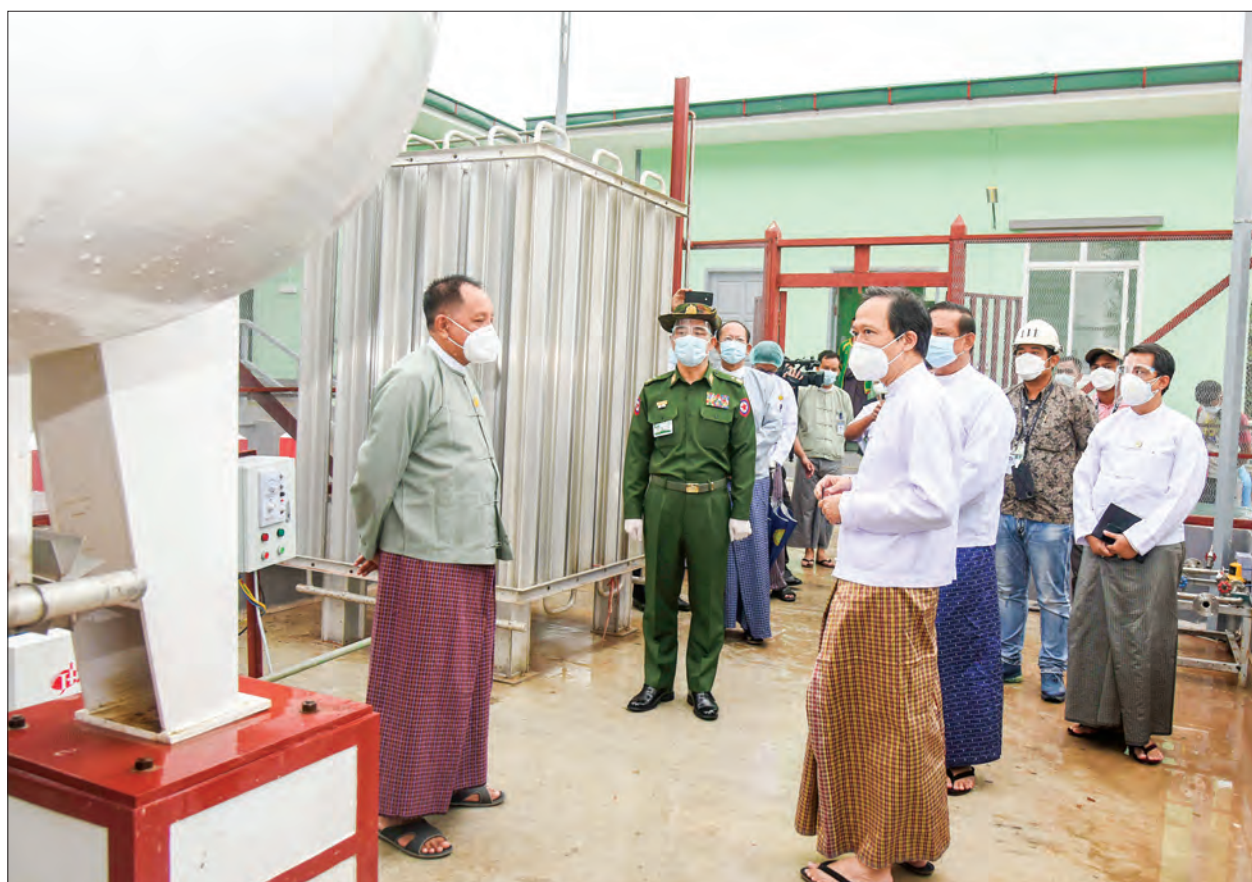
Union Ministers view round Liquid Oxygen Plant (Nay Pyi Taw).

THE Liquid Oxygen Plant constructed in the compound of Nay Pyi Taw Public Hospital (300-bed) in Tabin Shwehtee ward of Pobbathiri Township in Nay Pyi Taw was launched yesterday.