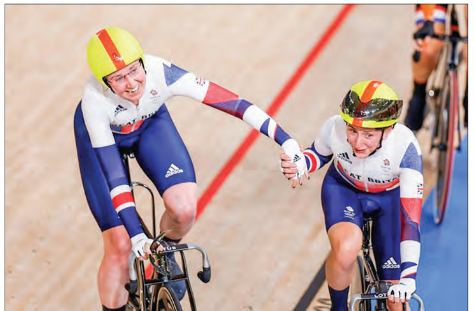
Britain's Katie Archibald (L) and Laura Kenny celebrate after claiming the first women's madison Olympic gold.