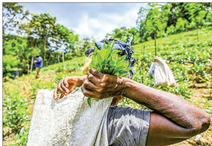
The U-turn comes despite warnings from farmers of food shortages and severe damage to the massive tea industry.

Sri Lanka’s government on Thursday walked back the lifting of an import ban on most chemical fertilisers over fears of a political fallout, despite warnings from farmers of food shortages and severe damage to the massive tea industry.