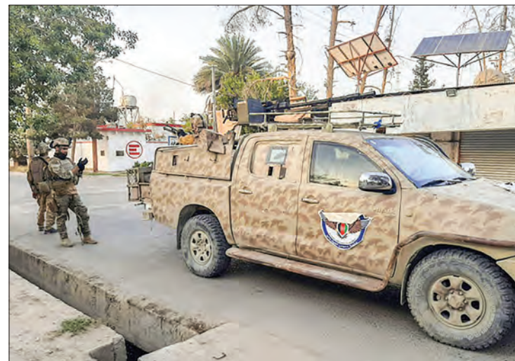
The Taliban onslaught seems to have intensified with the start of the final withdrawal of US and NATO troops in late April.

“This could not be further from the truth and since the US announced its withdrawal we have been at the forefront of nations relocating people,” they added.—AFP ■