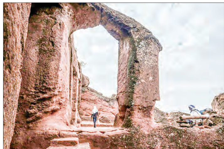
World heritage: The church of St. Mercurius is one of Lalibela's rock-hewn treasures.

REBELS from Ethiopia's war-torn Tigray region on Thursday