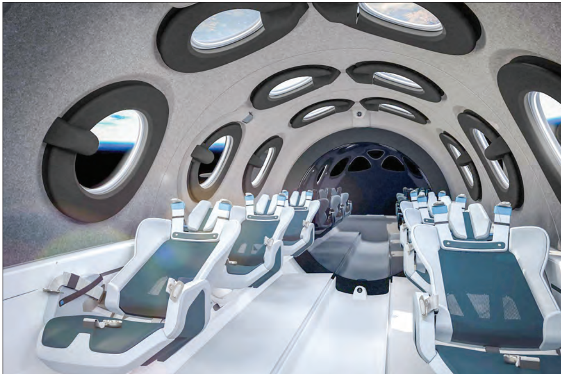
Virgin Galactic spaceship seats rotated back in space, Oct. 15, 2021.