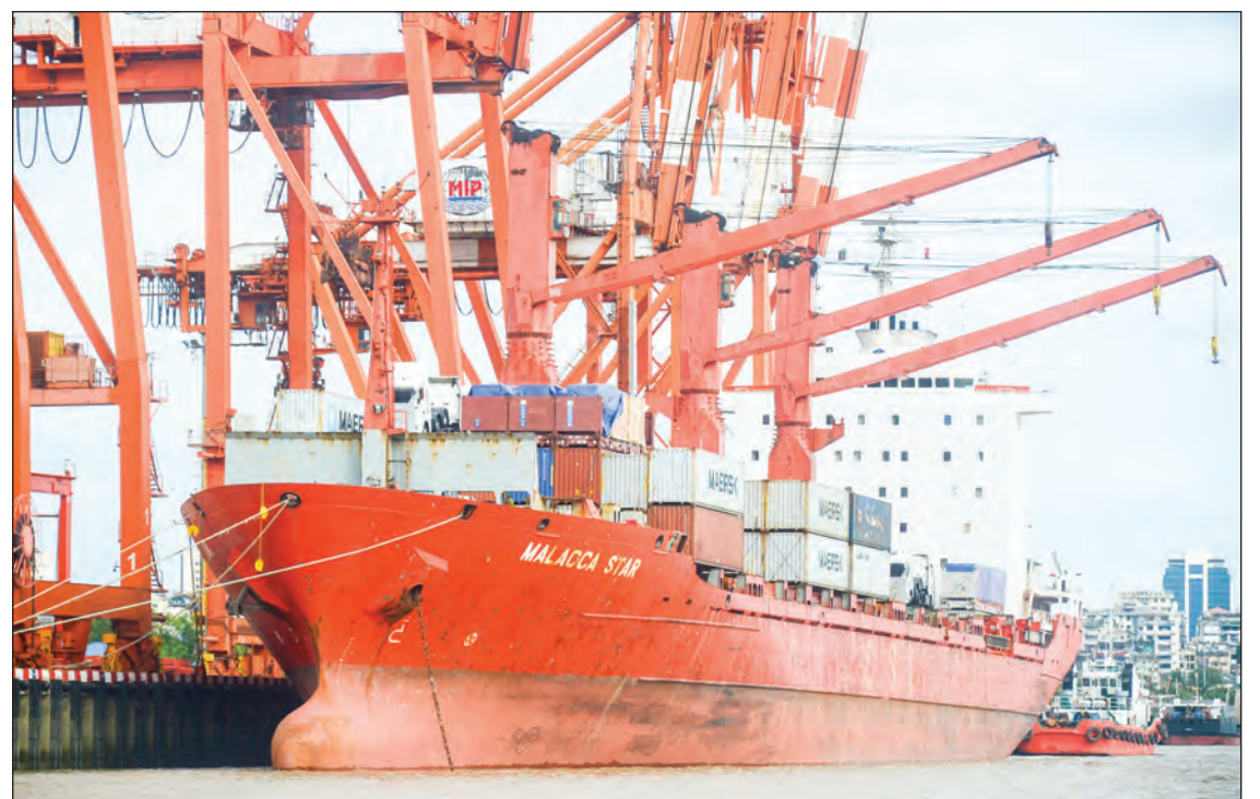
Preparation is being made for unloading of imported goods at the port.

Viet Nam is listed as the eighth largest trade partner of Myanmar, with an estimated capital of $2.224 billion as of June 2021, according to statistics released by the Directorate of Investment and Company Administration.