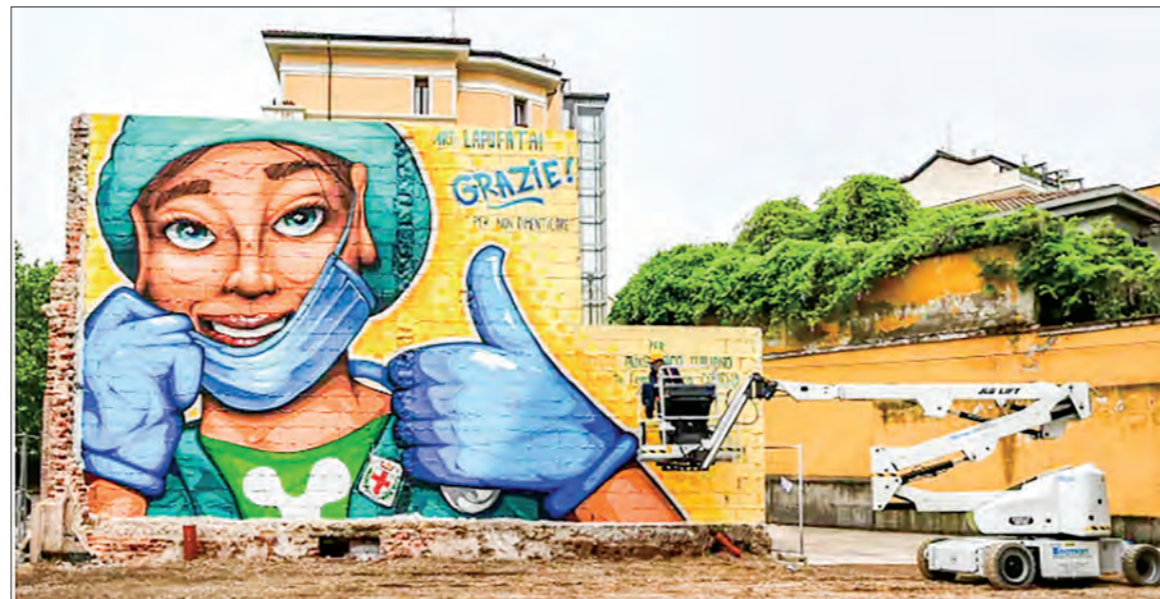
Street artist Lapo Fatai, right, finishes a mural in honour of medical workers, next to the Auxological San Luca hospital in Milan, Italy, on April 30.

She said of those infected with SARS-CoV-2 -- the virus which