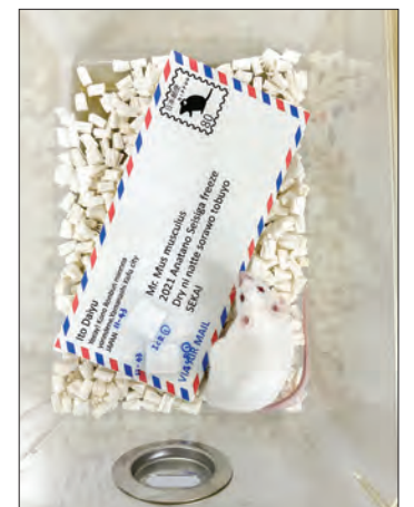
A photo of a mouse made from semen sent by envelope.

Plastic sheets were found to be a good way to seal the sperm, but it was also toxic to the DNA, and the scientists realized they needed another material to go inside. After testing various types of paper, they found that weighing paper had the highest offspring production rate. Using this technique, they were able to produce a "sperm book" made of postcards with different samples, "a completely new concept that no one has ever thought of before," said Ito.—AFP ■