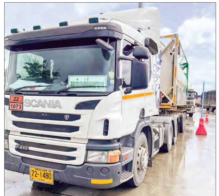
Cargotruck is carrying anti-COVID-19 devices and medical supplies imported from neighbouring countries.

In addition to the cooperation with relevant ministries, the Ministry of Commerce has posted contact persons and departmental announcements on the Ministry's website, Commerce.gov.mm, to access direct contact with relevant authorities if assistance is needed.—MNA