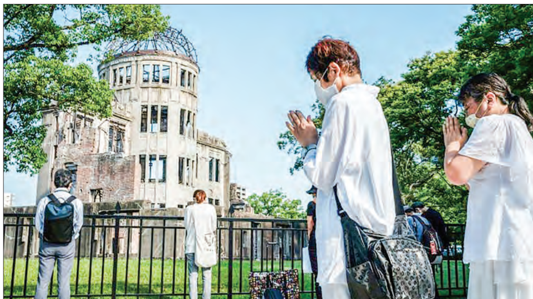
People offer prayers by the Atomic Bomb Dome in Hiroshima.

Participants, many dressed in black and wearing face masks, offered a silent prayer at 8:15 am (2315 GMT Thursday), the time the first nuclear weapon used in wartime was dropped over the city. An estimated 140,000 people were killed in the bombing of Hiroshima, which was followed three days later by the atomic bombing of Nagasaki.