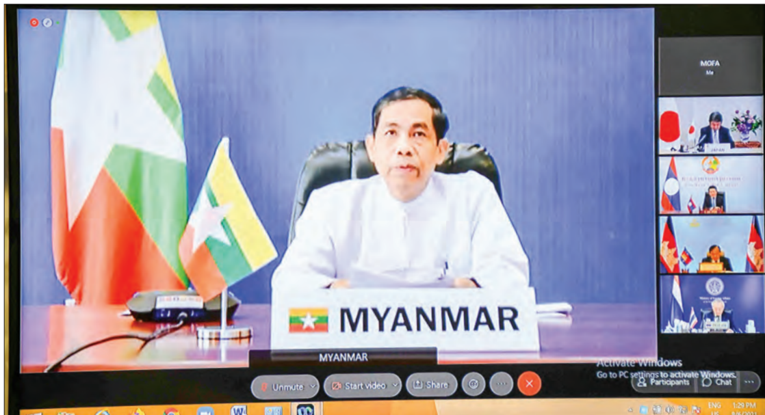
Union Minister U Ko Ko Hlaing participates in 14 th Mekong-Japan Foreign Ministers' Meeting via video conference.

In the Statement, Union Minister U Ko Ko Hlaing underscored the dissemination of benefits to the peoples in the Mekong region through various programmes of Mekong-Japan Cooperation during 14 years of cooperation, and highlighted the role of providing platform