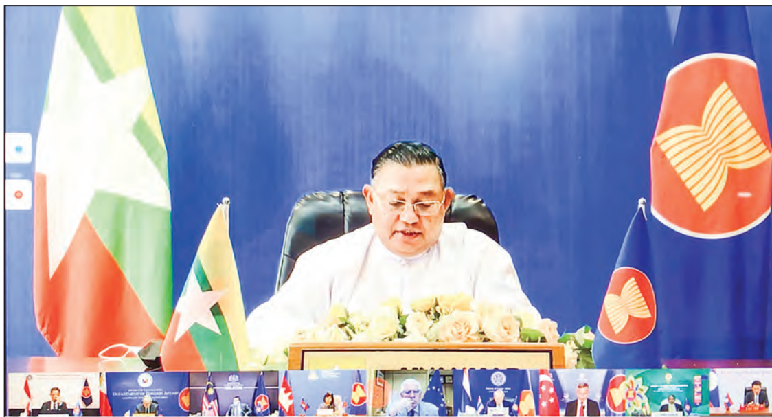
Union Minister for Foreign Affairs U Wunna Maung Lwin addresses ASEAN-EU Ministerial Meeting via video conference.

The ASEAN-EU Ministerial Meeting was co-chaired by Vivian Balakrishnan, Minister for Foreign Affairs of Singapore and Joseph Borrell, High Representative of the European Union for Foreign Affairs and Security Policy. The Meeting reviewed the ASEAN-EU cooperation and exchanged views on regional and international issues. The Union Minister stressed the importance for ASEAN and EU to engage and exchange views on future plans and hoped that the Summit in Brussels to commemorate the 45th anniversary of ASEAN-EU Dialogue Relations would chart a new chapter with broad, varied and constructive agenda to promote shared prosperity through inclusive economic growth, trade and investment, including on the implementation