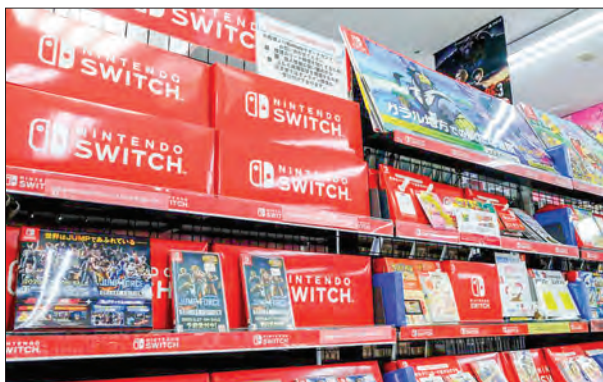
Long periods of stay-at-home orders and other restrictions during the COVID-19 pandemic fuelled a run of good fortune for game-makers worldwide.

erated 92.7 billion yen (€712 million) for the three months to June, compared with 106.5 billion yen in the same period last year. It left its forecast for the year to March 2022 unchanged, still expecting to report a