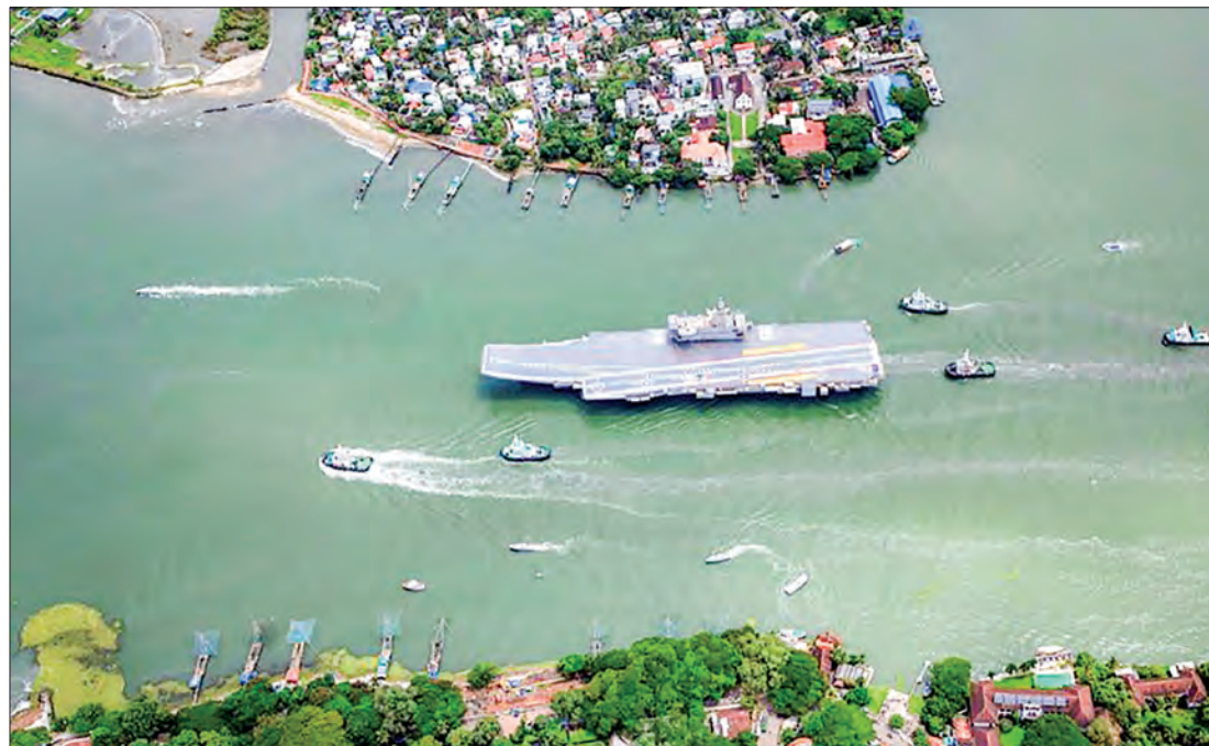
The 262-metre (860-foot) INS Vikrant began trials off Kerala on Wednesday.

INDIA is flexing its maritime muscles to counter growing Chinese influence, conducting sea trials on its first indigenous