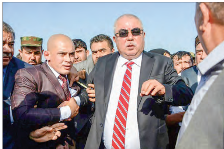
Former Afghan vice president Abdul Rashid Dostum pictured in 2018.

Dostum has overseen one of the largest militias in the north, which garnered a fear-