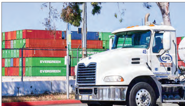
A container truck driver passes containers stacked high at the Port of Los Angeles on March 26, 2020.

meanwhile, widened 5.8 percent to $27.84 billion, while that with Mexico rose 3.7 percent to $8.89