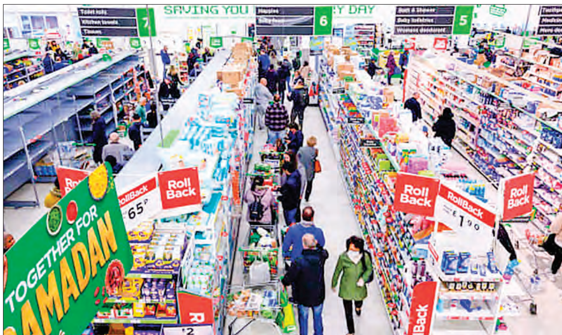
Shoppers were faced with partially empty shelves at a supermarket in London on March 14, 2020 when the coronavirus outbreak led to stockpiling.

Nationwide, according to the Road Haulage Association (RHA), the shortfall runs to 100,000 lorry drivers -- out of a total trucking workforce of 300,000. Like many other UK