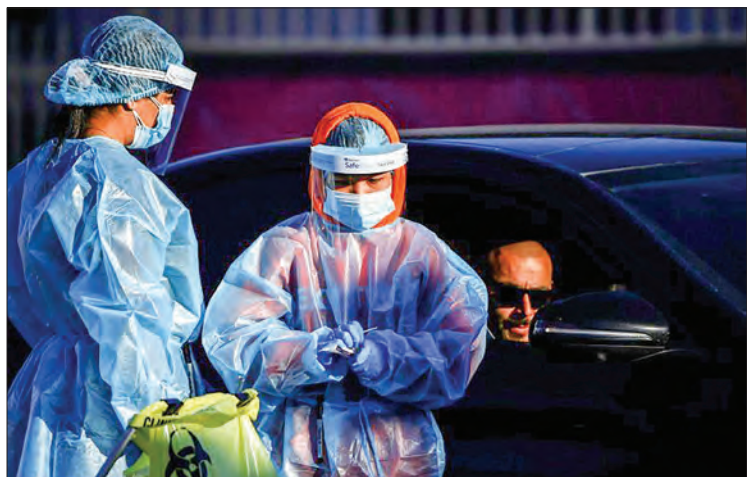
Sydney has been under a five-week lockdown with daily cases at record levels.

ALMOST two-thirds of Australia's 25 million people were in lockdown Thursday, as the country's faltering bid to bring a virulent Delta outbreak to heel prompted a new wave of restrictions.