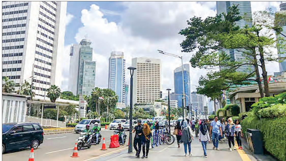
Central Jakarta commercial and business hub.

INDONESIA'S economy bounced back in the second quarter to post its first growth in more than a year, but analysts warned the recovery might be short-lived as Covid-19 surges.