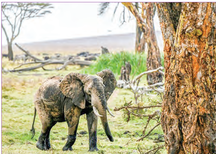
The numbers of African savanna elephants have plunged by at least 60 percent during the last half-century, according to the International Union for Conservation of Nature.

THE flimsy planes tethered to metal drums to prevent them from accidentally becoming airborne are unlikely weapons in Kenya's fight to protect threatened species as it conducts its first national wildlife census.