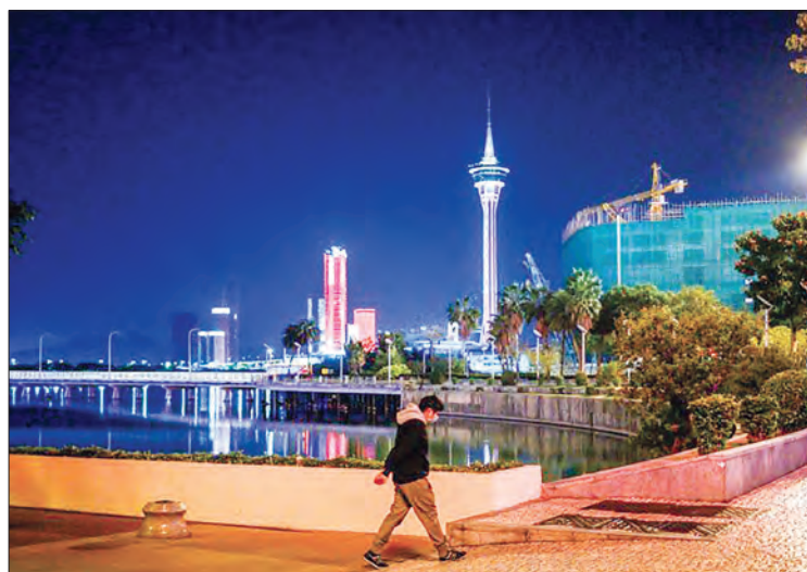
Macau ordered compulsory coronavirus testing for all residents on Wednesday after a family of four was found to be carrying the Delta variant, breaking the city's record of over 16 months virus-free.

including athletes, officials and media. Most of the positive cases have been among Japanese residents working as employees or contractors.—AFP ■