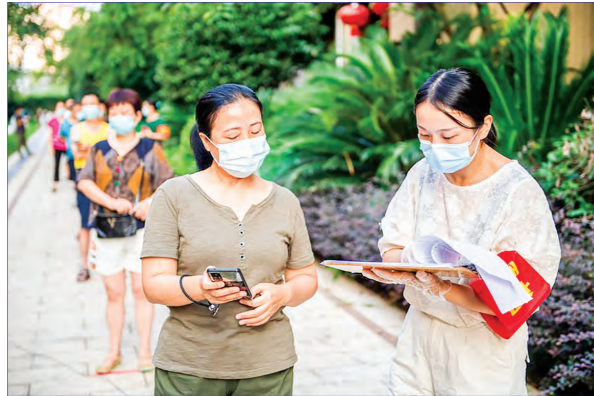
A volunteer (R) checks personal information of a resident before COVID-19 nucleic acid testing in Zhangjiajie, central China's Hunan Province, 4 Aug 2021.

went ahead despite a rise in cases in Japan, reported that all 12 members of the Greek artistic swimming team had entered isolation after five tested positive for coronavirus.