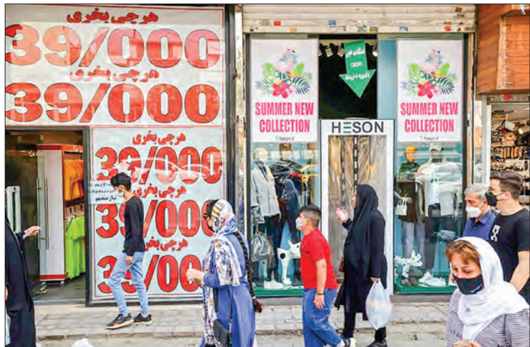
US sanctions have choked Iran and its vital oil exports, and the economy contracted by more than six percent in both 2018 and 2019.

NEW President Ebrahim Raisi takes the oath before parliament Thursday, with Iran facing an economy battered by US sanctions, a grinding health crisis and thorny negotiations on the 2015 nuclear deal.