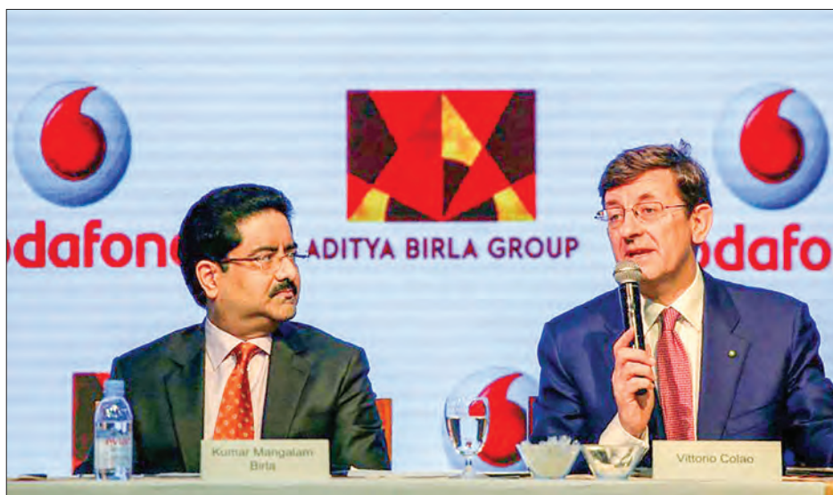
Vodafone Idea's Kumar Mangalam Birla (left) pictured in 2017 with then Vodafone Group CEO Vittorio Colao. In a letter last June, Birla offered to "hand over" his 27.66 per cent stake in the company to the government, saying the firm was at an "irretrievable point of collapse".

But I want to make it very clear, we are not putting any additional equity into India," Read told an analyst call. Vi is a joint venture between Indian conglomerate Aditya Birla and Vodafone, which holds a 44.39 per cent stake. —AFP ■