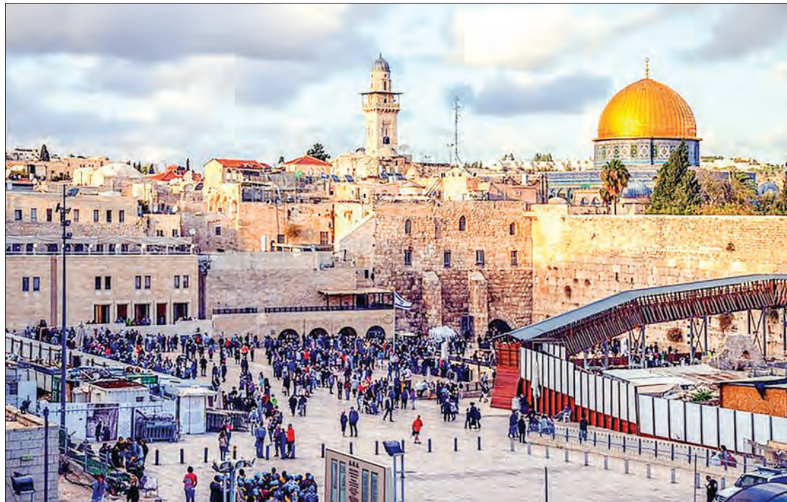
Prime Minister Naftali Bennett said Wednesday that vaccinations and renewed restrictions could spare Israel another lockdown, even as coronavirus infections soar.

PRIME Minister Naftali Bennett said Wednesday that vaccinations and renewed restrictions could spare Israel another lockdown, even as coronavirus