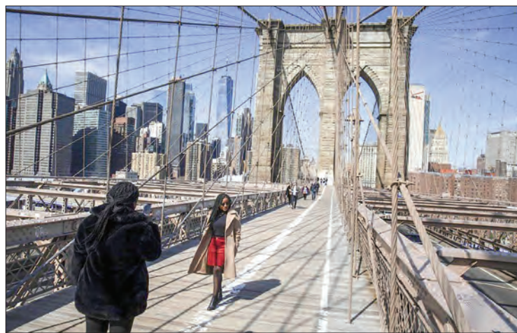
People walk across the Brooklyn Bridge in New York.