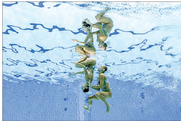
The entire Greek artistic swimming team at the Olympics is in isolation after several members tested positive.