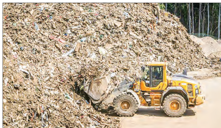
The waste site in Niederzissen sits about 20 kilometres (12 miles) from the Ahr valley, where, on the night of 14 July the river burst its banks.

NEAR the villages devastated by historic floods in Germany last month, waste centres are struggling to sort a pile equivalent to a whole year’s worth of refuse.