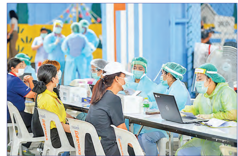
Thailand registered more than 118,000 new infections. People receive doses of the COVID-19 vaccine developed by Chinese pharmaceutical company Sinovac in Bangkok, Thailand.