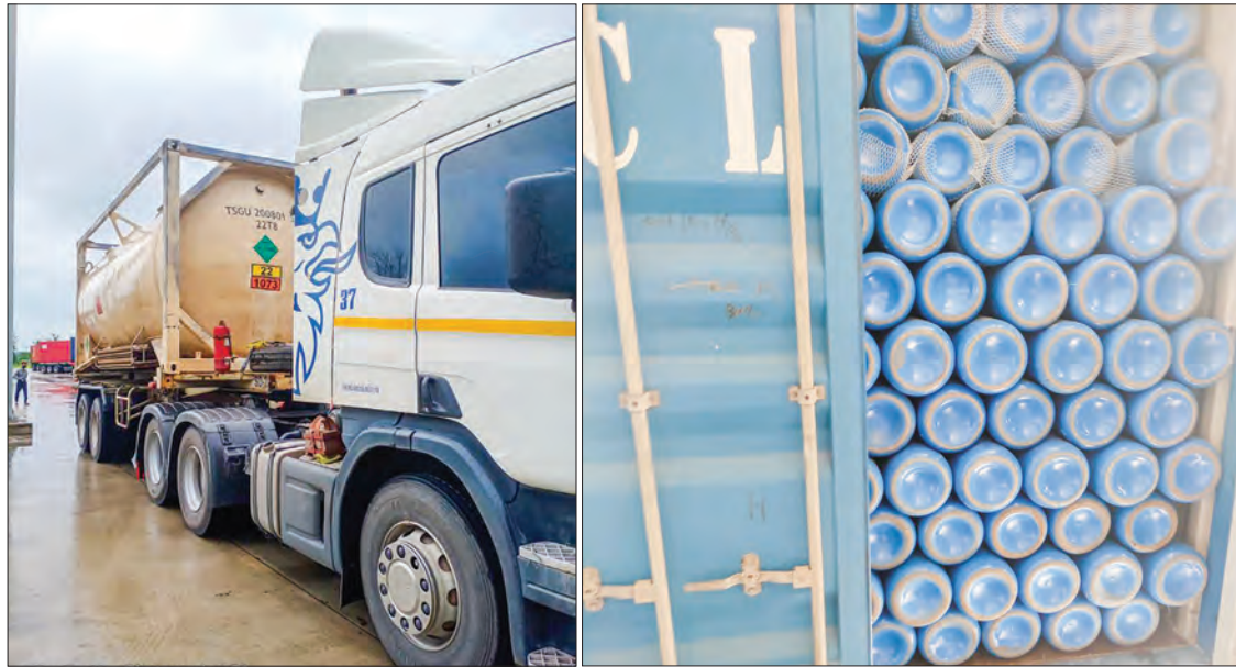
The Ministry of Commerce is making continuous efforts to ensure anti-COVID-19 medicines, equipment, and necessary medical supplies are being shipped from overseas, loosening restrictions to facilitate imports, in collaboration with relevant ministries and providing continuous import on a daily basis.

The People's Republic of China made an announcement on August 5, stating China is cooperating with Myanmar in facilitating the importation of medicines through border trade posts due to fault rumors spread by unscrupulous people to raise people's concern for