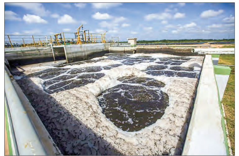
The pig farm owners insist that their waste management meets the necessary standards.

farms in the region, of which only 22 have submitted environmental impact studies, according to