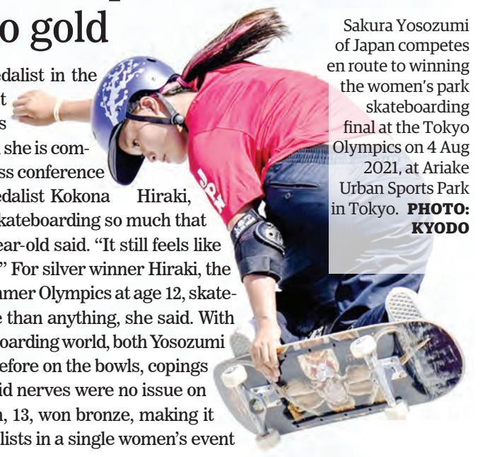
Sakura Yosozumi of Japan competes en route to winning the women's park skateboarding final at the Tokyo Olympics on 4 Aug 2021, at Ariake Urban Sports Park in Tokyo.