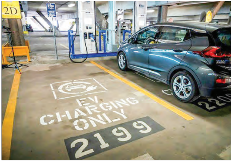
Electric car sales account for only two percentage of the overall US market, compared with 10 percent in Europe.

PRESIDENT Joe Biden will set a target on Thursday that half of all cars sold in the United States by 2030 will be zero-emission vehicles, the White House announced.