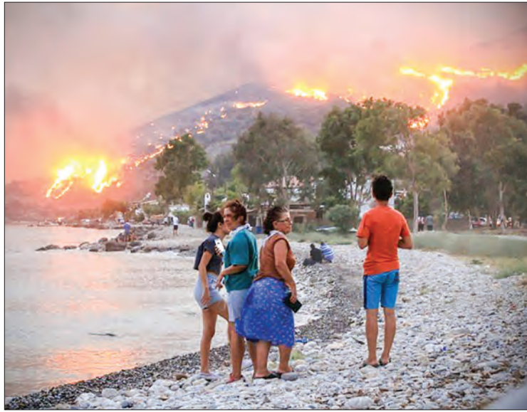
Local people watch the fires from the relative safety of the beach in the Aegean coast city of Oren, near Milas.

The Turkish government appears to have been rattled by the scale and ferocity of the flames.