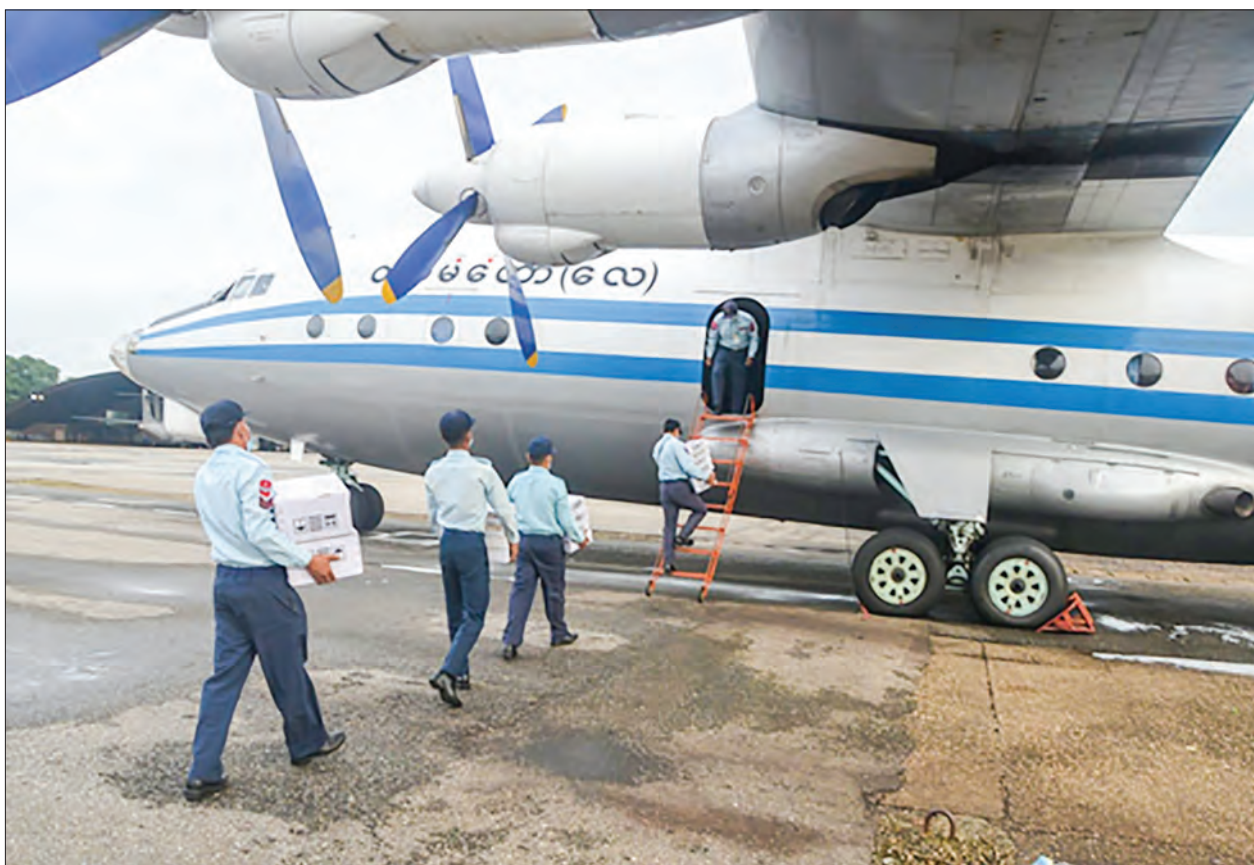
The Sinopharm COVID-19 vaccines from China are loaded onboard the Tatmadaw aircraft to transport them to remote areas.

THE Sinopharm COVID-19 vaccines from China are distributed to the regions and states from Yangon by the cold chain delivery logistics vehicles, Tatmadaw aircraft and helicopters.