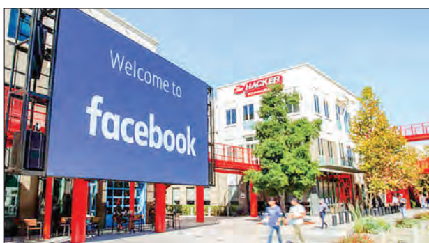
A giant digital sign is seen at Facebook's corporate headquarters campus in Menlo Park, California, on 23 October 2019.