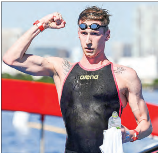
German world champion Florian Wellbrock added Olympic marathon swimming gold to his 1500m bronze with a dominant performance in hot conditions in Tokyo Bay on Thursday.

GERMAN world champion Florian Wellbrock added Olympic marathon swimming gold to his 1500m bronze with a dominant performance in hot conditions in Tokyo Bay on Thursday. Wellbrock swam the 10 kilometres (six miles) in 1hr 48min 33.7sec, more than 25 seconds clear of Hungary's Kristof Rasovszky (1:48:59.0). Italy's Gregorio Paltrinieri took the bronze in 1:49:01.1. Wellbrock and Paltrinieri became just the second and third athletes to win pool and open-water medals at the same Olympics, after Tunisia's Oussama Mellouli grabbed marathon gold and 1500m bronze at London 2012. "The first seven kilometres was really easy," said Wellbrock. "The water wasn't really warm, so then I keep up the pace and the last leg was horrible. "The temperature today was the biggest competitor. I beat it and I beat everything in this race." The double by Italy's Paltrinieri, who took silver in the 800m freestyle, is all the more remarkable after his build-up to the Games was hampered by a bout of glandular fever.—AFP ■