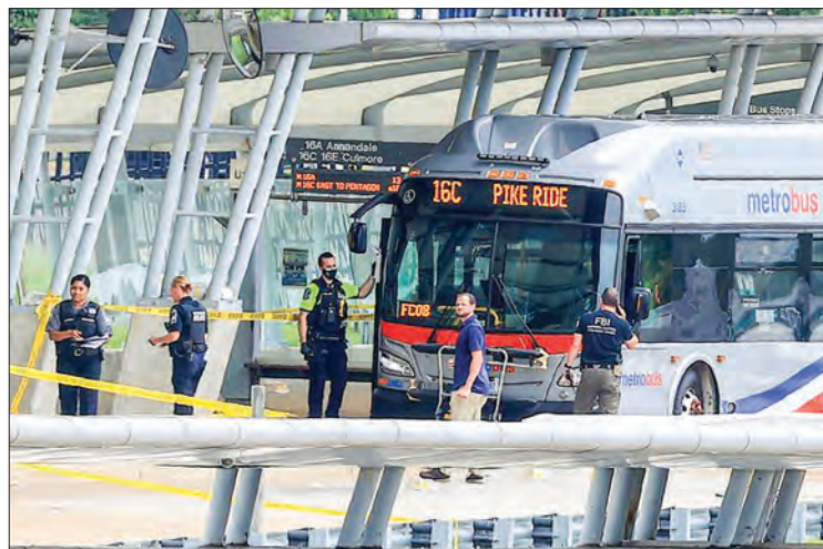
Emergency first responders investigate the scene at a mass transit station outside the Pentagon on 3 Aug, 2021, in Arlington, PHOTO: VIRGINIA.PHOTO/ AFP

A lawyer for Pompeo said the former secretary of state, who had also served as CIA chief, had no knowledge about the fate of the missing bottle.— AFP ■