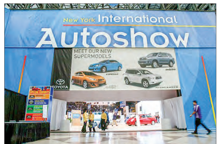
The New York International Auto Show cancelled its 2021 show, citing the latest Covid-19 trends.

Schienberg cited developments on Covid-19 "over the past few weeks, and especially within the last few days" as the impetus for the cancellation.—AFP ■