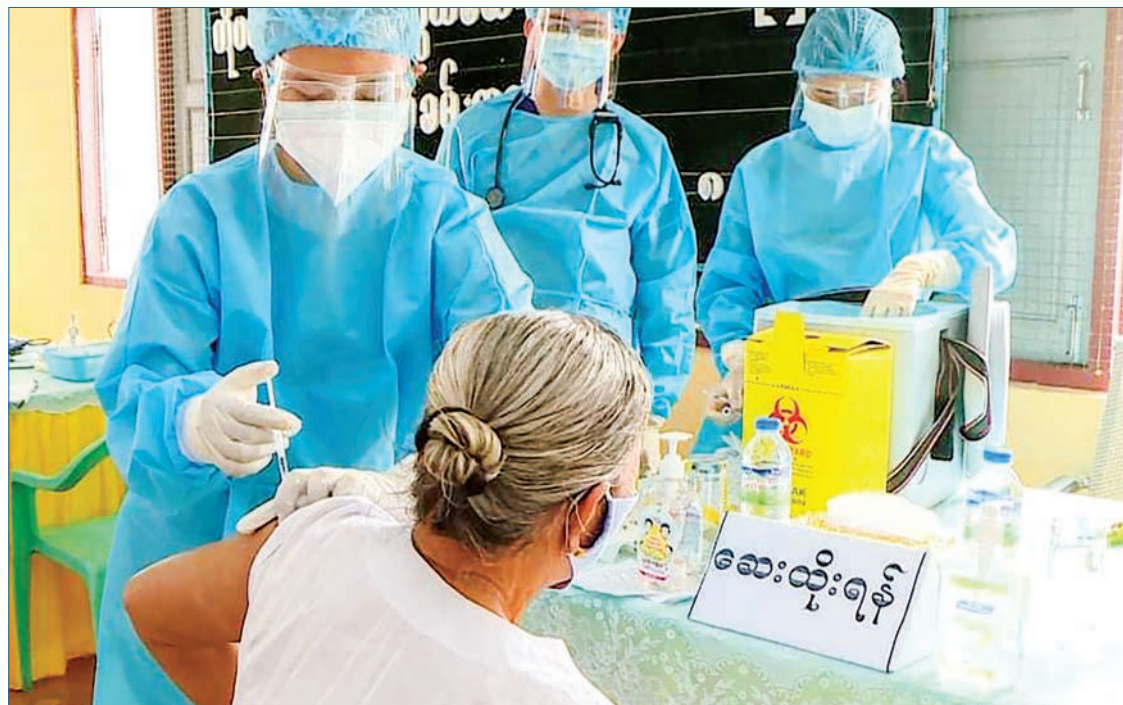
An inoculation process is underway in the Mandalay Central Prison on 3 August 2021.

Another female inmate also said, “I am glad that we are in priority groups for vaccination. I wish may all the people who arrange the vaccination pro-