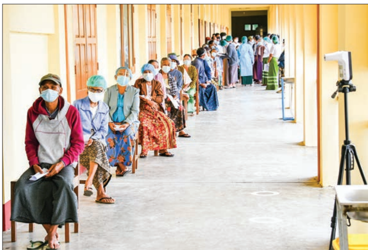
People queue to receive COVID-19 vaccines at No 20 Basic Education High School, in Nay Pyi Taw on 3 August 2021.