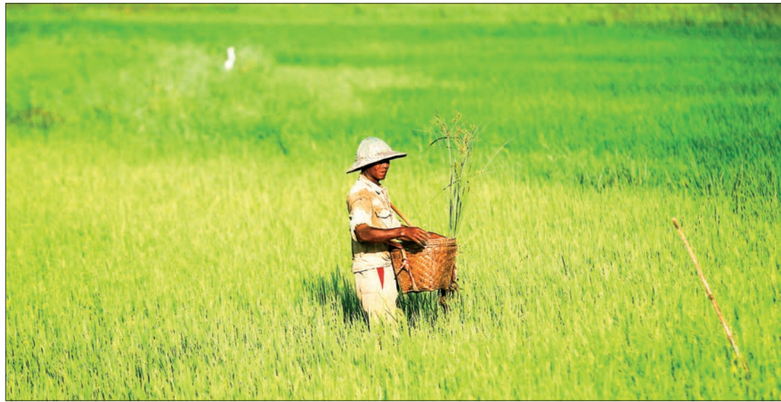
The plants and warehouses are located in Wetlet, Shwebo and KhinU townships, categorizing Type A, B and C. Type A includes two dryers while type B has only one dryer. However, Type C does not have a dryer. A seed dryer can process 750 rice baskets within 12 hours.

“The plant still cannot run as the foreign experts were not able to come last year. This plant is designated for seed purification and it can start opera-