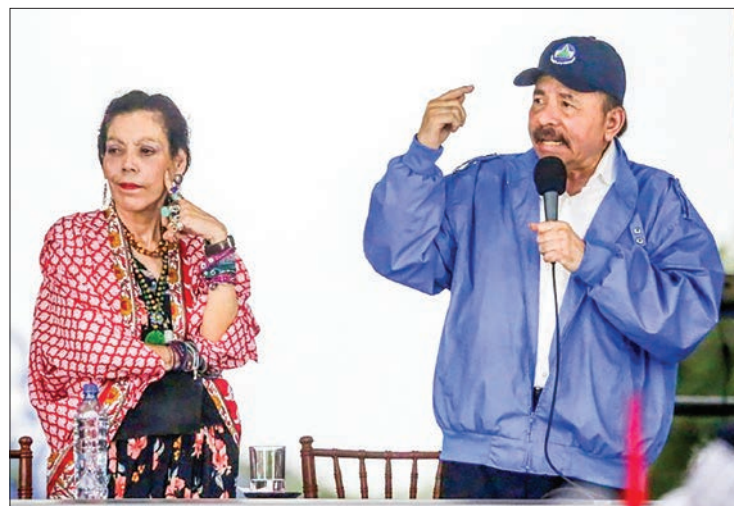
Nicaraguan President Daniel Ortega (R) and his wife, Vice President Rosario Murillo, still command a lot of support despite accusations of repression and a mounting death toll.

repression after detaining more than 30 opposition figures during the last two months, including seven presidential hopefuls. —AFP ■