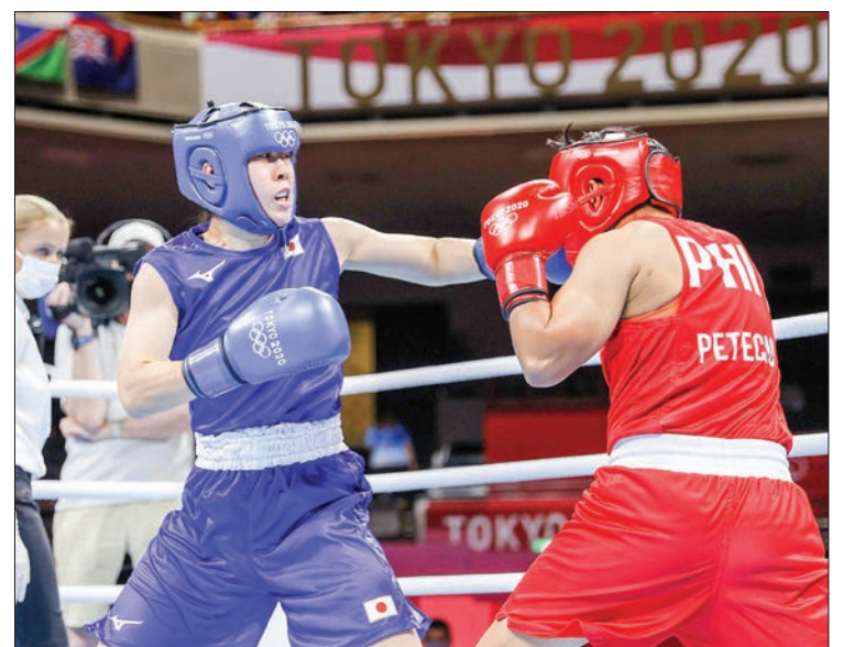
Japan's Sena Irie (blue) and Nesthy Petecio of the Philippines fight in the women's boxing featherweight final of the Tokyo Olympics on Aug. 3, 2021, at Kokugikan Arena.