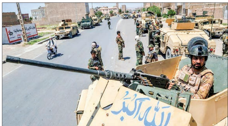
An Afghan National Army commando stands guard on top of a vehicle along the road in Enjil district of Herat province.

AFGHAN forces battled Monday to stop a first major city from falling to the Taliban following weekend offensives by the insurgents on urban centres in a sharp escalation.