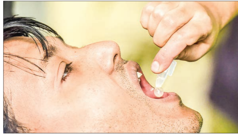
A man receives an oral cholera vaccine from a health worker during a vaccination campaign in Dhaka on 19 February, 2020.

"In order for the vaccine to really work well, we need as many people to take it as possible," said