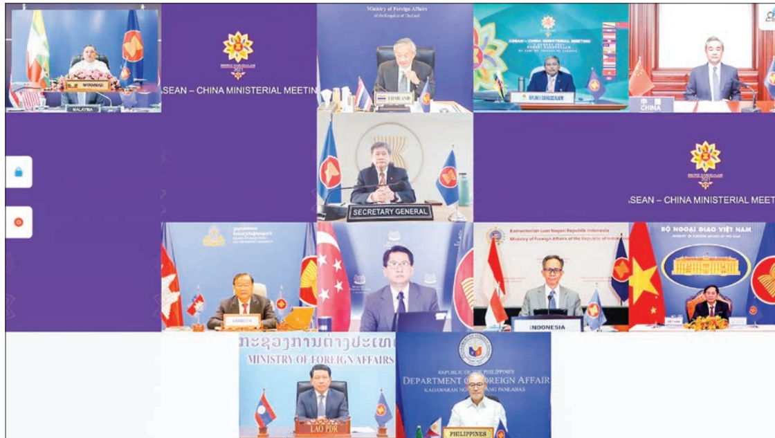
The MoFA Union Minister joins the second Mekong-US Partnership Ministerial Meeting via videoconferencing from Nay Pyi Taw on 3 August 2021.

At the meeting, the Foreign Ministers and the Secretary of State reviewed the progress of one-year collaboration between Mekong countries and the United States under the Partnership. Moreover, they exchanged views on the matters of how the Mekong-US Partnership can contribute to the sustainable development