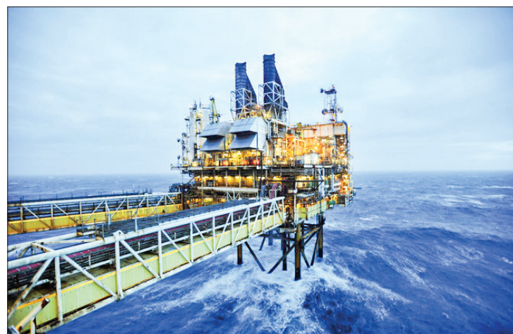
A section of the BP ETAP (Eastern Trough Area Project) oil platform in the North Sea, around 100 miles east of Aberdeen, Scotland.

BP returned to profit in the second quarter, the British energy giant announced Tuesday, hav-