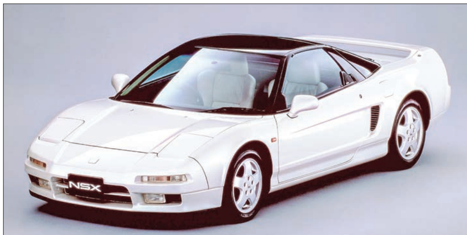
Supplied photo shows Honda Motor Co.'s first generation NSX luxury sports car launched in 1990.

The move comes as Honda plans to gradually increase the proportion of electric and fuel cell vehicles in its total sales in major markets such as Japan, the United States, Europe and China, aiming for 40 per cent in 2030 and 80 per cent in 2035.—Kyodo ■