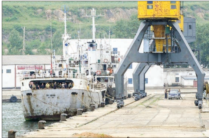
Cargo ships docked at the Rason port in North Korea

North Korea's state-run media made no mention on