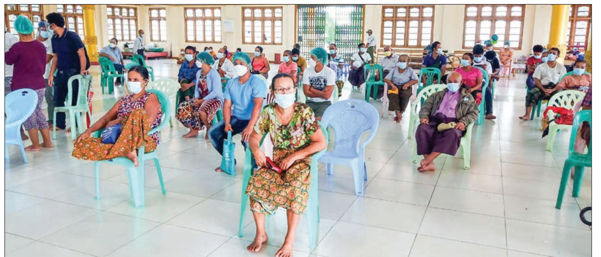
People queue to receive the COVID-19 vaccines at an inoculation centre in Kyaikto on 3 August 2021.