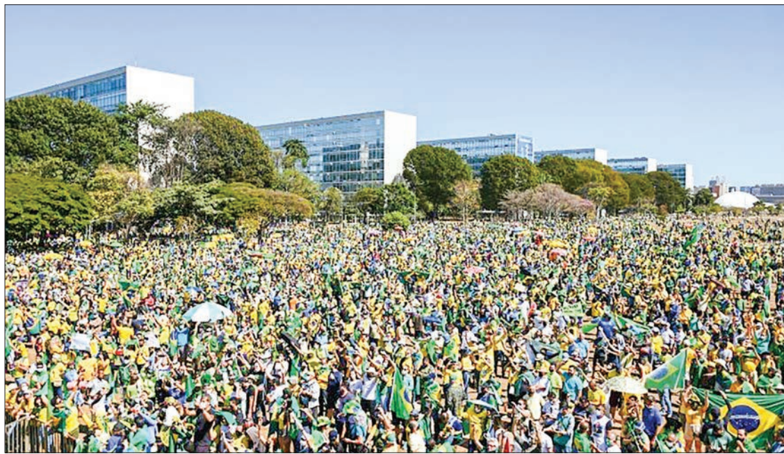
Demonstrators take part in a rally in support of Brazilian President Jair Bolsonaro and calling for a printed vote model at Esplanade of Ministries in Brasilia, Brazil on 1 August, 2021.