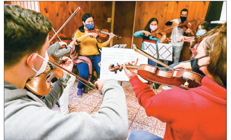
Rehearsing during the pandemic gave members of the Latin Vox Machine orchestra a purpose and objective.

The violas are rehearsing in the living room, while the violins are in the kitchen. Later, the keyboards and choir will take their places to practise.