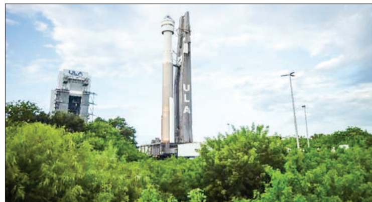
This NASA photo shows A United Launch Alliance Atlas V rocket with Boeing's CST-100 Starliner spacecraft on top.

BOEING will be aiming to get its spaceflight programme back on track Tuesday with an uncrewed flight of its Starliner capsule to