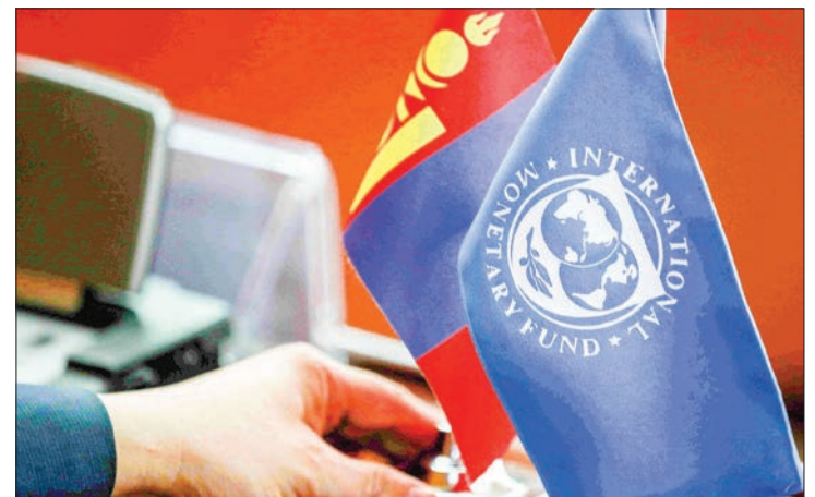
The International Monetary Fund has greenlit increasing lending capacity by $650 billion, the last step in approving an initiative to boost aid to the most vulnerable countries.

had already been approved by the IMF's executive board in mid-July, will be implemented on 23 August. Newly issued SDRs will be allocated to member countries in proportion to their IMF quota, the lender said. Emerging and developing nations are to receive around $275 billion in total. But "we will also continue to engage actively with our membership to identify viable options for voluntary channeling of SDRs from wealthier to poorer and more vulnerable member countries to support their pandemic recovery and achieve resilient and sustainable growth," Georgieva said. Wealthy countries could, for ex-