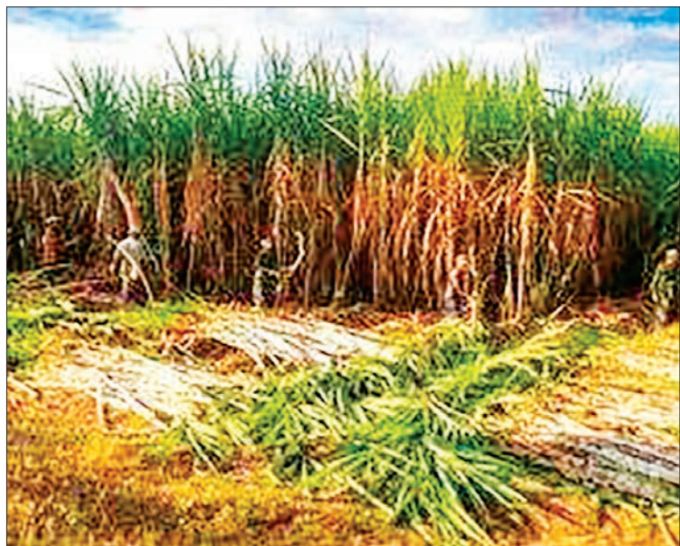
Sagaing Region possesses 9.6 million acres of monsoon and winter crops. The region is the third-largest producer of rice crops and the main producer of pulses and oil crops.

Sagaing Region possesses 9.6 million acres of monsoon and winter crops. The region is the third-largest producer of rice crops and the main producer of pulses and oil crops.