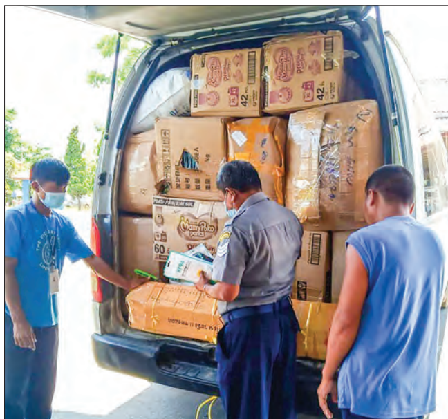
via Tachilek land border.

On 23 July, 2,689 oxygen concentrators from Yangon International Airport and 48 tonnes of liquid oxygen, 21 tonnes of the liquid oxygen tank, 4,103 home