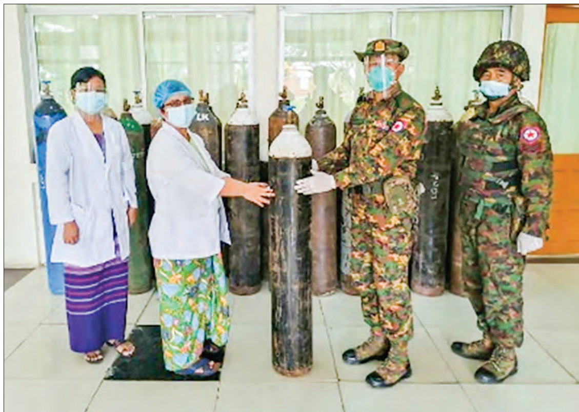
Oxygen cylinders are donated to the Nay Pyi Taw General Hospital (300-bedded).

It is reported that the Ministry of Health and Sports is having a greater number of oxygen plants in each region and state to reduce the need for oxygen, and the Tatmadaw is also installing oxygen plants in various areas of the Regional Military Headquarters. — MNA