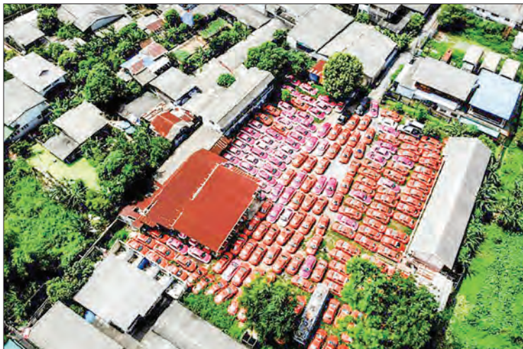
Thailand's government has faced an avalanche of criticism for its management of the pandemic and the slow roll-out of vaccines.

A lot attendant sprayed his taxi down with disinfectant and collected his keys. Tourism accounts for a fifth of Thailand's economy, which is suffering its worst crash since the 1997 Asian financial crisis.—AFP ■