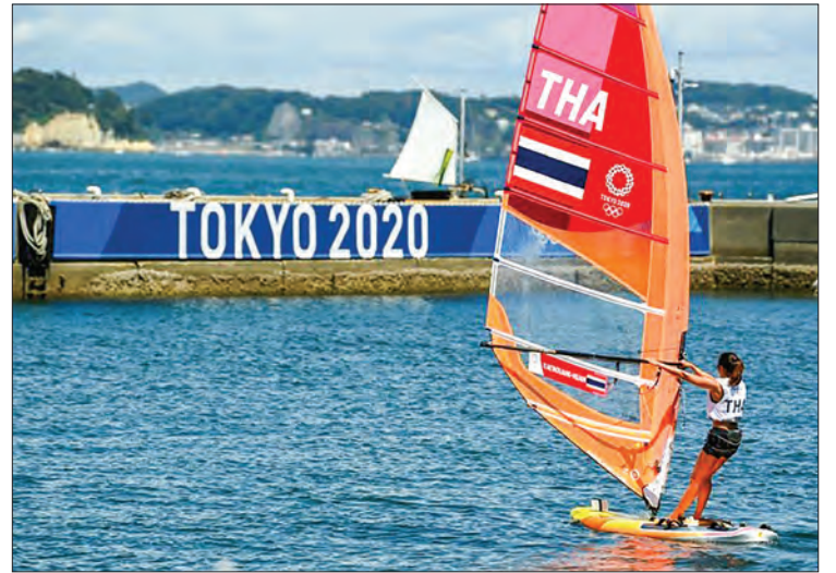
A competitor from Thailand heads out on her windsurfer board to practise ahead of the Tokyo 2020 Olympic Games sailing competition at Enoshima Yacht Harbour in Fujisawa, Kanagawa Prefecture.

"But now it's very atmospheric and now I'm looking forward to it." Friday is a national holiday in Japan and families set up picnic blankets in Tokyo parks to watch the jets draw the Olympic rings in coloured smoke.—AFP ■