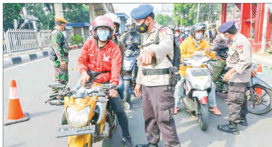
Police and military officers work at a check point to restrict traffic flow as motorists head downtown in Jakarta on 15 July 2021, as the highly infectious Delta variant rips across the archipelago, catapulting it ahead of India as Asia's COVID-19 epicentre.

The highest numbers of new cases were reported from Indonesia (350,273 new cases; up 44 per cent), Britain (296,447 new cases; up 41 per cent), and Brazil (287,610 new cases; down 14 per cent).