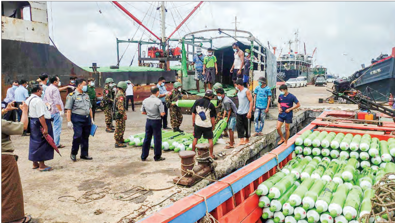
via Kawthoung seaport.

oxygen concentrators, 12,350 test kits, 75 tonnes of masks from Muse, Myawaddy, Tachilek, Hteekhee, Chinshwehaw and Kawthoung border trade posts were successfully imported.