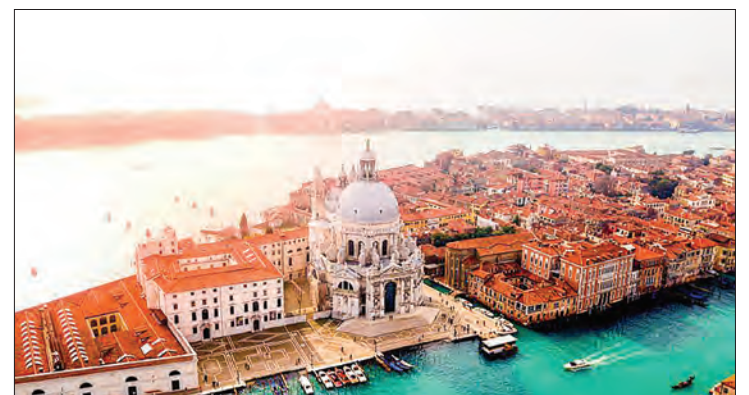
Venice avoided being named a world heritage site in danger by UNESCO on Thursday, just weeks after Italy moved to ban large cruise ships from sailing into the city centre.

Prime Minister Mario Draghi expressed "great satisfaction" at the decision. For