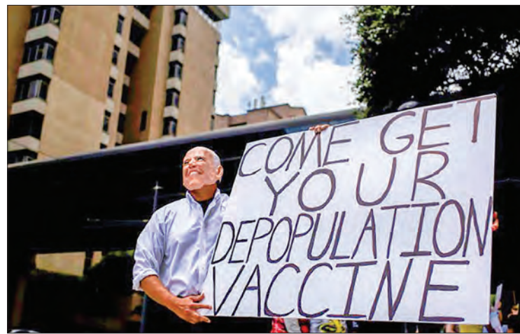
An anti-vaccine protester dressed up as Joe Biden in June 2021 promoted one of several conspiracies that have contributed to low vaccination rates, particularly among US Republicans.

WITH Delta variant infections spiking across the United States, growing numbers of Republican officials and lawmakers have joined the chorus of support for coronavirus vaccinations, swatting aside conspiracies that have left millions of Americans unprotected. Covid-19 deaths and hospitalization rates are rising