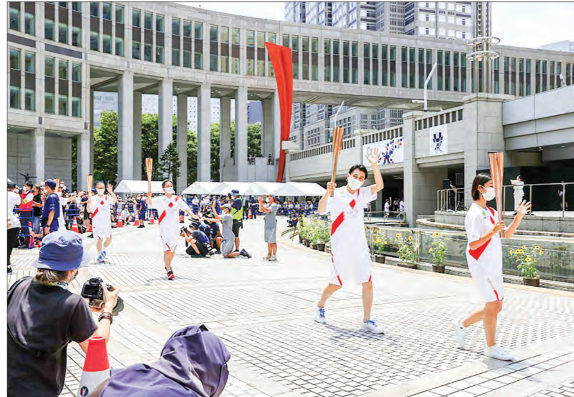
Tokyo Olympic torch relay participants prepare to attend the Olympic flame arrival ceremony in the Japanese capital on 23 July 2021, ahead of the opening ceremony of the Summer Games.

The WHO chief said that the world's failure to share vaccines, tests, and treatments, including