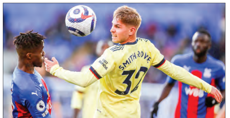
Arsenal youngster Emile Smith Rowe has signed a new long-term contract, the Premier League club announced on Thursday.

"As we all saw last season, Emile is an intelligent player with excellent ability," said Gunners manager Mikel Arteta who has handed Smith Rowe the number 10 shirt. — AFP ■