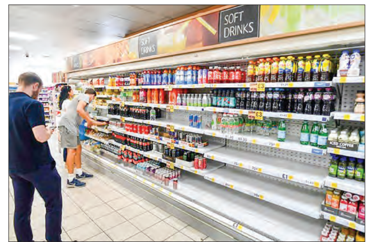
Newspapers ran photos of empty supermarket shelves as missing staff at stores and in supply chains hit retailer's operations.