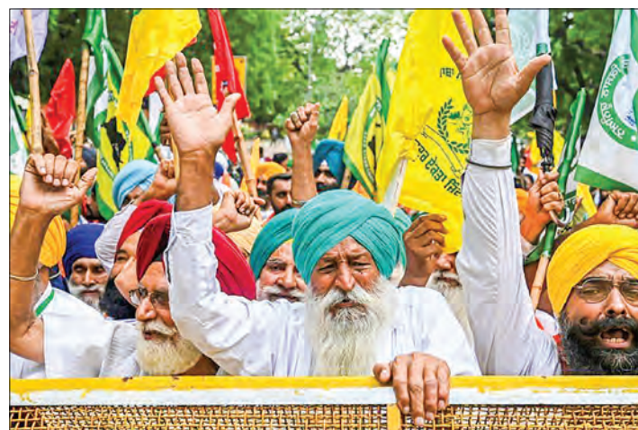
Indian farmers are renewing a campaign against government agriculture reforms.

THOUSANDS of security forces deployed across New Delhi on Thursday for protests by