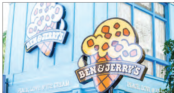
The results come after Israel's Prime Minister Naftali Bennett last week warned Unilever that its subsidiary Ben and Jerry's decision to stop selling ice cream in the occupied Palestinian territories would have "severe consequences".

dropped five per cent to €3.12 billion in the first six months of the year compared with the corresponding period in 2020, Unilever said in a statement. Revenue