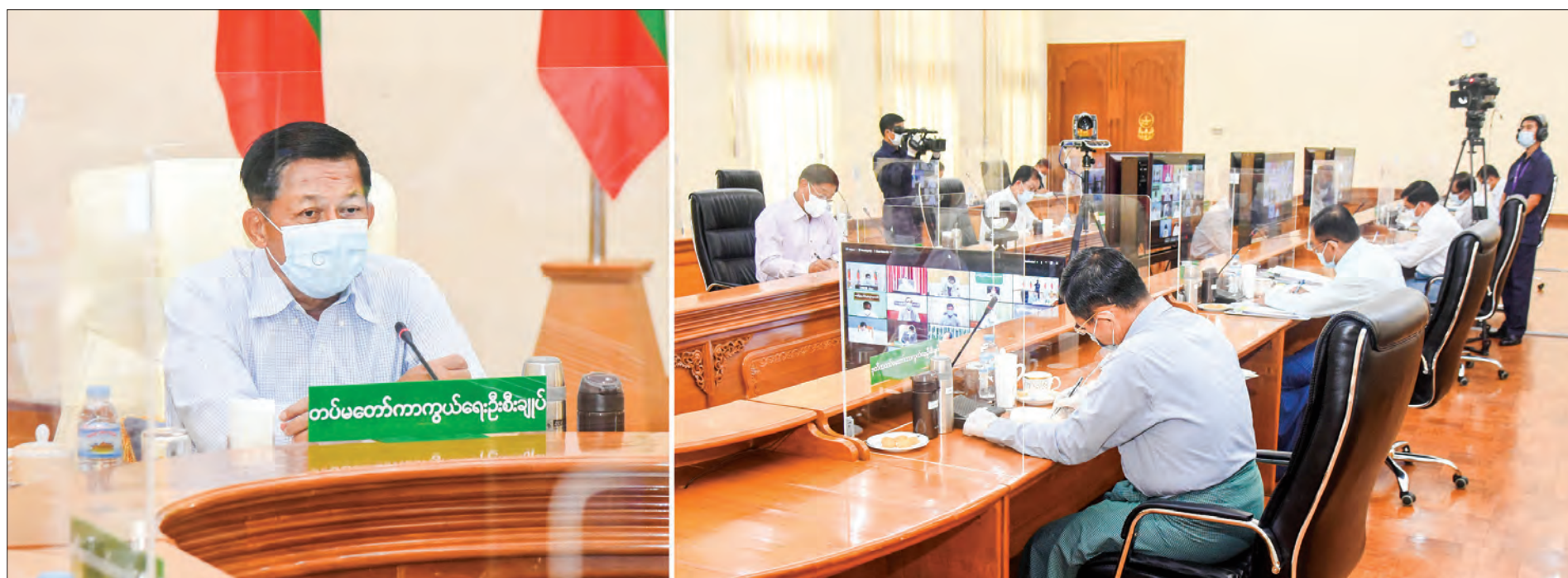
State Administration Council Chairman Senior General Min Aung Hlaing is addressing the fourth coordination meeting on the prevention, control and treatment of COVID-19 in Nay Pyi Taw on 23 July 2021.

THE fourth coordination meeting on the prevention, control and treatment of COVID-19 was held in Nay Pyi Taw and Chairman of the State Administration Council, Commander-in-Chief of the Defence Services Senior General Min Aung Hlaing addressed the meeting.