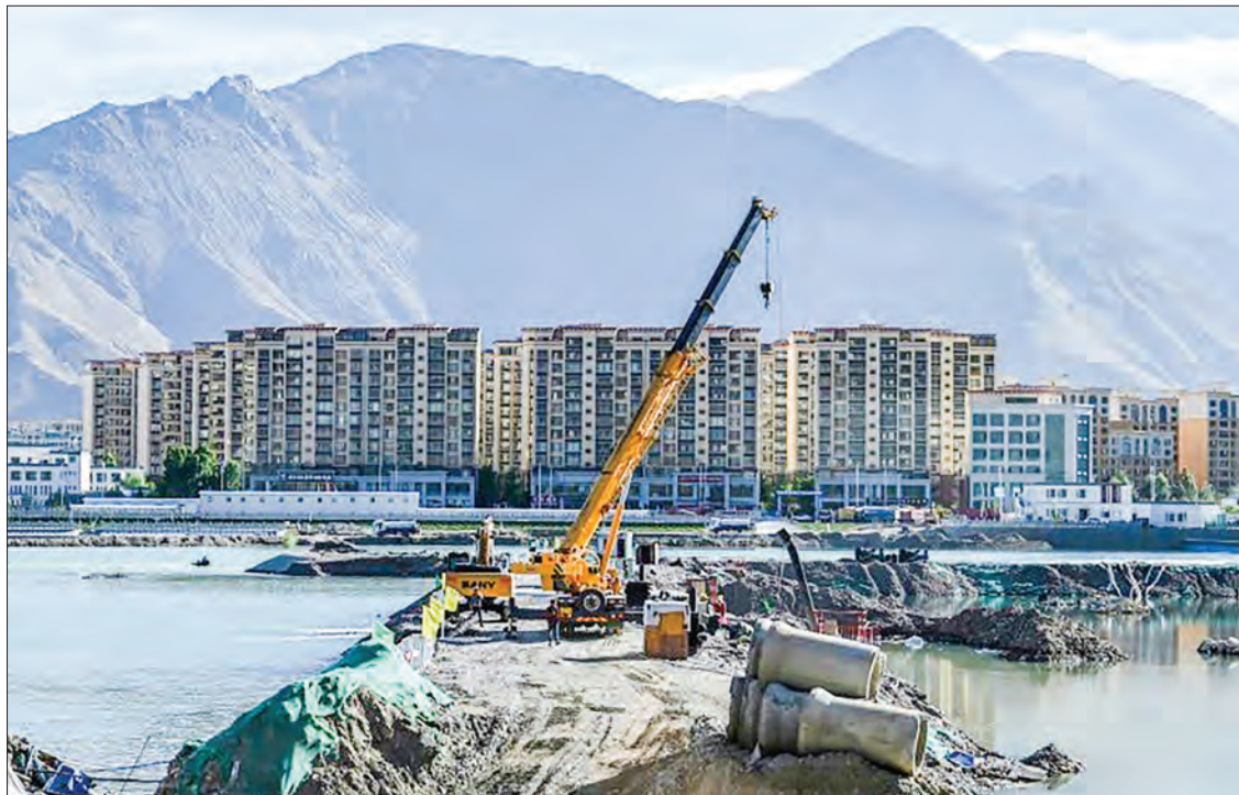
Beijing sees development as an antidote to discontent in Tibet, where many still revere the Dalai Lama -- the region's exiled spiritual leader -- and resent an influx of Chinese tourists and settlers.

Xi has visited Tibet twice, once in 1998 as Fujian province's party chief and another time in 2011 as vice-president.—AFP