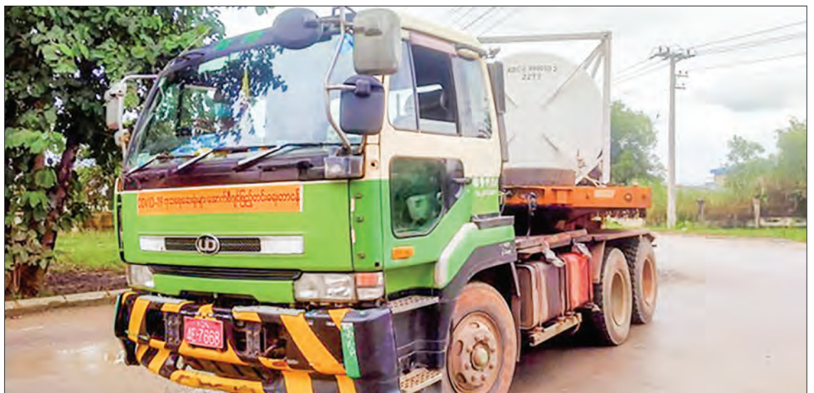
via Myawady land border.