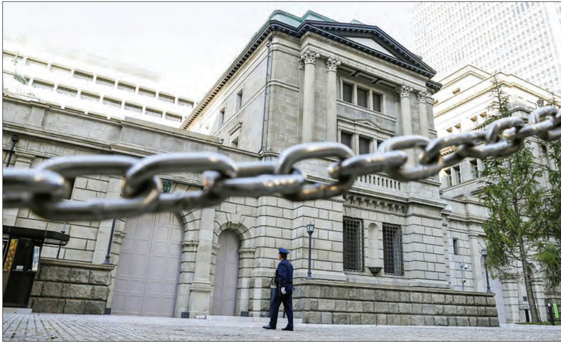
Bank of Japan head office in Tokyo.

JAPAN may achieve fiscal consolidation in fiscal 2027, two years earlier than previously estimated, as tax revenue has been rising despite the coronavirus pandemic, the government said Wednesday.