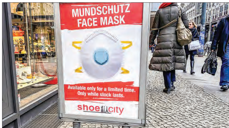
Shoppers walk past a sign advertising the sale of protective face masks outside a shoe shop in Berlin on 13 February 2020, as the coronavirus "COVID-19" epidemic has many people using the masks to prevent the spread of the virus, resulting in stocks running low.

MORE than half of all European adults are now fully vaccinated, the EU said on Thursday, as countries across Europe and Asia battled fresh outbreaks blamed on the fast-spreading Delta variant.