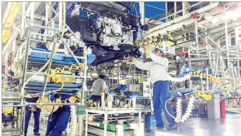
Daihatsu's vehicle assembly plant. PHOTO: KYODO NEWS

Toyota, Isuzu and Hino are seeking to promote eco-friendly and autonomous driving trucks via Commercial Japan Partnership Technologies launched in April.—Kyodo News ■