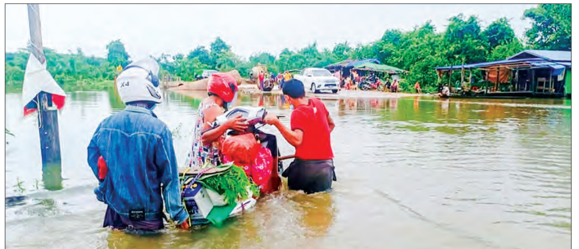
The water depth on the creek bridge is about 3 feet, and it is not safe for the vehicles to pass. The hazards pose difficulties for the commuters at present.

The water depth on the creek bridge is about 3 feet, and it is not safe for the vehicles to pass. The hazards pose difficulties for the commuters at present.