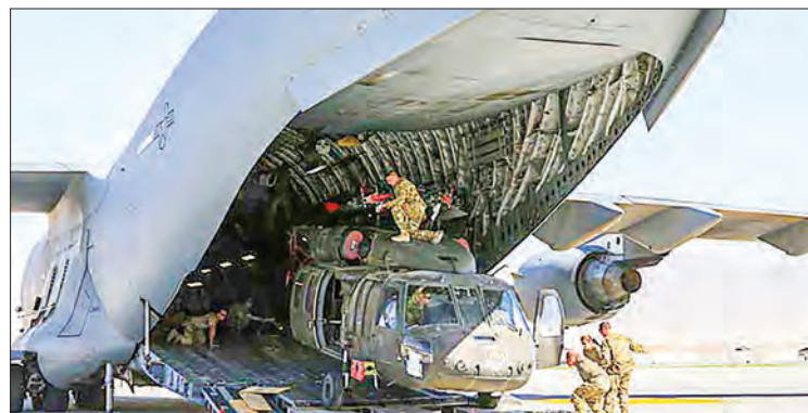
In this handout photo taken on 16 June 2021 and released on 29 June 2021 by the US Defence Visual Information Distribution Service (DVIDS) Aerial porters work with maintainers to load a UH-60L Blackhawk helicopter into a C-17 Globemaster III in support of the Resolute Support retrograde mission in Bagram.

airstrikes in support of the ANDSF," he told reporters at a press briefing, adding that head of the US Army Central Command (Centcom), General Kenneth McKenzie, had authorized the strike. Kirby said he could not provide details on the air strikes, but reiterated Defence Secretary Lloyd Austin's Wednesday statement that the United States remains "committed to helping the Afghan security forces and the Afghan government going forward."—AFP