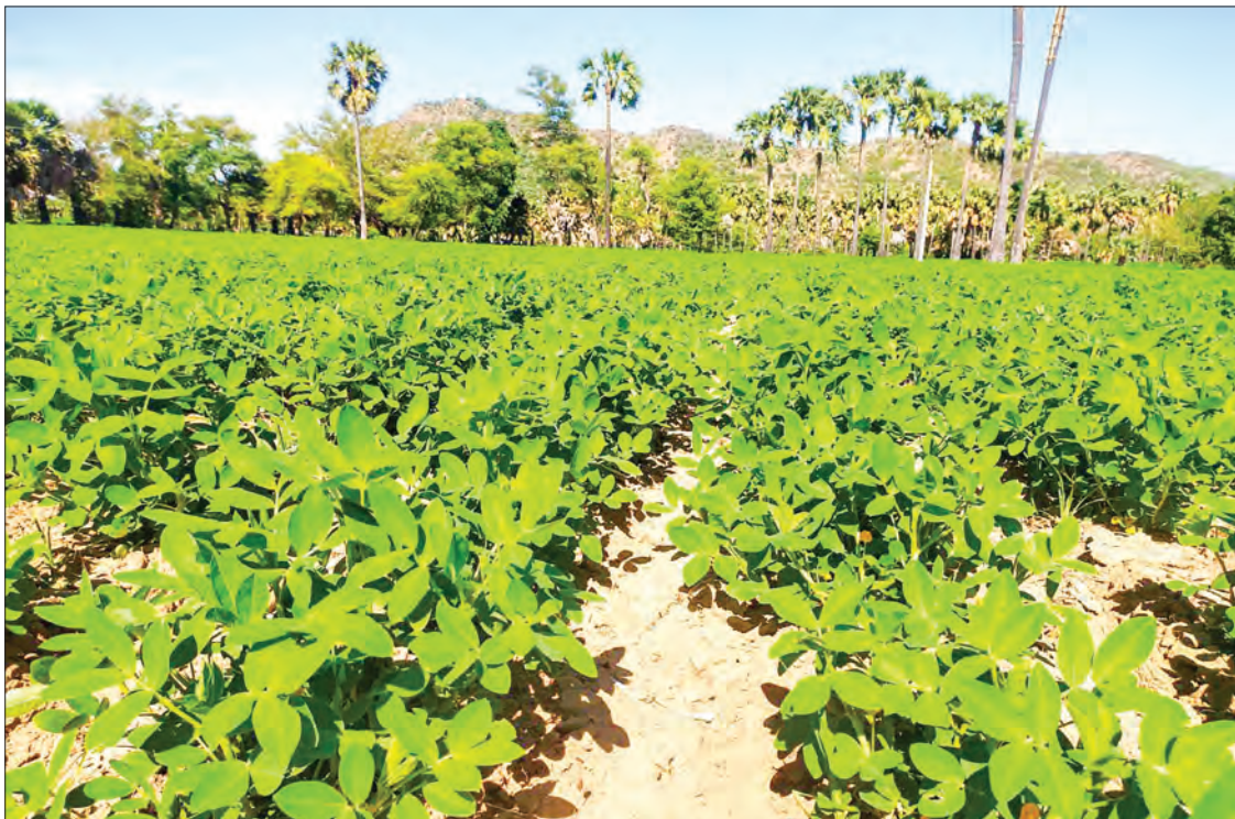
Those peanut seeds were broadcast in May. Good rainfall ensures a good yield for the farmers during the harvest time.

The peanut seeds for cultivation costs K55,000 per basket. Last year, some growers did not even cover the input cost including peanut seeds, land treatment, rent for farmer ploughing machines, labour wages, fertilizer and pesticides. This year, high yield raises hopes for peanut growers to receive a good price. — KPD/GNLM