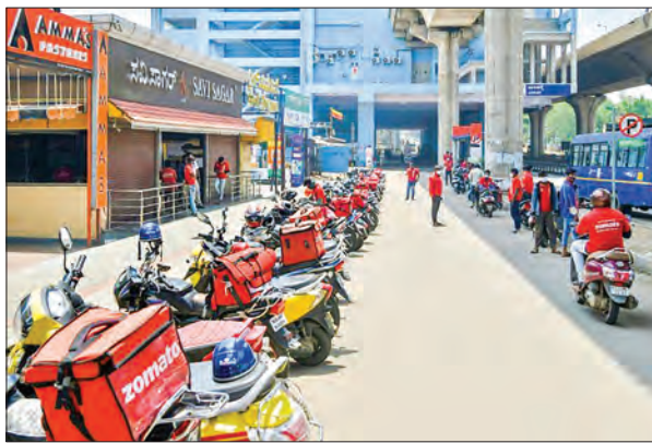
Zomato dominates India's booming app-based food-delivery space alongside rival Swiggy.

firms valued at more than a billion dollars -- have been created, including half a dozen in four days in April.—AFP ■