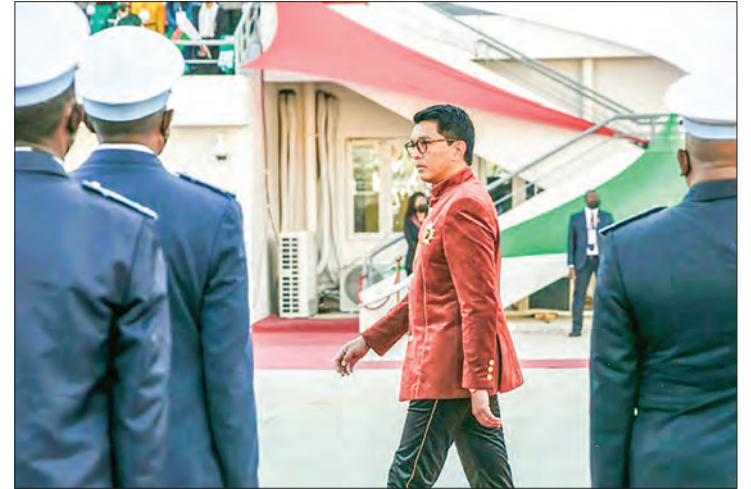
Rajoelina inspects the troops on Madagascar's Independence Day last month.

Rajoelina, 47, first seized power in March 2009 from Marc Ravalomanana with the backing