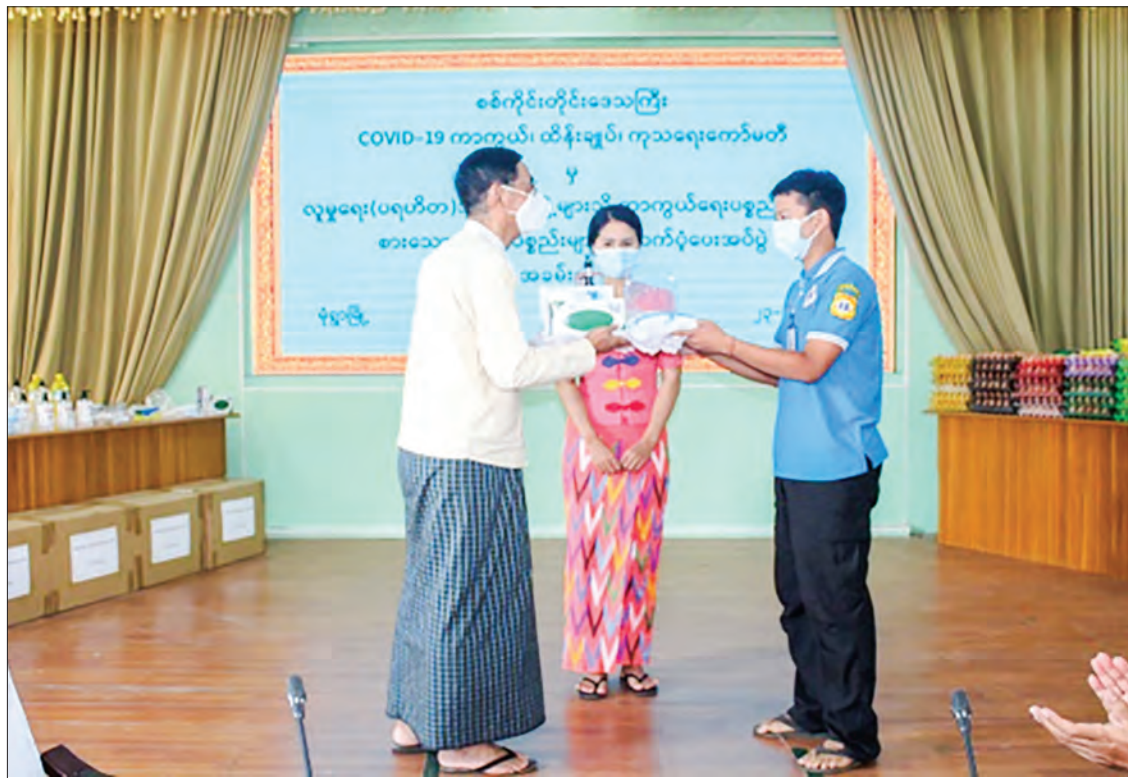
The Sagaing Administration Council Chairman presents COVID protective supplies and foodstuffs to the civil society organizations.

TATMADAW members, medical, health workers and social welfare teams work together in order to offer medical treatment to positive patients and isolated patients at military hospitals, public hospitals, health departments and COVID-19 treatment centres during the third wave of COVID-19.