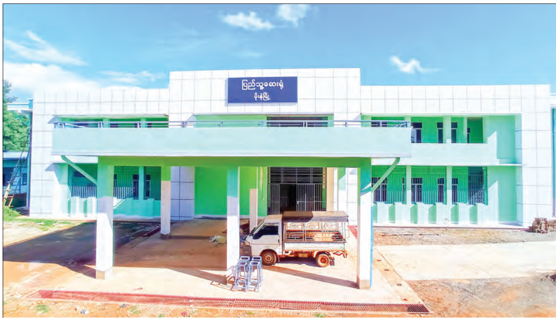
The extended building is a two-storeyed RC building and it is 143 feet in length and 98 feet in width.

THE construction of an extended two-storeyed building in Mongnai Township, southern Shan State has been completed 95 per cent, it is learnt.