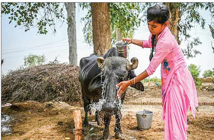
Animals also need some respite from the intense heat in the desert city of Sri Ganganagar in Rajasthan where temperatures of 50 degrees Celsius (122 degrees Fahrenheit) are nothing out of the ordinary.

Sri Ganganagar, in the desert state of Rajasthan near the Pakistan border, is regularly India's hottest place and tempera-