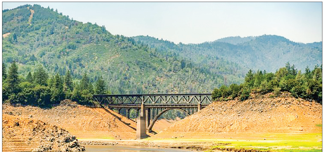
A section of a drought-stricken Shasta Lake in California, where drought conditions are worsening.

CALIFORNIA'S governor called on residents to reduce their water consumption by 15 per cent as he extended a state of drought emergency to nearly half the parched US state's population Thursday.