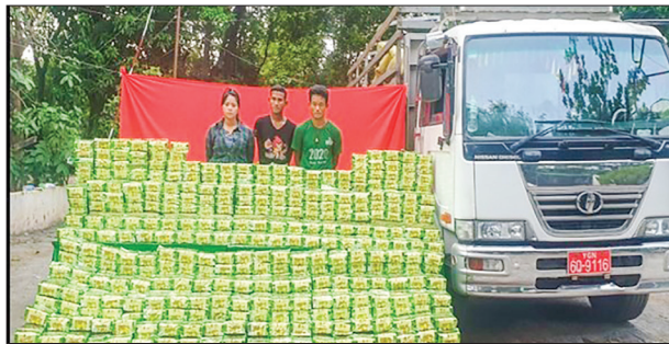
The seizure of 1580 kg of QING SHAN-inscribed ICE stimulant drugs (estimated worth of K 39.5 billions) between Mayanchaung village and Inngapu village of Kyaikto town.

On 27 June 2021, Naval Vassal (BaYintNaung)