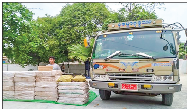
The seizure of 7,600,000 WY-inscribed stimulant tablets (estimated worth of K 11.4 billions) at (7) Mile security check point at Taungoo town.

In April 2021, 7,600,000 WY-inscribed stimulant tablets (estimated worth of K 11.4 billions) carrying from Mong Nai town to Myawadi town were confiscated at (7) Mile security check point at Taungoo town.