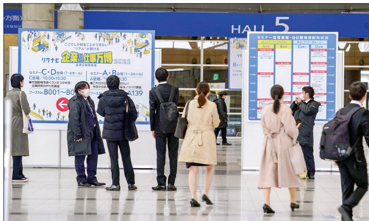
Job seekers head to an information fair in Chiba, east of Tokyo, on March 1, 2021.

A total of 80.5 per cent of university seniors in Japan who are scheduled to graduate next March have secured job offers as of July 1, an improvement from last year when job-hunting was affected by the coronavirus pandemic, according to a survey.