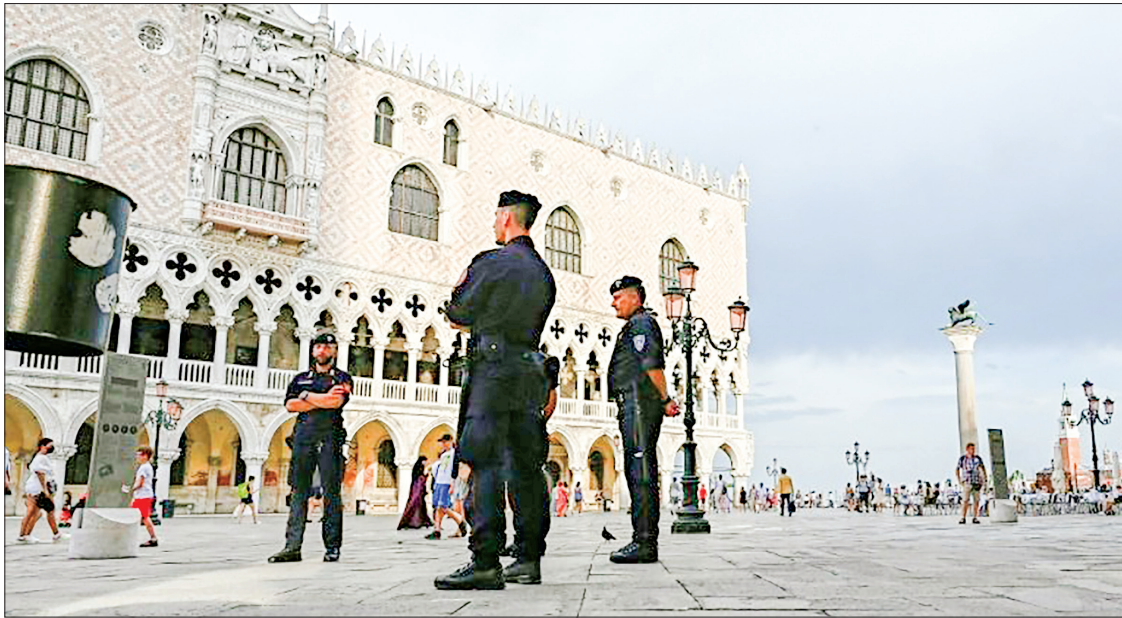
Security is tight for G20 finance ministers meeting in Venice.

FINANCE ministers from the G20 richest nations are expected to give the green light Saturday to a historic deal to tax multinational companies more fairly.