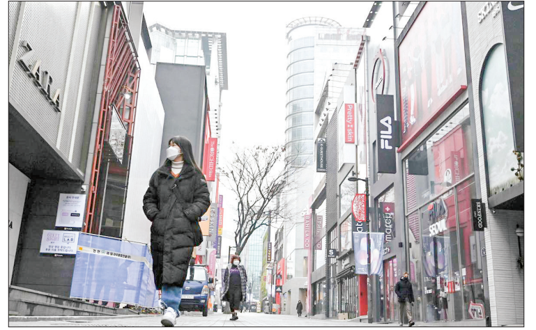
Masked pedestrians walk through the quiet Myeong-dong shopping district in Seoul on December 23, 2020 as South Korea banned gatherings of more than four people in the capital and surrounding areas

Cluster infections have surfaced in areas including schools, offices and shopping malls, with people in their 20s and 30s — most of whom are not yet eligible