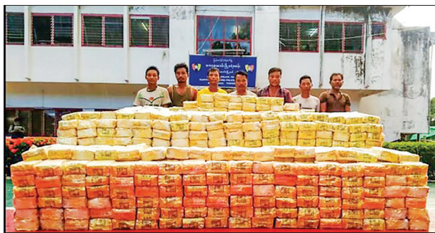
The seizure of 1500 kg of ICE stimulant drugs from a boat in Myanmar waters near Myanmar-India maritime border.

The seizures show that the synthetic drugs were manufactured in the ethnic areas dominated by EAOs. In reality, as the danger of narcotic drugs is the challenge not only concerned with Myanmar but also for all mankind, the State Administration Council is conscientiously combating against the illicit drugs in offensive manner as frontline force.