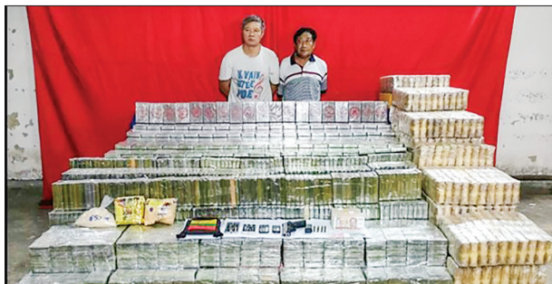
The seizure of heroin, stimulant tablets, IEC total estimated worth of K 14.36 billions along with small arms in Parsat ward of Tarchileik town.

Moreover, on 18 June 2021, 1710 kg of ICE stimulant drugs (estimated worth of K 34.2 billions) were