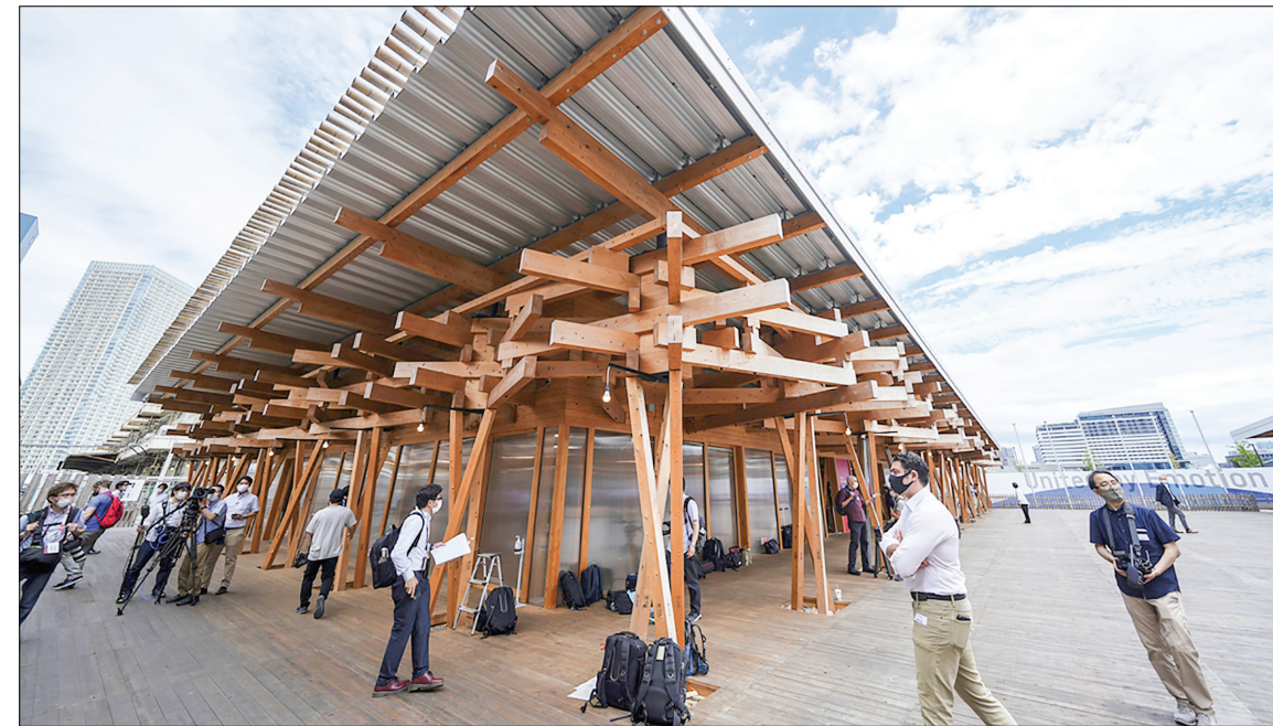
Journalists walk around the village plaza near the Tokyo 2020 Olympic Village during a media tour on 20 June, 2021, in Tokyo, Japan.

the plaza because we heard that at past Olympics families and guests to the village who could not enter athletes' real rooms enjoyed getting a feel for their accommodations," said a representative of real estate giant