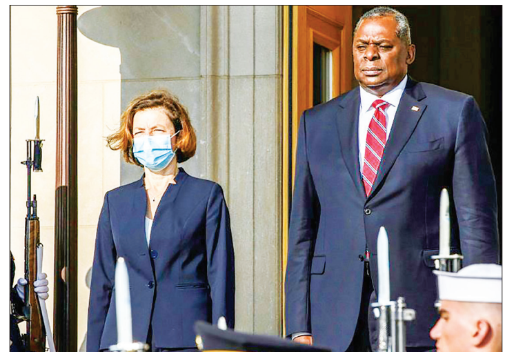
US Defense Secretary Lloyd Austin greets French Defense Minister Florence Parly for talks at the Pentagon.

The government blames the violence on an alleged plot by the opposition to "destabilize" President Nicolas Maduro. — AFP ■