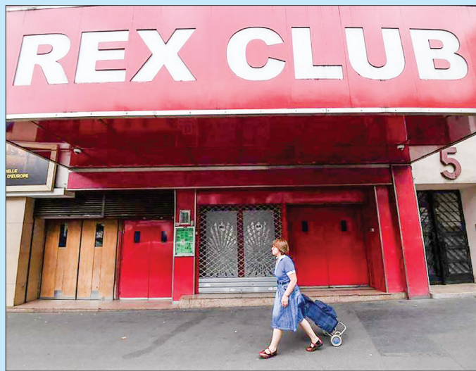
A woman walks past the Rex nightclub in Paris.

"It's a reopening for 30 per cent of discotheques because 70 per cent were unable to apply the strict health protocols," Health Minister Olivier Veran told France Inter radio. — AFP ■