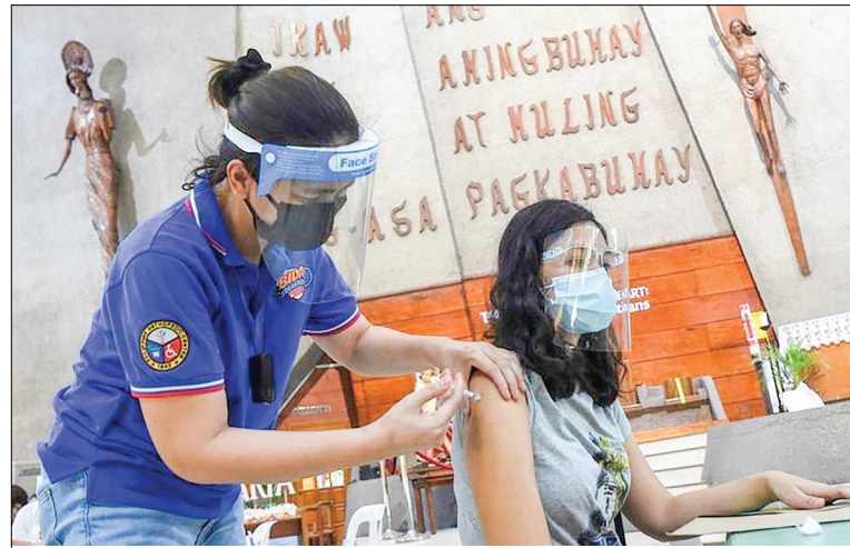
A health worker inoculates a resident with a dose of the AstraZeneca/Oxford COVID-19 vaccine inside a Catholic church turned into a vaccination centre in Manila on May 21, 2021.

According to the data in the US Vaccine Adverse Events Reporting System, approximately 40.6 cases of myocarditis per million second doses among males, and 4.2 cases per million among females, have been reported as of 11 June 2021 in those 12-29 years