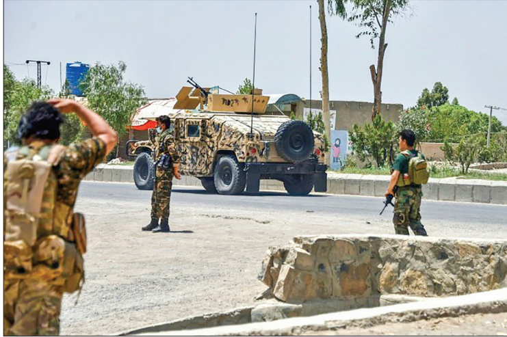
Afghan security personnel stand guard along a road in Kandahar during fighting between Afghan security forces and Taliban fighters.

THE Taliban claimed to be in control of 85 percent of Afghanistan as authorities Saturday prepared to retake a key border crossing seized by the insurgents in a sweeping offensive launched