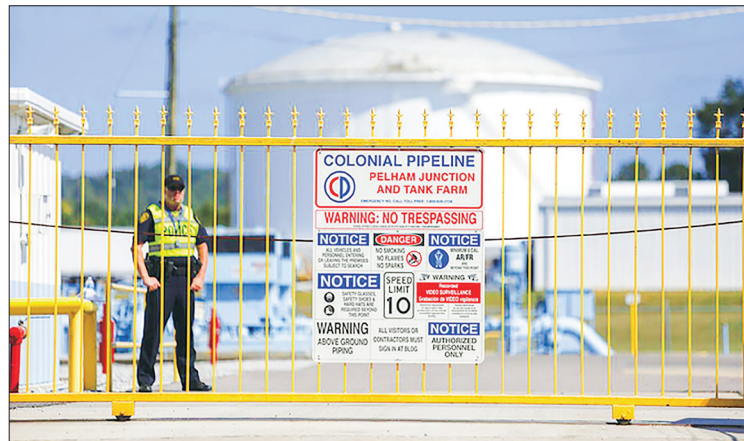
On May 7, 2021, Colonial Pipeline, an American oil pipeline system that originates in Houston, Texas, and carries gasoline and jet fuel mainly to the Southeastern United States, suffered a ransomware cyberattack that impacted computerized equipment managing the pipeline.

The United States has "been clear to what Russia's responsi-