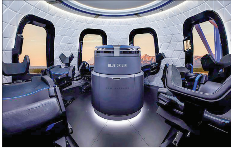
After lift-off, the capsule, which carries up to six crew members, separates from its booster, then spends four minutes at an altitude exceeding 60 miles (100 kilometers) -- also known as the Karman line, the recognized border of space.

While the tycoons are among the first passengers, their ultimate goal is to allow