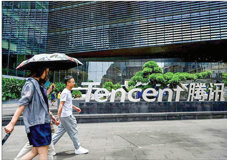
Plans for the merger of China's two largest video game live-streaming sites were initially announced by Tencent last October.

that would... further strengthen Tencent's dominant position in the video game live-streaming