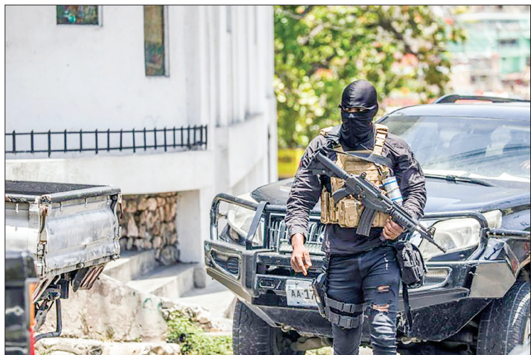
Police patrol the streets in Petionville, Haiti on July 9, 2021 as citizens brace for days of turmoil.

HAITI has asked Washington and the UN for troops to secure its ports, airport and other strategic sites after the assassination of president Jovenel Moise opened a power vacuum in the crisis-hit