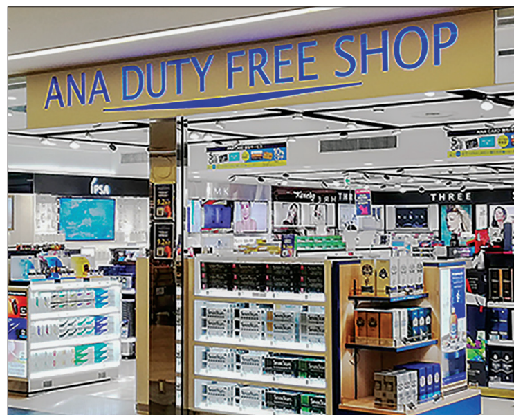
The government will ask duty-free stores to check the date of entry to Japan in customers' passports and report if they were shopping in violation of the required 14-day quarantine period, sources close to the matter said Friday.

Entrants associated with the Olympics are exempt from the usual border controls but are still required to take precautions, such as observing a three-day quarantine period after entering the country. — Kyodo News ■