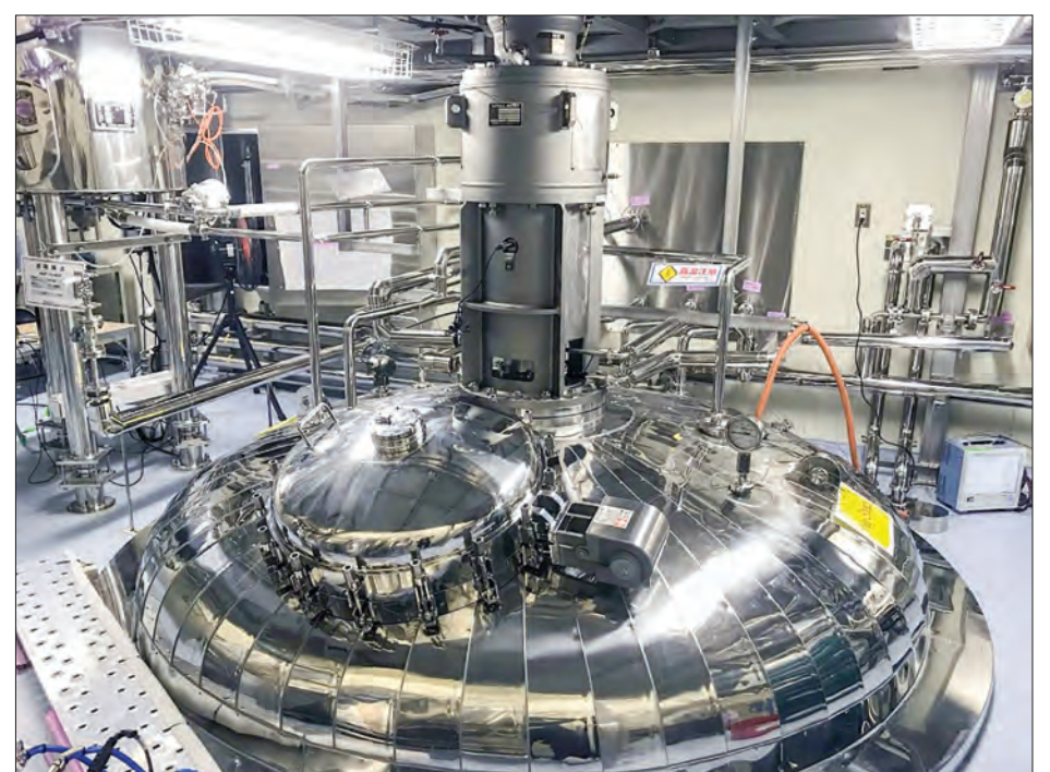
Undated photo shows a facility of Unigen Inc. to produce COVID-19 vaccine in Gifu Prefecture.

Shionogi began a clinical study of its recombinant protein-based vaccine last December, targeting around 200 Japanese people. It will consider carrying out trials in areas hit by rising coronavirus cases such as Southeast Asia and Africa, the officials said.—Kyodo News ■