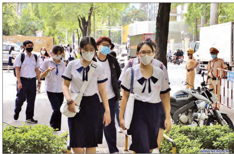
High school students leave a test site in southern Vietnam's Ho Chi Minh City, July 7, 2021. Over 993,000 Vietnamese high school students on Wednesday started sitting for the national final exam with strict COVID-19 control measures in place, Vietnam News Agency reported.

More than 1 million students registered for the national exam this year, said the ministry, compared to a little over 900,000 last year. The exam includes four parts, including literature, maths, foreign language, and either a group of three natural science subjects (physics, chemistry and biology) or a group of three social science subjects (history, geography and civics).