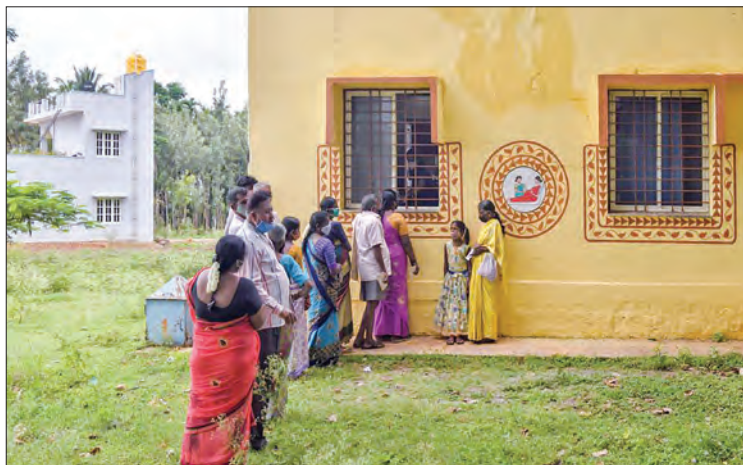
People stand in a queue to register to get a swab test for the COVID-19 coronavirus disease at the Kanaswadi Public Health Centre (PHC) on the outskirts of Bangalore on 7 July, 2021.

Four members from southern Karnataka state were also added, including millionaire media mogul Rajeev Chandrasekhar and Shobha Karandlaje.—AFP ■