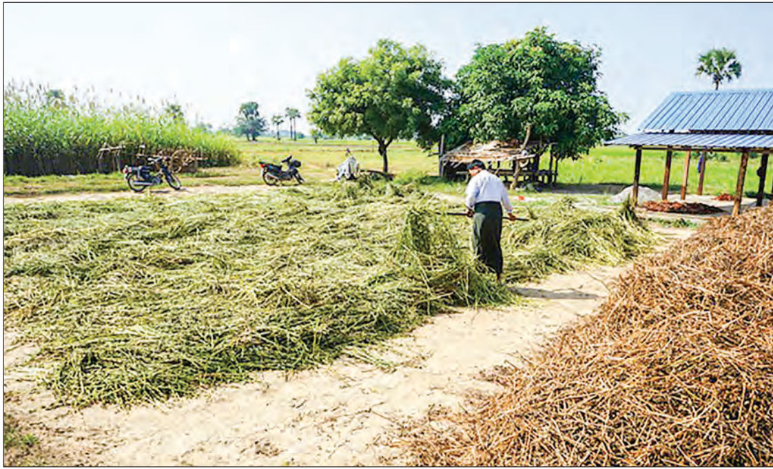
Sesame is cultivated in the country throughout the year. Magway Region, which has gained a reputation as the oil pot of Myanmar, is the main producer of sesame seeds.

MYANMAR'S sesame seeds export has earned US$287.75 million in the seven months (October-April) of the current financial year 2020-2021, according to data released by Myanmar Customs Department.