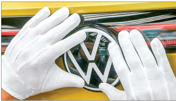
The agreement included a licence under Huawei's 4G patents which covers Volkswagen vehicles equipped with wireless connectivity.

Huawei did not provide financial terms or identify the VW supplier but it said the agreement included a licence under Huawei's 4G patents which covers Volkswagen vehicles equipped with wireless connectivity.