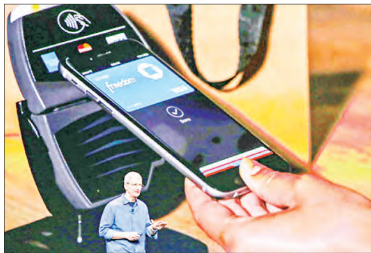
Dozens of US states joined forces in a lawsuit filed Wednesday accusing Google of abusing its power when it comes to getting apps for Android-powered mobile devices.

Dozens of US states joined forces in a lawsuit filed Wednesday accusing Google of abusing its