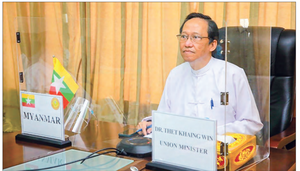
The Union Minister chairs the meeting.

MADO, with the support of the World Anti-Doping Agency's