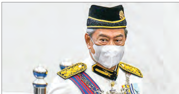
This photo shows Malaysia's Prime Minister Muhyiddin Yassin wearing a face mask during the opening ceremony of the third term of the 14th parliamentary session in Kuala Lumpur.

THE biggest party in Malaysia's ruling coalition said Thursday it was withdrawing support for the embattled prime minister and urged him to step down.