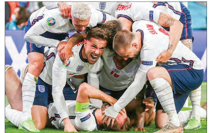
England are through to their first major final since 1966 at Euro 2020.

ENGLAND fans woke up bleary-eyed on Thursday to the reality of a first major tournament final in 55 years after a momentous win against Denmark set up a Euro 2020 showdown with Italy.