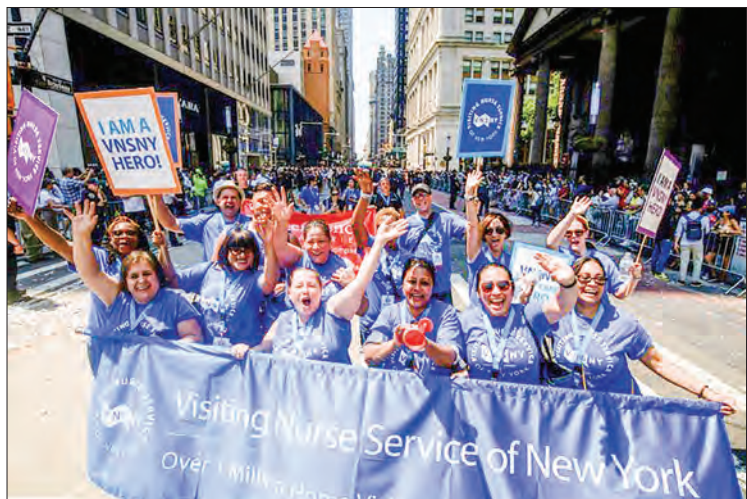
Hundreds of essential workers in New York marched down the southern stretch of Broadway in Manhattan known as the "Canyon of Heroes".

WITH a ticker-tape parade Wednesday, New York honored its everyday "heroes" who kept the city going through the pandemic and who now hope for recognition that's more than just symbolic.