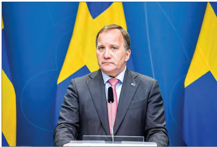
Stefan Lofven has been reinstated as Sweden's prime minister just weeks after his ouster.

Still, the margin was razor thin and on Tuesday the Social Democrats even struck a separate deal to secure the support of