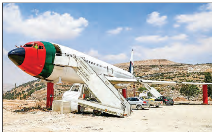
A decommissioned Boeing 707 aircraft from the 1980s has been converted into "The Palestinian-Jordanian Airline Restaurant and Coffee Shop Al-Sairafi Nablus".