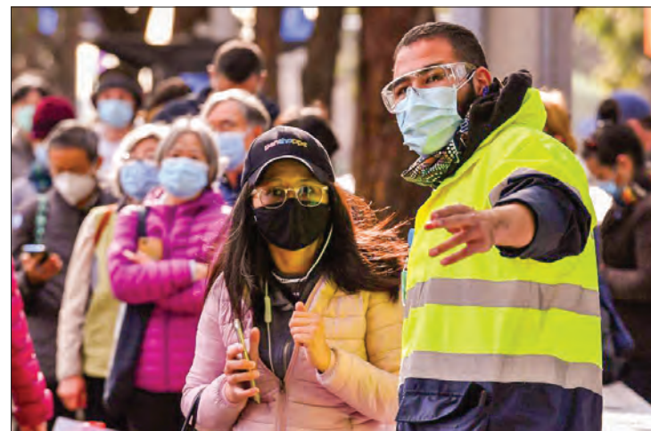
Sydneysiders wait in a queue outside a COVID-19 vaccination centre in the Homebush suburb of Sydney on July 7, as the city extends a coronavirus lockdown for at least another week.

After a top New South Wales health official suggested it might be impossible to bring the outbreak under control, regional leaders threatened to cut Sydney off from the rest of the country.—AFP ■