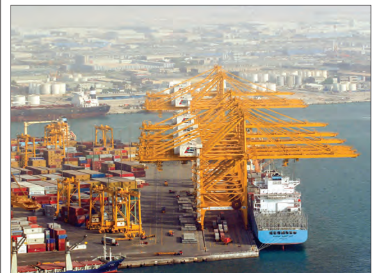
A blast, the cause of which remains unknown, at the Jebel Ali Port (pictured 2006) in Dubai sparked a fire.

The port authority said it was "taking all necessary measures to ensure the normal movement of ships in the port continues without any disruption", according to the Dubai Media Office.—AFP ■