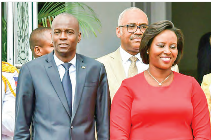
Haitian President Jovenel Moise (L) and First Lady Martine Moise, shown here in 2018, were attacked in their private residence in an assault which left him dead and her wounded.

Police did not identify the suspects or say what their motives were for the gun attack on Moise and his wife Martine, who survived, at their private residence in the capital Port-au-Prince early Wednesday.