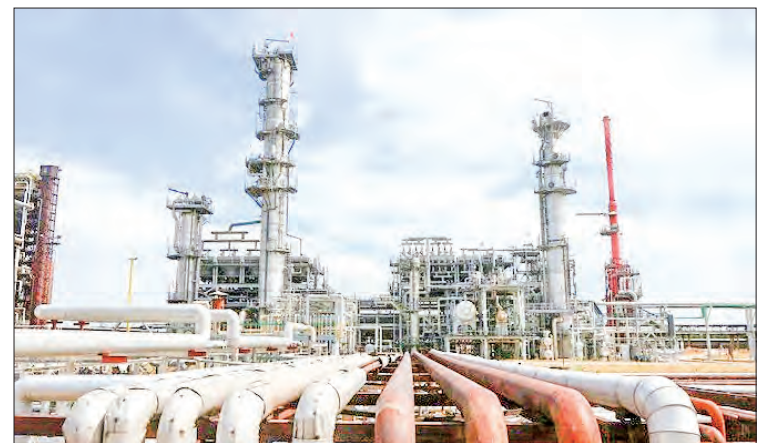
The United Arab Emirates has used its oil wealth both for vast construction projects and to become a major regional power.

Saudi Arabia’s ambitious de facto ruler Crown Prince Mohammed bin Salman and the UAE’s strongman Crown Prince Mohammed bin Zayed have long been seen as the region’s power couple, known by their matching initials—MBS and MBZ.