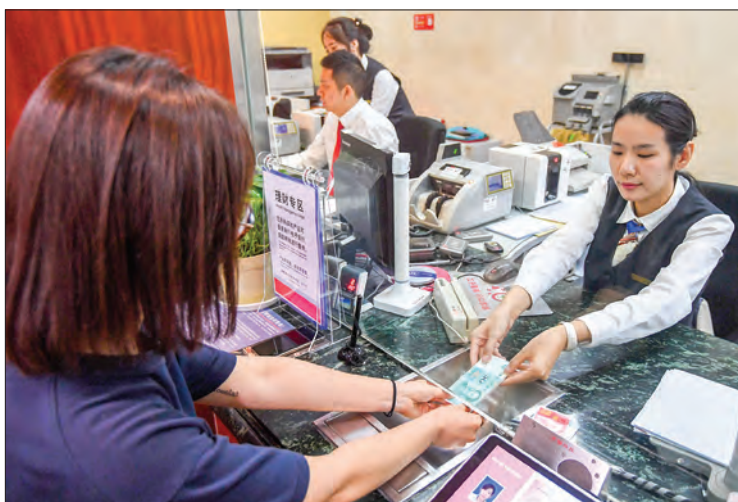
A staff member (R) hands over a stack of renminbi banknotes to a customer at an Industrial and Commercial Bank of China (ICBC) branch in Beijing, Aug. 30, 2019.

adopt monetary tools such as cuts in the reserve requirement ratio at an appropriate time, the meeting said. Xinhua reported it also said such measures are expected to mitigate the impact