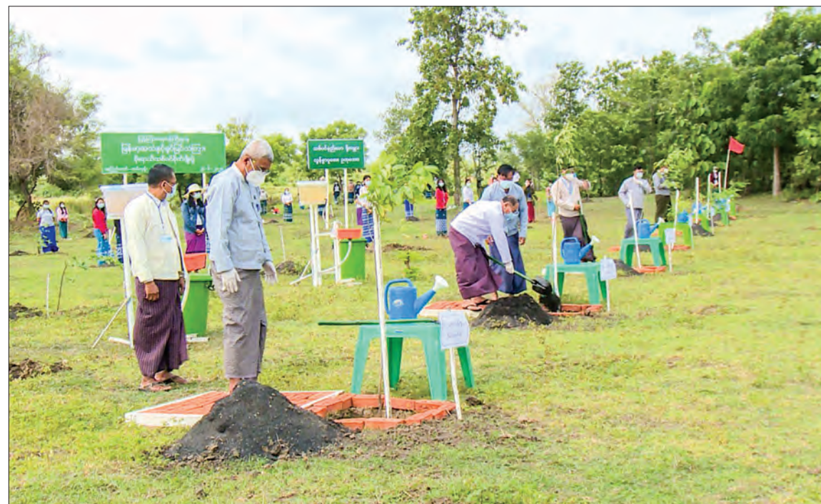
The monsoon tree-planting ceremony of the Myanma Radio and Television (MRTV), the Ministry of Information, was held on 26 June, 2021 in Nay Pyi Taw.

Currently, the Myanmar Forestry Policy (1995) and the Nation-