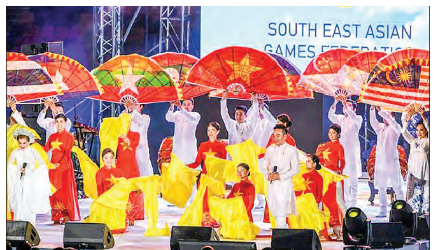
The regional Olympics were scheduled to be held in Hanoi and 11 other locations in November and December.