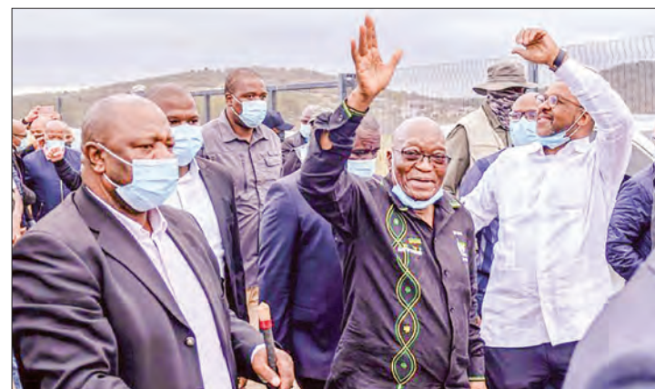
Among friends: Zuma, speaking to supporters who gathered on Sunday outside his rural home in southeastern Kwa-Zulu Natal province.

Zulu-Natal. It is the first time a former president has been jailed in post-apartheid South Africa. His turning himself in after days of refusing to do so brought an end to an impasse that had gripped the country, which is also battling a brutal third wave of Covid-19. The sentence handed to Zuma by the Constitutional Court last week