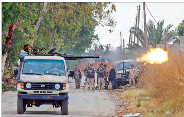
Libya has seen a decade of bloodshed that had largely ended with an October ceasefire -- but will the calm last?.

THE failure of UN-led talks on Libya to reach a compromise over December elections could endanger a roadmap that had raised hopes of ending a decade of chaos, analysts have warned.