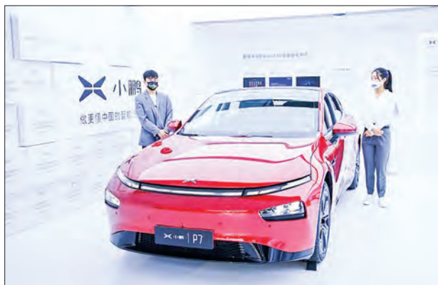
Electric car maker XPeng is chasing market leader Tesla in China.

SHARES in electric car-maker XPeng debuted in Hong Kong on Wednesday, as Chinese-based firms trading in the United