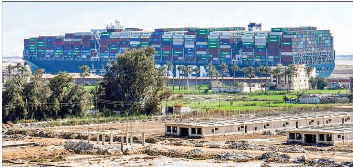
The Panama-flagged MV Ever Given is set to be released from Egyptian custody on Wednesday.

EGYPT is set to release the MV Ever Given on Wednesday, over 100 days since the megaship was refloated after blocking the Suez Canal for six days, crippling global supply lines and costing