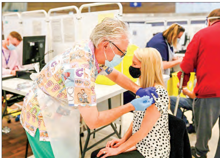
The opposition Labour party is calling for an independent probe into the British government's handling of the pandemic. A health worker administers a dose of the Pfizer Covid-19 vaccine at Pride Park in Derby, Britain.

One was a £30-million ($41-million) contract to produce