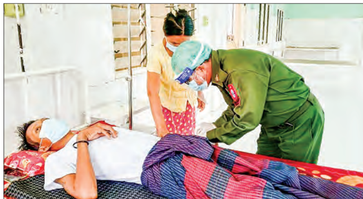
A local patient is receiving treatment at the Nyaungyan station hospital in Meiktila District.

THE Tatmadaw medical teams consisted of Tatmadaw doctors, specialists and nurses have been providing necessary medical treatment to the patients in military hospitals and public hospitals in Thazi Township Hospital, Hanza station hospital, Yinmabin hospital, Nyaungyan station hospital in Meiktila District of Mandalay Region, Tagaung station hospital in Thabeikkyin Township, Madaaya Hospital, Singaing hospital in Kyaukse township, Yintaw hospital, Myittha Hospital and Kume Hospital in Pyawbwe township,