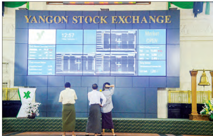
A total of K12.6 billion worth of 1.87 million shares by six listed companies were traded on the exchange in 2020, a significant drop compared to 2019.

In June, the shares of six listed companies — First Myanmar Investment (FMI), Myanmar Thilawa SEZ Holdings (MTSH), Myanmar Citizens Bank (MCB), First Private Bank (FPB), TMH Telecom Public Co. Ltd (TMH), the Ever Flow River Group Public Co., Ltd (EFR) and AMATA were traded in the equity market. The share prices per unit were closed at K9,000 for FMI, K3,500 for MTSH, K8,100 for MCB, K20,000 for FPB, K2,800 for TMH, K3,200 for EFR and K5,000 for AMATA respectively.