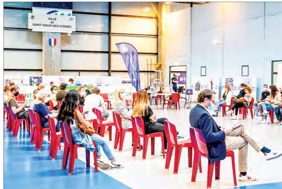
People wait to receive an injection of a COVID-19 vaccine at the temporary vaccination centre in a gymnasium in Saint-Maur-des-Fossés, outside Paris.

The new study, which involves 30 hospitals and has