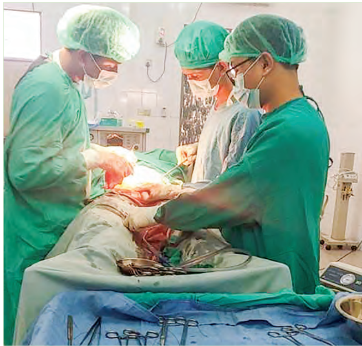
A local patient is undergoing operation at the Thabeikyin Tatmadaw hospital.

TATMADAW keeps providing healthcare services for patients at the military hospitals and temporary treatment hospitals in the townships of regions and states.