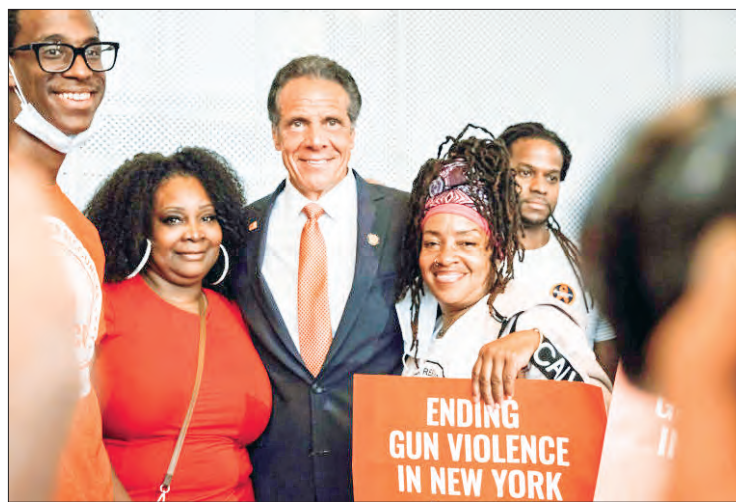
New York's governor issued new emergency measures to fight gun violence Tuesday, as he made it easier for shooting victims to sue gun manufacturers.

"If you look at the recent numbers, more people are now dying from gun violence and crime than COVID," Cuomo said in a press release.