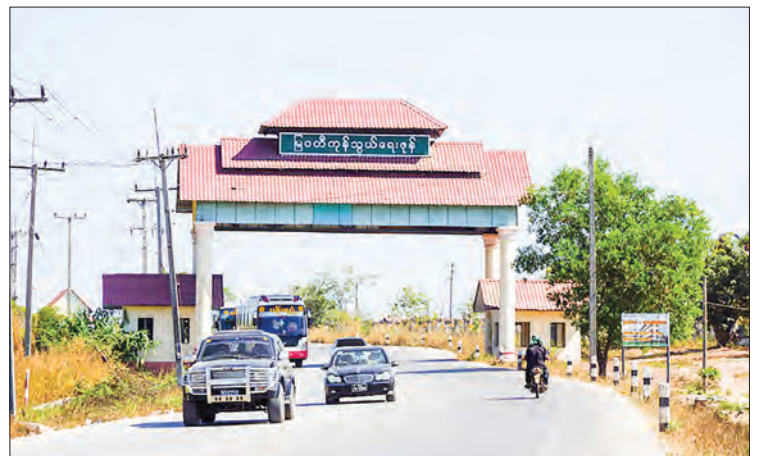
More quarantine centres have been opened in Myawady township of Kayin State to handle the growing number of COVID-19 infections in the township.

The township municipal committee has instructed every restaurant and teashop in the Myawady region to adopt only a take-away system. — Aye Maung/GNLM