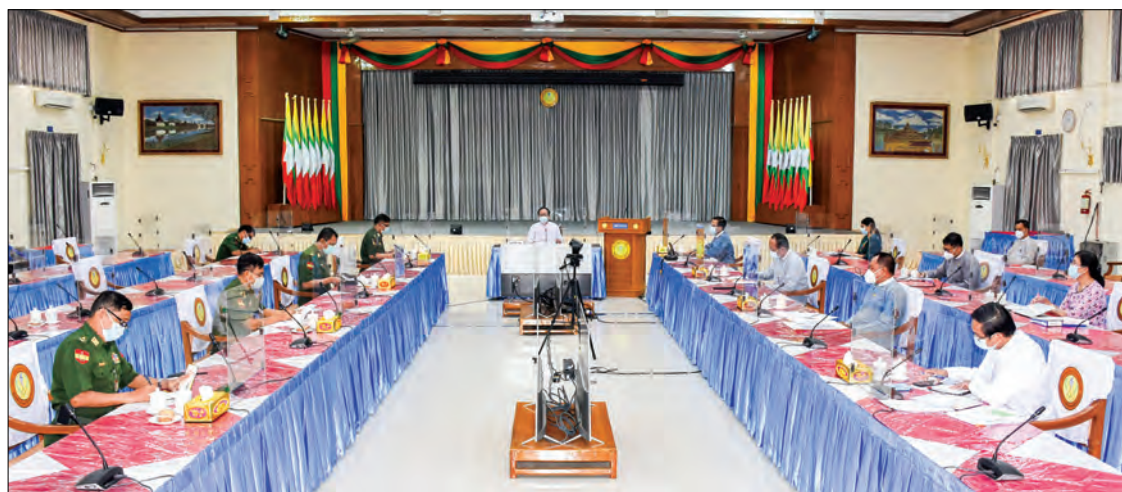
The COVID-19 Disease Prevention and Control Coordination Meeting in progress in Nay Pyi Taw yesterday.

The townships participating in the home-stay programme are being expanded in time and disease control regulations to be strictly followed are issued in Nay Pyi Taw Council Area, administration bodies and relevant states and regions, the Union Minister continued. "Immunizations are also being provided in a timely