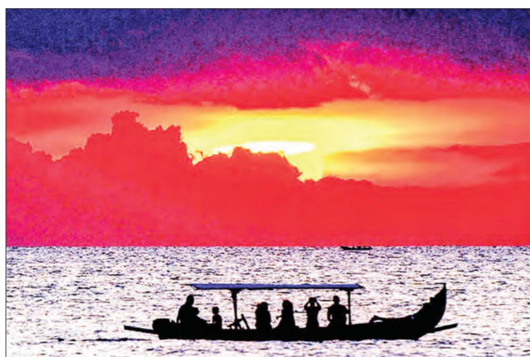
Foreign tourists on a traditional boat enjoy the sunset at Kuta beach in Bali.

The re-opening of Indonesia’s holiday islands to international tourists still seem a long shot.