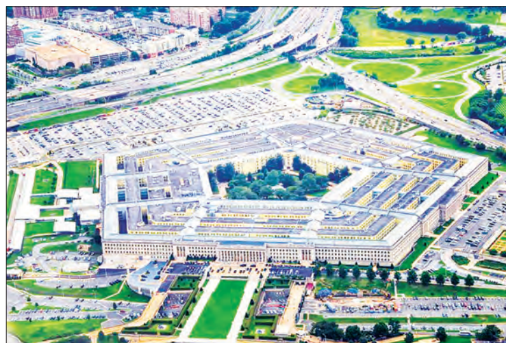
The US Pentagon said its JEDI contract specifications no longer met its current-day requirements.

Officials said that instead of going forward with the deal in the face of litigation, the government would start over with the aim of getting the most up-