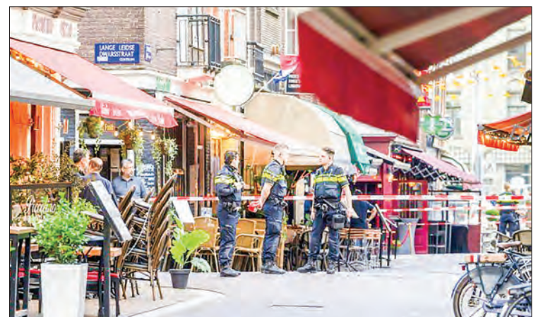
Police said three people had been arrested, among them the suspected shooter, but gave no details on the possible reasons for the attack.

ence. Eyewitnesses told local media that the 64-year-old journalist and TV presenter was shot up to five times, including once in the head. Police said three people had been arrested, among them the suspected shooter, but gave no details on the possible reasons for the attack. Prime Minister Mark Rutte told a press conference in The Hague the attack was "shocking and inconceivable".—AFP ■