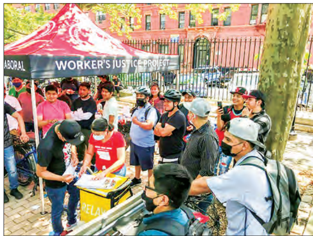
Hispanic food delivery men registered as members of the “Los Deliveristas Unidos” movement in Washington Heights, New York, on June 20, 2021.

In just a few months, “Los Deliveristas Unidos,” the first movement of independent riders for food delivery apps, has gained more than 1,000 members and over 13,000 Facebook