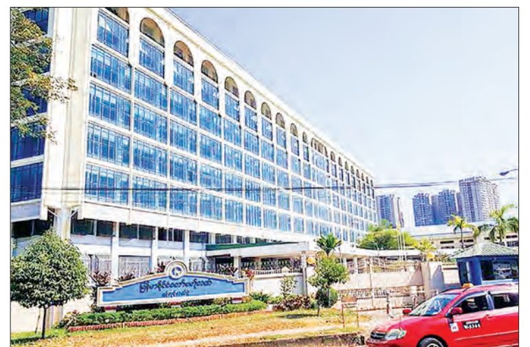
Central Bank of Myanmar in Yangon.

In 2019, the rates are pegged at K1,508-1,517 in July, K1,510-1,526 in August, K1,527-1,565 in September, K1,528-1,537 in October, K1,510-1,524