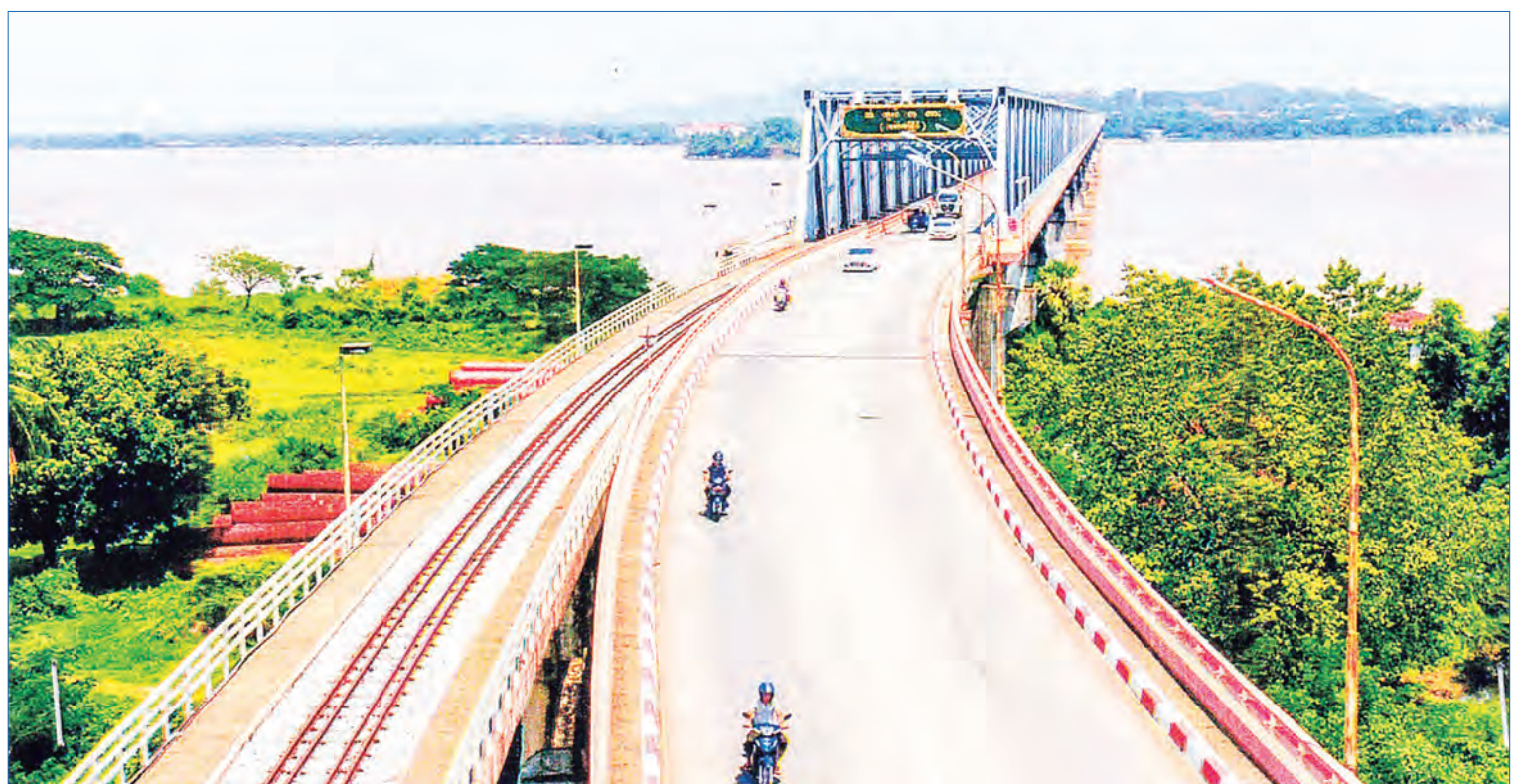
The Thanlwin Bridge (Mawlamyine) was built and opened by the government on 5 February 2005. Mon State has developed since then and has been free of the time-consuming troubles of waiting for a ferry boat to cross the river.

and the Department of Highway Mon State are making efforts to meet the needs of the state and the people as per the geographical location. The Ministry has been developing and implement-