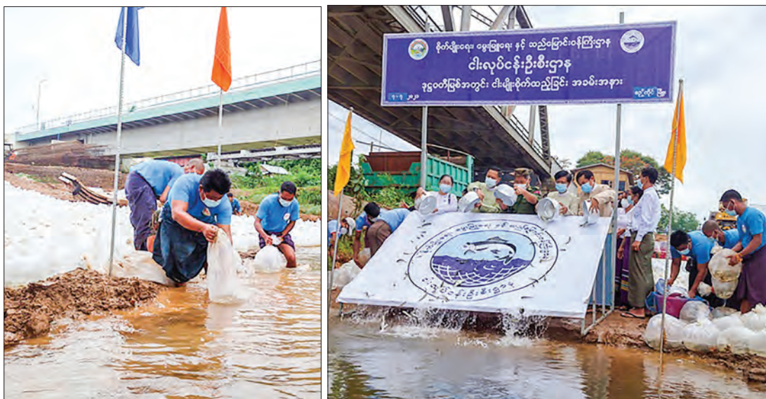
So far, the Kyaukse township fisheries department has already released over 10.8 million fingerlings from Nat Yekan, Kume, Thayetgone, Yay Nantthar fish hatching camps.

FOR the development of fish resources in Singaing township, Mandalay region, a total of 1 million fingerlings were released into the Dokhtawady River at 8:30 am on 7 July.