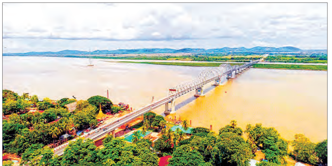
A bird's eye view of the Thanlwin Bridge (Chaungzon).

The Thanbyuzayat-Phayathonzu Road, an international link to Thailand, is 9 miles and 5 miles long from the Mon/Kayin border and has been upgraded from an earthen road to an asphalt road, with the project expected to be upgraded to four lanes. Of 15 miles of the 24-foot-wide Thanbyuzayat-Kyaikkhami road, 6 miles and 2 furlongs was upgraded to AC section at the end of 2020-2021FY and the rest 8 miles and 6 furlongs will be upgraded in the coming FY. Therefore, it will be more convenient for the