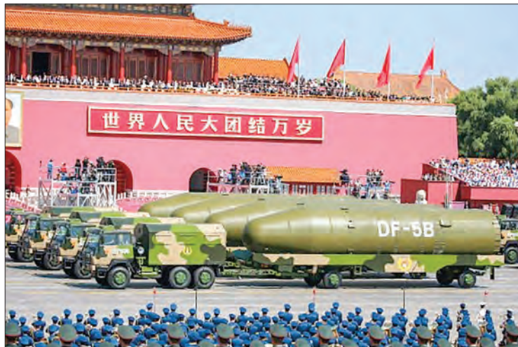
A study cited by The Washington Post suggests China is building more than 100 new sites suitable for launching its ICBMs.

"Despite what appears to be PRC obfuscation, this rapid buildup has become more difficult to hide," Price said. "And it highlights how the PRC appears