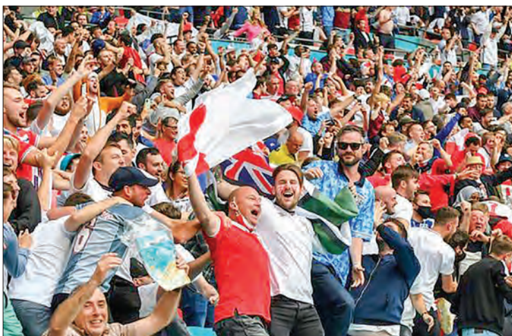
England supporters celebrate their team's win over Germany at Wembley.

AS Euro 2020 heads towards its conclusion, and ever larger crowds flock to matches, there are increasing concerns about games becoming super-spreader events as the Delta variant of coronavirus fuels a rise in