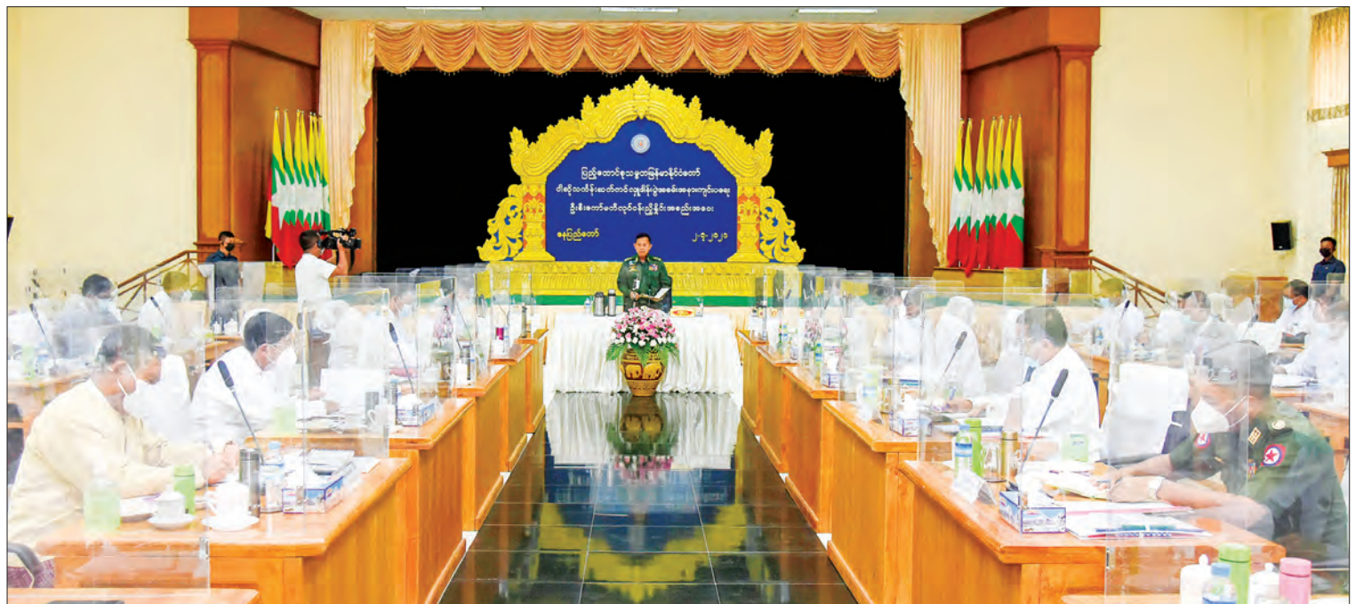
State Administration Council Vice-Chair Vice-Senior General Soe Win presides over the coordination meeting of the Leading Committee on Organizing the SAC Waso Robe-Offering Ceremony in Nay Pyi Taw on 2 July 2021.

In his address, the Vice-Senior General said the leading committee was formed with 13 mem-