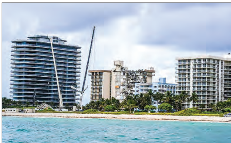
Rescuers have dwindling hopes of finding survivors in the partially collapsed 12-story Champlain Towers South condo building in Surfside, Florida.

"What amazed me about this group of people was their