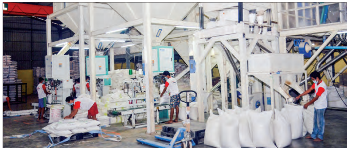
During the first three months of the current financial year, Myanmar exported over 720,000 tonnes of rice and broken rice worth over US$275 million.

Myanmar generated over US$800 million from rice export in the previous FY-2019-2020 ending 30 September with an estimated volume of over 2.5 million tonnes. — NN/GNLM