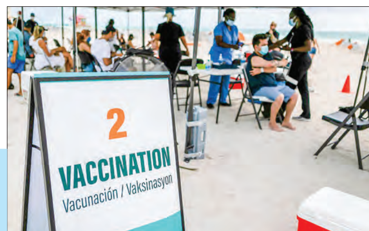
People get a Johnson & Johnson Covid-19 vaccine at a pop-up vaccination centre in South Beach, Florida on 26 June.