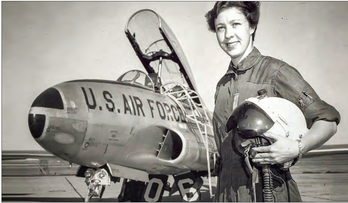
This undated handout photo obtained on July 1, 2021 courtesy of Blue Origin shows pilot Wally Funk, who at age 82 will become the oldest person ever to fly to space. PHOTO: HANDOUT/BLUE ORIGIN/AFP