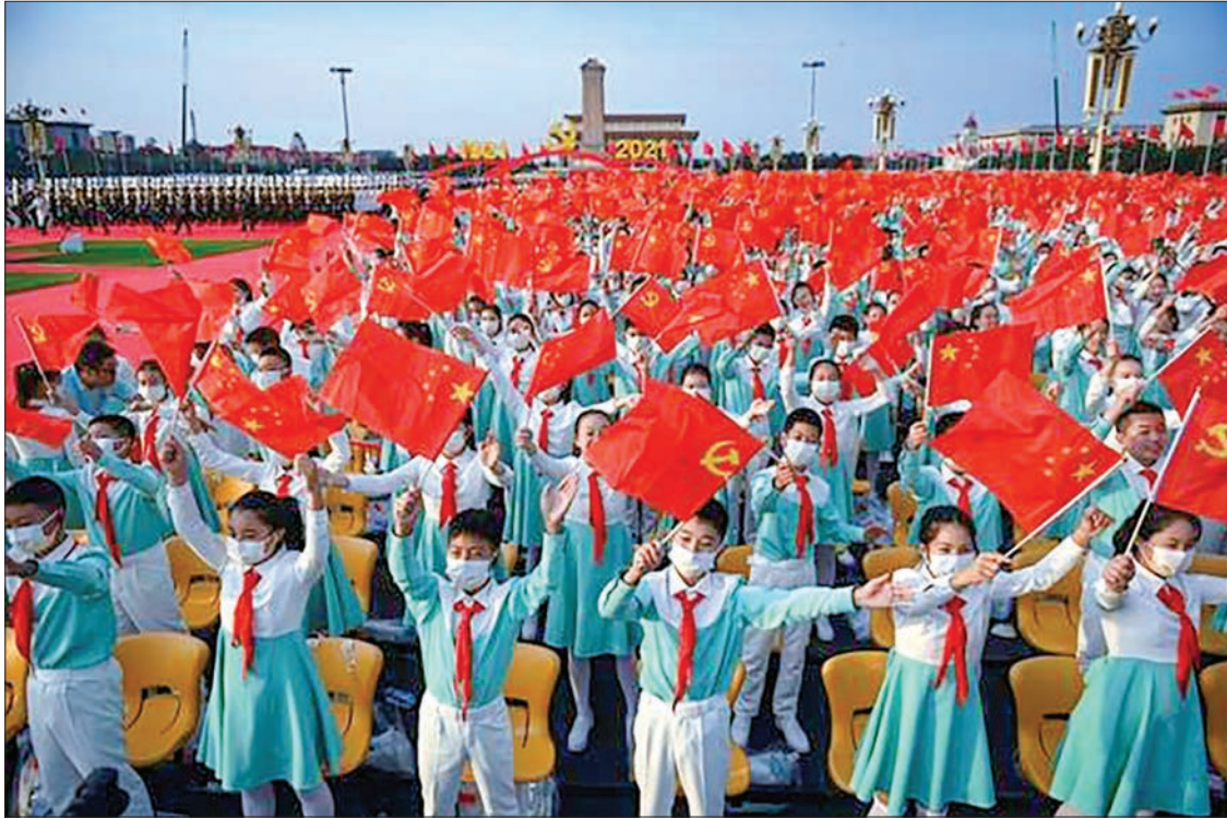
Students in Beijing celebrate the party's 100 th anniversary.

PRESIDENT Xi Jinping hailed China's "irreversible" course from colonial humiliation to great-power status at the centenary celebrations for the Chinese Communist Party on Thursday, in a speech reaching