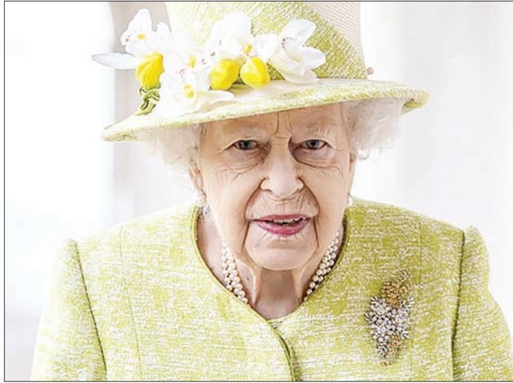
The Queen, who has met the chancellor several times during Merkel's 16 years in power, will host the German leader at Windsor Castle, west of London.

QUEEN Elizabeth II will host German Chancellor Angela