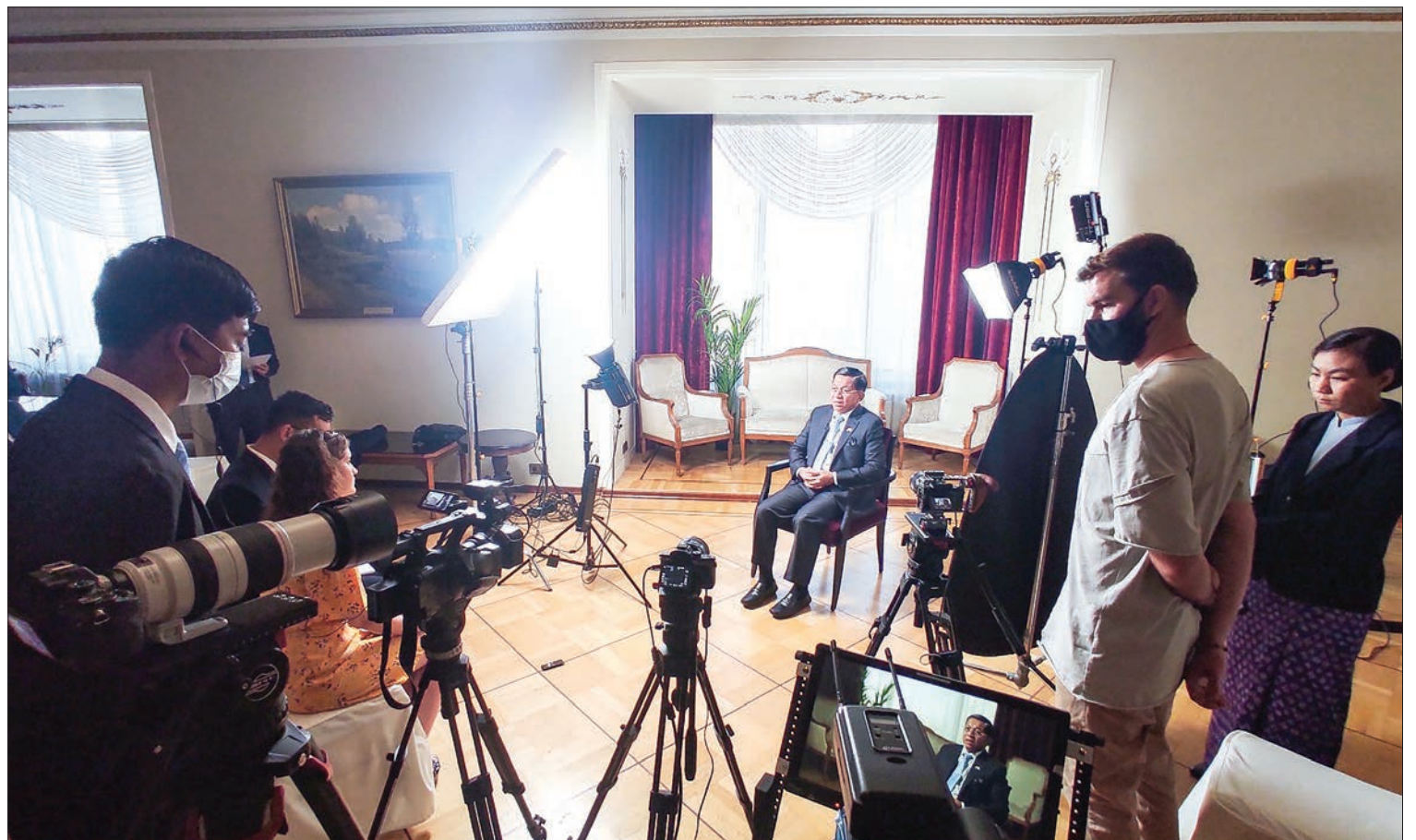
State Administration Council Chairman Senior General Min Aung Hlaing is answering the questions raised by the RIA news agency of the Russian Federation.

ror acts might have greater momentum. If so, our response might be violent. At this juncture, they will have to expect the chances of the international community interfering in the internal affairs of Myanmar. But, they may not reach such a situation. It is my highest estimation. It is my estimation only.