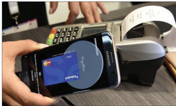
A customer making a payment via a mobile phone. Vipps will serve 11 million users and over 330,000 shops and web shops in Europe.

A group of banks in Denmark, Finland and Norway said on Wednesday they plan to merge their mobile payment apps to create one of the biggest services of its kind in Europe.