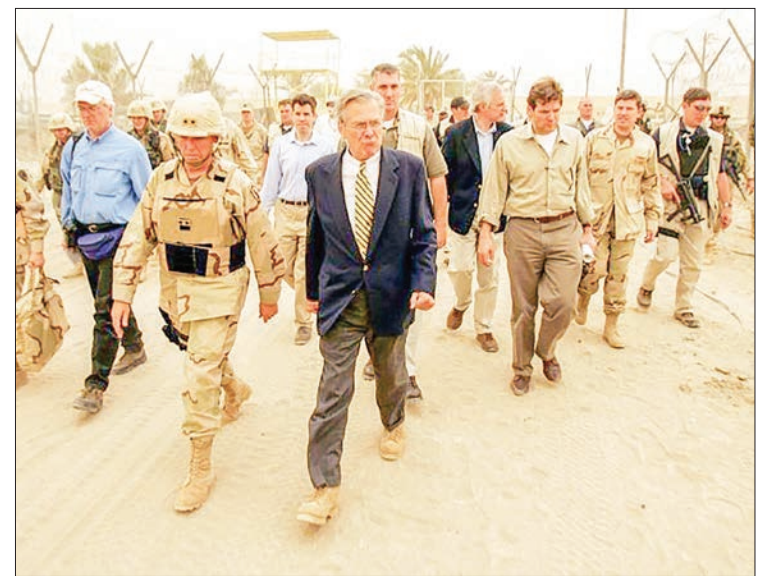
US Defense Secretary Donald Rumsfeld walks the grounds of the Abu Ghraib prison near Baghdad in May 2004.

The former congressman's brand of hawkish politics eventually fell from favour as politicians from both sides turned on "forever wars," and the troops he first sent to Afghanistan after the September 11, 2001 attacks will make their final withdrawal