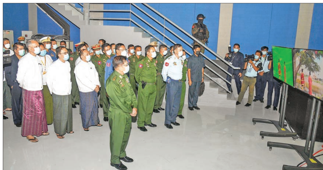
The Senior General and party are looking around inside the Myawady Media Centre on 2 May 2021.

derlined the primary duty of the Tatmadaw, which is to protect the country and he noted that skills and training appropriate to each rank are being provided in various training schools to improve the capacity of every member of the Tatmadaw.