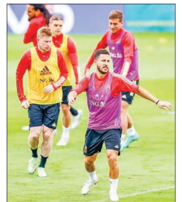
Kevin De Bruyne and Eden Hazard on Thursday were both absent from Belgium's final training session before their Euro 2020 quarter-final against Italy.

“Additionally, the VAR system will also be used for the first time in the 2021 AFC Cup final,” football authorities added. —GNLM