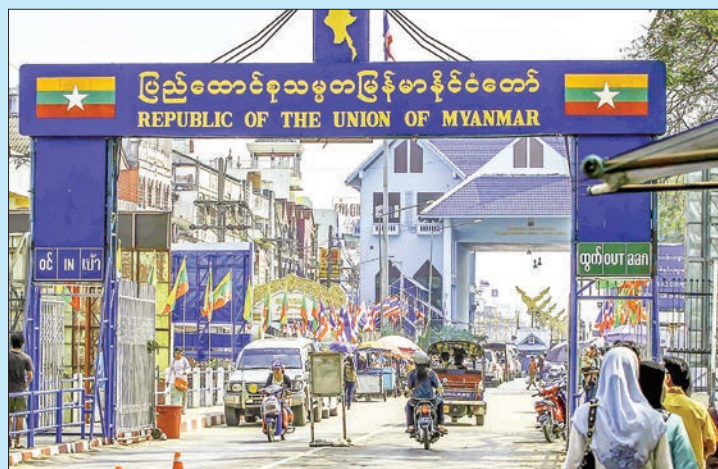
Myanmar's major export items are farm, animal, marine, forest, mining, CMP and other products. The country mainly imports capital goods, industrial raw materials, personal goods and CMP raw materials.

Myanmar's major export items are farm, animal, marine, forest, mining, CMP and other products. The country mainly imports capital goods, industrial raw materials, personal goods and CMP raw materials. — ZYA/GNLM