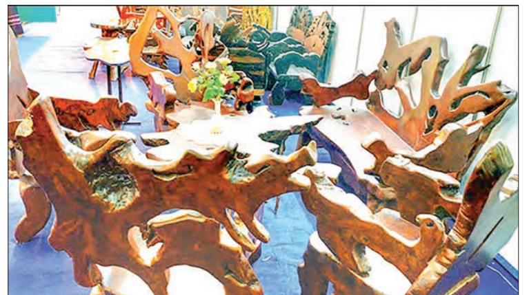
Myanmar's external trade between 1 October and 18 June in the current financial year 2020-2021 plummeted to US$21.48 billion, a sharp drop of 5.69 billion compared with the corresponding period of the FY2019-2020.

At present, the traders have transaction problems triggered by the restriction