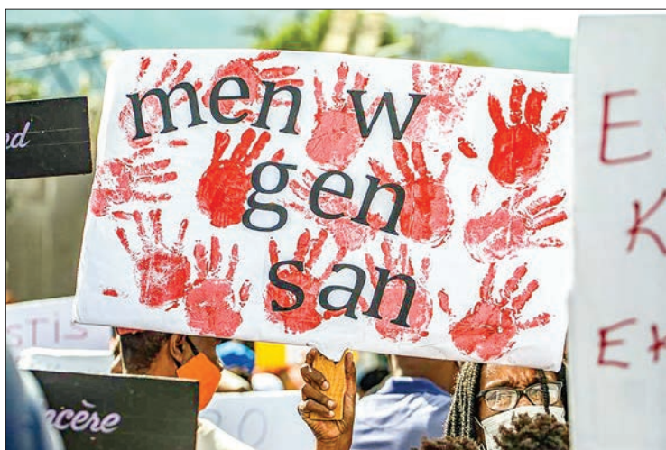
Haitians demonstrate on 10 December, 2020, in Port-au-Prince, on the occasion of International Human Rights Day, demanding their right to life in the face of an upsurge in kidnappings perpetrated by gangs.

At least 15 people, including a journalist and an opposition activist, were killed in Haiti in overnight violence suspected to be revenge attacks after the death of a police officer, offi-