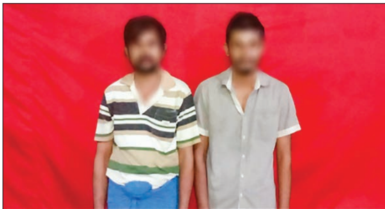
Two suspects arrested for homemade bomb blast in Thanlyin.

TERRORISTS threw a homemade bomb from a white car at the security forces checking vehicles near Aungthukha traffic light on Shukhintha Road, Thanlyin Township, Yangon at around 8 pm on 30 June, and ran away when security forces opened fire.