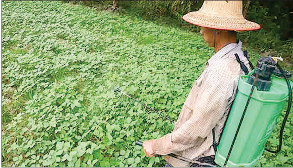
In May 2021, India's Ministry of Agriculture and Farmers Welfare approved not only black gram but also other pulses being imported from Myanmar that have the bill of lading up to October-end 2021, with relaxations of conditions regarding clearance consignment.

Myanmar can export 250,000 tonnes of black gram (urad) and 100,000 tonnes of pigeon peas under the G to G (government to government) pact during the April-March period between the 2021-2022 financial year and the 2025-2026 FY. The bilateral nego-