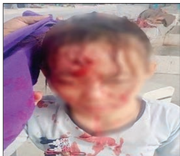
A woman was wounded by a homemade mine in Sangyoung.