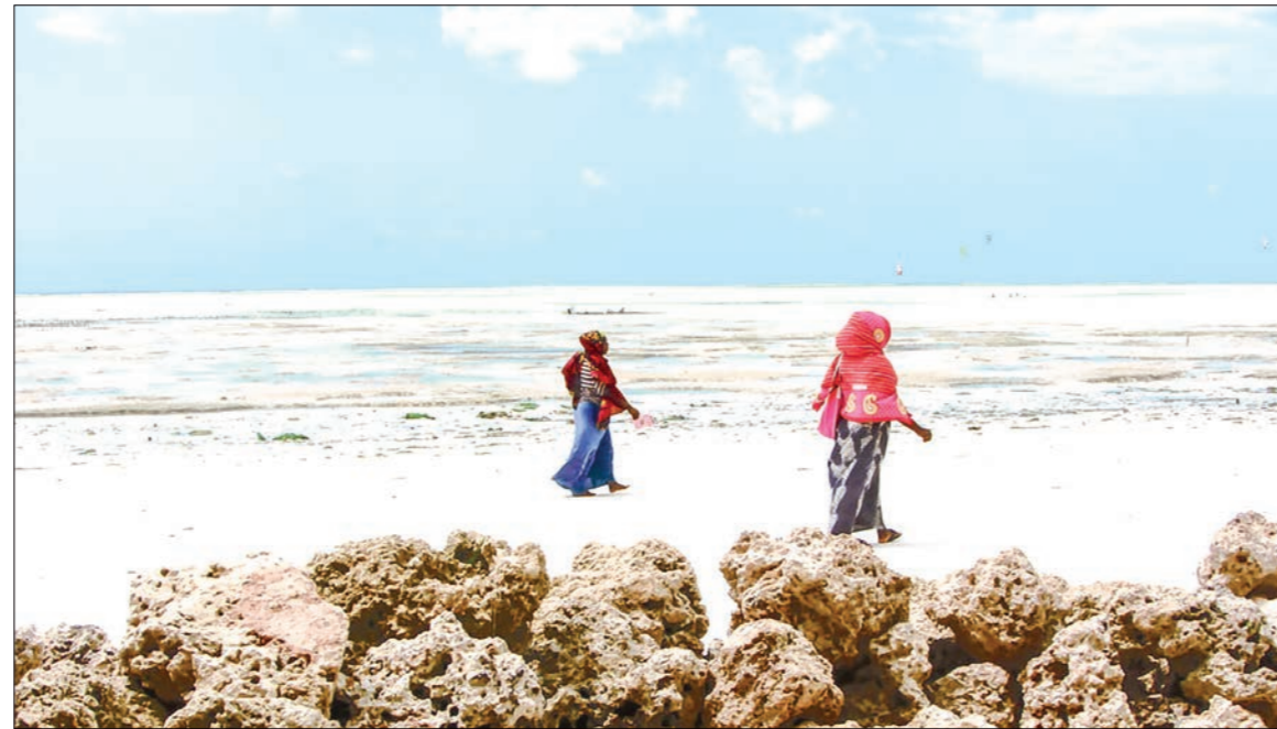
The crash in international tourism due to the coronavirus pandemic could cause a loss of more than $4 trillion to the global GDP for the years 2020 and 2021.

"Tourism is a lifeline for millions, and advancing vaccina-