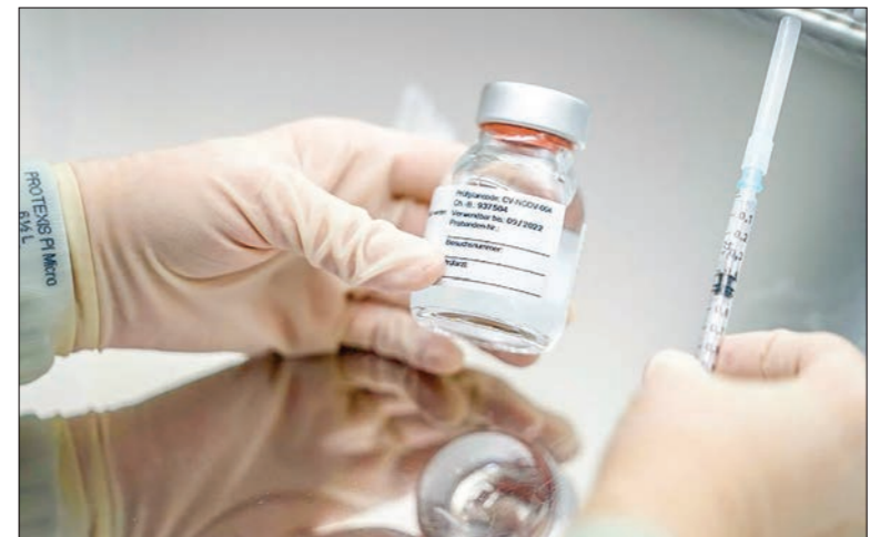
CureVac said in May that independent analysis "found no safety concerns" with its two-dose vaccine.