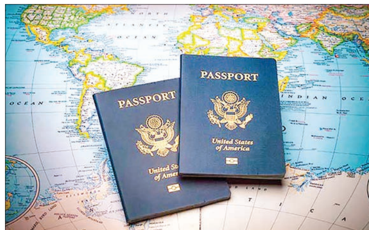
Earlier medical certification was needed to mark a gender on passports different from birth certificates.

"The process of adding a gender marker for non-binary, in-