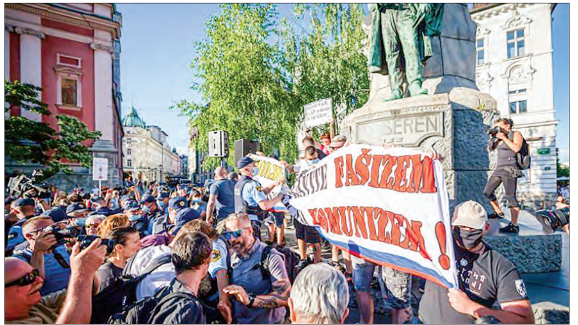
Riot police intervenes to stop a group of extremists that shortly provoked an incident at the beginning of the anti-government rally in Ljubljana on June 25, 2021.

Orban praised Slovenia's "tradition, spirit and pride" as well as its current "courageous leadership".