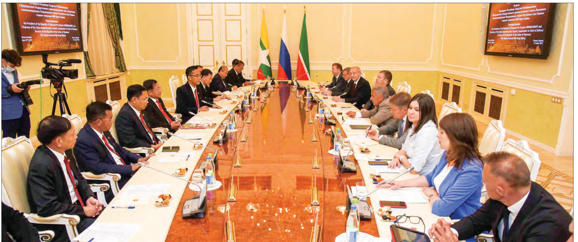
State Administration Council Chairman Commander-in-Chief of Defence Services Senior General Min Aung Hlaing meets President of the Republic of Tatarstan Mr Rustam Nurgaliyevich Minnikhanov on 25 June.