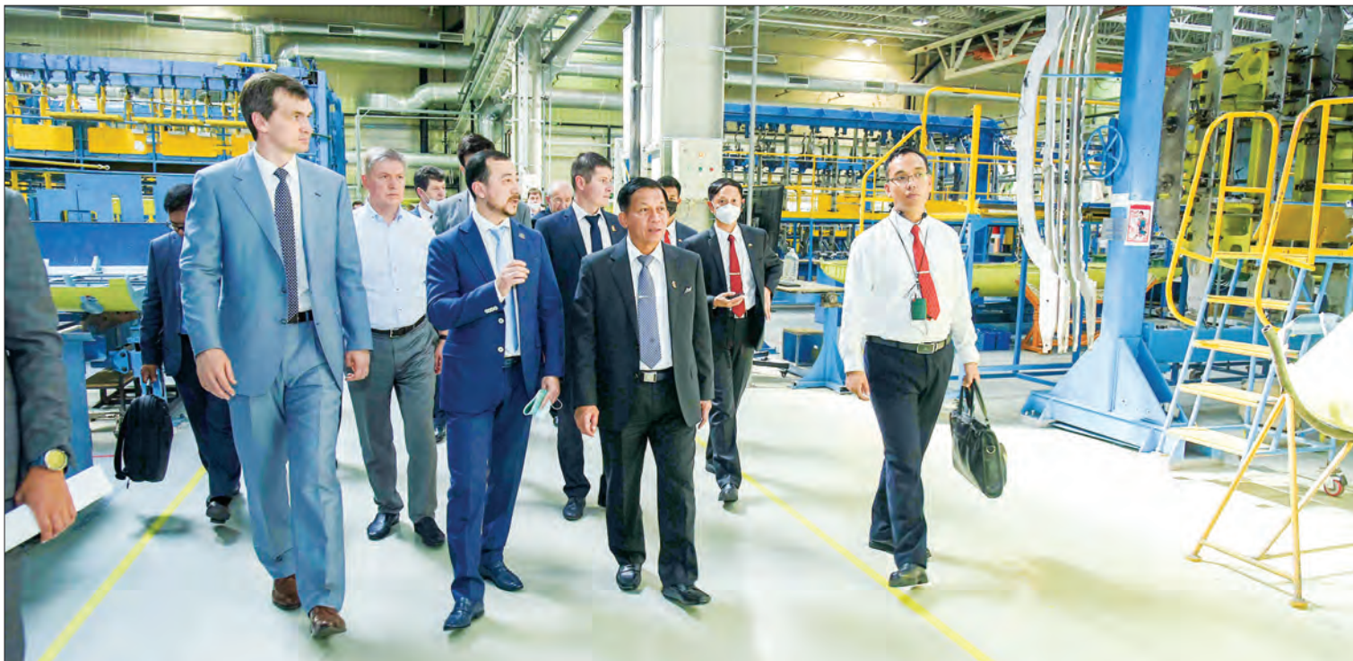
State Administration Council Chairman Senior General Min Aung Hlaing is viewing around the PJSC Kazan Helicopters factory in Kazan, capital of the Republic of Tatarstan on 25 June.

THE delegation led by Chairman of the State Administration Council Commander-in-Chief of Defence Services Senior General Min Aung Hlaing, ac-