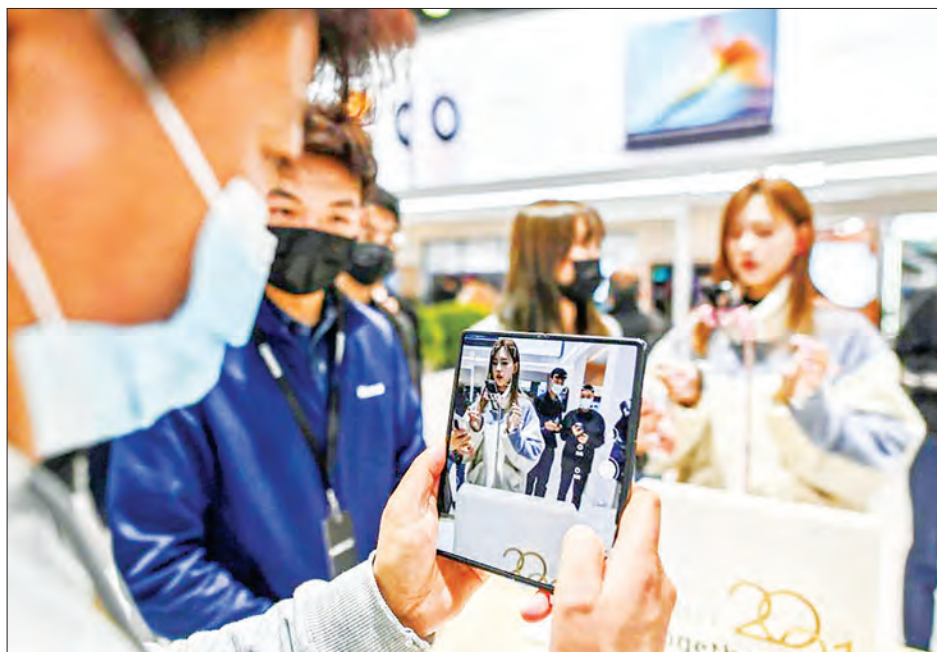
A man inspects a Huawei Mate X2 at the Mobile World Congress in Shanghai last February. China's beleaguered Huawei, whose smartphone business has been battered by US sanctions, will be the biggest firm with a physical presence at the show in Barcelona.

The GSMA has limited attendance to 50,000 compared with a normal attendance of around 100,000. It expects 30,000-35,000 people to actually attend, although Granryd warned it was "very difficult" to make forecasts this year.— AFP ■