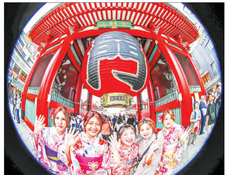
Photo taken with a fisheye lens on May 22, 2019, shows tourists posing for a photo in front of the Kaminari Gate at Sensoji Temple in Tokyo.

TOKYO has ranked the fourth most expensive city for expatriates in an annual cost of living survey by a U.S. consulting firm, dropping one spot from last year.