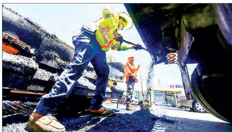
A US infrastructure improvement agreement is good news for construction and oil companies, among others.