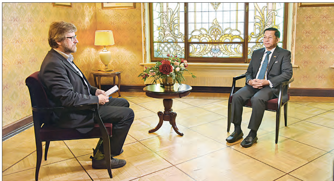
Russia 24 interviews Senior General Min Aung Hlaing.

A: It is right. Such difficulties unexpectedly emerged when efforts are being made to develop democracy in Myanmar. As we responded to violent acts in taking action against such measures, we faced various blames due to misunderstanding over us. I'd like to say protests are generally staged against a government in a democracy. Such event may happen in every country. There are many examples of similar events. But, if ordinary protests may be transformed into terror acts and attacks, relevant responsible security organization needs to respond to such acts not to harm the people as well as not to undermine the rule of law. If their acts are beyond the restrictions, we need to take action against them under the law. Whoever commits the acts beyond the restrictions, we will take action under the law. So, we don't have any refusal over the event. In fact, such an event is based on malpractices in the elections performed in a practice of democracy. Although such an event could be cleared in the early stage, the problem happened due to the absence of holding the dialogues to address the malpractices. I have declared the five-point road map as our future plans since we took the office. If the state of emergency and appropriate processes would have been completed, I have given a promise to hold an election democratically with-