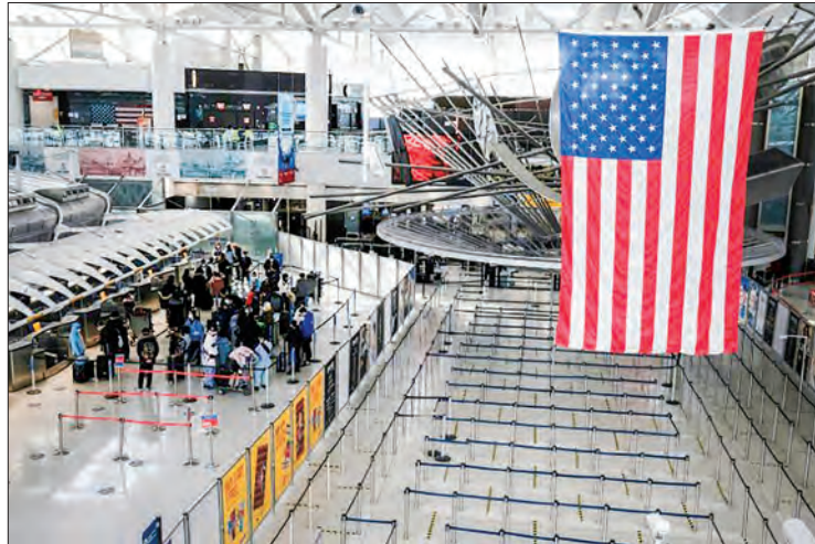
EU countries have reopened their borders to Americans who are vaccinated or test negative for Covid-19, but the United States has not reciprocated.

The US Chamber of Commerce on Friday urged Washington to allow the return of European travelers "as soon as possible."