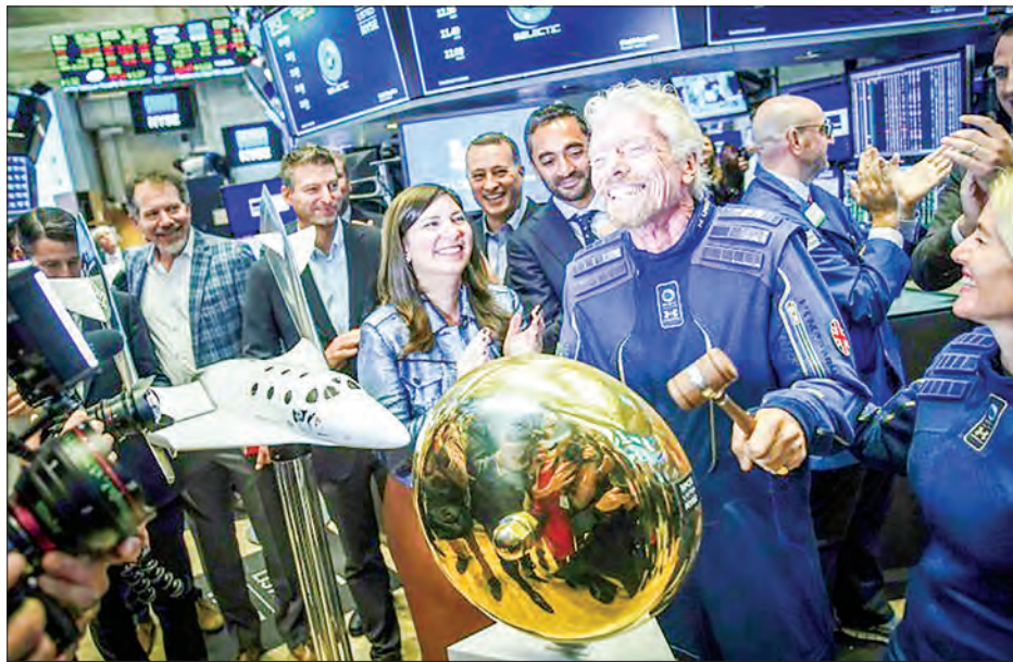
Sir Richard Branson rang the bell of the New York Stock Exchange in October 2019 for the first day of trading of Virgin Galactic Holdings, which has now received approval to fly passengers to space.