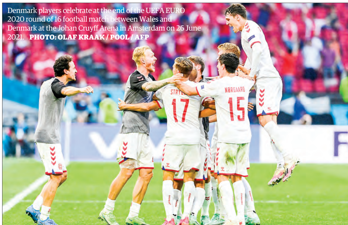
Denmark players celebrate at the end of the UEFA EURO 2020 round of 16 football match between Wales and Denmark at the Johan Cruyff Arena in Amsterdam on 26 June 2021.

Eriksen, still recovering at home after his cardiac arrest, was present in everyone's minds at the home of Ajax, and that combined with a vast Danish support inside the one-third full Johan Cruyff Arena made this occasion like a Danish home game.— AFP ■