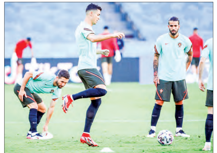
Portugal's forward Cristiano Ronaldo (C) and teammates take part in an MD-1 training session at La Cartuja stadium in Seville on 26 June 2021, on the eve of their UEFA EURO 2020 round of 16 football match against Belgium.

JAN Vertonghen said that Belgium's focus wouldn't just be on Cristiano Ronaldo as the Red Devils prepare to take on Portugal in a Euro 2020 last-16 showdown between two of the tournament favourites.