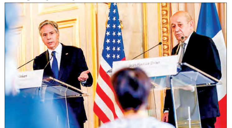
Both US Secretary of State Antony Blinken (L) and France's Foreign Minister Jean-Yves Le Drian urged Iran to return to the nuclear accord.

But Blinken said that Biden still supports a return to the accord, under which Iran had drastically scaled back its nuclear work until Trump withdrew in 2018 and imposed crippling sanctions. — AFP ■