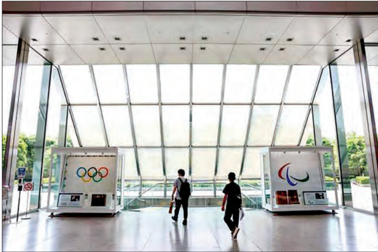
Olympic and Paralympic Games' official flags are on display at Tokyo Metropolitan Government Building in Tokyo on June 24, 2021.