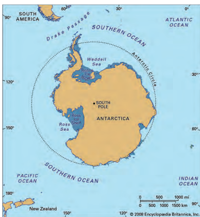
Southern Ocean, also called Antarctic Ocean, the portions of the world ocean south of the Pacific, Atlantic, and Indian oceans and their tributary seas surrounding Antarctica below 60° S. It is unbroken by any other continental landmass.

Environment Changes to the ocean's physical, chemical, and biological systems have taken place because of climate change, ocean acidification, and commercial exploitation. The Southern Ocean is subject to all international agreements regarding the world's oceans; in addition, it is subject to these agreements specific to the Antarctic region: International Whaling Commission (prohibits commercial whaling south of 40 degrees south [south of 60 degrees south between 50 degrees and 130 degrees west]); Convention on the Conservation of Antarctic Seals (limits sealing); Convention on the Conservation of Antarctic Marine Living Resources (regulates fishing).