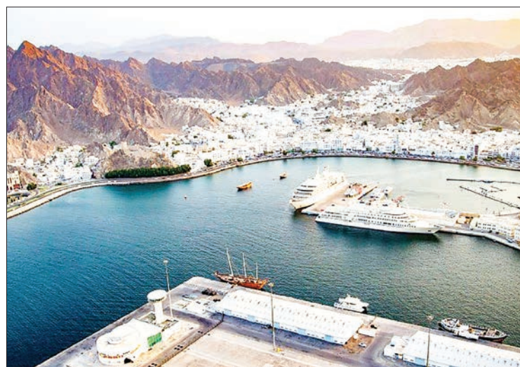
Sultan Qaboos port in the Omani capital Muscat, from the air.

OMAN will begin issuing long-term residency to foreign investors, the government said Wednesday as authorities attempt to shore up the Gulf nation’s flagging economy.