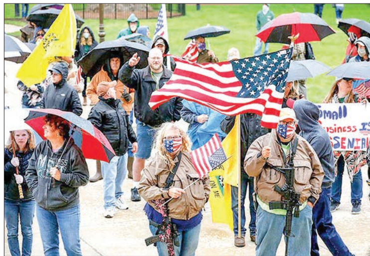
Armed demonstrators protest in Lansing, Michigan, May 14, 2020.

US President Joe Biden laid out new measures Wednesday to tackle America's gun crisis against a backdrop of surging