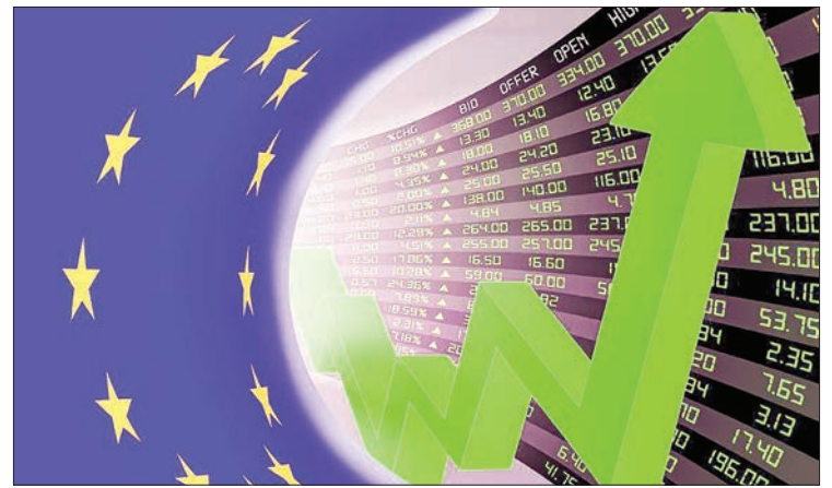
Business activity in the eurozone jumped at its fastest rate in 15 years in June.

“The strength of the upturn – both within Europe and globally – means firms are struggling to meet demand, suffering shortages of both raw materials and staff,” Williamson said.—AFP