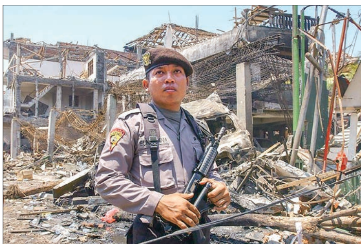
Hardline Islamist groups depend on a charity box scam to pay for operations across Indonesia, which has suffered a series of hotel bombings and other attacks over the years.

belonged to Jemaah Islamiyah (JI) – the notorious network behind Indonesia's deadliest terror