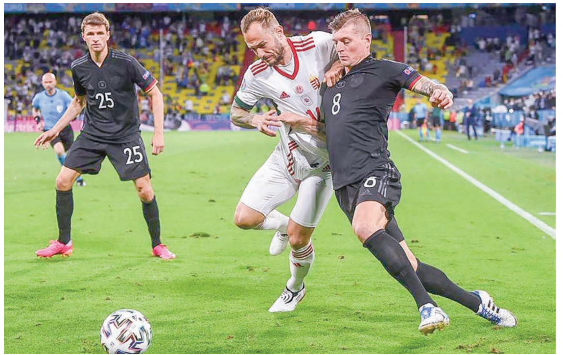
Germany were facing elimination from Group F on Wednesday until second-half replacement Leon Goretzka fired in the crucial late equaliser to seal a 2-2 draw with Hungary which put Joachim Loew's side into the last 16.

MANUEL Neuer says Germany are relishing a return to Wembley to face England in the last 16 of Euro 2020, 25 years after breaking English hearts at the tournament. Germany were facing elimination from Group F on Wednesday until second-half replacement Leon Goretzka fired in the crucial late equaliser to seal a 2-2 draw with Hungary which put Joachim Loew's side into the last 16.