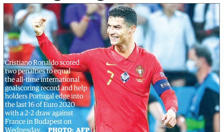
Cristiano Ronaldo scored two penalties to equal the all-time international goalscoring record and help holders Portugal edge into the last 16 of Euro 2020 with a 2-2 draw against France in Budapest on Wednesday. PHOTO: AFP

World champions France will next take on Switzerland in Bucharest on Monday.— AFP ■