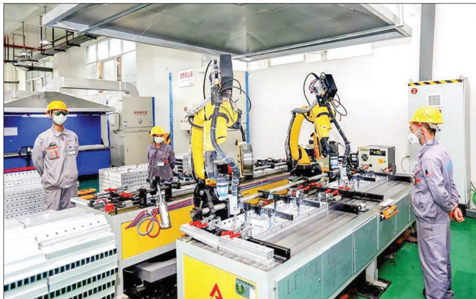
Employees check production at a smart facility of an aluminum product company in Liupanshui, Guizhou province.

The commission said it would work with other departments to release the nonferrous metal reserves in multiple batches as needed in light of market price changes.—Xinhua ■