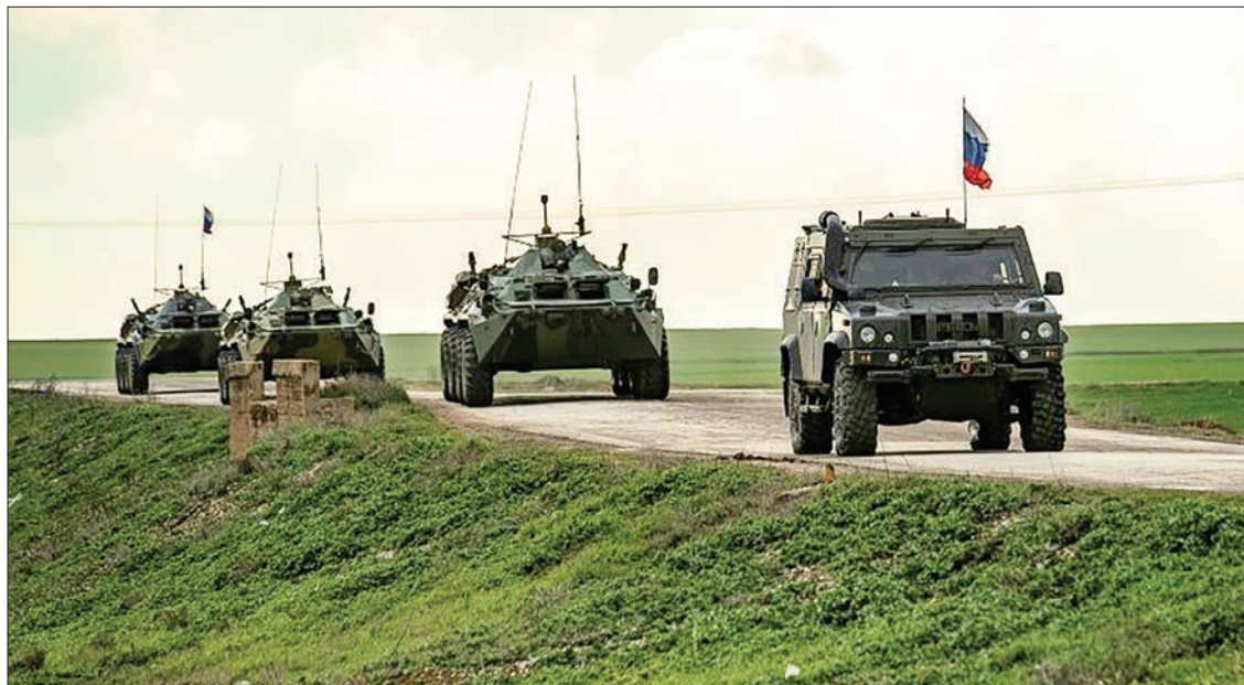
In this file photo taken on February 22, 2020 Russian military vehicles patrol the M4 highway in the northeastern Syrian Hasakeh province on the border with Turkey.

THE UN and a handful of countries pressured Russia Wednesday to continue allowing authorization of the only border crossing through which humanitarian aid