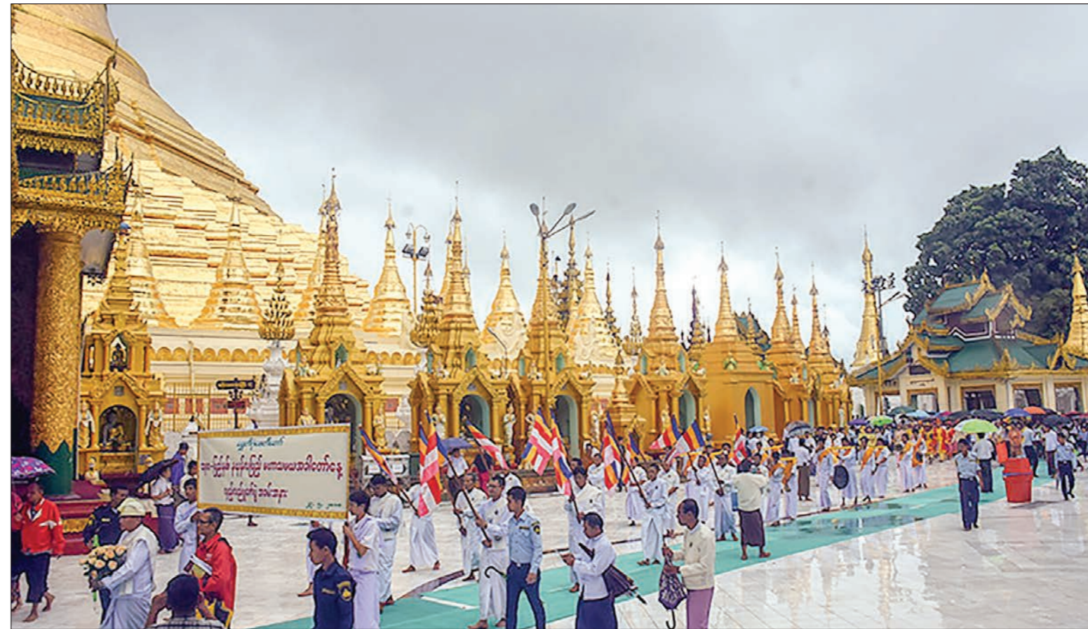
Buddhist devotees celebrate Maha Samaya Day at Shwedagon Pagoda in Yangon.

In this regard, the Lord Buddha preached the Suttas depending on the characters of the Sangha—Samma Paribbaniya