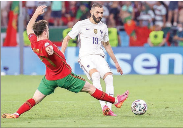
Karim Benzema said he was delighted to score his first goals for France since 2015 against Portugal on Wednesday, as there was "a little pressure" on him across the country.

But he netted a first-half penalty in the final Group F game against Portugal before slotting in a second to end his long wait. "A lot of joy, a lot of pride," he said to BeIN Sports. "I think everyone was waiting for it. There was a little pressure on me from all over the country but I'm a footballer, a professional—I need that pressure." A 2-2 draw, which also saw Cristiano Ronaldo score twice to equal the all-time international goalscoring record, sent France through as group winners. Deschamps' men will face Switzerland in the last 16 on Monday in Bucharest. "He (Benzema) was looking for that. He hasn't lost his confidence, or mine," Deschamps told TF1. "We will recover well and then we'll prepare for that (Switzerland game) as well as possible." — AFP ■