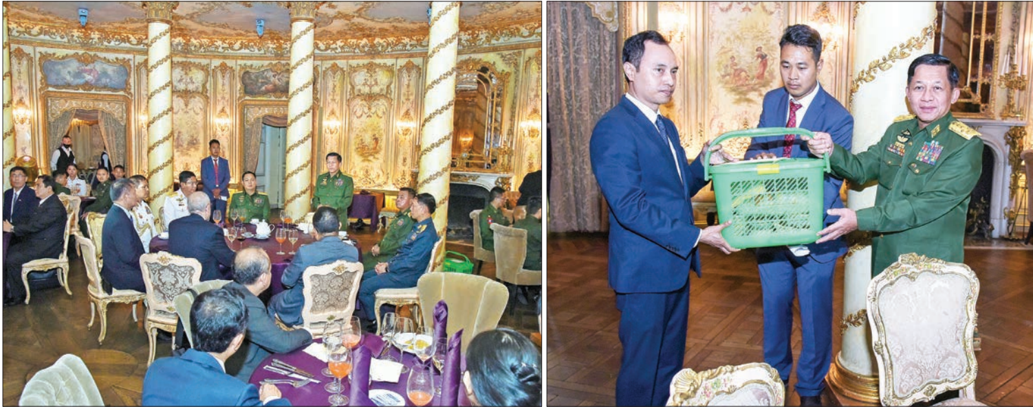
State Administration Council Chairman Senior General Min Aung Hlaing meets families of the Myanmar Embassy and the office of Myanmar Military attaché (Army, Navy and Air) and scholarship trainees at Turandot restaurant in Moscow. He is giving gifts and cash awards to them.

STATE Administration Council Chairman Commander-in-Chief of Defence Services Senior General Min Aung Hlaing on 23 June afternoon met with families of the Myanmar Embassy to the Russian Federation and the Office of Myanmar Military Attaché (Army, Navy and Air)