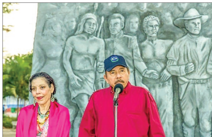
Nicaraguan President Daniel Ortega (R) and Vice-President Rosario Murillo attend an anniversary ceremony for the birth of Sandinista leader Carlos Fonseca Amador in Managua on June 23, 2021.

Pro-government security and paramilitary forces have arrested 19 people, including five opposition presidential challengers as well as journalists, businessmen and a banker. — AFP ■