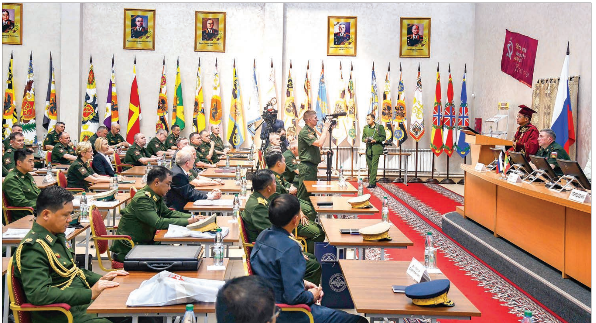
The ceremony to confer the honorary professor on State Administration Council Chairman Commander-in-Chief of Defence Services Senior General Min Aung Hlaing by the Military University of the Defense Ministry of the Russian Federation in progress.

A CEREMONY to confer the honorary professor on Chairman of the State Administration Council Commander-in-Chief of Defence Services Senior General Min Aung Hlaing who attended the 9 th Moscow Conference on International Security-2021 (MCIS-2021) took place at the Military University of the Defense Ministry of the Russian Federation on 23