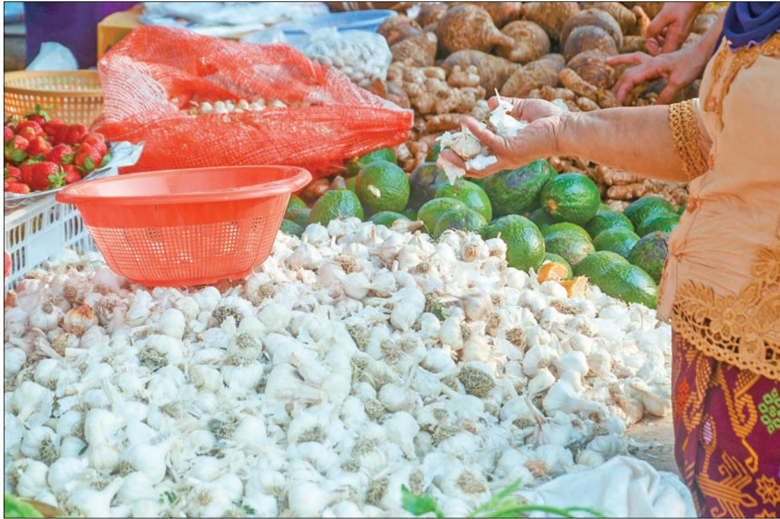
The prices of kitchen crops (onion, garlic, chilli, potato and spices) are rising in the Yangon market, according to trade data released by Yangon Bayintnaung Wholesale Centre.

THE prices of kitchen crops such as onion, garlic, chilli, potato and spices are rising in the Yangon market, according to trade data released by Yangon Bayintnaung Wholesale Centre.