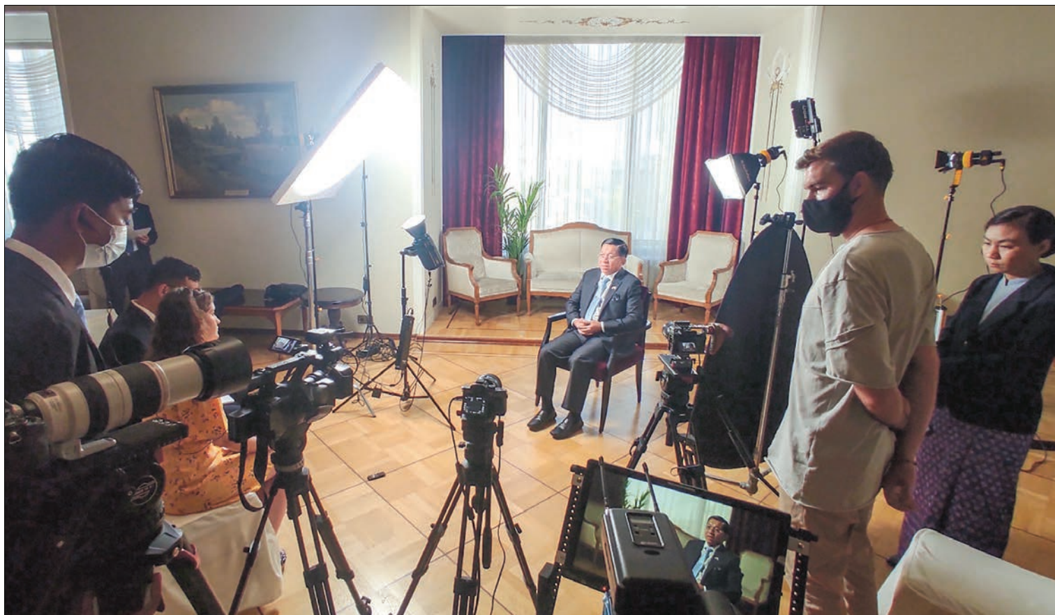
State Administration Council Chairman Senior General Min Aung Hlaing's interview with RIA News Agency at the Metropol Hotel in the Russian Federation.