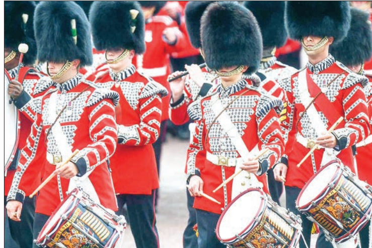
Britain's royal family for the first time revealed how many ethnic minority staff it employs on Thursday, and admitted it has not made sufficient progress on diversity. The Massed Bands perform.

The palace disputed the claim, saying "recollections may vary", while Harry's elder brother, Prince William, insisted: