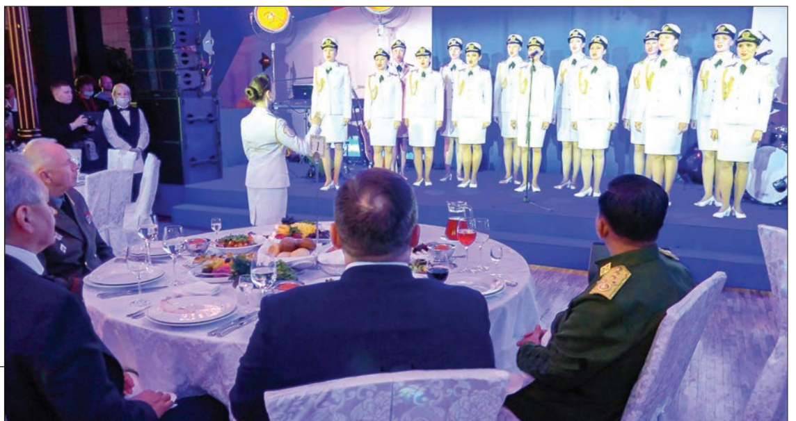
During the dinner reception period, the musical troupes of the Russian Defense Ministry performed the traditional songs and dance.