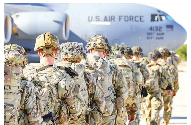
The top US military official, General Mark Milley, on Wednesday defended the necessity of studying even controversial parts of history.

Two Republican lawmakers in the House of Representatives, including Trump supporter Matt Gaetz, took advantage of a congressional hearing with Milley, who is the chairman of the US Joint Chiefs of Staff, and Defense Secretary Lloyd Austin to ques-