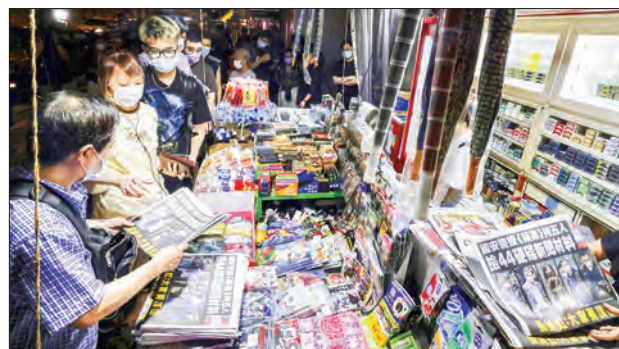
People stand in a queue to purchase copies of the Apple Daily at a newspaper stand in Hong Kong in the early hours of 18 June, 2021.

The newspaper increased its print run to 550,000 in August last year, up from its usual daily circulation of 70,000 to 100,000 copies, following the arrest of Lai. — Kyodo News ■