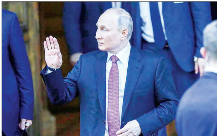
Putin said Russia was ready to continue the talks provided Washington was also willing to do so.

The Russian leader said the meeting was "quite friendly" and that he and Biden "were able to