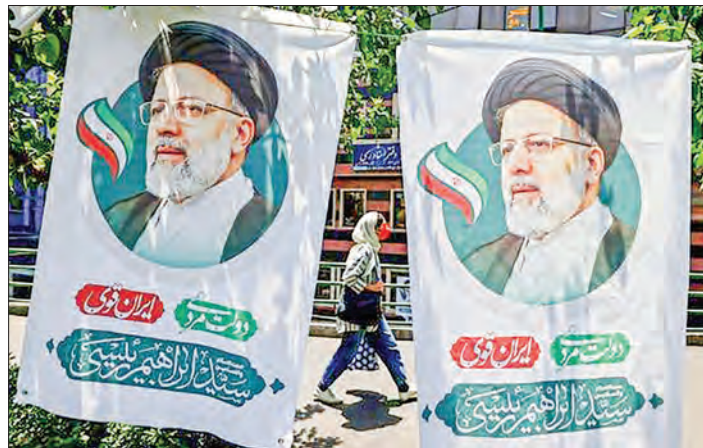
Ultraconservative cleric Ebrahim Raisi appears to be the frontrunner in Iran's presidential election due to take place on Friday and has been named by Iranian media as a possible successor to supreme leader Ayatollah Ali Khamenei.

"How can we vote for these people who did this to us? It's not right." — AFP ■