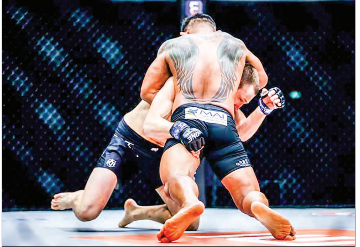
Aung La N Sang (upper position) tries to choke his rival Reineir De Ridder at ONE Inside the Matrix event in Singapore on 30 October, 2020.

After losing ONE middleweight and light heavyweight title belts, Aung La N Sang is set to challenge for the Middleweight title later this year, with at least one more bout for the Burmese Python to come this year. —GNLM