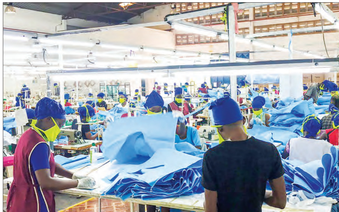
Workers manufacture PPE in a Kenyan factory.

Diversity defines the world's middle-income countries, which were already home to some 62