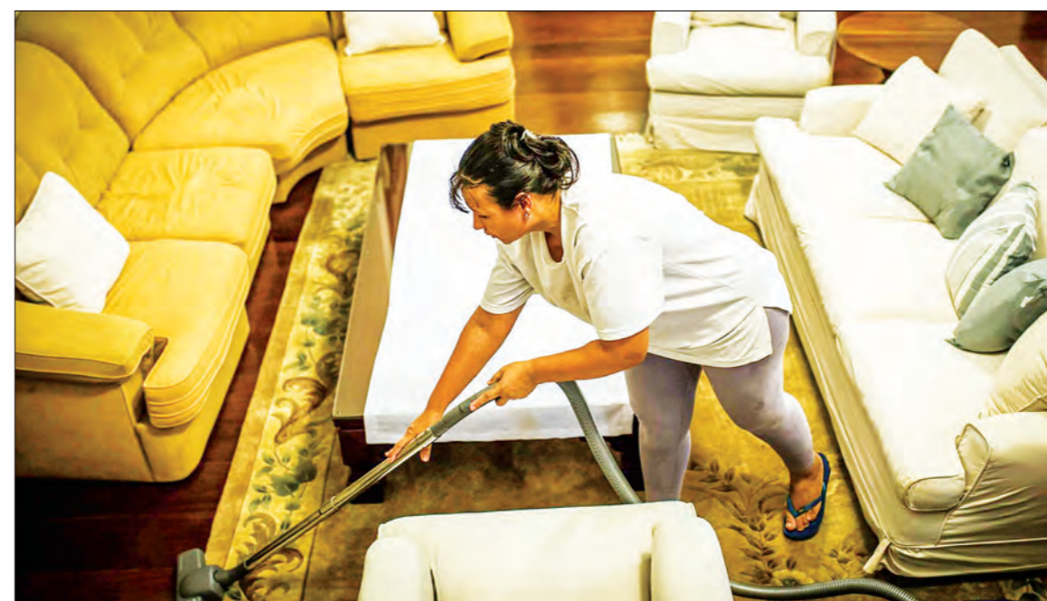
According to ILO, there are at least 75.6 million domestic workers aged 15 and over, amounting to around one in 25 people employed worldwide. Just over three-quarters are women.