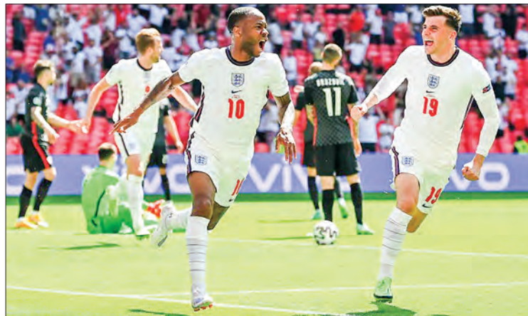
England can join Italy, Belgium and the Netherlands in the last 16 of Euro 2020 on Friday if the Three Lions get the better of neighbours Scotland in a grudge match at Wembley.

"For the fans and for us it is a big occasion but it is another opportunity for three points and our objective is qualification. That