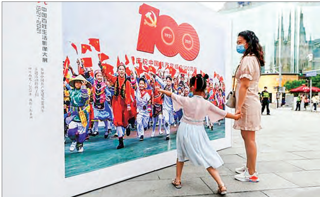
Banners and billboards have been placed around the country reminding citizens to live a “civilized” life and obey authorities.

CHINA is ramping up a propaganda blitz ahead of the 100th birthday of the ruling Communist Party, with banners and billboards around the country reminding citizens to live a “civilised” life and obey authorities.