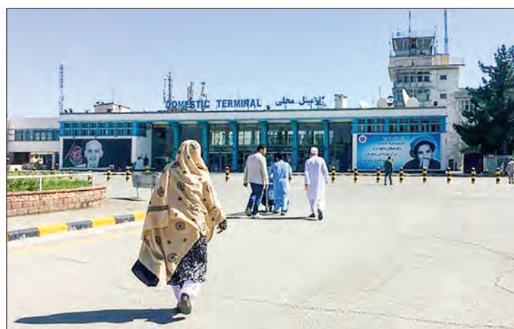
Passengers arrive at the domestic terminal of the Hamid Karzai International Airport in Kabul in 2018.

THE United States on Thursday hailed a commitment by Turkey to secure Kabul’s airport, addressing one key area of concern amid fears the government will collapse once US forces leave.