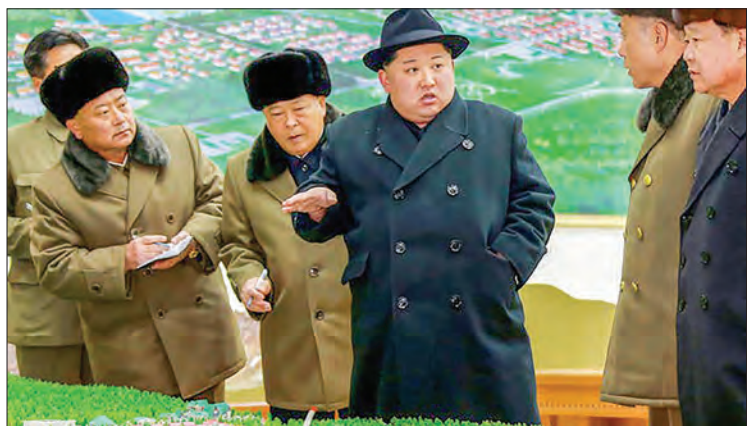
North Korean leader Kim Jong Un says his country needs to be ready for both dialogue and confrontation with the United States.

NORTH Korean leader Kim Jong Un has said the country must prepare for both "dialogue and confrontation" with the United States, but with a particular emphasis on the latter as Pyongyang probes for any US policy shift under President Joe Biden.