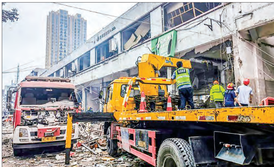
The blast prompted a rare statement from Chinese President Xi Jinping urging local officials to “learn profound lessons” from it.

building that had previously housed a vehicle frame manufacturer; and several survivors told local media that the gas pipeline had fallen into disrepair after the factory was moved last year.