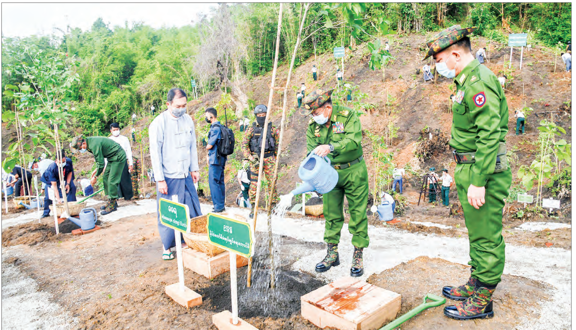
State Administration Council Chairman Commander-in-Chief of Defence Services Senior General Min Aung Hlaing seen watering a star-flower sapling at the rainy season tree planting ceremony in Nay Pyi Taw on 18 June 2021.

CHAIRMAN of the State Administration Council Commander-in-Chief of Defence Services Senior General Min Aung Hlaing attended the 2021 environmental greening activity at No 17 block in Pozaungtaung forest reserve beside No 1 road in Nay Pyi Taw-Tatkon in Ottarathiri Township of Nay Pyi Taw yesterday morning.