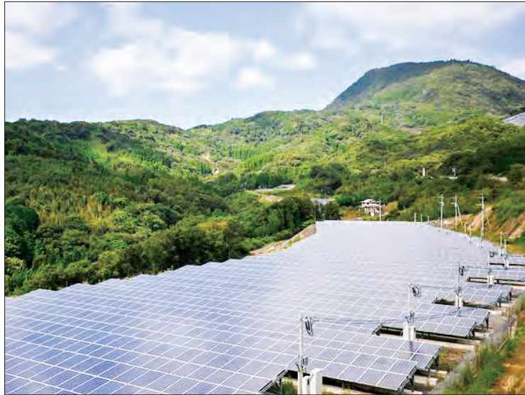
Japan plans to ramp up its use of solar panels, such as these shown in Yufu, Oita prefecture in 2019.

To achieve its goal of carbon neutrality by 2050, the government will adopt the principle of making it a "top priority" to promote as much renewable energy as possible, while try-