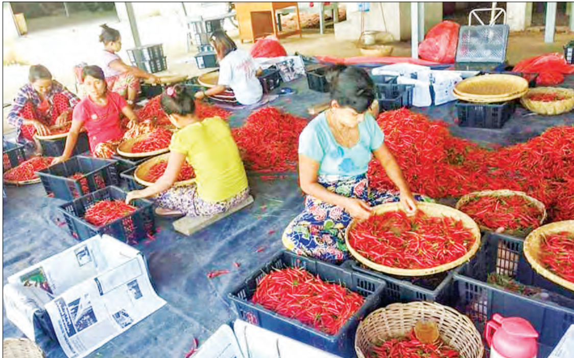
Chilli peppers are systematically dried and producers can reduce the level of fungal contamination.

YAMETHIN township will cover 60 acres of chilli pepper under Food Safety Project (FSP) and the drying machines will be used to reduce the level of fungal contamination in peppers, said U Than Win, deputy officer of Yamethin Agriculture Department.