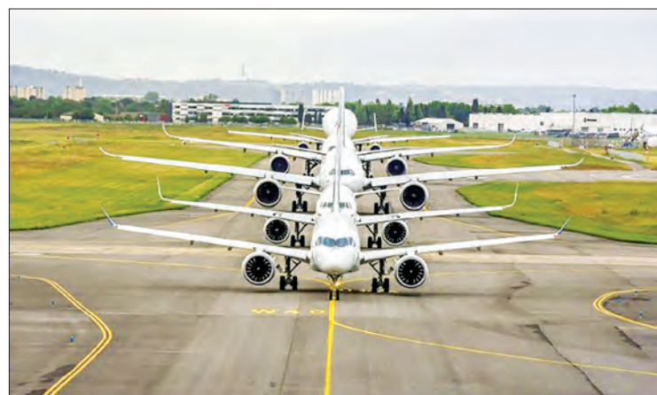
The Airbus-Boeing dispute is the longest-running one in the history of the World Trade Organization.

The Airbus-Boeing dispute, the longest-running in the history of the World Trade Organization, has seen damaging retaliatory tariffs slapped on products such as French wines, Scotch whisky and US wheat and tobacco. — AFP ■