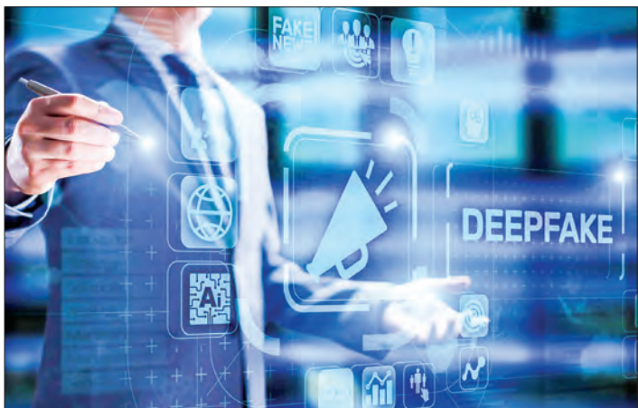
This work will give researchers and practitioners tools to better investigate incidents of coordinated disinformation using deepfakes.

“In digital photography, fingerprints are used to identify the digital camera used to produce an image,” the scientists said. — AFP ■