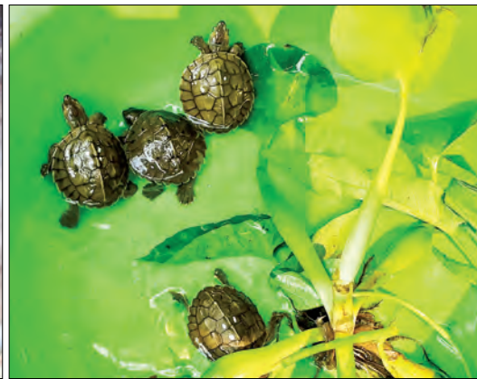
To protect those Burmese roofed turtles from extinction, Wildlife Conservation Society (WCS) and Turtle Survival Alliance (TSA) handed over 100 roofed turtles to the Lawkananda Wildlife Sanctuary under the approval of the Department of Forest, including 3 to 4 years old 40 male and 60 female turtles.

The Forest Department, WCS and TSA cooperatively carried out research on sexual maturity, turtles mating, egg laying and hatching times. The staff of the sanctuary and voluntary staff conserved and successfully researched the Burmese roofed turtles until hatching in the past ten years, under the medical care of Vet Dr Tin Lwin.