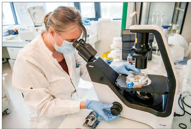
A biologist at OSE Immunotherapeutics pharmaceutical lab works on a program to develop a vaccine against Covid-19 on 31 March, 2021 in Nantes, France.