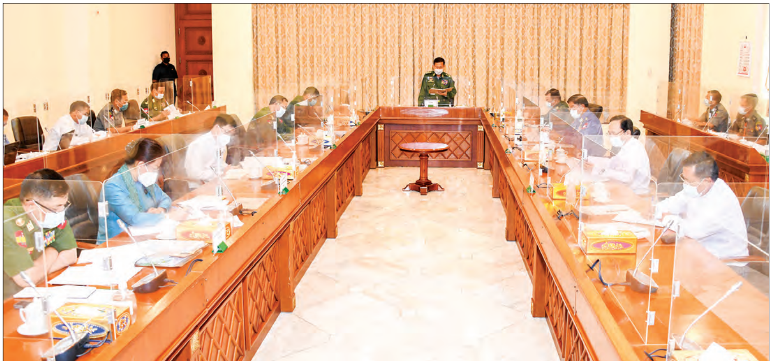
State Administration Council Vice-Chairman Vice-Senior General Soe Win is attending the fourth meeting in Nay Pyi Taw yesterday.

Speaking on the occasion, the Vice-Senior General said that COVID-19 Control and Emergency Response Committee was re-constituted on 11 February 2021. At present, more than 178.2 million of glob-