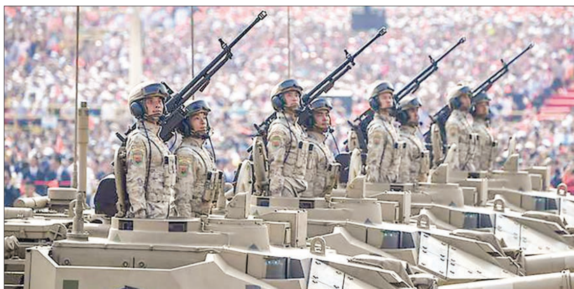
Chinese soldiers participate in a military parade at Tiananmen Square in Beijing on 1 Oct, 2019.

In an angry response, a statement from the Chinese mission to the European Union called for NATO to "view China's development rationally, stop exaggerating various forms of