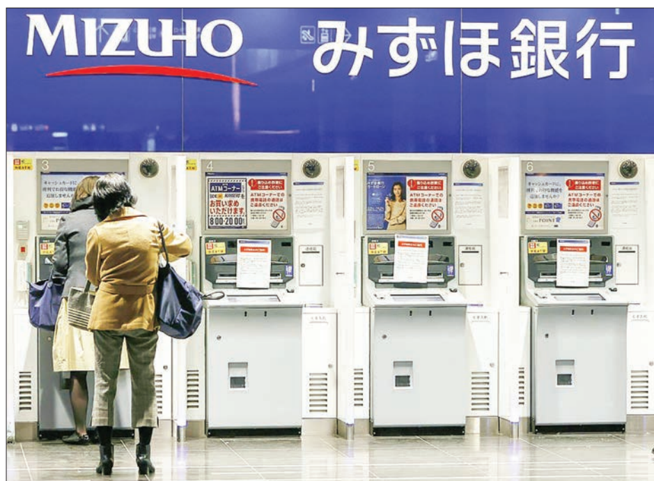
A series of system failures that hit Japanese megabank Mizuho Bank earlier this year, including many of its automated teller machines, were due to poor operation and management rather than system defects, a third-party panel concluded Tuesday.

A series of system failures that hit Japanese megabank Mizuho Bank earlier this year, including many of its automated teller machines, were due to poor operation and management rather than system defects, a third-party panel concluded Tuesday.