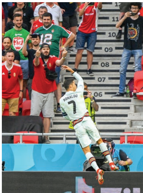
Hungarian supporters gesture as Portugal's forward Cristiano Ronaldo celebrates scoring his team's second goal during the UEFA EURO 2020 Group F football match between Hungary and Portugal at the Puskas Arena in Budapest on 15 June 2021.

"The body is old, but I did quite well today in terms of my movement and stuff." — AFP