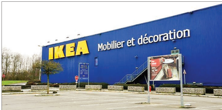
Ikea says it has 'already been punished very severely in terms of its reputation' in France.