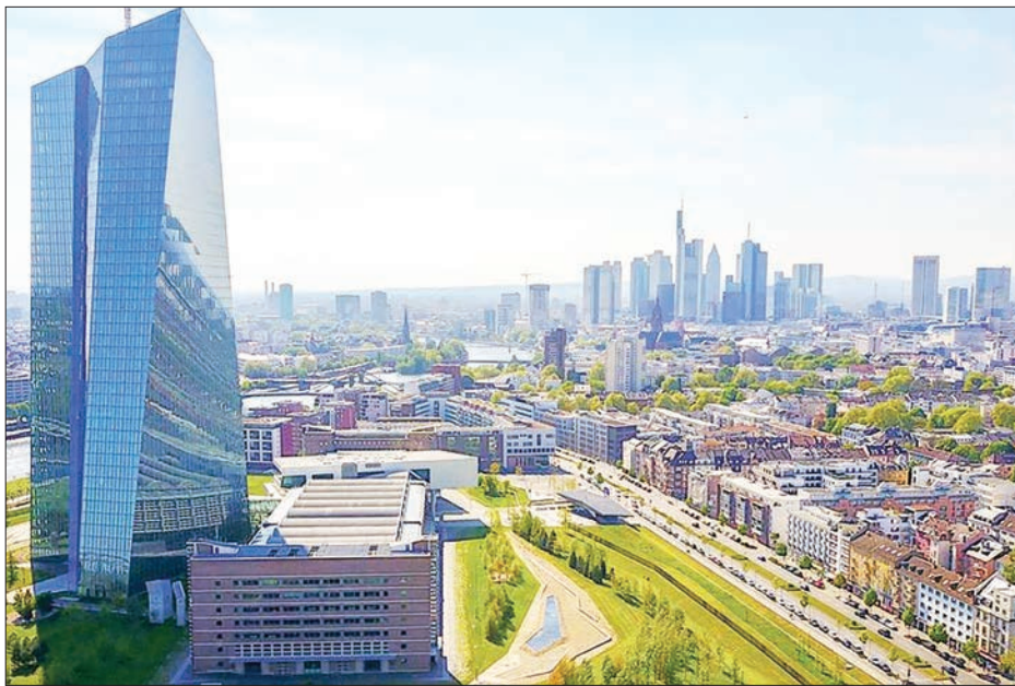
The European Central Bank headquarters in Frankfurt am Mein.

The Governing Council expects the key ECB interest rates to remain at their present or lower levels until it has seen the inflation outlook robustly converge to a level sufficiently close to, but below, two per cent within its projection horizon, and such