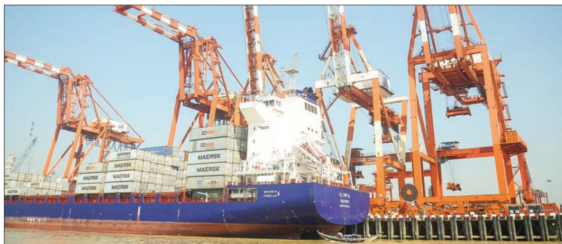
Over the past eight months, the country's total external trade touched a low of $20.46 billion, which plunged from $26.08 billion recorded in a year-ago period.

Myanmar exports agricultural products, fishery products, minerals, livestock, forest products, finished industrial goods, and other products. On the other hand, it imports capital goods, consumer goods, and raw industrial materials. The country currently has nine ports involved in sea trade. Yangon Port is the main gateway for Myanmar's maritime trade. It includes the Yangon inner terminals and the outer Thilawa Port. — MM/GNLM