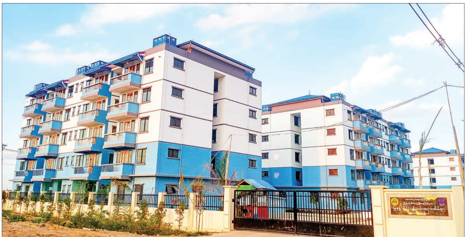
Mya Nandar government employee rental housing in Dagon Myothit (Seikkan) Township of Yangon Region.

“We will rent out the apartments on a group basis. The applicants need the special recommendation letters of their respective department heads like the township officers. We will prioritize those who do not have a house with a big family. Depending on the applications of various ministries, we will allocate the units on a ratio. We will make the decision with our groups. We will submit our decisions to the regional government, and they will make a final decision for their stay. We will prioritize the in-service government employees who do not have