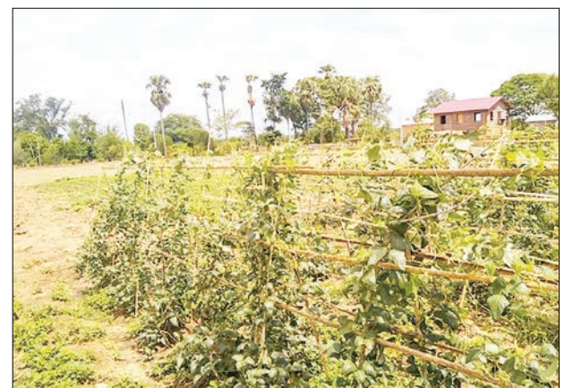
The long beans are grown in the boundary line. The long bean plant is growing well in loamy soil, and it would heavily yield after cultivating for 70 days.

The long bean price ranged between K800 and K1,200 per viss in the market last year.