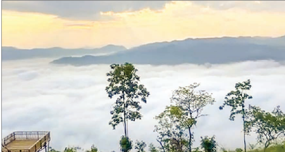
The beauty of sea cloud is formed when the stream of water from the Duttawadi river flows over 20,000 feet of mountains, transformed into clouds. With the combination of the sky, ground and weather, the most beautiful time of the Nawngkhio Cloudy Villa is between November and January.

There are seven photo shooting places, and it changed