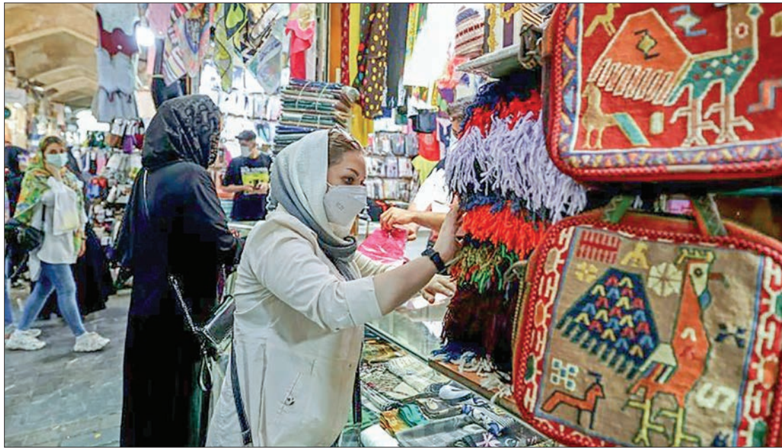
'The educated middle class of the big cities is overall very disappointed in Rouhani,' says analyst Thierry Coville.

PROMISING greater openness at home and outreach abroad when he was elected in 2013, Iran's outgoing moderate President Hassan Rouhani comfortably won a second term but leaves office as a deeply unpopular fig-