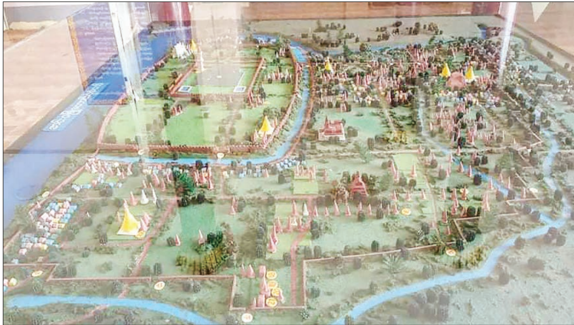
The museum is open between 9 am and 4:30 pm every day except the public holidays and Monday for the visitors with free admission.

The museum was opened in April 2003. It exhibits five display rooms for models of Inwa city, Buddha statues and scriptures, photos of ancient buildings, the gallery for cultural heritage, handicrafts and personal belongings of ancient people, arts and architecture. The arts and architecture of old