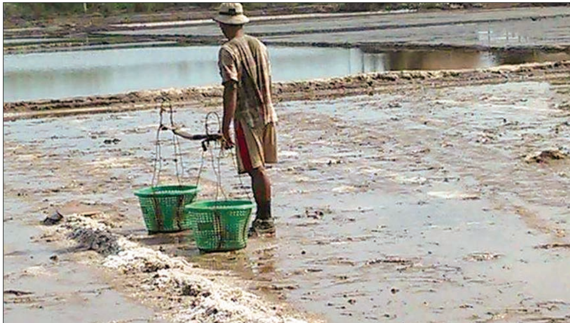
The raw salt stood at K55-70 per viss (a viss equals 1.6 kilogrammes) at the depot in Mawlamyine, Mon State. On 14 June, the price increased to K120-150 per viss.

Additionally, locally produced salt cannot compete against the imported salt in qual-