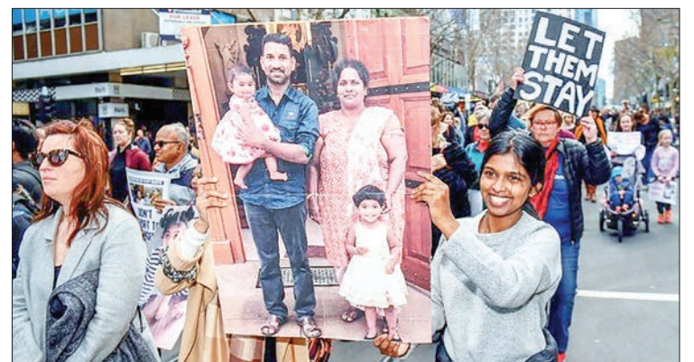
The family were sent to the Christmas Island detention centre in 2019, sparking protests calling for them to be allowed to stay.

Immigration Minister Alex Hawke announced Monday the family would stay in Perth while they exhaust their legal options, as the government faced a backlash within its own political ranks over its handling of the case.