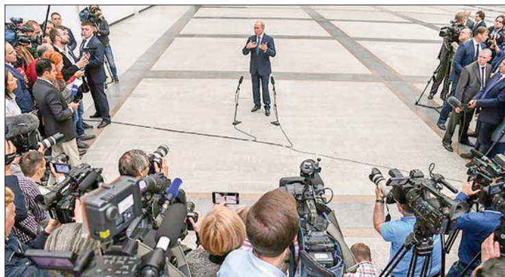
Russian President Vladimir Putin speaks with journalists in Moscow June 7 following his annual televised call-in programme.

as long as they pertain to the health and life of specific individuals and of their families? Of course. Sure thing," he said.