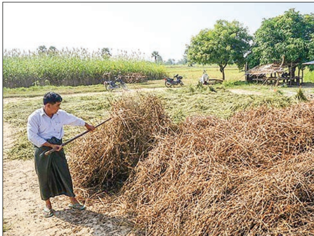
There are two types of sesame called Talin sesame and Htaung sesame. At present, a basket of sesame is fetching K 4,700. Now, the sesame growers from Kyaukse township are happy with making a good profit from sesame.

SESAME growers from Kyaukse township, Mandalay region, are glad to get bumper yield and a good price.