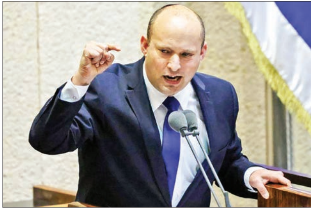
Naftali Bennett, a multi-millionaire former tech entrepreneur who made his political name with hardline religious-nationalist rhetoric, will be Israel's new prime minister after parliament approved a new government on Sunday.

NAFTALI Bennett, a multi-millionaire former tech entrepreneur who made his political name with hardline religious-nationalist rhetoric, will be Israel's