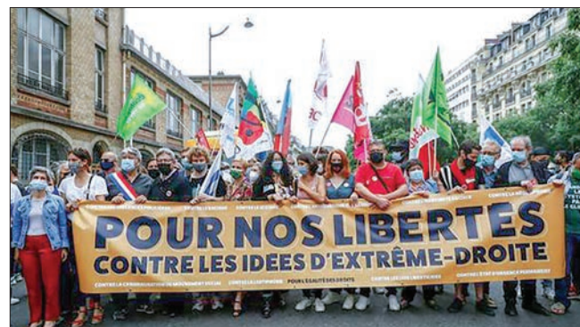
More than 100 left-leaning organisations participated in the “Liberty March” in cities and towns across France.

In the Mediterranean port of Marseilles, more than a thousand demonstrators marched behind a CGT union banner that called for “unity to break down the capitalism that leads to fascism”. — AFP ■