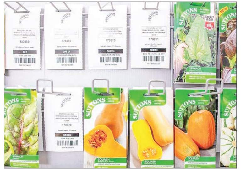
The protocol led to supply delays and empty shelves in Northern Ireland.

All told him directly to abide by the terms of the divorce deal he signed to take the UK out of the European Union after nearly 50 years of membership. — AFP ■