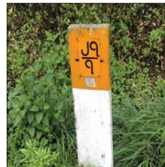
27 mile and seven furlongs post.

The security measures have been heightened to reveal the case as the armed groups brutally killed the innocent civilians including members of the Sangha.—MNA