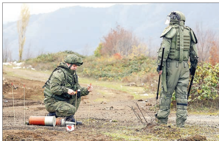
Russian peacekeepers clear mines in Nagorno-Karabakh.

He said he had earlier "provided Azerbaijan with a certain number of minefield maps through Russian Foreign Minister Sergei Lavrov." — AFP ■