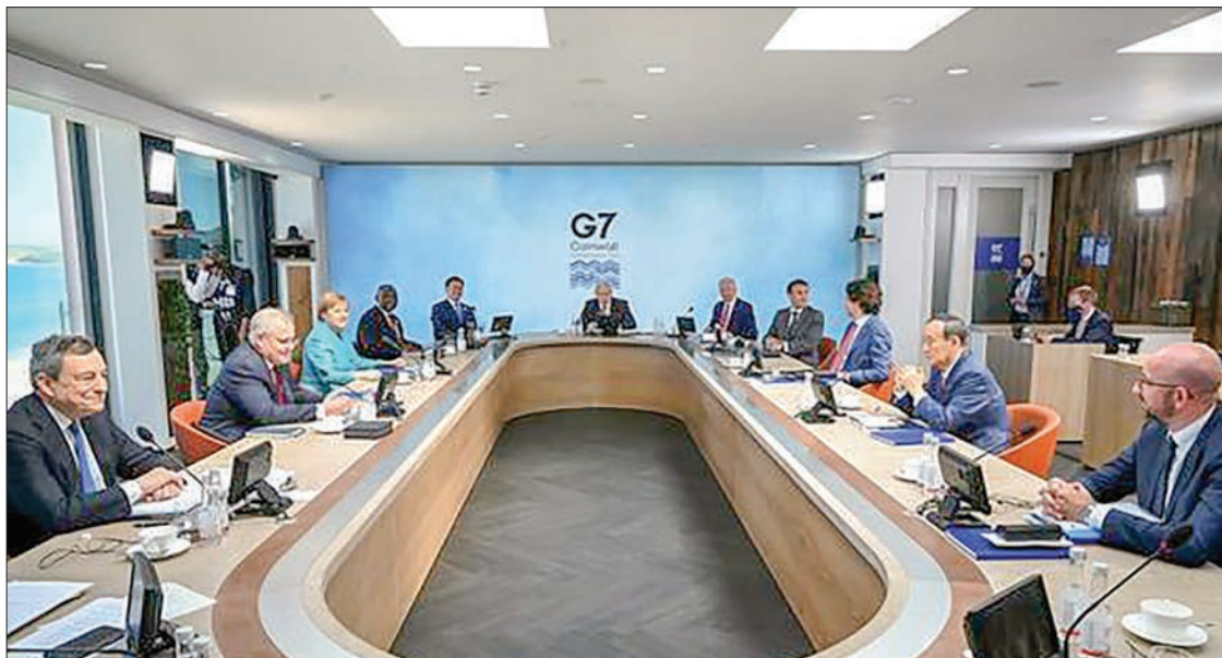
The gathering in Cornwall in southwestern England has been the first opportunity for G7 leaders to meet in person in two years.

use of only so-called clean coal for power “as soon as possible”, ending most government sup-