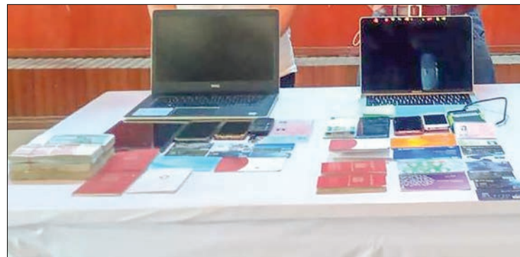
Related equipment in arresting Nyein Chan (a) Khaing Ko Mon and Shoon Seint Seint seen in documentary photo.

Nyein Chan attended the military and explosive course together with Shoon Seint Seint in the area of KNU Brigade (5) in Bilin Township due to the connection created by Tun Aung