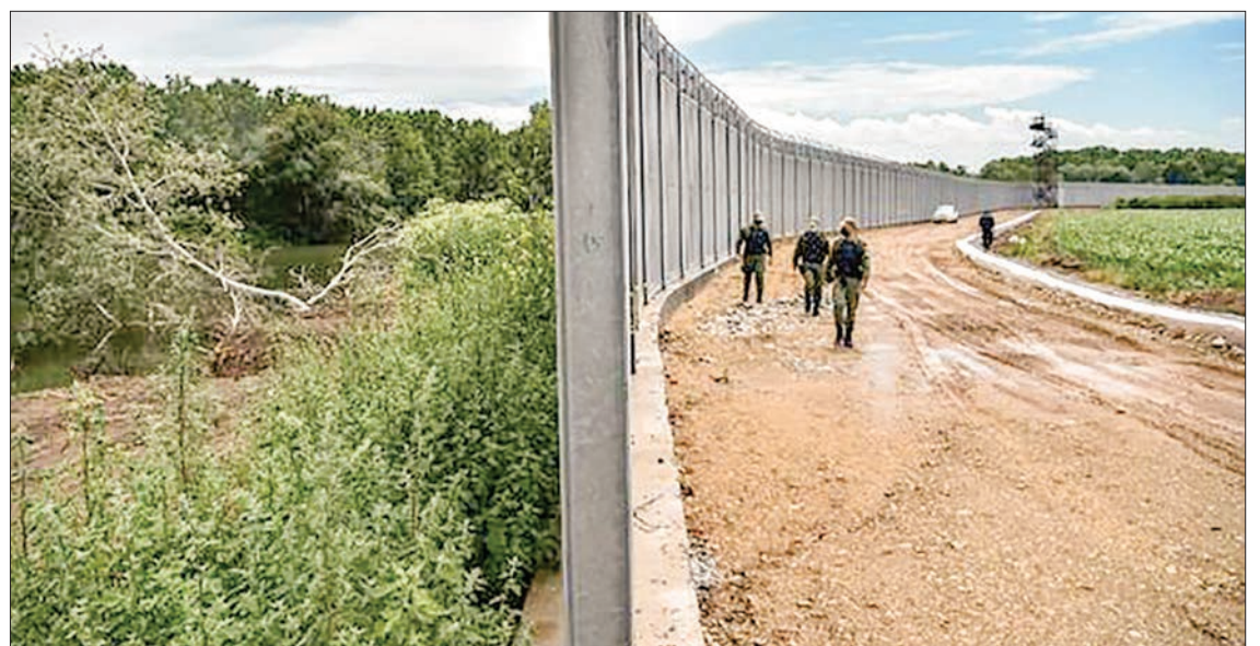
Greece has deployed cameras, radar and a 40-kilometre (25-mile) steel fence more than five metres high along part of its border with Turkey.

A Greek court on Saturday sentenced four Afghan asylum seekers convicted of starting fires that burnt down Europe's largest migrant camp last year to 10 years in prison each.