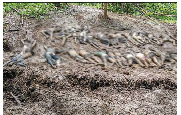
Construction workers brutally killed by KNDO.

Officials from the bridge construction site checked the dead bodies with their identities to inform parents and relatives about the deaths and opened the