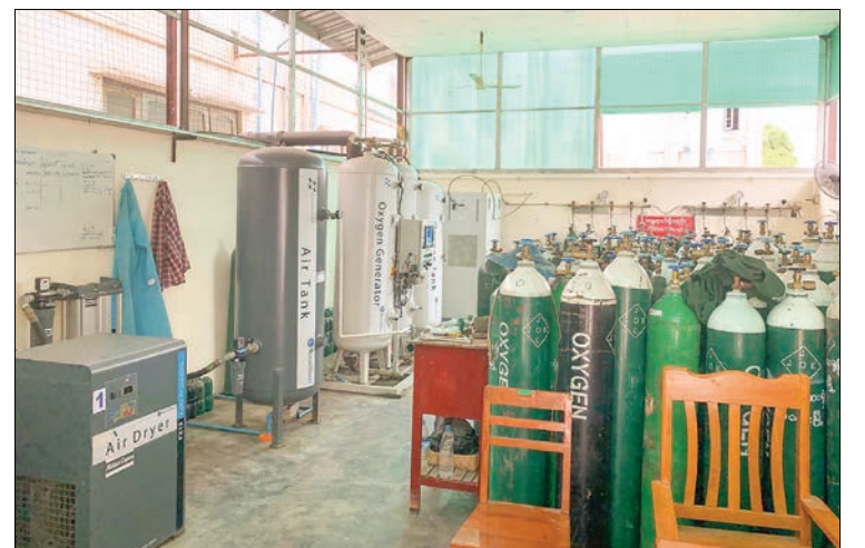
Oxygen cylinders kept in a room before distribution.

The health workers, Tatmadaw medics and volunteers perform early detection of COVID-19 cases and lab tests and arrange to isolate those who had close contact with positive cases and those came from border areas.