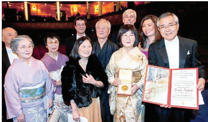
Japanese chemist Ei-ichi Negishi (R, with his family) won the Nobel Prize for his work developing a method to create complex chemicals.

JAPANESE chemist Ei-ichi Negishi who won the Nobel prize for developing a method for creating complex chemicals necessary for manufacturing drugs and electronics has died aged 85, his US university said.