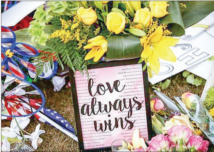
A makeshift memorial at the Pulse nightclub in 2016, which President Joe Biden enshrined as a national memorial on June 6, 2021.

PRESIDENT Joe Biden on Saturday marked the fifth anniversary of a mass shooting in a gay nightclub in Florida, taking the rare step of saying he would designate the club as a national memorial.