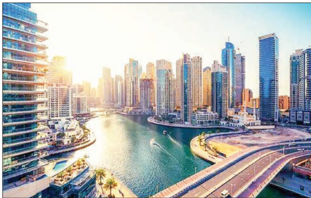
High-rise buildings at the Dubai Marina.

TAX advantages paired with a life of luxury have long drawn foreigners