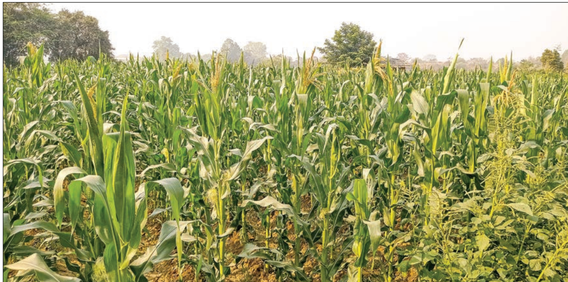
Corn plants thriving in plantation.

Myanmar has been delivering corns to the neighbouring countries such as Thailand and China via land border. The shipment to Singapore, Malaysia and Viet Nam abruptly stopped