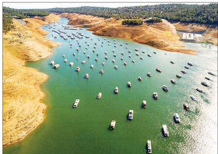
With the water level reaching historic lows, boats had to be taken out of Lake Oroville in Northern California; this photo is from May 24, 2021.

Widespread water-use restrictions appear inevitable over the coming months, with potentially serious ramifications for Western states, in particular for irrigation-dependent farmers — who provide much of the country’s fruits and vegetables. — AFP ■