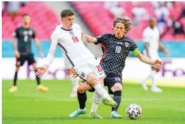
England's midfielder Mason Mount (L) plays the ball with Croatia's midfielder Luka Modric during the UEFA EURO 2020 Group D football match between England and Croatia at Wembley Stadium in London on 13 June 2021.