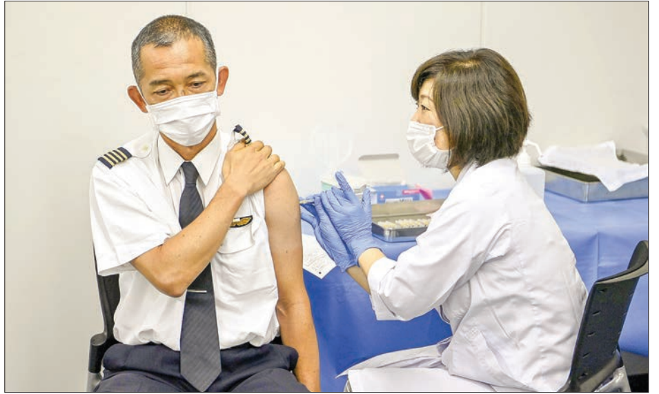
A pilot receives a COVID-19 vaccine at Haneda airport on June 13, 2021, under All Nippon Airways Co.'s vaccination program for employees.

ANA Holdings Inc., the parent of the major airline, had initially sought to begin on-site vaccinations from that day but was able to bring forward the plan in cooperation with the govern-