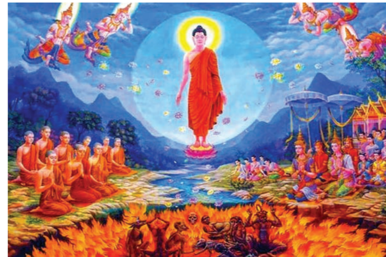
The Lord Buddha delivered the famous Maha Thamaya Sutta to the Devas and Brahmas of all universes.

Although festival of religious examinations in Nayon was not recorded yearly, there is no doubt that they were held regularly throughout Myanmar history. Examinations took place in the Thudhamma zayats built by the King. Preparations were made in advance such as gilding the zayats, renovating and decorating the surroundings. Pavilions were constructed in which the monks were fed daily and were presented with offertories. A special “min lan” (မင်းလမ်း) or royal road was made lined on either side with yazamat fences (ရာဇမတ်ကွတ်) (Diamond shaped design of lattice fences) and flower pots. The surface of the royal road was covered with fine whit sand. At the end of the road was built a richly decorated Pavilion for Their Majesties and the court from homage to the monks. Naturally festivities took place where royalty appeared in