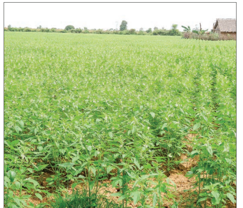
Photo shows thriving sesame plants.

The volume of sesame exports was registered at over 96,000 metric tonnes, worth $130 million, in the financial year 2015-2016; $100,000 tonnes, worth $145 million, in the FY 2016-2017FY; 120,000 tonnes, worth $147 million, in the FY 2017-2018; 33,900 tonnes valued $43.8 million in the 2018 mini-budget period, 125,800 tonnes, worth $212.5 million in the FY 2018-2019 and over 150,000 tonnes of sesame, worth $240 million in the previous FY 2019-2020, the trade data of Central Statistical Organization indicated.—KK/GNLM