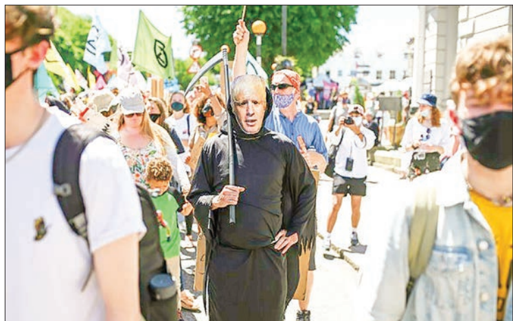
The harbour town in southwest England is being used to host a media centre for reporters from around the world.

THOUSANDS of environmental campaigners rallied noisily and colourfully Saturday in Cornwall to urge G7 leaders to do far more against climate change and bio-