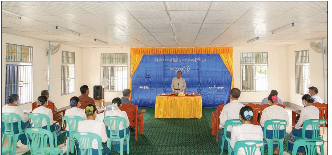
Union Minister for Information U Chitt Naing meets staff from Laukkai retransmission station and Information and Public Information Department.

Hopang and Laukkai in Shan State (North) and those from Information and Public Relations Department and instructed them to take care of health condition, culture good morale, serve the duty honestly, and try hard to be capable in the work process with moral, discipline and goodwill. He also presented cash assistance and foodstuff to them.