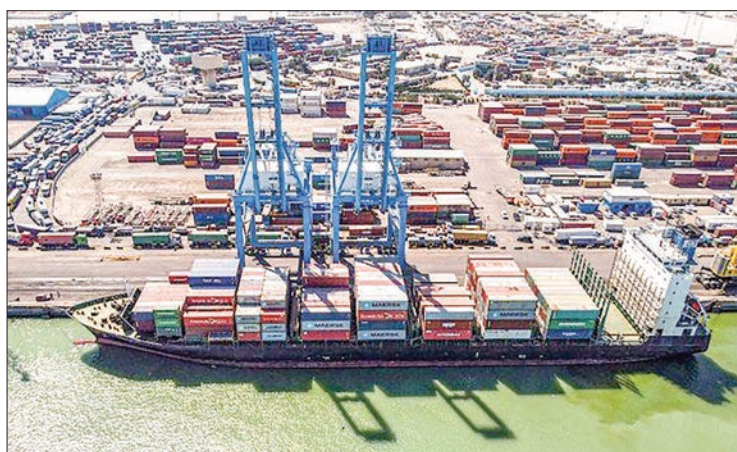
Both men worked at the Gulf port of Umm Qasr, a key entry point for imports of foodstuffs and medicines which is reputed to be the most corrupt in Iraq.

IRAQ announced Saturday it has arrested two generals on suspicion of taking bribes to waive customs duties, a practice esti-