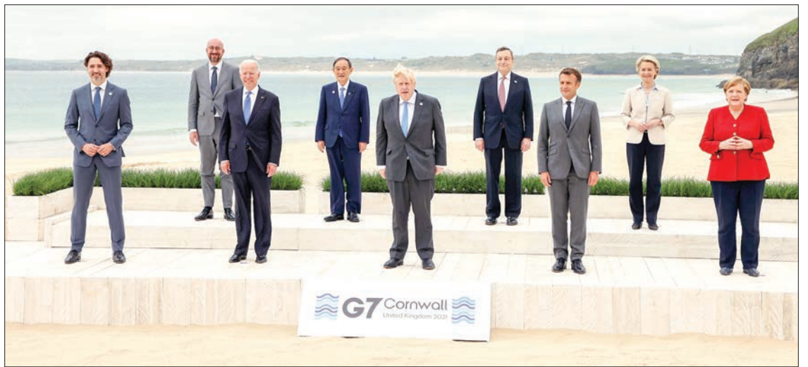
(From L) Canadian Prime Minister Justin Trudeau, European Council President Charles Michel, U.S. President Joe Biden, Japanese Prime Minister Yoshihide Suga, British Prime Minister Boris Johnson, Italian Prime Minister Mario Draghi, French President Emmanuel Macron, European Commission President Ursula von der Leyen and German Chancellor Angela Merkel pose for a photo in Cornwall, England, on June 11, 2021. They gathered for a summit of the Group of Seven major economies.

"The upside is that growth is soaring. The downside is that consumer inflation is surging, and labor problems are pressuring businesses." — AFP ■