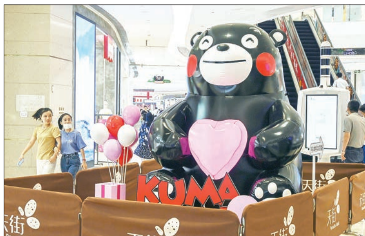
A 2.5-meter-high balloon representing Kumamon, the official black bear mascot of Japan's Kumamoto Prefecture, is on display on June 7, 2021, at a temporary shop dedicated to goods related to the mascot, which recently opened at a shopping complex in the suburbs of Shanghai.

The outlet will then feature in various regions including Beijing, according to the prefectural government. —Kyodo News ■