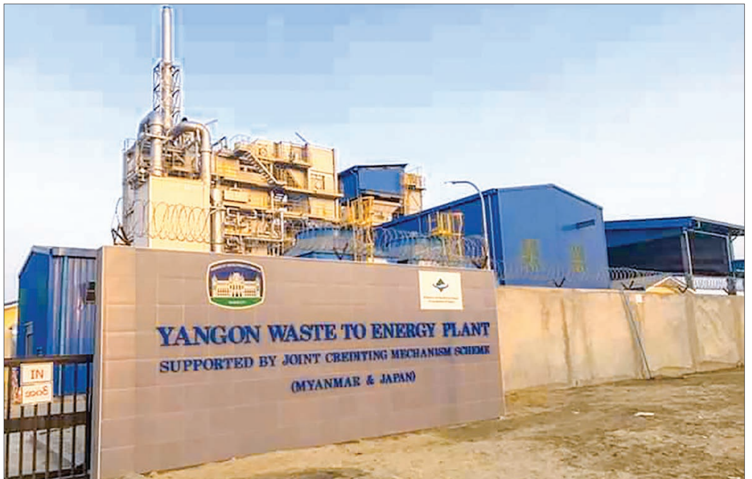
Photo shows picture on Yangon Waste to Energy Plant in Shwepyitha Township.