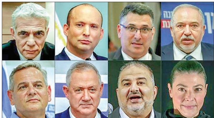
A combination of pictures created on June 2 shows the heads of Israel’s newly-announced ‘change’ coalition who are united by their hostility to Benjamin Netanyahu, Israel’s longest-serving prime minister whose rule could end on Sunday. PHOTO: AFP/FILE

But the ever-combative Netanyahu has tried to peel off defectors that would deprive the nascent coalition of its wafer thin legislative majority. — AFP ■