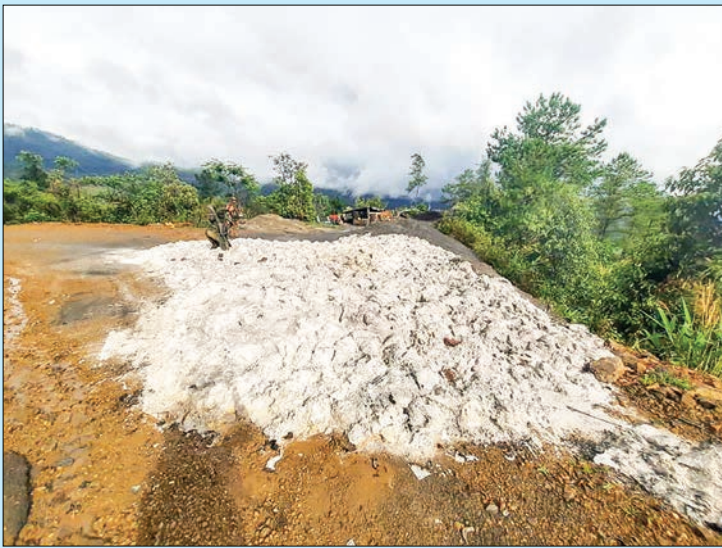
Photo shows a pile of burnt school textbooks.

TWO cargo trucks carrying 127,797 copies of school textbooks from KG to Grade 4 sent