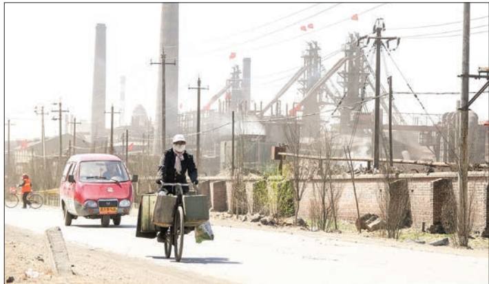
Photo taken in 2012 shows a rare earth refinery near Baotou, China, the country dominating the global mining and refining of the minerals.

Rare earth minerals with names like neodymium, praseodymium and dysprosium are crucial to the manufacture of magnets used in industries of the future like wind turbines and electric cars. And they are already present in consumer goods such as smartphones, computer screens and telescopic lenses. Others have more traditional uses, like cerium for glass polishing and lanthanum for car catalysts or optical lenses. — AFP ■