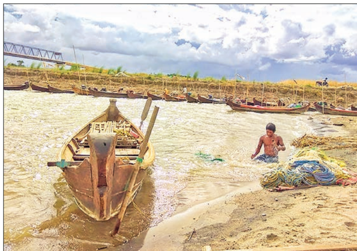
A local fisherman capturing fish in the river.

LIVESTOCK and Fisheries sector has attracted five foreign investment projects as of April-end in the current financial year 2020-2021 since October, according to the Directorate of Investment and Company Administration (DICA).