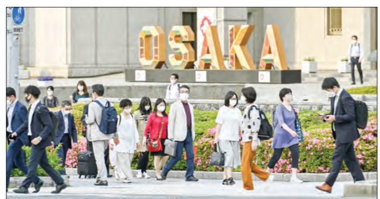
Osaka was traditionally considered Japan's economic hub.

qualitative and quantitative factors across five broad categories: stability, health care, culture and environment, education and in-