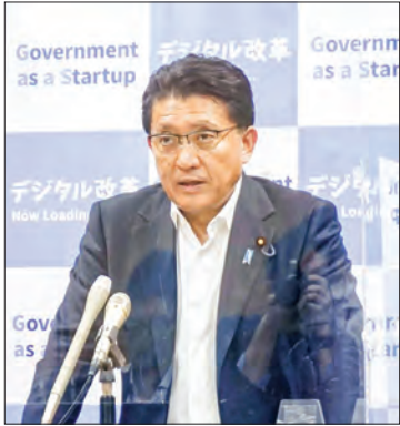
Digitalization minister Takuya Hirai holds a press conference in Tokyo on June 11, 2021.

DIGITALIZATION minister Takuya Hirai admitted Friday he instructed officials to coerce the developer of a smartphone app for monitoring the health of foreign visitors during the Tokyo Games into cutting costs by threatening to withhold future government contracts.