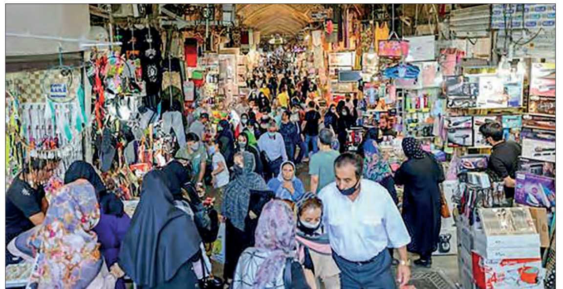
When Iranians vote for a new president they will do so in the depths of an economic crisis brought on by crippling sanctions.

Ultimate political power in Iran rests with the supreme leader, Ayatollah Ali Khamenei, who gave the green light to both the original agreement with a group of world powers, and to efforts since April to revive it. — AFP ■