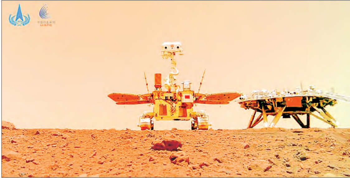
The Zhurong rover, named after a mythical Chinese fire god, has been studying the topography of a vast Martian lava plain known as the Utopia Planitia.