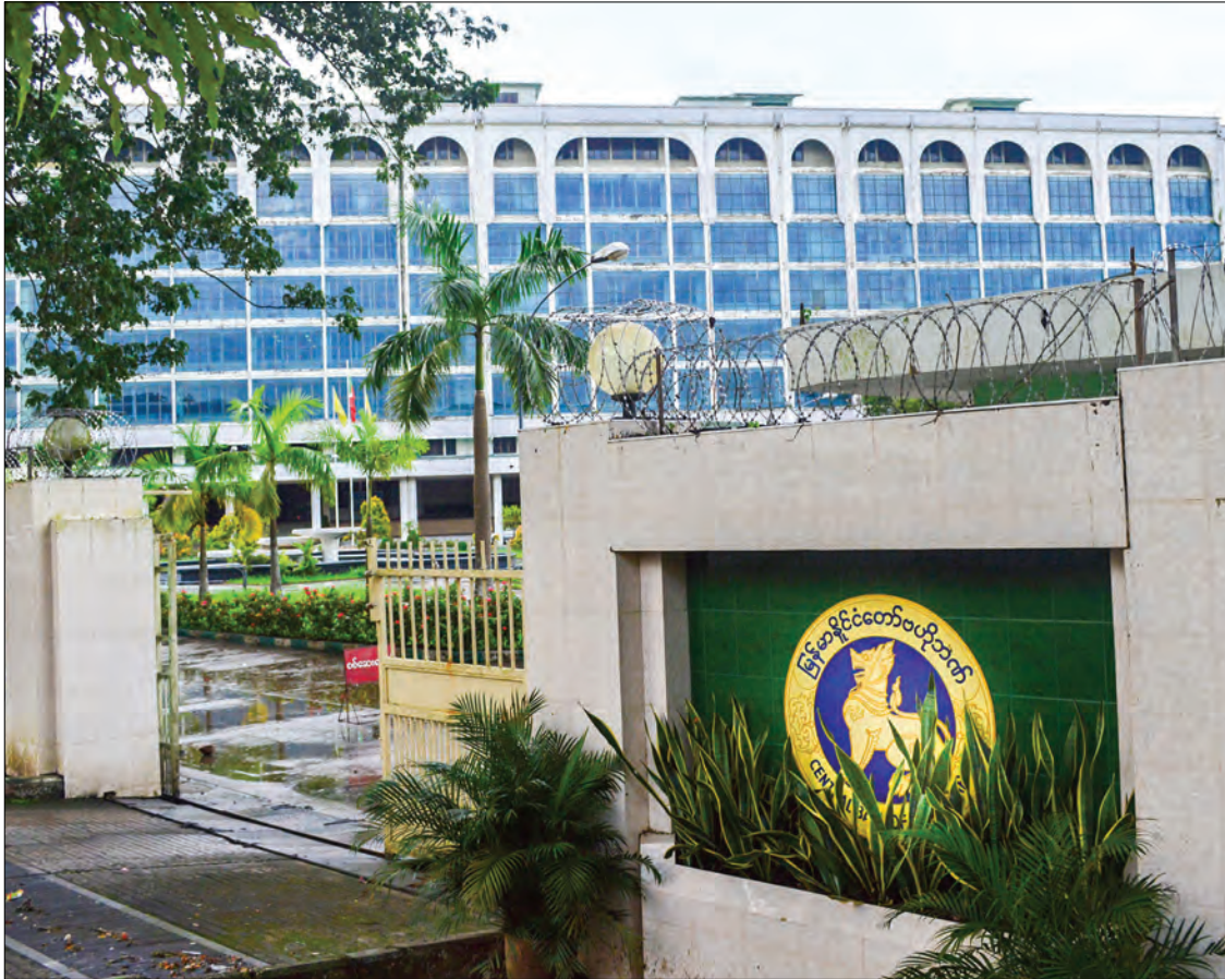
CBM is selling the US dollar at an auction rate, intending to keep the exchange rate stable.

THE US dollar exchange rate fell by K10, following the Central Bank of Myanmar (CBM) selling 3 million US dollars, according to the local foreign exchange market.