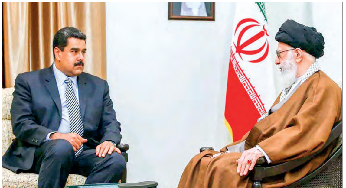
Venezuelan President Nicolas Maduro meets with Iran's Supreme Leader Ayatollah Ali Khamenei in Tehran in 2016.

Blumenthal said the "precedent" of allowing Iran to provide arms to the region causes him "great concern" and Austin said he shared that concern.