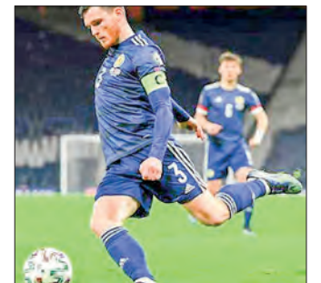
Andy Robertson will lead Scotland into their first major international tournament for 23 years.

cult, and there will be plenty of emotions but you can't get too carried away," said Mancini, who has guided the Azzurri back to a major tournament after their ignominious failure to reach the 2018 World Cup. Mancini has rebuilt Italy, the 1968 European champions, on a 27-match unbeaten run. — AFP ■