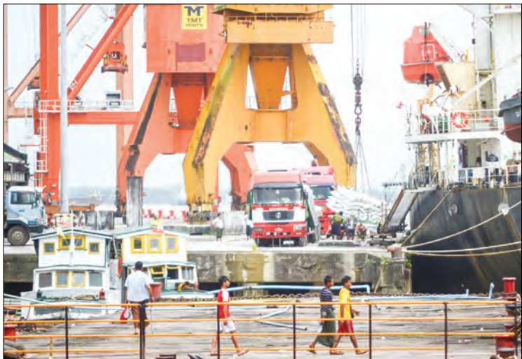
Myanmar set the rice export target at only 2 million tonnes in the current FY as summer paddy growing acreage drops.

Myanmar generated over $800 million from rice exports in the previous FY2019-2020 ended 30 September, with an estimated volume of over 2.5 million tonnes. — KH/GNLM