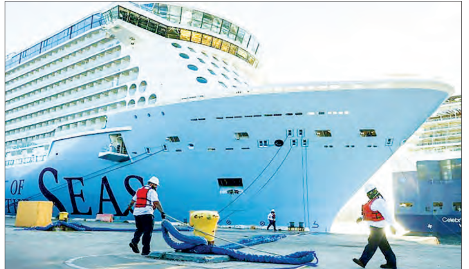
Dock workers tie the Royal Caribbean's Odyssey of the Seas to its berthing spot on June 10, 2021 in Fort Lauderdale, Florida.