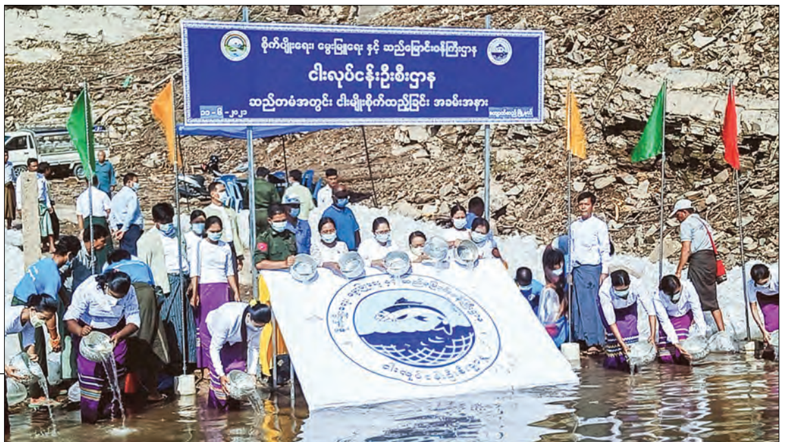
The Fisheries Department added about 900,000 fingerlings into Yeywa hydropower project reservoir in Kyaukse township on yesterday.

According to the District Fisheries Department, 900,000 fingerlings were added to the reservoir, including 650,000 Rohu fingerlings, 200,000 barb fingerlings, and 50,000 golden Mrigal fingerlings.