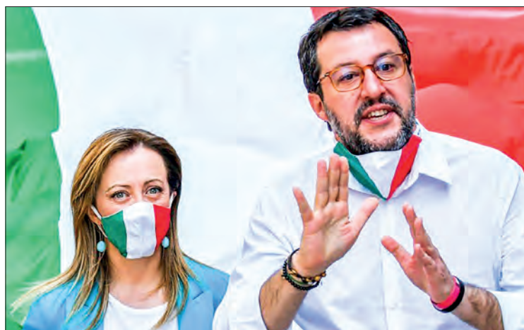
Meloni, 44, is mostly picking up votes from the League, whose leader Matteo Salvini can no longer ride on anti-establishment sentiment since his party gained a place in the cabinet, according to a political analyst.

Her success — recent surveys put her party at around 20 per cent — raises the prospect that the next elections will produce the most right-wing government in Italy's postwar history, with FDI in the driving seat.