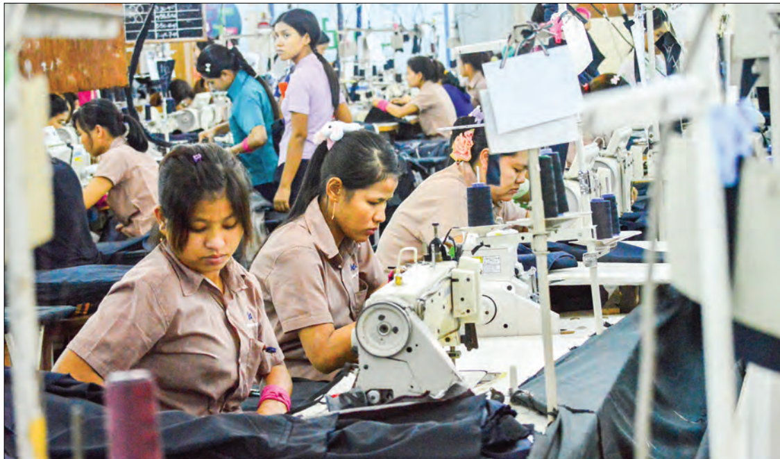
Exports of garments manufactured under the cut-make-pack (CMP) system were valued US$2.2 billion between 1 October and 28 May in the current FY.

The factories are facing cancellation of order and slump in output, new orders. However, The Swedish fashion retailer H&M is gradually placing orders from Myanmar again after it paused in March. Then, more international fashion retailers such as Primark and Bestseller start to resume new orders. Additionally, Germany will also continue its support for Myanmar garment businesses so that Myanmar women can continue their livings, posted the Germany Embassy Yangon's Facebook.