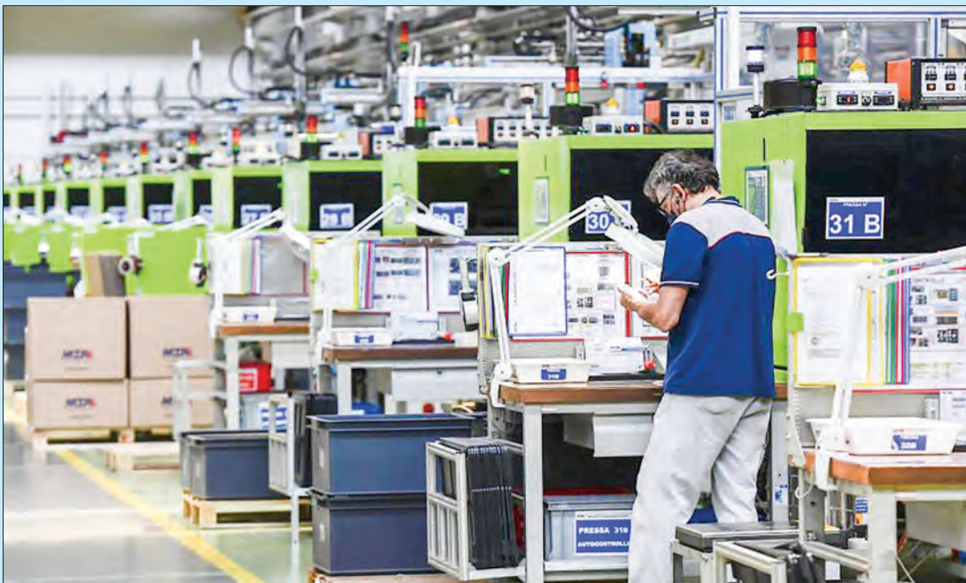
The Italian multinational company MTA, specialised in electromechanical components for the car industry, in Codogno, southeast of Milan.

ITALY’S industrial production index returned to pre-COVID levels in April, official data showed on Thursday, in another sign of optimism for the eurozone’s third-largest economy.