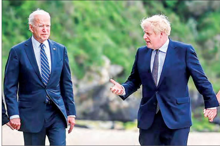
President Biden (l) will attend the G7 summit, on his first foreign trip, along with host Boris Johnson, seen here in Cornwall on Thursday.

Most of the G7 heads of state and government will reconvene on Monday in Brussels for a NATO meeting, before Biden heads on to his first summit with President Vladimir Putin in Ge-