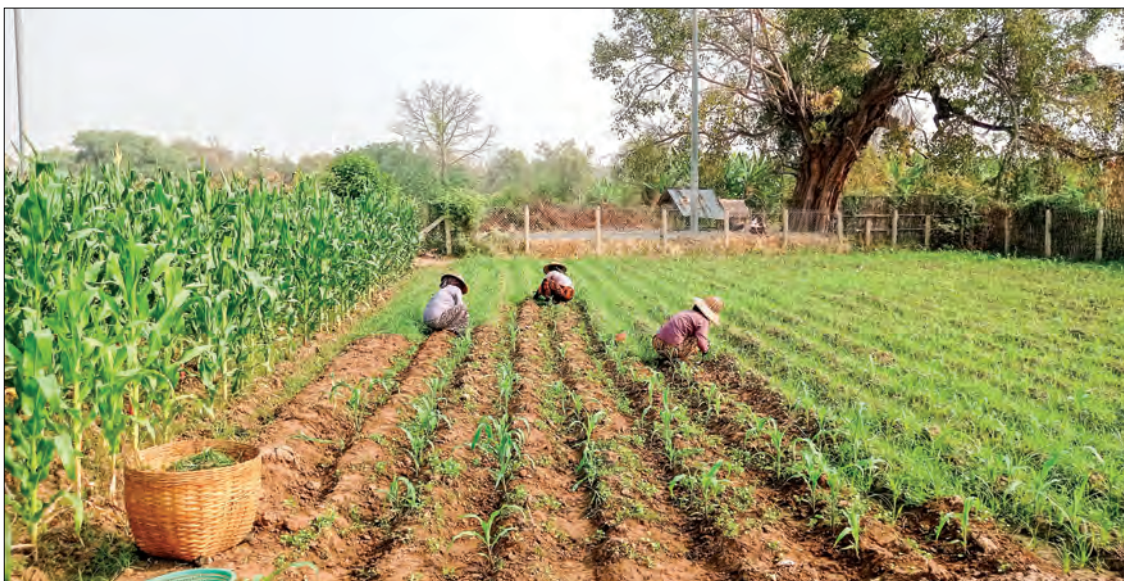
Growing maize requires adequate soil moisture. Therefore, it is necessary for summer and cold season planting to provide water to the soil to ensure the proper soil moisture.

FARMERS in Kyauktan Village, Minbu (Saku) Township, Magway Region, are re-cultivating maize as a monsoon crop because of its high yields and reasonable prices.