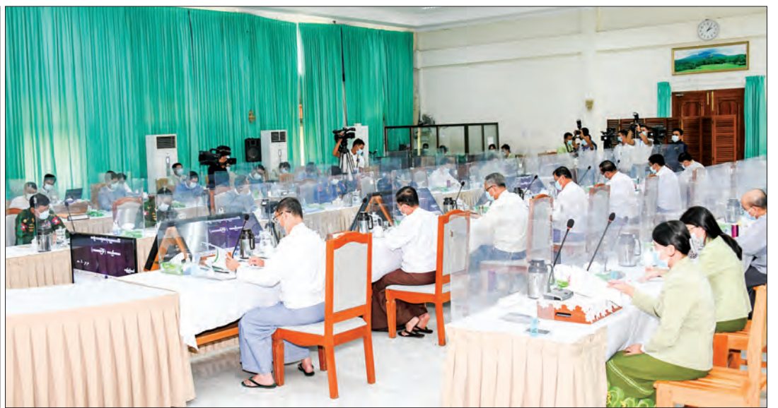
State Administration Council Vice-Chairman Vice-Senior General Soe Win is addressing the first meeting of the National Land Utilization Council yesterday.

land utilization and land invasion caused disputes on permission and ownership rights between those in the management sector and the people.