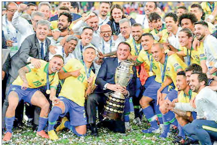
In 2019, Brazil won the Copa America on home soil in a carnival atmosphere -- but the 2021 edition promises to be more sombre.

Co-hosts Argentina and Colombia were stripped of their rights at the 11th hour, due mostly to the deteriorating pandemic situations in those countries but also deadly social unrest in the