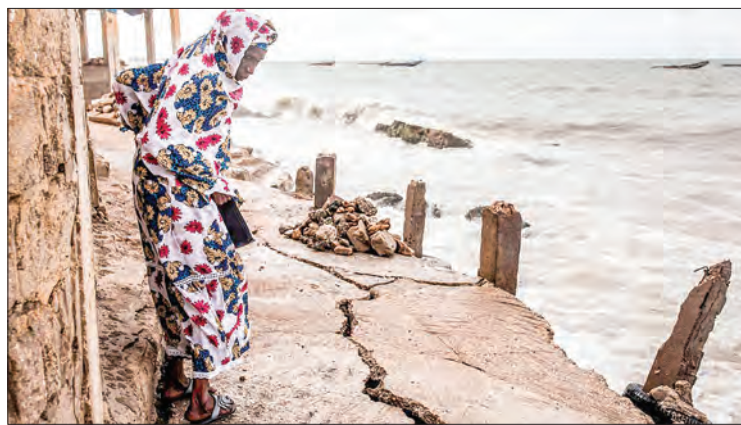
A woman looks at a crack in the walkway that leads to the mosque in Bargny, Senegal, on September 18, 2020. Fishing villages like Bargny have been fighting the rising seas for decades.

They also cautioned against planting trees to suck up carbon pollution in ecosystems that have not historically been