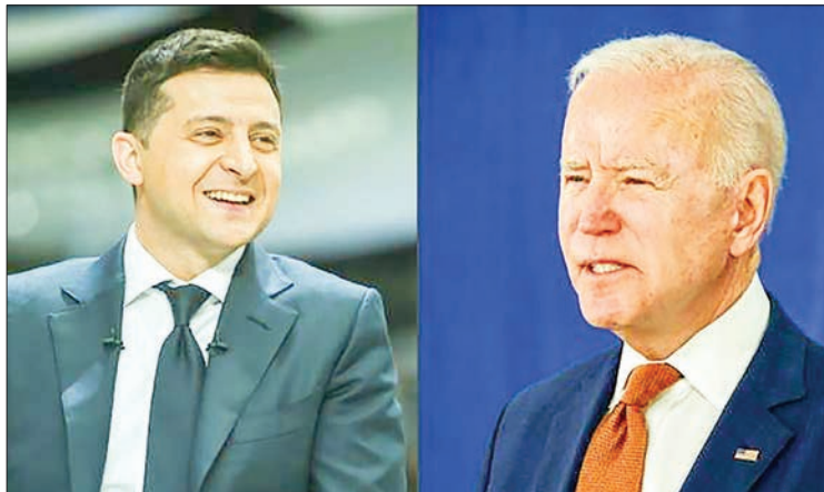
Ukrainian President Volodymyr Zelensky (L) has accepted an invitation to the White House by US President Joe Biden.

The invitation to visit in July marked a show of support for Ukraine ahead of Biden's summit with Russian President Vladimir Putin in Geneva next week.