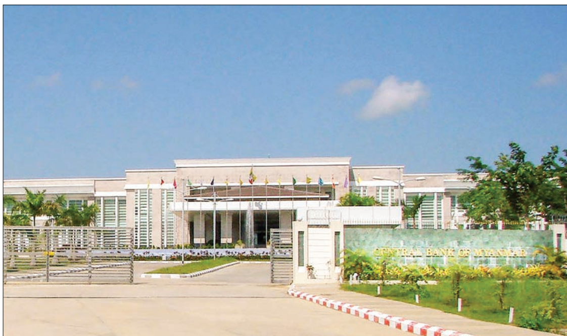
The CBM reportedly sold $24 million at an auction rate in May. The CBM's move aims at governing the market volatility, the CBM stated.

The CBM trades the foreign currency with the authorized