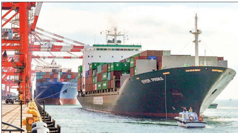
An international cargo ship arrives at the Port of Tokyo.

JAPAN posted a more than six-fold increase in its current account surplus in April to 1.32 trillion yen ($12 billion) as the trade balance swung back into the black due to a surge in exports from a year earlier when the coronavirus pandemic stalled economic activity, the Finance Ministry said Tuesday.