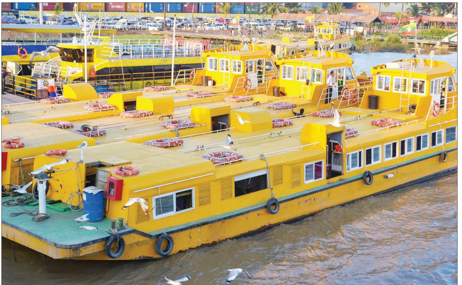
The Yangon Water Bus was launched in Hline and Yangon rivers to ensure smooth transport of passengers and ease traffic congestion.