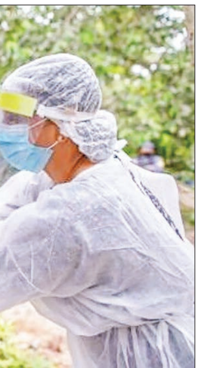
near Manaus, Brazil.

declined in recent weeks, the world is facing a crisis said on Monday in his ongoing campaign to vaccinate developing countries.