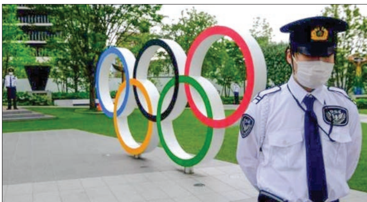
Olympic organizers want to keep visitors under close supervision in Tokyo.

OVERSEAS journalists covering the Tokyo Olympics will have their movements tracked by GPS, the Games president said Tuesday, and could have their passes revoked if they break the rules.