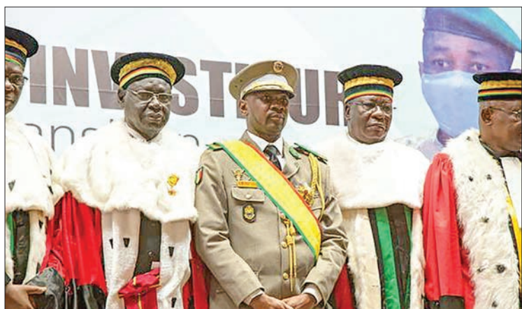
Colonel Assimi Goita, centre, is sworn in as Mali's transitional president after leading two coups in the Western African country.

MALIAN strongman Colonel Assimi Goita stood by the goal of staging elections next February as he was sworn in as tran-