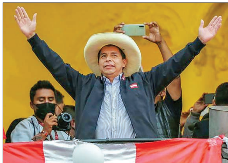
Peruvian presidential candidate Pedro Castillo at his party's headquarters in Lima after taking a razor-thin lead as the final votes are tallied in the run-off election. Right-wing populist Keiko Fujimori and hardline leftist Pedro Castillo were neck-and-neck in a battle for Peru's presidency Monday as the crisis-hit nation's election looked set to go down to the wire.

Election observers from the Organization of American States (OAS) said the candidates' "conduct in these crucial hours is decisive to maintain calm." — AFP ■