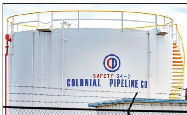
Russia-based ransomware hackers forced the shutdown of the largest fuel network in the eastern United States, run by Colonial Pipeline.