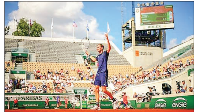
Daniil Medvedev had not won a match at the French Open before this year's tournament.

Medvedev could take over the number one ranking if he reaches the final and Djokovic does not. — AFP ■