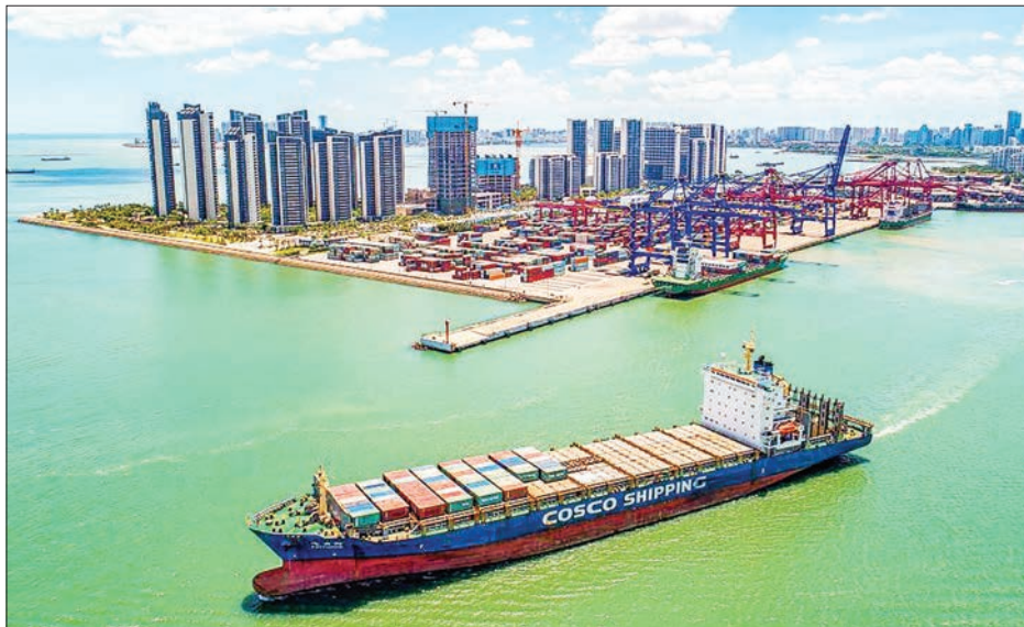
A cargo ship loaded with containers leaving a port in Haikou, in China's southern Hainan province.

world's second largest economy posted strong growth but came in lower than expectations of