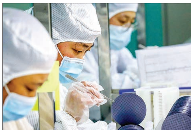
Employees at a semiconductor manufacturing company.

KYECC employs more than 7,000 people, including around 2,100 migrants, and counts some top international tech firms as clients, such as Intel, Qualcomm and Nvidia. KYECC said in a filing to the Chinese Taipei Stock Exchange that its June output and revenue are expected to drop 30 to 35 per cent due to the suspension of work. Local media raised concerns that the suspension could impact the global chip shortage as KYECC's business is a key final step in the semiconductor supply chain. Two other tech firms in Miaoli have also reported infection clusters and suspended migrant workers. — AFP ■