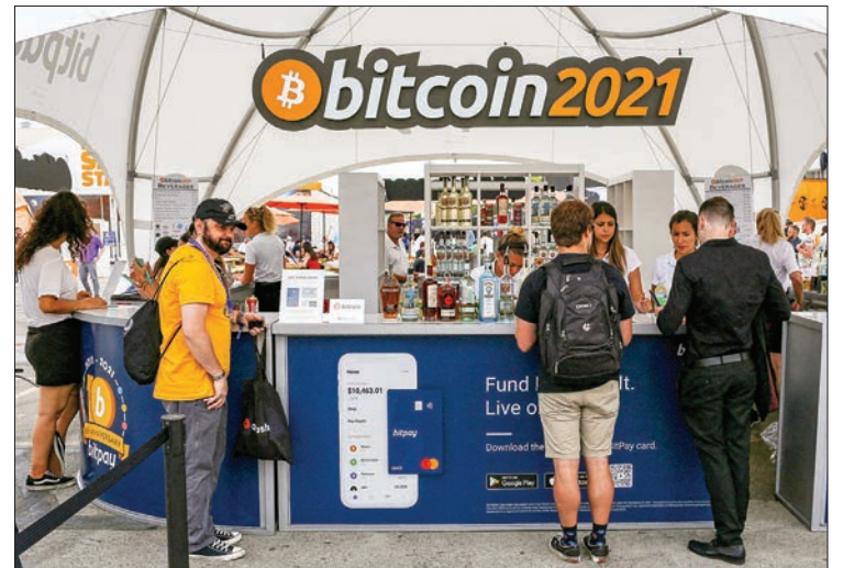
El Salvador's President Nayib Bukele said legalizing bitcoin would transform the remittance-dependent economy.

Remittances from Salvadorans working overseas represent a major chunk of the economy