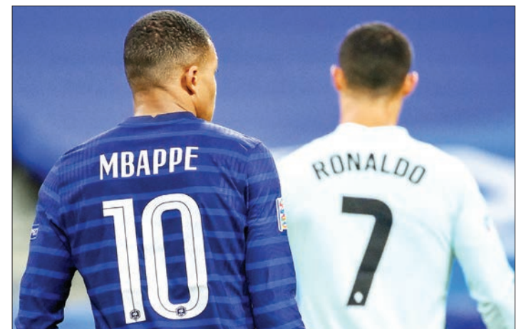
Cristiano Ronaldo and Kylian Mbappe will go head to head at Euro 2020.

Coached by the Italian Marco Rossi, Hungary will get to play their first two matches at home in Budapest but their best player, RB Leipzig midfielder Dominik Szoboszlai, is out injured. It would be an enormous surprise if they finished anywhere other than bottom of their group. — AFP ■