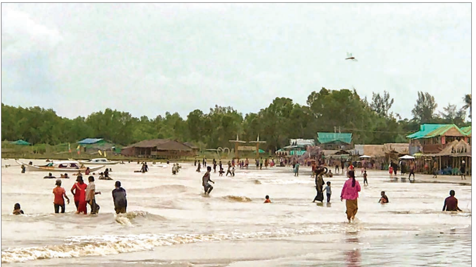
Hseeintan beach can be seen with young and old travellers in Kanyingon Village-tract of Kungyangon Township, Yangon Region.

Children from flocks of travellers happily enjoy riding of horses, speedboats and four-wheel motorcycles at Hseeintan beach. Meanwhile, adults from the flocks pose for documentary photos together with statues of mermaids near the beach. Moreover, visitors wait for the sunset to take photos with the