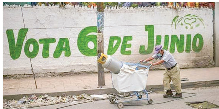
Mexicans will vote in elections seen as critical to President Andres Manuel Lopez Obrador's reform agenda.

Mexico's economy, the second-largest in Latin America, plunged by 8.5 per cent in 2020 in the worst slump in decades, although the government predicts a rebound this year. — AFP ■