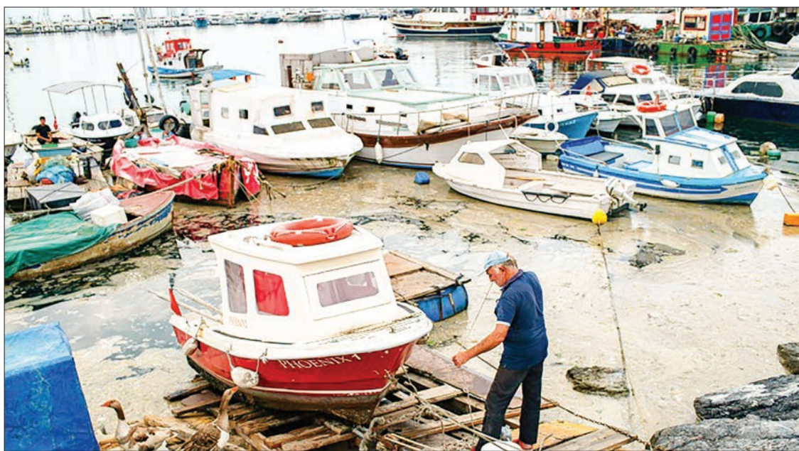
The naturally-occurring mucilage was first documented in Turkey in 2007, when it was also seen in parts of the Aegean Sea near Greece.

The viscous substance lapping the shores of Istanbul comes from a sort of nutrient