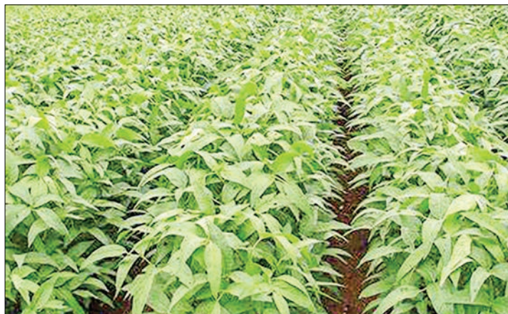
Soybean plantations thriving in patches.

THE strong demand from border markets hikes up soybean price to K80,100 per 60-viss bag (a viss equals to 1.6 kg).