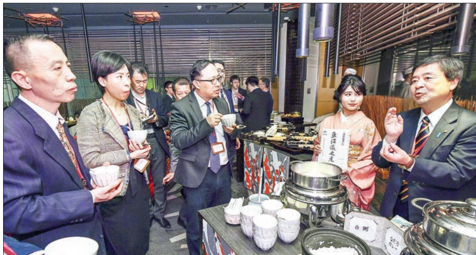
A customer (R) has bags of Japanese rice in his shopping baskets at a grocery store in Beijing on July 26, 2007.

According to Japan's agriculture ministry, Japanese rice costs two to three times more than rice grown in China or the United States. Export costs make Japanese rice even more expensive in