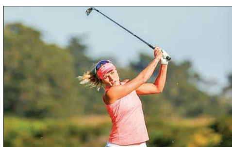
American Lexi Thompson is the 54-hole leader at the US Women's Open at Olympic Club in San Francisco.

Djokovic, the champion in Paris in 2016 and chasing a 19th Grand Slam title, brushed aside 93rd-ranked Ricardas Berankis of Lithuania 6-1, 6-4, 6-1.