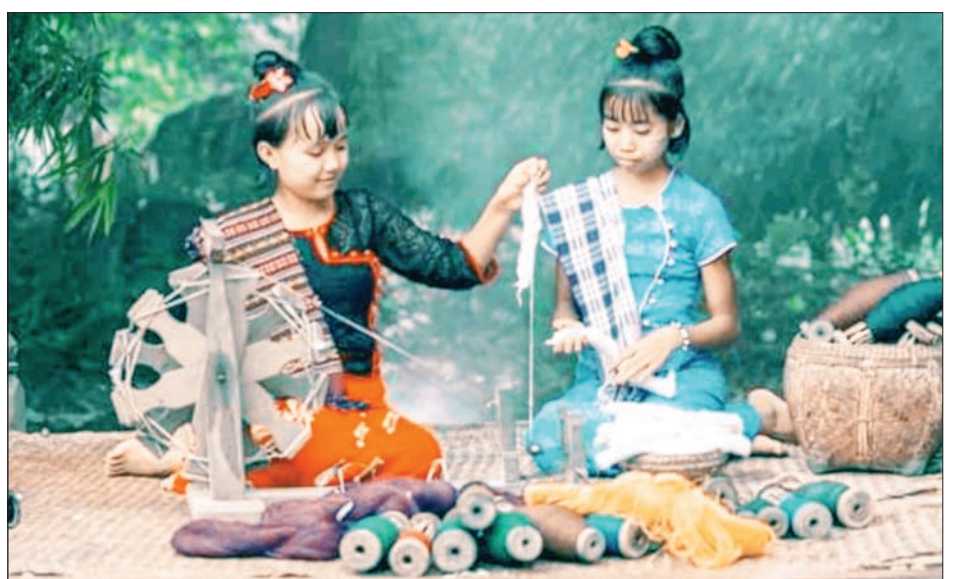
Rural young women making thread of cotton wool for production of textile as traditional works.

tured with the use of machinery. However, traditional weaving, production of baskets made of bamboo, mats and pottery indus-