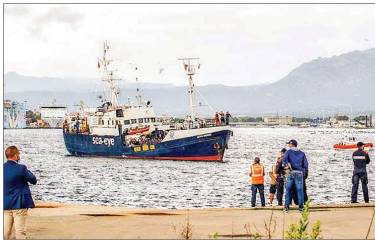
The Italian coastguard has stopped a migrant rescue boat belonging to the German group Sea-Eye from operating due to safety breaches, it said on Saturday.

THE Italian coastguard has stopped a migrant rescue boat belonging to the German group Sea-Eye from operating due to