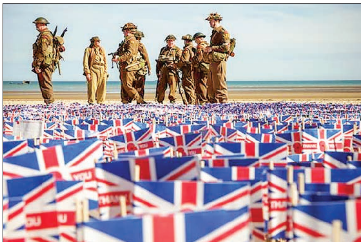
The memorial overlooks a beach where British forces landed on June 6, 1944.

It consists of a series of 160 standing white stones where the names of the soldiers who fell are inscribed in chronological order from June 6 to August 31, 1944. Some 4,000 tonnes of stone were used. — AFP ■