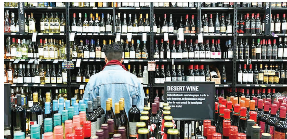
Sales of alcohol drinks and accompanying tax revenues grew some 3 to 5 percent last year from 2019 in some nations such as Britain, the United States and Germany. A patron stands in front of a shelf full of wine bottles at a liquor store in the Brooklyn borough of New York City on March 20.