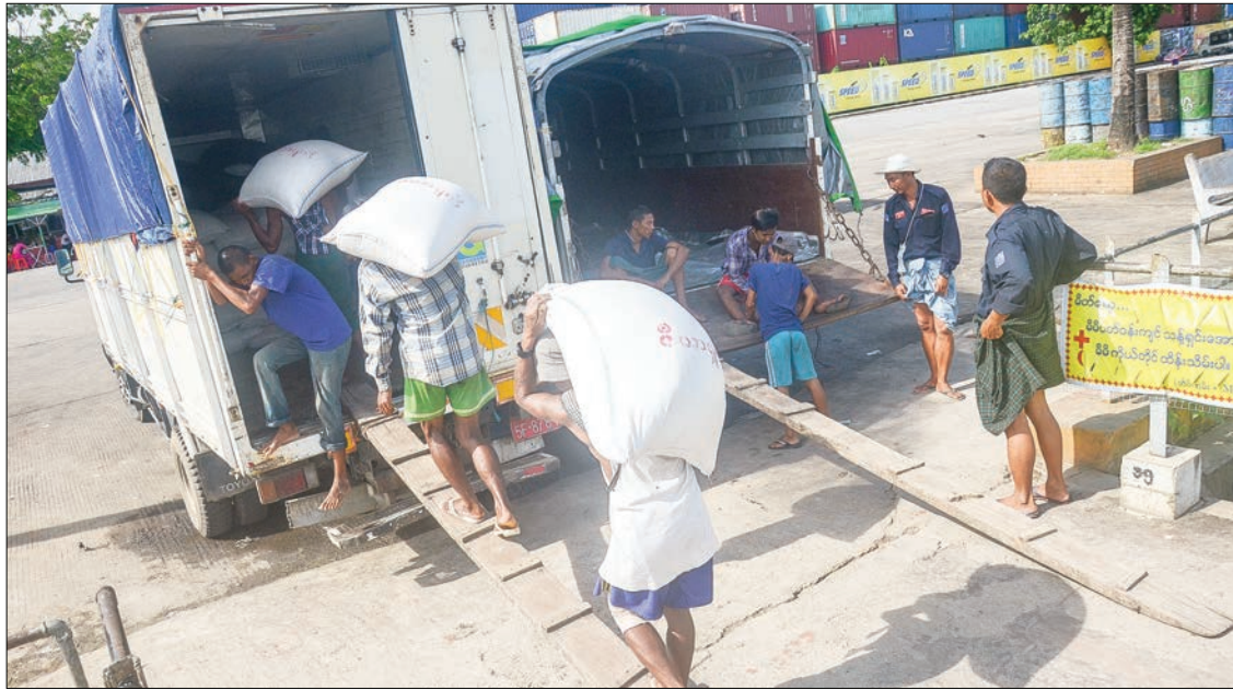
Freight workers are loading bags of rice on cargo truck.

Next, China's Customs granted licences to 47 Myanmar companies on 26 February 2021 to legally export the rice to China through Muse land border this year. The author-