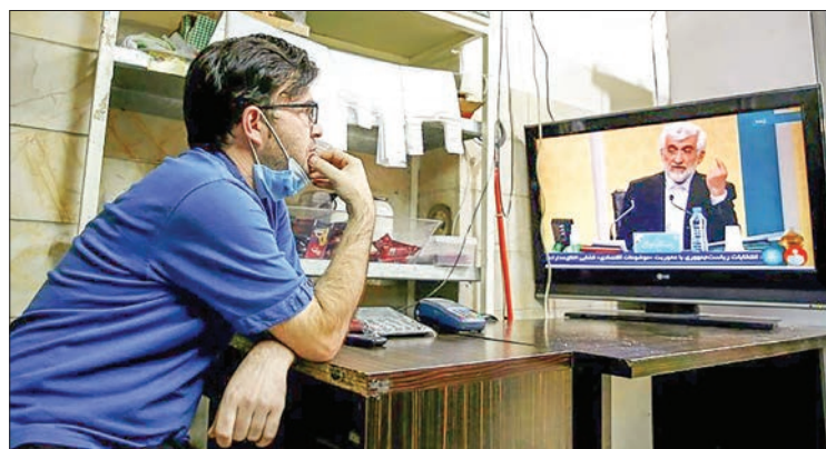
An Iranian man watches the first presidential candidates' debate at a shop in Tehran on June 5, 2021. Iranians are set to elect a successor to President Hassan Rouhani on June 18.

"Mr Hemmati, your governance was catastrophic, you are sitting here as a representative of Mr Rouhani," said Mohsen Rezaei, a former chief of Iran's Revolutionary Guards. — AFP ■