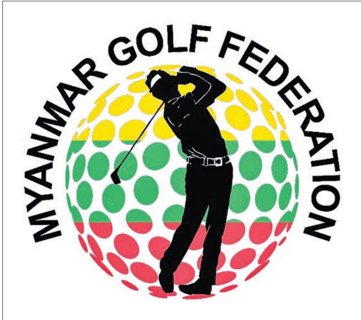
Logo of Myanmar Golf Federation.

OFFICIALS from Myanmar Golf Federation selected Myanmar national golfers at the Okkalapa Golf Course in Yangon on 6 June ahead of the upcoming XXXI SEA Games.