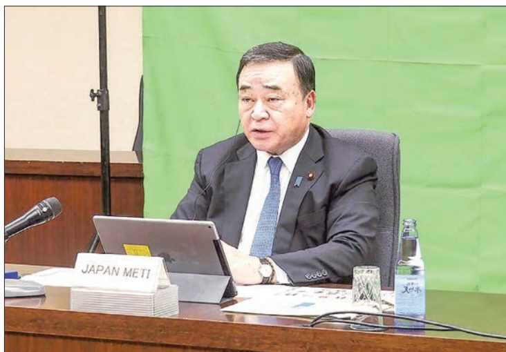
Supplied photo shows Japanese trade minister Hiroshi Kajiyama taking part in an online meeting of the Asia-Pacific Economic Cooperation forum on June 5, 2021, in Tokyo.

"Recognizing the role of extensive COVID-19 immunization as a global public good, we urgently need to accelerate the production and distribution of safe, effective, quality-assured, and affordable COVID-19 vaccines," they said in a joint