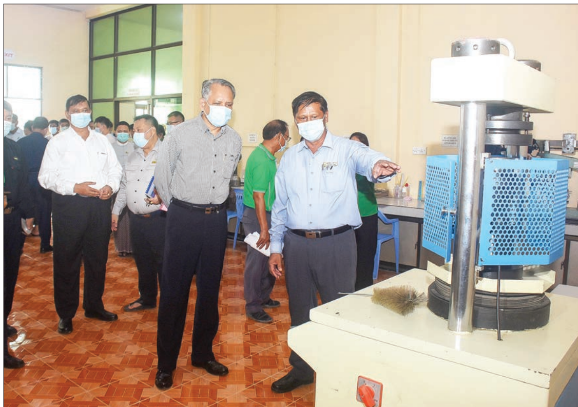
Union ministers view use of machinery in manufacturing of high quality fire proof bricks at the plant in Danyingon of Insein Township, Yangon Region.

U Aung Naing Oo, Union Minister for Investment and Foreign Economic Relations, Vice-Chairman of Myanmar Investment Commission, and U Shwe Lay, Union Minister for Construction,