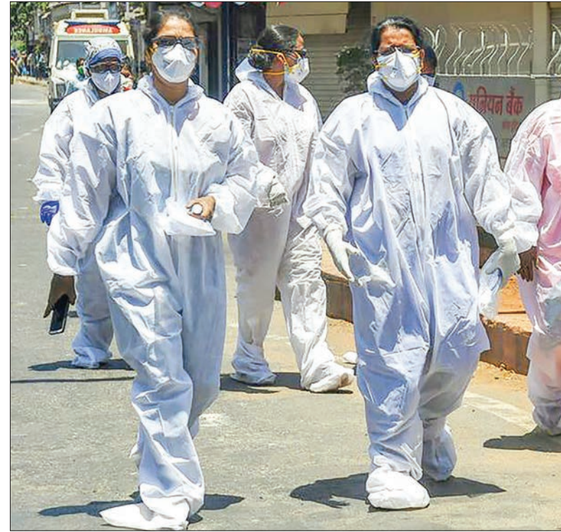
Healthcare workers wearing Personal Protective Equipment (PPE) walk out of a hospital after an imposed nationwide lockdown as a preventive measure against the COVID-19.

In just one typical case, in December police busted a call centre that allegedly defrauded