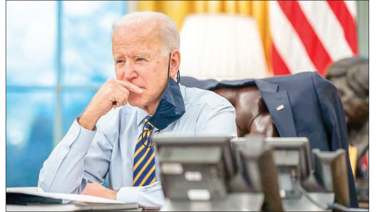
Biden will head to Europe Wednesday, and is set to attend both the G-7 and NATO summits as well as holding a high-stakes meeting with the Russian leader in Geneva on June 16.