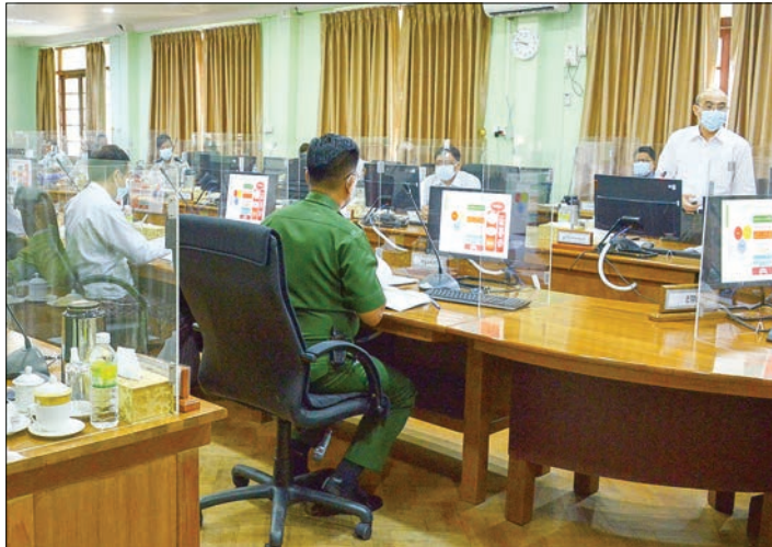
Union Minister for Natural Resources and Environmental Conservation U Khin Maung Yi meets Ayeyawady Region Administration Council members and departmental officials.

He then said it should reduce the natural resources exploration rate and establish firewood forest, conserve mangrove in coastal regions as a national duty in accordance with the instructions of State Administration Council Chairman.