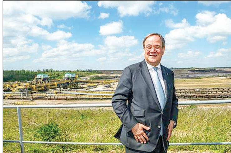
An AfD victory would be a devastating blow for the conservatives and seriously weaken the already fragile standing of the CDU's new leader Armin Laschet.

But the far-right AfD established a strong foothold there in