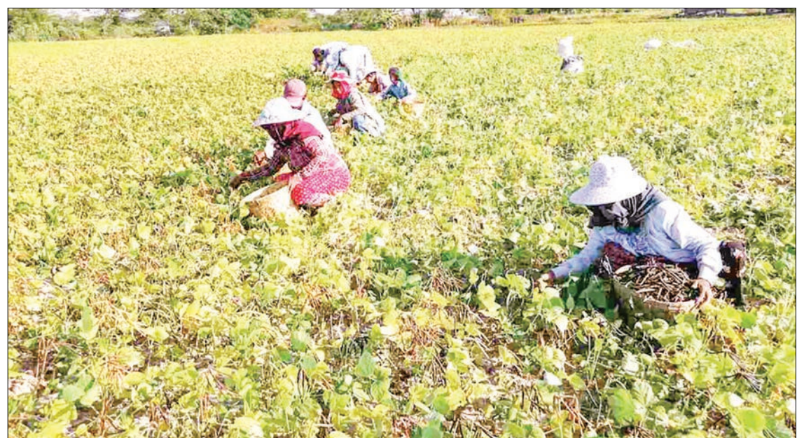
Farming workers are plucking green gram in the farm.

Green gram is primarily grown in Sagaing, Magway, Mandalay, Yangon, Bago, and Ayeyawady regions and Mon and Kayin states.