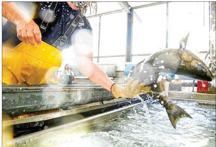
California’s fish and wildlife department have taken “the proactive measure of trucking millions of hatchery-raised” juvenile salmon to the sea.

WITH chronic drought drying up rivers earlier than usual this year, California is scaling up a drastic operation to help its famous Chinook salmon reach the Pacific – transporting the fry by road in dozens of large tanker trucks.