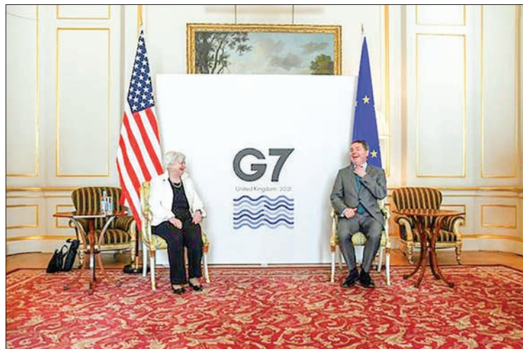
US Treasury Secretary Janet Yellen (L) says a global minimum tax 'would end the race to the bottom in corporate taxation.'

FINANCE ministers from wealthy G7 nations on Saturday pledged to commit to a global minimum corporate tax of at least 15 per cent, rallying behind a US-backed plan.