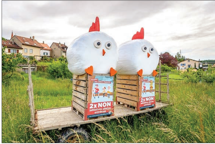
Farmers in the “Yes” campaign say they have been the victims of insults, threats and intimidation.

The initiative, entitled “For a Switzerland free from synthet-