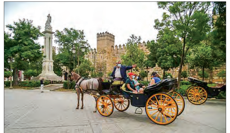
Authorities say tourists will be greeted "with open arms" but the money they will spend will pale in comparison to the income the sector has lost.

European football governing body UEFA in April