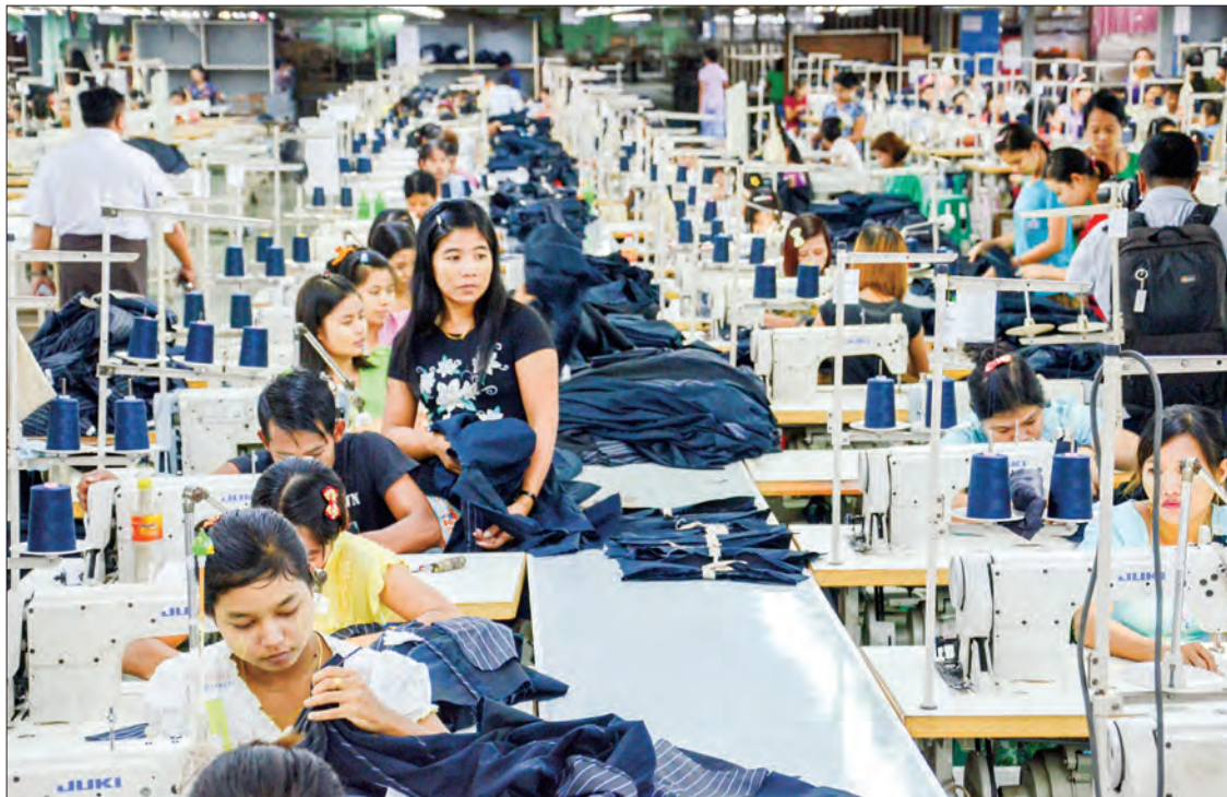
The Swedish fashion retailer H&M is gradually placing orders from Myanmar again after it paused in March. Then, more international fashion retailers such as Primark and Bestseller starts to resume new orders.

Myanmar's manufacturing sector is primarily concentrated in garment and textiles produced on the Cutting, Making, and Packaging basis. It contributes to the country's GDP to a certain extent.