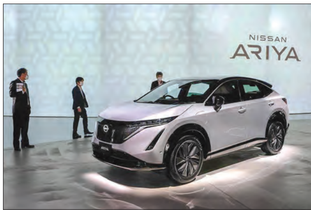
Announced in July 2020, the model was supposed to go on sale in Japan from mid-2021, before arriving in Europe, North America and China by the end of the year.

JAPANESE carmaker Nissan said on Friday it will delay the planned summer launch of its flagship new electric Ariya model to this winter over the global chip shortage plaguing carmakers.