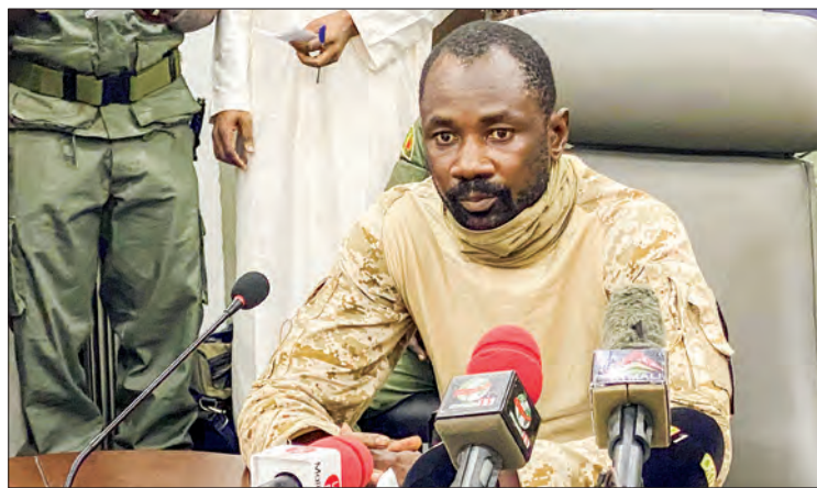
Malian strongman Colonel Assimi Goita is expected to be installed as president of the interim government on Monday.

But the long-planned rally was held after strongman Colonel Assimi Goita, who led a coup on the back of the protests, ousted the civilian transitional president and prime minister on May 24.