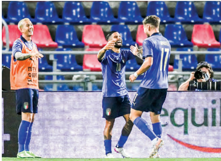
A week before they kick off Euro 2020 in Rome, Italy crushed the Czech Republic 4-0 in Bologna on Friday, keeping an eighth straight clean sheet.

Barella, who injected energy from midfield, added a second before half time.