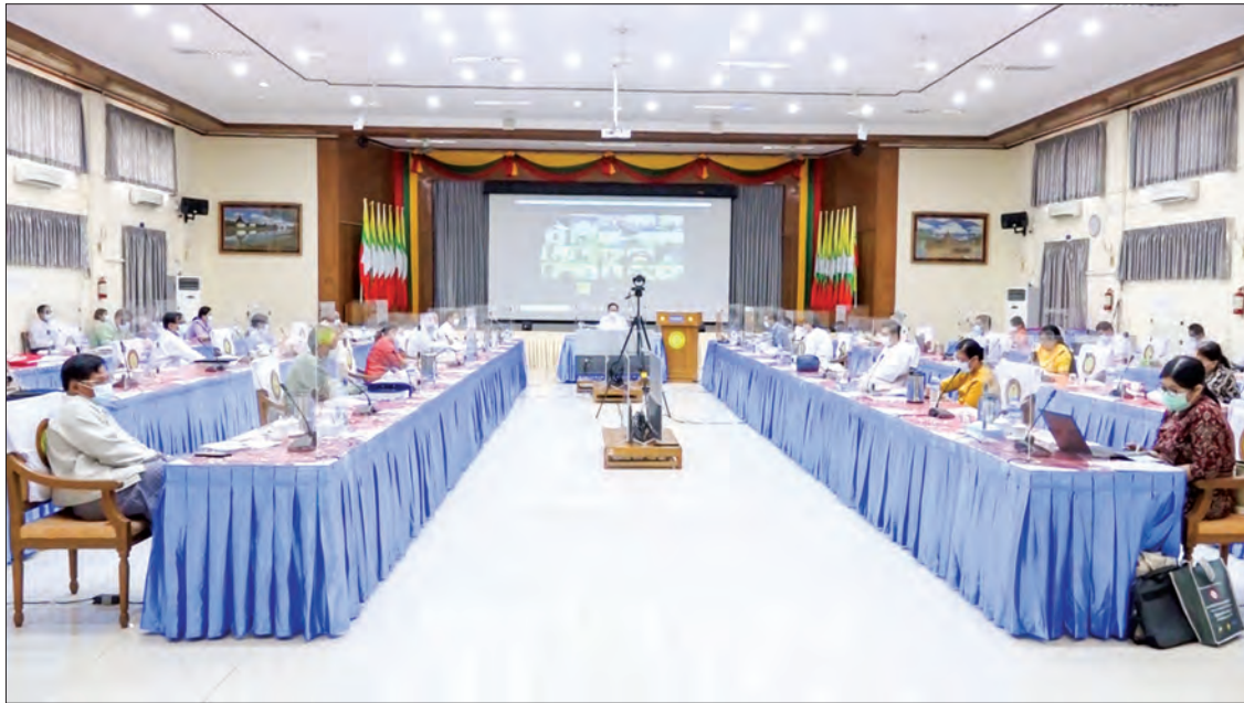
Union Minister Dr Thet Khaing Win discusses with officials of the Department of Public Health and Department of Medical Services at the coordination meeting yesterday.

THE Ministry of Health and Sports held the coordination meeting of the Department of Public Health and Department of Medical Services through videoconferencing on 4 and 5 June.