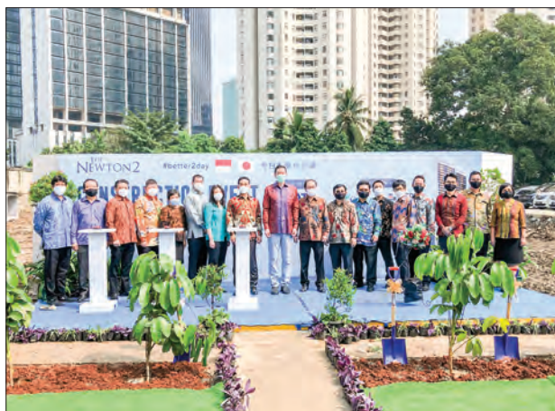
Japanese contractor Toda Corp.'s Indonesian arm and local property developer Ciputra Group hold a groundbreaking ceremony in southern Jakarta on June 3, 2021, to build a 24-storey condo complex.

The company's local real estate consultancy, PT. Toda Group Indonesia, held a groundbreaking ceremony in southern Jakarta on Thursday for the 33-month project to build the 24-storey "Newton 2" complex jointly with major local property