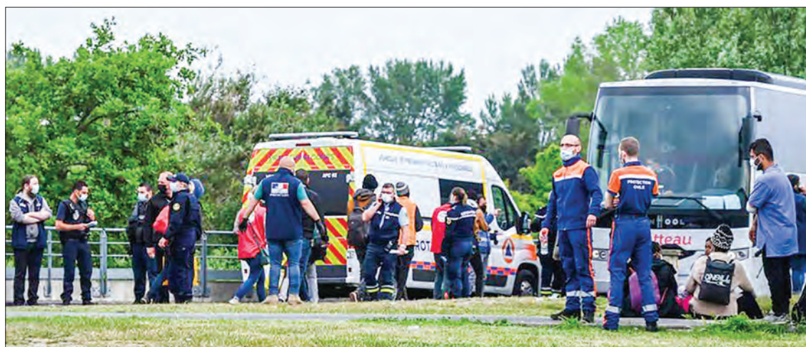
Police supervise the clearing of a camp near Calais, northern France, where about 600 migrants had been living.

"Thank you to the security forces who are mobilized and to