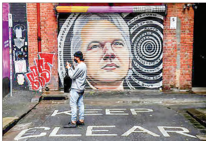
A mural of Julian Assange is seen in a laneway in Melbourne.

“Difficult to accept’ Momentum is growing behind the US-led plans to limit the ability of multinationals like tech giants to game the system to boost profits, especially at a time when economies around the world are reeling from the impact of the coronavirus pandemic. — AFP ■