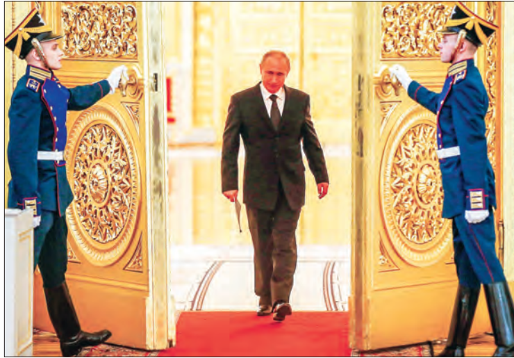
Speaking to Russia's Channel One television later in the day, Putin said he did not expect any breakthrough in Geneva but said it would be good to discuss topics of mutual interest. Russian President Vladimir Putin at the Kremlin in Moscow on March 17, 2015.

“We need to find ways to regularise these relations,” Putin told the Saint Petersburg International Economic Forum, adding