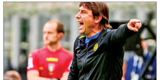
Tottenham Hotspur's hopes of appointing Antonio Conte as their new head coach seem to have faded on Friday night after it was reported that the English Premier League club have decided to end negotiations with the Italian coach.

He was trying to understand if it were possible to bridge the gap with the top four or five Premier League teams in a short period of time, with Spurs having finished 24 points behind champions Manchester City. Conte may now decide to take a year out of management. — AFP ■