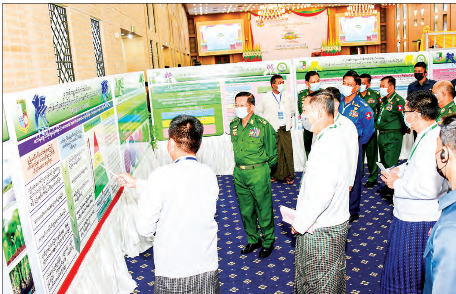
State Administration Council Chairman Senior General Min Aung Hlaing and attendees are paying an observing tour around the panel displays at the World Environment Day 2021 event.

2020 was a year experiencing many disasters, including the Covid-19 global pandemic. With the continued outbreak of the pandemic this year, all must place emphasis on ecosystem restoration as a priority to solve the problems of depleting natural