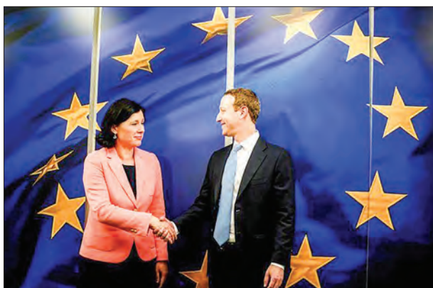
The European Commission said it had opened a formal antitrust investigation to assess whether Facebook violated EU competition rules.

data from its digital advertising services, which allow another business to advertise to its users, as well as from a "single