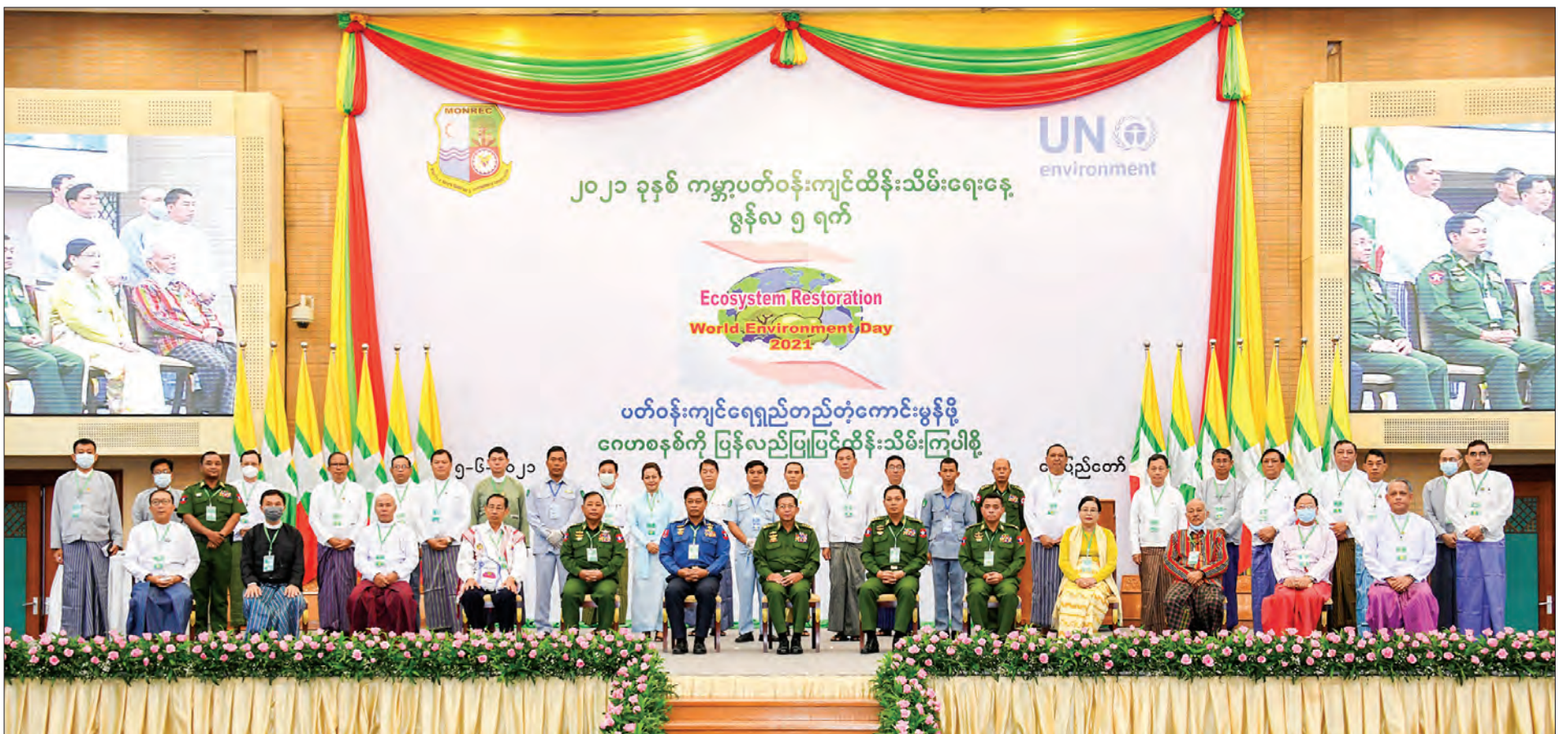
Chairman of State Administration Council Commander-in-Chief of Defence Services Senior General Min Aung Hlaing and attendees are posing for the documentary photo at World Environment Day 2021 in Nay Pyi Taw on 5 June 2021.

We, Myanmar people, love trees and forests and have had a sense of consciousness on the conservation of forest since a long time ago: Senior General