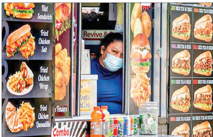
US businesses are hiring, but Labour Department data indicates some unemployed workers are staying away from the workplace, constraining employment growth.

The line to get into the Mana Convention Center in Miami's trendy Wynwood neighborhood wrapped around the building. Everyone was in high spirits and there were no face masks to be seen. — AFP ■