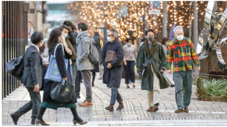
People wearing face masks walk in Tokyo's Marunouchi business district on Feb. 2, 2021.

Tepid wage growth is seen as a drag on consumption, which makes up the bulk of the econ-