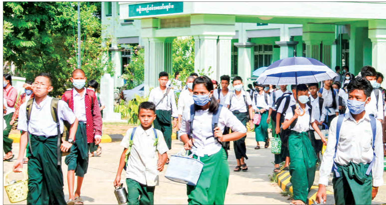
BEHS-7, Nay Pyi Taw.

Education began in prehistory, as adults trained the young in the knowledge and skills deemed necessary in their society. In pre-literate societies, this was achieved orally and through imitation. Story-telling passed knowl-