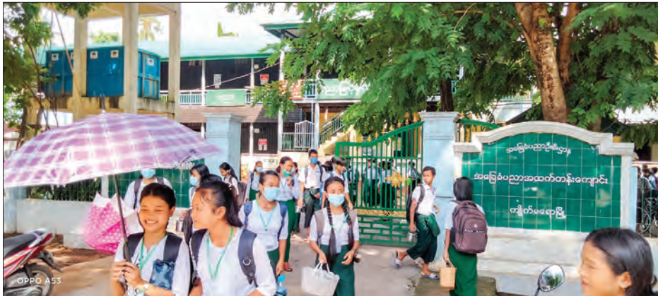
Kyaikmaraw Township, Mon State.