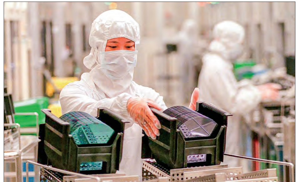
Technicians working at a microchip making factory in Taiwan.

"The Hsinchu Science Park is home to some very important global semiconductor factories," mayor Lin Chih-chien told AFP. "Hsinchu city has to protect not only its residents, but also importantly protect the home base of the world's most important semiconductor industries."