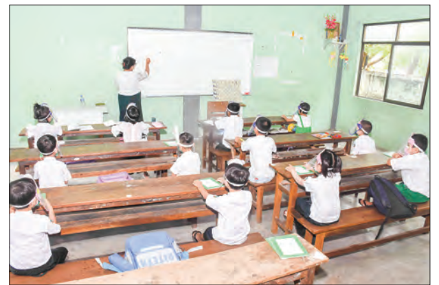
Mahaangmyay Township, Mandalay Region.