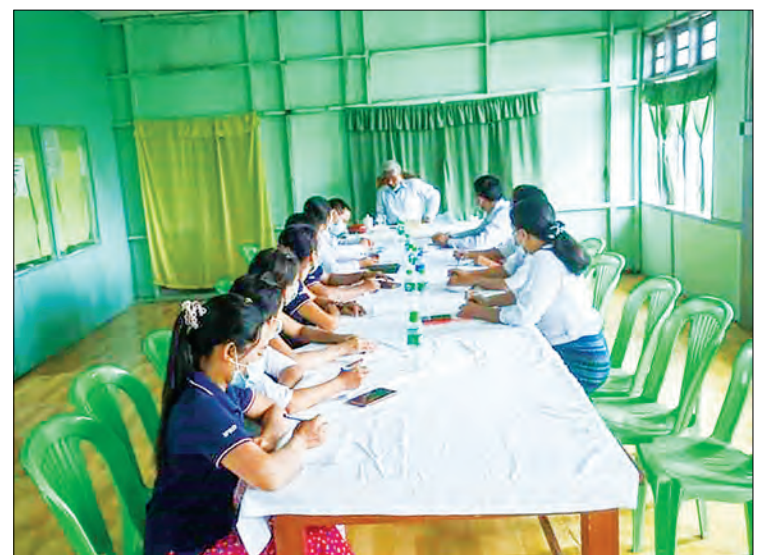
The deputy minister meets the Shwebo IPRD staff on 31 May 2021.

The deputy minister gave instructions regarding the reports and needs of employees and stressed the need to perform the duties with goodwill. — MNA