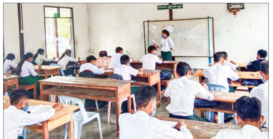
Monghset Town, Shan State (East).