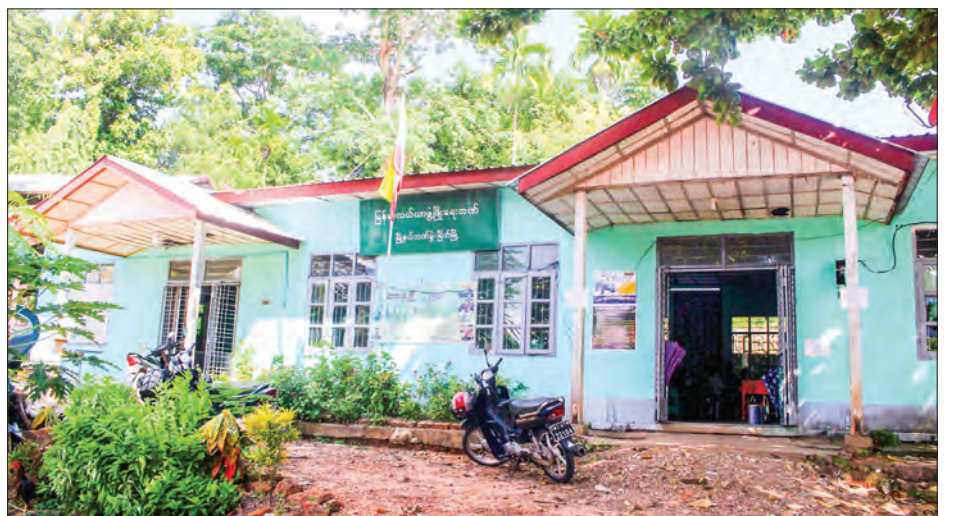
The MADB Myeik branch will disburse a total of 6,122 farmers (36,671 acres) monsoon crop loans, paying out K150,000 per acre.

MADB provides annual agricultural loans to small-scale farmers, intending to have food self-sufficiency and export competitiveness for Myanmar's agricultural products in order to boost exports, promote the interests of the farmers and enhance their socio-economy.