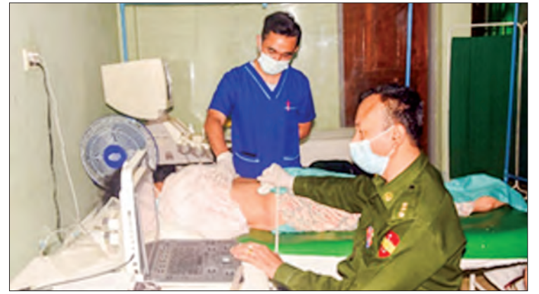
station military hospitals. The commanders also gave food-stuffs to the patients yesterday. — MNA

Commanders of Northern Command, Yangon Command, South-West Command, North-West Command and Southern Command comforted the patients—monks, local people, military officers, other ranks and their families—at the respective