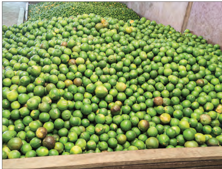
But this year, the price of lemon was K40 per fruit, a drop by half this year compared to last year.

THE lemon trees are widely grown in Kya-in-Seikkyi township, Kayin State, and the lemon cultivation is successful.