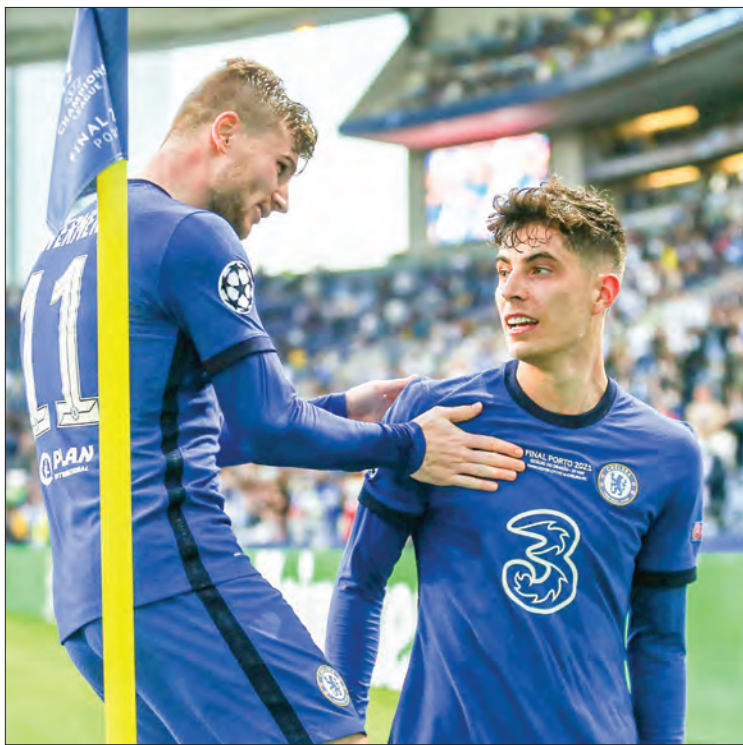
The late arrival of a quartet of Premier League stars is set to give Germany a timely boost as head coach Joachim Loew looks to fix his misfiring side in their final preparations for Euro 2020.

THE late arrival of a quartet of Premier League stars is set to give Germany a timely boost as head coach Joachim Loew looks to fix his misfiring side in their final preparations for Euro 2020.