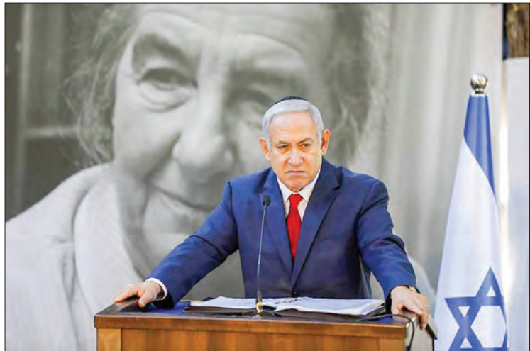
Netanyahu, 71, was formally charged in 2019 over allegations he accepted improper gifts and sought to trade regulatory favours with media moguls in exchange for positive coverage.

ISRAEL'S longtime premier Benjamin Netanyahu is set to lose power after a diverse coalition united in an 11th-hour deal against him, raising questions about the next steps in