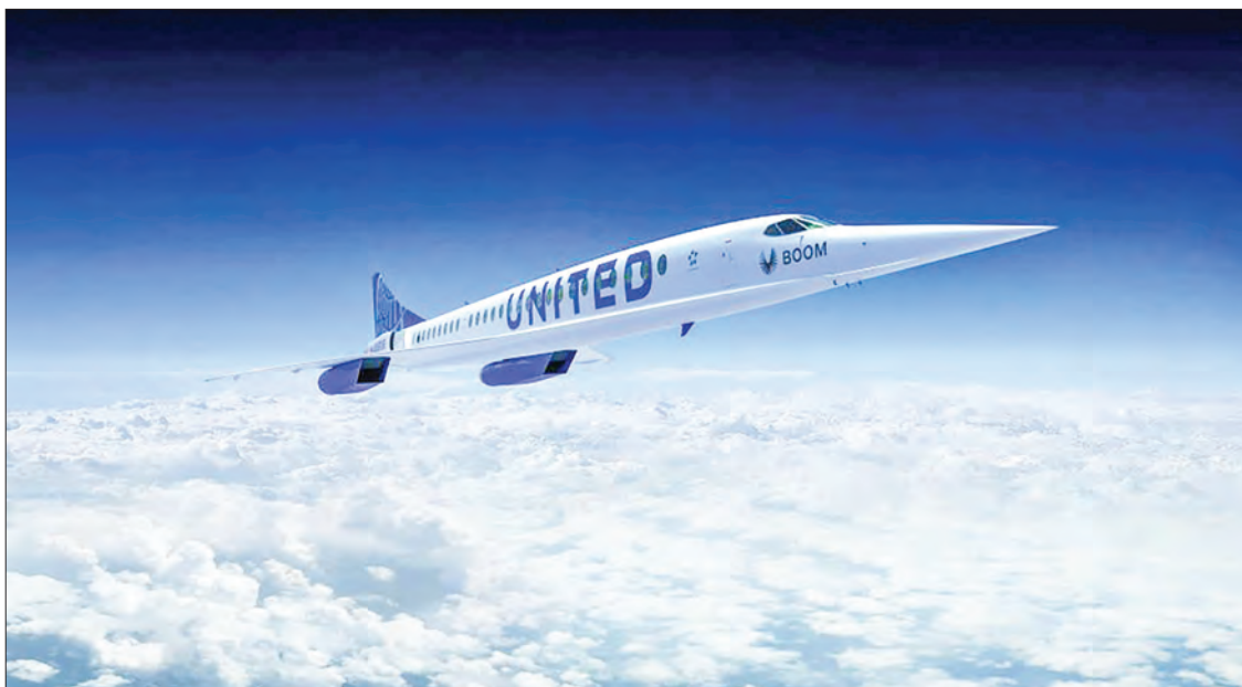
An artist rendering released by Boom Supersonic shows the company's supersonic airplane with the United Airlines logo.

"The jury is out on how they will be able to operate the new national security law. There are all sorts of question marks up in the air," the Times quoted Hale as telling an online conference on Thursday. — AFP ■