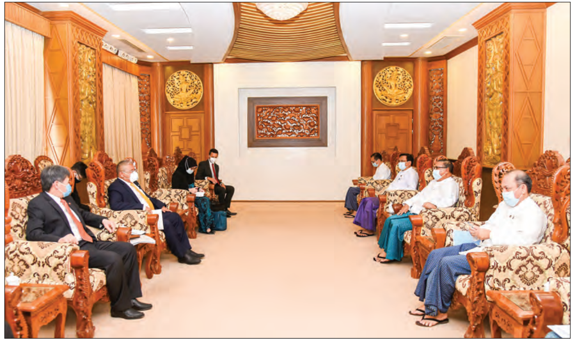
Union Minister U Wunna Maung Lwin receives the Brunei Foreign Minister and ASEAN Secretary-General in Nay Pyi Taw yesterday.

In the evening, Union Minister hosted dinner for Minister of Foreign Affairs II of Brunei Darussalam and Secretary General of the ASEAN.—MNA