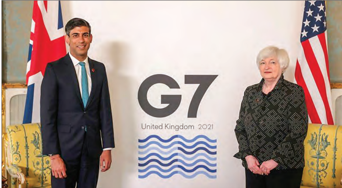
Britain's Chancellor of the Exchequer Rishi Sunak (L, with US Treasury Secretary Janet Yellen) is hosting the G7 meeting on plans for a minimum global level of corporate tax.

GROUP of Seven finance ministers are set to kick off talks on Friday, with the spotlight on ambitious plans for a minimum global level of corporate tax.