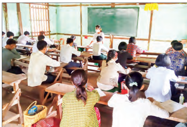
Kyaukpadaung Township, Mandalay Region.