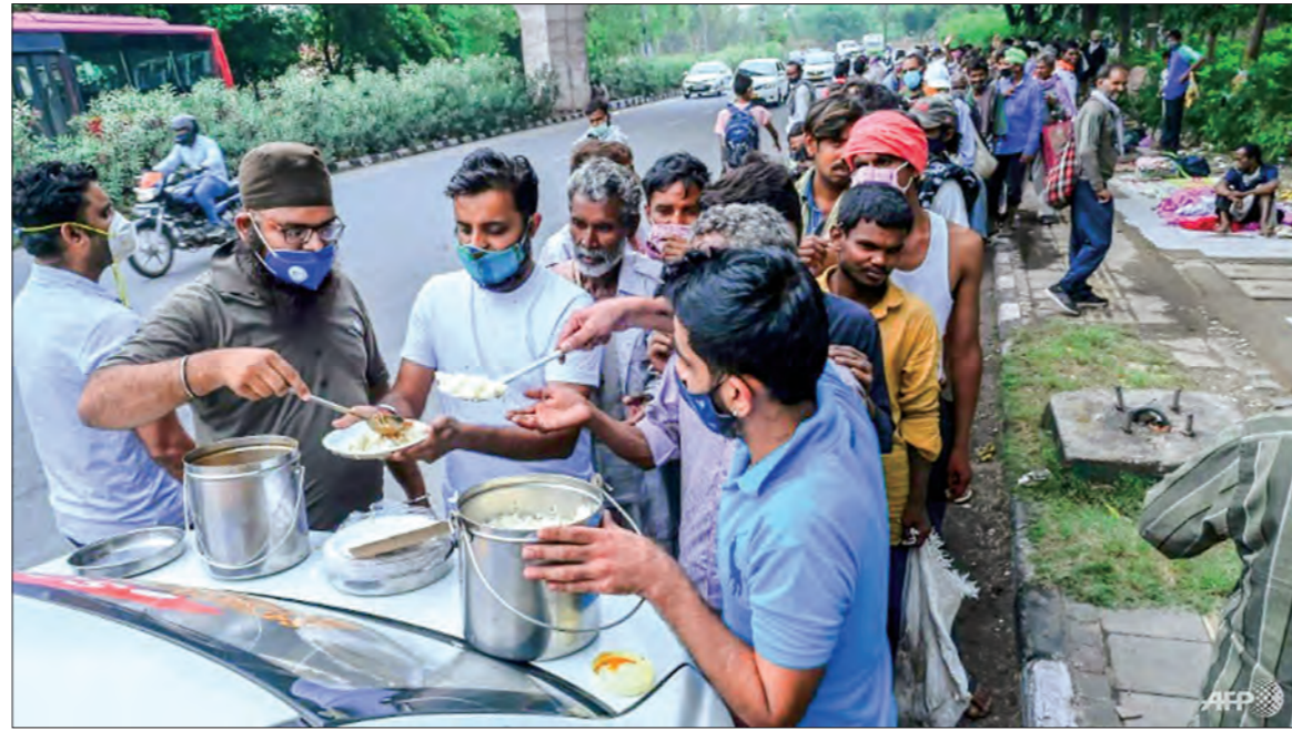
A devastating coronavirus wave has pushed millions of Indian families into poverty and hunger.

"Without a deliberate effort to accelerate the creation of decent jobs, and support the most vulnerable members of society and the recovery of the hardest-hit economic sectors, the lingering effects of the pandemic could be with us for years in the form of lost human and economic potential, and higher poverty and inequality."