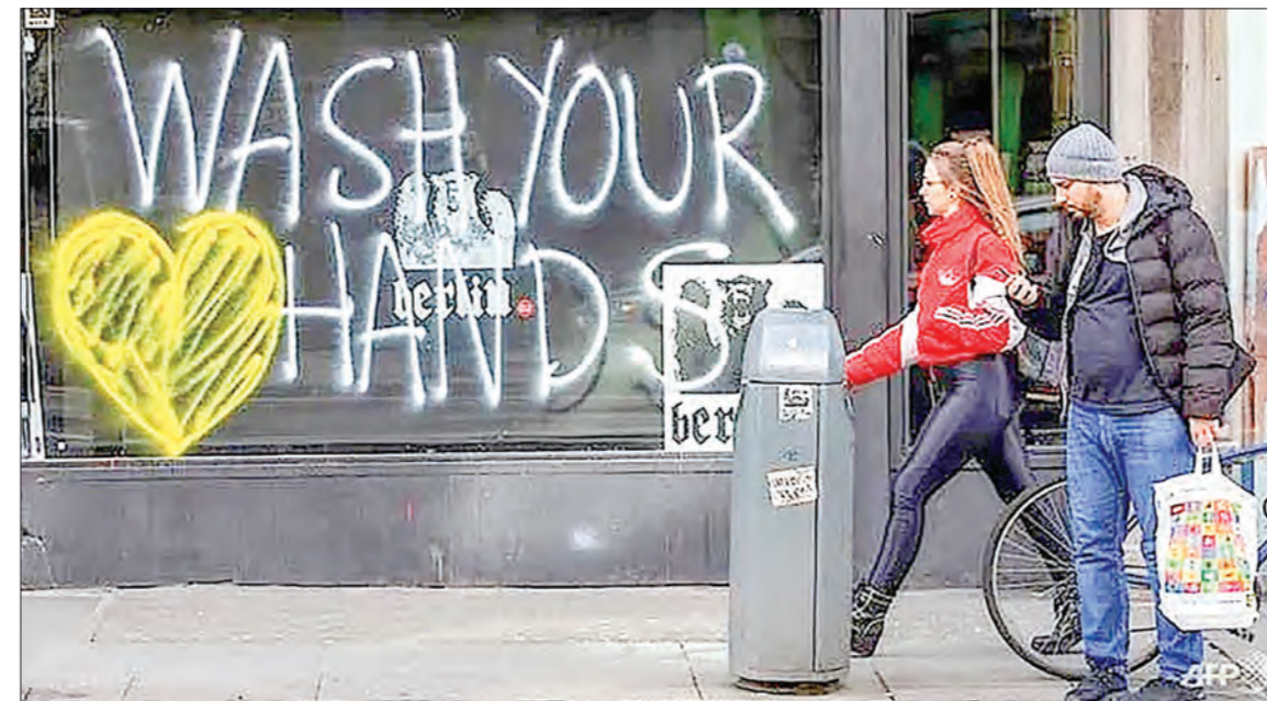
Pedestrians walk past graffiti urging people to 'wash their hands' in the Grafton Street area of Dublin City centre, on Mar 13, 2020.