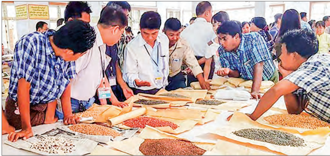
The black bean plantations yielded around 400,000 tonnes annually in Myanmar, and the bean is mainly exported to India.

Black bean price has increased when India, the primary buyer of Myanmar pluses, has redefined black bean, green gram and pigeon pea bean from a restricted commodity to a free import commodity. However, the price has not reached the price