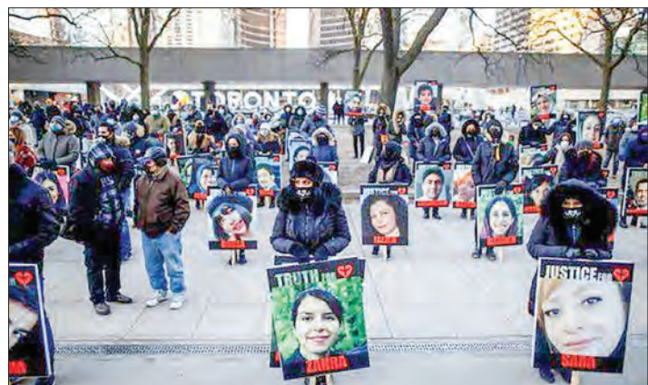
People hold signs with images of the victims of the downed Ukraine International Airlines flight PS752, which was shot down near Tehran by the IRGC, as family and friends gather to take part in a march to mark the first anniversary, in Toronto, Ontario, Canada, on January 8.

In a final report in March, the Iranian Civil Aviation Organisation (CAO) pointed to the "alertness" of its troops on the ground who shot the missiles amid heightened tensions between Iran and the United States at the time. — AFP ■