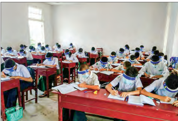
Bago Township, Bago Region.