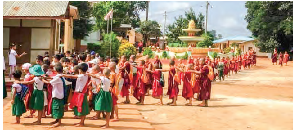
Nawngkhio Township, Shan State (North).