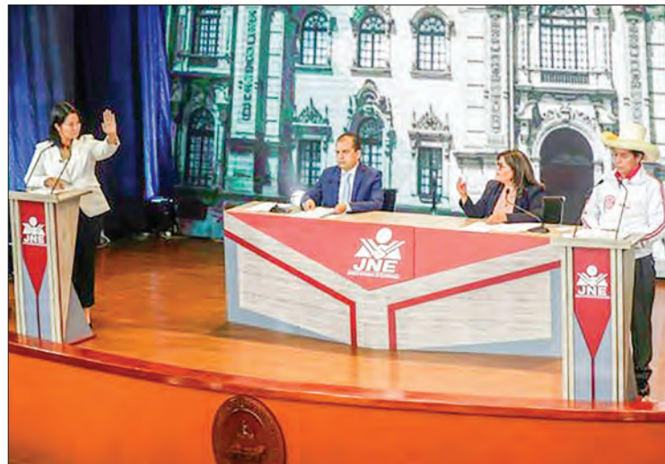
Peru's presidential candidates Keiko Fujimori (left) and Pedro Castillo represent polar opposite economic models but share similar views on gay rights issues.

PERUVIANS will be faced with choosing the "lesser evil" between rightwing populist Keiko Fujimori and radical leftwing unionist Pedro Castillo when voting for their new president on Sunday.