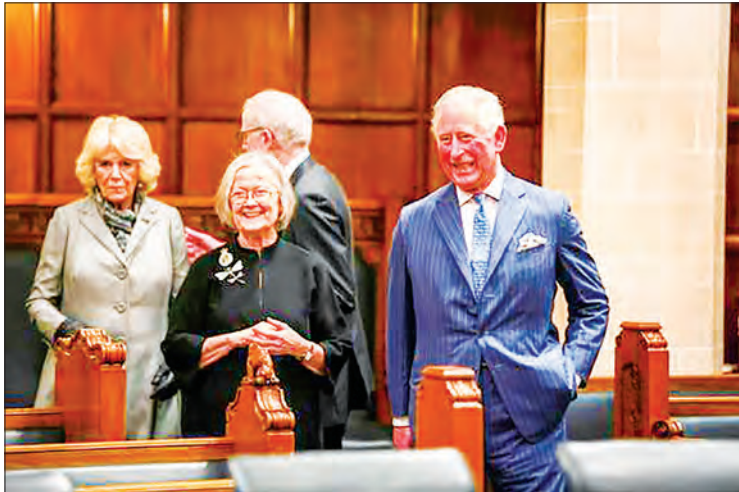
Baroness Brenda Hale (centre), with Prince Charles at the Supreme Court.

But China's imposition of a sweeping national security