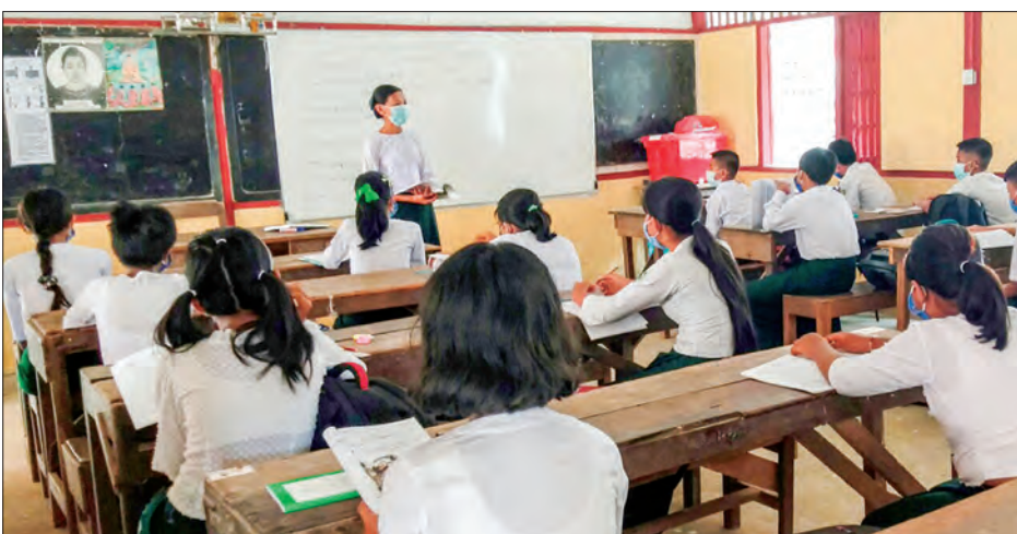
Chaungzon Township, Mawlamyine District, Mon State.