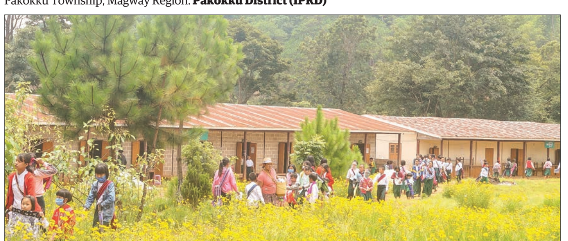
Naungtayar Town, Pintaya Township, Pa-O Self-Administered Zone, Shan State (South). Naungtayar