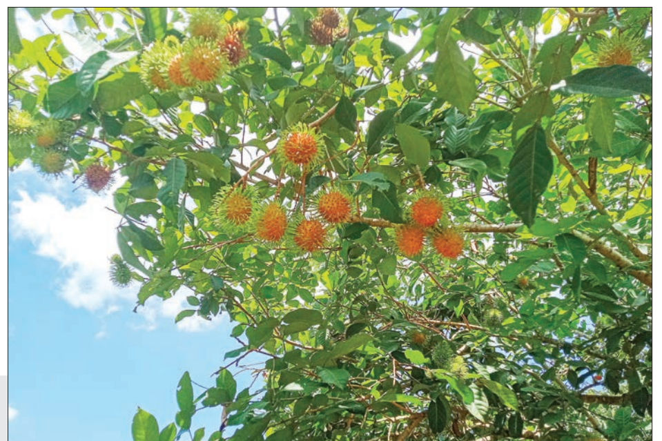
There are two colours of rambutan as yellow and red. The red rambutan fruit is more popular because it is sweeter than the yellow one.

There are two colours of rambutan as yellow and red. The red rambutan fruit is more popular because it is sweeter than the yellow one. The abundant yield of rambutan is earning the growers an additional income for their family.