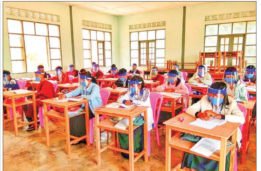
Pinlaung Township, Shan State (South). Township (IPRD)