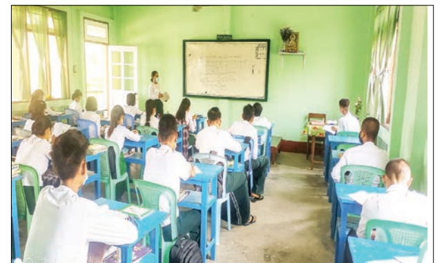
Zabuthiri Township.