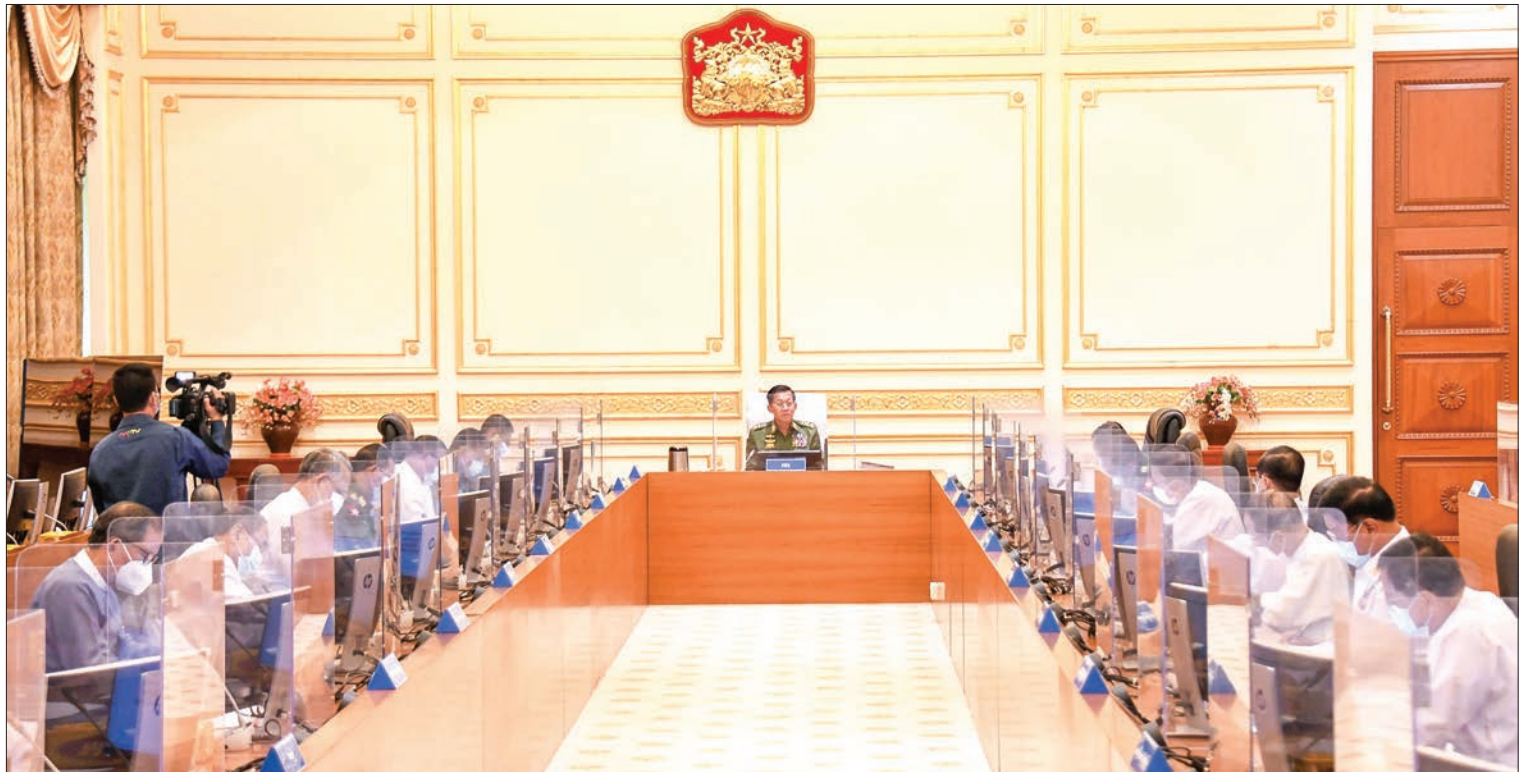
State Administration Council Chairman Commander-in-Chief of Defence Services Senior General Min Aung Hlaing presides over the SAC Management Committee meeting 8/2021 in Nay Pyi Taw on 3 June 2021.

In his speech, the Senior General said that the government is responsible for the State's economic development and peace and stability. The Tatmadaw, administrative bodies, and departments related to legal affairs and Myanmar Police Force are key players in ensuring peace and stability of