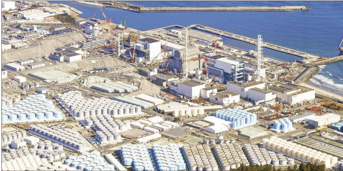
In Japan, many nuclear plants remain offline under stricter safety regulations implemented after the 2011 Fukushima nuclear disaster, which was triggered by a massive earthquake and tsunami.

JAPAN has softened its commitment to nuclear power in a draft economic growth strategy to be finalized later this month after facing opposition from several Cabinet ministers, government sources said Thursday.