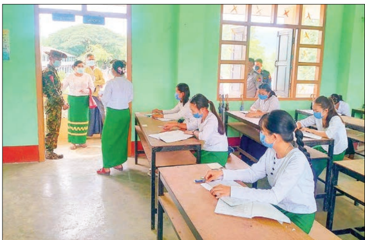
Mongpyin, Kengtung District, Shan State (East). Mongpyin