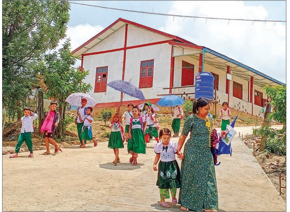
Metmung Township. Township (IPRD)