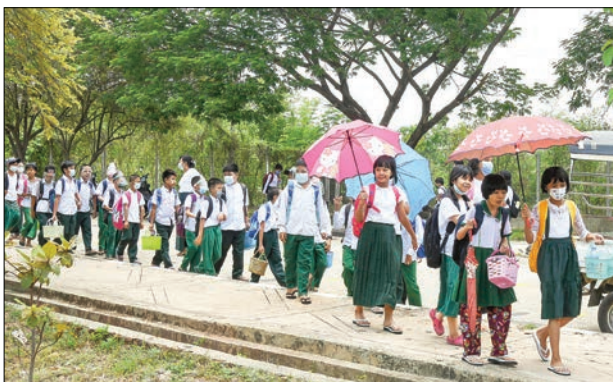
BEHS-5, Nay Pyi Taw.

Though the nationwide school enrolment week was set from 24 to 31 May, enrolment of students who have not yet enrolled for various reasons will be accepted continuously during the school opening period.