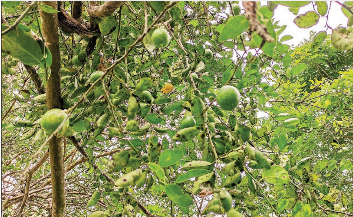
Lime plants can be seen throughout the country. The fruits grown in Kya-in-Seikkyi Township are often sent to the nearby markets.

THE lime prices are weakened in Kya-in-Seikkyi township in Kayin State in monsoon.