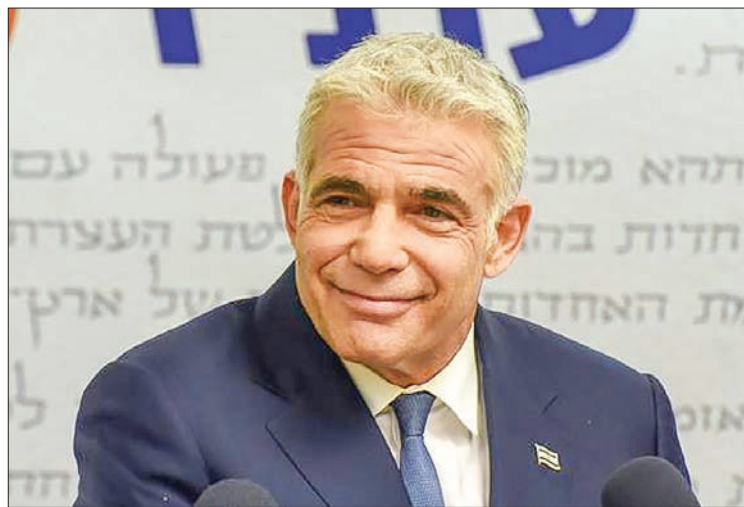
Israel's centrist opposition leader Yair Lapid.

tech millionaire Naftali Bennett, 49, would serve first as prime minister in a rotation agreement, with Lapid to take over after two years.