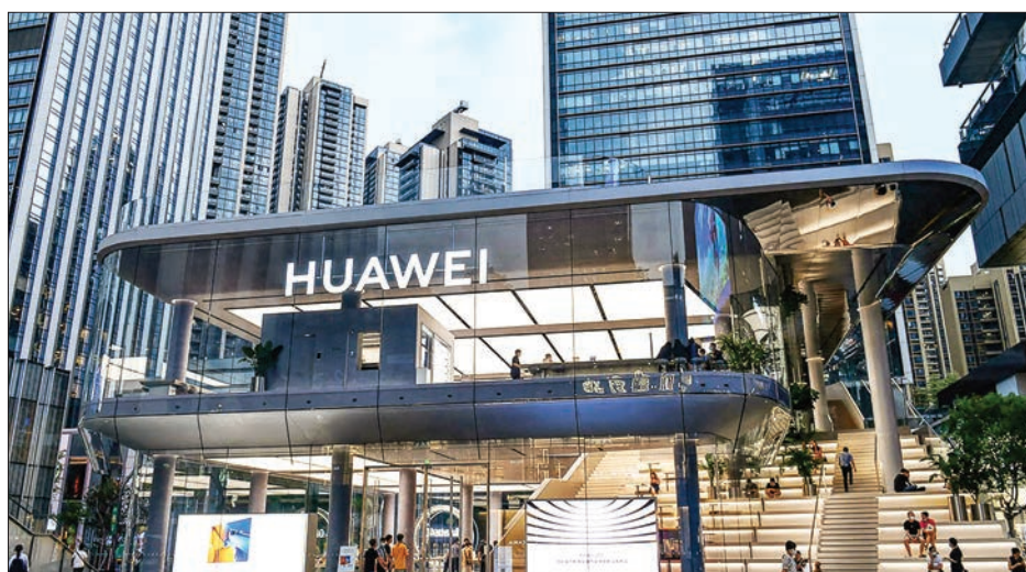
Huawei's most immediate challenge is in apps - convincing enough developers to reprogramme their applications and other content to work with HarmonyOS so that consumers will continue to buy Huawei phones. This photo taken on May 31, 2021 shows the Huawei flagship store in Shenzhen, in China's southern Guangdong province.

EMBATTLED Chinese tech giant Huawei will launch a homegrown new mobile operating system on Wednesday as it fights for survival in the smart-