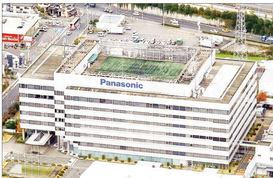
Panasonic Semiconductor Solutions Co.'s head office in Nagaokakyo, Kyoto Prefecture. PHOTO: KYODO/FILE

Japan's COVID-19 vaccination campaign completely relies on imports. The government has come under fire for a slow vaccine rollout that has been plagued by bottlenecks in vaccination booking systems, among other reasons. — Kyodo