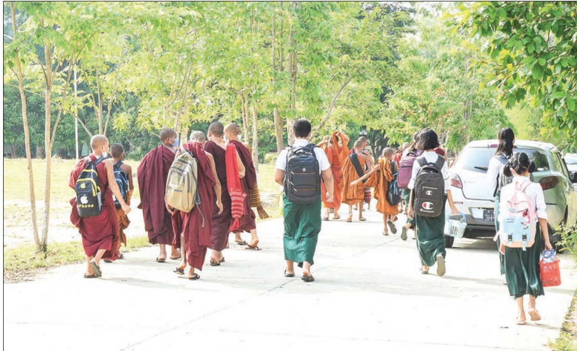
BEHS-8, Nay Pyi Taw.

“Before reopening the school, the government painted new painting to the school and about 100 people, with the help of the township administration body, cleaned the school com-