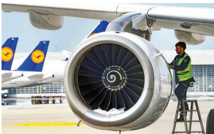
A technician of the German airline Lufthansa works on a parked plane at Munich International Airport, Munich, southern Germany, April 28, 2020.

"Due to the reciprocal practice, the Federal Aviation Authority also did not issue any further permits for flights operated by Russian airlines as long as authorisations are pending on the Russian side," it added. — AFP ■