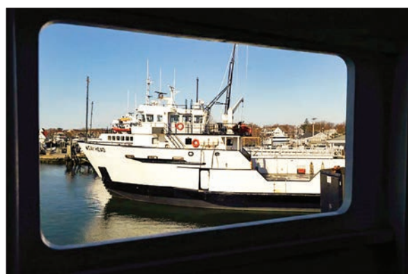
A ferry belonging to the Steamship Authority company at the port of Hyannis, Massachusetts.

Aside from the geopolitics, no company has successfully taken on the mobile OS duopoly now dominated by Google's Android and Apple's iOS systems, a battleground littered with the likes of flame-outs including BlackBerry, Microsoft's Windows Phone and the Amazon Fire device. Analysts say Huawei likewise faces a tough battle to carve out a sizeable share of the OS pie. — AFP ■