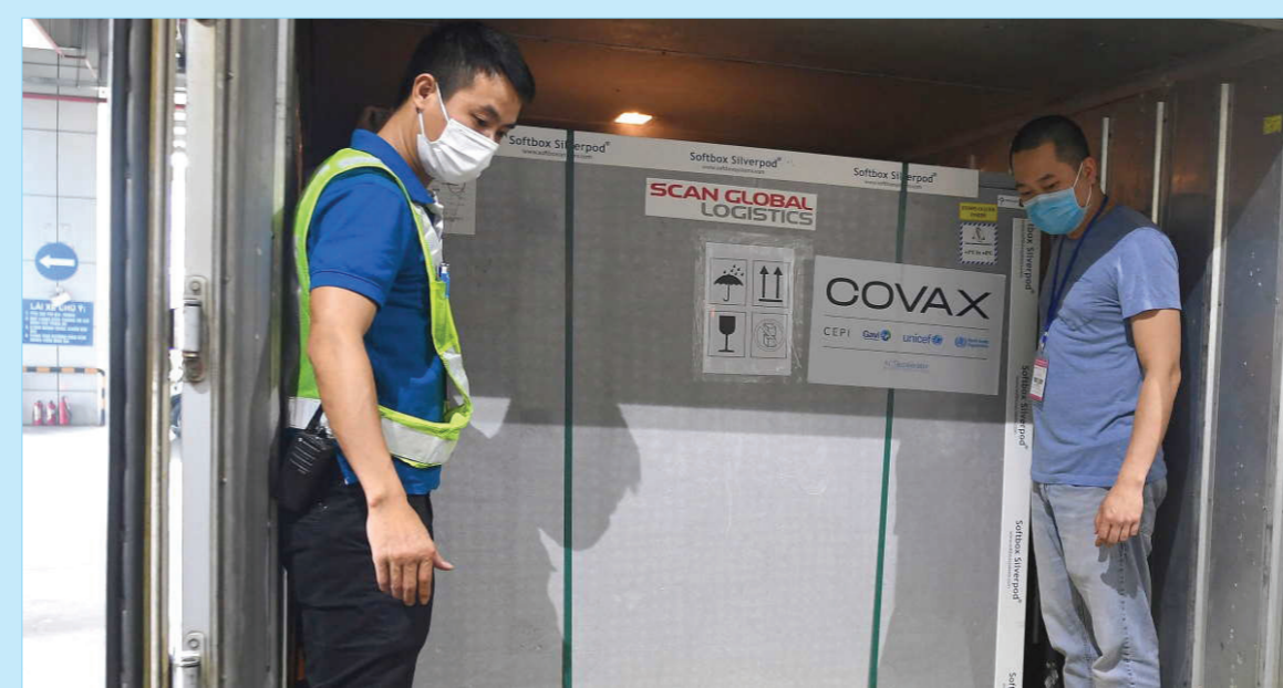
Workers prepare to offload a container carrying the first shipment of the AstraZeneca/Oxford COVID-19 coronavirus vaccine as it arrives at the Noi Bai International Airport Cargo terminal in Hanoi on 1 April, 2021.

At Wednesday's meeting, countries pledged to donate more than 54 million vaccine doses to lower-income nations to try to bridge the supply problems.