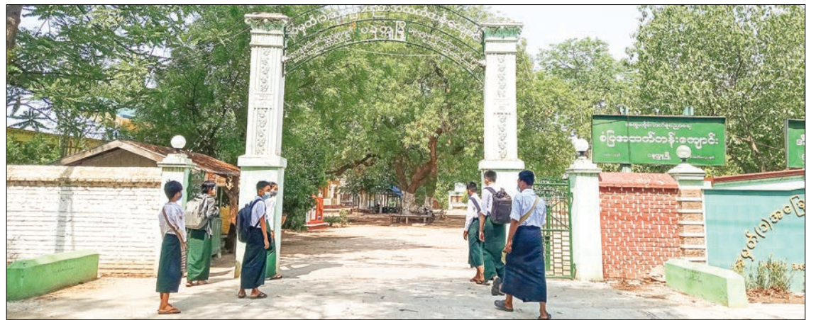
Pakokku Township, Magway Region. Pakokku District