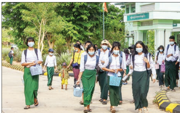
BEHS-7, Nay Pyi Taw.