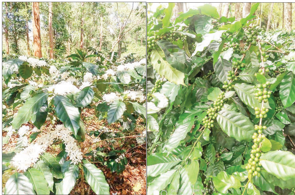
Natyaykan coffee farms in Ngaphe Township produces 2.5 tonnes of coffee seeds, and the private farms produce 42.5 tonnes, totalling 45 tonnes.

"A group of coffee growers has been formed to enhance the marketable quality. The awareness courses have been conducted three times, and so has been the demonstrations. Coffee seeds, plants and agricultural tools were also provided two times. The number of acres has grown over the years. About 45 tonnes of coffee have been produced so far