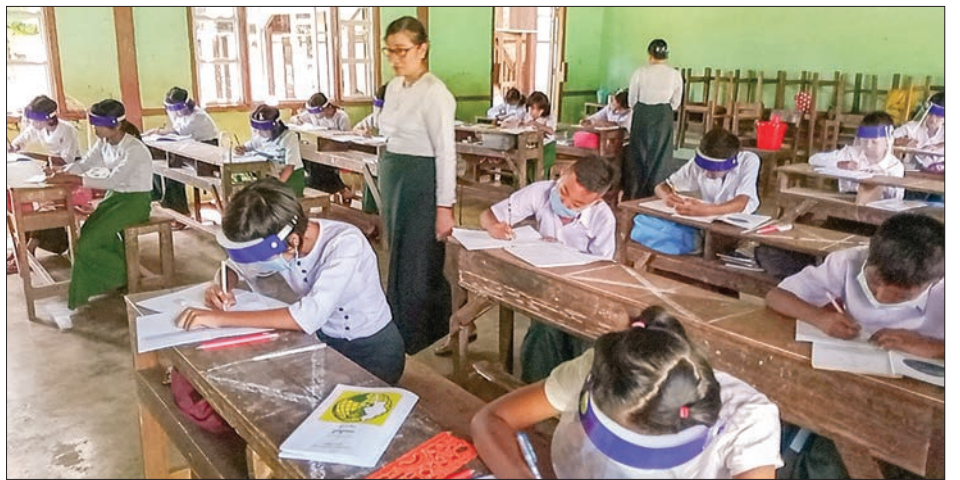
Thayetchaung, Dawei District, Taninthayi Region.