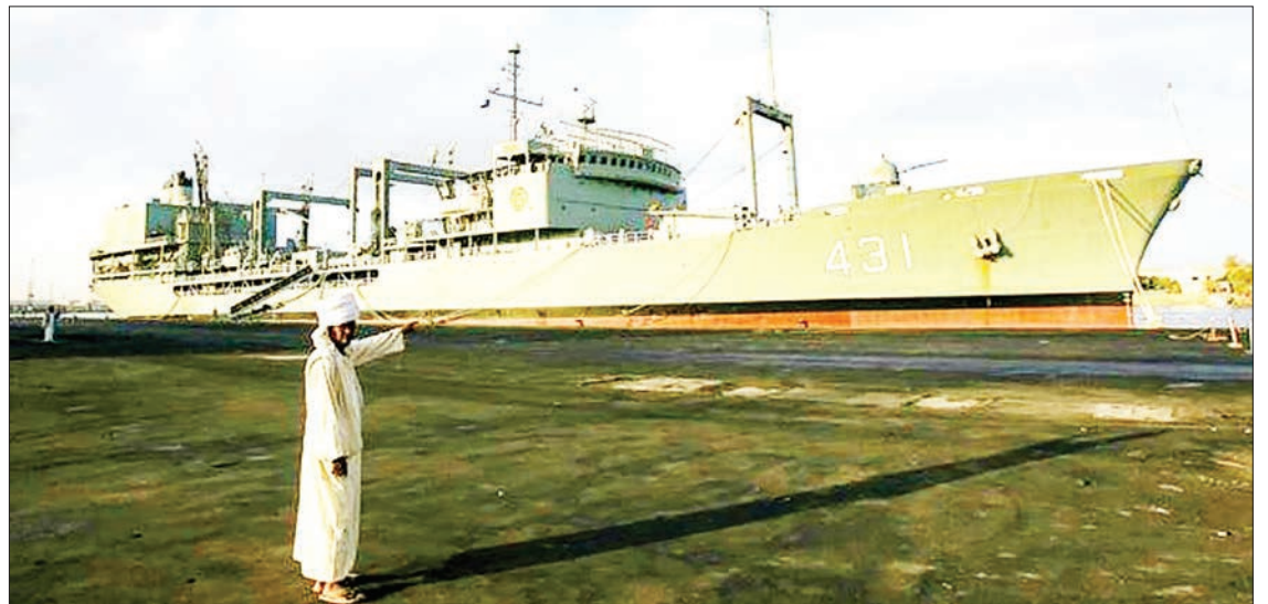
In this photo the Iranian Kharg 431 supply navy ship is seen docked in the Red Sea Sudanese town of Port Sudan

ship was hit by friendly fire during a naval exercise off Jask, killing the 19 sailors onboard.