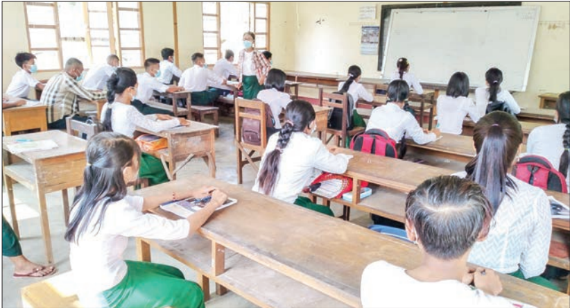
Kyaukdaga Town, Bago Region.