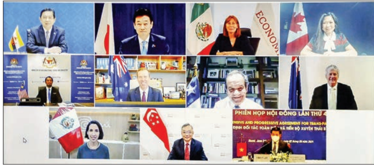
Screenshot image shows ministers from the 11-member Trans-Pacific Partnership countries holding an online meeting of the Commission, the TPP's highest decision-making body, on June 2, 2021.

THE 11 members of the Trans-Pacific Partnership decided Wednesday to start negotiations for Britain's entry into the regional free trade agreement, a Japanese minister said.