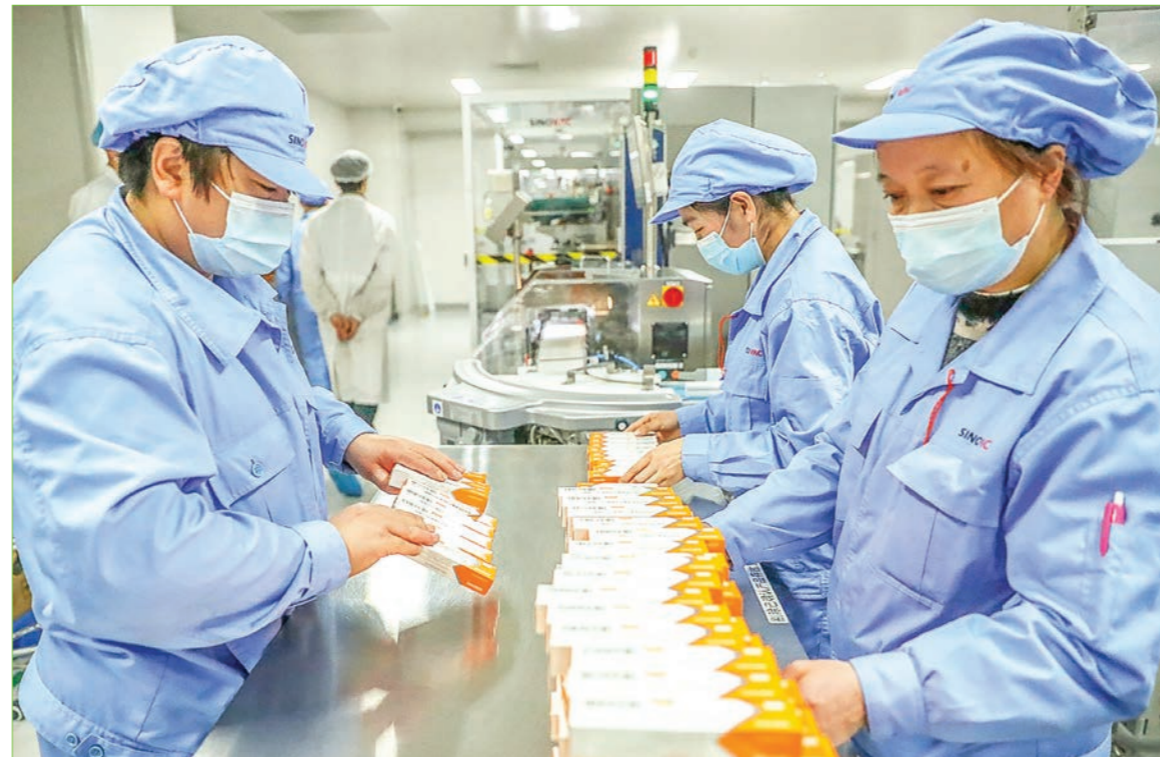
Workers arrange vaccine packages at a Sinovac COVID-19 vaccine workshop in Beijing on 18 January, 2021.

The WHO said the emergency use listing (EUL) gives countries, funders, procuring agencies and communities assurance that the vaccine has met international standards.