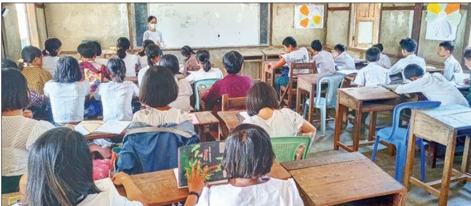
Ngaphe Town, Magway Region.