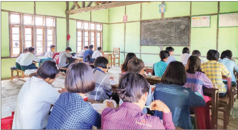
Pakokku, Magway Region.