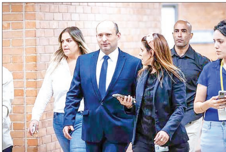
The leader of the Israeli Yemina party, Naftali Bennett, has agreed to join the anti-Netanyahu bloc.

Lapid, leader of the Yesh Atid party, was tasked with form-