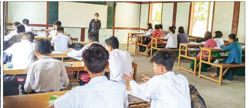
Wundwin Town, Mandalay Region.