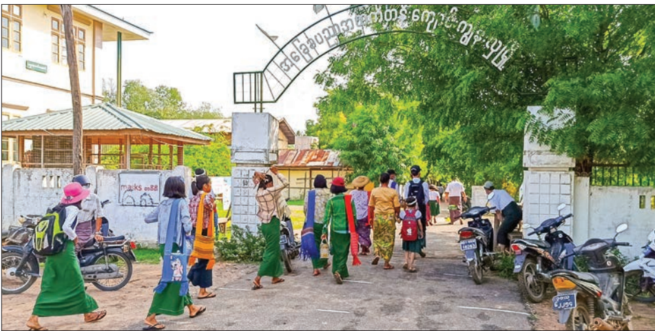
Kyunhla Town, Sagaing Region.