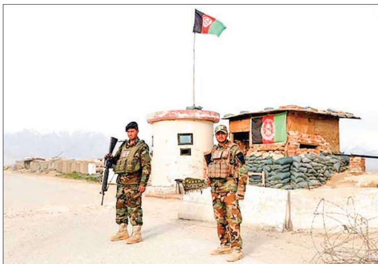
The US military will hand over its main Bagram Air Base to Afghan forces in about 20 days, an official said Tuesday.

An Afghan security official said the handover was expected