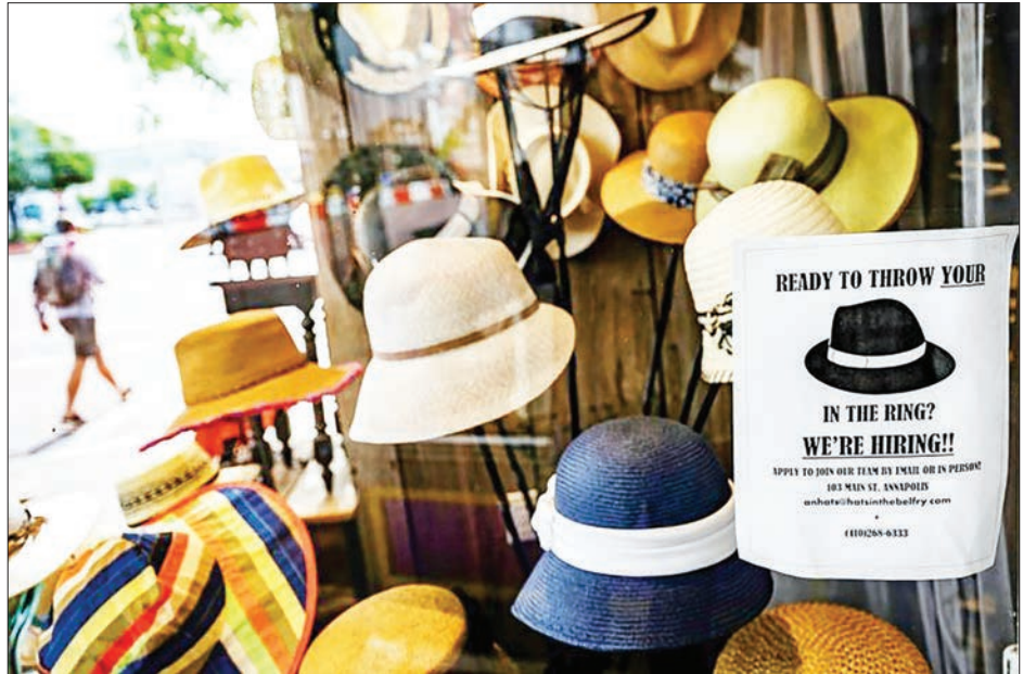
The Paycheck Protection Programme was part of the US government's response to the massive downturn caused by the Covid-19 pandemic in 2020.