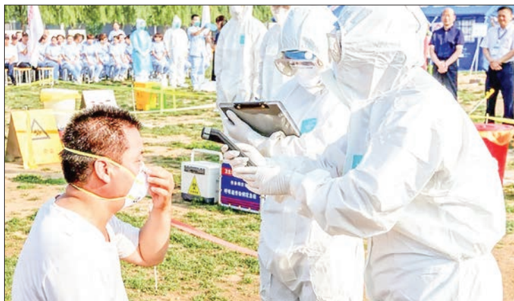
China's National Health Commission (NHC) confirmed Tuesday the first human case of a rare strain of bird flu known as H10N3. A 41-year-old man was diagnosed with H10N3 in China's eastern province of Jiangsu.

THE world's first case of a human infected with H10N3 avian influenza was detected in China,