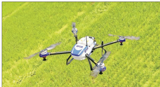
A drone developed by Japanese IT firm Optim Corp. flies over rice paddies.

Farmers are also embracing new digital technologies to increase crop output and income without additional human labor. — Kyodo News ■