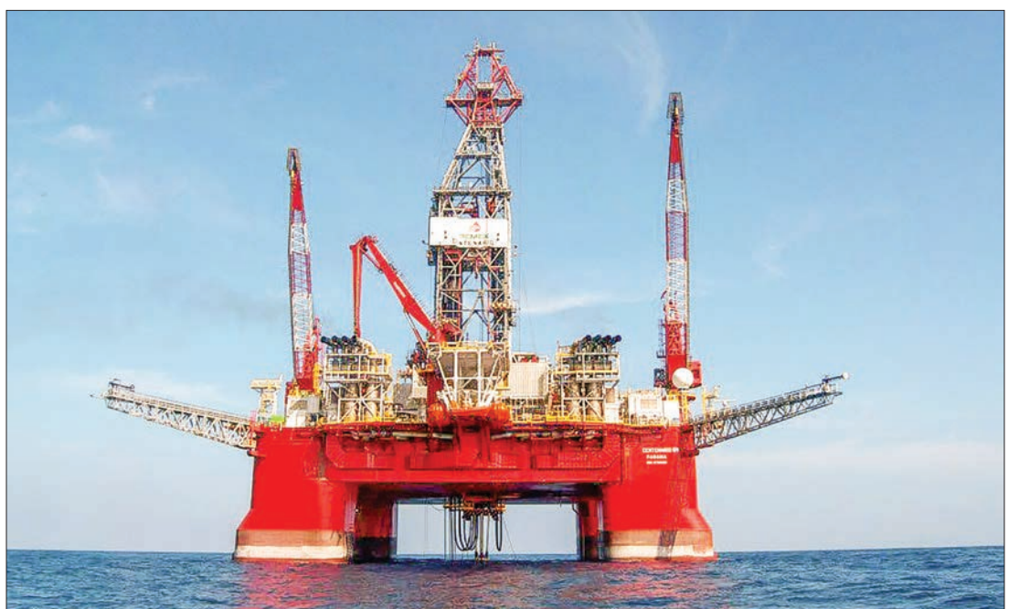
Handout picture released by Greenpeace on November 22, 2010 showing the Centenario deepwater oil drilling in the Gulf of Mexico, where Greenpeace activists arrived to display banners against the drilling of oil. Representatives from 194 countries are to meet in the Mexican resort city of Cancun from November 29 to December 10, 2010 in a UN climate summit.

BP plans to reduce oil and gas production by 40 per cent within the next decade, Looney said. — AFP ■