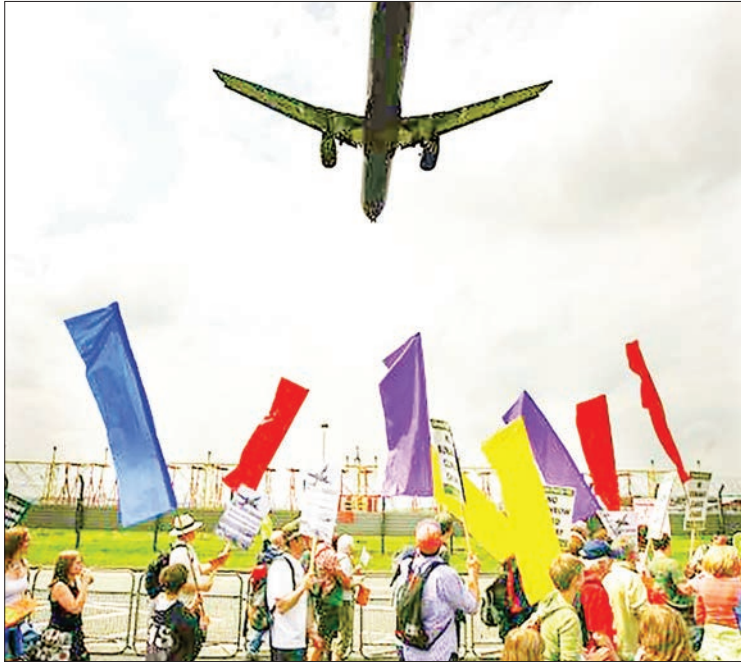
For the British authorities, leaving the European carbon trading market makes it easier to monitor companies and their activities.

BRITAIN recently launched its own carbon trading market, more than five months after Brexit, as the government targets lower emissions before this year's vital UN climate change summit.