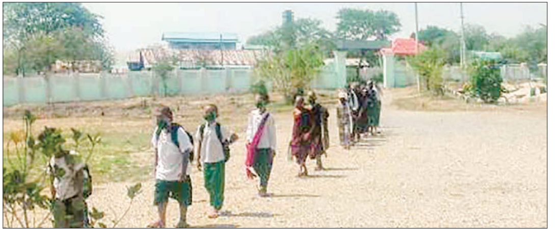
Myinmu Town, Sagaing.