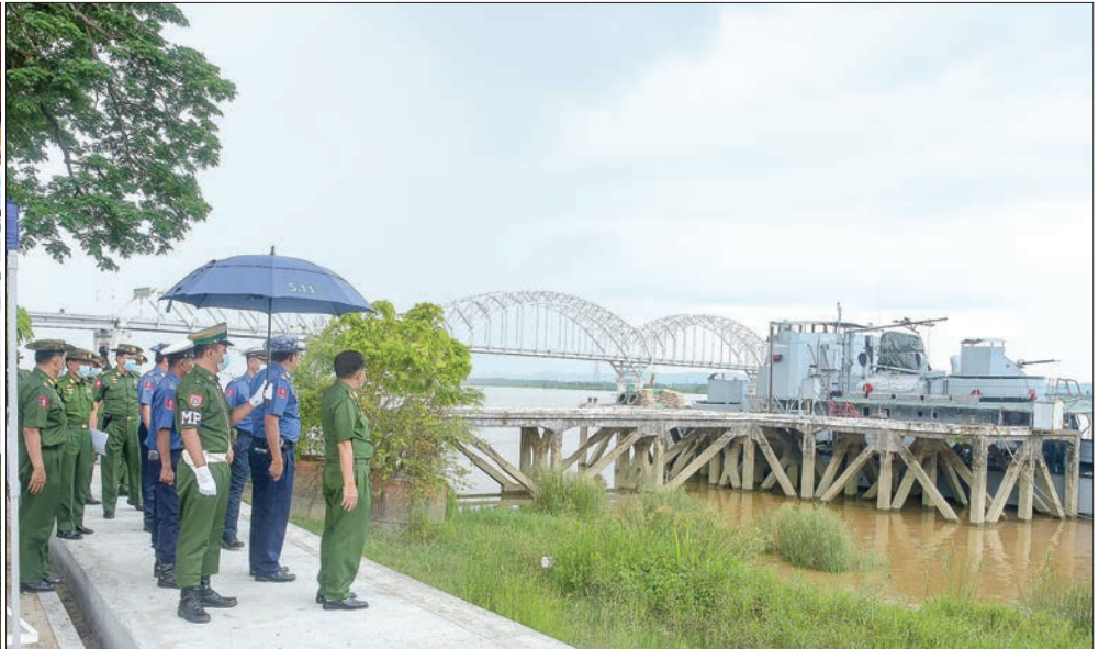
At the navy base.