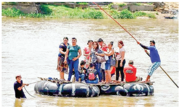
For Honduran migrants, leaving home is an uphill battle.

THE US Secretary of State on Tuesday called on Central American countries to defend democracy and fight corrup-