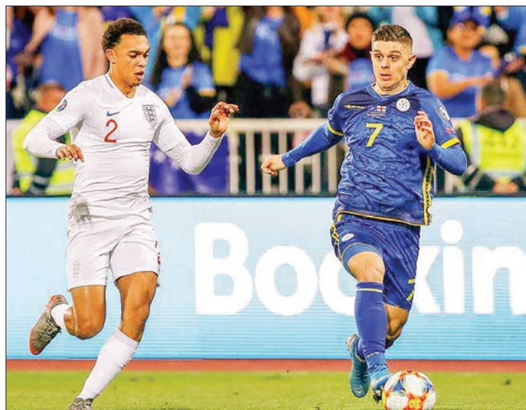
Liverpool defender Trent Alexander-Arnold was named in the England squad for Euro 2020 on Tuesday, while in-form Jesse Lingard missed out on a place in Gareth Southgate's 26-man group.

"The most difficult thing is to not be able to take players who've been with us in previous matches and who are such good professionals." Alexander-Arnold faces intense competition, with Kyle Walker, Kieran Trippier and Reece James among four right-backs included in the squad. — AFP ■