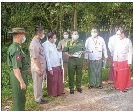
At the sports park.