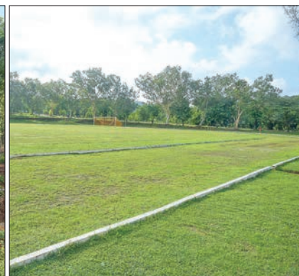
At the military station playground.