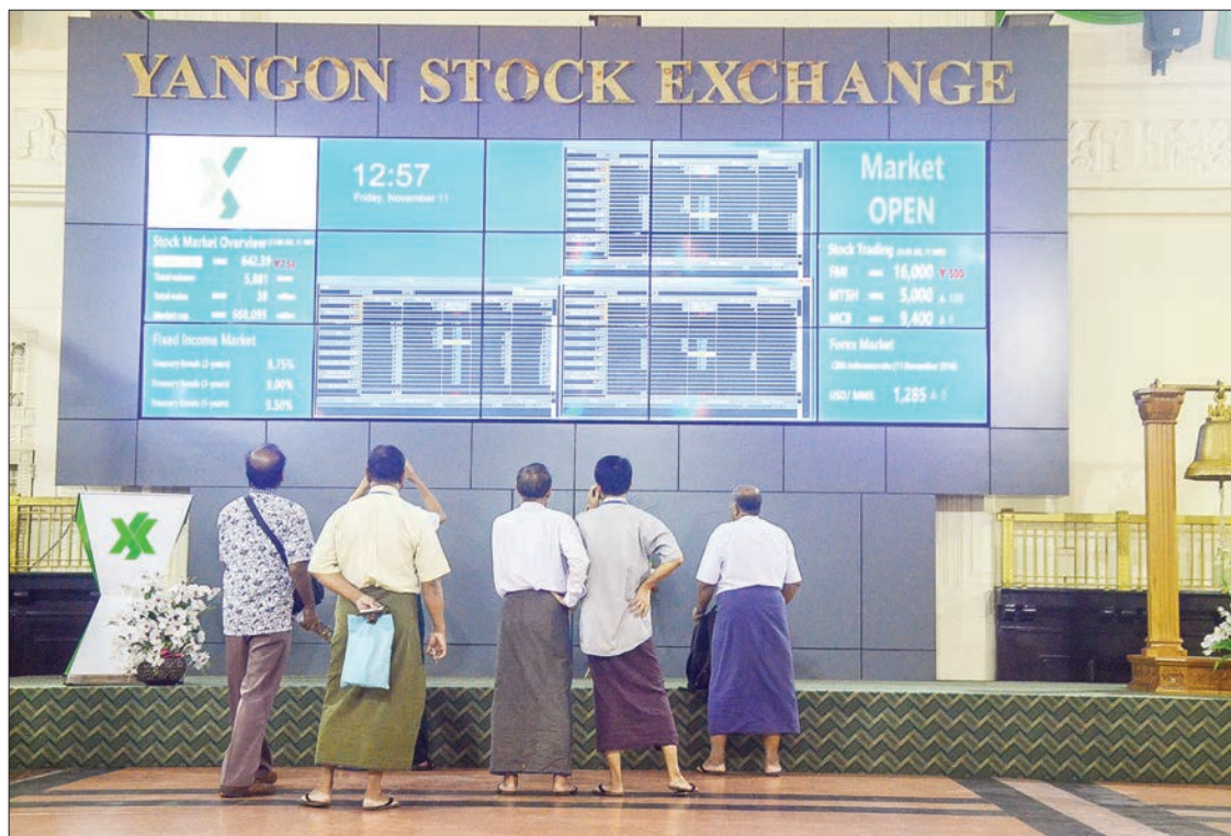
The Yangon bourse is trading the shares of seven companies, including Amata, to date.

YSX has postponed the scheduled date of listing of the