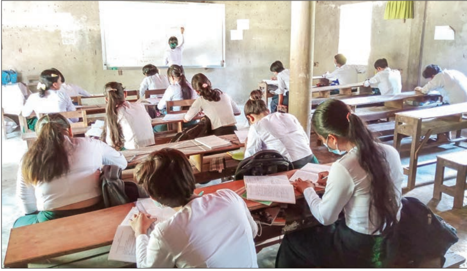
Dawei Town, Taninthayi Region.