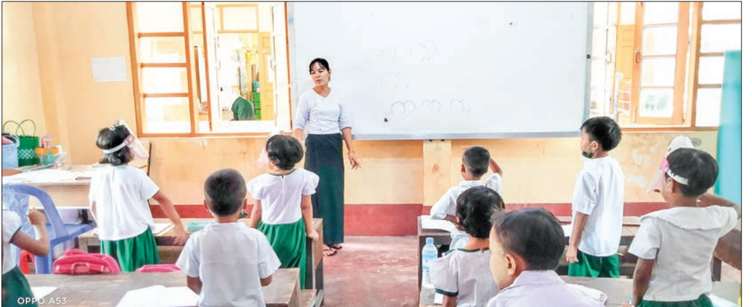
Kyaikmaraw Town, Mon State.