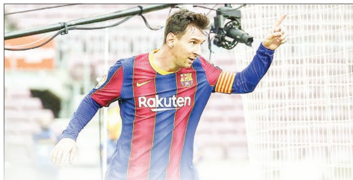
Barcelona president Joan Laporta repeated on Tuesday that negotiations with Lionel Messi "are going well", less than a month before the Argentine star's club contract expires.

The team will then spend two days in Slovakia before moving to St Petersburg. — AFP ■