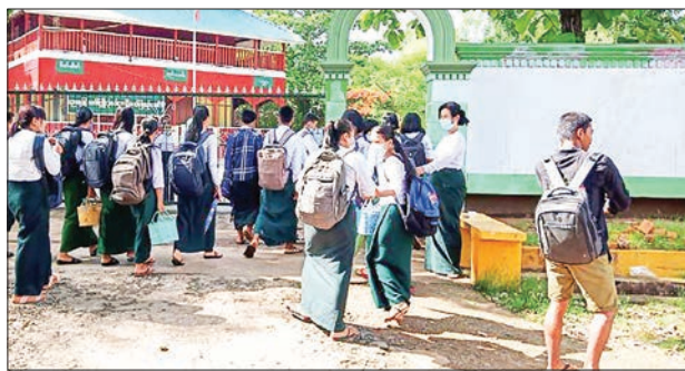
Kyaikto Township, Mon State.