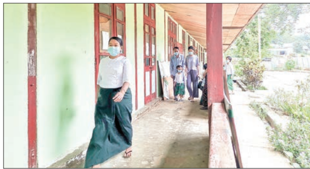
Kokang Self-Administered Zone, Laukkai Township, Shan State (North).