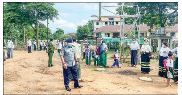
Kengtung Township, Shan State (East).