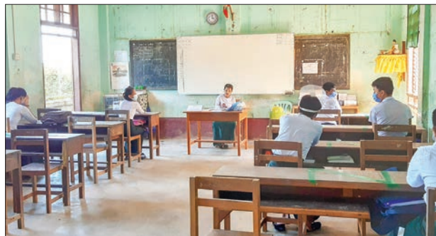
Kawthoung Township, Taninthayi Region.