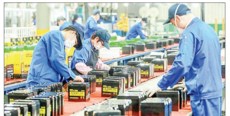
Factory activity in China nudged down slightly in May on slower demand and higher raw material prices, while the services industry boomed over the Labour Day break, official data showed on Monday.

Capital Economics said in a recent note that there are “few signs” of easing, with freight rates still going up. Meanwhile, the purchasing prices of major raw materials remains high, said the NBS. On top of that, a fresh wave of COVID-19 in Asian