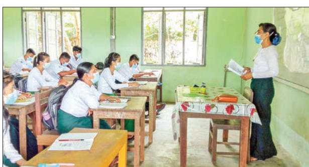
Chaungzon Township, Mawlamyine District, Mon State.