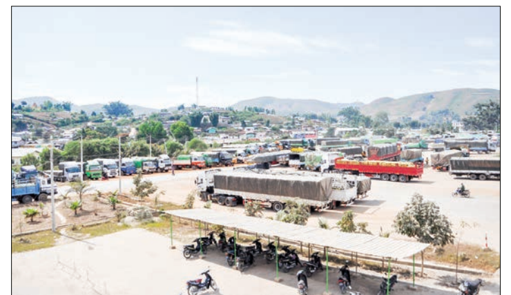
The trucks stuck in Kyalgaung, China, are allowed to depart between 1 and 3 June via Man Wein post.

During the first wave of the COVID-19, the driver-substitution system was practised in the border area, which helps lessen the impediment to the trade, yet the current restriction exacerbates border trade, the Muse Rice Wholesale Centre stated. — NN/GNLM