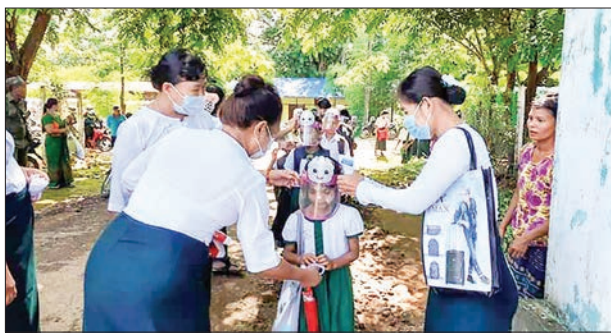
Kyaikdon Town, Kayin State.