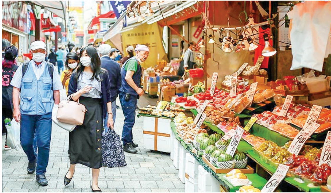
People wearing face masks walk in a street in Tokyo's Ueno area on May 27, 2020.

JAPANESE corporate profits in the January-March period logged their first year-on-year gain in eight quarters, driven by a strong recovery by the manufacturing sector from a coronavi-