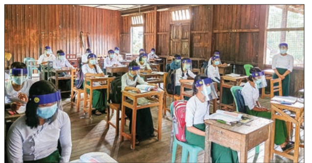
Kyaunggon Township, Ayeyawady Region.