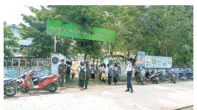
An Township, Kyaukpyu District, Rakhine State.