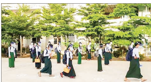
Myawady Township, Kayin State.