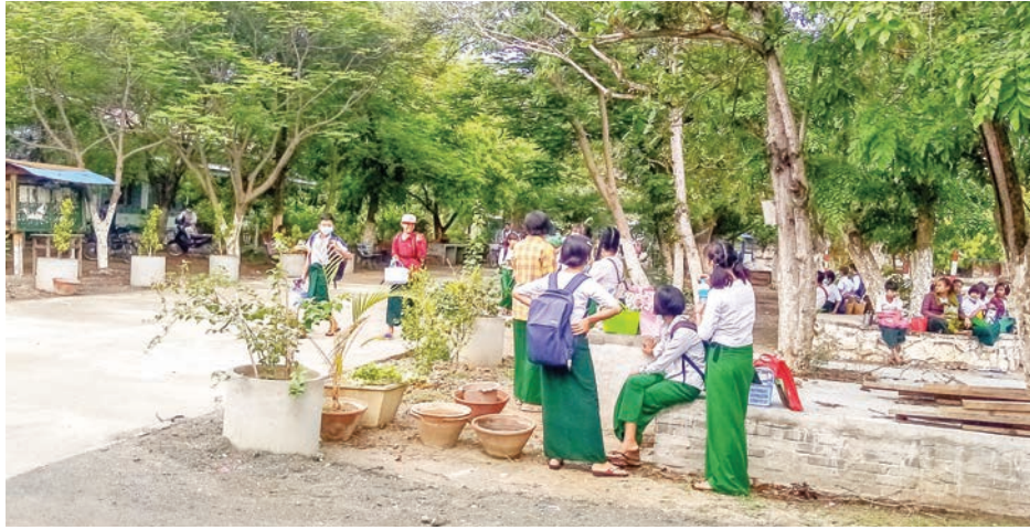
Singaing Township, Mandalay Region.