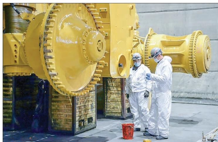
The Kumtor gold mine is the country's largest foreign investment project.

The giant Kumtor gold mine is the Central Asian country's largest foreign investment project and accounts for around a tenth of the economy. Kumtor was operated by Centerra Gold but Kyrgyz authorities suddenly seized the mine, prompting the Toronto Stock Exchange-listed company to turn to an interna-