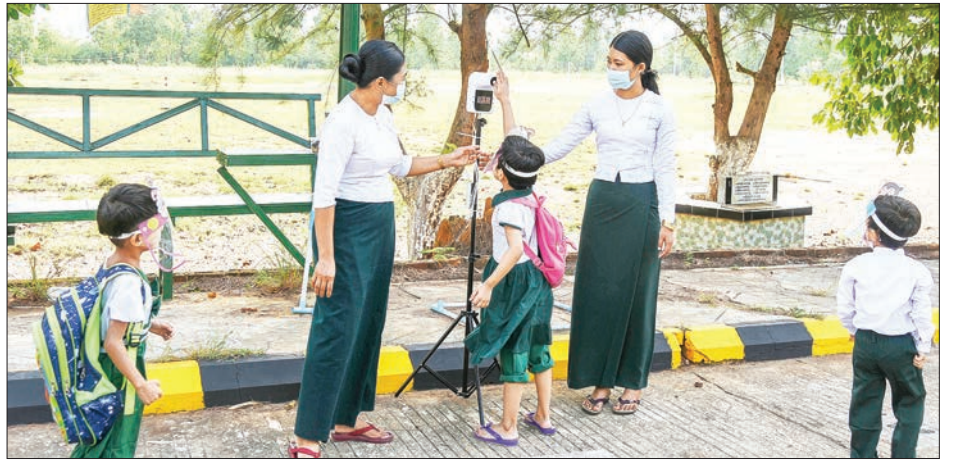
BEHS-6, Nay Pyi Taw.

The Government has also provided free textbooks and learning materials, and COVID-19 protective gears such as reusable masks and face shields to the students and the exemption of the enrol-