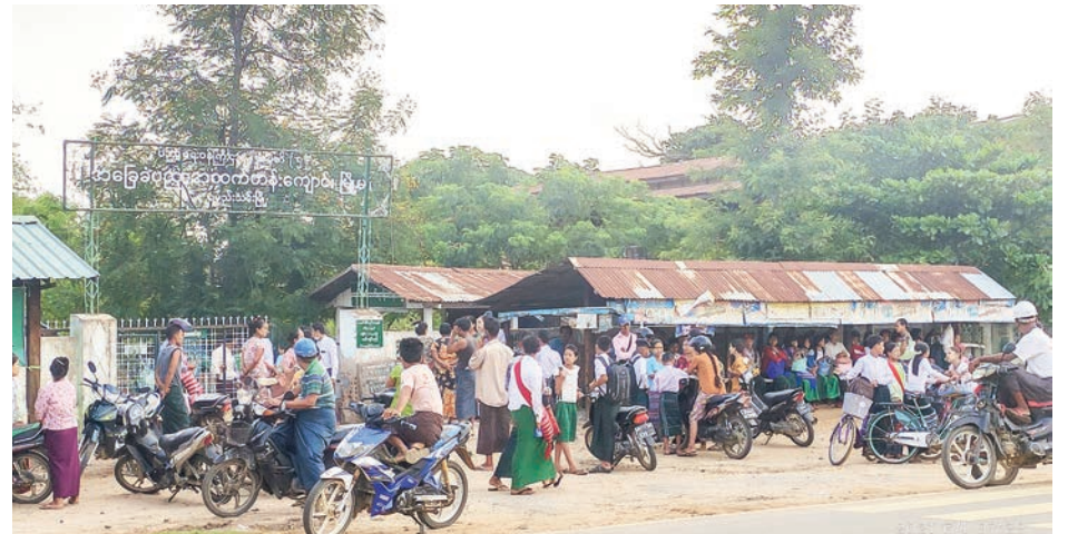
Yamethin Township, Mandalay Region.