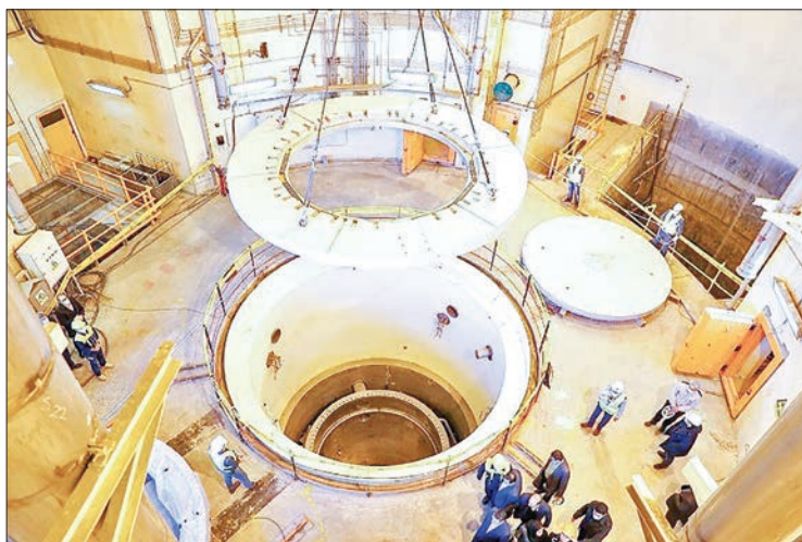
Talks are on in Vienna to revive the 2015 nuclear deal between Iran and world powers.

Iran and world powers are engaged in talks in Vienna to rescue the 2015 nuclear deal after former US president Donald Trump walked away from it in 2018 and reimposed crippling sanctions on Tehran. Trump's successor Joe Biden has signalled his willingness to revive the plan.