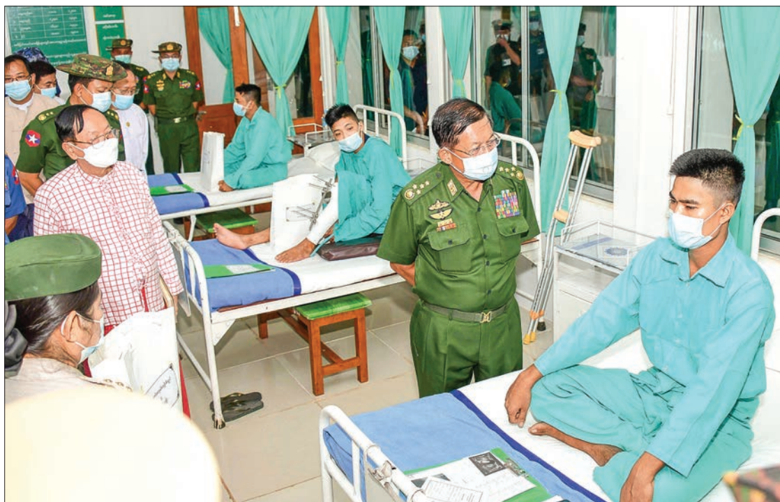
The Senior General comforts local patients at the military hospital in Mawlamyine yesterday.

about a solution to the problem of inaccurate voter lists. Those responsible did not seek any answers, and instead, they tried to come to power in a forcible way.