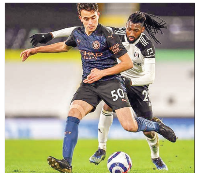
Manchester City’s Spain centre-back Eric Garcia will join Barcelona on a five-year deal next month, the Catalan club said on Tuesday.

“The player will sign a contract until the end of the 2025/26 season and his buy out clause is set at 400 million euros ($489.5 million),” the La Liga side said in a statement. Garcia follows Sergio Aguero after the Argentina forward left City for Barca on Monday. — AFP ■