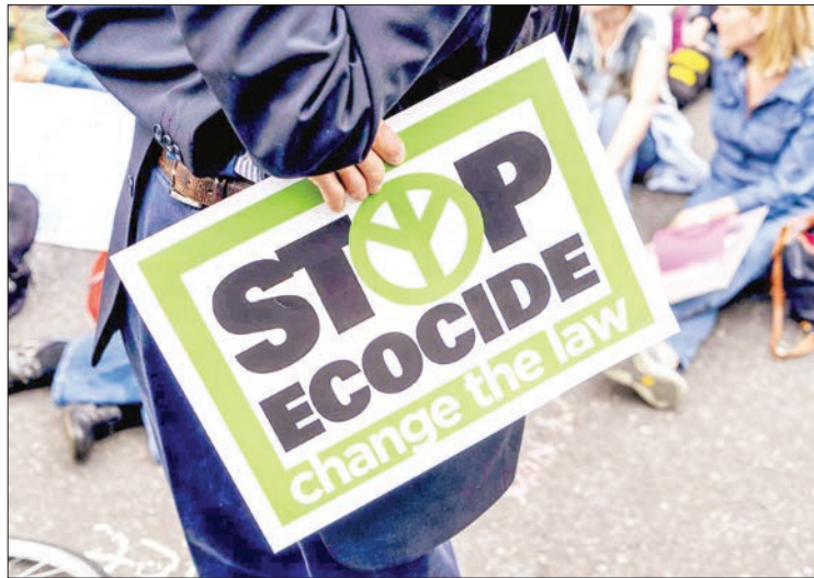
Talks on how to tackle climate change have long been hampered by disagreement between rich countries and rising giants. An Extinction Rebellion demonstrator protests outside of The Royal Courts of Justice in London in July 2019.

Moments earlier Vietnam called for developed countries