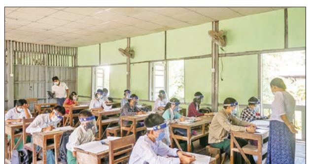
Pyay Township, Pyay District, Bago Region.