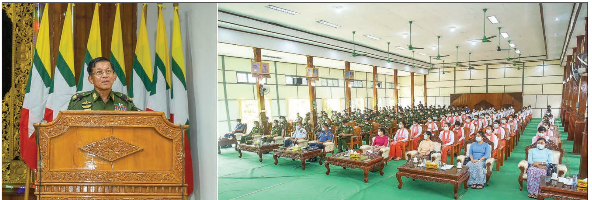
State Administration Council Chairman Senior General Min Aung Hlaing is making the speech at the meeting in Mawlamyine Station yesterday.

CHAIRMAN of the State Administration Council Commander-in-Chief of Defence Services Senior General Min Aung Hlaing delivered a speech in meeting with officers, other ranks and their families from Mawlamyine Station of South-East Command yesterday afternoon.