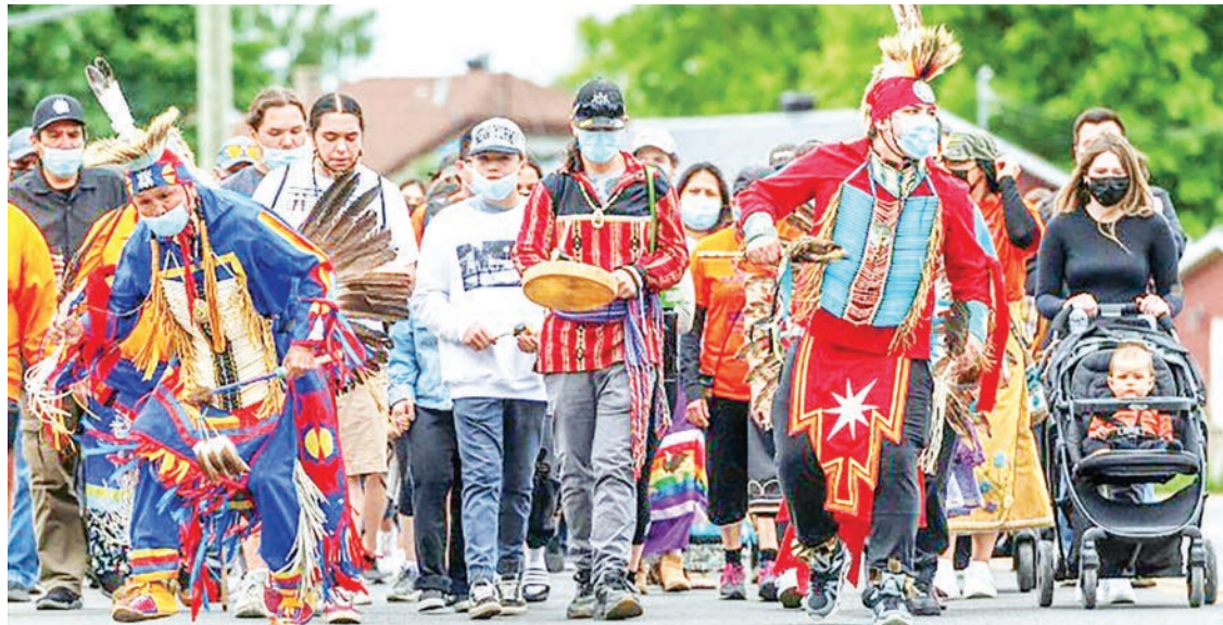
Members of the Mohawk community of Kahnawake, near Montreal, march through the town on Sunday to commemorate the news that a mass grave of 215 indigenous children were found at the Kamloops Residential School in British Columbia, Canada.

PRIME Minister Justin Trudeau on Monday expressed Canada's grief while pledging "concrete