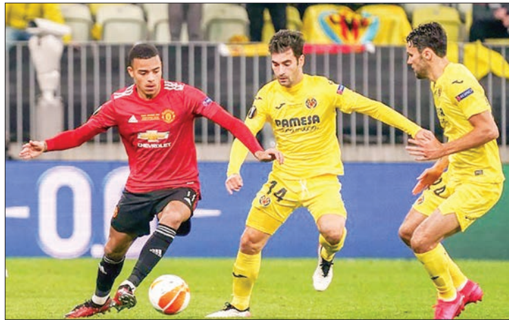
Mason Greenwood (L) started Manchester United’s Europa League final loss to Villarreal last week.

MANCHESTER United forward Mason Greenwood has pulled out of England’s Euro 2020 squad due to injury, the club announced on Tuesday.