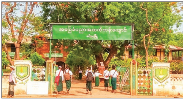
Minhla Township, Thayet District, Magway Region.