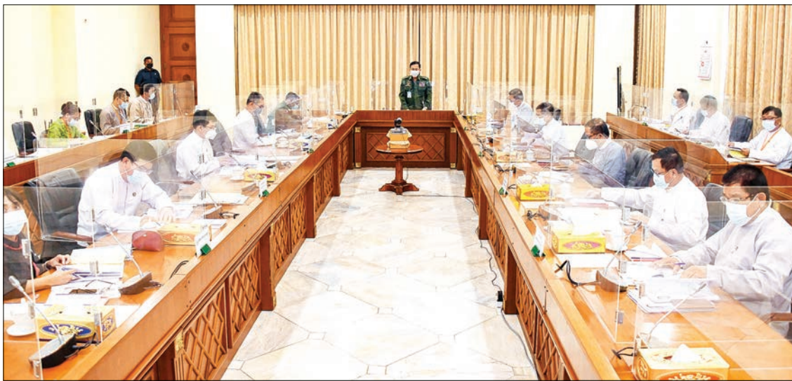
State administration Council Vice-Chairman Vice-Senior General Soe Win is addressing the Myanmar Special Economic Zone Central Committee meeting 1/2021 in Nay Pyi Taw yesterday.

Among the three SEZs, Thilawa SEZ only can be operated