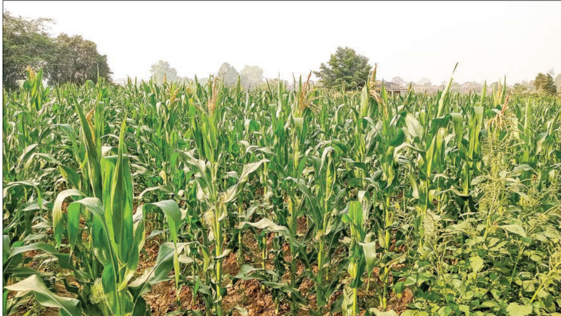
After two months of the cultivation period, the corn can be harvested in three months. The corn is sold for K100 per one in the retail market and K80 per one in the wholesale market.

ACCORDING to the corn growers, local farmers from Kyaukdone village in Minbu (Sagu) township are growing the corn. The cultivation is successful with the price remaining high.