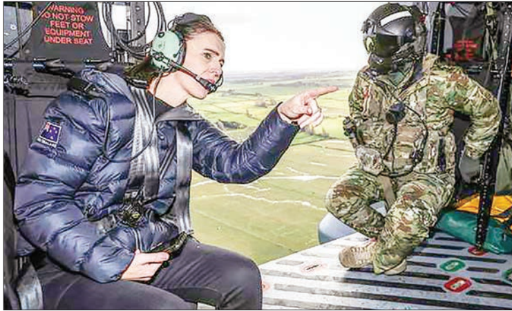
New Zealand's Prime Minister Jacinda Ardern inspects the flood damage from an army helicopter.

NEW ZEALAND Prime Minister Jacinda Ardern toured flood-hit areas of the country's South Island on Tuesday, expressing shock at the destruction left when three months' worth of rain fell in three days.