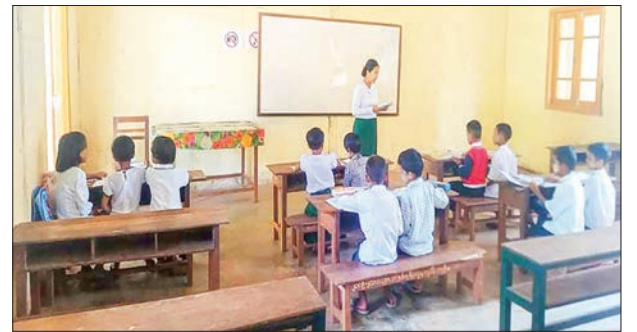
Mongnai Township, Langkho District, Shan State (South).