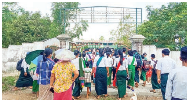
Myothit Township, Tamu District, Sagaing Region.