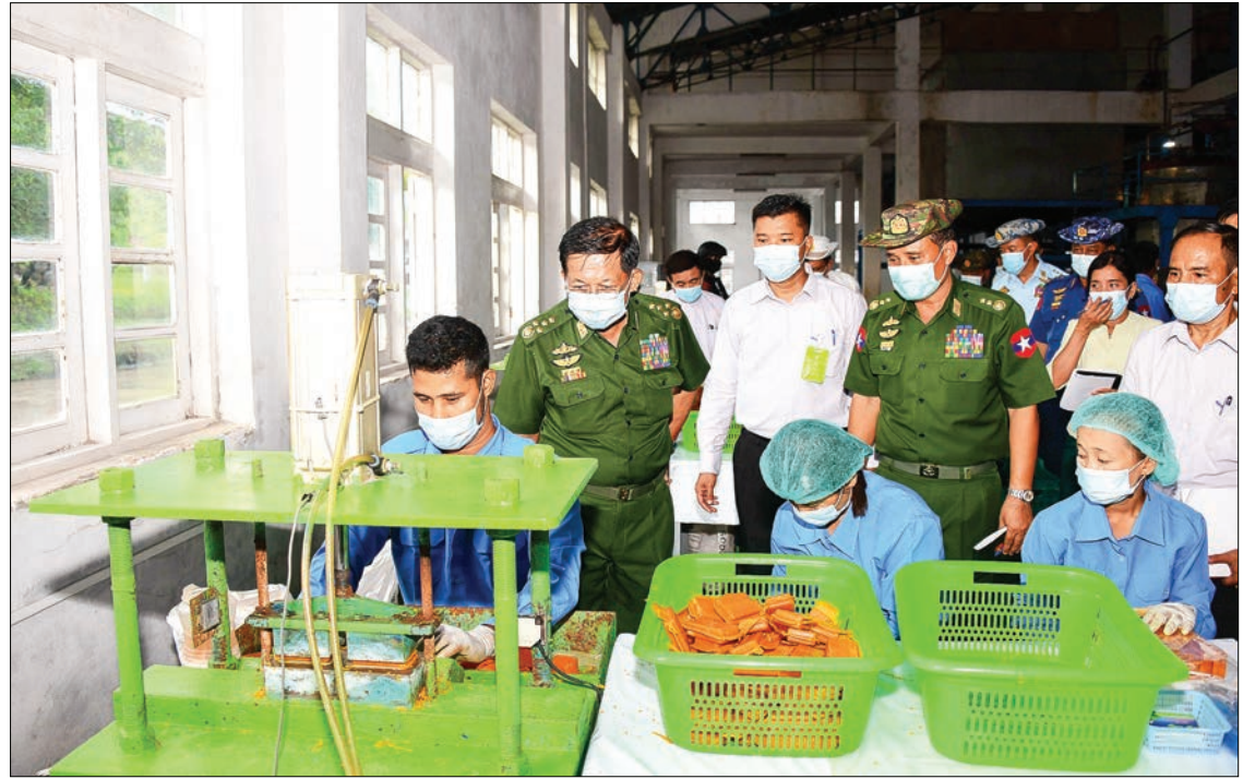
SAC Chairman Senior General Min Aung Hlaing is looking into the production process at the Padonmar Soap Factory in Paung yesterday.

The Padonmar soap factory is established to create job opportunities for war veterans and the local populace