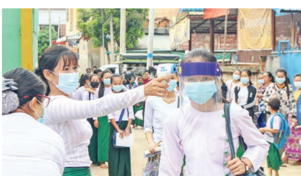
Mongyawng Township, Mongphyat District, Shan State (East).