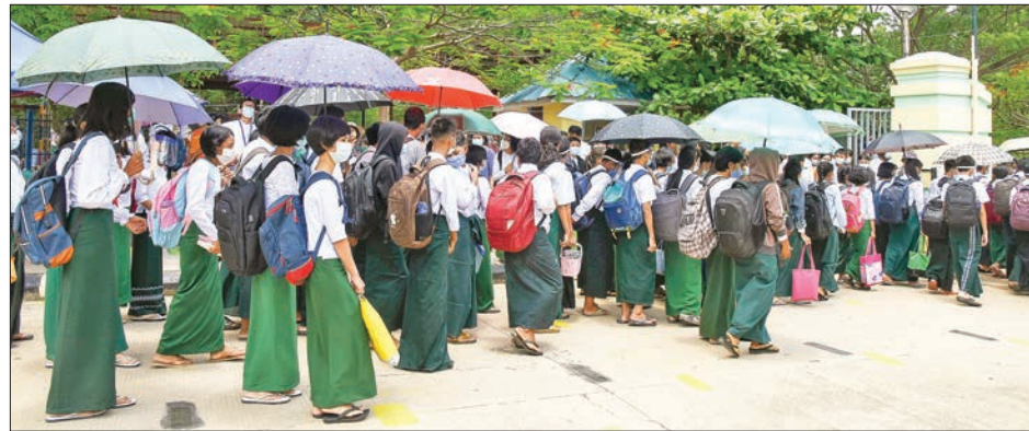
BEHS-5, Nay Pyi Taw.