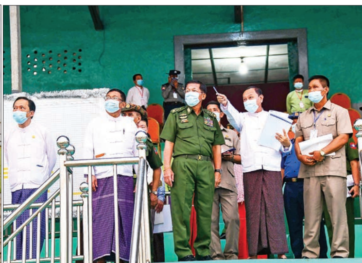
State Administration Council Chairman Senior General Min Aung Hlaing and party are inspecting the upgrade of Yamanya stadium in Mawlamyine yesterday.