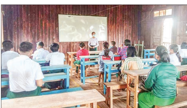
Waingmaw Township, Myitkyina District, Kachin State.