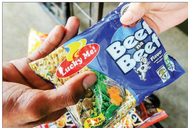
Monde Nissin exports instant noodles, biscuits and crackers to dozens of countries.

Monde Nissin exports instant noodles, biscuits and crackers to dozens of countries. It also owns the British meat-substitute maker Quorn. The money raised will be used to increase capacity