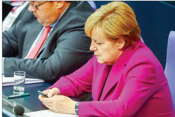
The US spied on Chancellor Angela Merkel and others, using Danish underwater cables.

text messages, telephone calls and internet traffic including searches, chats and messaging services -- including those of