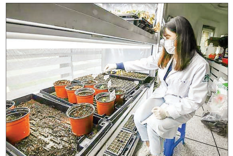
A researcher checks trial plantations at the wild plant seeds research division of the Baekdudaegan National Arboretum.

HIDDEN in a South Korean mountain tunnel designed to withstand a nuclear blast, the seeds of nearly 5,000 wild plant species are stored for safekeeping against climate change, natural disaster and war.