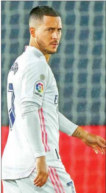
Eden Hazard is still having “some thigh problems” after missing much of Real Madrid’s season but “will be there when the Euros start”, he told a video press conference on Monday.

Hazard arrived at the national training centre at Tubize on Monday, at the same time as most of his team-mates and, as