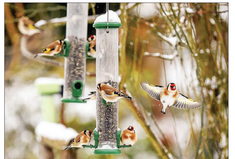
European goldfinches are among 43 common species in decline.

of numerous products, particularly autos. Around 20 Japanese companies will work with TSMC in the project worth 37 billion yen with the government paying just over half of that, an official from Tokyo’s Ministry of Economy, Trade and Industry told AFP on Tuesday. — AFP ■