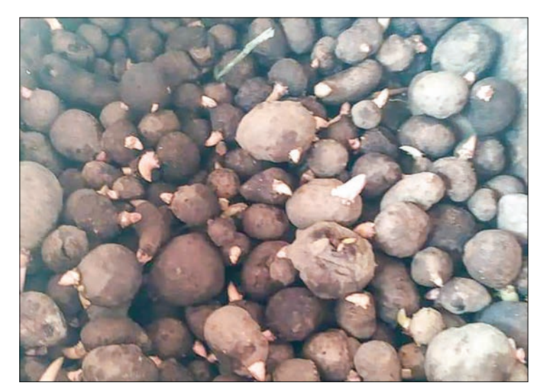
Residents of Bamauk Township of the Sagaing Region start cultivating elephant-foot yams for commercial purposes to generate foreign income from the yams.

RESIDENTS of Bamauk Township of the Sagaing Region start cultivating elephant-foot yams for commercial purposes to generate foreign income from the yams.