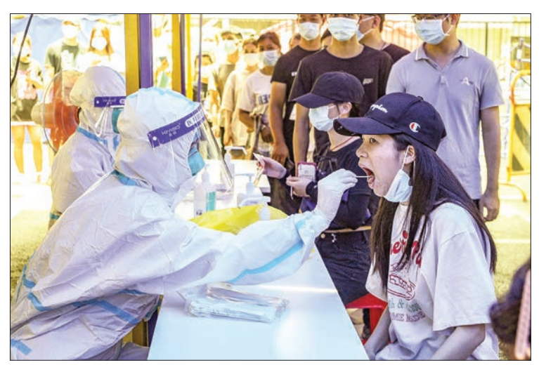
This photo taken on 30 May 2021 shows a woman (R) receiving a nucleic acid test for the Covid-19 coronavirus in Guangzhou in China's southern Guangdong province.

Guangzhou, an industrial hub of nearly 15 million people north of Hong Kong, reported 18 new local cases of the coronavirus on Monday, causing alarm in a country that has largely brought domestic transmission