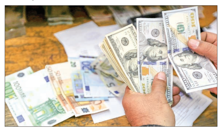
The CBM sold $6 million each on 12 and 13 May and $3 million each on 17, 18, 20 and 28 May, respectively.

THE Central Bank of Myanmar (CBM) reportedly sold US$24 million at an auction rate in May, the CBM data showed.