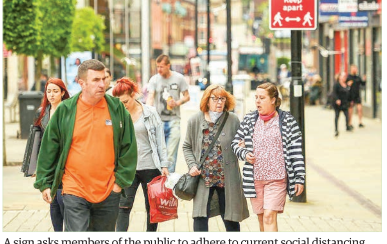
A sign asks members of the public to adhere to current social distancing guidelines as a Covid-19 variant of concern is affecting the community in Bolton, northwest England, on May 28, 2021.

"There are HVAC filtration systems, so that the virus can't escape through exhaust; any waste water that leaves the facility is treated with either chemicals or high temperatures to across the world, according to a