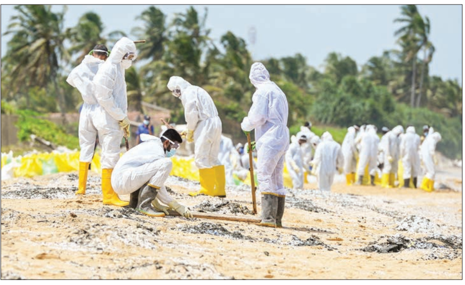
Members of Sri Lankan Navy remove debris washed ashore from the Singapore-registered container ship MV X-Press Pearl, which has been burning for the 12th consecutive day in the sea off Sri Lanka's Colombo Harbour, on a beach in Colombo on 31 May 2021.

"The 25-member crew have completed their quarantine and we are able to question them today," a police spokesman said. MEPA said the captain of the vessel had known about a nitric acid leak on May 11, long before the vessel entered Sri Lankan waters.