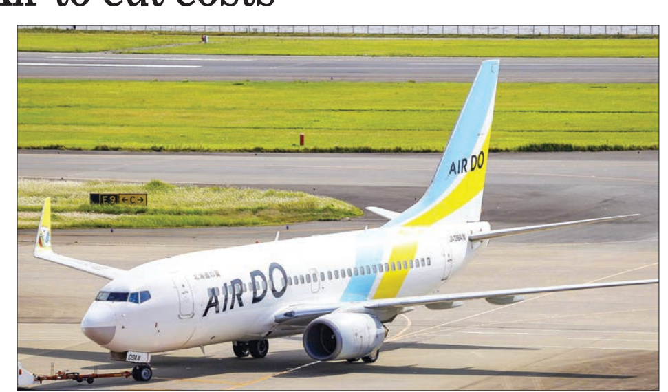
Photo taken on 31 May 2021, shows an Airdo Co. plane at Haneda airport in Tokyo. The medium-sized airline based in the northern Japan city of Sapporo will tie up with Solaseed Air Inc., another medium-sized airline based in Miyazaki, southwestern Japan, in aircraft maintenance and equipment procurement.

Airdo, headquartered in Sapporo in the country's northernmost major island of Hokkaido, and Solaseed