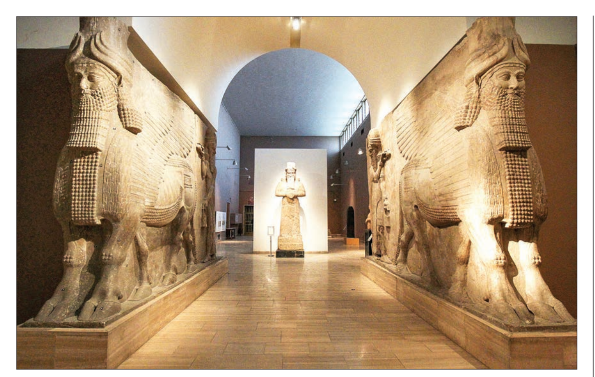
(FILES) This file photo taken on 4 April 2016, shows Assyrian artefacts originally from Mosul, displayed at Iraq's National Museum in the capital Baghdad, established by British archaeologist, writer, diplomat and spy Gertrude Bell.

12 WORLD 1 JUNE 2021 THE GLOBAL NEW LIGHT OF MYANMAR