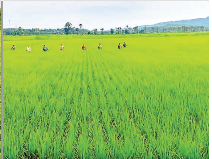
According to an official from the Township Agriculture Department, a total of 5,401 monsoon paddy and 12,023 acres of monsoon sesame will be grown in the coming rainy season.