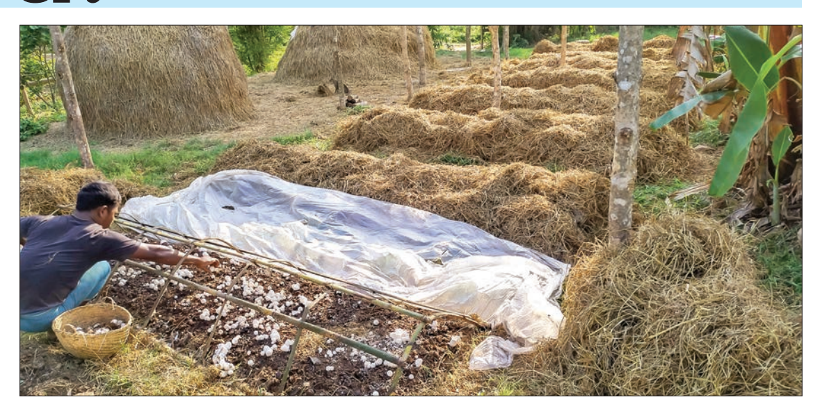
The people themselves grow mushrooms and sell them at K500 per bundle. The price of mushroom is between K4.500 and K5.000 per viss.

It can cost about K7,000 to grow mushrooms in an eightfoot and three-foot frame. The used materials in planting mushrooms can be recycled as fertilizers for other crops. The tropical and humid climate is the best one for growing mushrooms. — Ko Htun (Phaungpyin)/GNLM