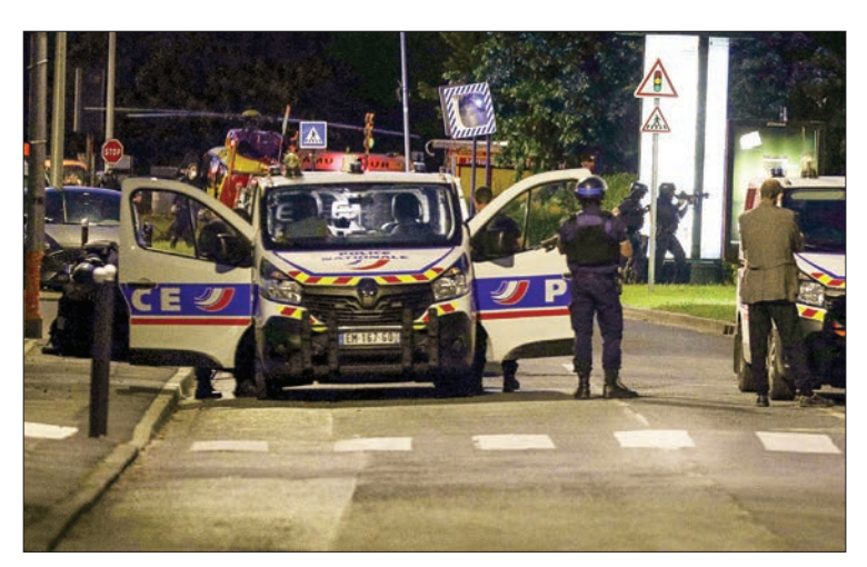
Members of the Raid, special unit of the French police get ready to intervene in Emerainville, outskirts Paris, on 30 May, 2021, during operations to arrest a man who holed up in his home in Emerainville as he is suspected of killing a woman and wounding his neighbour.