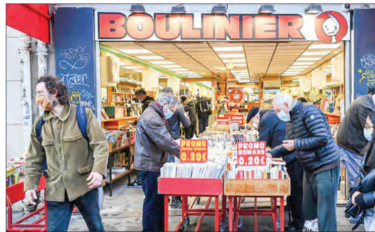
Consumer spending declined 8.3% in April from March.

target in any way," Finance Minister Bruno Le Maire told reporters, calling the first quarter slowdown "an automatic revision" linked to 2020 growth that he said had held up bet-