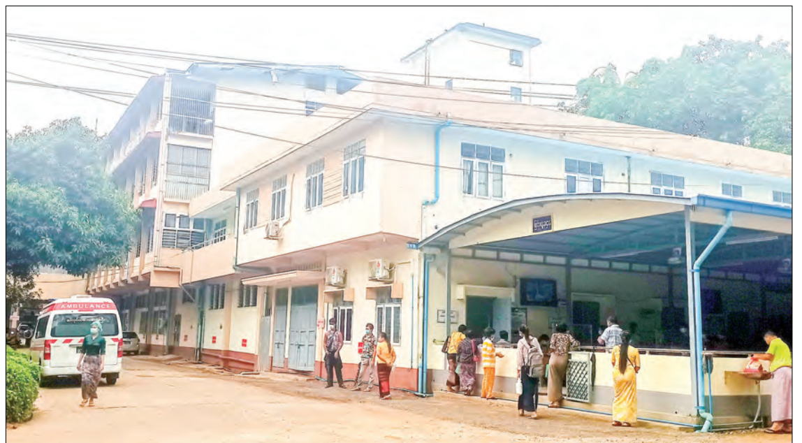
Worker's Hospital (Yangon).

THE Yangon Workers' Hospital, under the Ministry of Labour, Immigration and Population, has planned to reaccept inpatients except for major surgery cases starting from 24 May, according to an official from the hospital.