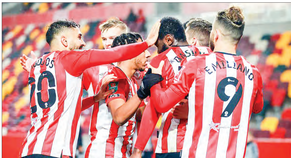
Brentford and Swansea will slug it out for promotion to the Premier League on Saturday as they meet in a Championship play-off final worth an estimated £180 million ($255 million).

In contrast, Swansea are hoping to return to the Premier League after a three-year absence. It is Brentford's story that has captured the imagination of neutrals. After spending 59 out of 60 seasons in the third or fourth tiers before reaching the