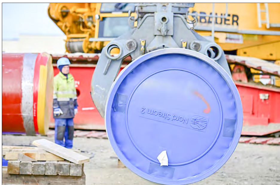
The Nord Stream 2 pipeline between Russia and Germany, a key part of Moscow's export strategy for state energy giant Gazprom, aims to deliver Russian gas to Europe via the Baltic Sea.

The global energy sector was hit hard by the onset of the coronavirus pandemic last year, with demand hammered as many countries shut down swathes of their economies in a bid to slow