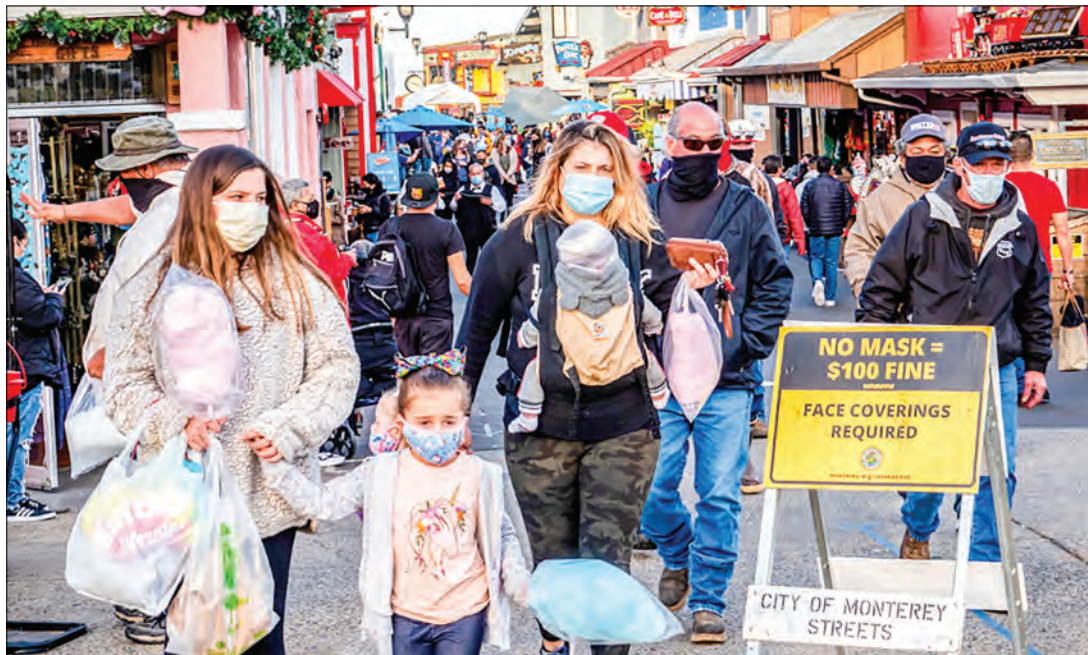
The combined gross domestic product of the 21 member economies of the Asia-Pacific Economic Cooperation is expected to grow 6.3 percent this year.

THE combined gross domestic product of the 21 member economies of the Asia-Pacific Economic Cooperation is expected to grow 6.3 per cent this year, turning around from a 1.9 per cent decline in 2020 as they gradually reopen while COVID-19 vaccines fan optimism, an APEC report showed.