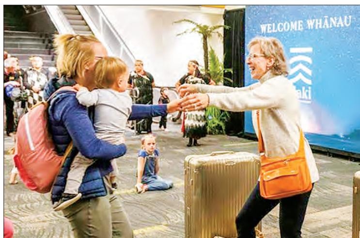
The travel bubble between Australia and New Zealand allowed families separated by Covid-enforced border closures to reunite.

QUARANTINE-FREE travel bubbles were hailed as tourism's