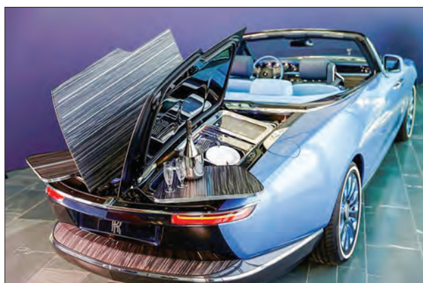
With a rear resembling a yacht deck and opening up for alfresco dining, Rolls-Royce's Boat Tail's opulent design features also hand-crafted aluminium panels and Swiss timepieces.

Rolls-Royce Motor Cars, which along with the wider luxury goods sector is recovering strongly from pandemic fallout, has launched a "Boat Tail" automobile -- tailor-made