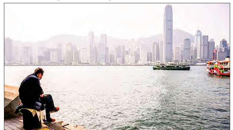
Hong Kong property developers are offering a chance to win an apartment in a lottery to boost the city's lagging vaccine rollout.

The announcement came three days after the city's Chief Executive Carrie Lam rejected calls for the government to offer cash handouts to encourage inoculations. She suggested local businesses provide the incentives. "To offer cash or something physical to encourage vaccination shouldn't be done by the government," she said. — AFP ■