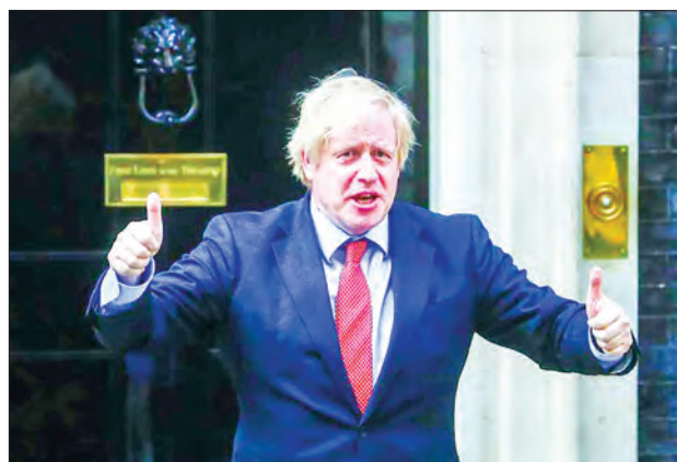
Publishing an annual report on ministerial interests, the UK government’s newly appointed adviser on ministerial standards found that Johnson “knew nothing” about how the designer makeover of his private quarters was funded, noting the works had begun as he was critically ill with Covid-19 in early April 2020.

Geidt found that Johnson “knew nothing” about how the designer makeover of his private quarters was funded, noting the works had begun as he was critically ill with Covid-19 in early April 2020. The prime minister should have shown more curiosity later but believed that the putative charitable trust would take care of the invoices, Geidt said. Officials failed to brief Johnson that the proposed trust was proving hard to get off