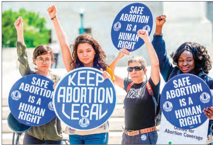
Abortion rights activists rally in front of the Supreme Court in Washington, D.C., on May 21, 2019.

The amendment limits the use of federal funds to finance abortions through Medicaid in cases of rape, incest or when the mother's life is in danger. Medicaid is public health medical insurance intended for