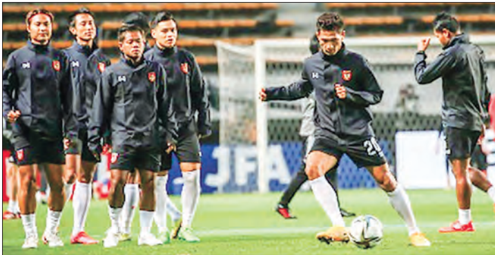
Myanmar national football squad is training in Japan ahead of the remaining World Cup Qualifiers to be played in Osaka, Japan.

The second round qualifiers are being held in eight groups. A total of 12 teams will advance to the third round of the 2022 World Cup Qualifiers and 2023 Asian Cup qualification. The Myanmar national team has already played against the Japan team in Chiba, so the other two matches will be played in Osaka and will leave for Osaka in the coming days.