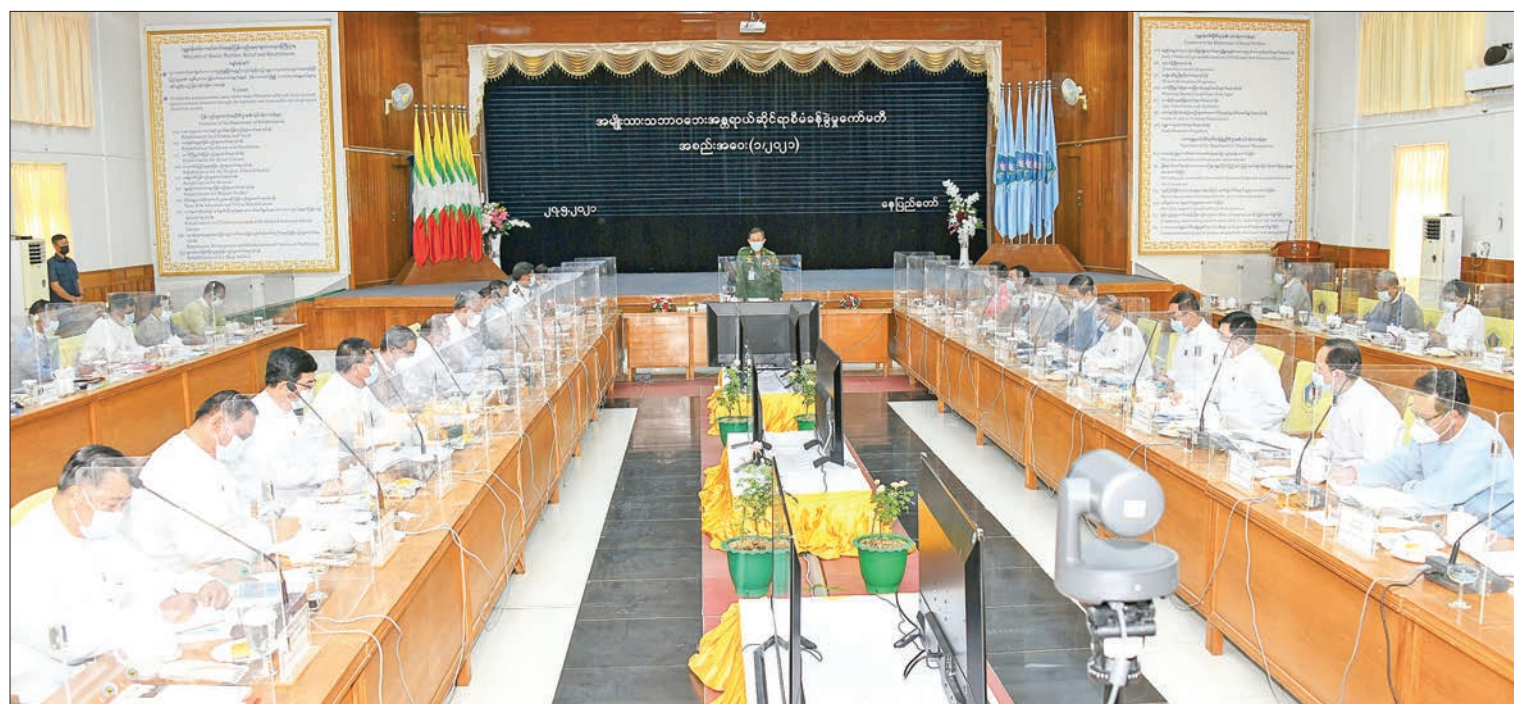
State Administration Council Vice-Chairman Vice-Senior General Soe Win presides over the National Natural Disaster Management Committee meeting 1/2021 in Nay Pyi Taw yesterday.

In observing outbreaks of natural disasters, the report of the Centre for Research on the Epidemiology of Disasters (CRED) stated that four categories were set as a criterion of the disaster which killed more than