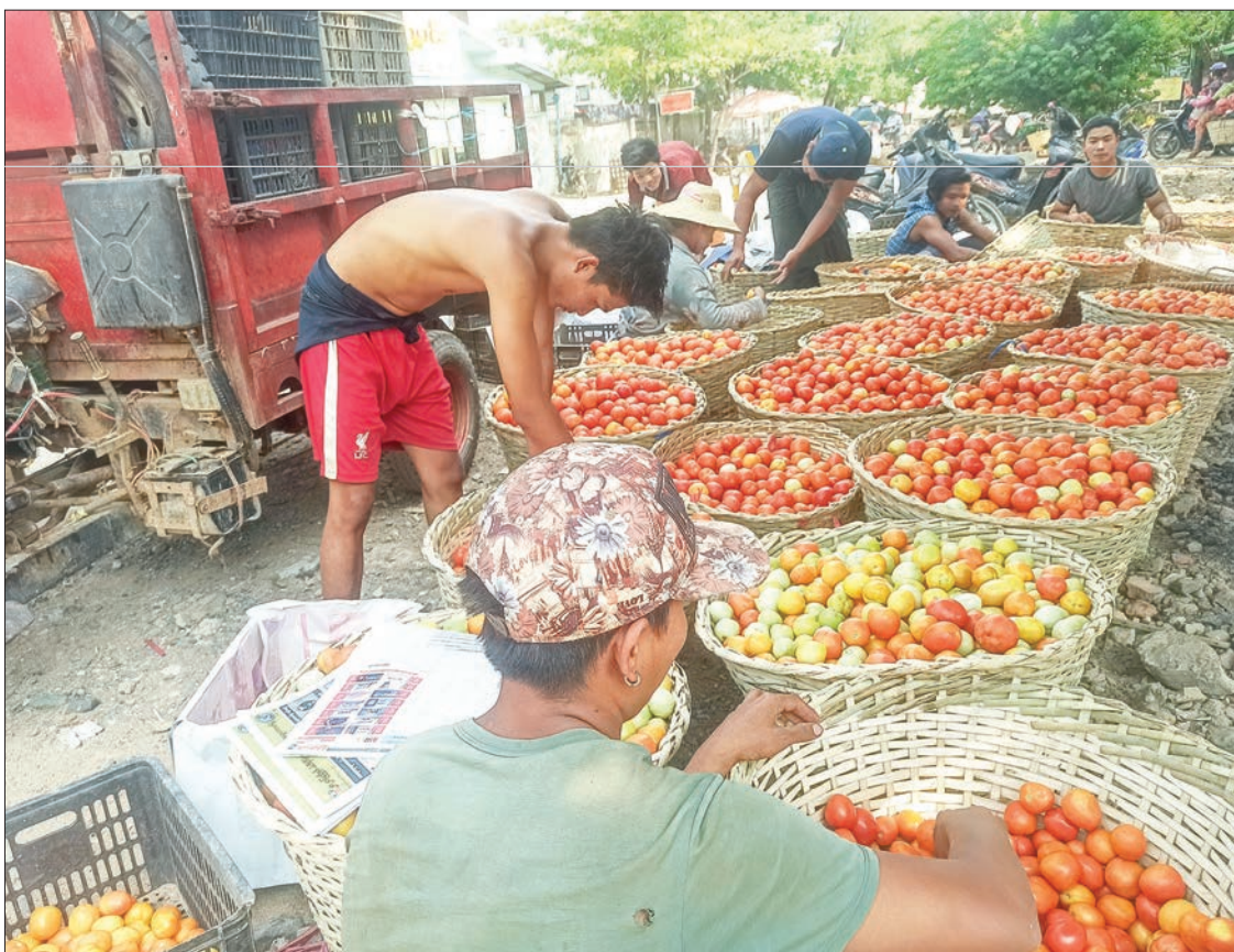
Tomato growers in Kawlin and Wuntho townships are making better profits this year than last year.