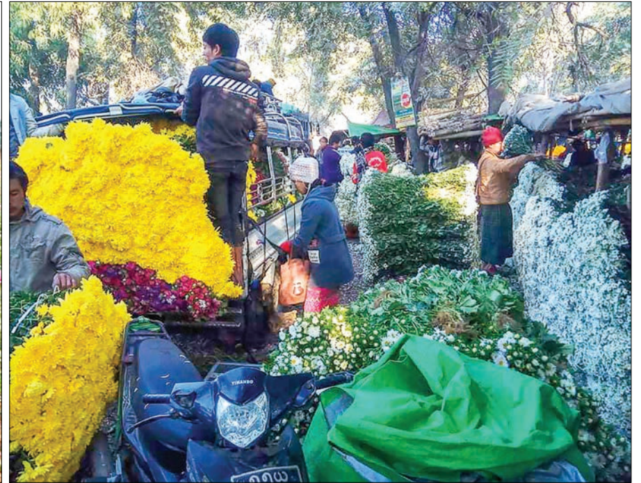
One bouquet of the flower was between K3,000 and K3,500 last year. It is only K2,000 this year, according to a flower grower from Kyaukmeew village, Patheingyi Township.

ACCORDING to the Mandalay Flower Market, with more supply than demand of Gandhama flowers grown in Patheingyi Township, PyinOoLwin and Nawng-