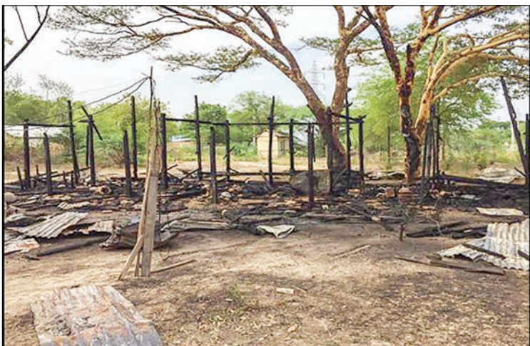
Ravages in the aftermath of arson attacks.

terrorist groups, who wish to destroy national interests, instigate teachers and education staff to join CDM and threaten, with death, those who do not do so. Innocent young students are forced to drop out of school.