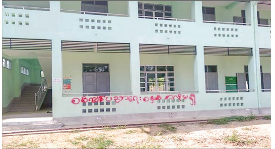
Texts against the Government at the school building.