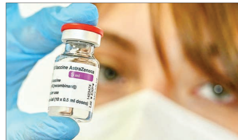
In this file photo taken on March 24, 2021 a medical worker holds a vial of the AstraZeneca vaccine against Covid-19 at a vaccination hub outside Rome's Termini railway station.