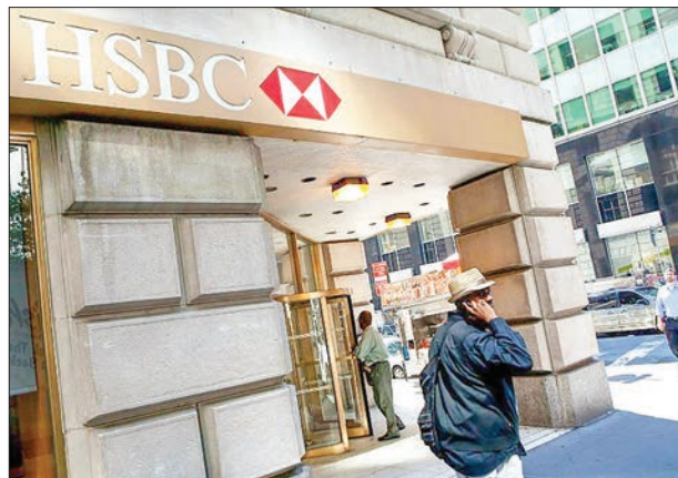
HSBC had already announced earlier this year that it intended to restructure its US retail and small business operations.

HSBC announced Wednesday that it is exiting the retail and small business banking market in the United States, in line with its strategy to refocus on corporate and investment banking in Asia.