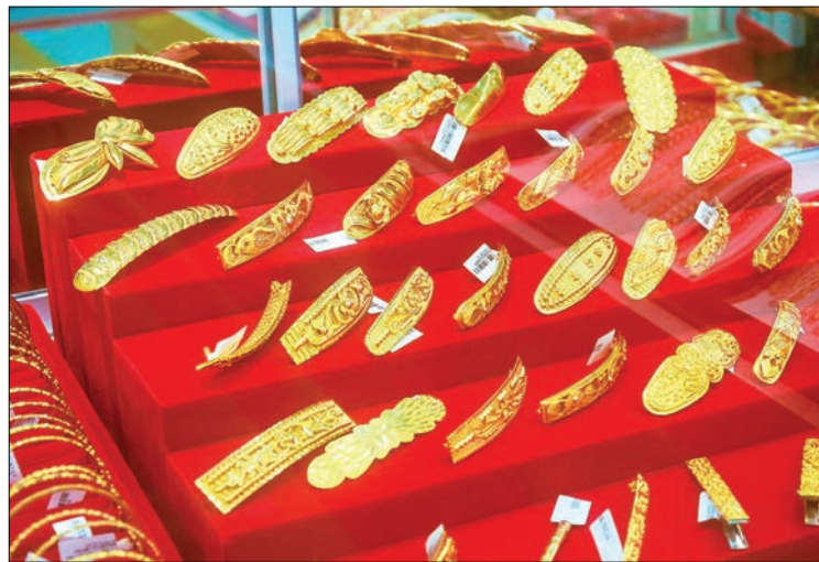
At present, the association has closed the gold trading to be able to steady the gold price and urged the members to run a cash-only for the gold transaction.

In January 2021, domestic gold fetched the highest price of K1,336,000 per tical on 6 January. It reached the