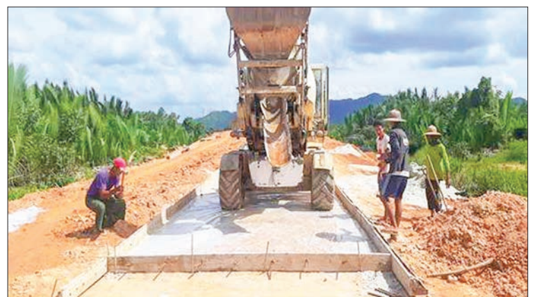
Township while 11 roads and 26 bridges are under construction in Kyunsu Township, 14 roads and 13 bridges in Pulaw Township and 22 roads and eight bridges in Taninthayi Township.