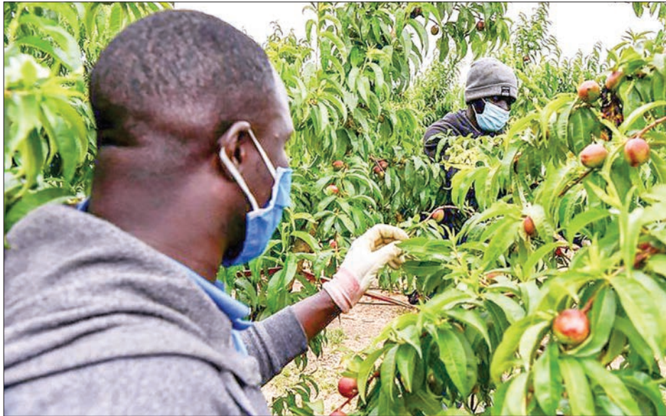
Under Spain's vaccination programme, farm workers have been given priority.

OUTSIDE an old blue and white school in northeastern Spain dozens of farm workers wait their turn to be vaccinated against the coronavirus by a team of nurses.