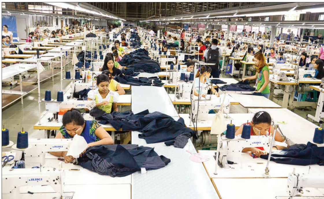
The Swedish fashion retailer H&M is gradually placing orders from Myanmar again after it paused in March. Then, more international fashion retailers such as Primark and Bestseller starts to resume new orders.

At present, Myanmar's garment export drastically dropped on the slump in de-