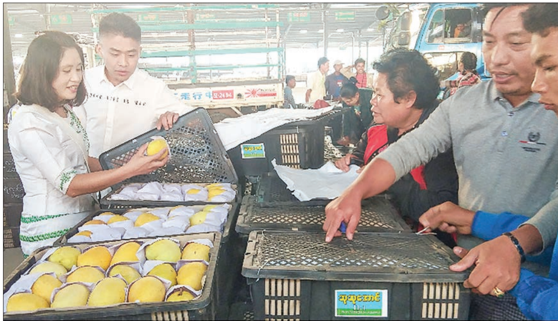
Eight per cent of Myanmar’s Seintalone goes to China. It fetches 100 Yuan per 16 kg box.

“China shut down many border posts. Only Kyinsankyawt post is available for cross-border trade, causing delays and long queue. It takes 4 to 5 days for a truck to enter the checkpoint. Heightening security measures on fruits and vegetables hinders the border