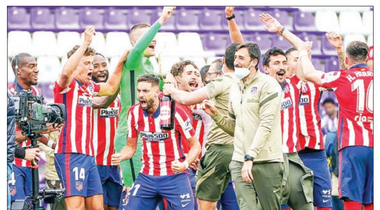
Atletico Madrid's players celebrate after winning the Spanish league.

Some Atleti players piled onto each other and others fell to the ground with exhaustion and relief. After being top since December and after almost throwing away a 10-point lead in February, the title was finally theirs.— AFP ■