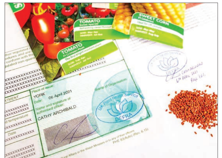
Mercer must now buy certificates costing hundreds of pounds in order to import seeds from England. PHOTO: AFP

The border was easy enough to keep open with both sides inside the EU. — AFP ■