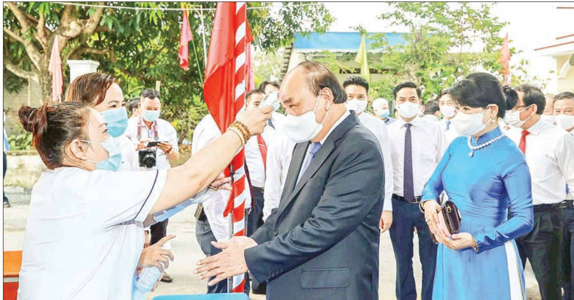
President Nguyen Xuan Phuc (C) has his body temperature checked and his hands disinfected prior to the voting process in Ho Chi Minh City on May 23, 2021.

Of the more than 5,000 infections confirmed since the start of the pandemic, 2,000 have been recorded since the beginning of