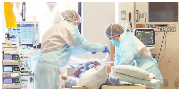
Photo shows two nurses providing medical care to a COVID-19 patient with severe symptoms at a hospital in Osaka on April 8, 2021.

OVER half of nurses working at coronavirus hospital wards have thought about quitting their jobs,