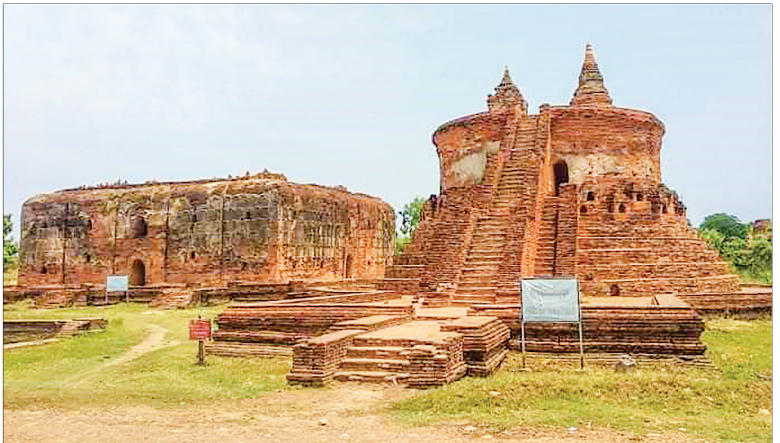
Ancient city-state Inwa was established by Khing Thadoeminphyra in 1364 AD.

The Ministry of Hotels and Tourism created further destinations at the six-series of the pagoda, the nine-series of the pagoda, the cluster of Daw Gyan pagodas, Myintmotaung Pagoda and Wingapa Pagoda, for travellers at ancient stupas and temples in the Inwa, Nyaungyan and Amrapura eras. A meeting will be