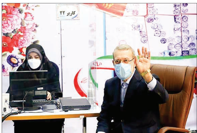
Iran’s former parliament speaker Ali Larijani registers his candidacy for Iran’s presidential elections.

A presidential election in Iran next month could provide the final straw to split an already long-divided conservative political camp, after years of growing divisions.