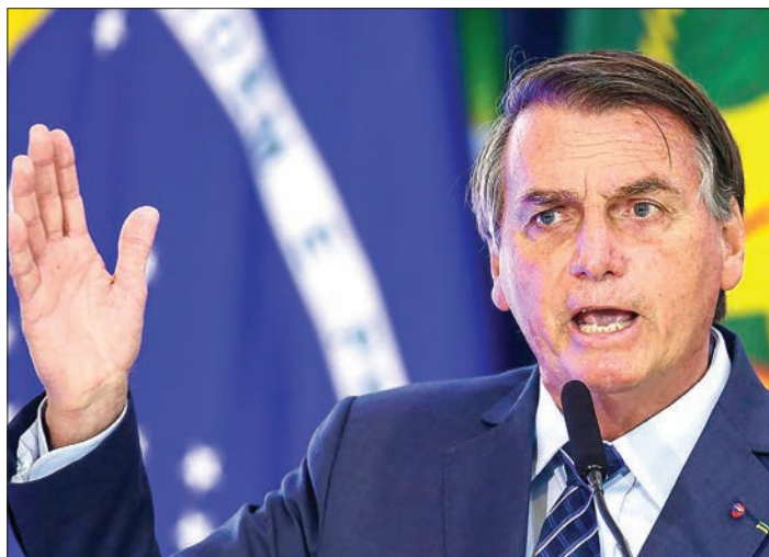
President Jair Bolsonaro must pay a fine for failing to adhere to state health safety regulations at a public event, the governor of Maranhao state said, as Brazil struggles to contain the Covid-19 pandemic.

Brazil has the world’s second highest coronavirus death toll, after the United States. — AFP ■