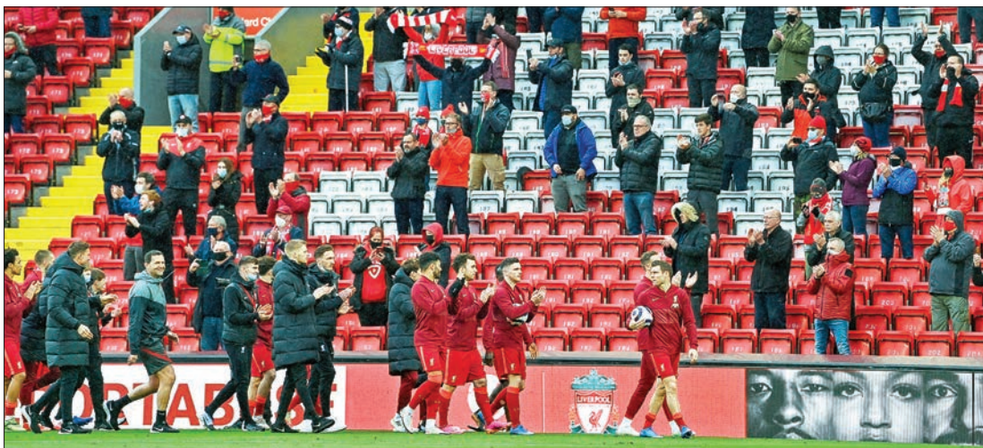
Liverpool players applauds the fans following during the English Premier League football match between Liverpool and Crystal Palace at Anfield in Liverpool, north west England on 23 May 2021.

LIVERPOOL and Chelsea seized the final two Champions League places in a dramatic end to the Premier League season on Sunday, leaving Leicester heartbroken for the second consecutive campaign.