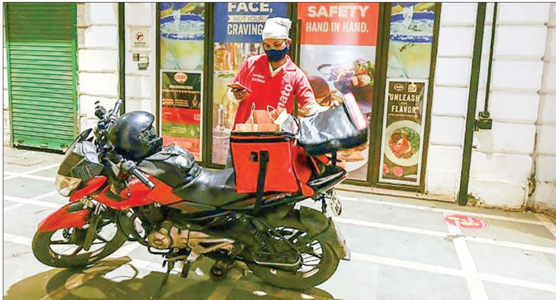
Food delivery firms have seen growing demand for their services during the pandemic.