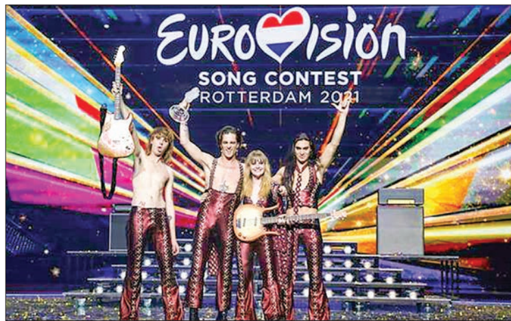
The high-kicking lederhosen and eyeliner-wearing Italians, who were favourites for victory, beat off stiff competition from France and Switzerland.

ITALIAN rock foursome Maneskin won the Eurovision Song Contest in Rotterdam on Saturday in a glammed-up message of hope for a world emerging from the coronavirus pandemic.