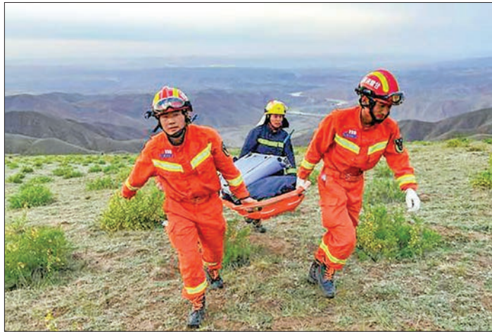
Rescuers managed to save 18 participants.