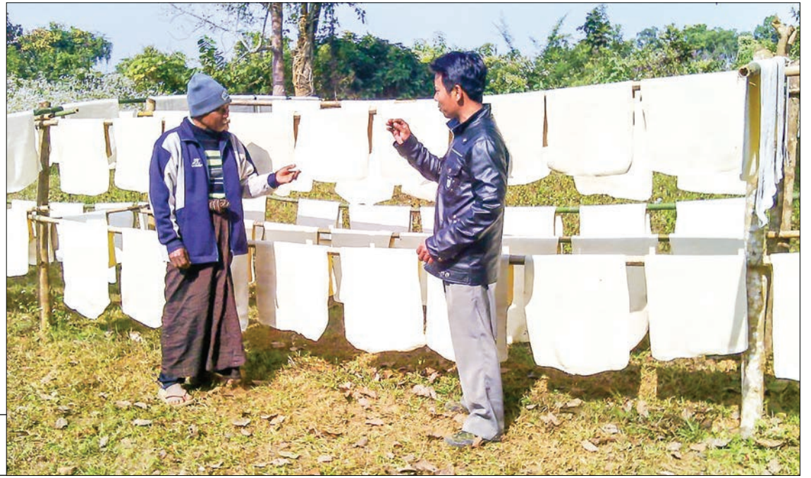
Rubber cultivation started in Homalin in 2005. The acres grew year over year, and the number of rubber acres reached 8,187 in 2021.

Moreover, a mixed cropping system is practised in the township. The coffee plants are also grown under rubber trees. The coffee seeds also raised the income of the farmers, according to the township Agriculture Department. — Hmway Kyu Zin/GNLM