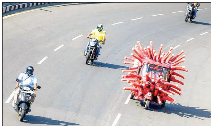
A health worker drives an auto-rickshaw decorated as a coronavirus model to raise awareness about the pandemic in India.

“As India reeled from the second wave and after the lockdown was announced in Maharashtra in April, classes were already closed or went online. It was then that I thought the very rickshaw I use to earn a living could also be used to help COVID patients,” he said. — AFP ■