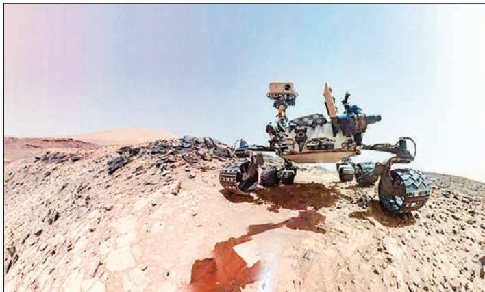
This low-angle self-portrait of NASA's Curiosity Mars rover shows the vehicle at the site from which it reached down to drill into a rock target called "Buckskin" on lower Mount Sharp.

A NASA team has found that organic salts are likely present on Mars. Like shards of ancient pottery, these salts are the chemical remnants of organic compounds, such as those previously detected by NASA's Curiosity rover. Organic compounds and salts on Mars could have formed by geologic processes or be remnants of ancient microbial life.