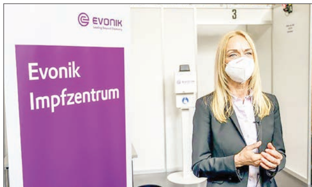
The makeshift vaccination centre at chemicals group Evonik's Hanau site, near Frankfurt, is one of several pilot projects in Germany.

"You can get vaccinated without hardly any waiting time, it's great," Scharf, 58, told AFP after