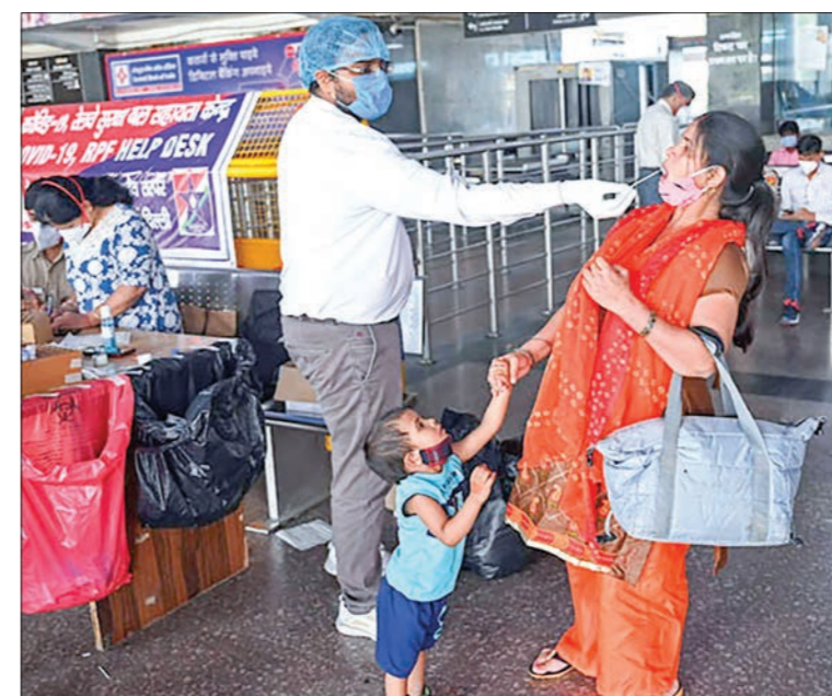
A health worker takes a swab sample from passengers for coronavirus screening at a railway station in New Delhi on Friday.