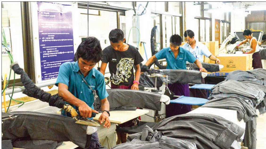
The garment sector is among the prioritized sectors driving up exports. The CMP garment industry emerged as a promising one, with preferential trade from Western countries.

MYANMAR'S garment export exceeded US$1.4 billion in the first five months (Oct-Feb) of the current financial year 2020-2021, according to the data released by the Ministry of Commerce.