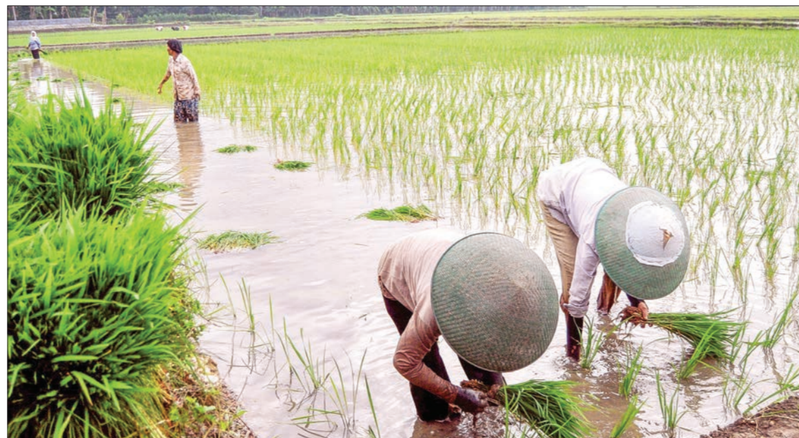
Planting rice in Gebangsari Village, Banyumas, Central Java, Indonesia.

“The pandemic will only be over once everyone is safe,”