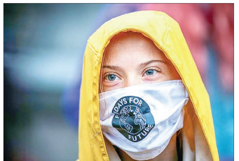
Swedish climate activist Greta Thunberg wants people to rethink the way the world produces its food.

"The way we farm and treat nature cutting down forests and destroying habitats, we are creating the perfect conditions for diseases to spill over from one animal to another -- and to us," the 18-year-old said. According to the World Health Organiza-