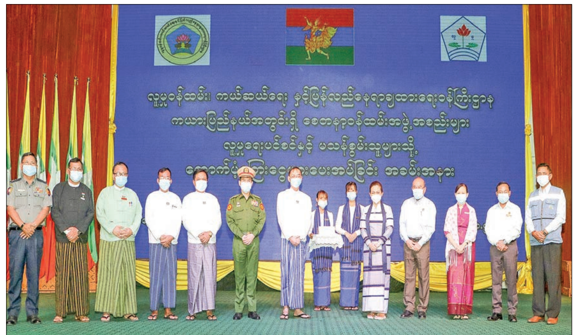
The support ceremony to the elderly, charity organizations and persons with disabilities in progress.

A total of K101.154 million kyats: K71.724 million to the charity/volunteer organizations, K26.04 million for a total of 868 senior citizens and K3.39 million to a total of 113 persons with disabilities, were provided at the