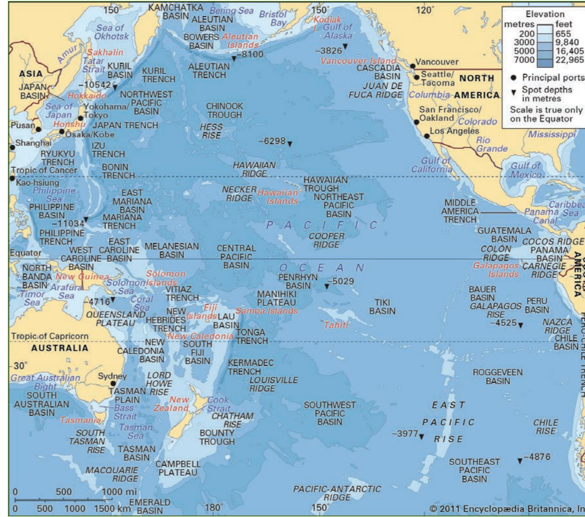
The Pacific Ocean, with depth contours and submarine features.

Apart from the narrow coastal zone of the eastern region and the broad continental seas of the western region, the Pacific is floored with pelagic