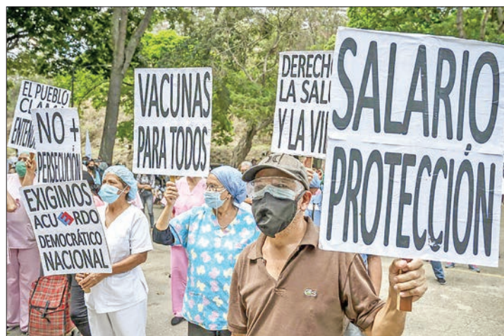
Health workers carry signs while participating in a protest demanding better wages, mass vaccination against the novel coronavirus, COVID-19, and biosafety material to protect themselves, outside the Doctor Jose Gregorio Hernandez Hospital in Catia neighborhood in Caracas as part of the celebration of the International Workers' Day on May 1, 2021.

In fact, this latest raise was not even published in the official government gazette. —AFP ■