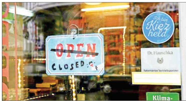
Germany's statistics agency says the coronavirus crisis "caused another decline in economic performance at the beginning of 2021", hitting household consumption in particular.

Germany's woes come as the country remains gripped by a third coronavirus wave that has pummeled the services sector, with restaurants, hotels and leisure centres all feeling the pain from prolonged closures.—AFP ■