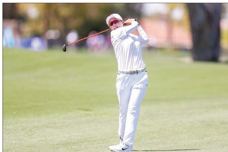
South Korea’s Kim Hyo-joo won the HSBC Women’s World Championship in Singapore.