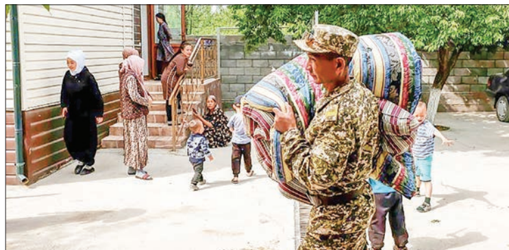
The border clashes comprise the heaviest fighting in years between the countries, raising fears of a wider conflict.

Clashes between communities over land and water along the long-contested border are regular occurrences, with border guards often getting involved. However, this week’s violence was by far the most serious during the Central Asian pair’s 30