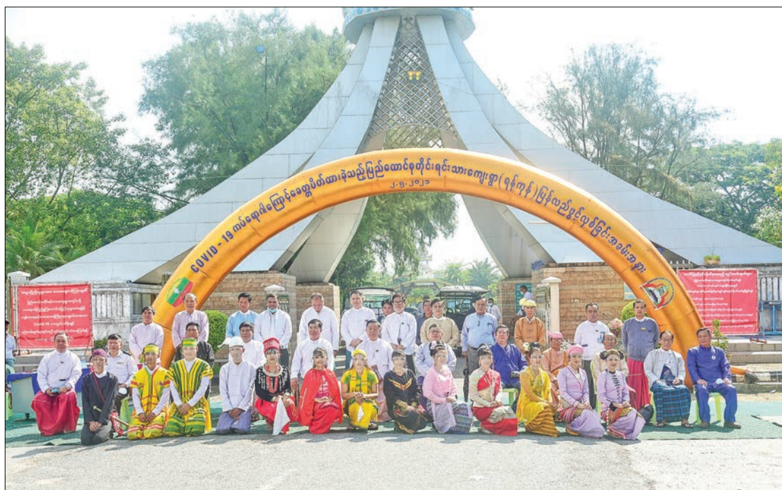
The Union National Races Village (Yangon) reopens to public on 2 May 2021.

THE Union National Races Village (Yangon) under the Department of Ethnic Literature and Culture, Ministry of Ethnic