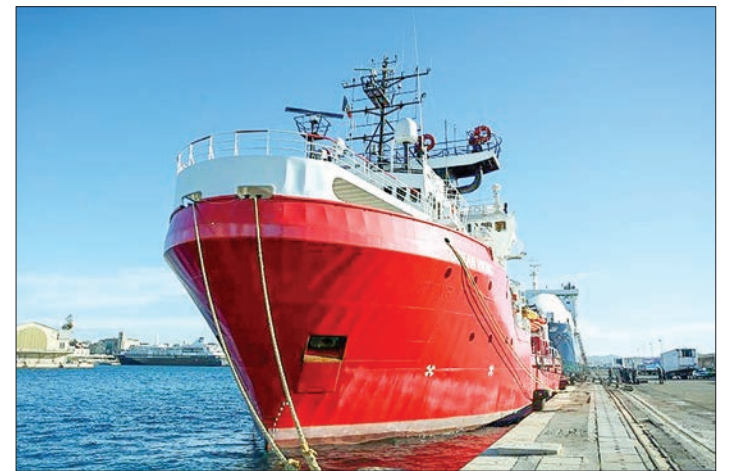
SOS Mediterranee's Ocean Viking ship — the charity says it has rescued nearly 33,000 people since February 2016.

Pictures taken at the scene showed the 236 migrants were given identity checks and Covid-19 tests as