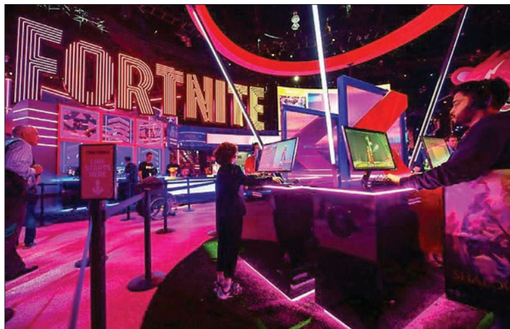
Gaming fans play “Fortnite” at the 2019 Electronic Entertainment Expo, also known as E3, on June 11, 2019.

IN a court clash with potentially huge repercussions for the world of mobile tech, Fortnite maker