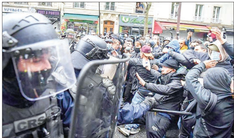
Police scuffled with protesters in Paris on Saturday, firing tear gas as thousands turned out across France for May Day workers’ rights demonstrations.

POLICE scuffled with protesters in Paris on Saturday, firing tear gas as thousands turned