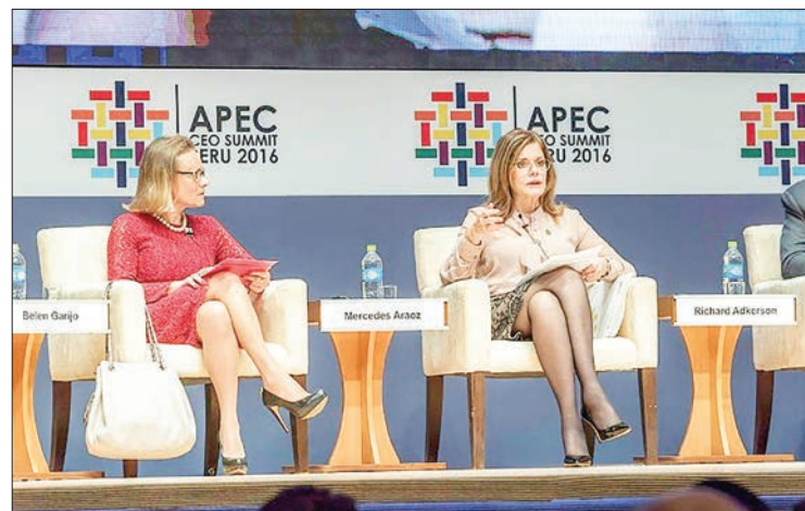
Belen Garijo will become the first woman to singlehandedly run a DAX 30-listed company from May.

last year after just six months, as SAP decided to switch back to a sole chief executive —