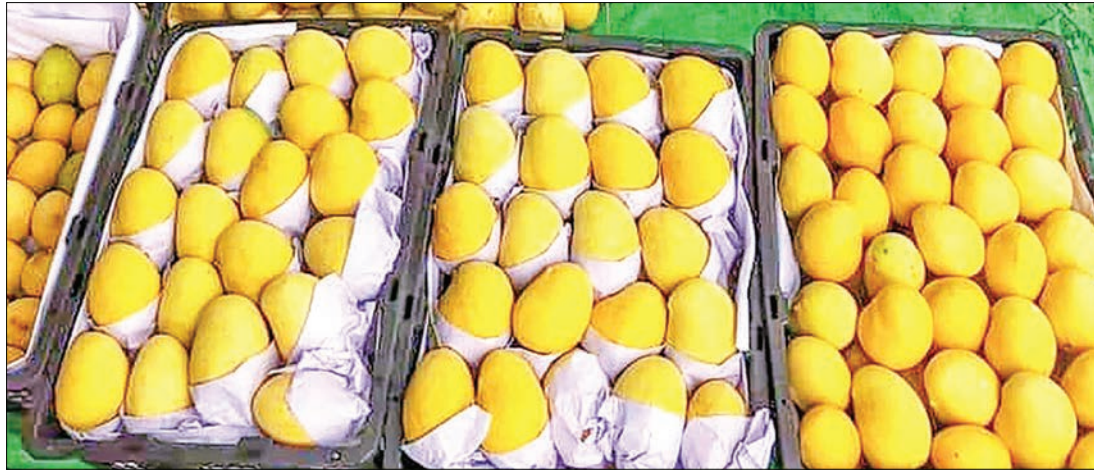
There are over 30,000 mango acres in Mandalay Region. The mango is normally harvested from mid-April to July across the country.