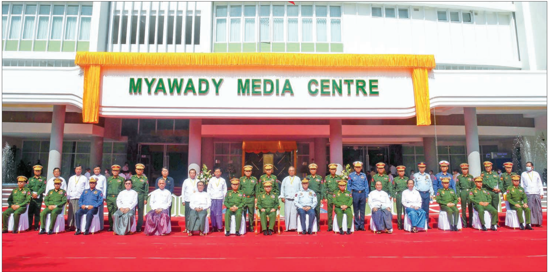
State Administration Council Chairman Senior General Min Aung Hlaing and dignitaries are posing for a documentary group photo at the unveiling ceremony of the Myawady Media Centre yesterday.