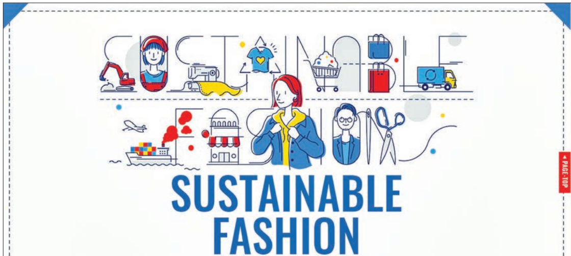
Screenshot taken on April 30, 2021, shows the website "Sustainable Fashion," launched by Japan's Environment Ministry.

CLOTHING items sold in Japan contribute to generating over 95 million tons of carbon dioxide a year, mostly emitted during the manufacturing process overseas, a government estimate