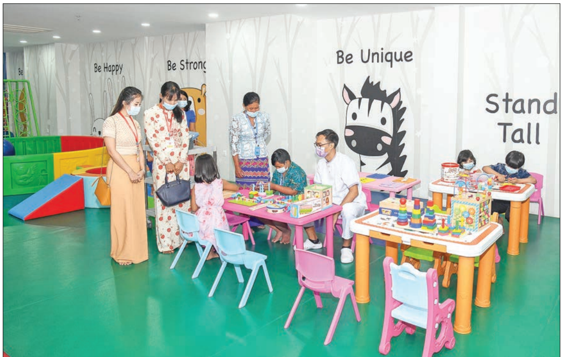
Children can play at the indoor playground of the Moe Kaung Treasure Maternal and Child Hospital.

Everyone can disseminate a thing targeted to the people