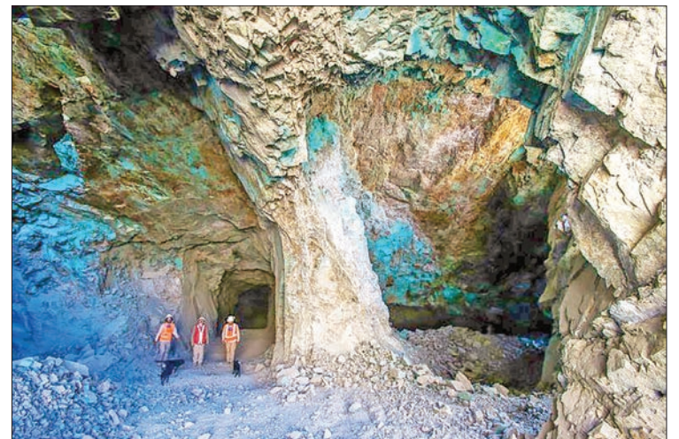
Workers of the Next Mineral mining company inspect the Comahue copper mine in Antofagasta, Chile -- copper prices hit a ten-year high this week.