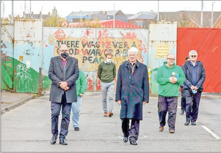
Northern Ireland marks its centenary on Monday.

NORTHERN Ireland marks its 100th year on Monday, but faltering efforts to commemorate the centenary encapsulate the rift at the heart of the British province.