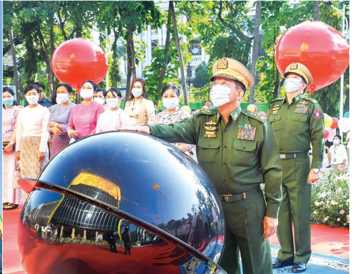
State Administration Council Chairman Senior General Min Aung Hlaing is unveiling the Moe Kaung Treasure Maternal and Child Hospital in Yangon on 2 May 2021.

C HAIRMAN of the State Administration Council Commander-in-Chief of Defence Services Senior General Min Aung Hlaing commissioned the Moe Kaung Treasure Maternal and Child Hospital and the Myawady Media Centre on Moegaung Road in Yankin Township of Yangon Region into service yesterday morning.