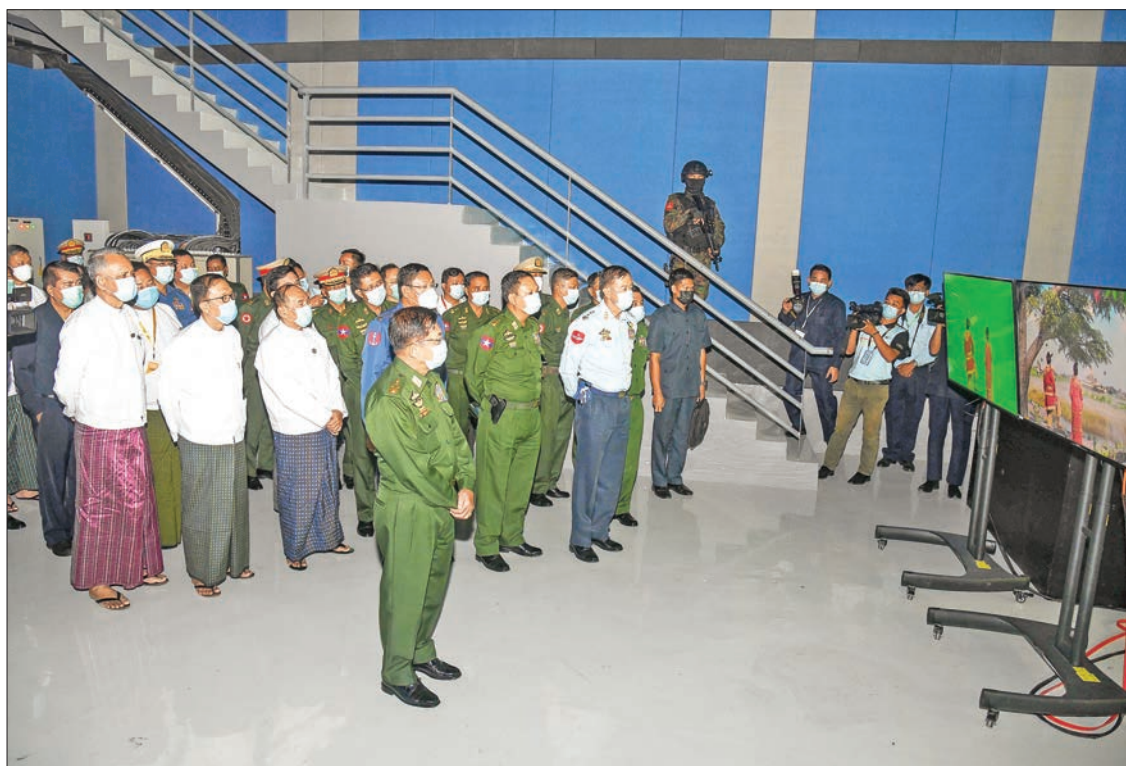
The Senior General and party are looking around inside the Myawady Media Centre on 2 May 2021.

Efforts were made to occupy the market of receiving medical treatment abroad of the people. Moe Kaung Treasure Maternal and Child Hospital was built with the aim of overcoming challenges of the language barrier, removing difficulties to urgently contact medical doctors, enabling the people to have international-level medical treatment, enjoying the family-type treatment, contributing to an unbalanced ratio of hospitals to patients, and providing highly-qualified treatments to the people with the use of modern medical equipment.