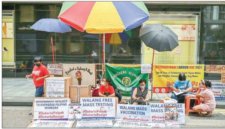
Migrant workers sit in front of protest banners in the Central district of Hong Kong on May 1, 2021.

would be the first time Hong Kong has directly tied working rights for foreigners to vaccines.