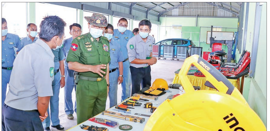
The MoBA Union Minister is inspecting the border youth development training centre (Dawei).

The Union Minister then met the staff of the Taninthayi Region Development Supervisory Office and border youth development training centre (Dawei) and stressed the need to follow the civil service personnel law with full of loyalty to the country. The demonstrators should teach the physical and mental issues in addition to the subjects.