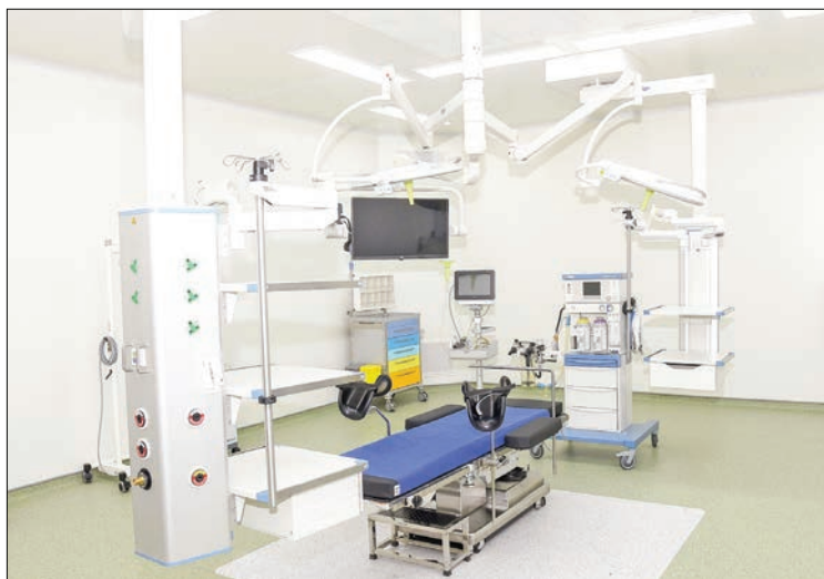
Modern medical equipment is seen at the Moe Kaung Treasure Maternal and Child Hospital.

The Myawady Media Centre is a seven-storey building. The first and second floors accommodate a 200-seat 3D cinema, a 300-seat LED projector theatre, two TV studios, other respective studios, library and training halls. The third, fourth and fifth floors are formed with business offices and the sixth floor with a ballroom, a function hall and a meeting hall. — MNA