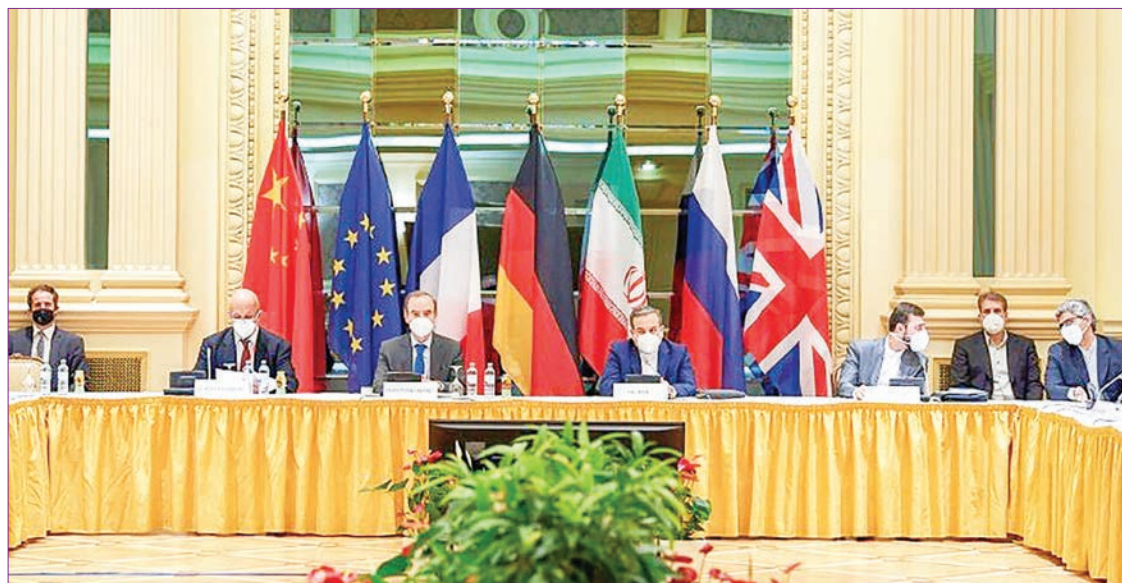
The Russian side expressed cautious optimism after the talks on Saturday and said they hoped for a result within three weeks.

Representatives of the parties still in the agreement (Iran,