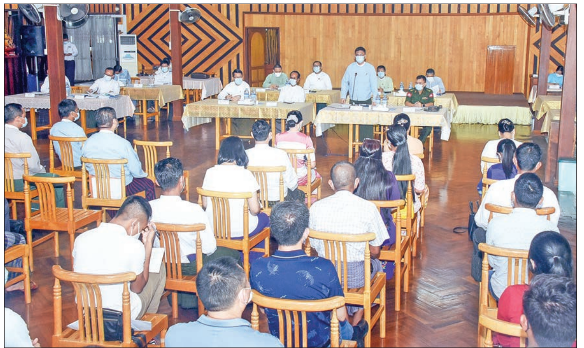
The MoC deputy minister meets industrialist and business people in Bago yesterday.

DEPUTY Minister U Nyunt Aung of the Ministry of Commerce, in his capacity of Chairman of the Working Committee on Ensuring the Smooth Flow of Trade and Goods, met the business persons and entrepreneurs from Bago Industrial Zone yesterday morning in Bago.