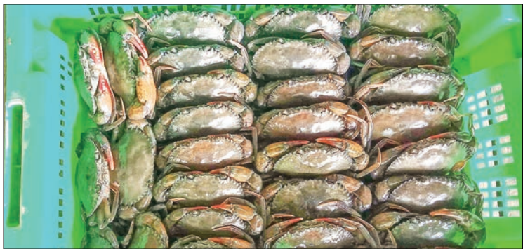
The soft-shell crabs from Kyaukpyu Township are being shipped to Asian countries such as Japan, the Republic of Korea, China Taipei (Taiwan) and Hong Kong SAR, Southeast Asian countries like Viet Nam and some European countries.

THE soft-shell crab cultivation business in the farms of No. 468 block in Kyaukpyu Township, Rakhine State is thriving and those crabs are started to distribute in the external market, said a breeder.