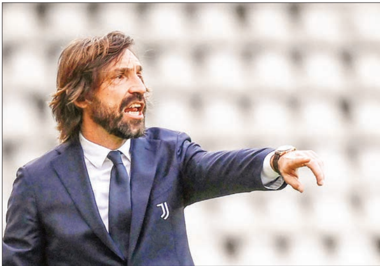
Andrea Pirlo took over as Juventus coach this season.

ANDREA Pirlo insisted Saturday he was calm about his job as Juventus coach as the Italian champions’ nine-year reign nears its end. Inter Milan are set to deny Juve a 10th consecutive crown with the Turin giants now battling for a Champions League spot.