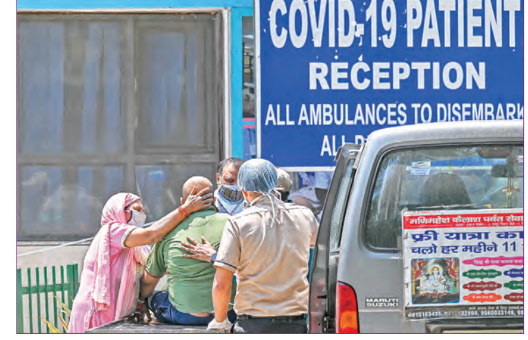
Medical staff and relatives help a Covid-19 coronavirus patient to get in a car at a hospital in New Delhi on 24 April 2021.

The White House said it was making vaccine-produc-