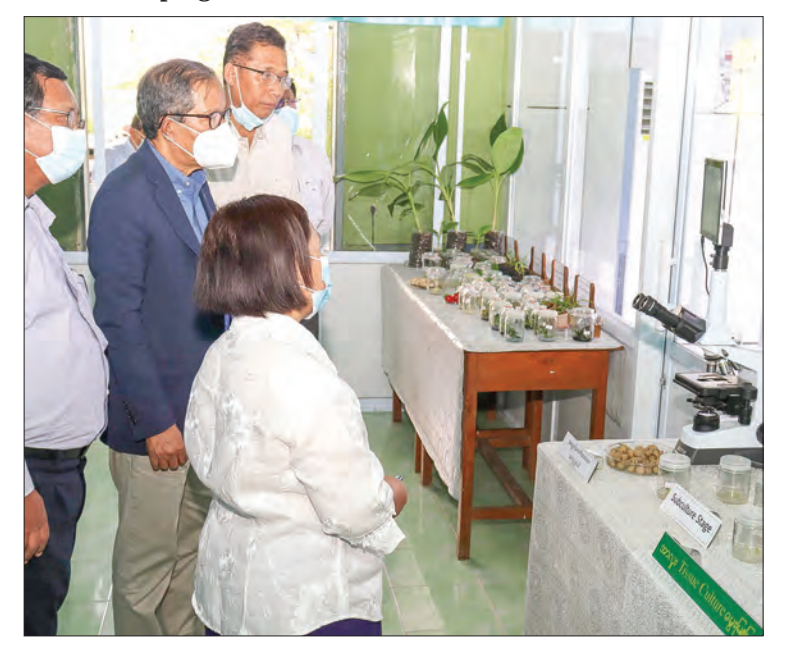
Union Minister U Tin Htut Oo and party are inspecting the Aungban Regional Research Centre-RRC on 24 April.

livestock-based production with modern methods and to achieve the comprehensive economic development of other economic sectors at the