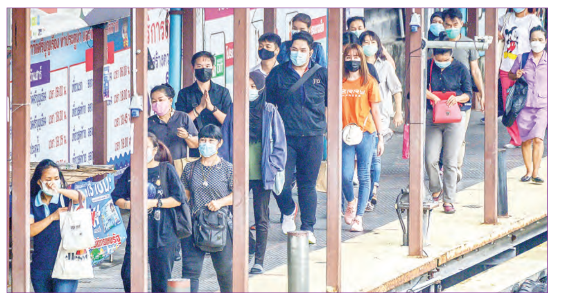
Commuters wearing protective face masks walk on Pratunam pier in Bangkok on 26 April 2021, after the government imposed strict restrictions including a 20,000 THB (525 Euros, 636 USD) fine for not wearing a mask in public following the recent outbreak of Covid-19 coronavirus cases in Thailand.

NEW Covid restrictions came into force in Thailand on Monday to try to halt a spiralling outbreak that saw deaths hit a record single-day high over the weekend.