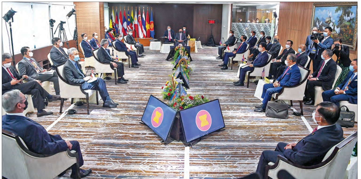
The ASEAN Summit in progress.

Sultan Haji Hassanal Bolkiah of Brunei Darussalam made a concluding remark, and the meeting was successfully concluded.