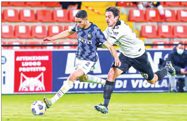
Inter were held against Napoli and Spezia but maintain a 10-point advantage as nearest rivals AC Milan lost last time out and next travel to Lazio.

ANTONIO Conte compared his jittery Inter Milan team to an orchestra as they approach a first Serie A title in over a decade having endured back-to-back draws before travelling to Hellas Verona this weekend.