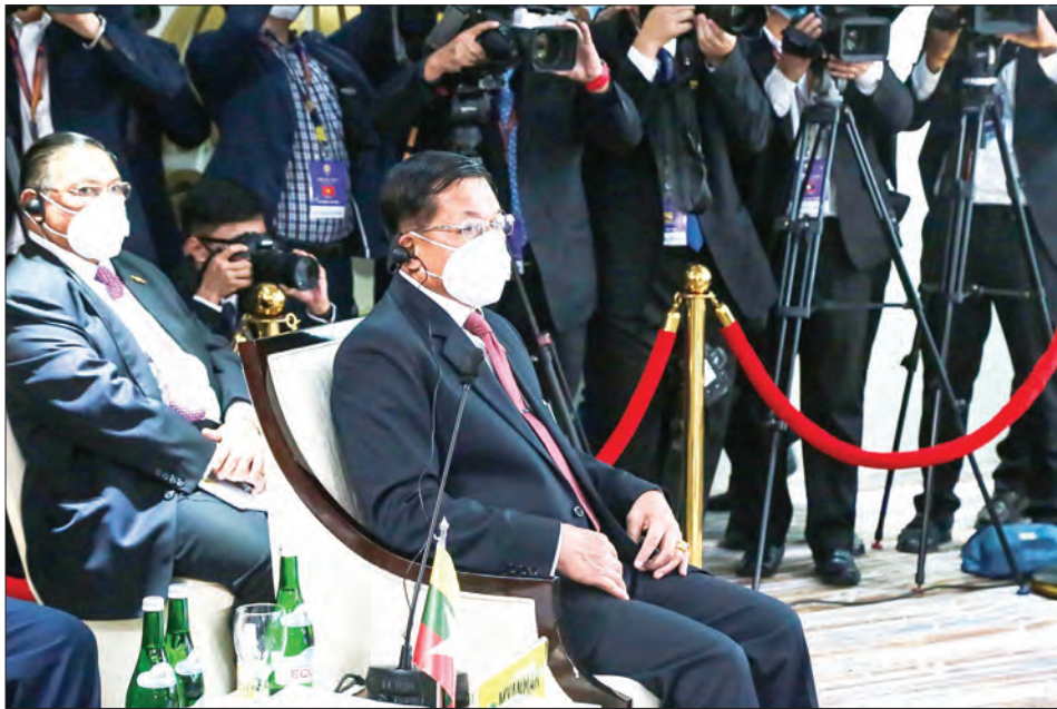
Attending the ASEAN Summit 2021.