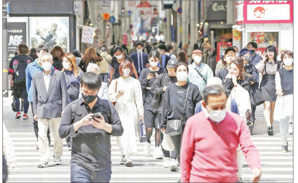
People wearing face masks walk in Osaka's Minami area on April 23, 2021. Prime Minister Yoshihide Suga declared a state of emergency the same day in Tokyo and the western Japan prefectures of Osaka, Kyoto and Hyogo amid a rapid resurgence of coronavirus infections.

omy to rebound in the April-June period from a downturn in the previous quarter when the second state of emergency was in place for parts of the country including Tokyo, Osaka and other urban areas, notably hitting the food services industry with restaurants and bars requested to close early. Gross domestic product data for January to March is scheduled to be released next month. But economists are already pessimistic enough to forecast contraction in the world's third-largest economy.—Kyodo News ■