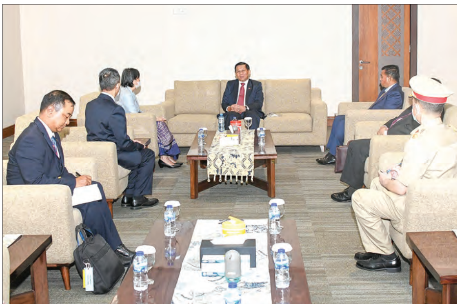
Warm conversation with the Myanmar Embassy staff.

flight and arrived back in Nay Pyi Taw Airport at about 10:45 pm Myanmar standard time, where they were welcomed back by the Vice-Senior General, members of the SAC, Union ministers, the commander of Nay Pyi Taw Command, deputy ministers and officials. —MNA