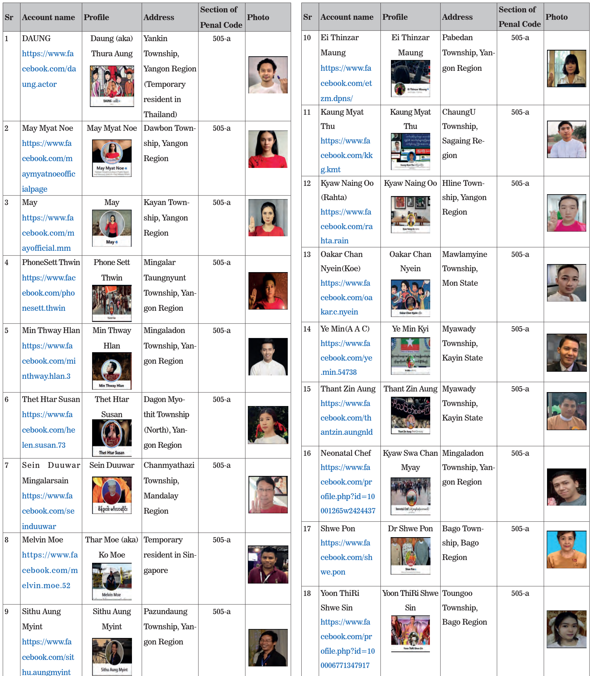
The list of people charged under Section 505-A of the Penal Code

Action will be taken against those who admit the offenders, and list of remaining offenders will be released. —MNA