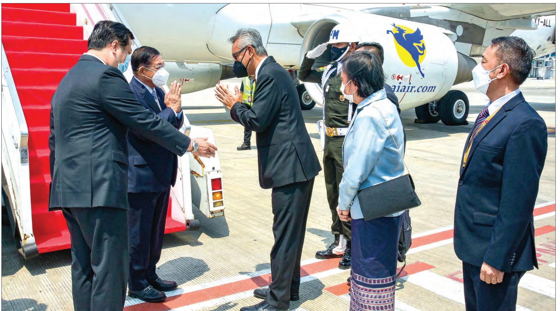
State Administration Council Chairman Senior General Min Aung Hlaing arrives at Soekarno Hatta Airport in Jakarta on 24 April 2021.

C HAIRMAN of the State Administration Council Commander-in-Chief of Defence Services Senior General Min Aung Hlaing and delegation left Nay Pyi Taw for Jakarta, Indonesia by special flight yesterday morning to attend the ASEAN Leaders' Meeting there and were seen off by Vice-Chairman of the