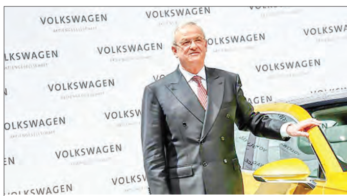
Volkswagen is demanding compensation from ex-CEO Martin Winterkorn for "breach of duty" in connection with the "dieselgate" scandal.

VW said in March it would be demanding compensation from Winterkorn, as well as Rupert Stadler, the former head of its Audi division, for "breach of duty" in connection with the affair. The company did not reveal how much it was seeking then. —AFP ■