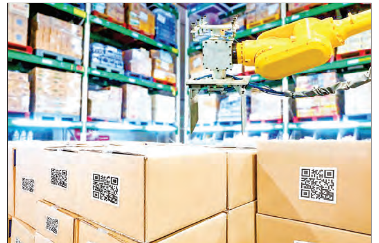
Blue Yonder has more than 3,000 clients worldwide, including multinationals Walmart and Coca Cola as well as airlines and couriers such as FedEx.

"The need for more intelligent, autonomous and edge-aware supply chains has been dramatically heightened by the