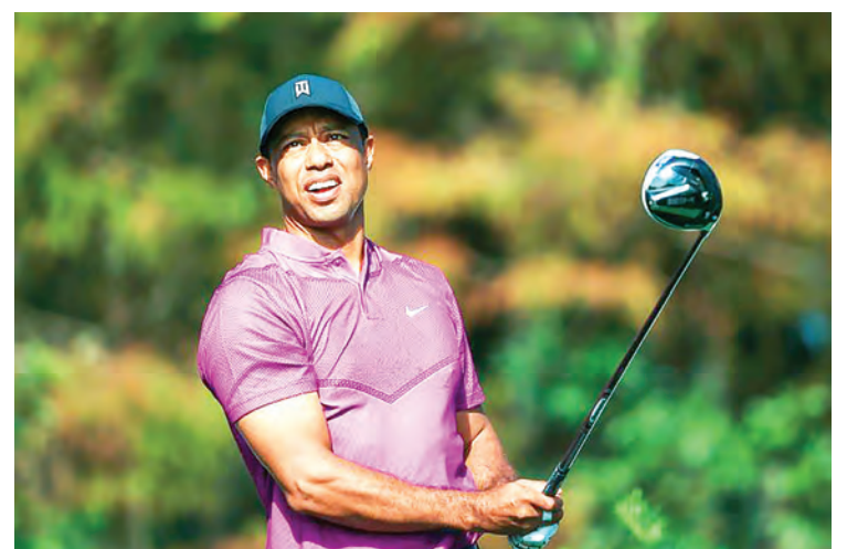
Tiger Woods posted a photo of himself on crutches on his Instagram account on Friday, the first image of him since he suffered serious right leg injuries in a one-car crash two months ago.

Woods had undergone a series of back operations before making a fairytale comeback that saw him win the 2019 Masters for his first major title since the 2008 US Open at Torrey Pines. —AFP ■