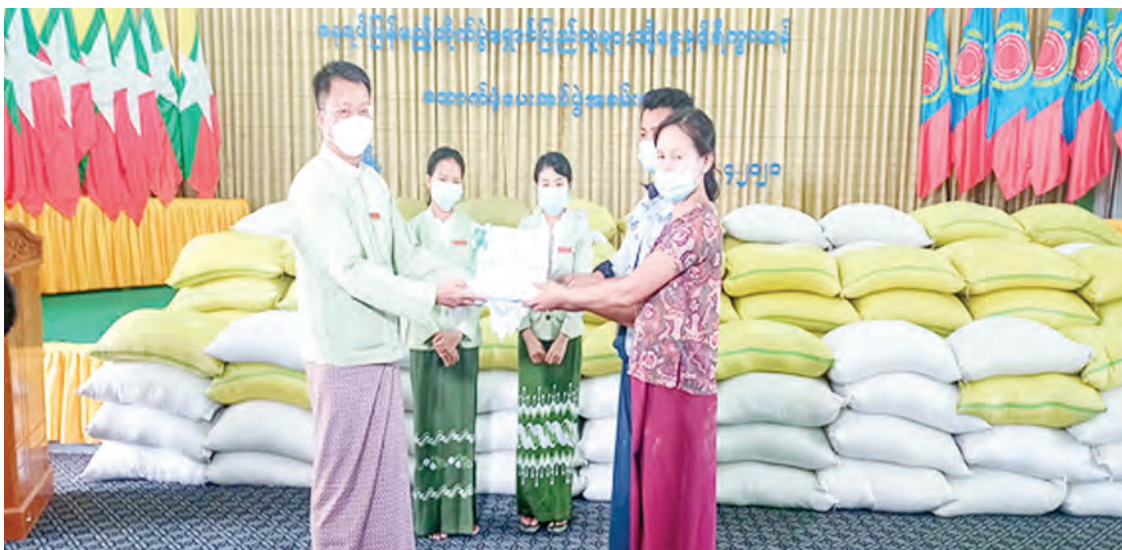
IDPs are receiving cash and kind in Rakhine State on 23 April.