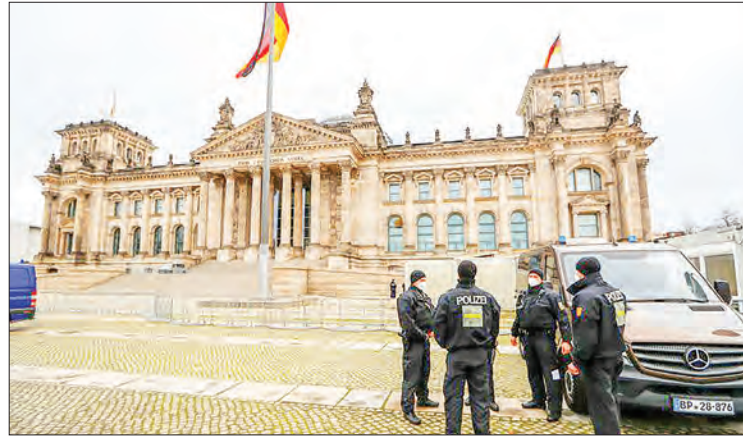
FILE PHOTO: Police officers stand outside the Reichstag building, seat of Germany's lower house of parliament, in Berlin.

GERMANY'S Bundestag, or lower house of the Parliament, passed a supplementary budget on Friday and approved an additional 60 billion euros (72 billion U.S. dollars) in debt.