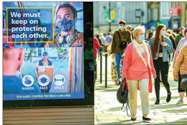
Retail sales by volume rose 5.4 per cent in March from February.

EMERGENCY pandemic support measures sent UK annual borrowing rocketing to the highest level since World War II, official data showed on Friday.