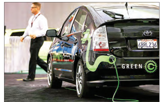
Hybrid electric vehicles made up 18.4% of total passenger car sales in the EU, almost doubling their market share in a year.

umes fell 20.1 per cent compared to a year ago, to reach 593,559 cars sold across the European Union. The volumes fell nearly 30 per cent in Germany and Spain. —AFP ■