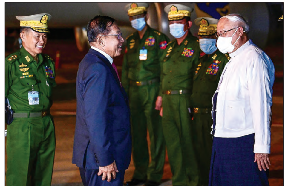
Arriving back in Myanmar.