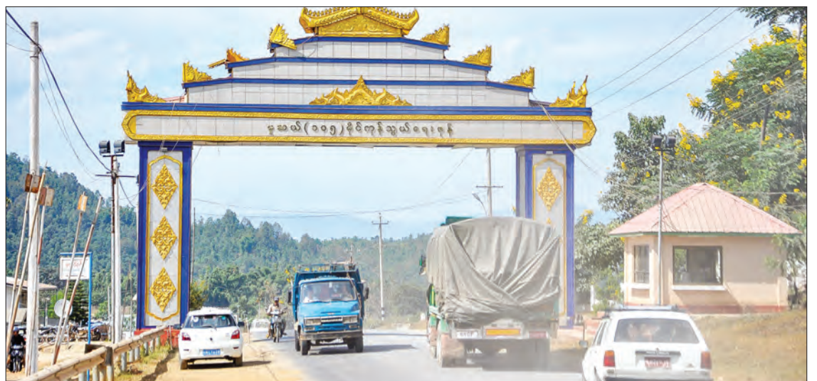
Muse border sees an enormous volume and value of border trade with an estimated value of more than US$2.53 billion this FY between 1 October and 16 April, a decrease of over $35.3 million compared with the last year's figures of $3.35 million.

Security forces are reportedly working to identify and arrest those involved in the violence and take effective action under the law. —MNA