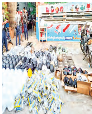
Confiscated weapons used in riots.

According to the tip-off, the police raided “Ma Ei” Store lo-