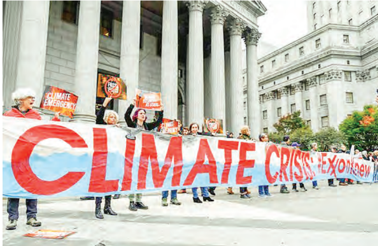
Oil companies, major producers of greenhouse gas emissions, are targeted by climate litigators and activists. Here, before the Supreme Court in New York on the first day of the Exxon Mobil trial, October 22, 2019.

FEWER than one in four of the world's largest companies are on track to meet basic climate change targets, according to a new study published on Thurs-