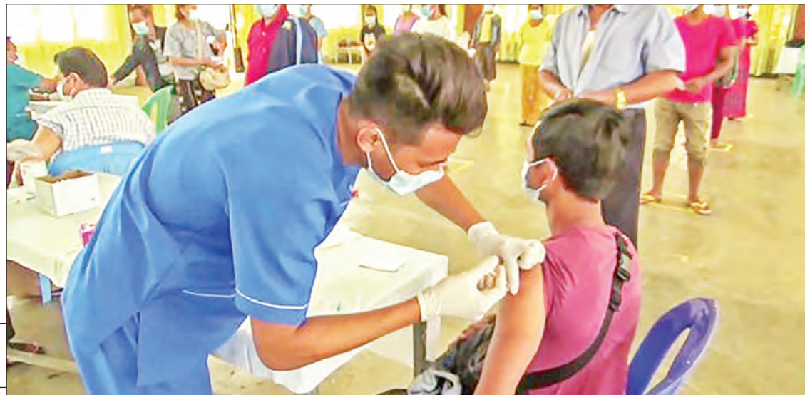
Tatmadaw medical teams are administering COVID vaccine jabs to locals in Taunggyi.

Nyaung Shwe, Kalaw, Yaksawk, Pekon, Hopong, Hsihseng, Pinlaung, Ywangan and Pindaya townships of Shan State (South), Loikaw Township of Kayah State, Kangyidaunt, Nyaungdon, Pantanaw and Ingapu townships of Ayeyawady Region by cooperating with the medics and healthcare workers of public hospitals. — MNA