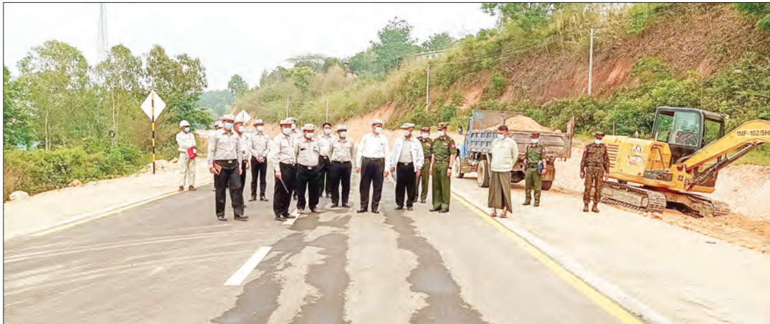
The MoC Union Minister and party are inspecting the road and bridge development works in Kengtung on 23 April.

UNION Minister for Construction U Shwe Lay, accompanied by Brig-Gen Myo Min Tun, Commander of the Triangle Regional Military Command, inspected the concrete paving