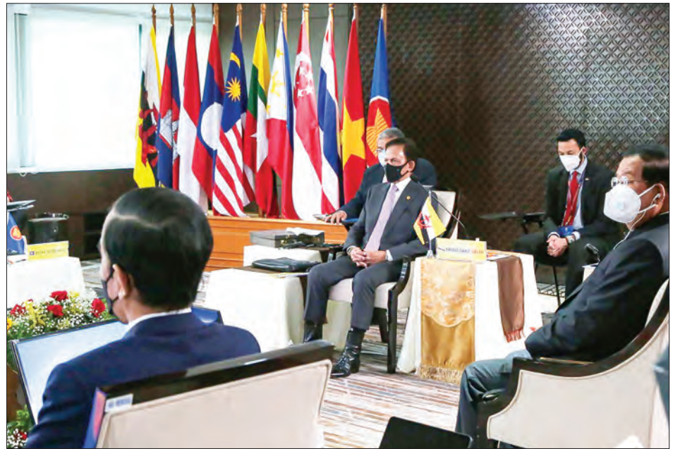
Holding talks with the ASEAN Chair.