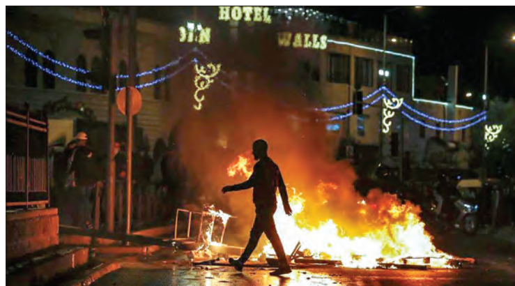
Streets are set ablaze as members of the Israeli security forces deploy during clashes with Palestinian protesters outside Damascus Gate.

extremists taking to the street bullying Arabs in nightly confrontations. —AFP ■