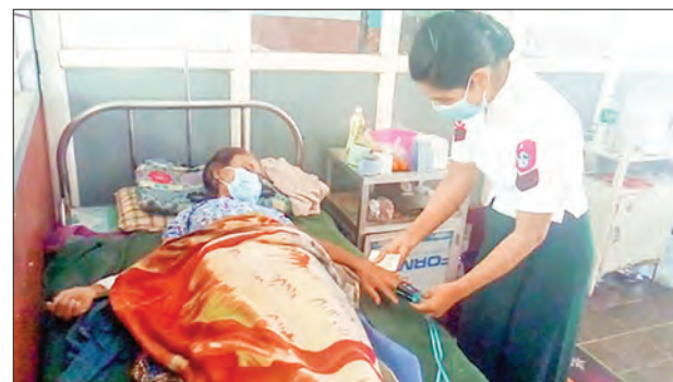
Tatmadaw medics are providing healthcare to locals in Latpadan.

spective commands also inspected the medical services at the hospitals and comforted the patients by providing food aids and necessary things. It is reported that local residents are satisfied with the medical supports of Tatmadaw. — MNA