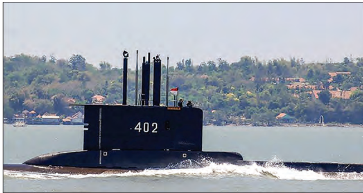
The submarine -- one of five in Indonesia's fleet -- disappeared early Wednesday during live torpedo training exercises off Bali.

But that deadline passed early Saturday with still no sign of the stricken vessel and its 53 crew. "There's been no progress yet," said Navy spokesman Julius Widjojono.