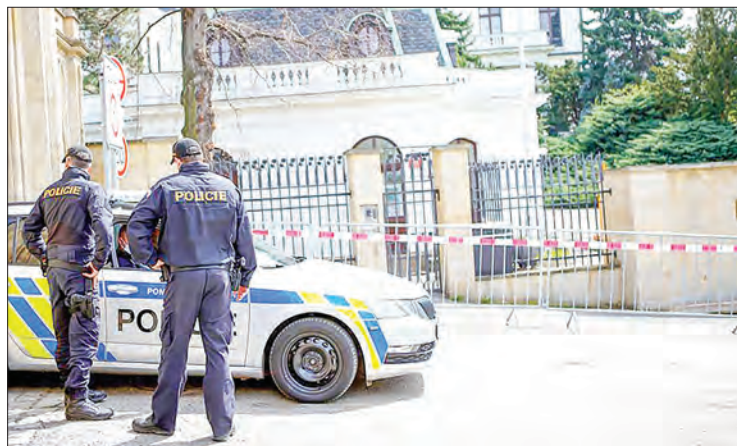
Czech police are seen outside the Russian embassy in Prague, the Czech Republic, on April 22, 2021. The Czech Republic will reduce and put a cap on the number of employees in the Russian embassy in Prague to the same number at the Czech embassy in Moscow, the Czech Foreign Ministry said on Thursday.

The Russian foreign ministry spokesperson said that Moscow would also limit the Czech