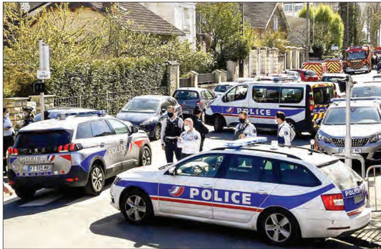
French police at the crime site.

FRENCH prosecutors opened a terror probe on Friday after a woman working for the police was stabbed to death at