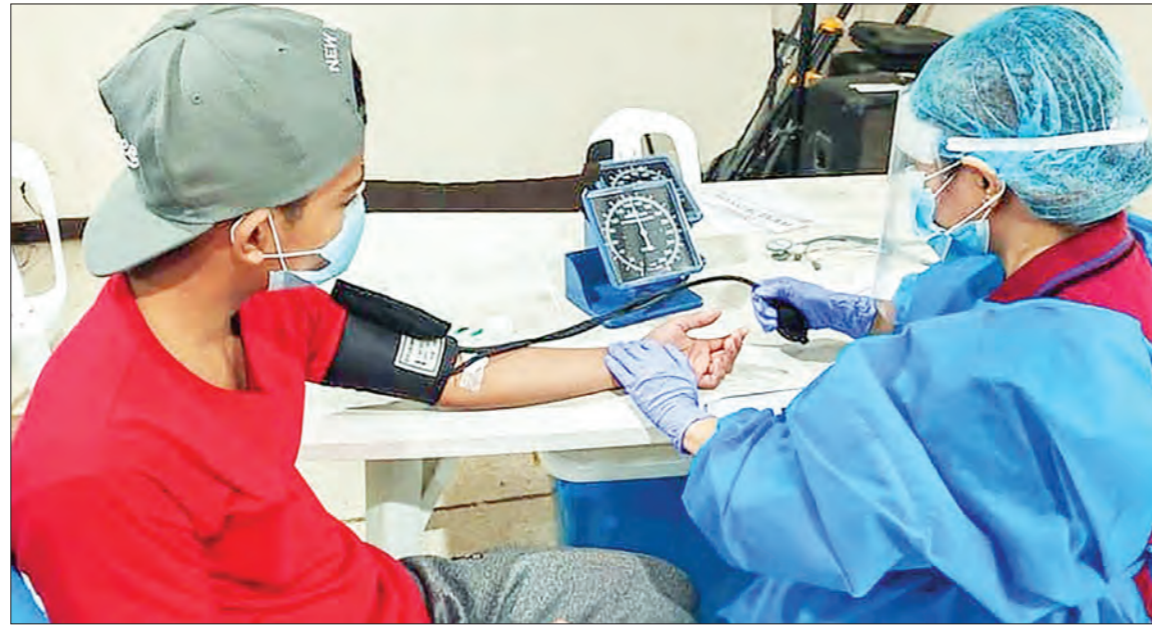
A front-line medical worker with a patient at a hospital in Muntinlupa, Philippines.

"It is encouraging to see that countries are beginning to build