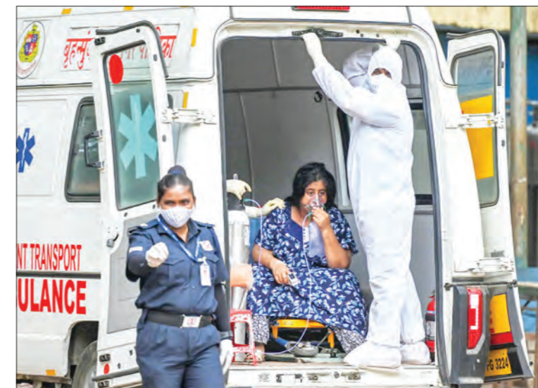
A health worker wearing Personal Protective Equipment (PPE) gear stands with a patient while getting transferred to an intensive care unit (ICU), inside an ambulance at a recovery centre to treat Covid-19 coronavirus patients, in Mumbai.