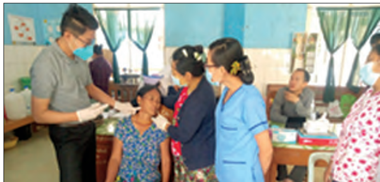
Tatmadaw medics are providing healthcare services to locals.

THE Tatmadaw medical teams comprising Tatmadaw doctors, specialists, and nurses, have been providing necessary medical treatments to the patients in military hospitals and general hospitals.