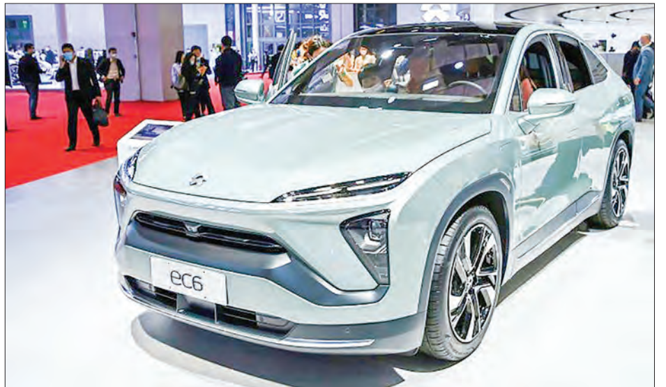
China is the world's biggest and most rapidly electrifying auto market.

The first major auto industry gathering of the year opens to the public Wednesday with the global sector looking to China -- the world's biggest and most rapidly electrifying auto market -- to lead the way into a post-pandemic future. Sales in China contracted two per cent to 25.1 million vehicles last year -- nearly one-third of the global total -- but are rapidly recovering thanks to the expanding popularity of electric cars. —AFP ■