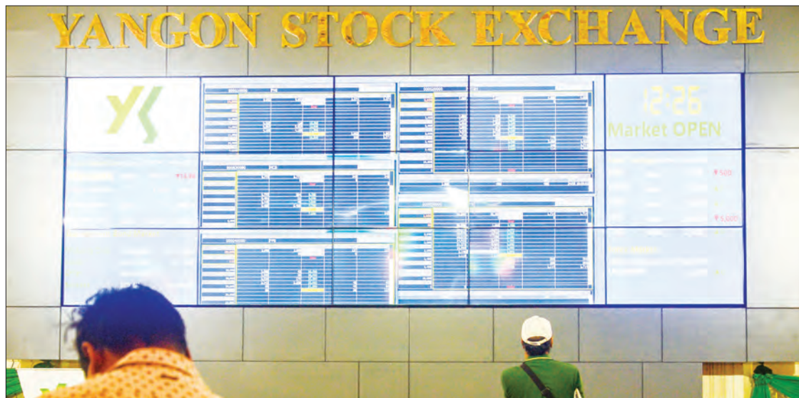
The security companies will monitor the daily trades of foreigners in keeping with the rules and regulations so that they do not exceed the limit set for each listed company.

The upper limit for FMI's foreign shareholding amount is at 14 per cent, with 4,635,357 shares. The foreign investors are about to reach the limit for shareholding. Consequently, the status of buy order acceptance is suspended on