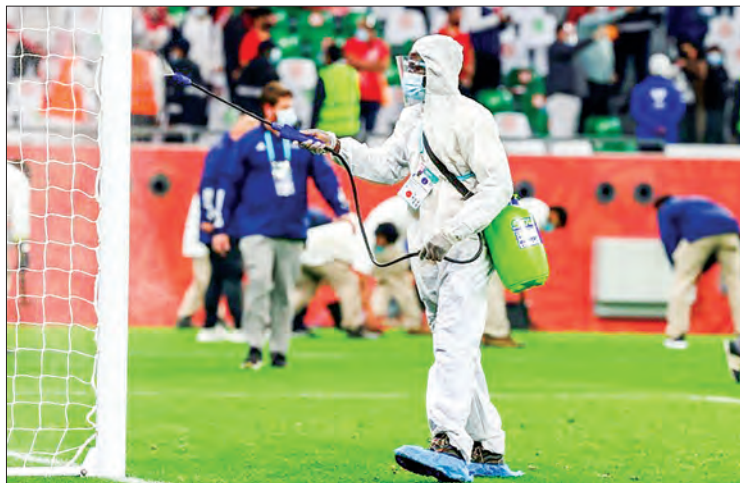
A sanitation worker sprays disinfectants on the goal post following a FIFA Club World Cup football match at the Education City Stadium in Qatar.

Simon Chadwick, professor of Eurasian Sport at EM Lyon