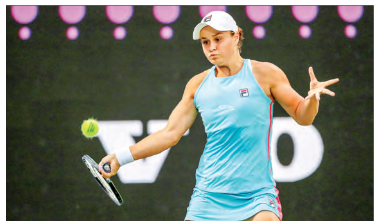
As Ashleigh Barty prepares for the start of Roland Garros on May 24, she insisted Monday that she does not regard herself as the defending champion.

She opened her clay-court season by reaching the quarterfinals in Charleston, South Carolina, at the start of the month. ■