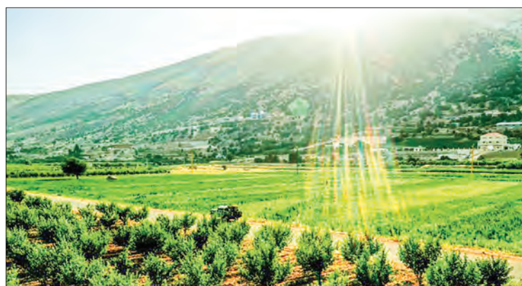
Farmers hit by Lebanon's economic crisis say growing hashish is less expensive than growing basic produce such as potatoes or green beans.

Lebanon is in the throes of a spiralling economic crisis compounded by the coronavirus