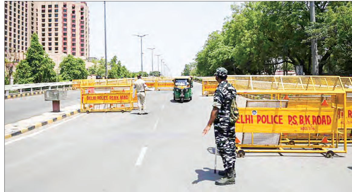
Police personnel stop vehicles at a checkpoint during a weekend lockdown imposed by the government amidst rising COVID-19 coronavirus cases, in New Delhi on 18 April, 2021.

In Japan, rising virus cases have stoked speculation that