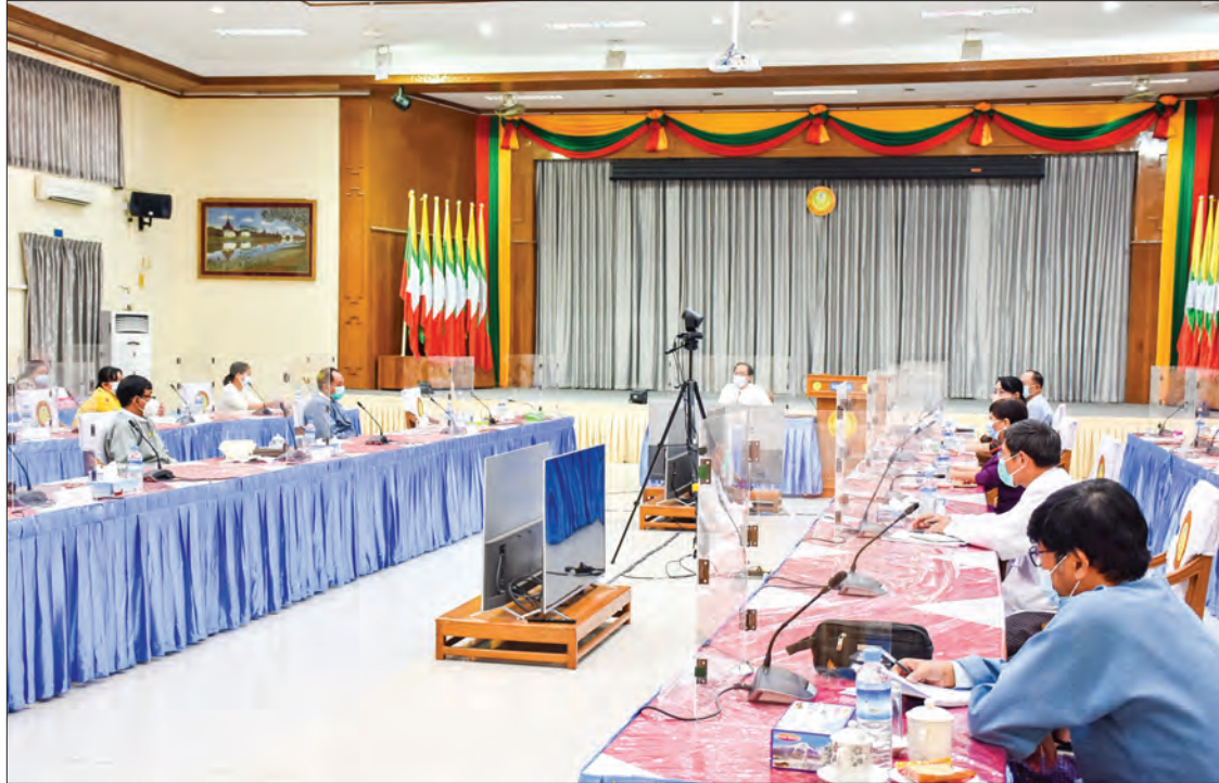
The MoHS Union Minister chairs the meeting on the Nay Pyi Taw hospitals' healthcare services yesterday.

He continued that the estimated budget for the procurement of medicines is K300