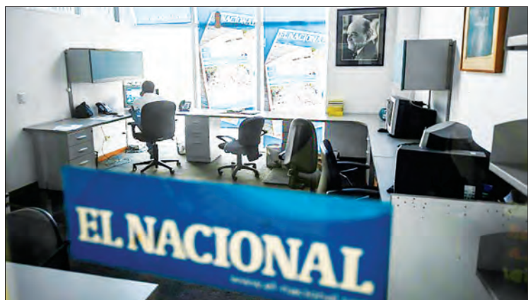
El Nacional newspaper once employed 1,100 people but is now down to a skeleton staff of 100 working on an online edition.

THE president of a Venezuelan newspaper hit with a $13 million damages judgment, on Monday