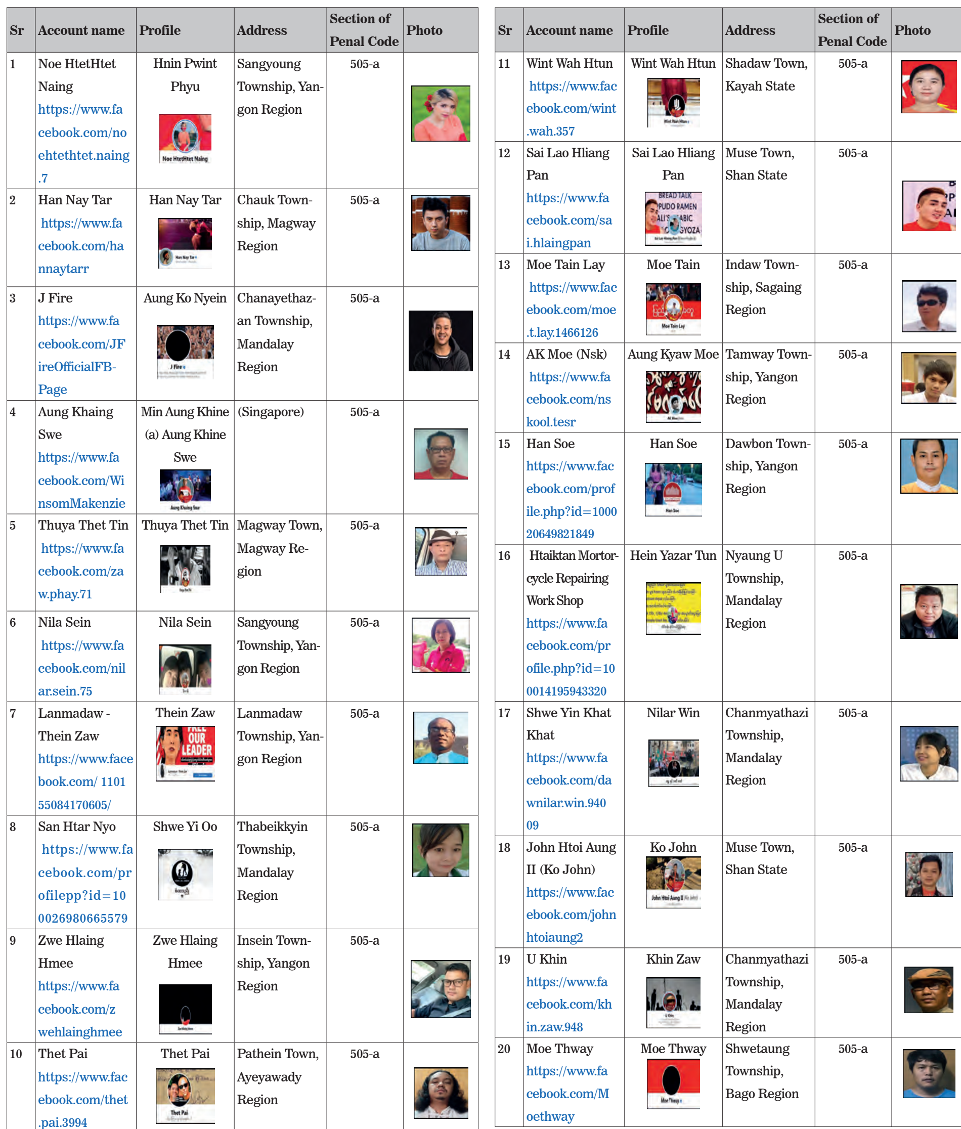
The list of people charged under Section 505-A of the Penal Code

Action will be taken against those who admit the offenders, and list of remaining offenders will be released. —MNA