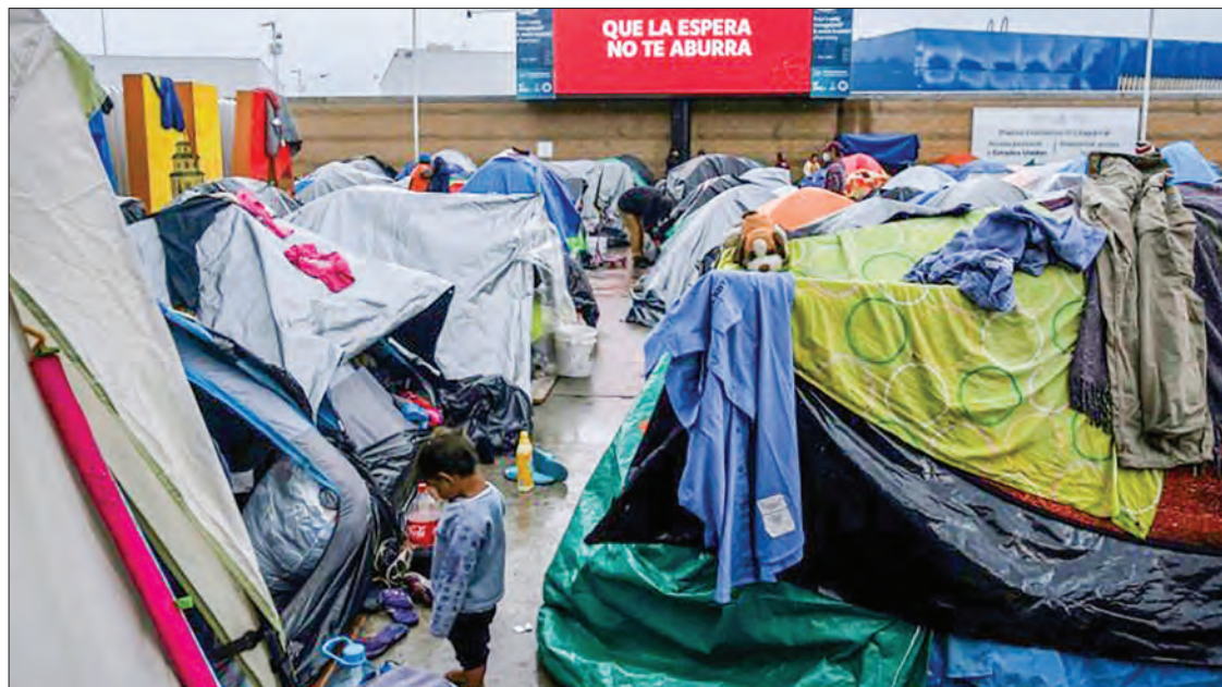
A migrant shelter in El Chaparral, Tijuana, Baja California state, Mexico where the number of children has increased dramatically.

"Most of the shelters I visited in Mexico are already overpopulated and cannot accommodate the growing number of children, adolescents and families migrating northwards,"