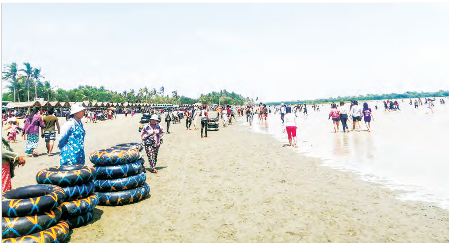
Local travellers are seen on the Sal Eain Tan beach during the Thingyan holidays.

The beach became famous in early 2017. When the water covers the beach’s sand, the vis-