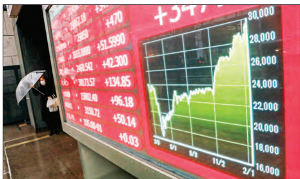
The Nikkei was down nearly two percent heading into lunch after investors took in calls for new states of emergency in the Osaka region and possibly Tokyo.

Both the Dow and S&P finished last week at new peaks and also posted their fourth consecutive weekly gains, following on the heels of strong data for American housing starts, employment and retail sales. But analysts said that a combination of dollar weakness and a lull in fresh data ahead of upcoming corporate results had conspired to tamp down enthusiasm. "It seems like