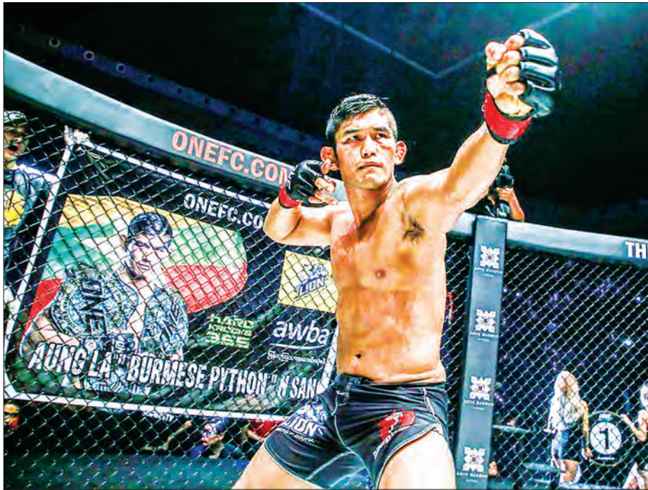
ONE Championship Light Heavyweight Champion Aung La N Sang will defend his title against Vitaly Bigdash in Singapore on 29 April.