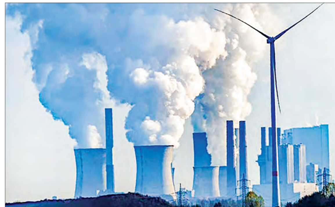
The IEA sees a 4.5-per-cent jump in coal demand, surpassing the 2019 level and approaching its all-time peak from 2014, as the biggest reason behind the rise in CO2 emissions.