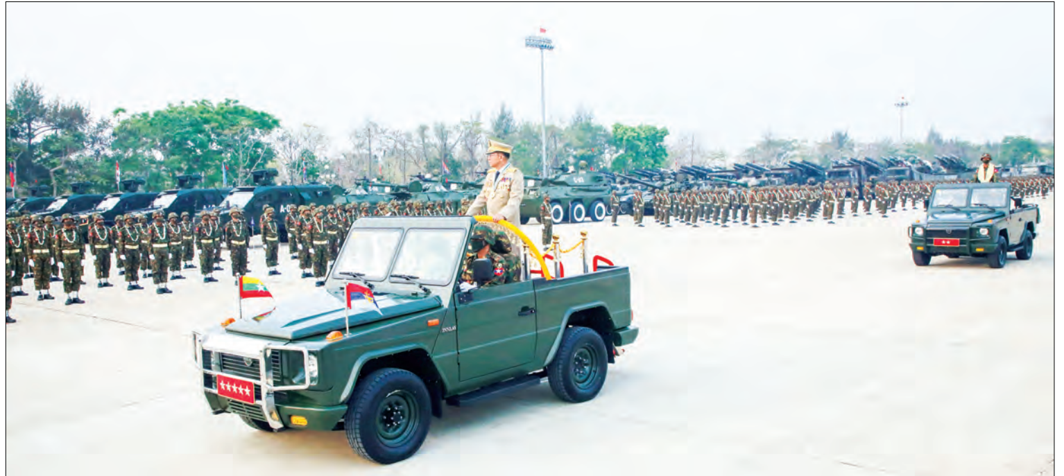
State Administration Council Chairman Commander-in-Chief of Defence Services Senior General Maha Thray Sithu Min Aung Hlaing is inspecting the Assembled Columns of Armed Force and Myanmar Police Force on 27 March 2021.

On 1 March 2021, at the 4/2021 meeting of the State Administration Council, the State Administration Council Chairman noted the instigating role of social media posts in spreading unrest and fuelling violence and emphasized that the security forces would continue to exercise utmost restraint and the lowest level of response possible in every situation, in line with international norms for riot control. A democratic system provides for people to express their likes