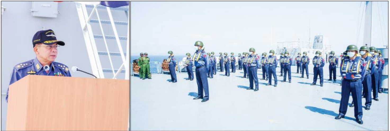
State Administration Council Chairman Commander-in Chief of Defence Services Senior General Min Aung Hlaing is giving strategic advice for the Sea Shield 2020 military firing practice drill onboard "Mottama" yesterday.

The Tatmadaw is conducting Army, Navy and Air military drills continuously to protect the sovereignty and territory of the country well and to enhance its defence capability. Naval ships, including submarine (Minye Thinkhathu) has been conducting the Three-Dimensional Naval Exercise-Sea Shield 2020 involving strategic aerial, surface and underwater operations and firing since 2 April this year in Myanmar territorial waters in the Bay of Bengal.