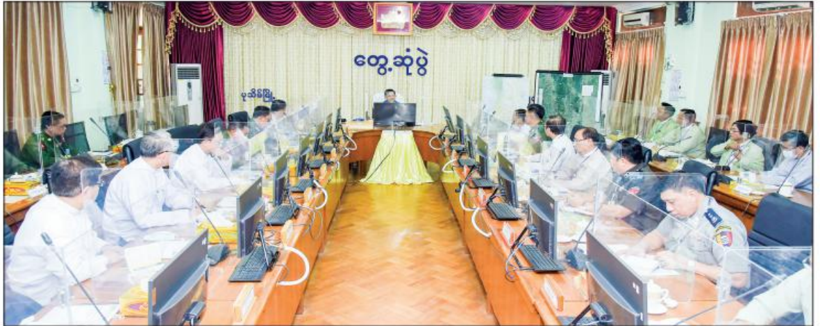
Chairman of State Administration Council Commander-in-Chief of Defence Services Senior General Min Aung Hlaing meets members of Ayeyawady Region Administration Council, and departmental staff on 10 April 2021.

Afterwards, the Senior General explained the implementation of the democracy system, saying the Tatmadaw studied the international practices of democracy during the term of previous Tatmadaw government before the democratic transition of Myanmar and shaped the process of democratic transition before pushing the country onto the democratic path aspired by the people by successfully holding the multiparty democracy election in accordance with democratic norms in 2010. It has been a decade since the democratic transition started and elections are the essence of democracy system. Even class leaders were elected based on will of the majority when we were at school. Elections are