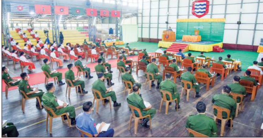
Chairman of State Administration Council Commander-in-Chief of Defence Services Senior General Min Aung Hlaing meets officers, other ranks, and families of Patheingyi Station on 10 April 2021.

T HE Tatmadaw is taking part in the leading role of national politics in accord with the 2008 Constitution, and it is a part of the State and the Tatmadawmen are also a part of the people. The Tatmadaw is an organization that defends the country. From the time independence was restored till today, the Tatmadaw has had striven to regain the independence and has been restoring the stability and tranquility. So, the history of the State and that of the Tatmadaw are inseparable. The leading role of national politics under the constitution is the political heritage given by the State. In the first