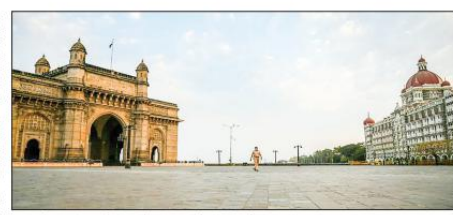
Deserted streets in Mumbai, in India's virus-stricken Maharashtra state.

FRESH lockdowns and curfews were imposed on tens of millions of people from India to Argentina as Covid-19 infections surged again and vaccine roll-outs were hampered by shortages and scares over side effects. In India, the worst-hit state of Maharashtra was running out of vaccines as the health system buckled under the weight of the contagion, which has killed 2.9 million people worldwide. Having let its guard down with mass religious festivals, political rallies and spectators at cricket matches, the world's second-most populous nation has added more than a million new infections since late March. Every weekend from Saturday until the end of April, Maharashtra's 125 million people will be confined to their homes unless travelling or shopping for food or medicine. "I'm not for the lockdown at all but I don't think the government has any other choice," media professional Neta Thagi, 77, told AFP in Maharashtra's megacity Mumbai. "This lockdown could have been totally avoided if people would take the virus se-