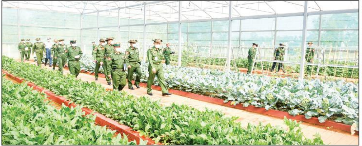
State Administration Council Vice-Chairman Vice-Senior General Soe Win inspects the agriculture and livestock works in Bahtoo Station yesterday.

They also visited the Paungsee Farm (Bahtoo San) at Tat-