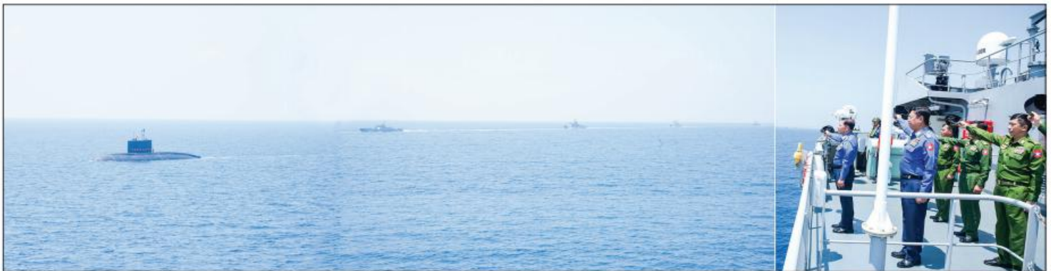
The submarine (Minye Thinkhathu), surface ships and helicopters of the Tatmadaw (Air) are saluting Senior General Min Aung Hlaing in Single Line Formation.