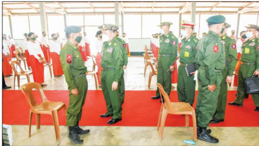
State Administration Council Vice-Chair Vice-Senior General Soe Win is greeting officers, other ranks, families and cadets in Yamethin Station yesterday.

He then said the security forces allowed the peaceful protesters to stage their strikes between 4 and 22 February freely. But the protestors committed attacks on factories and industries, including police stations, courts and township administrative offices, later 22 February. They