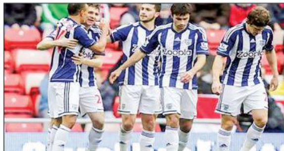
In a letter to lawmakers, a number of bodies including the Football Association, Premier League, Rugby Football Union and England and Wales Cricket Board said current social distancing rules would be "insufficient to end sport's Covid financial crisis".

Test events are being launched over the coming weeks as part of the government's