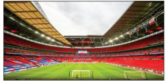
Wembley will allow 25 percent of its seats to be filled at least for the first four matches due to be played there at this year's European Championship.

The number of spectators allowed in stadiums looks set to vary considerably across the eight venues, with Saint Petersburg and Baku confirming they will allow crowds at 50 percent of capacity and Budapest aiming to allow 100 per cent capacity "but with strict stadium entry requirements for spectators." —AFP ■