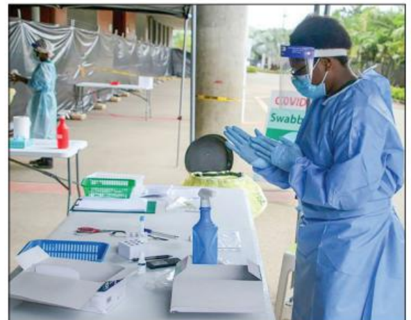
A sports stadium in Port Moresby is being used as a makeshift Covid-19 clinic.

About 40 per cent of the 1,600 staff at the Port Moresby General Hospital have agreed to be vaccinated, according to health officials, while doses will also be sent to hotspots including Lae, Goroka and Vanimo. But beyond securing vaccines, Wong said a major hurdle is convincing people to get the jab in a country where adult vaccination programmes are rare and virus misinformation is rife. —AFP ■