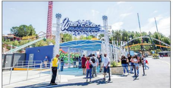
The rollout of vaccines has raised hopes that economies can begin to reopen and allow people to get back to a semblance of pre-pandemic life.

Confidence that global growth will soar as vaccines allow economies to open has for now overtaken worries that the re-