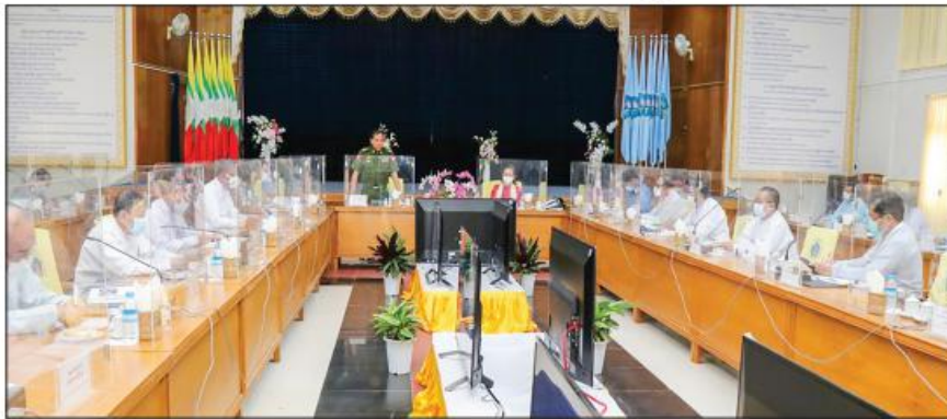
Union Minister Lt-Gen Tun Tun Naung chairs the coordination meeting (1/2021) of the National-level Committee on Resettlement and Closure of IDP Camps yesterday.

At the meeting, Union Minister for Border Affairs Lt-Gen Tun Tun Naung, in his capacity as the Chairperson of the National-Level Committee, discussed policy and procedures to be implemented by the committee, formation of regional level committees and working committees, continued programmes to protect