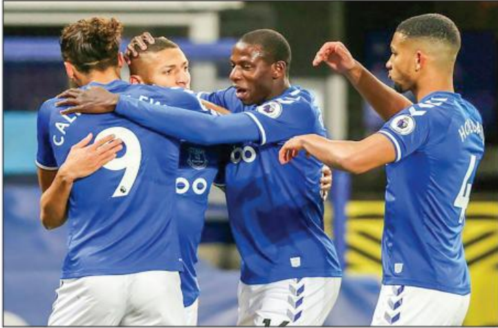
Everton have not qualified for the Champions League since 2005.

MANCHESTER City already have one hand on the Premier League trophy but the battle for the top four is likely to go down to the wire as a clutch of clubs seek to join Europe's elite next season.