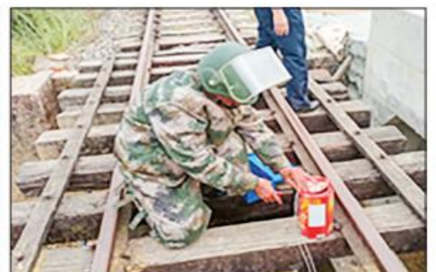
Military engineers are clearing the handmade mine.