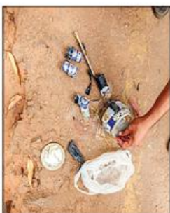
Pieces of handmade grenades and mines after attack on security forces.

Security forces are investigating to take action against the perpetrators of the vandalism in accordance with the law, according to the statement of the Myanmar Police Force.—MNA