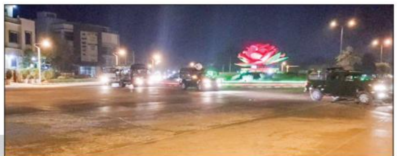
Tatmadaw, police and fire brigade members take security measures at night in Nay Pyi Taw.

Tatmadaw, police and fire brigade members also jointly conduct security measures for the peaceful night and community peace in respective regions and states and keep serving security measures the whole day.—MNA