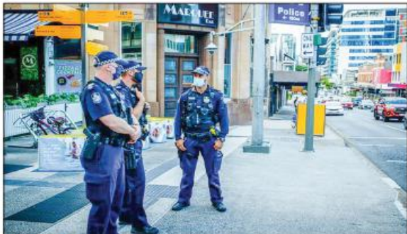
Brisbane's three-day lockdown was ordered Monday, forcing schools, restaurants and bars to close after an outbreak in the city.

STAY-AT-HOME orders for more than two million people in Australia's third-biggest city Brisbane were lifted Thursday, ending a snap coronavirus lockdown just ahead of the traditionally busy Easter holidays.