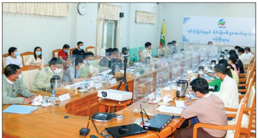
The MIFER deputy minister presides over the coordination meeting on development projects aided by the EU.

underscored on the importance of information exchange and urged to update over the implementation constraints to the respective development partners including to explore possible options for the national priority projects. He also added that the Ministry of Investment and Foreign Economic Relations would facilitate for the matters that need to be consulted between the relevant ministries and development partners. The totally 25 representatives from the relevant ministries and organizations participated in the meeting. The Coordination Meeting on the projects funded by French (AFD) and the Federal Republic of Germany was also held on 31 March 2021.—MNA