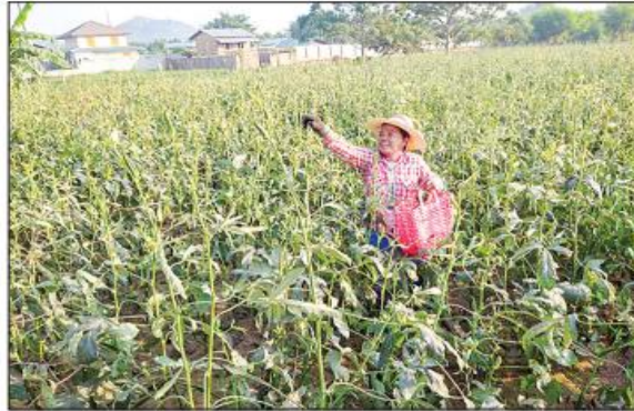
Consuming okra can help people fight against cancer and reduce stress and cure kidney and liver diseases and diabetes.

"I have four acres of farmland. We could not grow the paddy because those farmlands are sandy soil and are located next to the Zaw Gyi river. I have six family members, and I need to use the farmlands effectively to have family income. Now, I have cultivated seasonal crops such as okra, dregea volubilis , eggplant, rosselle, radish and safflower. But, I have cultivated okra for one acre. We don't have to spend the labour charges because family members help grow those seasonal crops. However, the cultivation of the seasonal crops cost over K100,000. Okra takes over 60 days in total from cultivating to harvest, both in the dry season and in winter. We harvest every two days at first, and then, as more plants mature, we harvest every day. About 12 visses of okra have yielded on the first harvest. As there is abundant yield, we have got about 60