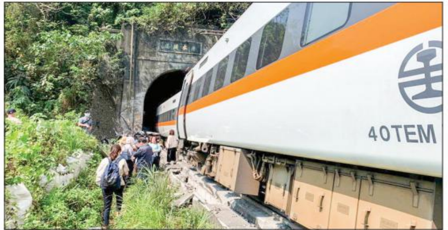
People walk next to the train which derailed in a tunnel north of Hualien in Chinese Taipei on Friday morning. Dozens of passengers were feared killed.

"We broke the window to climb to the roof of the train to get out."