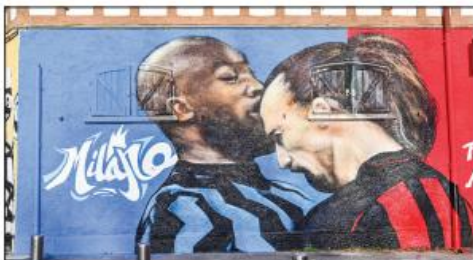
Zlatan Ibrahimovic and Romelu Lukaku's fines for squaring off in a row during an Italian Cup match will be donated to charity, their rival Milan clubs said on Thursday.

ZLATAN Ibrahimovic and Romelu Lukaku's fines for squaring off in a row during an Italian Cup match will be donated to charity, their rival Milan clubs said on Thursday.