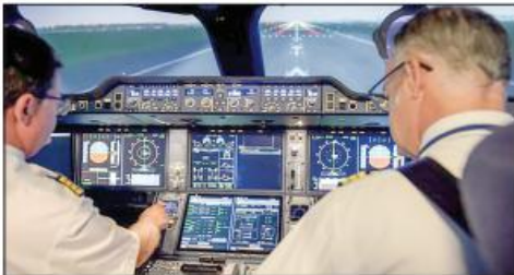
United Airlines announced Thursday it will immediately start hiring pilots, beginning with a group of 300, to be ready to meet growing demand for air travel.

-- has reinforced the view among investors that the US economy will run hot, with analysts saying its corporate tax implications were also being put aside for now.—AFP ■