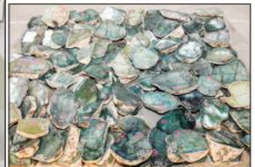
Sales of pearl and gems lots in Myanmar kyat for April 2021 will last ten days from 1 to 10 April. During the period, the emporium will sell 317 lots of pearl, 2,148 lots of jade, and 199 lots of gems to local gem merchants through open tenders.

today's displayed. But, current pieces of pearl are appropriate for the domestic market. As stocks are set at fair prices, buyers are expected to obtain benefit. I think if I sell out this pearl, I will get profit," said a gem merchant who viewed