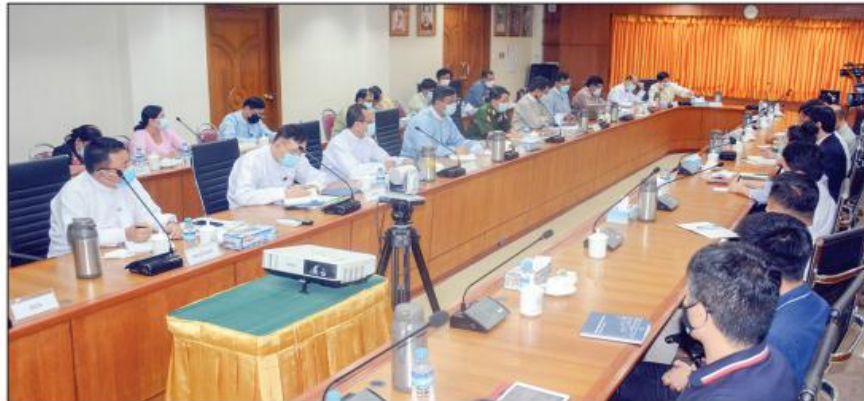
The MoC Deputy Minister hold talks with foreign investors on ensuring the seamless flow of trade and goods yesterday.

The departmental officials also discussed matters related to the trade, banking, jetty, arrival visa, investment and export and import permits.