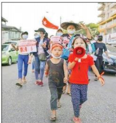
As such, international organizations like UNICEF, which takes exceptional care of children, should object and protest the children against exploitation.

MEMBERS of NLD and its extremist followers commit incitements through various ways and means for the people to reach the roads, utilizing children who are immature, innocent in politics in the frontline of riotous protests.