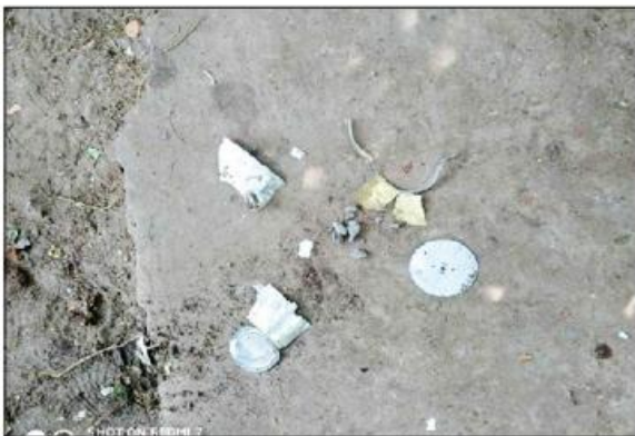
Pieces of handmade mine seen after attack on security forces.

ACCORDING to a statement from the Myanmar Police Force, the rioters have accelerated acts of sabotage in accordance with the methods used by the terrorist groups, across the country.