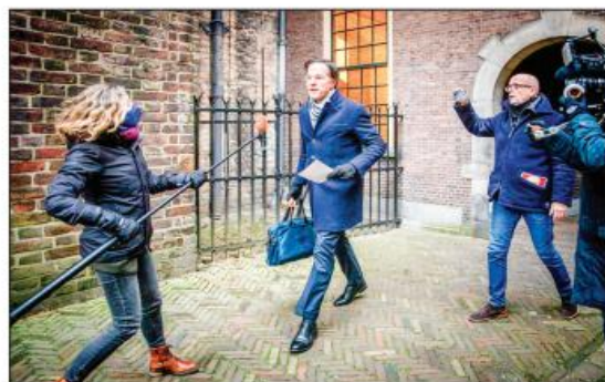
Dutch Prime Minister Mark Rutte.

The name of CDA lawmaker Pieter Omtzigt's name appeared in the notes with the words "position elsewhere" — widely seen as meaning that he should be given a ministerial post to keep him quiet. —AFP ■