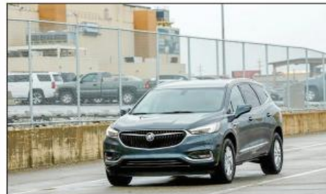
GM reported higher US sales in the first quarter, but inventories dwindled amid the industrywide semiconductor shortage.

dence, but a semiconductor shortage that has crimped production raises questions about supply in coming months.