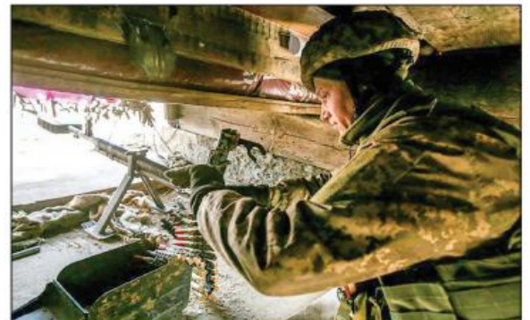
Ukraine has been locked in a conflict with Russian-backed separatists since 2014.

seeking to create "a threatening atmosphere" as Kiev hopes to resume a ceasefire brokered last year.