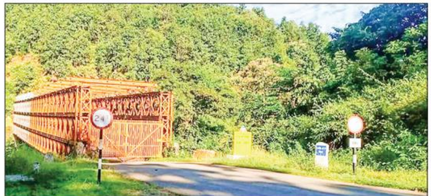
There are two Myanmar-India border crossings in Tamu township No 1 checkpoint and No 2 checkpoint.

There are two Myanmar-India border crossings in Tamu township No 1 checkpoint and No 2 checkpoint. Border trade between Myanmar and India hit US$145 million as of 19 March in the current financial year 2020-21 ending September, said a statistical report of Myanmar's Commerce Ministry.