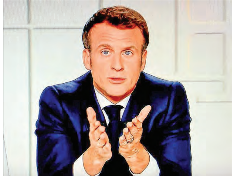
French President Macron speaking on television on Wednesday night.

More than 53,000 new cases were announced late Wednesday, but that number covered two days after no numbers were made public on Tuesday. —AFP ■