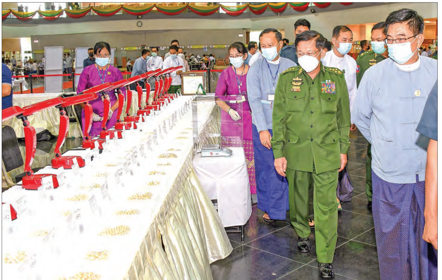
State Administration Council Chairman Senior General Min Aung Hlaing is looking around the pearl lots displayed at the Mani Yadana Jade Hall in Nay Pyi Taw yesterday.

Officials presented a video presentation on preparation to successfully hold the gems emporium in April 2021 to the Senior General.