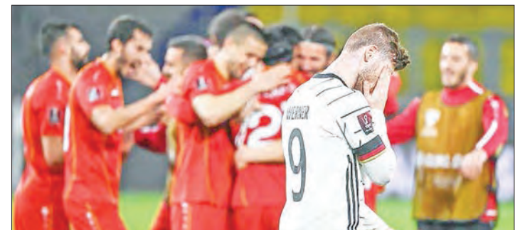
Germany’s performance was dubbed “embarrassing” after they suffered their first World Cup qualifying defeat for 20 years in a humiliating 2-1 home loss to North Macedonia which heaped pressure on coach Joachim Loew.

“Nasty Surprise” said football magazine Kicker while Frankfurt-based daily FAZ opted for “Rude awakening for the German team”. —AFP ■