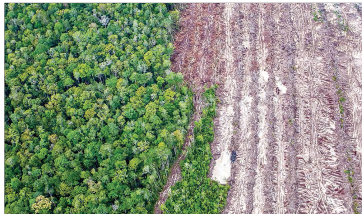
This image shows the aftermath of cutting down trees and although there is land to build homes or anything else by cutting down trees, one tree decreases the amount of clean air (oxygen) we might be able to get.