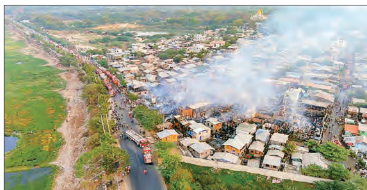
Fire broke out in Pyigyitagun Township in Mandalay Region.

Similarly, in Yangon Region, Ruby Mart located at the corner of Pansodan Road and Bogyoke Aung San Road, Yangon was also burned down around 2 am yesterday, and a fire broke out at Gandhama Wholesale located in Mayangon Township at the same time yesterday morning. — MNA