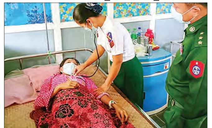
Military medics seen caring for local patients at township hospitals.

Similarly, the Tatmadaw medical team provided healthcare services to patients at Kume Hospital in Myittha Township, Mandalay Region. Officials from respective commands also inspected the hospitals' medical services. They comforted the patients by providing food aids and necessary things. Locals are reportedly satisfied with the medical support of Tatmadaw. — MNA