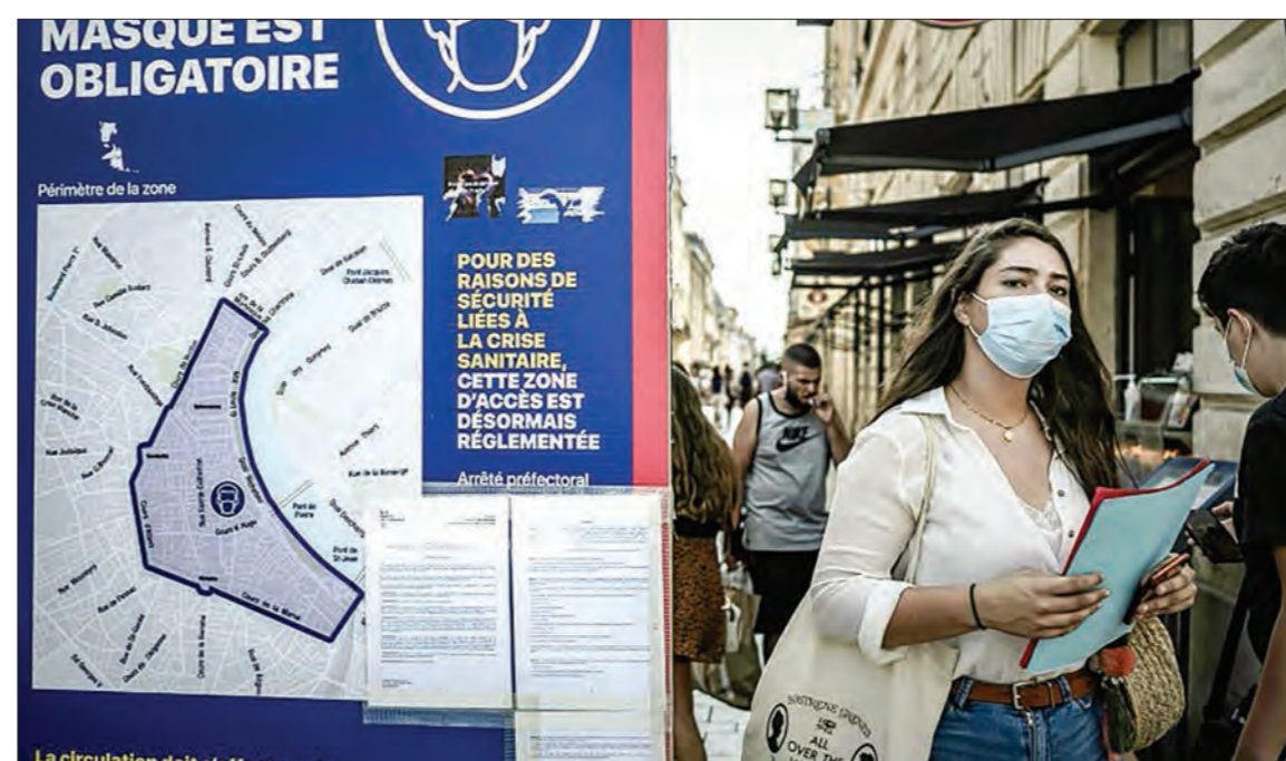
In recent months, some European countries like France and Spain have seen a quick increase in cases.