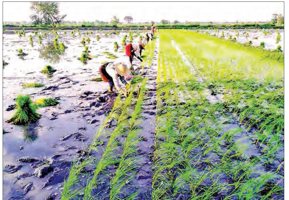
In the 2021 summer crops cultivation season, the department targeted to cultivate 19,804 acres of summer paddy and 31,660 acres of summer sesame in the whole township.

In the 2021 summer crops cultivation season, the department targeted to cultivate 19,804 acres of summer paddy and 31,660 acres of summer sesame in the whole township. The local growers started producing the summer corps in their farmland to meet the expected target. They are growing a variety of summer paddy species such as Ayar Min, Ma Naw Thuka, Hsin Thuka, Paw San Yin, said a paddy grower from Shwebo village, Pwintphyu Township. — Ye Win Naing (IPRD)/GNLM