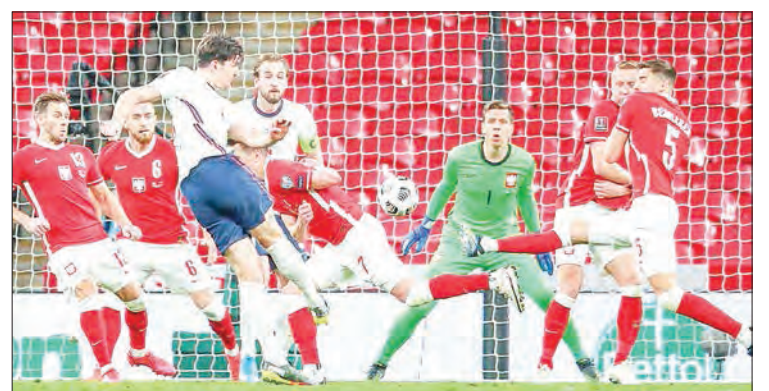
Harry Kane became England’s all-time leading penalty scorer on Wednesday as Gareth Southgate’s side beat Poland 2-1 to make it three wins out of three and seize control of their World Cup qualifying group.

Manchester City midfielder Phil Foden headed over from a Chilwell cross early in the game as the hosts started on the front foot. —AFP ■