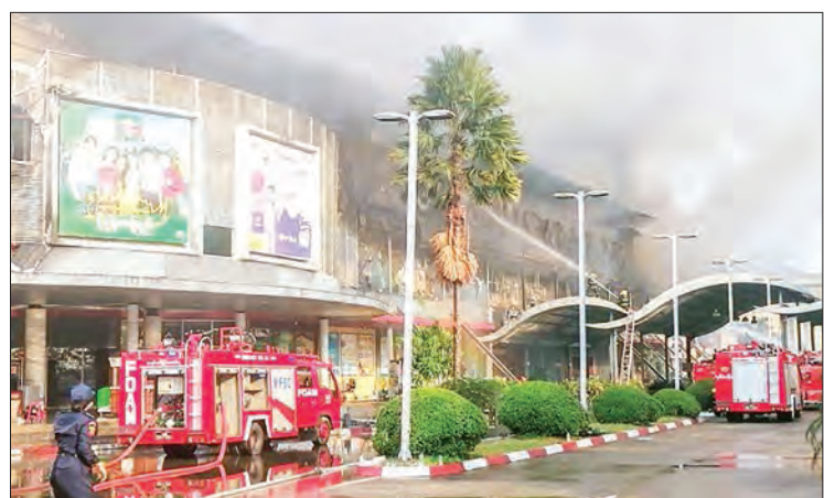
Gandhama wholesale in Mayangon township on fire.