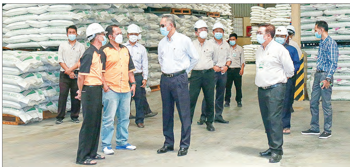
The MIFER Union Minister makes an inspection tour around the Myotha Industrial Zone in Mandalay Region yesterday.

Then, the Union Minister highlighted the strategic location of Myotha Industrial Zone, which is situated at the intersection of highway, waterway and airway in Mandalay Region,