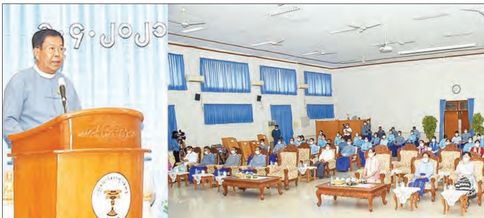
UCSB Chair U Than Swe addresses the 84 th anniversary in Nay Pyi Taw yesterday.

THE Union Civil Service Board held the commemoration ceremony to celebrate the 84th anniversary of the foundation of the Union Civil Service Board, in accordance with the COVID-19 rules and regulations set by the Ministry of Health and Sports yesterday morning in Nay Pyi Taw.