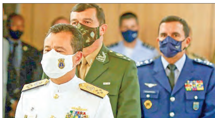
Brazil's new navy commander Admiral Almir Garnier (L), Army commander General Paulo Sergio Nogueira de Oliveira (2-L) and new Air Force commander Brigadier Carlos Almeida Baptista Jr (R) attend their presentation ceremony.

Braga Netto said the trio would all be "faithful to their constitutional missions of defending