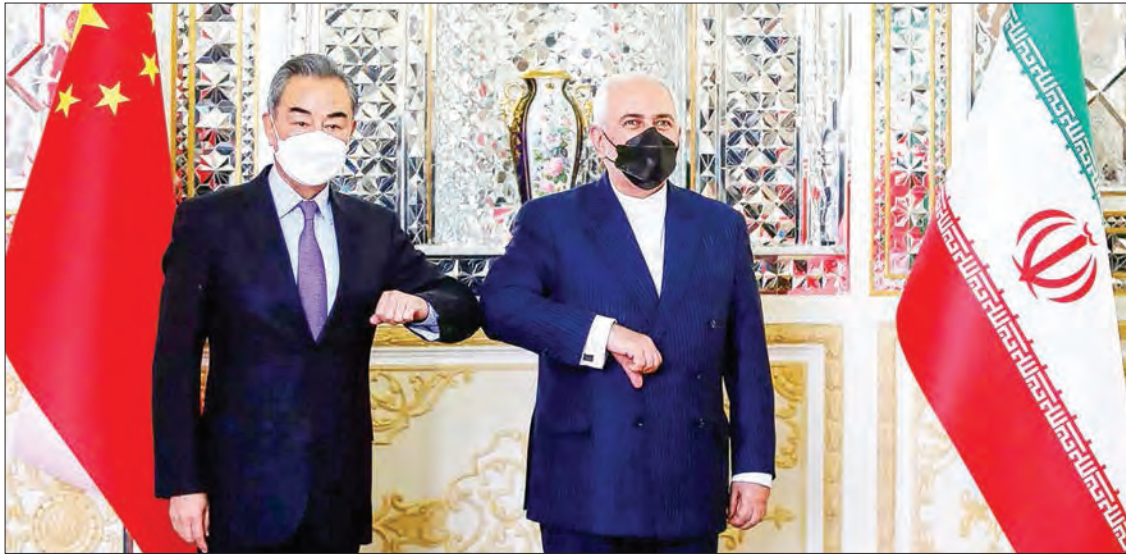
Iranian Foreign Minister Mohammad Javad Zarif (R) greets his Chinese counterpart Wang Yi (L) in Tehran on March 27, 2021 as the countries sign a cooperation pact.

THE United States said Wednesday that it has a shared interest with Beijing in curbing Iran's nuclear programme, declining to fan the flames over a 25-year cooperation pact signed by the