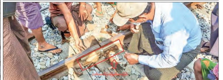
Perpetrators are destroying rail tracks and MR staff are making repair work.