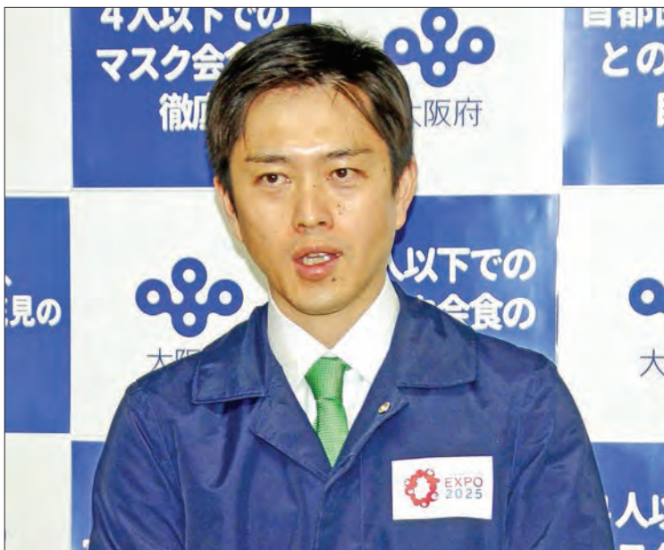
Osaka Gov. Hirofumi Yoshimura speaks in Osaka on April 1, 2021.

relay to adhere to the forthcoming measures, which may see businesses fined for not complying with restrictions such as on operating hours.