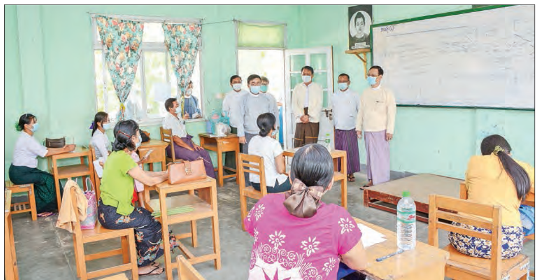
Union Minister Dr Nyunt Pe and party are inspecting the training courses on Grade 7 and Grade 10 new curriculums in Nay Pyi Taw yesterday.

He also said the teachers should have goodwill and sympathy in serving their duties. The teachers can present their difficulties regarding the schools and the needs of the students. The officials will provide proper teaching materials and facilities, including toilets, as quickly as possible. The teachers should clean up the school compound. They need to train the students to keep their schools and classrooms clean. Then, the Union Minister and party inspected the training courses and comforted the trainee teachers.—MNA