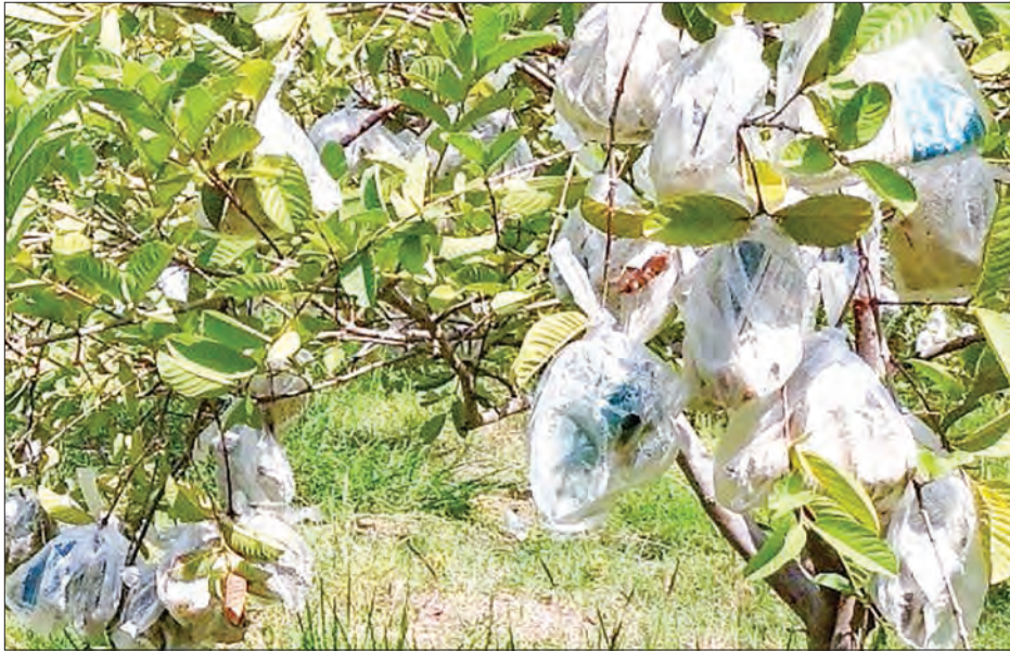
Guava is considered a nutritionally-valuable and remunerative crops. The fruits are consumed widely in the country where retailers traditionally sell the fruits mainly in the markets and near bus stops.

more than 100-kilo guava trees on a manageable scale for four years to earn family extra income.