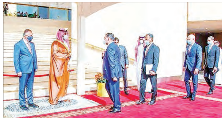
Iraqi Prime Minister Mustafa al-Kadhemi (L) walks a diplomatic tightrope as Baghdad often finds itself caught between Tehran and its rivals Riyadh and Washington.

Kadhemi said the group's claim was "not true" and insisted that the attack was not launched