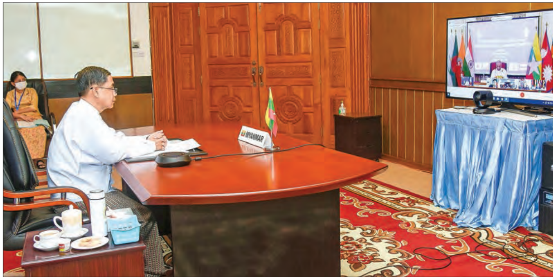
The MoIC Union Minister joins the 17th BIMSTEC Ministerial Meeting online from Nay Pyi Taw yesterday.

In his statement, Union Minister U Ko Ko Hlaing, among others, stated that it was necessary for BIMSTEC to overcome the challenges through cooperation