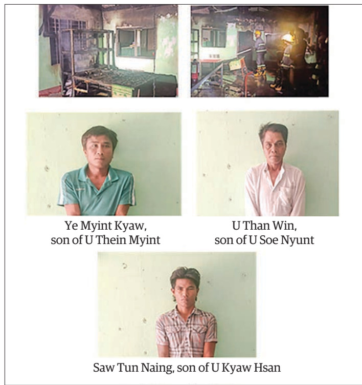
Twenty-year jail sentence with labour against arson attackers seen above.

Myothit (North), Dagon Myothit (South), Dagon Myothit (Seikkan) and North Okkalapa townships in Yangon Region and rioters managed to prevent the fire engines from fighting the fires. These places were put under Martial Law on 14 and 15 March. It has already announced 23 types of crimes to be heard by the military tribunal in these areas. So severe actions would be taken against those who would commit any of these crimes.—MNA