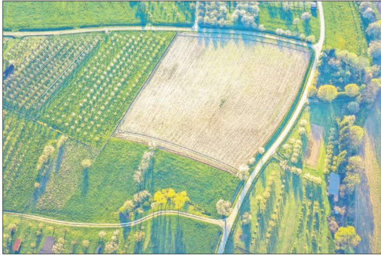
Rising demand in wealthy countries for dozens of commodities ranging from coffee to soybeans has stepped up the pace of deforestation in the tropics.

RISING demand in wealthy countries for dozens of commodities ranging from coffee to soybeans has stepped up the pace of deforestation in the tropics, researchers said Monday.