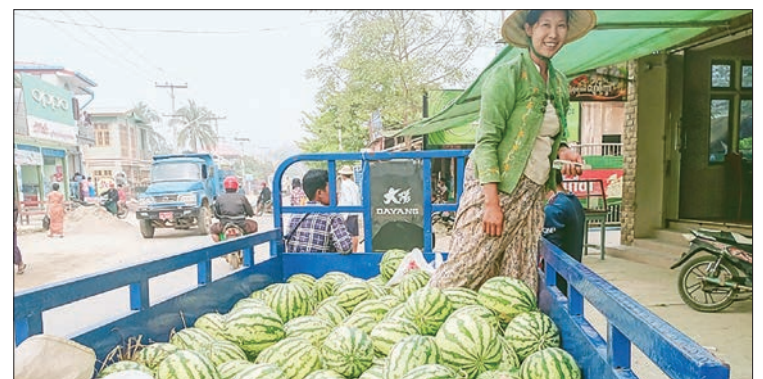
More than 1,000 trucks of watermelon are now stranded in Muse 105th mile zone.

Myanmar yearly exports over 800,000 tonnes of watermelon and about 150,000 tonnes of muskmelons to China, the association stated.—Hlaing Bwa/KK/GNLM