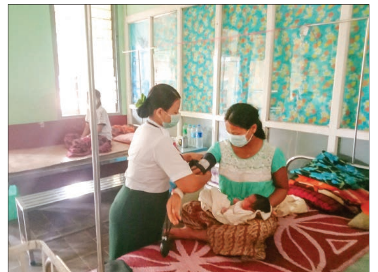
Tatmadaw medics seen providing healthcare services to locals at the Latpadan people's hospital.

Officials from respective commands also inspected the hospitals' medical services. They comforted the patients by providing food aids and necessary things. Locals are reportedly satisfied with the medical support of Tatmadaw. — MNA