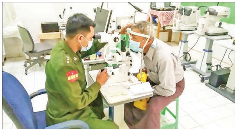
A local gets eye-tests at the military hospital in Kengtung.

MILITARY hospitals in the townships of regions and states keep providing medical treatments to the people to solve their health-