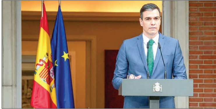
In this handout picture made available by La Moncloa, Spanish Prime Minister Pedro Sanchez holds a press conference at La Moncloa palace in Madrid to announce his cabinet reshuffle on March 30, 2021.

Pablo Iglesias, the leader of the far-left Podemos party, was replaced as vice president