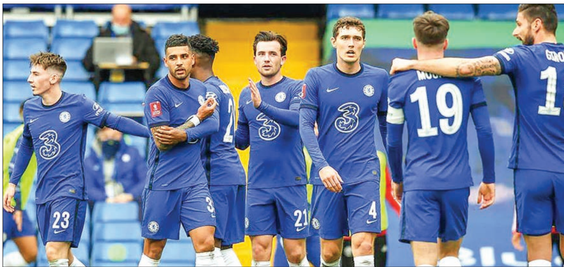
Both legs of the Champions League quarter-final between Portuguese club Porto and Premier League side Chelsea will be played in Seville, Spain, due to Covid-19 travel restriction.

BOTH legs of the Champions League quarter-final between Portuguese club Porto and Premier League side Chelsea will be played in Seville, Spain, due to Covid-19 travel restrictions, UEFA confirmed on Tuesday.