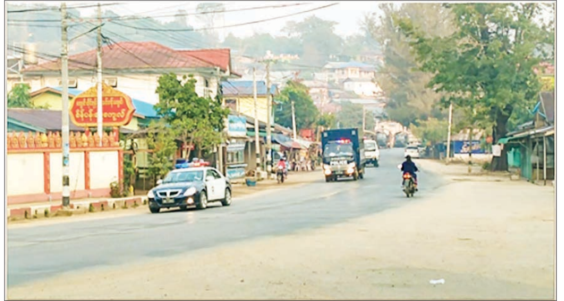
Tatmadaw, Police Force and Fire Brigade makes the joint security measures starting 14 February.

TATMADAW, Police Force and Fire Brigade jointly conducted security measures to ensure the State's stability, security of people, the rule of law and