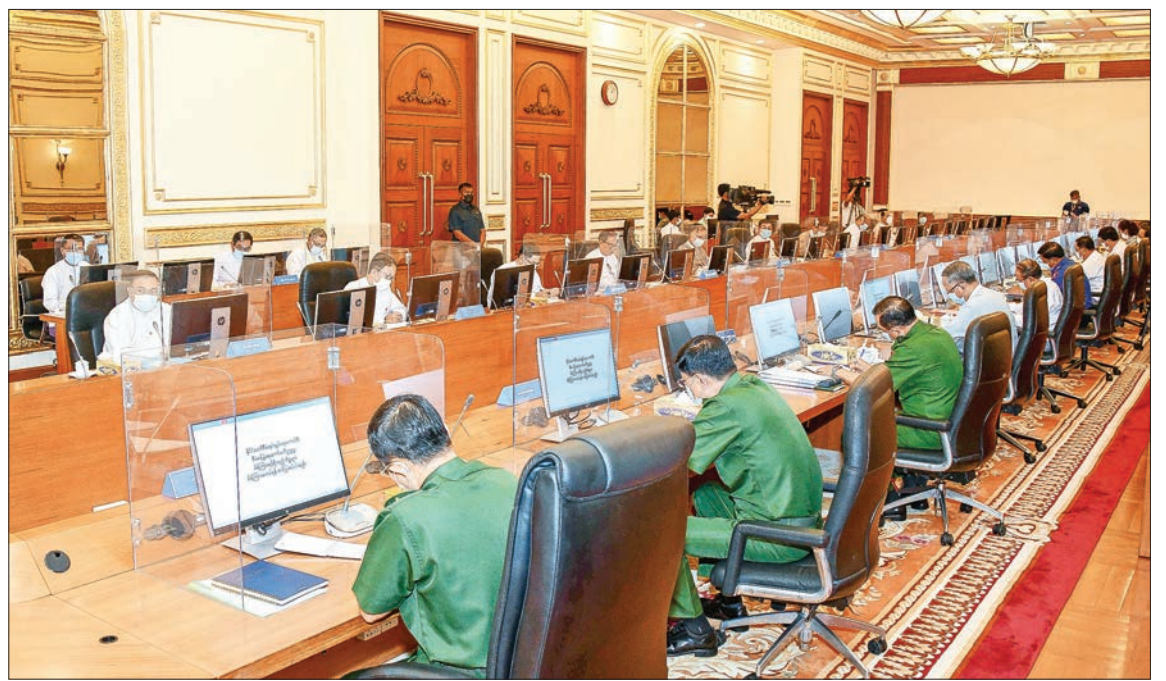
State Administration Council Chairman Senior General Min Aung Hlaing presides over and addresses the SAC Management Committee meeting 4/2021 on 31 March 2021.

THE Management Committee of the State Administration Council held a meeting 4/2021 at the meeting hall of the State Administration Council Chairman's Office in Nay Pyi Taw yesterday afternoon, attended with an address delivered by Chairman of the State Administration Council Commander-in-Chief of Defence Services Senior General Min Aung Hlaing in his attendance.