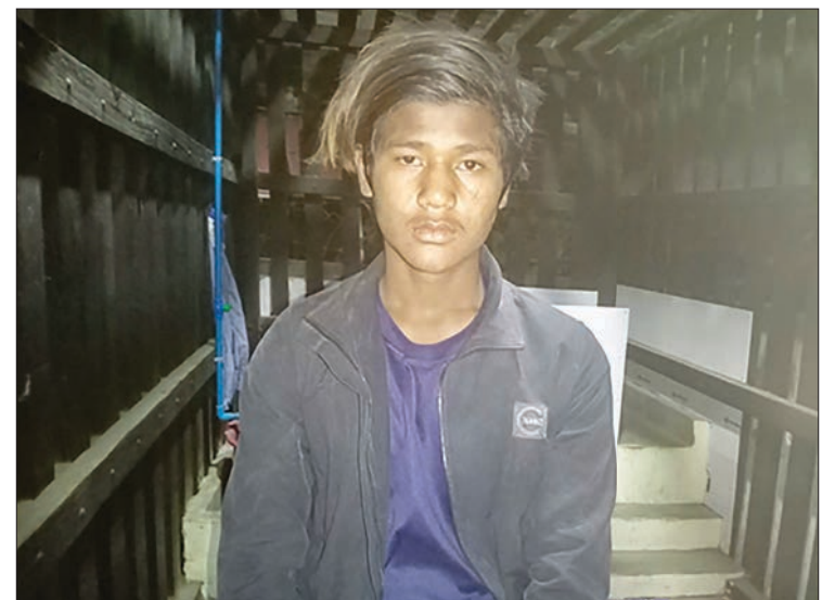
One of the eight suspects under arrest for killing police officer in Mandalay.

It is reported that the arrest of those who brutally killed the police officer is underway.