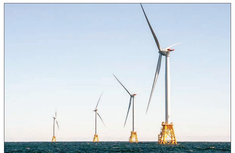
Wind turbines of the Block Island Wind Farm off the coast of Rhode Island in October 2016: the Biden administration has announced it plans major investment to boost offshore wind farms.

The move should cut 78 million tons of carbon dioxide emissions, the White House