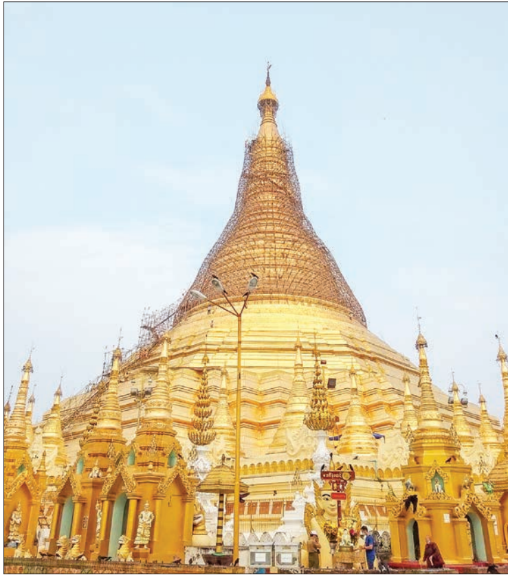
The Shwedagon Pagoda is systematically covered in scaffolding, and gold coating is being carried out with over 11,000 coated gold sheets.

The Shwedagon Pagoda was reopened to the public on 8 March, and about 70,000 pilgrims have visited the pagoda to date. It is reported that the Board of