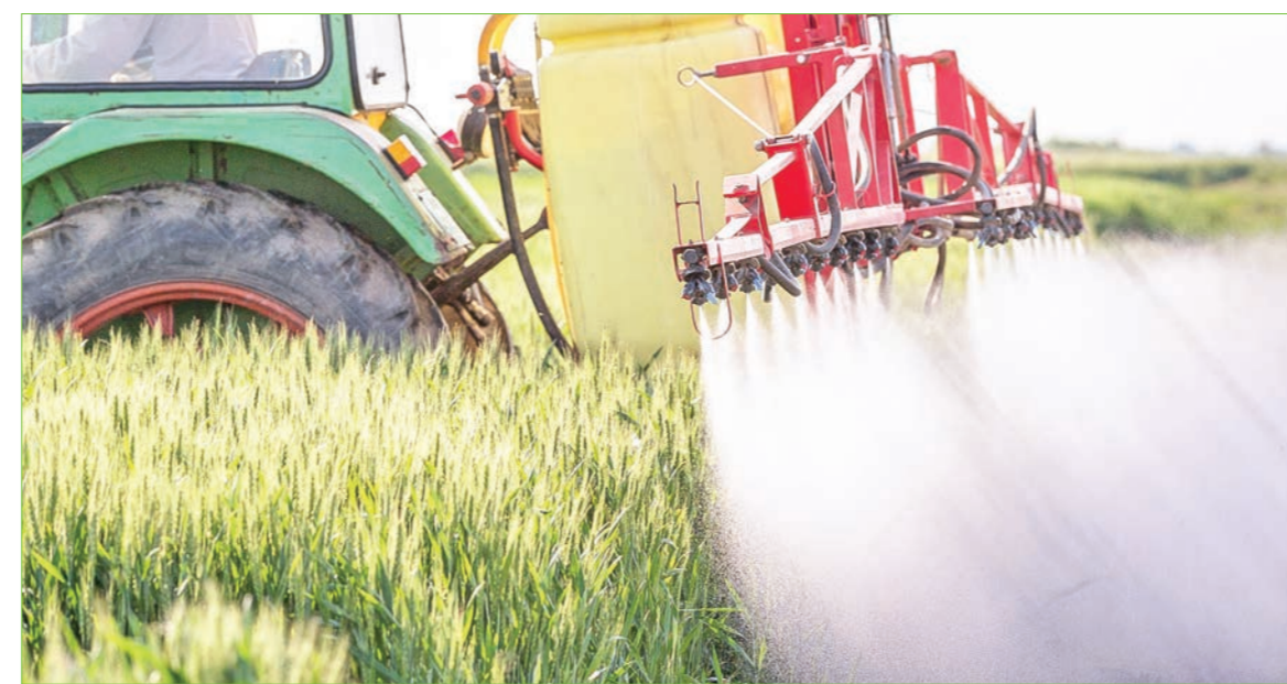
Insecticides, herbicides and fungicides, collectively known as pesticides, are chemicals that are used in agricultural pest control.

The study, published in Nature Geoscience, found that overall 64 per cent of global agricultural land --approximately 24.5 million square kilometres