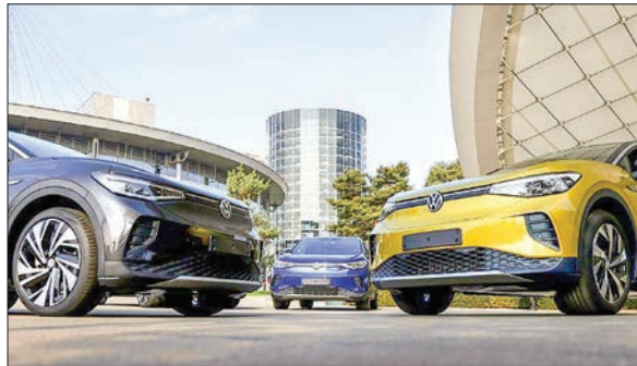
A Volkswagen spokesman said the "Volkswagen" rebrand was a joke.

VOLKSWAGEN US' subsidiary is keeping its name and will not rename itself "Volkswagen," a company spokesman said Tuesday, confirming that an earlier announcement was an April Fool's joke that may have gone further than intended.