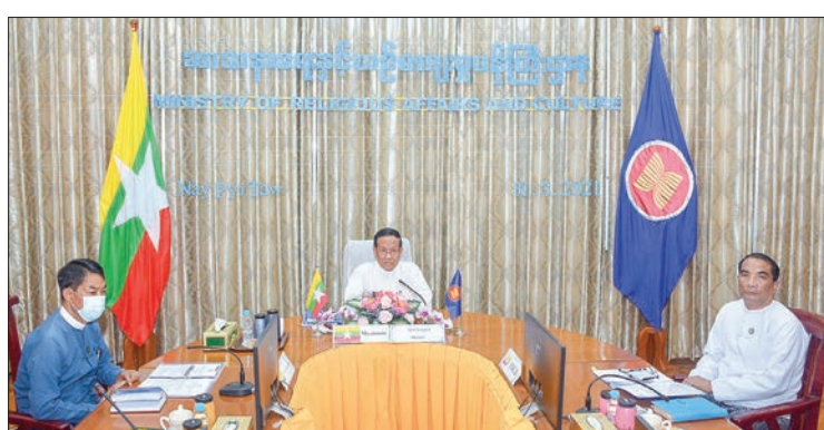
Myanmar delegation led by the MoRAC Union minister participates in the online 25th ASEAN Socio-Cultural Community Council Ministers Meeting yesterday.

The meeting focused on the priority areas of the ASEAN Socio-Cultural Community Pillar, the activities carried out