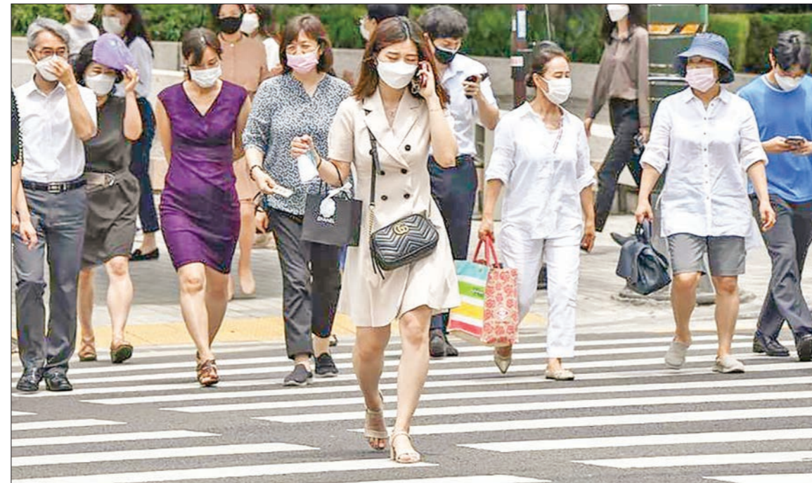
A new report shows the world is not on track to close the gender gap for another 135.6 years. Pedestrians wearing face masks cross the road in central Seoul on June 23, 2020.

The WEF pointed to a study by the UN's International Labour