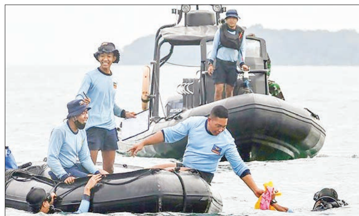
Divers had been searching the Java Sea for the missing voice recorder -- one of the plane’s two “black boxes”.

But investigators had said it was too early to pinpoint an exact cause. The cockpit voice recorder could provide vital clues to what the desperate crew was saying when the flight from Jakarta to Pontianak in Borneo went down.