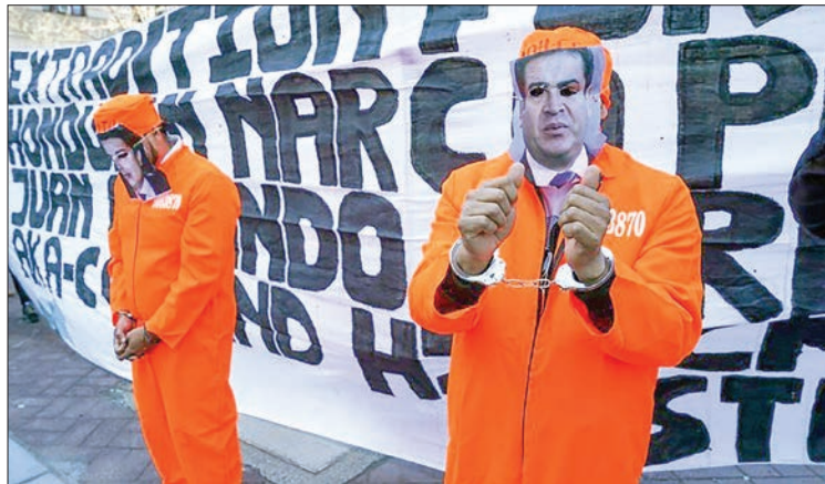
Protestors celebrate outside the US District Court Southern District of New York on March 30, 2021 after Juan Antonio “Tony” Hernandez, brother of the president of Honduras was sentenced to life for drug trafficking offenses.

HONDURAN President Juan Orlando Hernandez’s brother was sentenced to life in prison