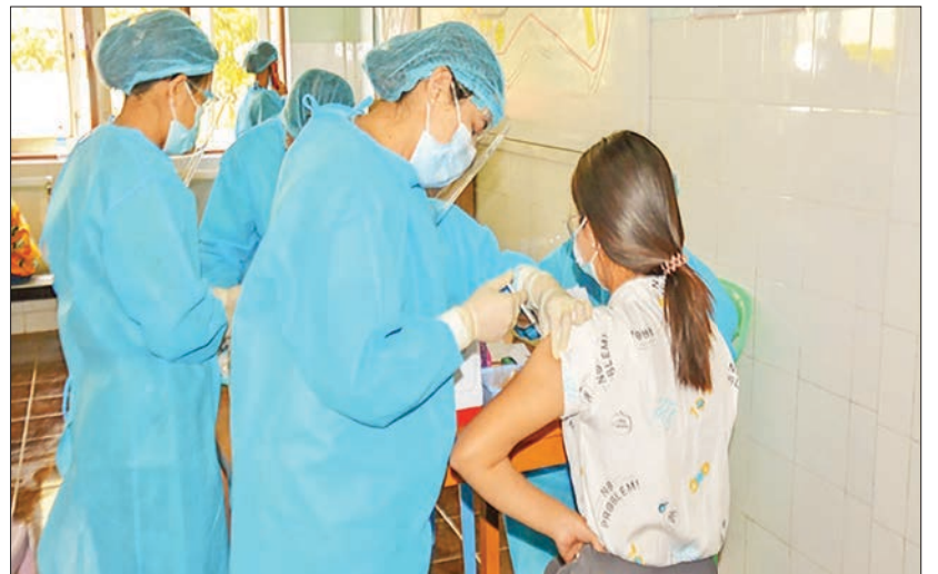
COVID vaccination programmes are underway with added momentum under the State Administration Council's management.

The Ministry of Health and Sports will use the first doses of 1.5 million vaccines, and it also has enough vaccine for the second dose. Moreover, arrangements are being made to receive more vaccines for the people. — MNA