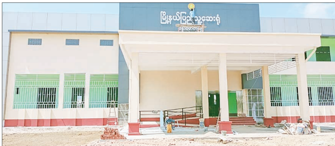
The extended 500-bed hospital building is 16,800 square feet wide, with two operation-rooms and a maternity ward.

THE construction of an extended two-storeyed building in Bamauk township People's hospital compound in Katha district, Sagaing region, has nearly completed.