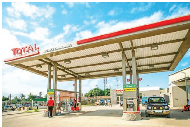
A deadly assault by Islamic State-linked militants in Mozambique could delay plans by Total to build a massive liquefied natural gas facility, analysts warn, although the project is still likely to go forward.

Total and its partners plan to invest $20 billion in the project, and raised nearly $15 billion in financing last year, the largest amount ever for a project in Africa. —AFP ■