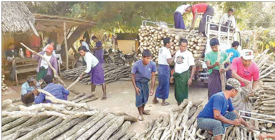
Authorities submitted a proposal to UNESCO in March 2021 to include Myanmar Thanaka on the representative list of the intangible cultural heritage of humanity.