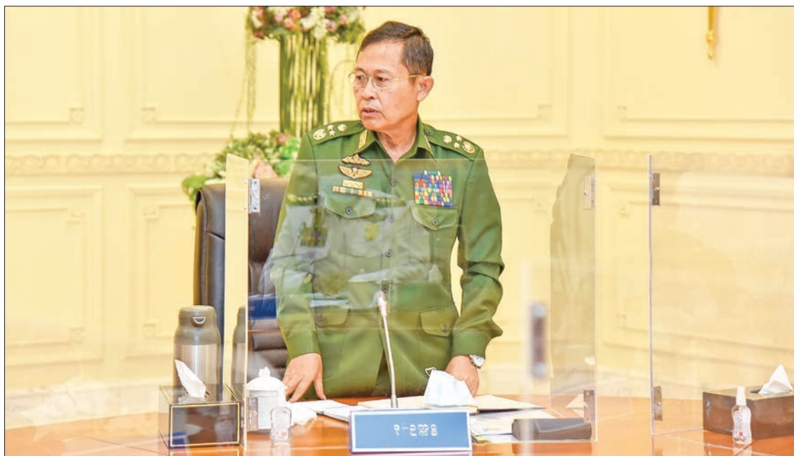
The Vice-Chairman of the Council Deputy Commander-in-Chief of Defence Services reported on security arrangements, riotous and violent organizations' attempts to commit destructive acts, and future plans to take regional security.

Peaceful protests were staged as of the third day when the Tatmadaw took responsibilities for the State. Later, protests were transformed into riots, violent acts, setting fire for destruction, rebellion and killing. These events were tackled under the law step by step. Handling the riots in the international community, it can be seen that the countries on the path of democracy for a long time take more severe action than that of Myanmar. Meanwhile, some ethnic armed organizations attacked some outposts of the Tatmadaw and Myanmar Police Force as an act to fish in trouble water. It was known that they committed such actions due to foreign countries' support without any political concepts. As such, the Tatmadaw responded to them. The Council maintains the peace to realize the peace process and develop the country in democracy as they are ethnics and have signed the NCA. However, the Council responded to them, which broke the NCA. In reviewing such events, it can be