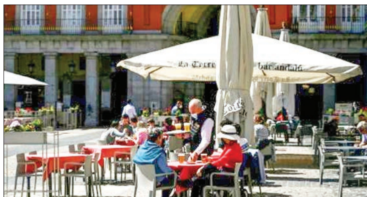
While Spaniards are not allowed to leave their own regions until April 9 to avoid a resurgence of coronavirus infections over Holy Week, similar restrictions do not apply to international tourists.

foreigners fuelled resentment over the seemingly haphazard nature of travel restrictions in Europe during the pandemic, with many Spaniards taking to social media to vent their anger. While Spaniards are not allowed to leave their own regions until April 9 to avoid a resurgence of coronavirus infections over Holy Week, similar restrictions do not apply to international tourists, who can still fly into Spain on presentation of a negative Covid test. —AFP ■