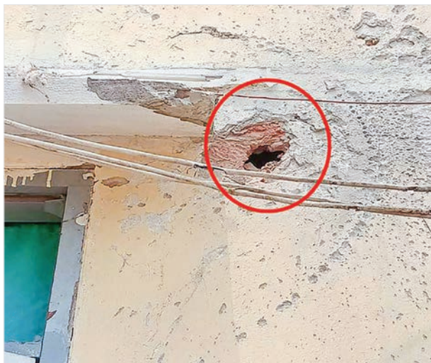
Ravages are seen after violent attack on Bago district police station yesterday.