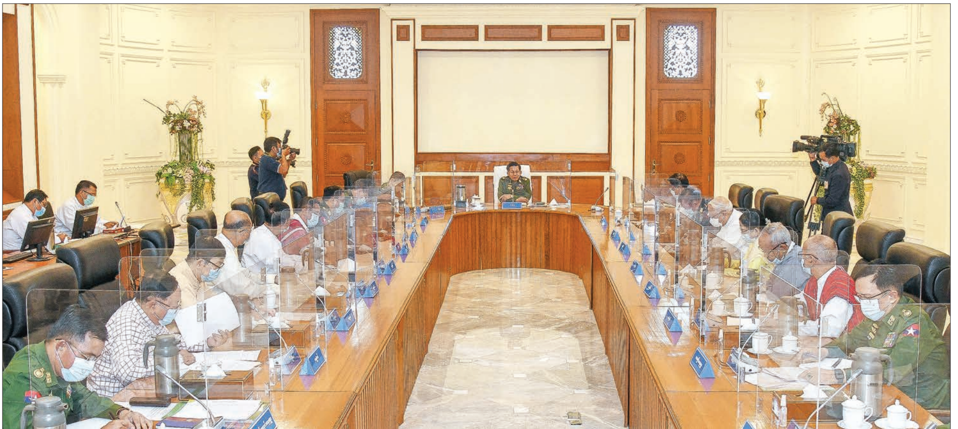
State Administration Council Chairman Senior General Min Aung Hlaing presides over the Council meeting 8/2021 in Nay Pyi Taw on 30 March 2021.

CHAIRMAN of the State Administration Council Commander-in-Chief of Defence Services Senior General Min Aung Hlaing delivered an address at the meeting 8/2021 of the Council at the Chairman of the State Administration Council's office in Nay Pyi Taw yesterday afternoon.