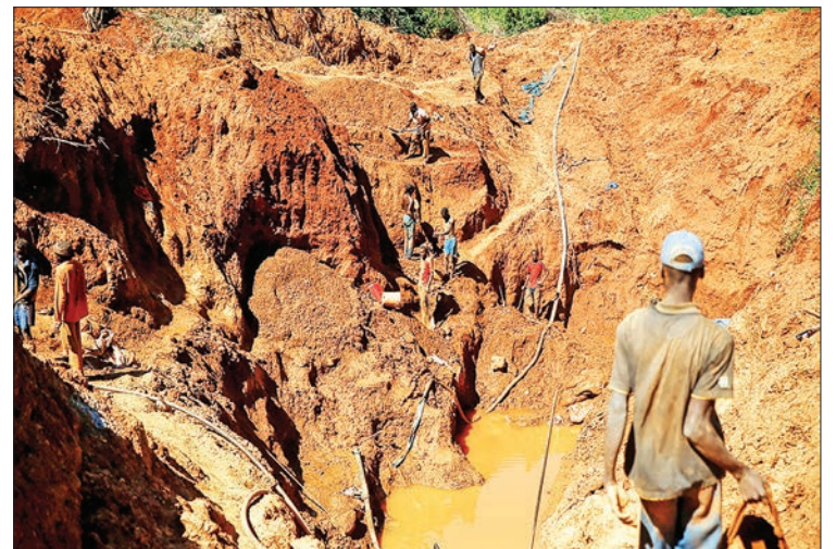
Rescuers were working against the clock to rescue 11 people trapped in a flooded illegal goldmine since last week.

Diego Mesa, minister of mines and energy, said the missing miners had been involved in