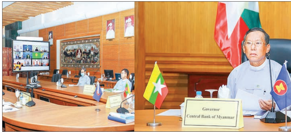
CBM Governor U Than Nyein joins the 7th ASEAN Finance Ministers Central Bank Governors meeting online yesterday.

The ASEAN Finance Ministers and Central Bank Governors exchanged views on ASEAN regions' sustainable finance, digital infrastructures, COVID-19 responses, monetary policy, and fiscal policy.