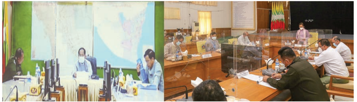
Union Minister Dr Thet Thet Khine meets the CHRD to bridge development gap between Rakhine State and other states regions yesterday.

State on 16 March, pointed out that it is necessary to implement the arrangement on return of the displaced persons from Rakhine State signed by Myanmar and Bangladesh on 23 November 2017 and the physical arrangement for repatriation of displaced Myanmar residents from Bangladesh under the arrangement on return of the displaced persons from Rakhine State signed on 1 January 2018 if these agreements do not harm the interests of the country. She noted that the Chairman of the State Administration Council had given guidance to accept appropriate points in accord with the Citi-