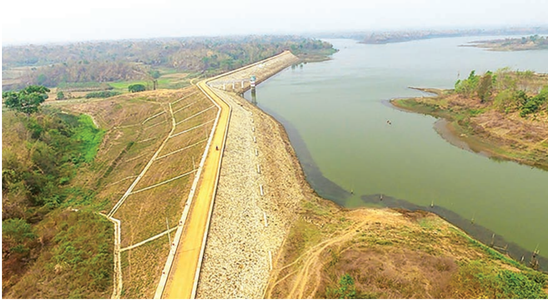
Union Minister U Tin Htut Oo discusses to develop the agro sector yesterday.

THE Ministry of Agriculture, Livestock and Irrigation organized a meeting over the establishment of mixed crop plantation and comprehensive development in Chaung Ma Nge Dam area yesterday.