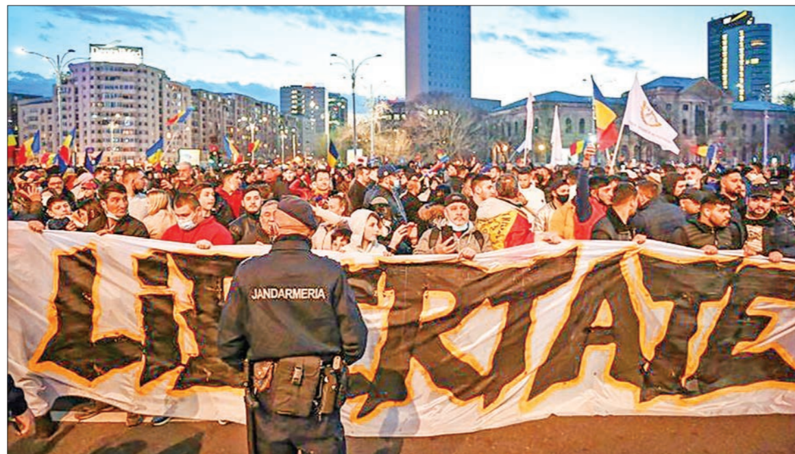
People are continuing to protest coronavirus restrictions, such as here in Romania.

Ahead of a meeting with world leaders, UN chief Antonio