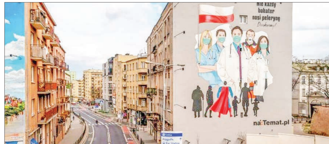
FILE - A mural paying tribute to the sacrifice of doctors, nurses and paramedics in the fight against the coronavirus is seen in Warsaw, Poland, April 2, 2020.

The treaty -- first proposed by European Union Chief Charles Michel at the United Nations last year -- would likely be the focus of major international wrangling. Michel and World Health Or-