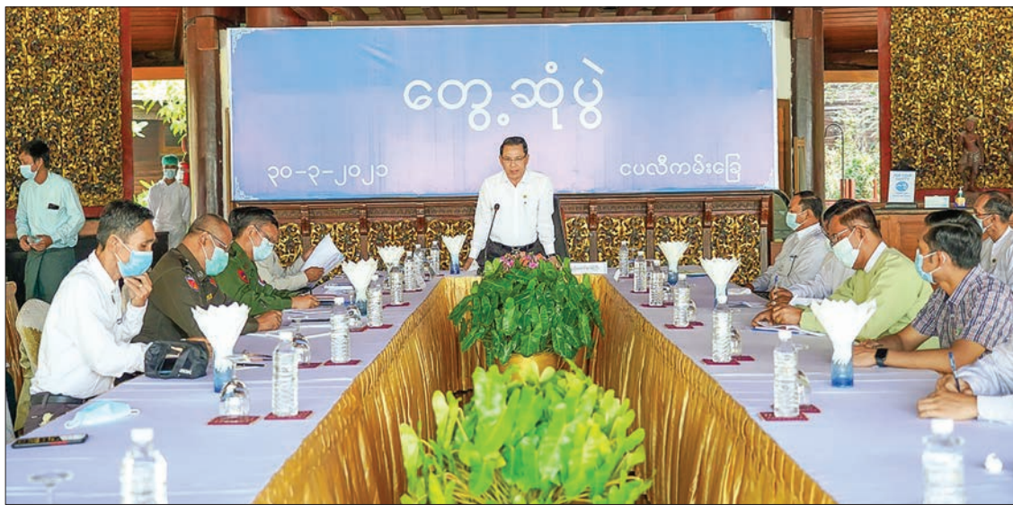
Union Minister U Maung Maung Ohn meets the hoteliers in Rakhine State yesterday to revive tourism.

About one-year suspension of the hotels and tourism industry due to the outbreak of COVID-19 brought loss to people from all strata. Arrangements have been made