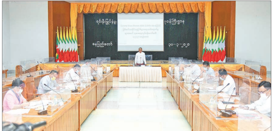
Union Minister U Aung Naing Oo chairs the Working Committee meeting to address the COVID impact on the country economy yesterday.

The meeting also discussed matters relating to measures to address the economic impacts of the COVID-19 and further measures to proceed expeditiously.—MNA