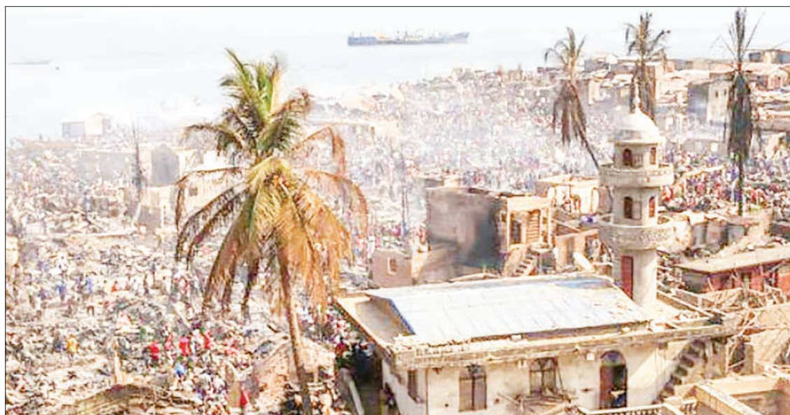
People look on at the aftermath of a large fire that broke out in an informal settlement in Susan's Bay, Freetown on March 25, 2021. The fire burned down hundreds of informal buildings, effecting thousands of people.

SIERRA Leone's disaster-management agency requested aid on Monday after a fire destroyed a slum in the capital Freetown