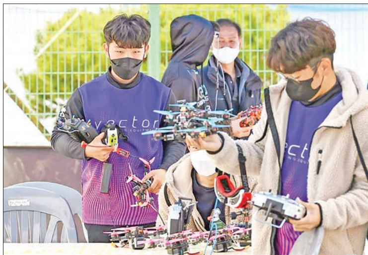
Racing drones are custom-built by competitors and their teams.

The only human movement was the twitches of fingers on handsets, which the pilots use to control the aircraft while wearing virtual-reality goggles that