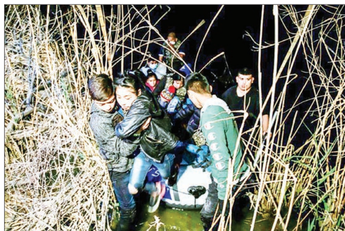
A group of undocumented migrants from Honduras and Guatemala get off a Mexican trafficker's boat on the US side of the border near Roma, Texas, on March 28 2021.

"Every day" there is a lot of work, 'Chuchi' tells AFP from his boat. "We have kids, just like you" and the work pays well, he says. —AFP ■