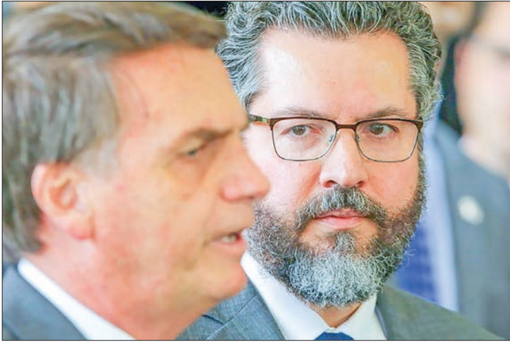
Brazilian former foreign minister Ernesto Araujo (right) had been a key member of the so-called "ideological wing" of far-right President Jair Bolsonaro's administration.

BRAZILIAN President Jair Bolsonaro overhauled his government Monday, changing six cabinet members including the foreign, defense and justice ministers, as the far-right leader faced mounting pressure over a deadly surge of Covid-19.