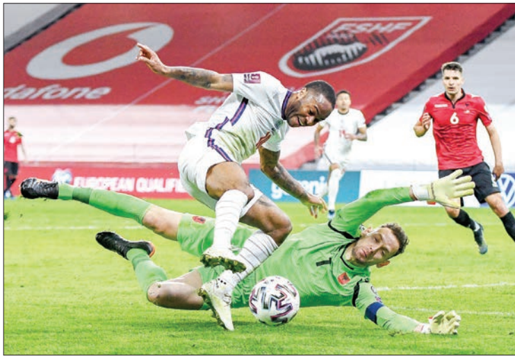
England’s forward Raheem Sterling (L) fights for the ball with Albania’s goalkeeper Etrit Berisha (R) during the FIFA World Cup Qatar 2022 qualification Group I football match between Albania and England at the Air Albania Stadium, in Tirana on 28 March 2021.

ENGLAND manager Gareth Southgate says it has taken Thomas Tuchel’s arrival at Chelsea to persuade many fans that Mason Mount is an “exceptional player.”