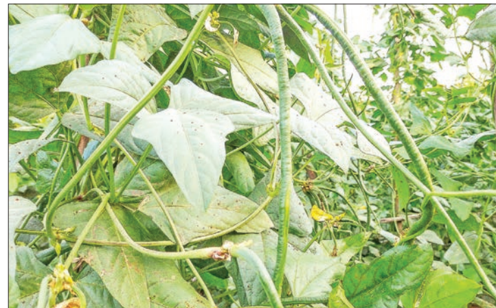
The growers from Kyaukse are cultivating short term crops to earn their family income and are growing the string bean on a manageable scale.

The long bean is necessary crops not for the housewife but for the Myanmar rice noodle soup (locally called Moat Hin Khar) sellers. So, the local growers are happy for making a profit by selling them.