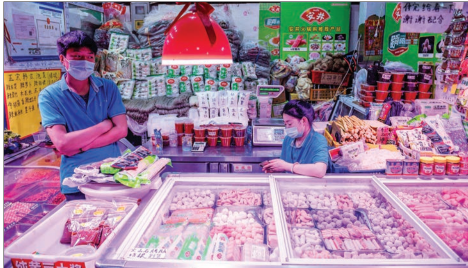
This file photo taken on 20 June 2020 shows vendors waiting for customers at their stall selling frozen meat and seafood balls at a market in Beijing. The chances that Covid-19 emerged in Wuhan because of imported frozen food are "very low", international health experts said March 29, 2021, casting doubt on one of the main theories China has embraced for the cause of the first coronavirus outbreak in late 2019.

first passed to humans from a bat through an intermediary animal, and all but ruled out a theory the virus could have leaked from a high-security lab in central China.