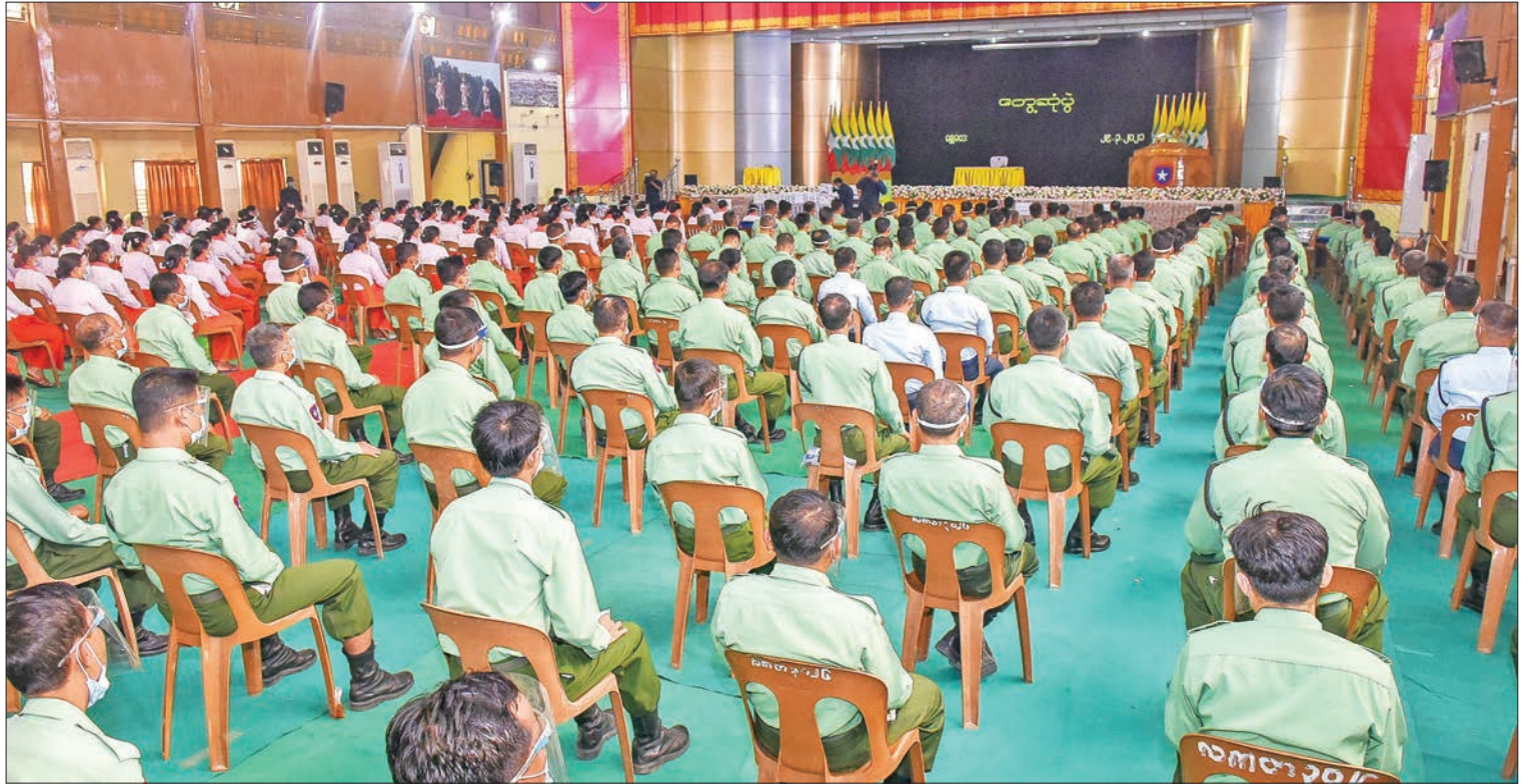
State Administration Council Vice-Chairman Vice-Senior General Soe Win meets and comforts the military personnel, MPF members and families in Mandalay Region yesterday.

During the meetings, the Vice-Senior General said about the refusal of Hluttaw and NLD government to address more than 10.4 million suspected voting frauds in the 2020 General Election, neglect to hold National Defence and Security Council meeting, declaration of the state of emergency starting 1 February 2021 under the 2008 Constitution due to their forcible taking power and five future programmes of State