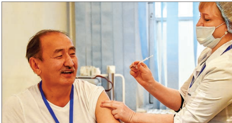
Kyrgyz Health Minister Alymkadyr Beishenaliyev receives a dose of the Sinopharm vaccine against the coronavirus disease in Bishkek on 29 March 2021.

KYRGYZSTAN kicked off its coronavirus vaccination campaign on Monday using China's Sinopharm jab, as the West accuses Beijing and Moscow of using their vaccines as tools to win geopolitical clout.