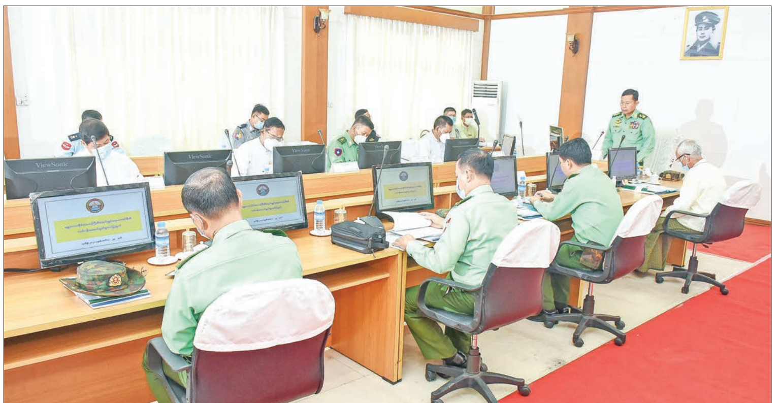
The State Administration Council Vice-Chairman hold talks with the Mandalay Region Administration Council members yesterday.

During the meeting, the Vice-chairman of SAC discussed policies and directives made by the SAC Chairman, cooperation work with Myanmar Police Force, Tatmadaw, administrative organizations and the civilians who want community peace, detailed inspections on rioters to stop their activities in the townships and wards, CDM activities and quick arrest of those lead CDM and riots, and actions to be taken against them under the law. He also said that it needs to cooperate in reopening the banks in respective townships to be able to resume the businesses. The relevant officials in business sectors should make efforts to revise the businesses hit by COVID-19, including for renewable energy to ensure