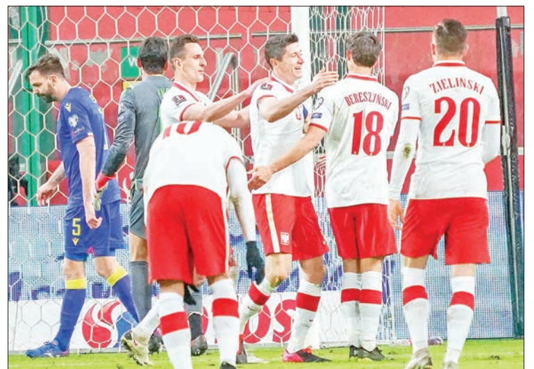
Poland’s forward Robert Lewandowski (C) celebrates scoring the opening goal with his teammates during the FIFA World Cup Qatar 2022 qualification football match Poland vs Andorra in Warsaw, on 28 March 2021.

Two players, midfielder Mateusz Klich and backup goalkeeper Lukasz Skorupski, have tested positive in the past few days. —AFP ■