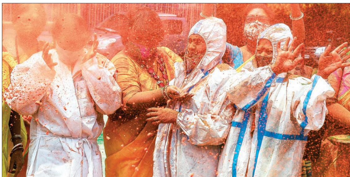
People wearing protective suits as a preventive measure against the spread of the Covid-19 coronavirus, play with coloured powders as they celebrate Holi, the spring festival of colours during a photo opportunity organized by a local club in Kolkata on 29 March 2021.

INDIAN authorities clamped down on one of the country's biggest Hindu festivals on Monday as the country passed 12 million coronavirus cases with financial hub Mumbai recording its highest-ever rise in daily infections.