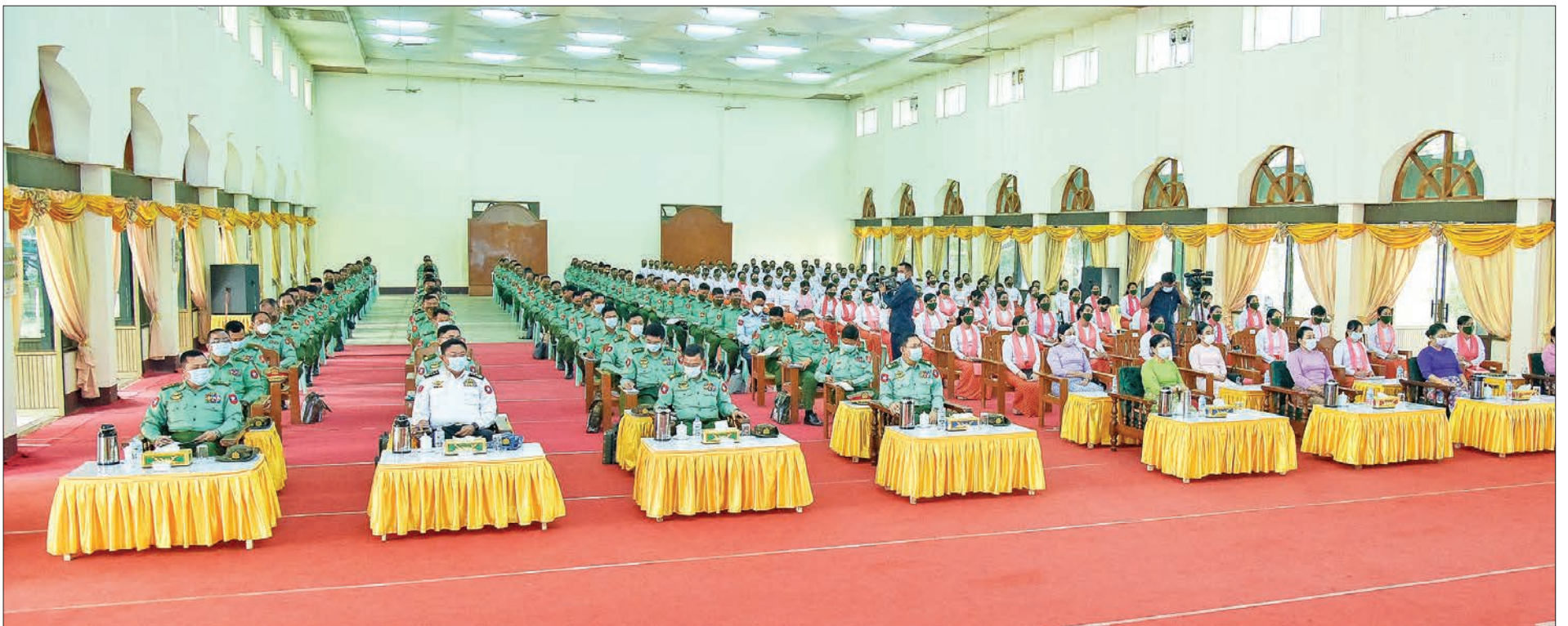
State Administration Council Chairman Senior General Min Aung Hlaing meets officers, other ranks and families of Kengtung Station and the Senior General is addressing the attendees.

At present, the newly-formed Union Election Commission is inspecting voting lists. In investigating top officials from the previous commission, their commission did not have freeness and followed the president's control and instructions.