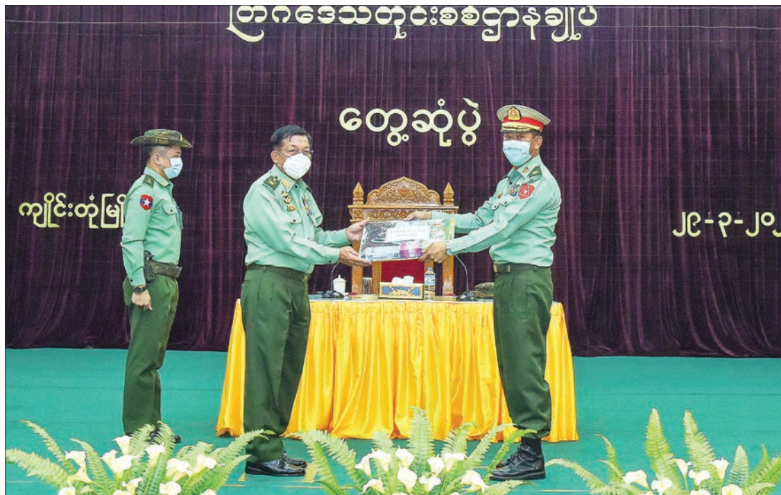
The Senior General presents foodstuffs and personal goods produced by Tatmadaw factories to the Triangle Region Command Commander yesterday.

Although the country was peaceful and stable in the first week of the Tatmadaw duty assumption, protests and riots were staged due to incitements of NLD members and supporters as of the second week. At present, protests were transformed into anarchic mobs, breaking the laws, and then to the rebellion. It was found