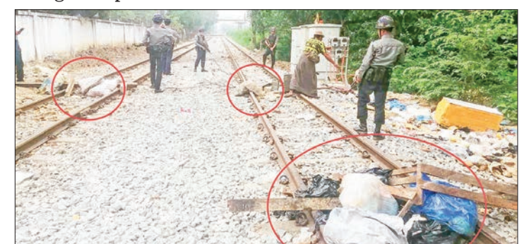
Myanmar Railways will open files of the lawsuit against the acts and destruction of unscrupulous violent persons at relevant police stations under the law to take action against them.

Myanmar Railways will open files of the lawsuit against the acts and destruction of unscrupulous violent persons at relevant police stations under the law to take action against them. As Myanmar Railways regularly operates circular trains on a daily basis, local people and staff take the trains. — MNA