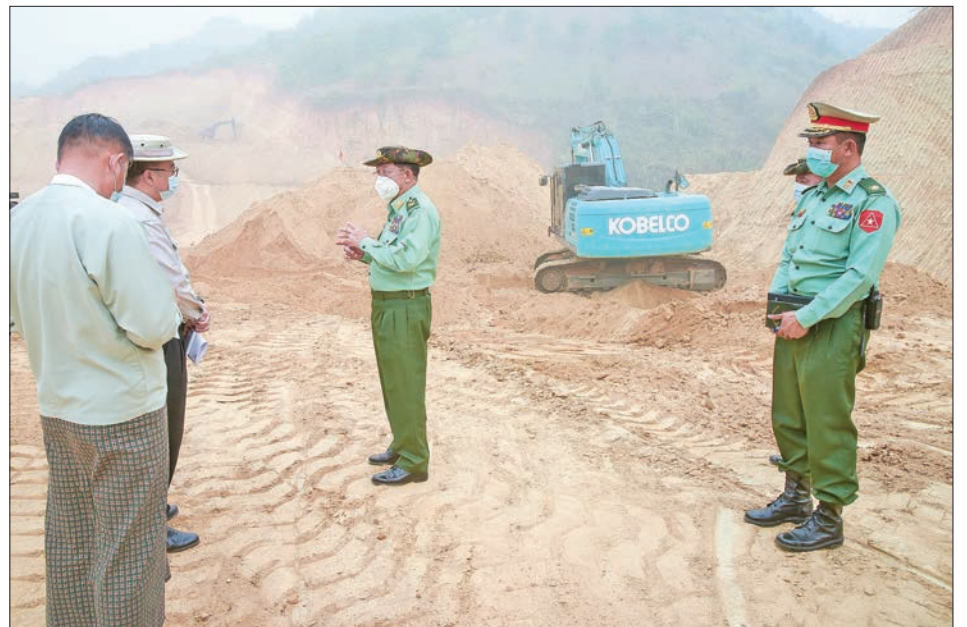
State Administration Council Chairman Senior General Min Aung Hlaing inspects the Kengtung bypass road construction yesterday.