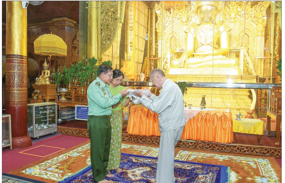
The Senior General and wife donates offertories and cash to Maha Muni Pagoda board of trustees in Kengtung yesterday.

The Senior General and party also visited Maha Muni Buddha Image of Kengtung. They donated offertories to the Buddha image and cash to the pagoda board of trustees. The Senior General instructed the pagoda board of trustees regarding the pagoda's centenary festival, which falls on the full moon day of Tazaungmone.