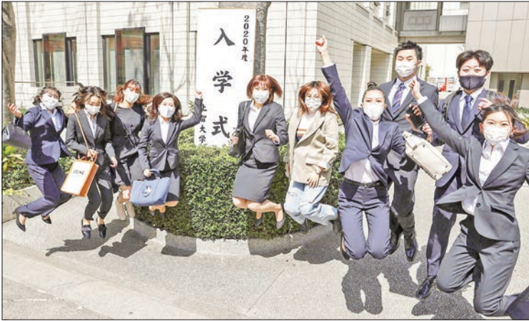
Sophia University students celebrate at the venue of a belated enrollment ceremony in Tokyo on 29 March 2021.

SOPHIA University in Tokyo held Monday the first of a series of belated entrance ceremonies for last year's freshers who are now about to enter their second year after the coronavirus outbreak forced the cancelation of the original event last spring.