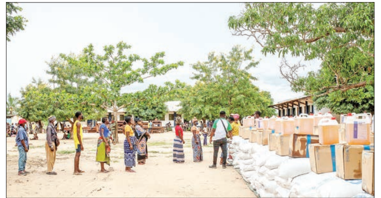
Internally displaced persons await in line during an United Nations World Food Programme's distribution at the "3 de fevereiro escola" school in Matuge district, northern Mozambique, on 24 February 2021. Food packages are distributed at the site for displaced families from Ibo, Mocimboa Da Praia, and Macomia places that have been attacked by armed insurgents in the last two years north of the province of Cabo Delgado.

The government said dozens were killed in the attack, including seven people caught in an ambush during an operation to evacuate them from a hotel where they had sought refuge. A South African is among those