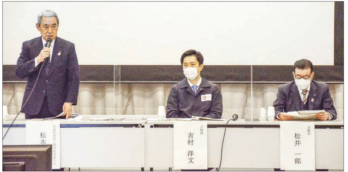
Local government and business leaders in Osaka Prefecture are pictured on 29 March 2021 at the launch of a committee to pitch Osaka city as a new financial centre in Asia.

Osaka has Japan's first integrated bourse for stocks and commodity futures. The unprecedented all-day system outage