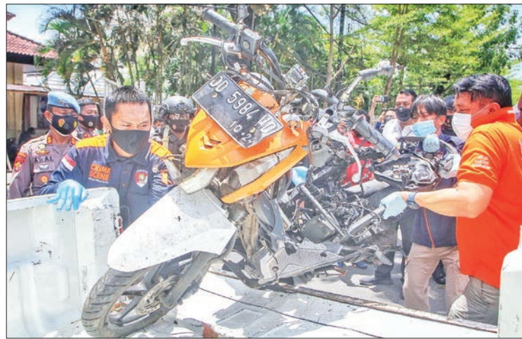
Indonesian police remove a motorcycle that was used by bombers during a reconstruction of the explosion in Makassar on 29 March 2021, one day after the suicide bombing at a cathedral on Palm Sunday.

Raids at several locations including at the couple's home