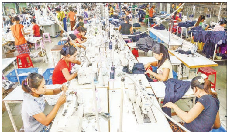
Myanmar's garment export dropped by over 25 per cent as of the first quarter of the current FY compared with a year-ago period on the back of a slump in demand by the European Union market.

EXPORTS of finished industrial goods drastically plummeted to US$3.137 billion between 1 October and 12 March in the current financial year 2020-2021, a severe drop of $1.66 billion compared with the corresponding period of the previous FY, according to the Ministry of Commerce.