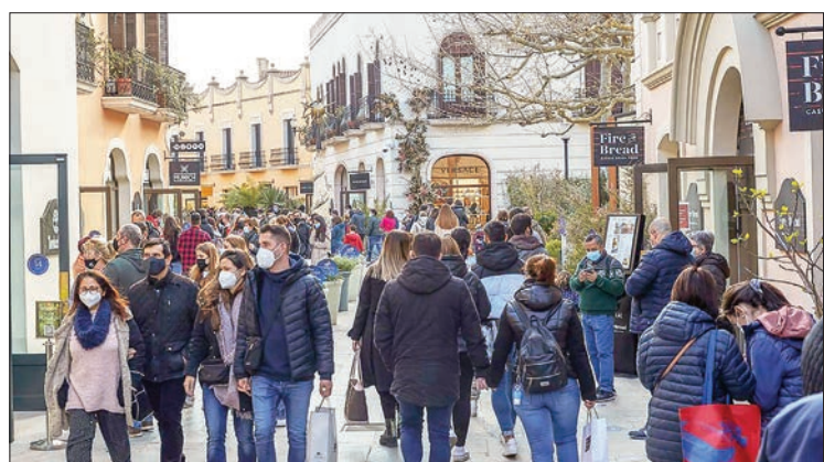
Spain's gross domestic product (GDP) fell by 10.8 percent in 2020, the worst since 1970.

SPAIN'S gross domestic product (GDP) fell by 10.8 per cent in 2020, the worst since 1970, according to data published by the Spanish Statistical Office (INE) on Saturday.