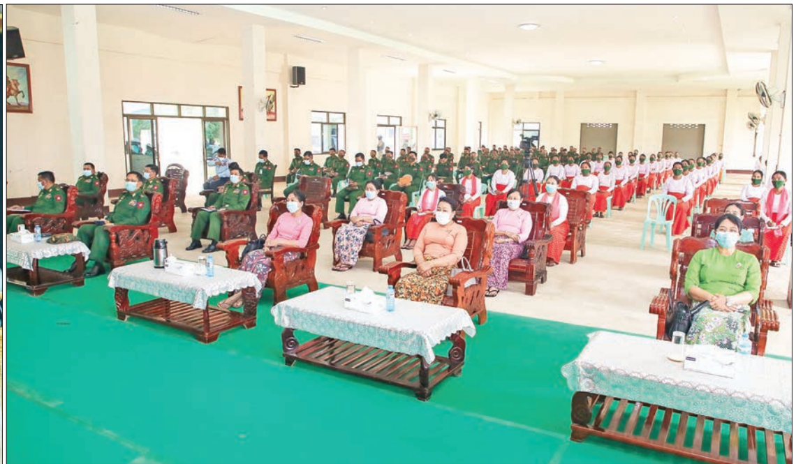
Chairman of State Administration Council Commander-in-Chief of Defence Services Senior General Min Aung Hlaing meets officers, other ranks and families of Tachilek Station.

C HAIRMAN of the State Administration Council Commander-in-Chief of Defence Services Senior General Min Aung Hlaing met officers, other ranks and families of Tachilek Station yesterday afternoon.