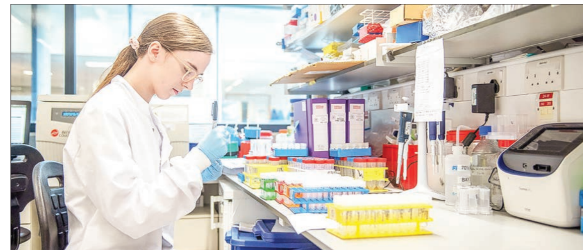
The coronavirus vaccine developed by the University of Oxford and AstraZeneca is already being administered in the UK.