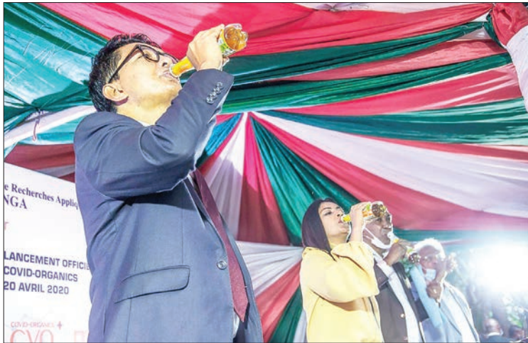
President Andry Rajoelina, left, ran headlong into scientific scepticism after he launched a touted cure for Covid last April.

MADAGASCAR'S President Andry Rajoelina walked back on his hard line stance against coronavirus vaccination Friday, accepting mass inoculation but standing by a herbal infusion he has touted as a "cure."