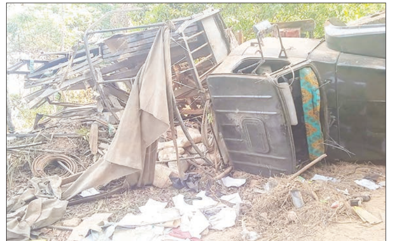
Damages are seen after the KNLA Brigade-5's attack.

Although KNU members and local ethnic people want to continue to walk on the NCA path, which is a basic agreement for eternal peace, the local ci-