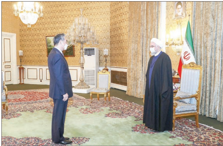
Iranian President Hassan Rouhani (R) meets Chinese Foreign Minister Wang Yi (L) in Tehran, Iran on March 27, 2021.

CHINA and Iran struck a new accord Saturday for strengthening bilateral political and economic relations over the next