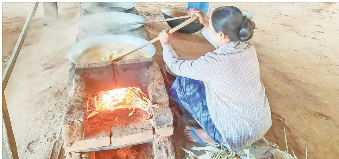
Jiggery price is declining. The local people from the central part of the country struggle to survive from the production of jaggery and palm juice only.

The toddy season starts in January and February in Ngathayouk town. The business is physically demanding but less secure. The toddy palm tree