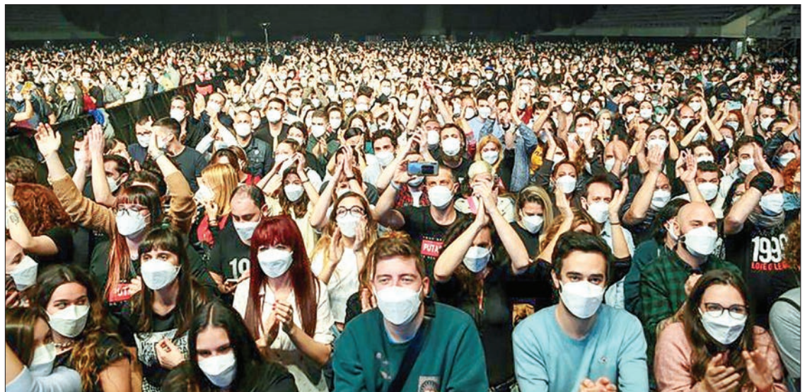
Music fans were treated to a pre-pandemic style concert in the name of research.

MUSICIANS on stage, spotlights flooding the arena and 5,000 fans dancing ecstatically: live music was back in Barcelona Saturday for a clinical trial seeking pandemic-safe ways to celebrate mass events.