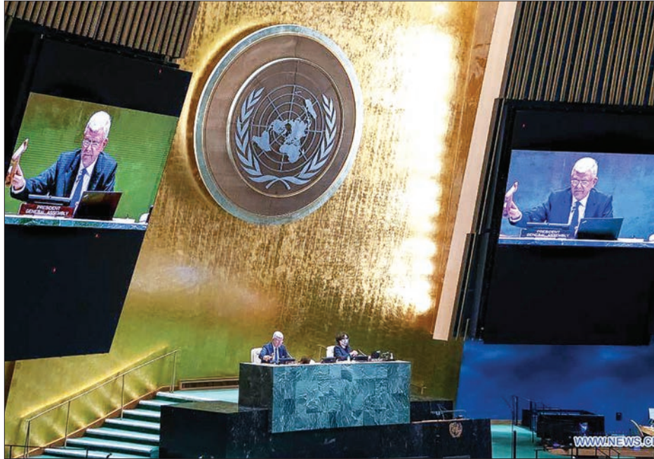
Volkan Bozkir, president of the 75th session of the UN General Assembly (UNGA), chairs the informal meeting of the UNGA plenary on the Political Declaration on Equitable Global Access to COVID-19 Vaccines at the UN headquarters in New York on March 26, 2021.

The initiative reportedly aimed to raise awareness of the need to work together to defeat the pandemic while raising awareness of the low availability of vaccines to