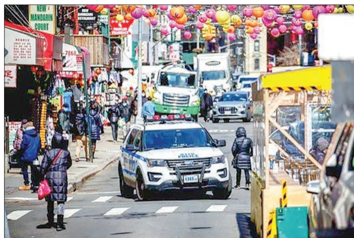
Police officers patrol in Chinatown of New York, the United States, March 19, 2021.

"Like much of America we've seen a disturbing spike in hate crimes targeting Asian-Americans in New York City," Shea said. —AFP ■