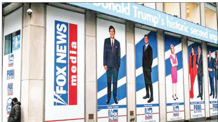
Vote machine maker Dominion is seeking over $1 billion in a lawsuit lodged Friday against Fox News, alleging the network broadcast false claims that its machines were used to rig the 2020 election that Donald Trump lost.

VOTE machine maker Dominion is seeking over $1 billion in a lawsuit lodged Friday against Fox News, alleging the network broadcast false claims that its machines were used to rig the 2020 election that Donald Trump lost. This is the second defamation complaint against the conservative news channel, which was already sued in February for similar reasons by another voting machine company, Smartmatic.