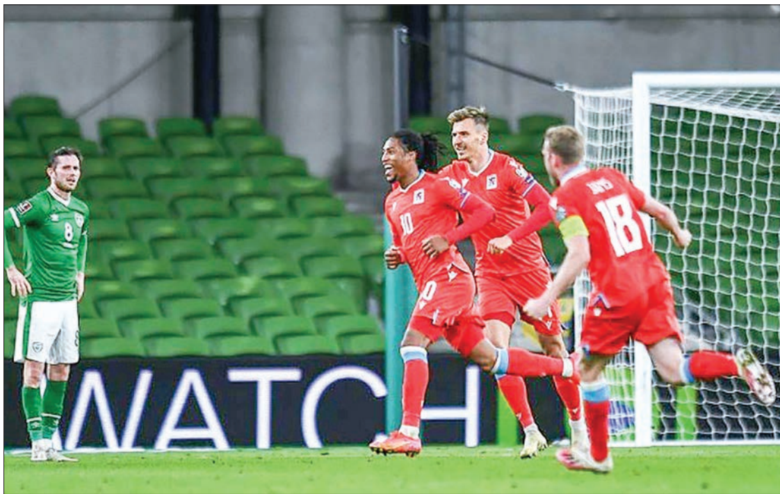
Gerson Rodrigues fired the only goal in Luxembourg's 2022 World Cup qualifier with Ireland.

LUXEMBOURG'S Red Lions secured one of the most famous wins in the Grand Duchy's sporting history with a 1-0 defeat of Ireland in their 2022 World Cup qualifier in Dublin on Saturday night.