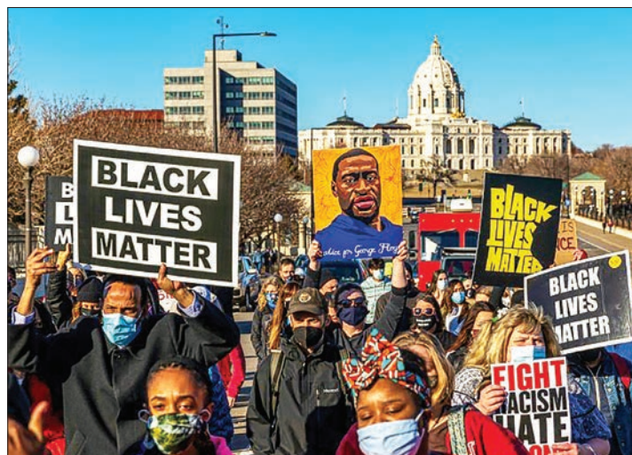
Protestors at a 'Justice for George Floyd' march in Saint Paul, Minnesota.

A conviction on any of the charges -- second-degree murder, third-degree murder or manslaughter -- will require the jury to return a unanimous verdict. —AFP ■