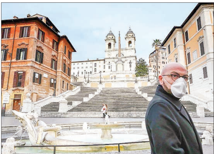
A man wearing a protection mask walks by the Spanish Steps at a deserted Piazza di Spagna in central Rome.

Even so, the atmosphere was like travelling back to a time before the pandemic with excited crowds dancing, hugging each other and belting out songs at the top of their voices, or just drinking beers at the bar.—AFP ■