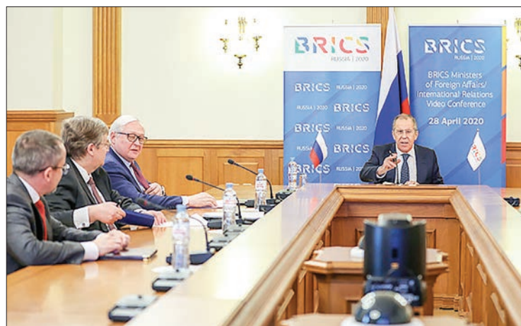
Russia's Foreign Minister Sergei Lavrov and Russia's Deputy Foreign Minister Sergei Ryabkov (R-L) during an informal video conference session of the BRICS Foreign Ministers Council.

Patel said BRICS countries should build greater cohesion for sharing of ideas between industrialists on how to penetrate export markets and greater use of manufacturing networking to address technology innovation and marketing.