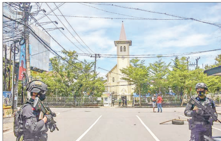
An Indonesian cathedral was rocked by a suspected suicide bombing on Sunday with body parts littering the chaotic scene as Christians inside celebrated the start of Holy Week, police said.

daughters, aged nine and 12 — and another family of five, which carried out the suicide bombing of a police headquarters, all belonged to the same Koran study