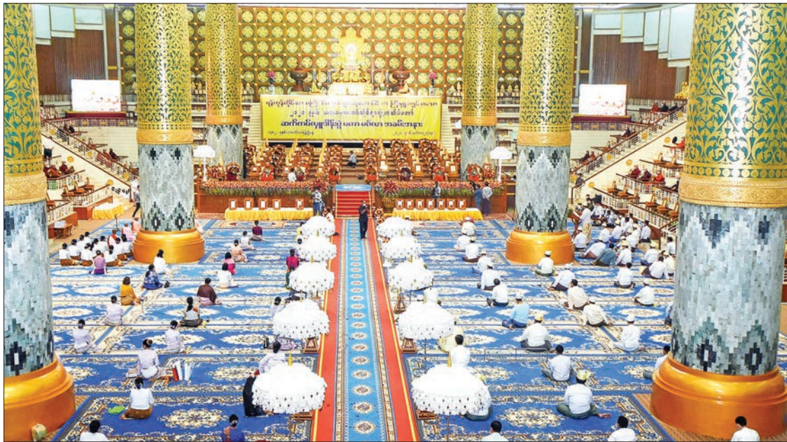
The YRAC holds the 2021 religious Titles Conferring Ceremony in Yangon on 27 March 2021.

WITH the Yangon Region Administration Council's leadership, the 2021 Religious Titles Conferring Ceremony to the venerable monks, nuns and people was held on 27 March in Maha Pathana Cave in Thiri Mingalar Kaba Aye Hill, Yangon.