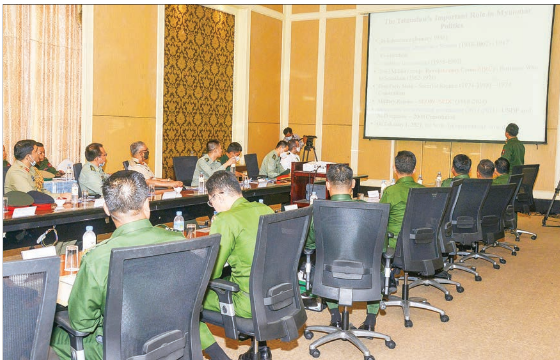
Myanmar officials explained the current situation, which was happening in the country, to the military attachés who attended the celebration of the 76 th Armed Forces Day.

MYANMAR officials explained the current situation, which was happening in the country, to the military attachés who attended the celebration of the 76 th Armed Forces Day on 27 March afternoon in Nay Pyi Taw.