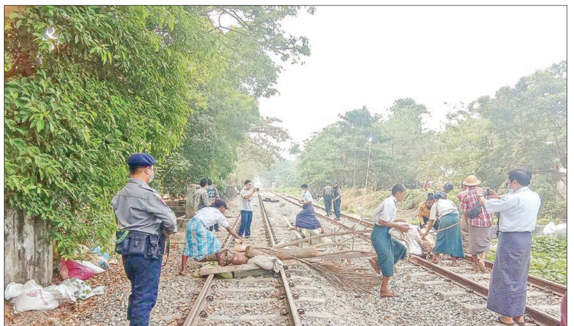
It is reported that Myanma Railways will take legal action against the terrorists for their acts and harassment at the respective police stations.

People and civil service personnel took the train as Myanma Railways run a regular commuter train on a daily basis. — MNA