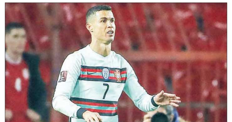
Portugal coach Fernando Santos said “it isn't possible” that what he saw as a clear goal scored by Cristiano Ronaldo in Saturday's World Cup qualifier against Serbia could be ruled out.

Ronaldo later posted on his Instagram page: “I always give and will give everything for my country, that will never change. “But there are difficult times to deal with, especially when we feel that an entire nation is being harmed.” —AFP ■