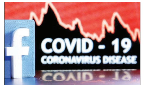
Facebook has frozen Venezuelan President Nicolas Maduro's page for violating policies against spreading misinformation about COVID-19 by promoting a remedy he claims, without evidence, can cure the disease, a company spokesman said on Saturday.

"We follow guidance from the WHO (World Health Organization) that says there is currently no medication to cure the virus," the spokesman told Reuters.—AFP ■