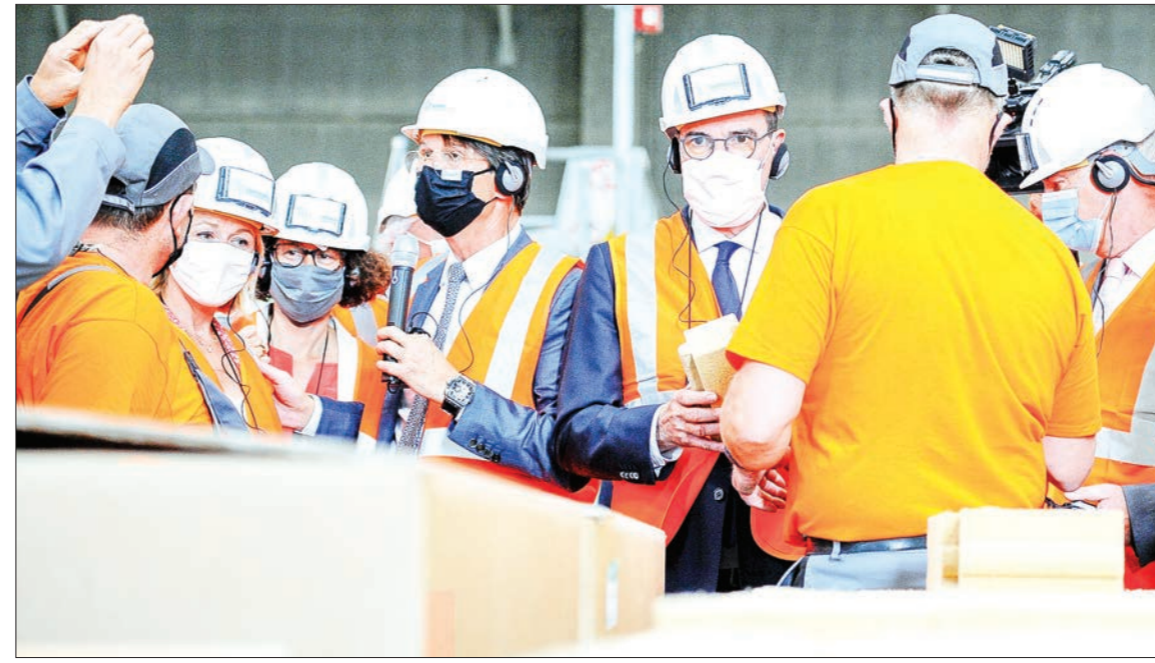
French Prime Minister Jean Castex visits and insulation systems factory in Golbey, eastern France.

It estimates the delay will cost the bloc's 27 member states some 123 billion euros this year.