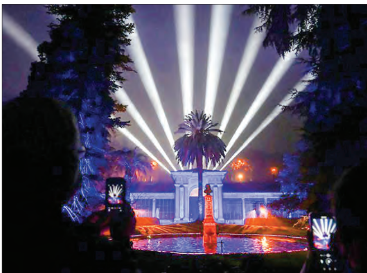
Compared with much of the rest of Europe, the Covid-19 atmosphere in Spain feels like a fiesta.

But it's a reality which has annoyed and angered Spaniards who are banned from leaving their own regions until April 9 to avoid a resurgence of Covid infections over Holy Week, a hugely popular holiday when people routinely travel to see family. —AFP ■