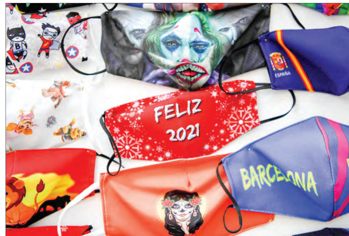
Fabric face masks are displayed for sale at a store in Madrid.