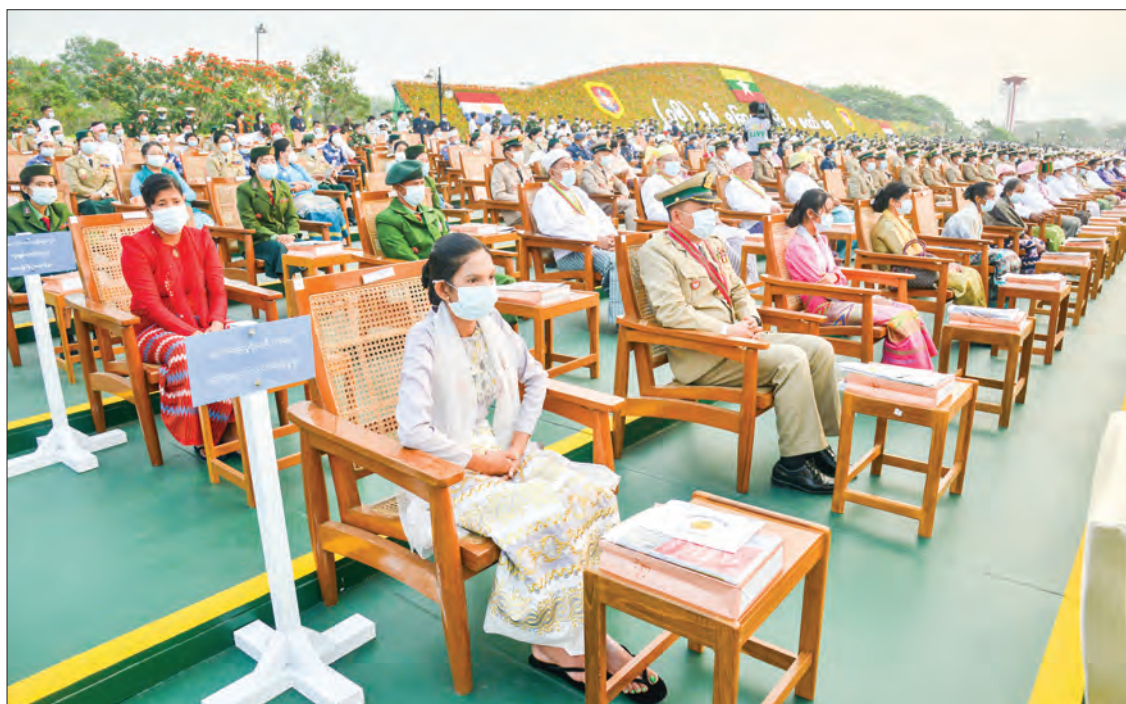
The military personnel and civilian guests are attending the parade of 76 th Anniversary Armed Forces Day yesterday.

Giant posters portraying the activities of Tatmadaw members (Army, Navy and Air) that promote patriotism and nationalistic fervour were erected along Yangon-Mandalay highway, and Pinlaung junction, Posters bearing the mottos of the Tatmadaw in Myanmar and English were erected or hanged along the parade route in honour of the 76th Anniversary Armed Forces Day. 100