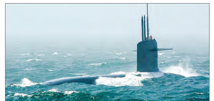
Tula K-114 SSBN.

THREE nuclear-powered missile submarines broke thick ice and surfaced in the Arctic Ocean simultaneously for the first time in the history of the Russian Navy, Navy Commander-in-Chief Nikolai Yevmenov said Friday.