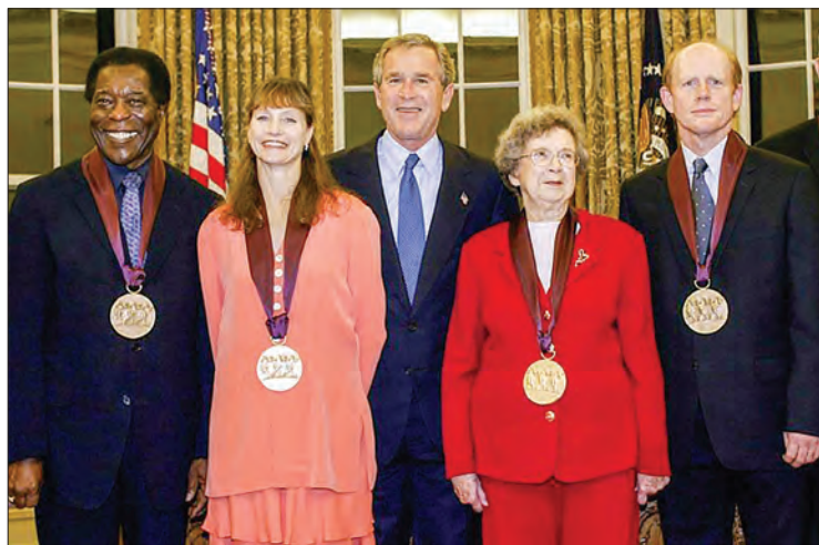
Beverly Cleary (2nd R) is pictured with president George W. Bush (center) in this November 12, 2003 photo, along with other recipients of the National Medal of Art (from L) blues musician Buddy Guy, dancer Suzanne Farrell and director Ron Howard.

"And in my childhood, many years ago, children's books seemed to be about English children, or pioneer children. And that wasn't what I wanted to read. And I think children like to find themselves in books." —AFP ■