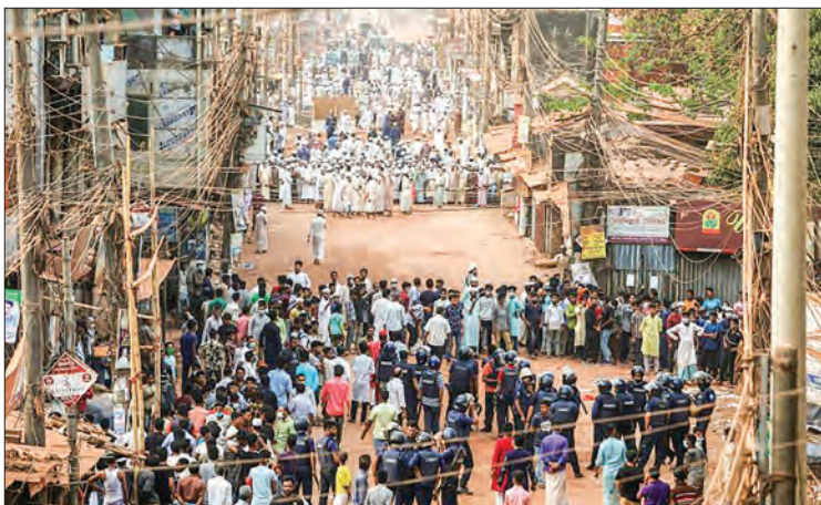
Five people were killed Friday during clashes between police and activists of the Hifazat-e-Islam group protesting against Indian Prime minister Narendra Modi's visit to Bangladesh.

Police said four bodies of members of Hefazat-e-Islam, a hardline Islamist group, were brought to Chittagong Medical College Hospital after violence erupted at Hathazari, a rural town where the group's main leaders are based.— AFP ■