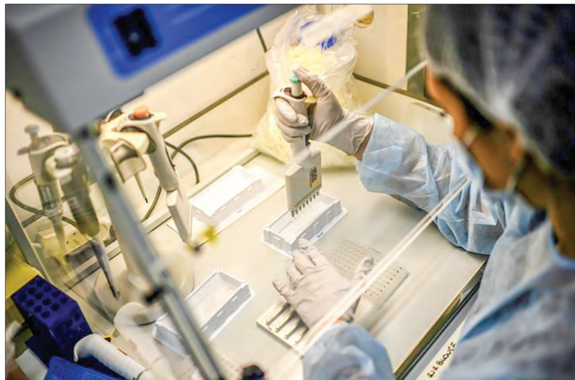
The SARS-CoV-2 virus has already undergone several thousand mutations since it emerged in humans in late 2019.

It's a tree that is constantly growing branches. Unlike events like viruses