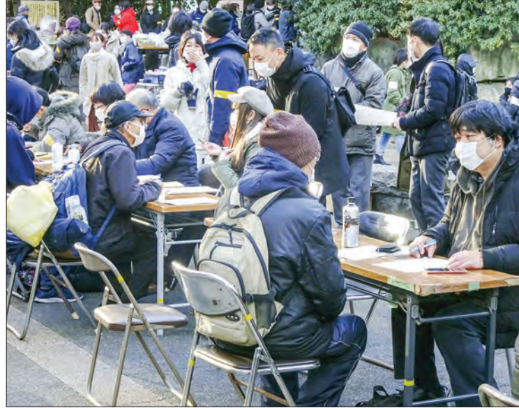
Consultation service offered for people facing economic hardship in Tokyo on Dec. 31, 2020.

they want is what we call rich people," said a person involved in the auto industry. "Situations around them do not necessarily affect them."