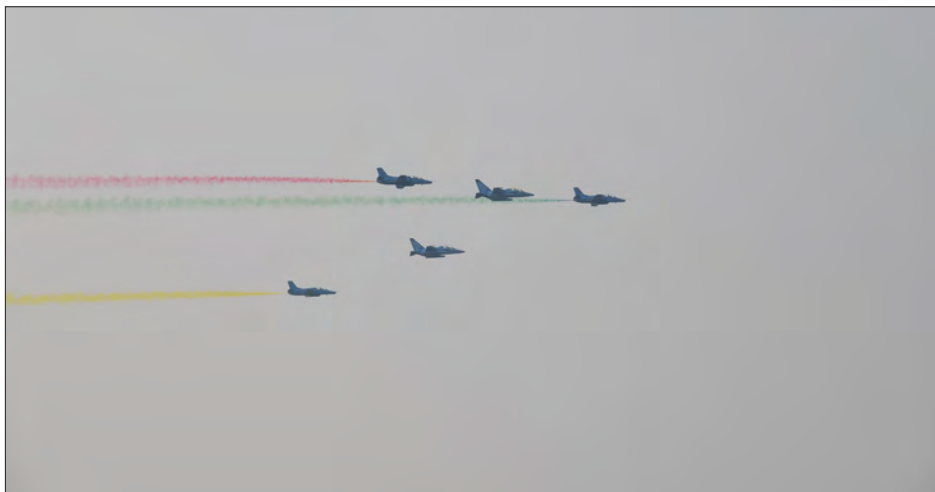
The Air Force.