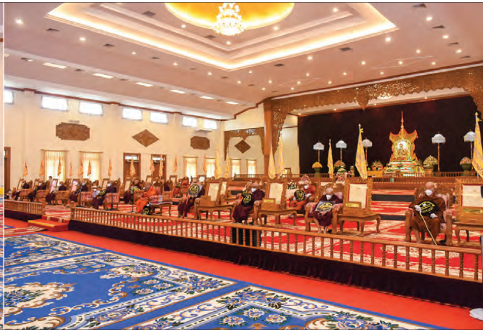
The Religious Titles Conferring Ceremony for the year 2021 is in progress in Nay Pyi Taw on 28 March 2021.

A ceremony to confer religious titles was held yesterday afternoon at Sasana Maha Beikman in Uppatasanti Pagoda compound, Nay Pyi Taw.