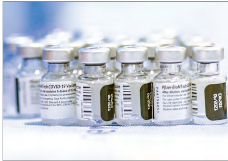
Pfizer vaccine offers 97 per cent protection in preventing symptomatic disease.

"It is expected to facilitate the rapid roll-out and distribution of the vaccine in the EU by reducing the need for ultra-low temperature cold storage conditions throughout the supply chain." —AFP ■