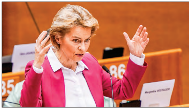
European Commission President Ursula von der Leyen.

THE German Constitutional Court on Friday abruptly stopped Europe's biggest economy from ratifying a 750-billion-euro ($885 billion) EU coronavirus recovery fund, after a last-minute legal challenge was filed against the move.