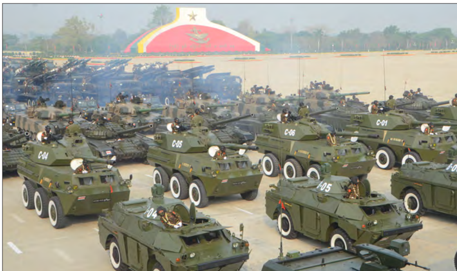
The artillery column.