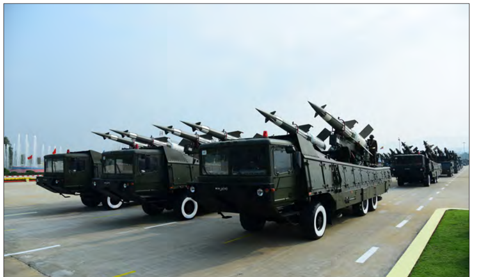
The missiles column.