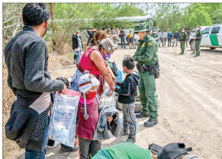
Asylum seekers await transport by U.S. Border Patrol agents after their group of immigrants crossed the Rio Grande into Texas on March 25, 2021 in Hidalgo, Texas.

A senior Border Patrol official said on Friday that the numbers continue to increase: some 6,000 undocumented migrants were caught on Thursday trying to enter the country. Unlike in the past, when most of those caught crossing the southern border illegally were single adults, most recently about half have been either in family units or as unaccompanied children. —AFP ■