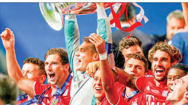
UEFA has put forward plans for a new format from 2024 featuring one 36-team league replacing the current group stage.

UEFA will decide next week on a revised format for the Champions League which will likely overhaul Europe's top football competition from 2024, European Leagues revealed on Friday.