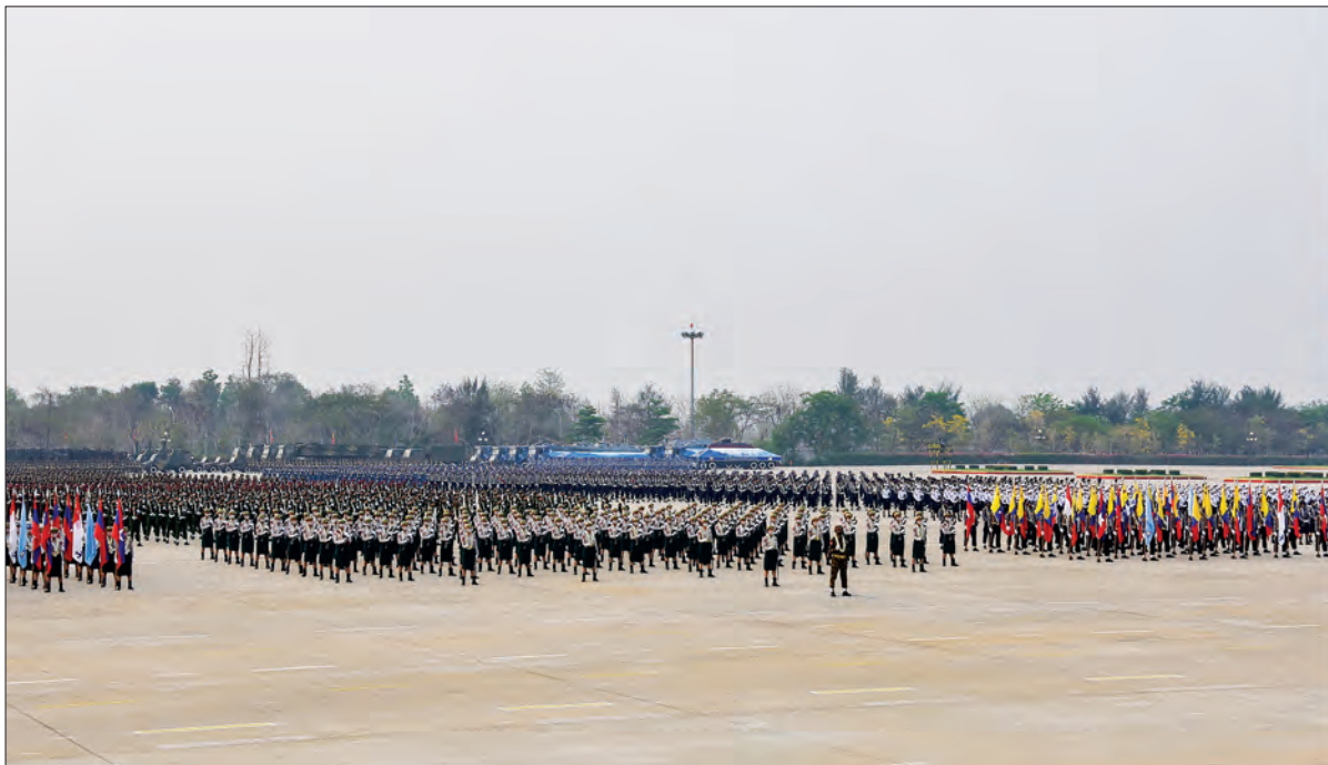
The Parade of the 76 th Anniversary Armed Forces Day is in progress in Nay Pyi Taw on 27 March 2021.