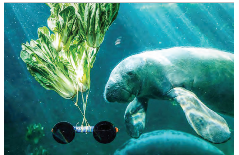
A manatee feeds on cabbage in the aquarium at the Vincennes zoological gardens in Paris on April 4, 2019.

That is almost as many manatee deaths as were counted in the last three years combined. About 175 manatees usually die in Florida every year. The FWC said in a statement Wednesday that the situation could now be classed as an Unusual Mortality Event (UME). "Preliminary information indicates that a reduction in food availability is a contributing factor," the commis-