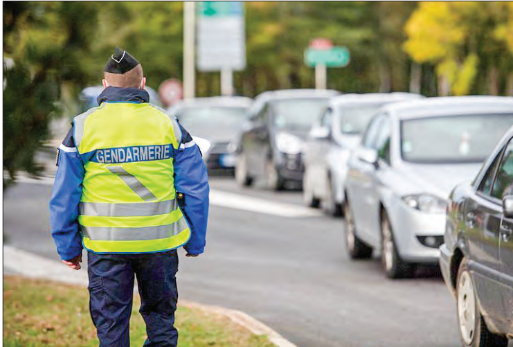
The French government announced increased police checks on Friday to enforce travel restrictions in place in Paris and several other regions as coronavirus cases continue to soar around the country.

THE French government announced increased police checks on Friday to enforce travel restrictions in place in Paris and several other regions as coronavirus cases continue to soar around the country.