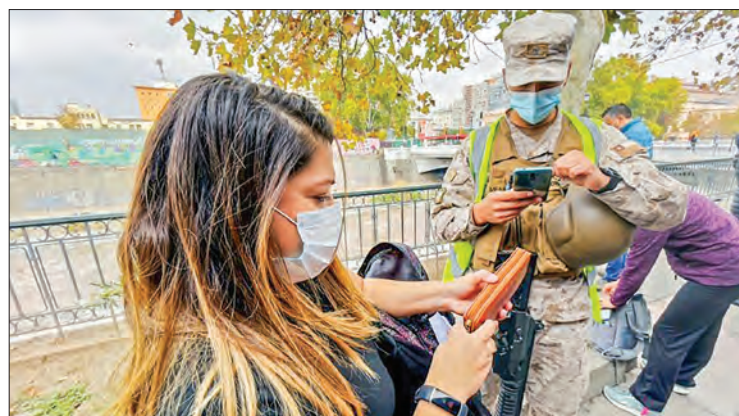
A soldier checks a pedestrian at a checkpoint in the Chilean capital Santiago as the country imposes a Covid-19 lockdown -- despite encouraging vaccination rates. PHOTO: AFP

Chile began vaccinating health care workers on December 24 and from February 3 it started with the general population, initially the over 90s. —AFP ■