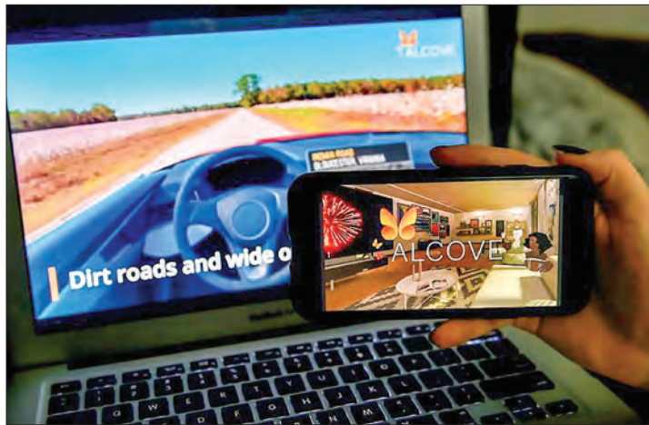
This illustration picture shows a virtual road trip on a computer and the travel application logo from Alcove, a platform for virtual reality travel which has gained momentum during the pandemic.