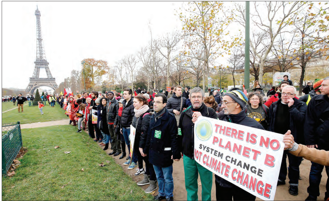
President Joe Biden is directing the U.S. to rejoin the international Paris Climate Agreement, which aims to cut global greenhouse gas emissions. Here, activists rally on Dec. 12, 2015.

Bangladeshi Prime Minister Sheikh Hasina and Bhutanese