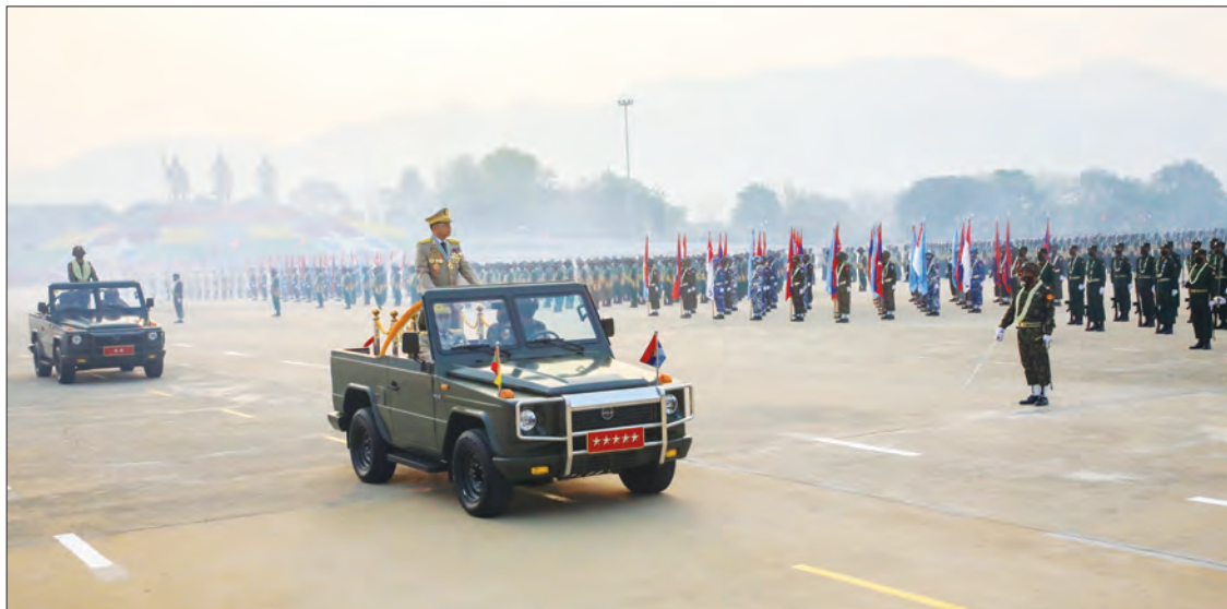
The Senior General is inspecting the parade columns.