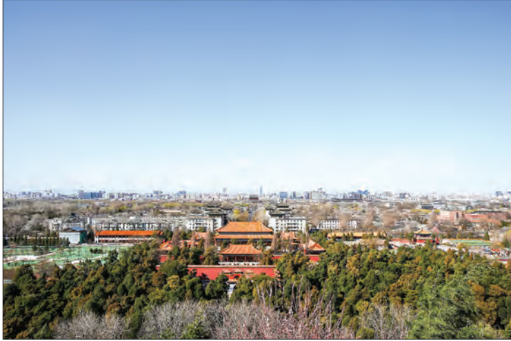
Beijing's air quality has improved significantly in the last few years thanks to the emission reductions following the implementation of clean air actions.

BEIJING'S air quality has improved significantly in the last few years thanks to the emission reductions following the implementation of clean air actions, according to the latest report released by the Atmospheric Pollution and Human Health (APHH) in a Chinese Megacity (APHH-Beijing) programme that unites British and Chinese scientists.