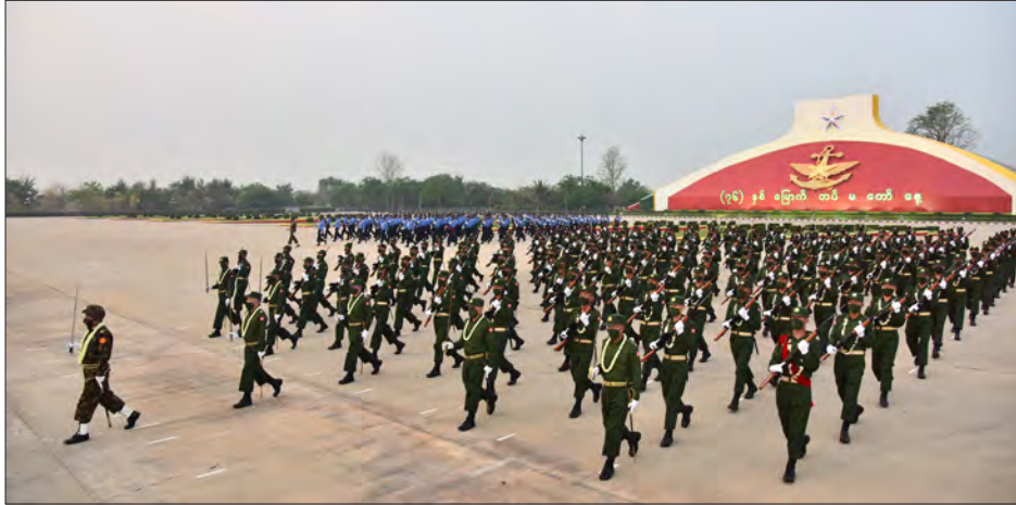
The military parade columns seen marching in the parade ground.