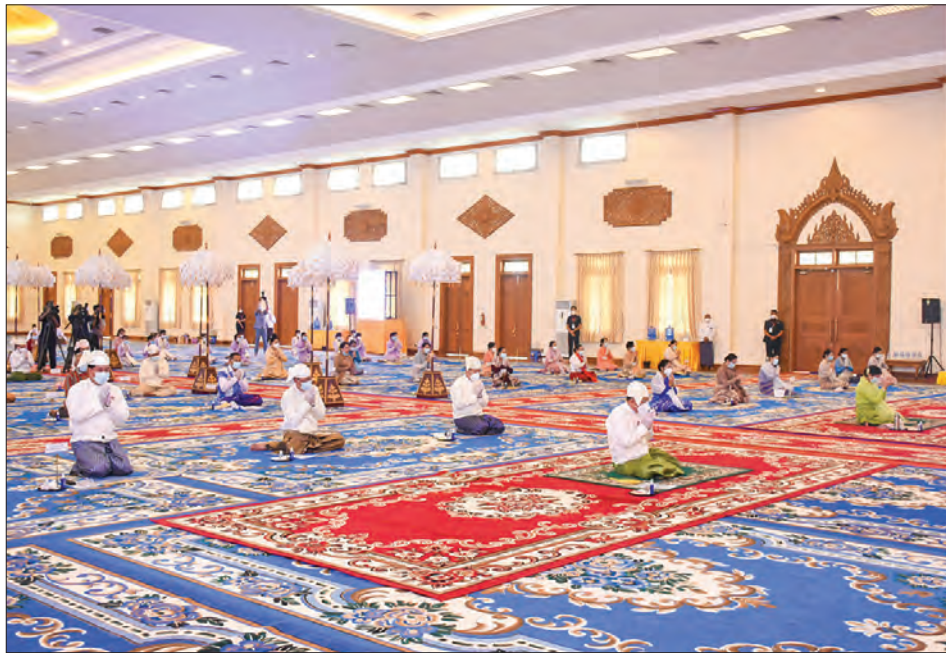
The Senior General, wife and military personnel attends the ceremony.