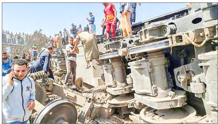
Rescuers gather around the overturned wreckage of two passenger trains that collided in the Tahta district of southern Egypt, killing at least 32 people.

A collision between two trains killed at least 32 people and left more than 160 injured Friday in southern Egypt, a country plagued by fatal rail accidents widely blamed on crumbling infrastructure and poor maintenance.