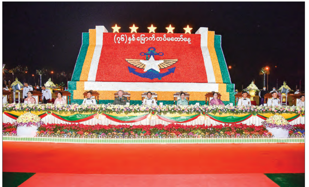
The Senior General and wife are warmly greeting the diplomatic corps at the Armed Forces Day Dinner.