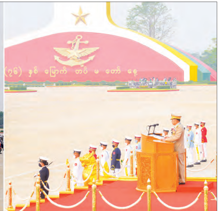
The Senior General is addressing.

T HE Parade of the 76th Anniversary Armed Forces Day took place at Nay Pyi Taw military parade ground this morning with an address by Chairman of the State Administration Council Commander-in-Chief of Defence Services Senior General Maha Thray Sithu Min Aung Hlaing.