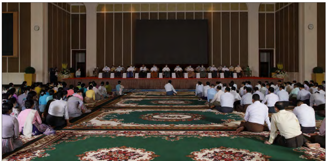
Tatmadaw families are paying obeisance to retired senior officers yesterday.

The Coordinating Commander (Army, Navy and Air) and the attended Tatmadaw officials respectfully presented the gifts to the retired senior Tatmadaw officers.—MNA