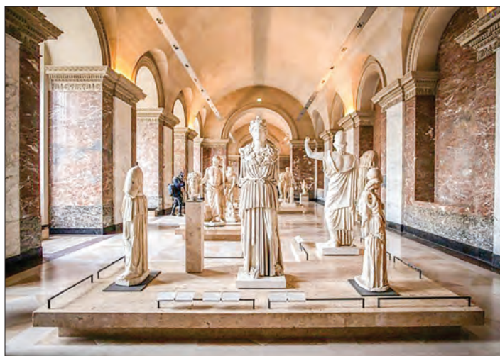
A year of pandemic-related shutdowns has seen an explosion in visits to the Louvre's website.

THE Louvre museum in Paris said Friday it has put nearly half a million items from its collection online for the public to visit free of charge.