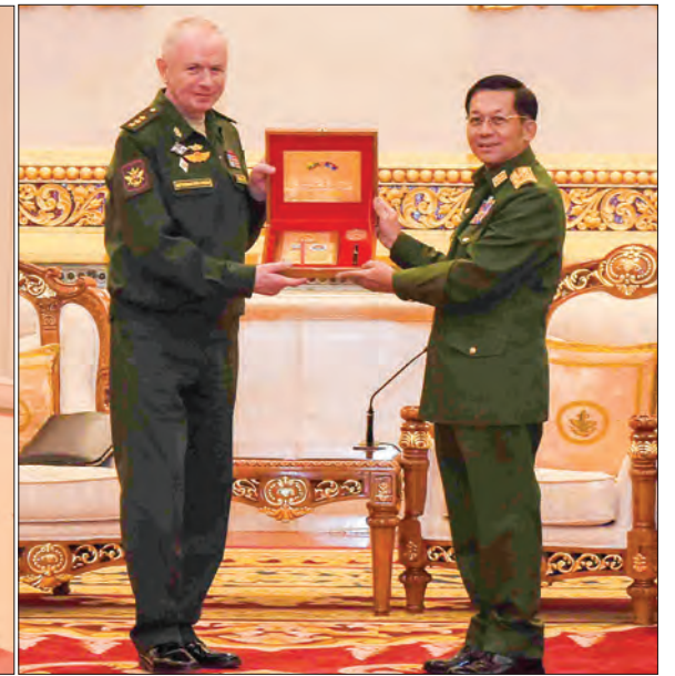
The Senior General presents the honorary medal to Russian Deputy Minister for Defence.

corrupt politics were shaped in the 2020 election so as to grasp the power of the State in unfair ways. That is why the Tatmadaw assumed State responsibility. The Tatmadaw is taking responsibilities in a short time to ensure genuine democracy and disciplined and endured democracy. After restoring peace and stability, Myanmar will be placed on track of democracy to become a peaceful, stable, disciplined democratic country.