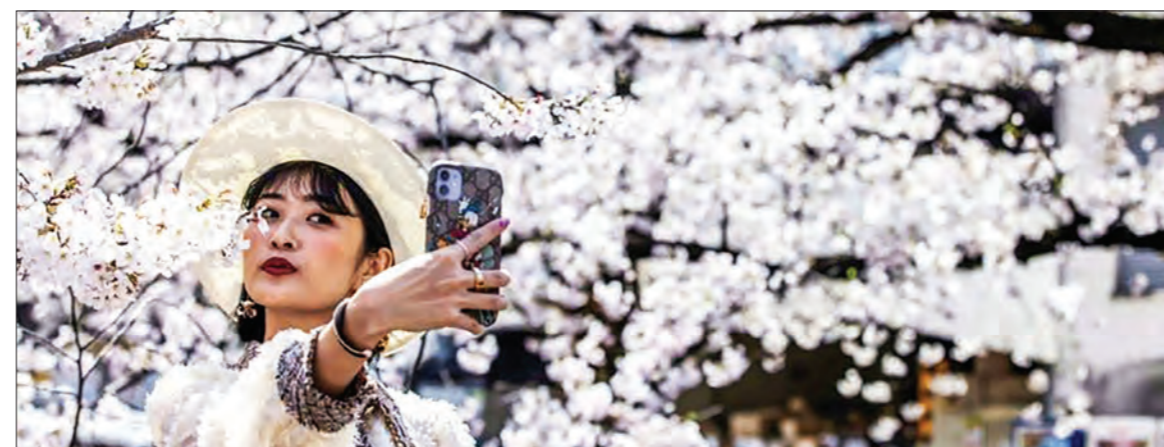
Many people decided to make the most of Friday's sunny weather and clear blue skies to snap 'sakura' selfies.

But many people, mostly wearing masks, decided to make the most of Friday's clear blue skies to snap "sakura" selfies, stroll down blossom-lined paths or take boat rides under the pink-and-white blooms.