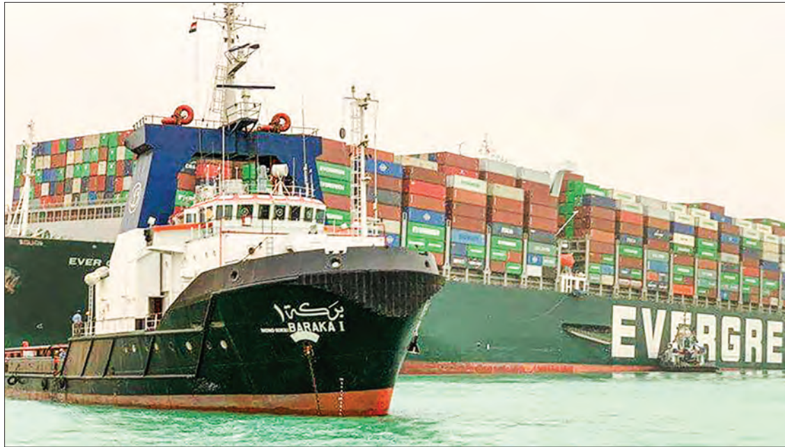
Canal service provider Leth Agencies said at least 150 ships were waiting for the Ever Given to be cleared, including vessels near Port Said on the Mediterranean Sea, Port Suez on the Red Sea and those already stuck in the canal system on Egypt's Great Bitter Lake.