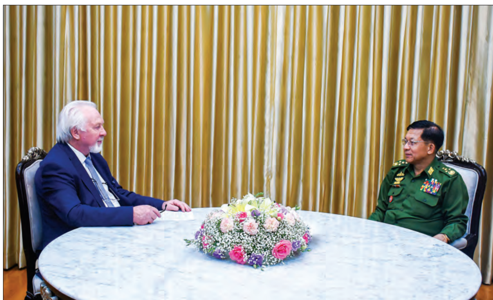
State Administration Council Chairman Senior General Min Aung Hlaing receives Russian Information Adviser to the President and gives interviews to the Russian Federation news agencies.