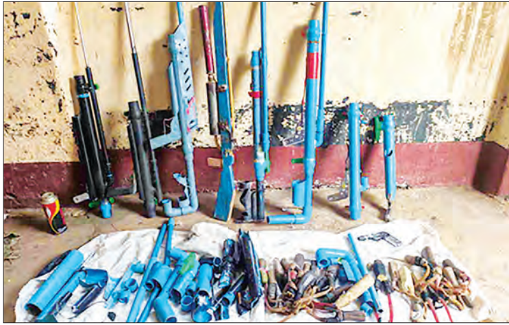
Handmade weapons are seen after villagers (Ayeyawady region) handed over to security forces.

ship, Myeik Township, Thayet Chaung Township and Yebyu Township in Taninthayi Region handed over a total of 124 percussion guns, 75 handmade guns, 17 slingshots, 98 handmade ball ammos, 2 spears, 19