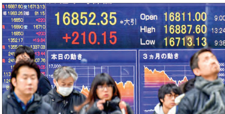
Tokyo stocks advanced Friday on renewed expectations for a U.S. economic recovery following progress on vaccine rollouts and improved labor market data.

The 225-issue Nikkei Stock Average ended up 446.82 points, or 1.56 per cent, from Thursday at 29,176.70. The broader Topix index of all First Section issues on the Tokyo Stock Exchange finished 28.61 points, or 1.46 per cent, higher at 1,984.16. Gainers were led by marine transportation, precision instrument, and land transportation issues. —Kyodo New ■