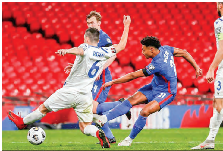
England's Ollie Watkins (centre) scores their fifth goal against San Marino at London's Wembley Stadium, on March 25, 2021.

Aston Villa forward Watkins enjoyed a dream debut as he came off the bench to complete the rout in the closing stages. Only some sloppy finishing and a fine display from San Marino