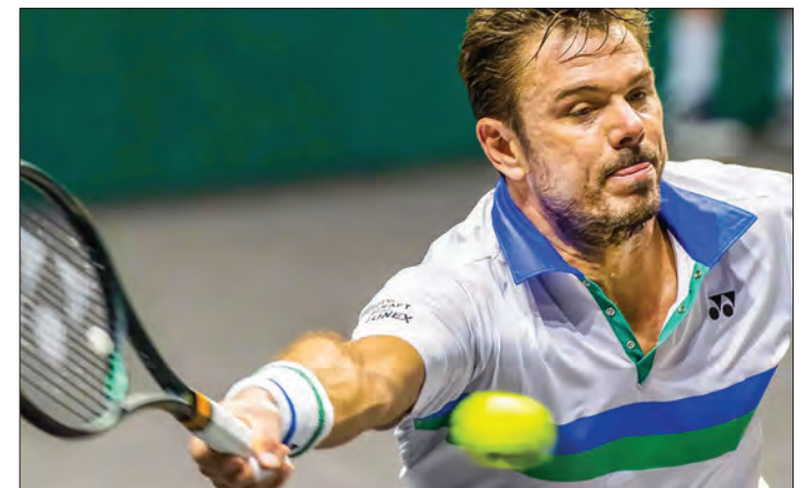
Out of action: Stan Wawrinka.

Wawrinka, currently at 21 in the world, underwent two left knee surgeries in August 2017. —AFP ■