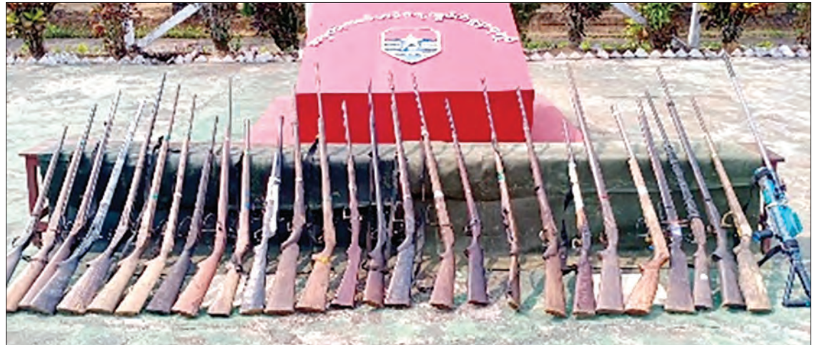
Handmade guns are seen after villagers (Taninthayi region) handed over to security forces.

ammunitions to the security forces after the security forces educated them that carrying illegal weapons can be taken serious legal action.