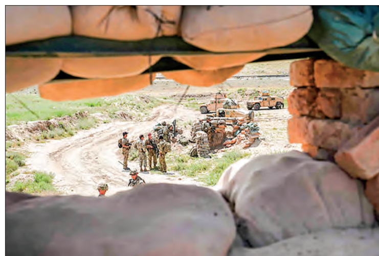
US troops are seen through a firing position at the Afghan National Army (ANA) checkpoint in Nerkh district of Wardak province west of Kabul.

are in consultations with our allies and partners on how to proceed." "It is not my intention to stay there for a long time. But the question is how and under what circumstances do we meet that agreement that was made by (former) President Trump," Biden said when asked about exit of US troops from Afghanistan. Lastly, Biden said, "We (US) will leave (Afghanistan), the question is when we will leave." Since coming to power the Biden administration has made it clear that it is not willing to let the Taliban have its way as the price