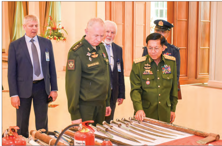
The Senior General and Russian Deputy Minister for Defence are viewing the weapons used in riots.

In his discussions, the Senior General said in looking back at the history of Myanmar, one can see an essential role of Myanmar Tatmadaw. Anyone cannot deny that the Tatmadaw has been striving to prevent the country's disintegration in successive eras since the time when the country had regained its independence amid the difficulties of armed conflicts. Although the Tatmadaw paved the way for multiparty democracy for the country according to the people's demand, anticipation could not be true as expected. People have aspired for free and fair democratic politics. However,