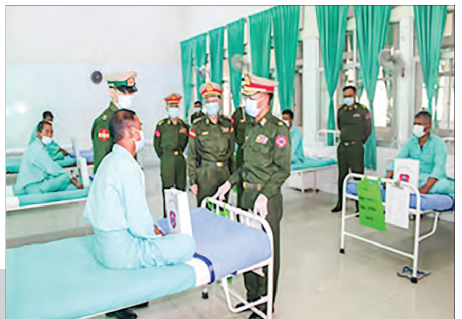
North Western Command Commander Brig-Gen Phyto Thant and party seen encouraging local patients at station hospital in Monywa.

Officials from the respective commands also provided the patients with foods, and medical workers were provided with cash assistance. — MNA