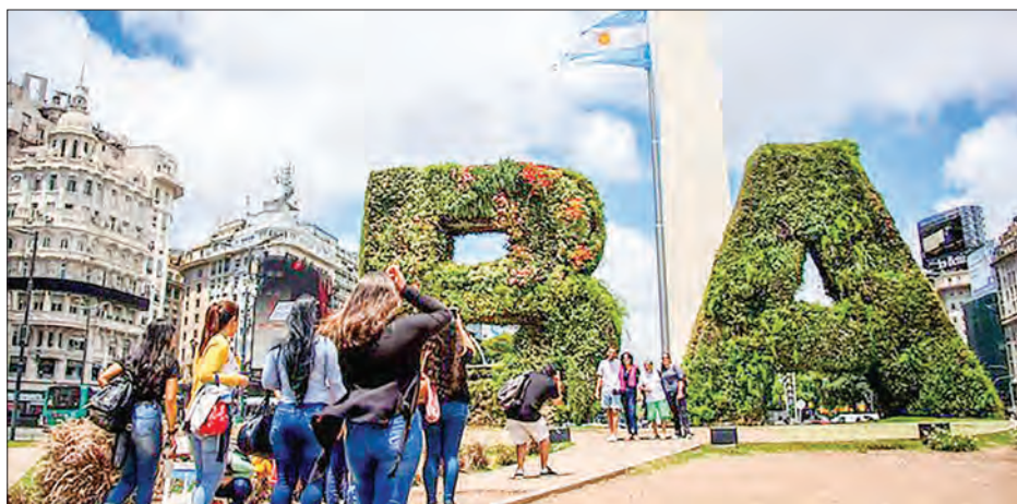
Tourists pose for pictures at the Obelisk along 9 de julio Avenue in downtown Buenos Aires.

thorities and the IMF team made progress in defining some key principles that could underpin an economic program to help address Argentina's near- and medium-term challenges," it added. The two sides had a "shared recognition of