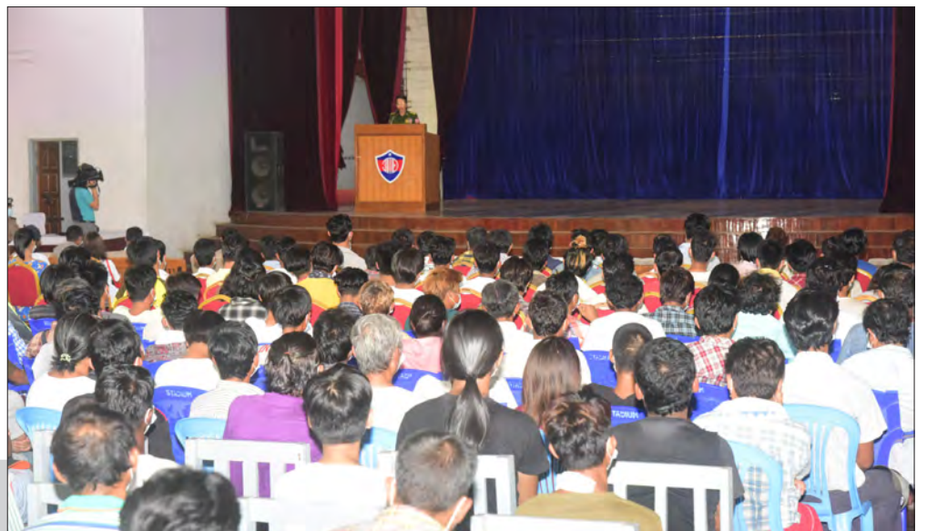
Released protesters are seen listening to the remarks made by the YRAC member and secretary.

Moreover, 628 people -- 360 men and 268 women -- were also released from Insein Prison on 24 March.