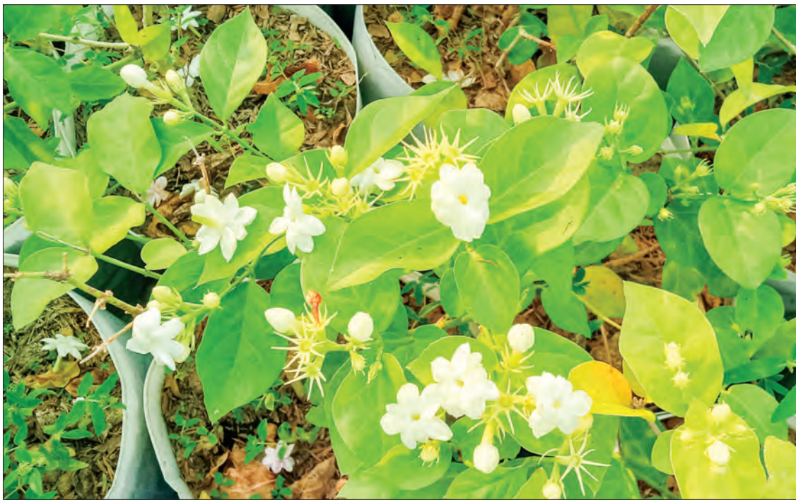
The jasmine flower is blooming abundantly from February to May. It is famous for its fragrance.

The jasmine flower is blooming abundantly from February to May. It is famous for its fragrance.