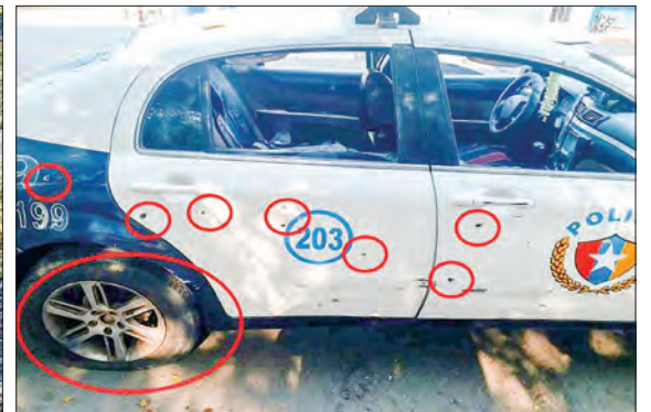
Damages to the police station and vehicle of security forces are seen after violent attacks.

Township. The two handmade bombs exploded on the roads, and no casualties.