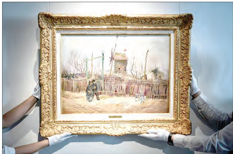
Not considered a supreme Van Gogh masterpiece, it still went for $15.4 million.

ONE of the few paintings by Vincent Van Gogh still in private hands sold for more than 13 million euros at auction Thursday,