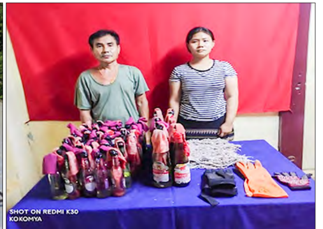
Photos show arrested persons and seized handmade weapons they used in riots.

POLICE have seized weapons and arms using in riots on 25 March.