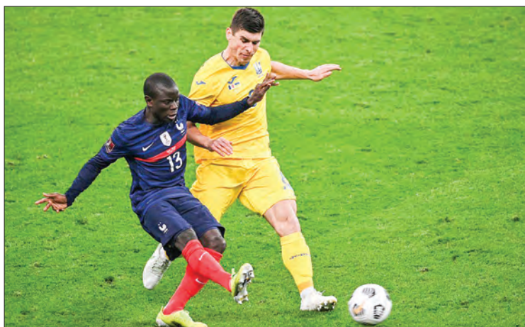
France's midfielder N'Golo Kante (L) vies with Ukraine's midfielder Ruslan Malinovskyi during the FIFA World Cup Qatar 2022 qualification football match between France and Ukraine at the Stade de France in Saint-Denis, outside Paris, on March 24, 2021.

LONDON — Chelsea's N'Golo Kante earned the compliments from French media outlets following a strong performance for France last night.