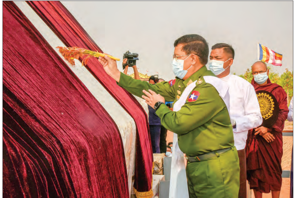
Senior military officers and disciples led by the Township Sangha Nayaka Committee Chairman Sayadaw sprinkled scented water on the part-4 rock of the Buddha image

A ceremony to convey the part of Bhumi Phassa Mudra sitting marble Buddha image for the fifth time took place at the Maha Mingala pavilion in Buddha park in Dekkhinathiri Township of Nay Pyi Taw yesterday morning. The ceremony was graced