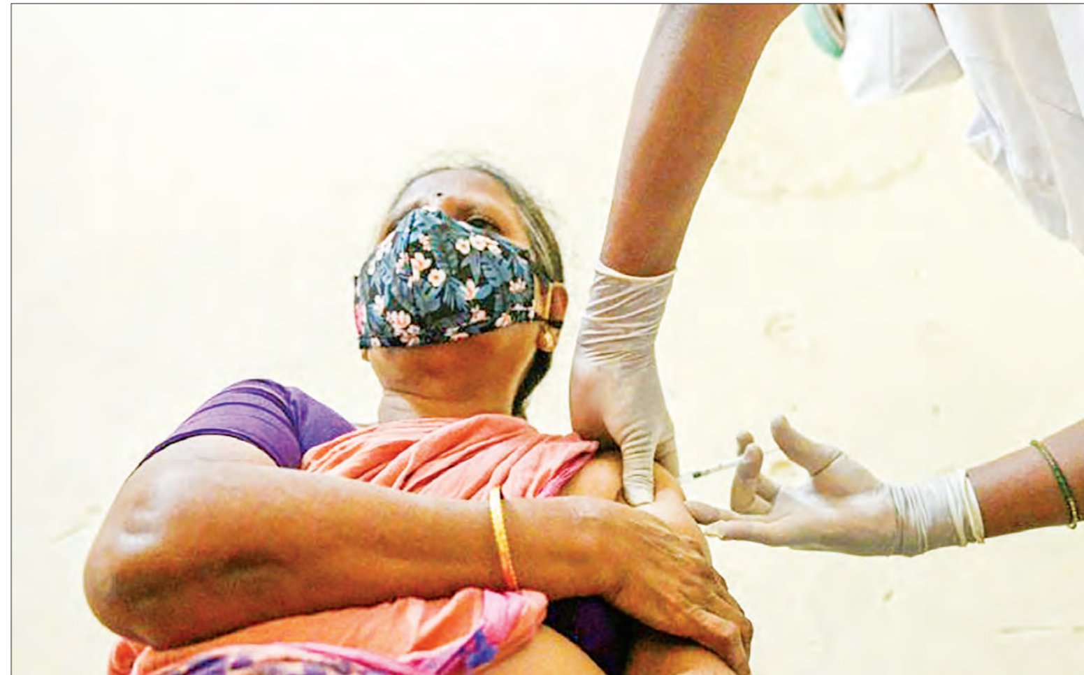
Indian authorities are aiming to vaccinate 300 million people by August.

UNICEF said Thursday it was "expecting an additional 40