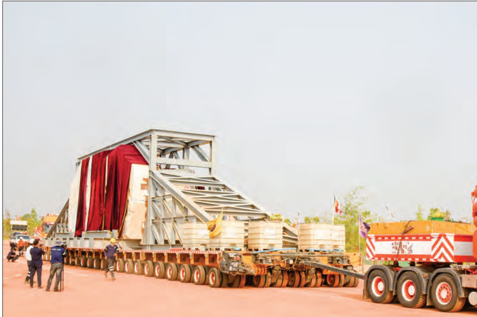
The modular trailer is conveying part of sitting Buddha image in Nay Pyi Taw Yesterday.