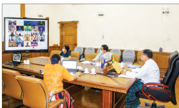
The MoPFI deputy minister joins the online ASEAN finance and central bank deputy governors' meeting yesterday.

The Deputy Minister also joined the ASEAN Finance and Central Bank Deputy Governors' meeting with the Ministry of Fi-