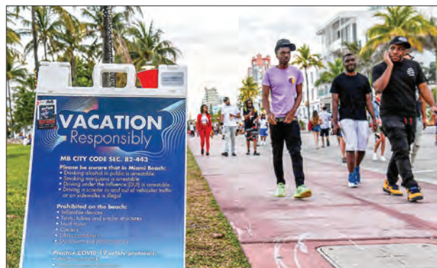
A sign asking vacationers to follow Covid-19 safety protocols in Miami Beach.

AFTER a year of pandemic restrictions, Americans want to get back on the move — a dynamic apparent in Miami's spring break revellers and Washington's deluge of rental