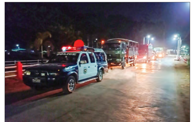
Tatmadaw, Police Force and Fire Brigade take joint security measures at night.

fire brigade members also jointly conduct security measures for the peaceful night and community peace in respective regions and states and keep serving security measures the whole day.—MNA ■